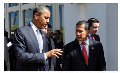
Presidents Humala and Obama

Leading up to and in the immediate aftermath of the election of President Ollanta Humala in 2011, there was speculation in foreign policy circles and the press about how Lima-Washington relations might be affected. 427, 428 Much of this discussion was fueled by memories of Humala's 2006 presidential election campaign, when he aligned