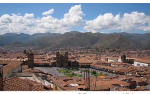
Plaza de Armas, Cuzco

With the exception of Lima, Cusco is probably the best-known Peruvian city to outsiders because of its storied status as the capital of the ancient Incan Empire, and as a jump-off point for the famous, terraced, stone ruins of Machu Picchu and the Sacred Valley of the Río Urubamba, Peru's top tourist attractions. <sup>83</sup> The city's location—tucked into a narrow valley in the Peruvian southeastern Andes—provides it with a geographical ambience missing from the