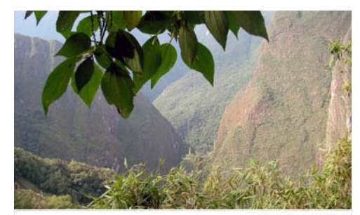
Sierra region

spur coastal upwelling from deeper water of nutrients that, combined with sunlight, generate extensive plankton growth that sustains Peru's rich offshore fishing grounds.<sup>22</sup> During extreme El Niño years, however, the trade winds decrease in strength or even disappear, reversing normal weather patterns and bringing heavy rains and even flooding to the northern coast of Peru.<sup>23</sup>