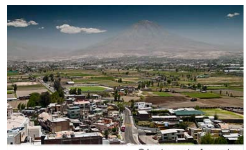
Arequipa Peru and volcano

Although it is only one-tenth as populated as Lima, the southern Peruvian city of Arequipa is nonetheless Peru's "second city." Though its growth has been on a smaller scale than that of Lima, Arequipa has grown from 160,000 people