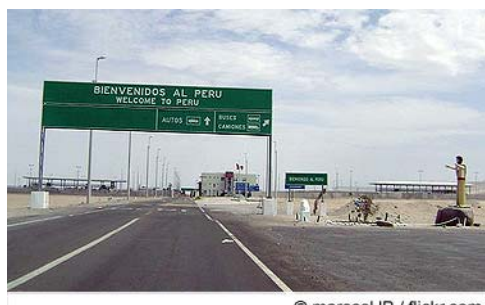
Peru-Chili border

Diplomatic relations between Peru and Chile have frequently been rocky, dating to the War of the Pacific (1879–1881), in which Chile took possession of Peru's southern coastal region that became the Chilean regions of Tarapacá and Arica y Parinacota. The two nations continue to disagree about their maritime border, an issue that caused Peru to apply in 2008 for arbitration by the International Court of Justice (ICJ). Oral arguments on the issue, which concerns tens of