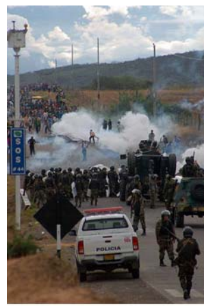
Deadly protest in Bagua

During 2009, the small town of Bagua in the northern Amazon jungle was the scene of indigenous protests over governmental leasing of tribal lands to international companies for the exploration of oil and natural gas, which ended with the deaths of between 30 and more than 100 indigenous people and police. Of the estimated 22 police officers who died in the violence, 7 were killed with spears. The protesters argued that the exploration for natural resources damages the environment and does not substantially benefit local villagers, who have not been consulted about the government's decision to lease their land. 495, 496