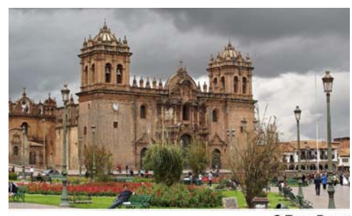
Cathedral of Santo Domingo

Peru has traditionally been a Catholic nation, but various Protestant Christian sects have made inroads in recent times. Results from the 2007 national census show 81.3% of Peru's population to be Catholic, 12.5% Protestant (mostly evangelical churches), and 3.3% miscellaneous Christians (Latter-day Saints, Seventh-Day Adventists, Jehovah's Witnesses, and Israelites of the New Universal Pact, a group of local origin). Small numbers of Jews, Muslims, Hare Krishnas,