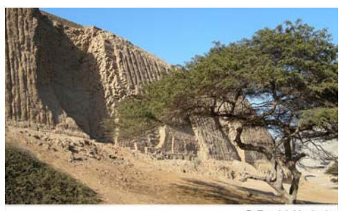
C David Almieda

Another pre-Incan civilization in Peru were the Mochica, whose culture reached its peak from about the first to eighth centuries C.E. 130 The Mochica occupied a stretch of the northern Peruvian coastal region, and several sites have been excavated in areas near the cities of Trujillo and Chiclayo. 131, 132 One of the first civilizations to build roads in Peru, the Mochica more easily moved their armies throughout the land. 133