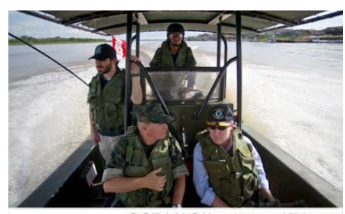
Policing drug trafficking

Peru's border with Colombia lies entirely in the Amazonian Basin, with all but a short stretch of it defined by the Putumayo River. The portion of the border not defined by the Putumayo River, in the far northeastern corner of Peru, was the site of a low-level war between the two countries in 1932–33 that eventually was mediated by the League of Nations. Since then, the two nations have had no border conflicts.