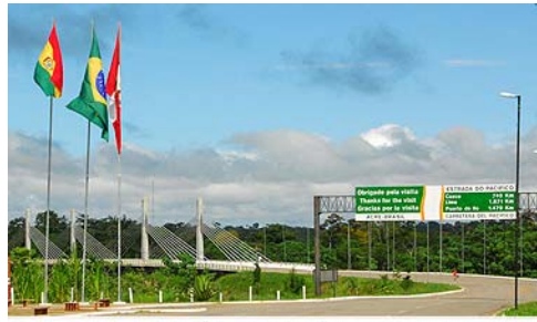
Brazil-Peru border

directions. Brazil's population centers were on its Atlantic coast, Peru's on the Pacific, and between them lay thousands of square miles of dense rainforest and the imposing peaks of the Andes. Only a brief rubber boom from the 1880s to the early 1900s caused either country to significantly focus on their Amazonian hinterlands, until the second half of the 20th century. Brazil's construction of an interior capital at Brasília in the late 1950s signaled a westward expansion into the