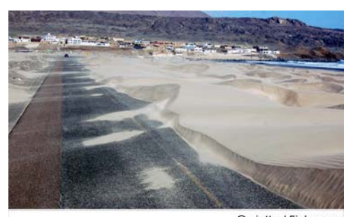
Sand dunes on the Pan-American

Peru's rugged Andean slopes and dense Amazonian forest lands have long posed challenges in linking the nation's more remote locations. More than 127,000 km (78,900 mi) of roads traverse the countryside, but only 11% are paved. 322 In the Costa region, road travel is much easier, with the nation's northern and southern borders connected by the Pan-American Highway, which passes through all the major coastal cities. 323, 324