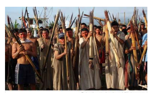
Oil exploration protest

In September 2011, Peru's President Ollanta Humala signed a consultation law that requires foreign investors to negotiate and try to find consensus with local indigenous communities before commencing mining or oil/natural gas operations in their regions. It is hoped that the new law will reduce the social unrest of some rural communities of Peru in recent years. Sometime violent protests against new foreign-backed mining and hydrocarbon-extraction