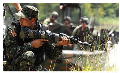
Peruvian special forces

Prior to 1980, Peru was frequently governed by military rule. Though the coups that brought about such authoritarian regimes have been replaced by democratically elected civilian governments, Intelligence Chief Vladimiro Montesinos had a strong influence over Peruvian government and military actions during the Fujimori period (1990–2000) through an extensive web of bribery, coercion, co-option, and blackmail. 418, 419