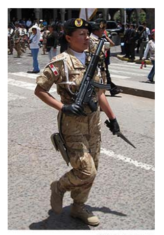
Military parade in Cusco

Peru has 115,000 active members in its armed forces, divided into army (74,000), navy (24,000), and air force (17,000). Another 77,000 individuals serve in the national police force.<sup>475</sup> The military has a long history of intervening in Peruvian politics, although no active military leader has headed the government since 1980. 476 (Current President Ollanta Humala is a retired lieutenant colonel in the Peruvian Army who served until 2005.)<sup>477</sup> Peru has no real imminent external threats at present, but the lingering maritime border dispute with Chile, now in arbitration at the International Court of Justice, continues to fuel tension. 478