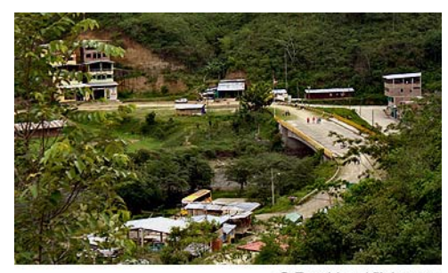
Peru-Equador border

Although Peru and Ecuador fought a brief border war in 1995 that ended in a settlement in 1998, recent relations have been mostly non-contentious. <sup>440, 441</sup> An agreement confirming the maritime border between Peru and Ecuador was negotiated successfully in May 2011, leaving no remaining land or maritime territorial issues between the two nations. <sup>442</sup>