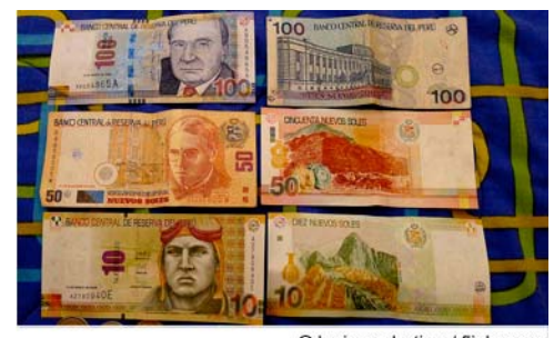
Peruvian currency

Peru's national currency is the nuevo sol (currency code: PEN). During the second half of 2011, the value of the nuevo sol relative to the U.S. dollar (USD) fluctuated in the range of 1 USD = 2.69–2.81 PEN. <sup>311</sup> Introduced in 1991, the nuevo sol is the nation's third currency system to be used since 1985. Peru's prior two currencies—the sol and the inti—had to be abandoned during the hyperinflation years of the 1980s and early 1990s. <sup>312</sup> Since then, adjustments to monetary-