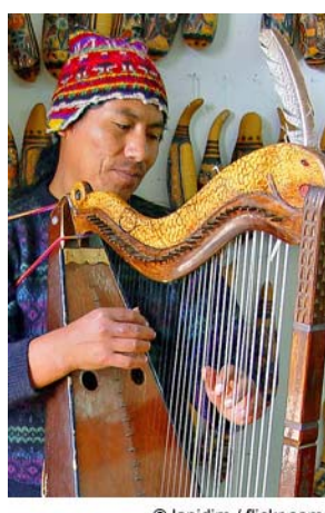
Harp player in Pisaq

Perhaps the most traditional Andean musical style is yaraví , characterized by slow and melancholy songs about lost love, wasted lives, or deceased loved ones. 382, 383 A much more up-