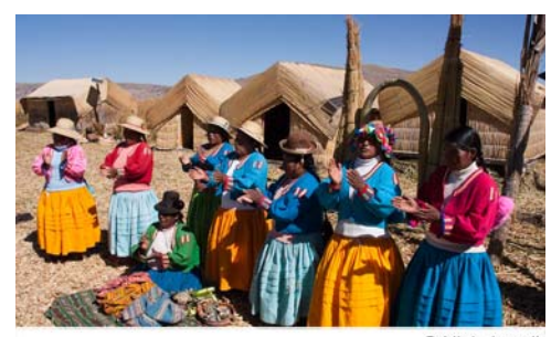
Aymara women chanting

the coast are sometimes referred to as cholos or serranos , terms that may carry a pejorative meaning. The term chuto also is used frequently, again in an often negative context, to distinguish those indigenous people in the remotest rural highlands who frequently speak no Spanish at all. 550