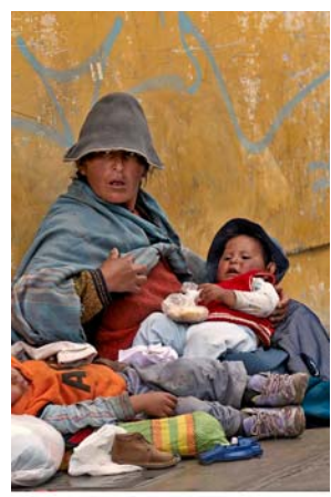
@ Andrew Howson Poverty

During the political instability of the 1980s, Peru's economy was in tatters, beset by declining economic growth, increasing poverty, and an astronomical inflation rate. 247 The 1980s have been described as a "lost decade," in which Peru's gross domestic product per capita declined by 30% (dwarfing the declines in other parts of Latin America). 248 Today, fueled in part by government policies favoring free trade, the nation has recorded nearly 10 years of above-average growth. Peru has also become a magnet for investment because of its stable economic climate and extensive natural resources. 249, 250 Though poverty and other social ills have yet to be addressed in many parts of the country, the overall trajectory has been one of improving economic conditions for large numbers of Peruvians.