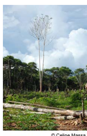
Deforestation, Amazon Jungle

Some of the land in the Upper Amazon also has been cleared for the illegal cultivation of cocaine, which has contributed to deforestation and erosion. Pesticides used to eradicate the