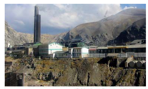
Mine in La Oraya

Mineral mining (including gold, silver, zinc, and copper) is one of the country's biggest industries. <sup>273, 274</sup> More than 60% of the country's exports are raw minerals mined in Peru. Many of Peru's largest industries are tied to value-added