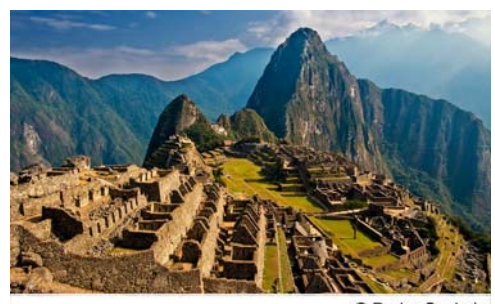
Machu Picchu, lost Inca city

Starting from their heartland in the Cusco Valley of southern Peru, the Incas conquered much of western South America in just a few generations. While successive Sapa Incas (Incan emperors) periodically raided the lands of neighboring ethnic groups over several centuries, no pattern of large-scale conquest occurred until the first half of the 15th century. <sup>146</sup> Under Pachacuti Inca Yupanqui (1438–1471), the Incan empire