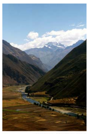
Sacred Valley of the Inca

While the majority of Peruvians now live in the large cities of the coastal plains bordering the Pacific Ocean, the historical heartland of Peru lies in the towering Andes Mountains, where the Incas once ruled over much of western South America.<sup>3</sup>