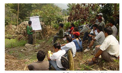
Discussing coffee growth

In recent years, asparagus from some of these Costa farms has become a leading export crop.<sup>255</sup> Much of this asparagus is sold in American