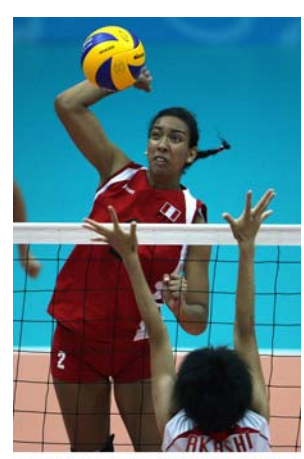
© Singapore 2010 Youth Olympic Games Women's volleyball

In national competition, two of the top club teams are Alianza Lima and Universitario de Deportes, whose rivalry is the oldest and most storied in the nation. 408