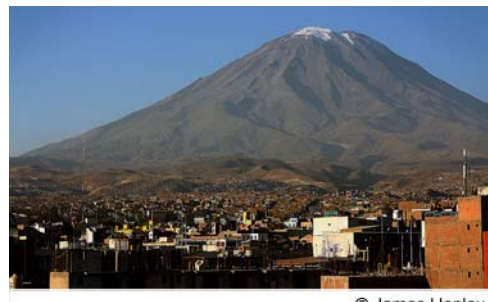
El Misti volcano

The Andean region and the coastal areas of Peru in particular are prone to frequent earthquakes, believed to be caused by the convergence of subterranean geologic forms known as tectonic plates. <sup>91, 92</sup> But the impact of these quakes is not limited to the coast and can cause major damage in the Sierra region from subsequent rock and snow avalanches. <sup>93</sup> The deadliest earthquake in Peru's historical record occurred in 1970, when a magnitude 7.9 temblor struck offshore near the