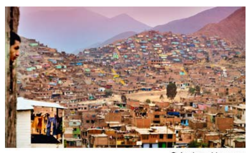
© Andrew Howson Low income housing

Nevertheless, Peru's disparity between the haves and have-nots remains a potent force in the national political and economic discussion. Alan García drew praise outside Peru for the nation's economic growth during his second presidential term (2006–2011). But inside Peru, particularly in the more rural regions of the Sierra and Selva, lingering poverty amid the economic expansion along with high-level government corruption only seemed to further fuel discontent.<sup>338</sup> As a result,