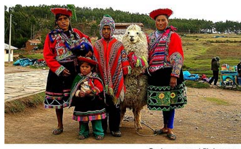
Family in traditional clothes

The traditional clothing of the native Andean people traces to the early decades following the Spanish conquest. After the rebellion against Spanish authority led by Túpac Amaru II in 1780–81, the Spanish banned all Incan-style clothing. Momen no longer wore the anaku , an anklelength one-piece dress wrapped around the body and then fastened over the shoulder by a long stickpin. In its place came the brightly colored skirts known as polleras , often worn in