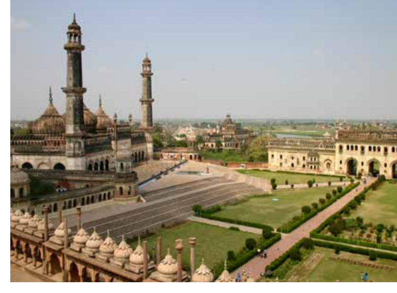
Mosque in Lucknow

Indian Muslims worship in mosques. Much of India was ruled for many centuries by Muslims, and some of the country's most famous architectural achievements are mosques built during the periods of sultanate, Mughal, and later regional rule. The Taj-ul-Masjid in Bhopal, the Moti Masjid and Jama Masjid in Delhi, and the Taj Mahal in Agra are a few examples. 82