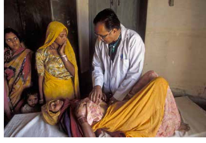
Female patient gets a check up

The majority of preventable rural deaths are related to infections, communicable diseases, parasites, or respiratory illnesses. Waterborne infections account for 80% of all illness in the countryside. Other common diseases include diarrhea, typhoid fever, hepatitis, worm infestations, and polio; tuberculosis is also