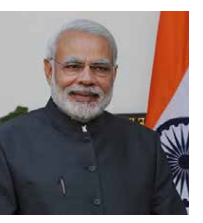
Narendra Modi, Prime Minister of India