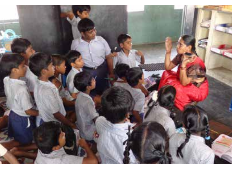
Classroom with students and teacher

Article 21A of the Constitution of India guarantees free and compulsory education for all children up to the age of 14.67 Enrollment in rural schools is on the rise, but in 2010 only 63% of all eligible 5-year-old children were enrolled in school. This number