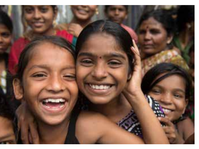
Children laughing

Children are highly valued in Indian society, especially if they are boys. In general, children enjoy a permissive childhood. They are not encouraged to be self-reliant and