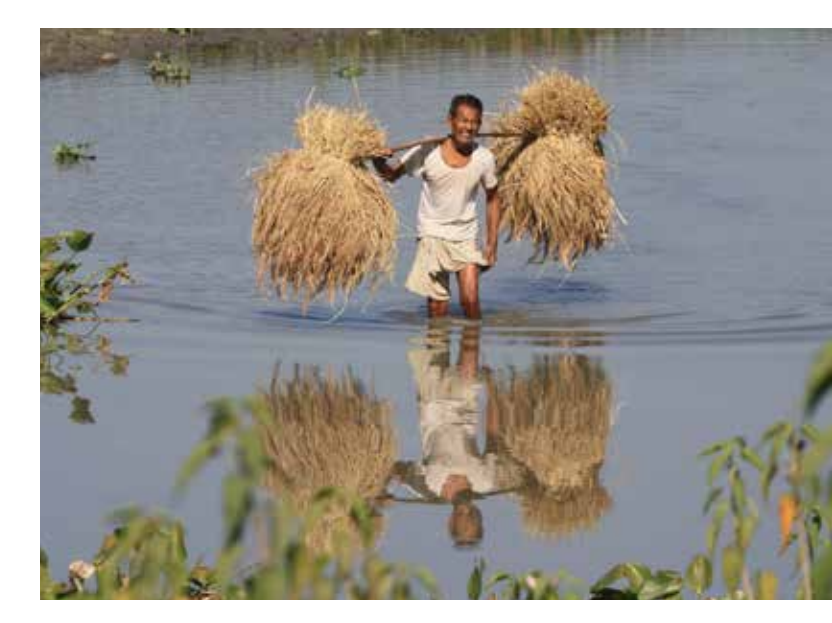
Man hauling his harvest

Agriculture is still the most important sector of the rural economy. The most important products raised by Indian farmers are food grains such as rice and wheat, fruits and nuts, vegetables such as potatoes and pumpkins, seeds, spices, coffee and tea, tobacco products and cotton, rubber, and jute.<sup>25</sup> According to a government study, digging wells, plowing, and sowing were the highest-paid jobs for men in agriculture.