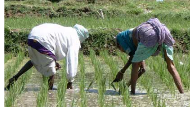
Rice paddies

From the late 1960s to late 1970s, India's agricultural output increased dramatically. This so-called "Green Revolution" was highlighted by a transition to high-yield varieties of key crops such as rice and wheat (particularly in the states of Punjab and Haryana) and an expansion of irrigation capacity, allowing more acreage to be farmed and