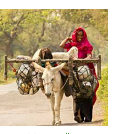
Woman walking with animals

Even if people have moved from their village to the city, the village remains an important part of their identity. People will often refer to their ancestral village as "our village."<sup>77</sup>