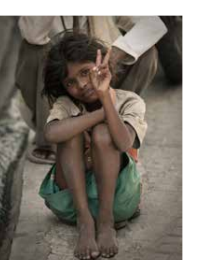
Child beggar

Begging is common in urban areas and gangs are behind much of it. Tourist sites are commonly frequented by beggars. The best way to handle it is to ignore the requests. If you give money to one, you will likely be besieged by others, who can be quite persistent in their requests. If you feel you must give something, give only 10 to 20 rupees at a time. Never give money when arriving at a location—only when you are leaving. Often, women beggars rent babies to seem more pitiable. Be aware that because of the criminal element inherent in begging in India, any gifts—whether money, toys, school supplies, or anything else that can be sold—simply contributes to the human trafficking that is endemic in India.