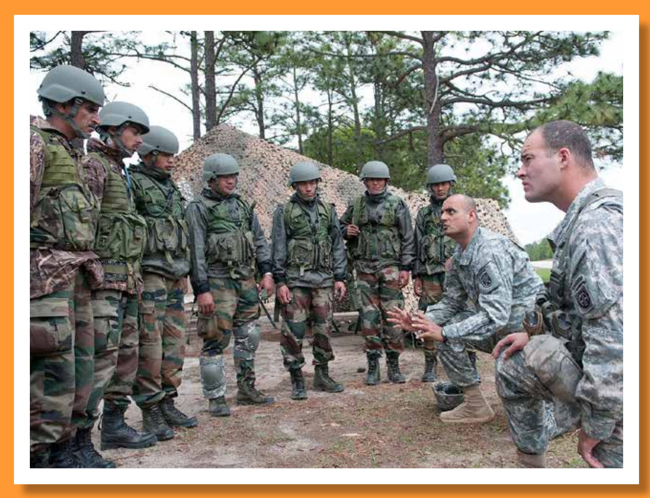
Weapons-range safety explained