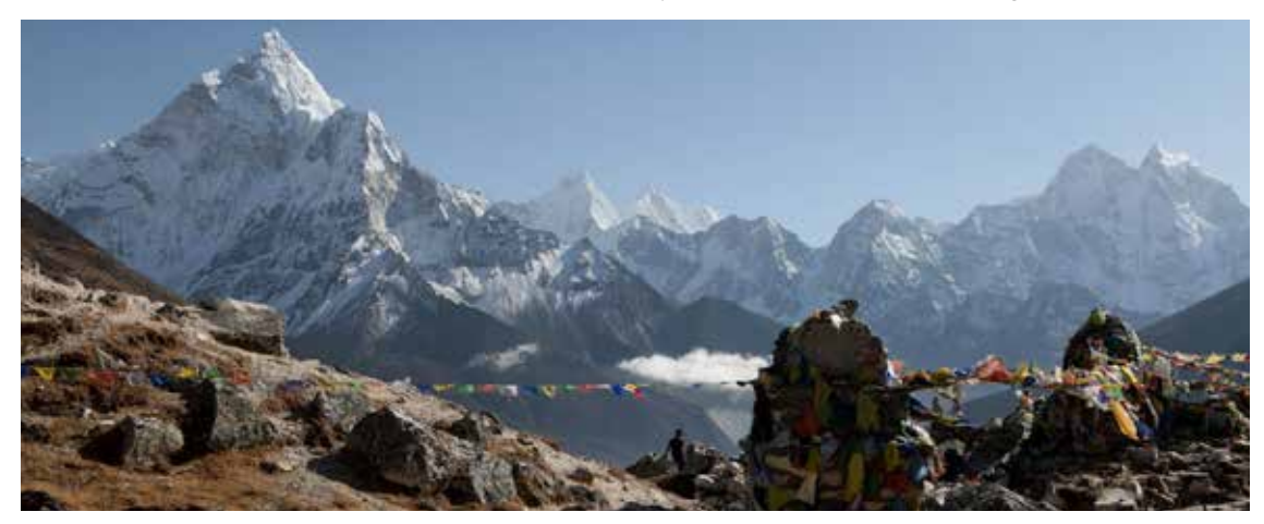
Himalayan mountain range

The Indian mainland comprises three main regions: the great Himalayan mountain range; the plains of the Ganga and Indus rivers, including the western desert region; and the southern Peninsula. Hindi speakers occupy much of the first two regions.<sup>20</sup> Hindi