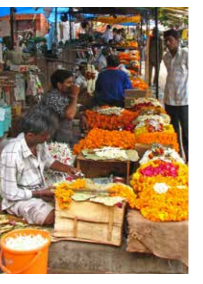
Flower market

Local produce markets tend to be crowded. Indians still prefer to buy fresh produce and