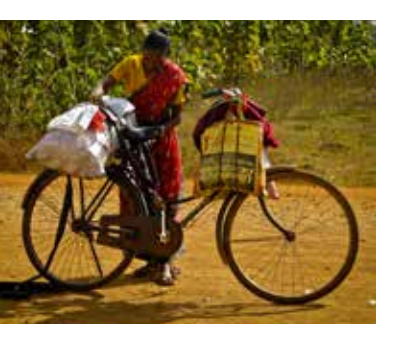
Woman loading her bike