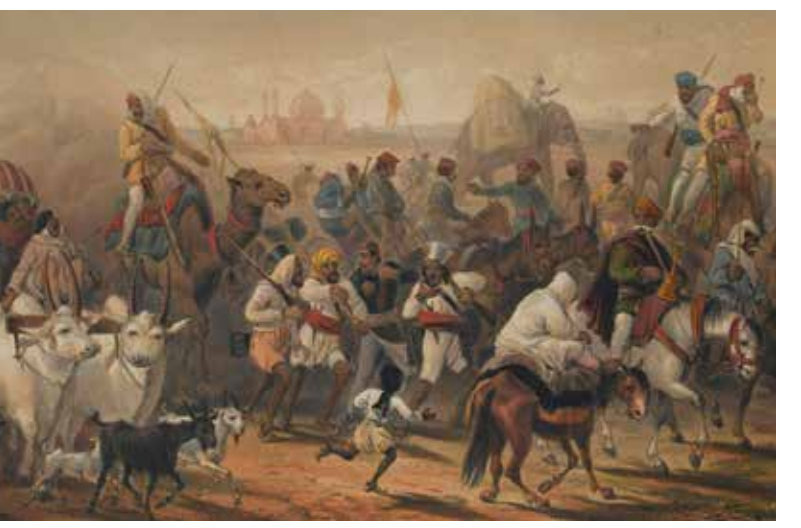
Depiction of the Sepoy Rebellion

From 1757 until 1857, the British East India Company expanded aggressively. The attitude of the British toward Indian culture changed from admiration and appreciation