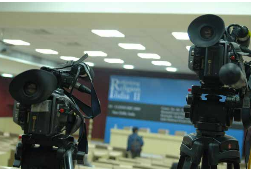
Video cameras

Starting with just one state-run television channel in 1991, India has grown to a country with hundreds of channels. Between 2005 and 2010, more than 444 channels emerged,