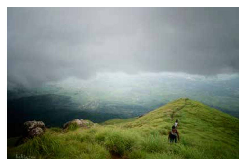
Cloudy sky before a monsoon

The northeast monsoon is far slower than its spring predecessor. It usually moves across northwest India in early