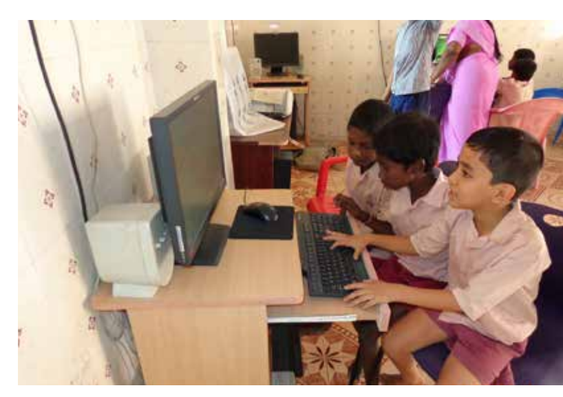
Students on the Internet

India has the third-largest internet market in the world with approximately 100 million users and is poised to attain the rank of second-largest as internet users increase. 181, 182, 183 India also ranks third in the world in internet censorship. The government has made numerous requests for specific sites to be removed. It also ranks fourth-highest in the world for data removal requests. 184