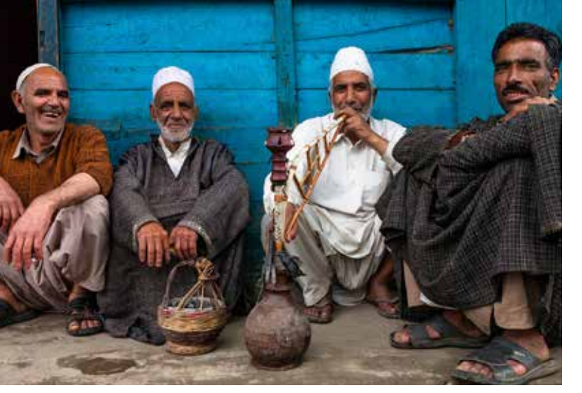
Men socializing

needs including cooking, general household tasks, and children. Women have historically been precluded from taking part in business or working outside the home. Customarily, males controlled the family resources, such as land or businesses. <sup>17</sup> Changes in the economic and social structures of the family have allowed more women in the labor force. <sup>18</sup>