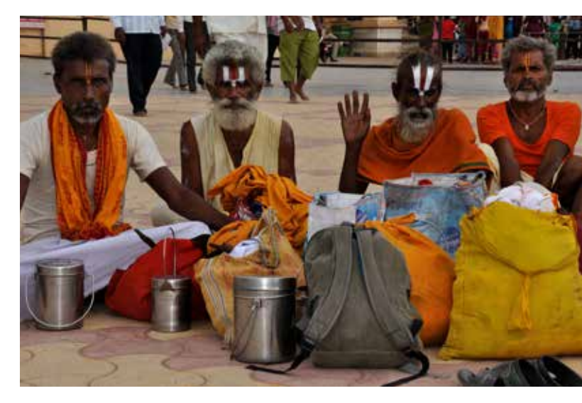
Hindu Monks in Veraval, Gujarat

Today, Hinduism is the dominant religion of India and Nepal. Hindus believe in the reincarnation ( samsara ) of the soul ( atman ), and that the quality of a person's next life is determined by their actions