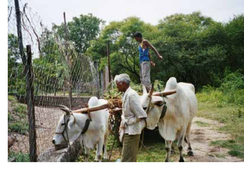
Rural farmers

Shepherds move livestock between different pastures (called "transhumance") in the western Himalayas. In the