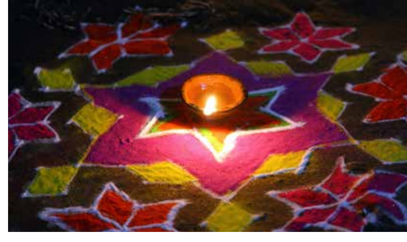
Candle for Diwali

Diwali, the festival of lights, is a 5-day festival celebrated nationwide in India in either October or November, based on the Hindu calendar. Although Hindus have various reasons for celebrating, Diwali is commonly accepted as a celebration of the renewal of life. In preparation for the festival, homes and businesses