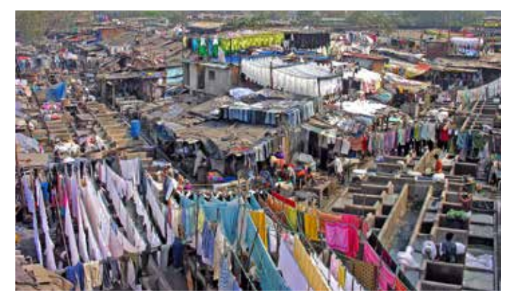
Laundry service, Mumbai

Since India's independence from Britain in 1947, a number of cities have changed their names from the British anglicized forms. Foremost among these is Bombay, which in 1995 became Mumbai, named for the goddess Mumba. Mumbai is the capital of the state of Mararashtra, and is built on a set of seven