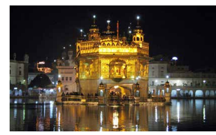
Golden Temple

The Sikh temple or shrine is called a gurdwara . Prominent within it is the Guru Granth Sahib , the Sikh holy book that is also considered by Sikhs to be the living Guru. Prominently displayed outside the gurdwara is the Sikh flag, the Nishan Sahib . It is triangular, of burnt orange or saffron color, and displays the Khanda, the symbol of Sikhism.<sup>83</sup>