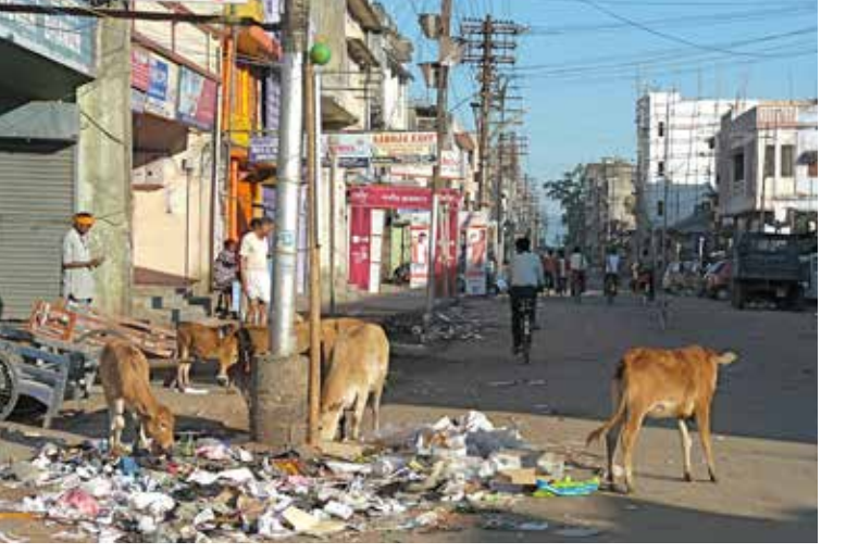
Trash in streets of Brahmaputra

simmer.<sup>125, 126</sup> In 2011, India was named the world's largest arms importer, further heightening concerns among its neighbors.<sup>127</sup>