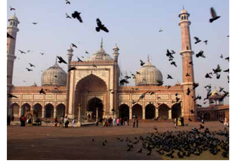
Pigeons in front of a mosque

At the time of independence and partition, many Indian Muslims migrated to the western and eastern portions of the new country of Pakistan (now Pakistan and Bangladesh). Some did so by choice, but others were forced.<sup>25</sup> Today, the highest percentages of Muslims in India are in the states of Jammu and Kashmir, West Bengal,