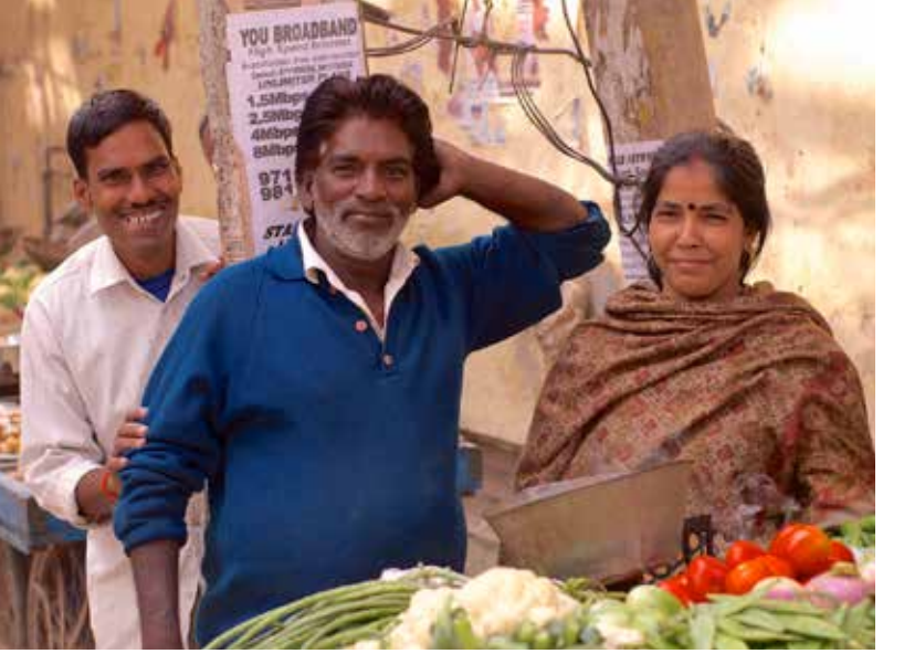
Market vendors

disparity between rates of male and female employment is highest among Muslims and upper-caste Hindu families. These two groups are also most associated with the practice of purdah , or the veiling of women to those outside the family.<sup>11, 12</sup> On the other hand, Dalits, who are historically of a low economic class, have one of the highest female labor participation rates, and most of this employment is in low-income positions.<sup>13, 14</sup>