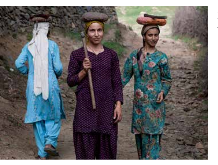
Women walking to work

Rural India is a deeply tradition-bound patriarchal society. Customary women's roles involve housework, caring for children, and handling the domestic front.<sup>31</sup> Women are