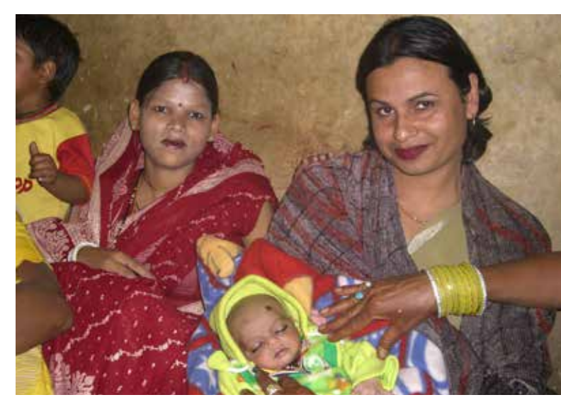
Young baby

Birth celebrations for baby daughters are more subdued than