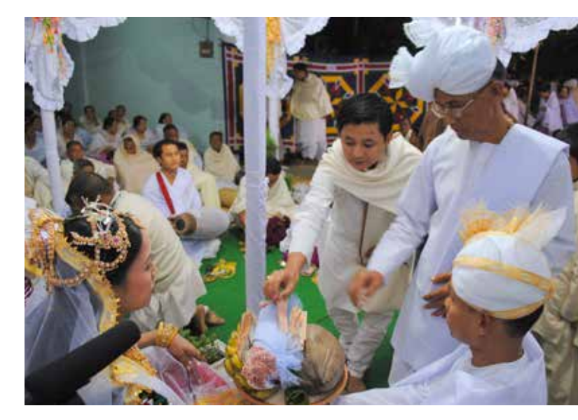
Wedding ceremony

A wedding is a family affair and as many relatives as possible attend. Normally, the