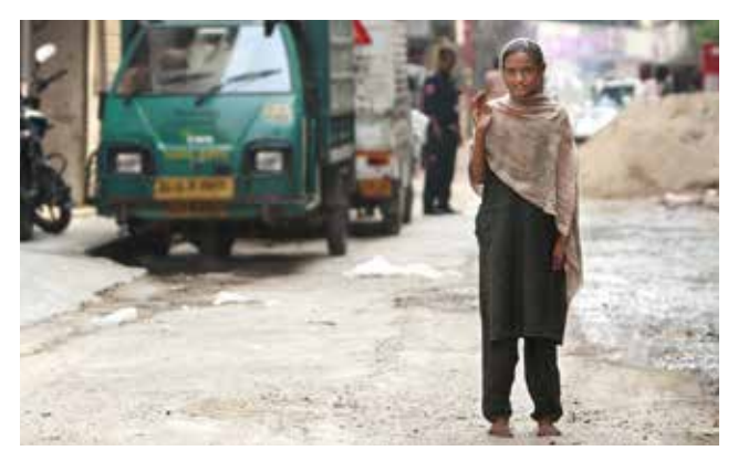
Young girl in Delhi

The special nature of adolescence is recognized in Indian society and there are specific regulations regarding behavior. This code of conduct generally involves celibacy and learning the traditions of the family and culture. Girls usually find their activities more restricted and they take on more responsibility for work related to the home. On the other hand, boys find that they have more freedom. It is during this time that Indian boys begin to take on more adult roles and to look for occupational pursuits. The experience of adolescence can vary greatly depending on social class, region of the country, and caste. Among the poor, many teenagers will drop out of school to work.