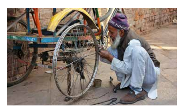
Mechanic fixing rickshaw wheel

Non-agricultural jobs are those that do not directly perform farming activities. The sector has grown steadily in recent years and encompasses jobs such as mining, manufacturing, processing, construction, masonry, transport, and services, to name a few.<sup>27, 28, 29, 30</sup>