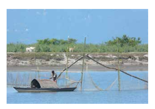
Brahmaputra River

The Brahmaputra River rises in the northern Himalayas in western Tibet and flows eastward for nearly 1,700 km (1,054 mi) before turning south near the Indian border. Its elevation then drops rapidly and it flows southwestward. In western Assam State, the Brahmaputra again turns toward the south and flows into Bangladesh. It is one of the longest rivers of the world at 2,900 km (1,800 mi). The