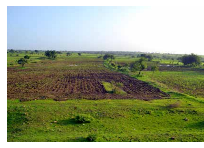
Farmland in the Deccan Plateau

India is divided into seven main geographic regions.<sup>17</sup> From north to south, they are the Northern Mountains, the Great Plains, the Central Highlands, the Peninsular Plateau (also called the Deccan Plateau), the East Coast, the West Coast, and the offshore islands. The offshore islands are in the Arabian Sea and Bay of Bengal. Some consider the Great Indian Desert (also known as the Thar Desert) and the Rann of Kutch area in western India to be an eighth