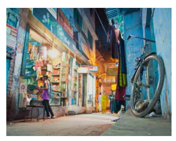
Street scene in Benares at night

Barnares is considered the most sacred city in India. It sits on the banks of the Ganga River in the state of Uttar Pradesh and is more than 3,000 years old. It is thought to be the oldest continuously inhabited city in the world. With temples located every few steps, Benares is known as the city of temples. The most famous pilgrimage site in the city is the Ganga (Ganges) River, where people gather to wash away their sins. <sup>79, 80, 81</sup>