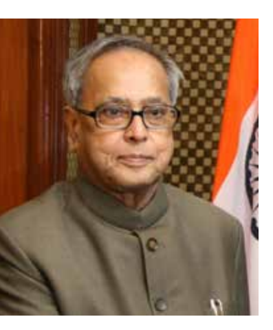
Pranab Mukherjee, President of India

India's rising population and growing economic power have placed it in a key position in the world. Still plagued by high illiteracy rates, tensions on its borders, extensive poverty, and environmental concerns, India is center stage. In 2011, the country gained a nonpermanent seat on the UN Security Council for the 2011 and 2012 term. Tensions continue between Pakistan and India over their dispute of Kashmir; each side has postured aggressively, and people fear a confrontation between the two nuclear powers. 128, 129