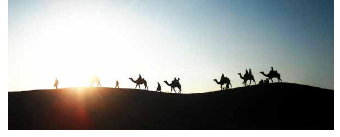
Camels in the Great Indian Desert

Thar is bordered by the Indus plain on the west, the Aravalli Range on the southeast, the Punjab plain to the north and northeast, and the Arabian Sea and the Rann of Kutch on the south.<sup>28, 29</sup>