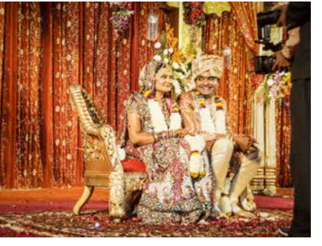
Bride and groom

"Secularism" within India is not so much about separation between religion and state but rather ensures the government respects and protects the beliefs and theological underpinnings of all religions. 42, 43 Many Indian laws were enacted to assure that no religious group or subgroup is allowed to have unfair political, economic, or legal