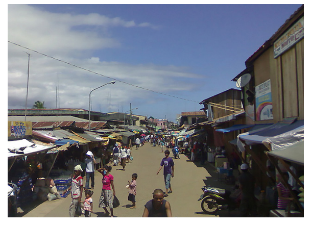
Marketplace in Port Holland, Maluso, Basilan

Despite its fertile soils, tropical climate, and stunning natural scenery, the Sulu Archipelago suffers from economic stagnation. In Tawi-Tawi Province, a lack of