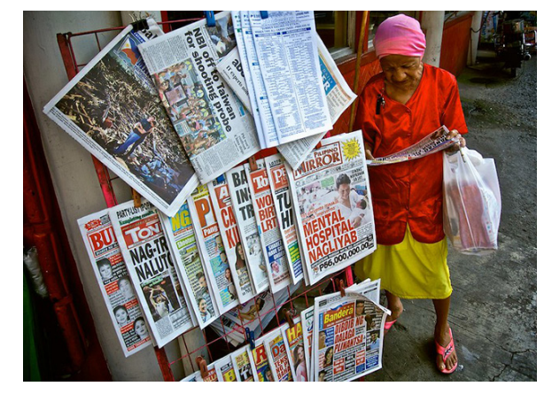
Newsstand in Philippines

Despite a strong tradition of freedom of the press, the Philippines is one of the most dangerous countries to be a journalist. The constitution protects freedom of the press, but violence, intimidation, and legal action significantly undermine the work of journalists.<sup>88</sup> Between 1992 and 2015, only Syria and Iraq had more journalists killed. Defamation is a criminal offense and journalists who report information that is critical of government officials risk prosecution. In response to these threats, the government has set up a safety task force to protect journalists. The quality of journalism is also hindered by a lack of government transparency, advertisement disguised as journalism, and the popularity of sensational media.<sup>89, 90</sup>