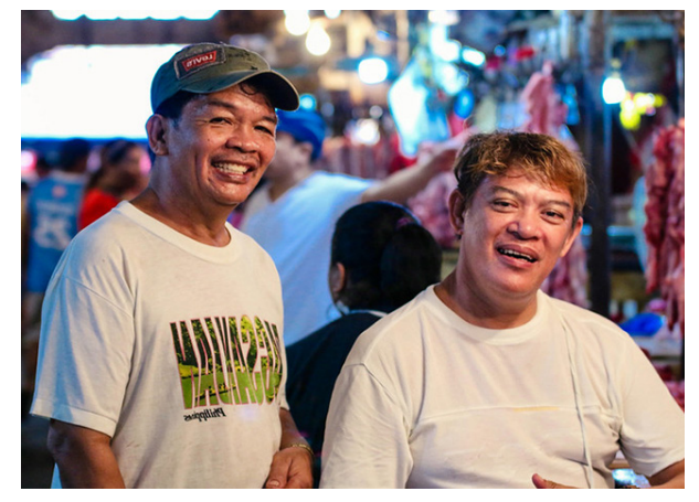
Friends pose together in busy marketplace

Exercising tact in greetings is important to preserve the honor or standing of others.<sup>29, 30</sup> Address new acquaintances as formally as possible; it is best to err on the side of formality by using a person's formal title or "Mr.," "Mrs.," and "Miss," followed by the last name. Colleagues can be referred to by their first name.<sup>31, 32, 33</sup>