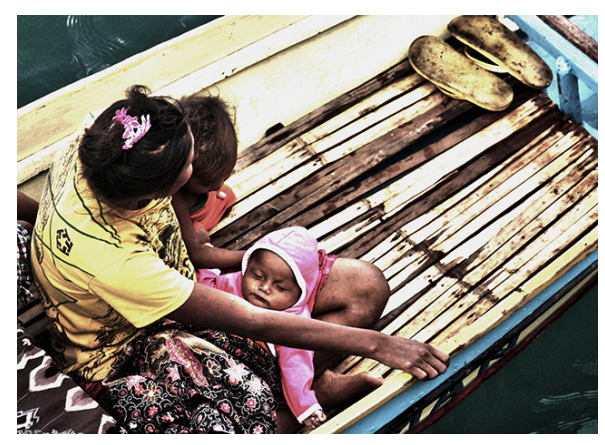
A Badjao family in a canoe

To enhance a newborn's chances of survival and health, infants are secluded after birth and protected by amulets ( hampan ).<sup>9</sup> The Tausug believe that every child is born with a spirit-twin that must be appeased to thwart bad luck.<sup>10</sup>