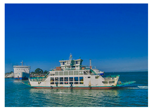
A typical ferry boat in the Philippines

Other than ferries, the main intra-island form of transportation is by air. The European Commission has banned all Philippine-certified air carriers because of an inability to verify compliance with international safety standards.<sup>74</sup> Similarly, the United States Federal Aviation Administration has found that the Philippines does not comply with international safety standards.<sup>75, 76</sup>