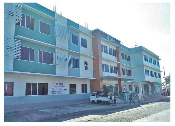
The United Doctors Hospital in Cotabato

Healthcare in the Philippines has undergone many changes in recent years due in part to reforms and policies aimed at improving access for residents. According to the Department of Health, the Philippines has 721 public hospitals and 1,071 private hospitals. While healthcare is characterized as efficient and affordable, it is not on par with the healthcare of many western nations. Healthcare standards vary dramatically from region to region; urban areas have a significantly higher standard than rural areas.<sup>29, 30</sup> The quality of hospital services might be substandard since many lack modern equipment and adequate sanitation.<sup>31</sup>