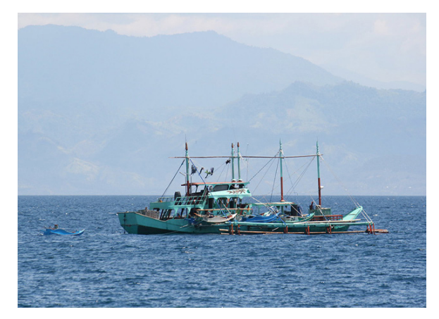
A fishing boat near Kiamba

The Tausug are primarily subsistence farmers who use water buffalo to plow their fields. Rice is the major subsistence crop, and it is intercropped with corn, cassava, millet, sorghum, and sesame. Other crops include peanuts, yams, eggplants, beans, tomatoes, and onions. Major cash crops are coconuts, coffee, hemp, and fruit such as mangoes, mangosteens, bananas, jackfruit, durian, lanzones, and oranges. The primary livestock raised are cattle, chickens, and ducks. Fishing in coastal waters plays an important role in Tausug subsistence and is carried out with nets, hook-and-line, and traps. Many municipalities also have seaweed farms.<sup>97, 98, 99</sup>