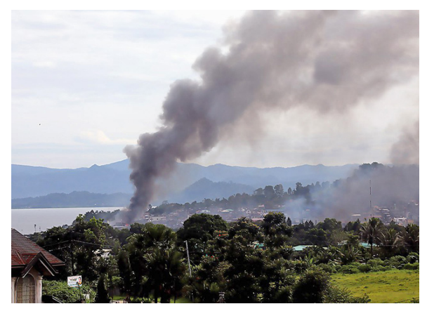
Airstrikes conducted against Mautes in Marawi City, 2017

As the peace process stalled in the Philippine legislature, various rebel groups became