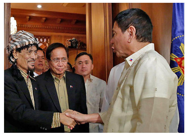
President Rodrigo Duterte meets Nur Misuari

emboldened. In 2015, dozens of Philippine police were killed in clashes with MILF fighters. In 2017, the Philippine army waged a bloody five-month battle to dislodge rebel groups aligned with the Islamic State from the Mindanao city of Marawi.<sup>62, 63</sup>