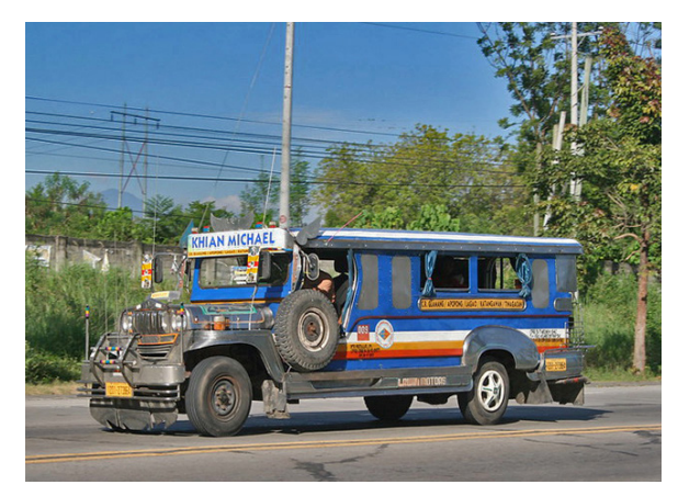
A Jeepney on the road in Mindanao

Public transportation modes throughout the Philippines, especially buses and jeepneys , are not safe because of pickpockets and theft. Armed robberies have happened and passengers have occasionally been killed.<sup>67, 68</sup> Jeepneys and tricycles are the traditional forms of public transportation in Sulu and Tawi-Tawi provinces. Used throughout the Philippines, jeepneys were first adapted from World War II U.S. military jeeps. A crowded jeepney can seat up to 30 passengers. Typically, the vehicles are decorated with colorful artwork, often including advertisements or political messages.<sup>69</sup>