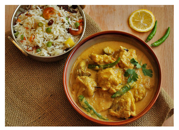
Chicken kurma and a rice dish

Tausug cuisine is heavily influenced by Malaysia, Brunei, Sumatra, and Indonesia. Unlike much of the rest of the Philippines, it does not have strong Spanish influences. Dishes are often accompanied by heavily spiced, coconut-milk based curries or sauces.<sup>41</sup> Examples include piyanggang , a chicken dish made with a green curry of coconut, lemongrass, and garlic; and beef kurma , a curried stew dish.<sup>42</sup> Tausug satti is a skewer of barbecued chicken or beef, served with rice cooked in young coconut leaves and accompanied by a sweet and spicy sauce.<sup>43, 44</sup>