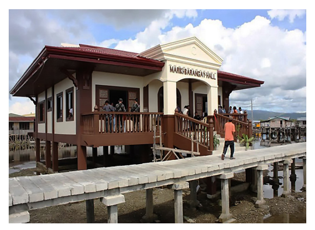
The Mariki Barangay Hall

Named after balangays, the Malay sailboats that carried early settlers from Borneo to the Philippines, barangays are the basic political units of local government in the Philippines.<sup>44, 45</sup> They are constitutionally recognized as governing community units of fewer than 1,000 people and may exist within a larger political unit, such as a municipality or city.<sup>46</sup> The chief executive officer of a barangay is the punong barangay (captain), who organizes community events, signs payments, and approves contracts. The sangguniang barangay is the legislative body of the barangay. Its members, called kagawad (counselors), include the punong barangay and seven additional elected members.<sup>47, 48</sup>