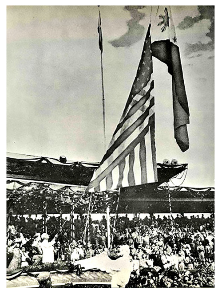
Flag ceremony on Independence Day, 1946

The Philippines gained full independence on 4 July 1946.<sup>44</sup> In 1950, Mohammad Esmail Kiram was restored as Sulu sultan. In 1962, the government recognized him and became increasingly interested in the affairs of Sulu.<sup>45</sup> In 1969, a Muslim (later Mindanao) independence movement emerged to press for a Moro nation (Bangsamoro). Armed clashes between Muslim and Christian groups escalated.<sup>46</sup> By 1971, Muslim Mindanao and Sulu were in a state of rebellion. A government task force was sent from Manila to mediate, with little success. At year's end, skirmishes between Muslim and Christian groups and the Philippine armed forces had cost the lives of over 1,566 people, 56% of whom were Muslims. The clashes created approximately 100,000 refugees whose villages were razed. They were predominantly Muslim but included Christian settlers and Lumad indigenous people, who had been pushed into the mountains.<sup>47, 48</sup>