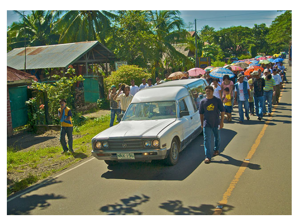
A hearse and its procession make their way

Mourners must maintain their composure throughout the service honoring the deceased. Corpses are thought to be still somewhat aware, so the service is