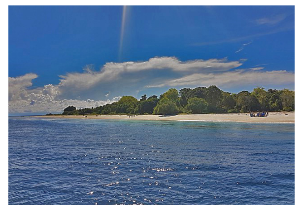
Panguan Island of the Celebes Sea in Tawi-Tawi

The climate of the Philippines is tropical, with generally warm temperatures in the non-mountainous regions.<sup>15</sup> The Sulu Archipelago, lying outside the typhoon belt, has a warm, moist climate characterized by two seasons. Rain is common throughout the year. Southeasterly rains fall from May to October and are replaced by dry winds from the northeast during the warm months of November through February. Temperatures are highest between May and August, when the relative humidity averages 86%. May is the hottest month, with temperatures averaging 31°C (88°F). Although January to April is considered the