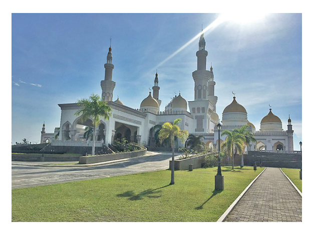
The exterior of the Sultan Haji Hassanal Bolkhia Mosque

Mosques are places of worship for Muslims. While men and women attend services therein, women must stay in the back, out of sight of the men. Visitors are allowed to observe, but should secure permission to do so.<sup>49,50</sup>