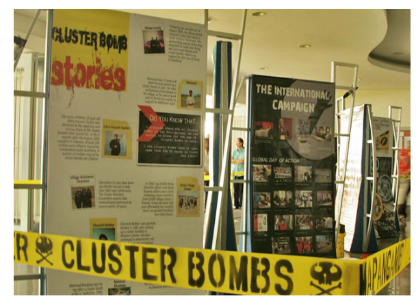
Information displays about the dangers of cluster bombs

In their decades-long antigovernment insurgency, the MNLF and ASG often plant mines throughout the Sulu Archipelago. Injuries from explosive devices are common. Most of those injured are civilians, but some are security force personnel. Some of these devices