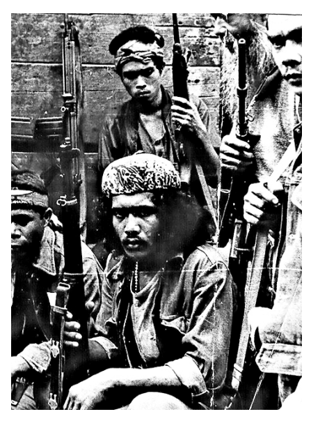
Moro National Liberation Front (MNLF) fighters fighting for independence Flickr / NCCA Official

the region flared intermittently for years. In 1974, the Philippine government formally recognized the creation of the government of Sulu. Several Muslim separatist groups formed during the period, including the Moro National Liberation Front (MNLF), the Muslim Independence Movement, and the Union of Islamic Forces and Organization. Finally, in 1977, negotiations between the MNLF and Manila forged the Tripoli Agreement, which provided for an autonomous Muslim region in Mindanao. But the talks collapsed, and fighting flared after Muslims boycotted the referendum for creating a provisional government.<sup>49, 50</sup> In 1989, the Organic Act for Mindanao officially created the Autonomous Region in Muslim Mindanao (ARMM), which included the three Tausug majority provinces.<sup>51</sup>