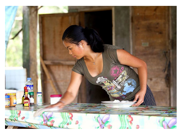
A young woman prepares a food table

Still, there is a tradition of separating the sexes, especially unmarried men and women. This separation does not extend to the seclusion of