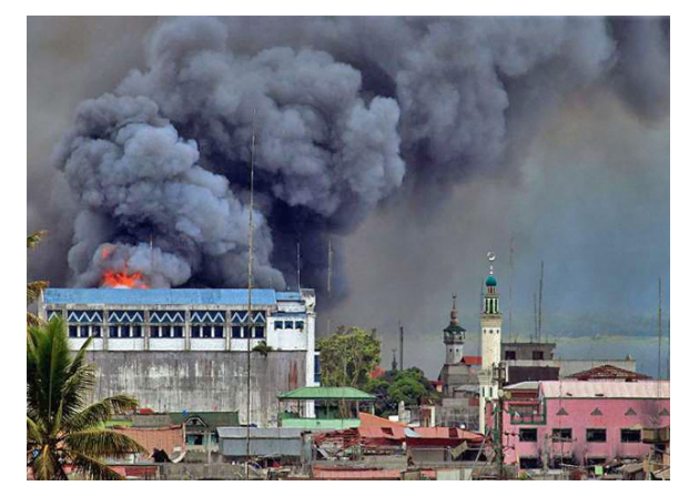
A structure fire caused by airstrikes in Marawi

The urban areas of Sulu Province, as well as the rest of the southern Philippines, face serious challenges. However, some are not typical urban challenges. One of the largest problems is the ongoing armed conflict between government forces and various insurgent and separatist groups. Between May and October 2017, the capital of Lanao del Sur Province, Marawi, was the scene of the longest urban warfare in Philippine history. The military fought against a coalition of Islamist insurgent groups that had taken control of the city and liberated it after five months. Reconstruction of Marawi is slow and likely to cost more than USD 1.2 billion over several years.<sup>6, 7, 8</sup>