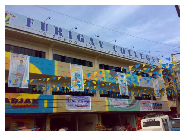
Furigay Colleges during the Lami-Lamihan Festival 2008

of schooling beginning at the age of six. This basic elementary education is divided into two components: primary (grades 1–4) and intermediate (grades 5 and 6). Public elementary school is free. Students receive a certificate of graduation upon completing their studies. Secondary education (junior high school) consists of four years of education.<sup>44, 45</sup> High school consists of two years of education, after which students may choose to attend a vocational school or college.<sup>46</sup>