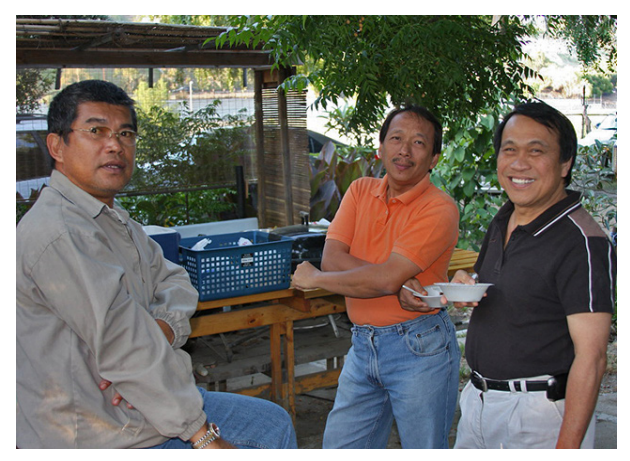
Three Tausug men socialize together

Bravery is a virtue instilled in every Tausug male throughout his life.<sup>17</sup> For him, combativeness or violence is considered bravery. The closest word in the Tausug language for "violence" is maisug , roughly approximate to "masculine," "violent," or