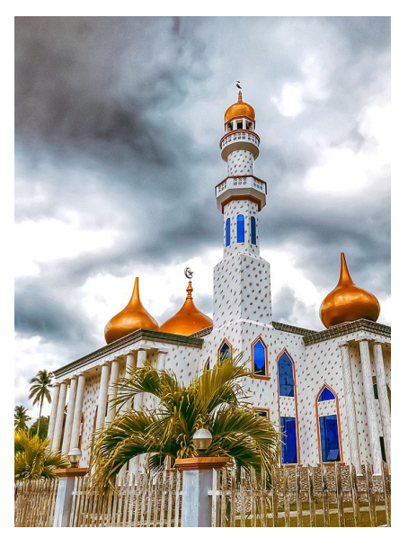
The Hadja Sitti Raya Mosque, Talipao, Sulu

Historically, Islam has been a unifying force for Tausug society against inner factionalism, colonizers, and the Christian-dominated government in Manila. The Tausug adhere to orthodox Sunni Islam, but some elements of pre-Islamic beliefs and folk Islam are also present. According to Tausug tradition, supernatural spirits inhabit both nature and man-made locations, and may be either good or evil. Healers ( mangungubat ) may alleviate suffering caused by evil spirits. In addition to seeking medical care and offering Muslim prayers when ill, the Tausug may also make offerings to healers and wear protective talismans.<sup>11, 12</sup>