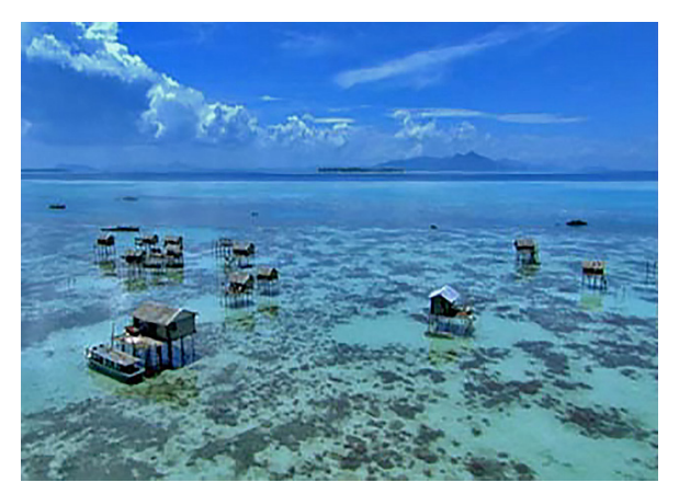
Stilt houses of the Samal-Badjao people

The Sama pay the greatest allegiance to their kinship group ( tumpuk ), who live clustered together. The group is headed by an elder with political and religious authority. Some settlements are based not on kinship but on participation in a particular mosque. In some settlements, it is normal for kinship groups to have exclusive use of mosques.<sup>118</sup>