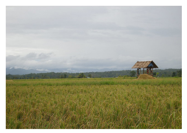
A rice field near Dipolog City

A lasting effect of the Philippines' Spanish colonial period is the concentration of land in the hands of a few wealthy landowners.<sup>3</sup> In the early- and mid-20th century, the land tenancy system was still in effect. Farmers worked the lands as tenant farmers, trading their labor and equipment for supplies, seeds, and tenancy rights from landowners. The farmers then planted and cultivated crops, dividing the harvest between farmers and owners. Under this system, tenants had to pay high interest rates and were perpetually indebted to the landowners. The tenancy system continued in modified forms during and after the U.S. occupation. Revolts against the system's