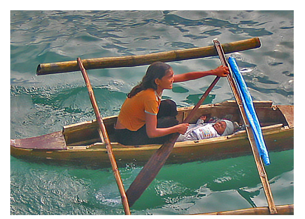
A Badjao mother and infant in a canoe

Often referred to as "Sea Gypsies" or "Sea Nomads," the Muslim Badjao are the original indigenous people of the Sulu Islands.<sup>120</sup> Traditionally, they lived full-time on boats called lepa-lepa , surviving on what they could harvest from the ocean. They ventured onto land only to barter their catches and resupply themselves. In recent years they have become more settled on the land along the coast, often living in houses built on stilts, particularly in Tawi-Tawi Province. Some of these stilt houses are built over water, nearly 1 km (0.6 mi) offshore. The Badjao make their living as fishermen and deep-sea divers. They are such accomplished divers that they