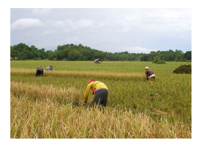
Workers harvesting rice in a field

Since the turn of the 21st century, the government has made efforts at equitable redistribution of farmland. Under the Comprehensive Agrarian Reform Program, government land suitable for agriculture but no longer used that way was identified for redistribution. Qualified beneficiaries, often marginalized agricultural workers, received certificates legally securing their land tenure.<sup>13, 14, 15</sup> In 2014, a former coconut plantation near Siasi in Sulu Province covering 1,300 hectares (3,213 acres) was broken up and distributed to 273 farmers.<sup>16</sup>