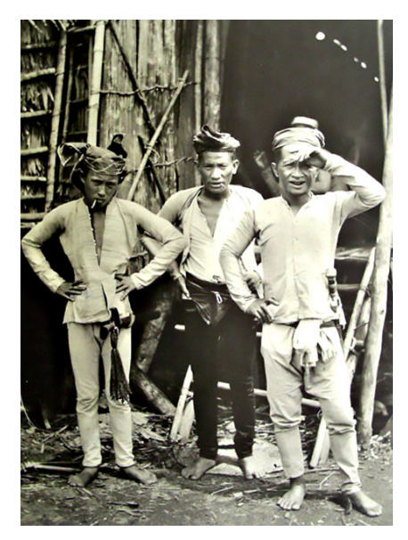
Moro men from the Sulu Archipelago pose together

The concept of reciprocity is important to not only the Tausug but every other culture in the Philippines. Buddi , the the Tausug term for reciprocity, embodies the notion of a debt of gratitude. This deference is always used in a positive manner to demonstrate goodwill toward those who offer gifts or favor to the recipient. As with sipug , buddi extends beyond the individual and reflects upon the family as well. Reciprocation that calls for revenge is known as tungbas . In of the context of violence, tungbas demands a life for a life.<sup>23</sup>