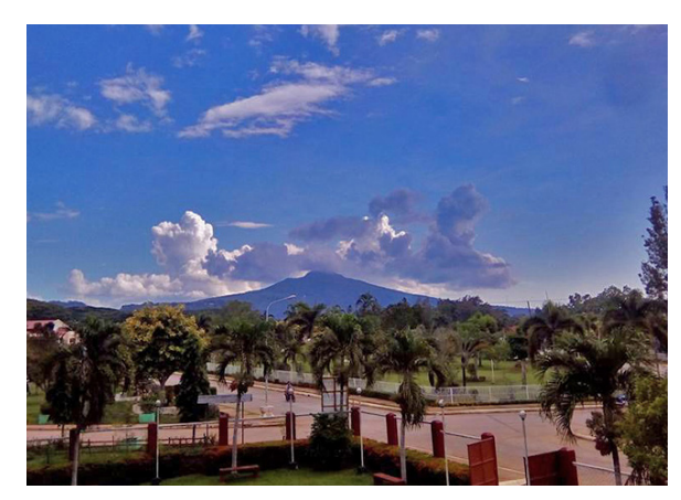
Bud Dajo volcano as seen from Jolo

The Sulu Archipelago is a series of volcanic and coral islands.<sup>7</sup> The archipelago contains three provinces: the northernmost islands of Basilan, Sulu in the center, and Tawi-Tawi on the southernmost tip.<sup>8, 9</sup> Sulu Province is rimmed by the Sulu and Mindanao Seas to the west and north, and the Celebes Sea to the east. The province comprises over 150 islands and islets, some of which are uninhabited. As a result of expanding human settlement, only a few wooded areas, which once consisted primarily of lowland rain forest, remain.<sup>10</sup>