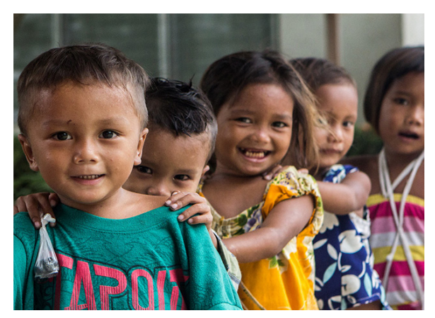
Badjao children in a Davao City school

reflected in many of their cultural rituals. One such custom involves tossing a newborn into the sea, where clan members dive in to save it. Many have fled to Malaysia and Indonesia to avoid the ongoing civil strife in the Philippines.<sup>121, 122</sup>