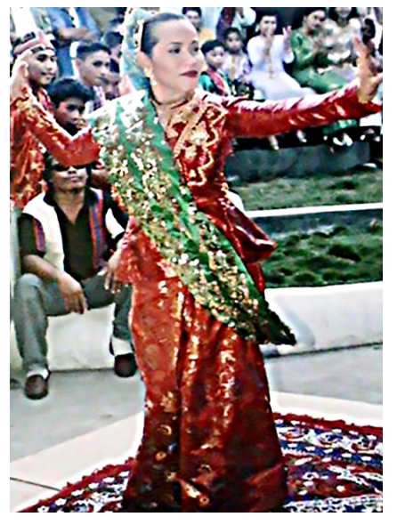
Tausug woman in traditional dress performs a pangalay dance

Clothing for Tausug men commonly includes a fitted shirt and pants with a matching waist sash and turban. Locally sourced cotton is the most common fabric used.<sup>56</sup> In the greater Sulu region, the patadyong is a featured piece of traditional clothing that resembles a sarong. Both men and women wear loose baggy pants known as sawal or kantyu . For men, the sawal is generally worn with a polo shirt, whereas women usually wear a sambra or collarless V-neck blouse with short sleeves. Sometimes women wear a sablay , a long-sleeved blouse reaching the hips. Another popular top for women, the biyatawi , features a tight-fitting bodice that flares at the waist. Common headgear for men is a cloth hat with geometric or floral designs. If a man has made the Hajj to Mecca, he may wear a white cap.<sup>57</sup>