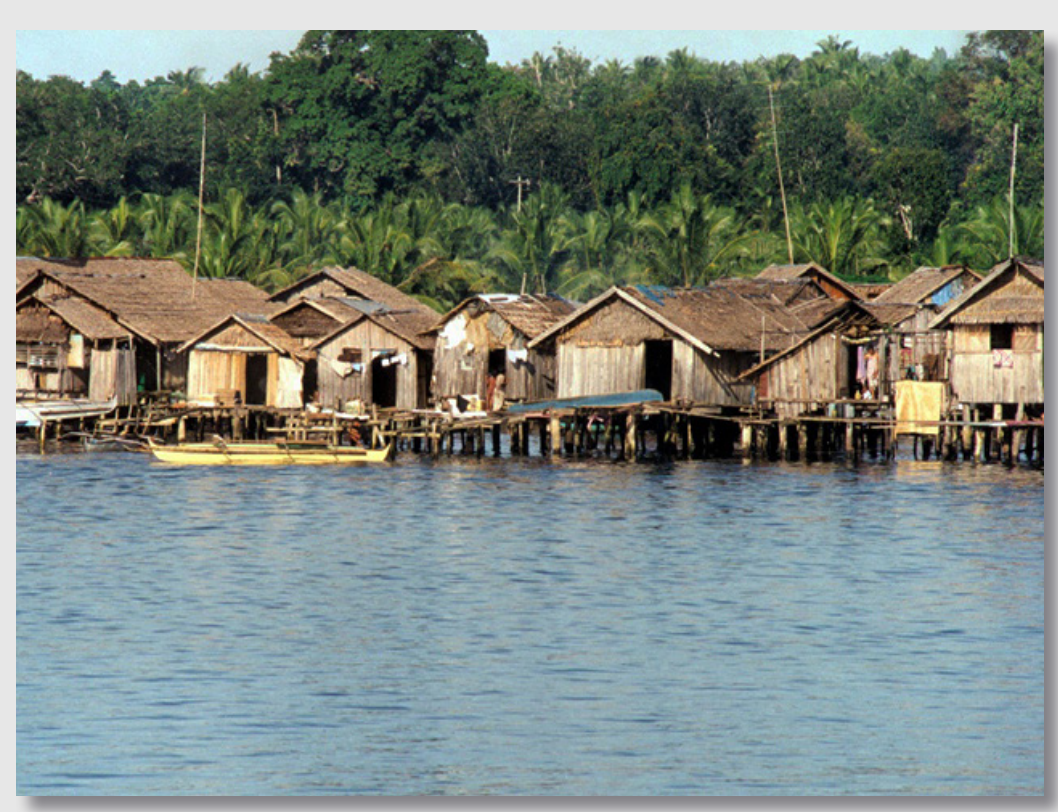
Stilt houses along the water in Basilan