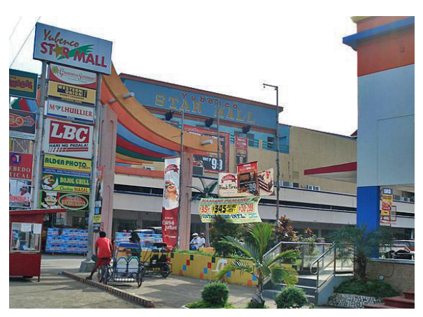
Exterior of the Yubenco Star Mall

Jolo Town is the commercial center of Jolo Island and the showpiece of Sulu Province. It features over 4,000 retail stores plus many small vendors in public markets or on the roadside near the commercial area.<sup>61</sup>