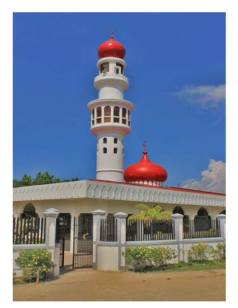
The Taluksangay Mosque, located in Barangay Taluksangay, Zamboanga

This holiday, literally meaning "sending away evil," falls on successive Wednesdays during the second month of the Muslim lunar calendar. It is a ritual held on the beach. Prayers and ablutions are meant to excise accumulated bala , a form of supernatural evil believed to accumulate in the body. It may take many forms, including disease, drought, and warfare. Rafts are loaded with various foods and a live chicken before being released into the current in order to lead the spirits away from the land.<sup>46, 47, 48</sup>