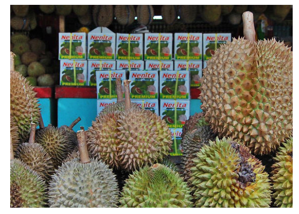
Durians in a marketplace

Tausug cuisine is noted for being spicy, and tiula itum (black soup) is particularly spicy. It is a dark, chicken-or beef-flavored broth prepared with ginger, turmeric, and burned coconut meat. It is served on special occasions such as weddings, but may be available at restaurants.<sup>55</sup>