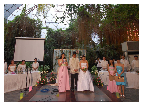
A wedding ceremony at a garden in Manila

Following the ceremony, the couple generally moves in with the bride's parents. The bond between the father and son-in-law needs to be as strong as that between father and son. After one year or the birth of a child, the couple moves in with the groom's parents or into their own home.<sup>43</sup>