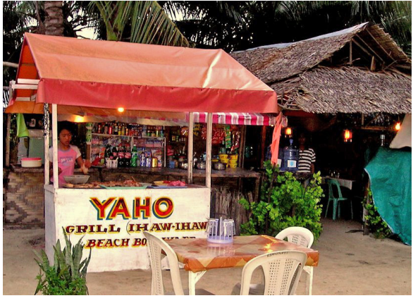
Outdoor dining along the shore in Mindanao

A popular breakfast in Sulu is satti , which is made of barbecued beef bits served on skewers and steamed rice balls cooked in puso (coconut leaves). These are topped with a curry-like sauce.<sup>52, 53, 54</sup>