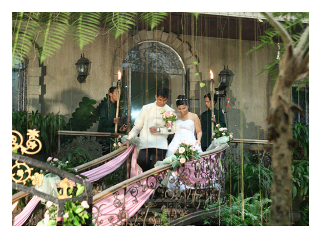
A marriage ceremony underway

( ungsud ), wedding expenses and cost of attire with the girl's father or male kin. Once both parties come to an agreement, the ungsud , the wedding may take place. The end of Ramadan is a favorite time for weddings, as is the month of the Prophet Muhammad's birth.<sup>22, 23, 24</sup> The traditional arranged marriage is often regarded as reflecting the wishes of the parents. A pagdakup (elopement) is said to reflect what the woman wants, while a pagsaggau (marriage via abduction) reflects the man's wishes.<sup>25</sup> With a pagsaggau , a man takes the prospective bride to the home of the datu , who will solemnize the wedding. The man must pay a fine for "abducting" his bride, but the price is often lower it would be for a negotiated marriage.<sup>26, 27, 28</sup>