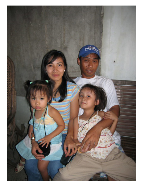
A Filipino family photo

Tausug women often marry at an early age, sometimes as young as fourteen. Traditionally, Tausug family size was large, and having as many as 10 children was the norm. This attitude is changing, but families are still large since the most popular family planning strategies involve the rhythm method and abstinence. Women are known to use herbs or roots to avoid pregnancy.