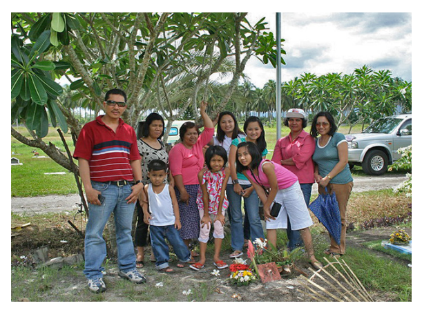
A family paying respects at a local cemetery

The Tausug meaning of friendship involves a social contract that demands reciprocity, particularly when dealing with violence. Reciprocity levels typically increase but rarely decrease. A Tausug who fails to live up to these obligations brings shame upon himself