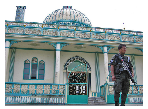
Due to ongoing armed insurgencies by the ASG and other armed groups, both Sulu and Tawi-Tawi provinces are dotted with checkpoints manned by Philippine security forces. The checkpoints may be permanent, as at the entrances of military installations, or temporary, set up in response to emerging security developments. Checkpoints are sometimes the scenes of bombing attempts by militants or shootouts between militants and security forces.<sup>50, 51, 52</sup>