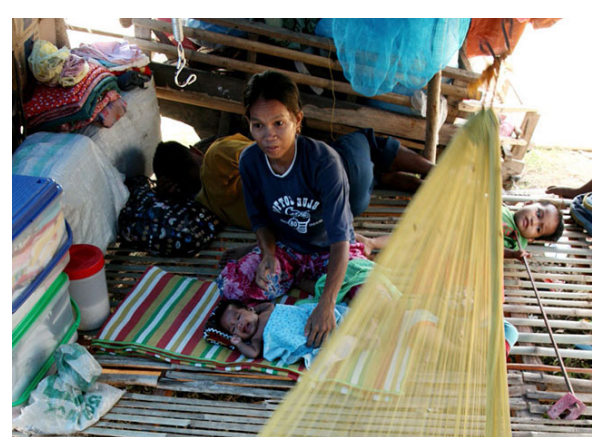
Infants cared for shortly after birth

Pregnant women may not go swimming in a lake, sea or ocean because of the belief that doing so increases the risk of stillbirth. Births may occur at home or in a hospital (in some of the larger cities such as Jolo Town). Loud gongs announce the child's birth, and an imam often arrives to offer