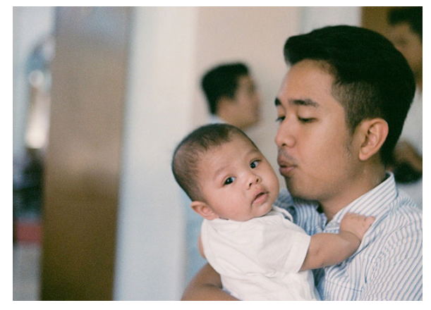
An uncle and a newborn baby

Newborn Tausug children are not named immediately. They are frequently given a temporary name until they are one or two years old. Tausug parents often select Arabic names for their children, such as "Ameer" for a boy. They may also choose the names of well-known Americans. Nonsense words may be chosen as names because parents like the way they sound. The father's first name will be the child's last name.<sup>54</sup>