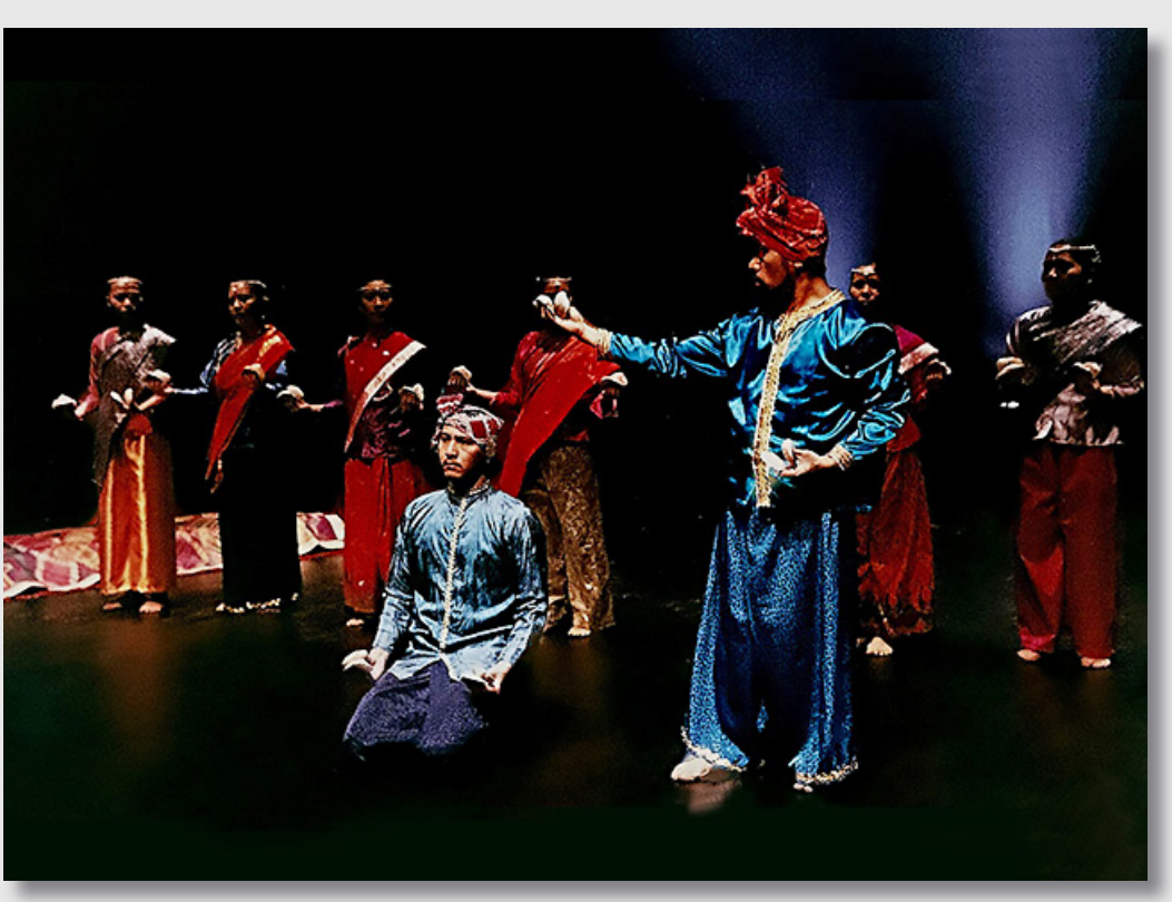
Traditional Tausug dancers perform together