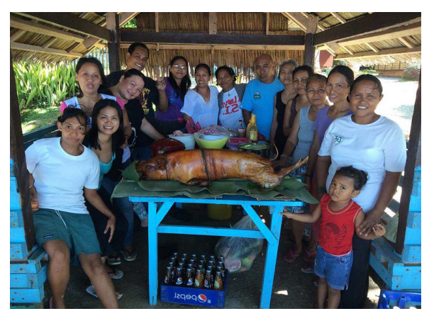
Pig roast at a beach party near Davao

Upon entering a Filipino house one, should say something complementary about it. Guests should not arrive exactly on time. Doing so could make the guest seem greedy and place the host family in an embarrassing position. Punctuality is not regarded as polite. Rather, it is better to arrive approximately 15 minutes after the appointed time. In rural homes, shoes are removed upon entering; in urban settings, this custom is less common. Some homes will have slippers available for walking around the house.<sup>35</sup>