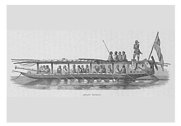
Illustration of Moro pirates of the 19th centurye

According to recent estimates, about 1,285,000 Tausug live in the Philippines, most of which reside in the Sulu Archipelago.<sup>8</sup> Worldwide, Tausug numbers reach 1,522,000. Beyond the Philippines, the Tausug are found in Indonesia and Malaysia.<sup>9</sup>