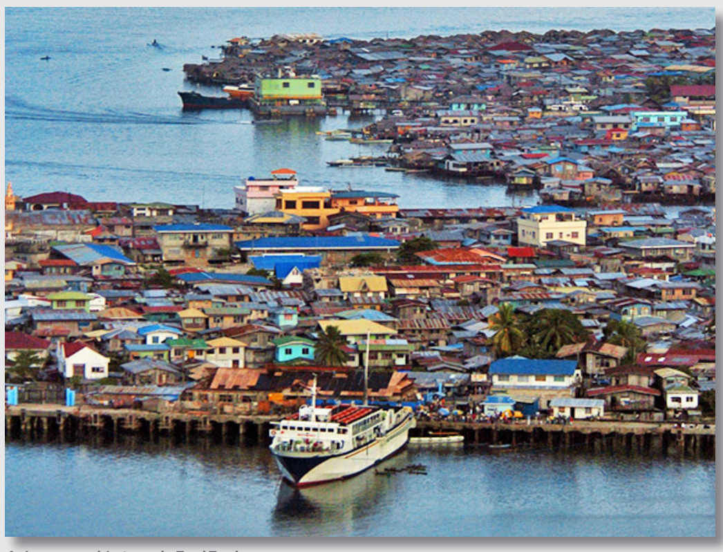
A dense seaside town in Tawi Tawi