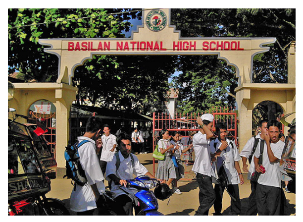
The gateway to Basilan National High School

In 2015, the literacy rate across the Philippines for males and females over 15 years of age was 96.3%.<sup>40</sup> In Sulu Province, literacy stood at 83% in 2015.<sup>41</sup> The 2008 functional literacy rate, which gauges a person's basic reading, writing, and computational skills, for ages 10 to 64 was 79.6%. The failure of many children to develop basic learning skills by the end of their primary education increases the dropout rate, which was about 51% in 2009–2010.<sup>42, 43</sup>