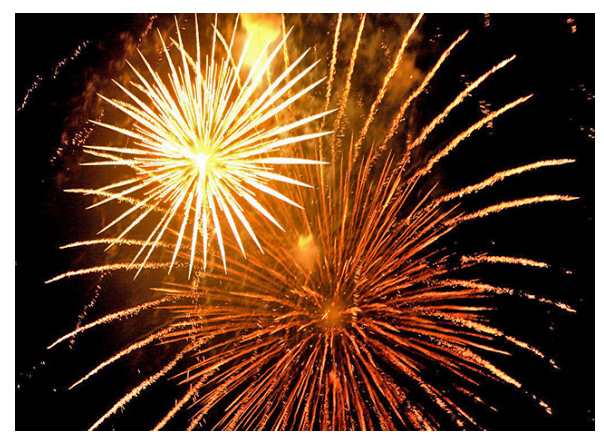
Fireworks above Makati City in 2007

New Year's Day is celebrated throughout the Philippines on January 1.<sup>61</sup> The Islamic New Year, taking place in Muharram (the first month of the Islamic calendar), is celebrated by the Tausug and other Muslim Filipino groups. The date varies by