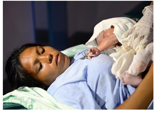
A mother and child receive care after a typhoon

Life expectancy throughout the Philippines is relatively low; the average Filipino is expected to live about 70 years. Life expectancy in rural areas is particularly affected, as people that live there receive a lower level of investment in medical services than urban areas. High rates of poverty, poor quality healthcare, and a lack of access to healthcare create higher incidences of health risks. The Philippine infant and maternal mortality rates are similar to the median of worldwide mortality rates. Around 6% of Filipino adults are obese, and almost 22% of children are underweight.<sup>30, 31</sup>