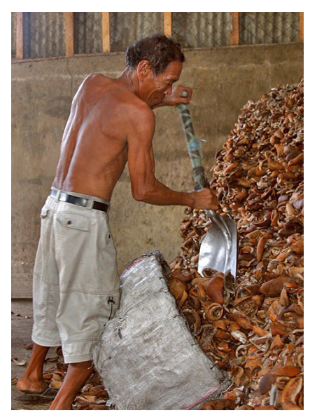
A worker bags up copra

The industrial and services sectors in Sulu Province have been held back by ongoing violence and terrorist activity. The Philippine government and the private sector have launched various initiatives to encourage economic development. Sulu's manufacturing activities are focused on bamboo household items, metal implements, mats, and headcloths.<sup>100</sup> Promising growth areas include telecommunications, hospital services, and coconut milling. In 2018, the World Bank encouraged the establishment of a free trade zone encompassing Basilan, Sulu, and Tawi-Tawi.<sup>101, 102, 103</sup>