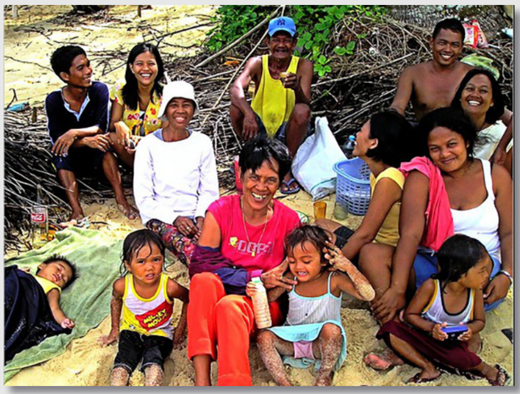
A docked passenger boat in the Philippines