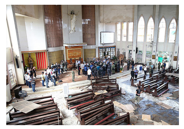
The destruction caused by the Jolo cathedral bombing

In Jolo Town, the bombing of a Catholic cathedral that left 22 people dead followed on the heels of the January 2019 referendum on the creation of the Bangsamoro Autonomous Region in Muslim Mindanao (BARMM). The bombing was likely coordinated by the Abu Sayyaf Group (ASG), which continues to seek an independent Muslim state in the southern Philippines.<sup>9, 10, 11, 12, 13</sup> Since the bombing, there has been a steady stream of deadly attacks by the Abu Sayyaf Group and clashes with government forces in Sulu Province.<sup>14, 15, 16, 17</sup>