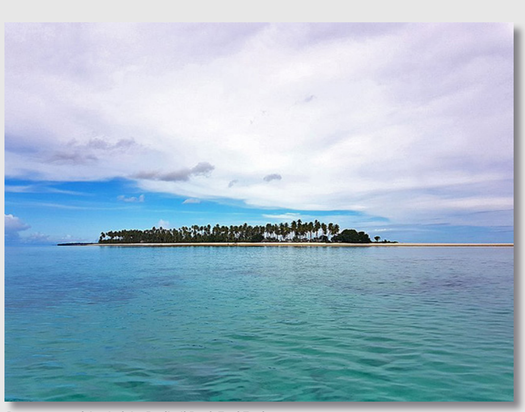
Panampangan island of the Basibuli Reef, Tawi-Tawi