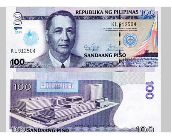
Front and back of 100 Philippine peso (PHP) currency

The official unit of currency is the Philippine peso (PHP). In August 2019, USD 1 was equal to approximately PHP 52.<sup>59</sup> ATMs are readily available in most urban areas but may be less prominent in rural settings. Credit cards are widely accepted in larger towns and cities, but in small towns and on infrequently visited islands it is difficult to use credit cards. Credit card fraud is widespread, so vigilance is advised when using credit cards; always keep cards