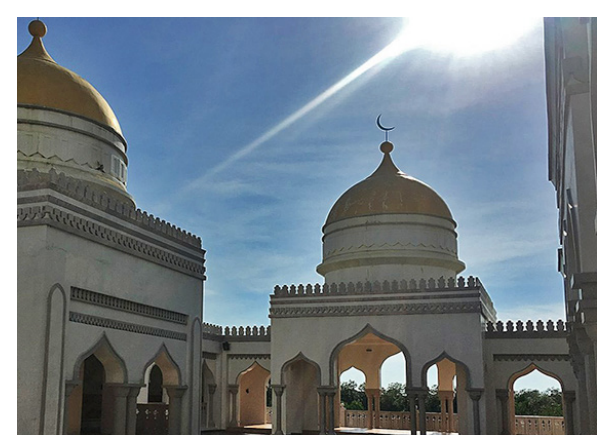
Inside Sultan Haji Hassanal Bolkhia Mosque

The Prophet Muhammad's birthday is celebrated in the third month of the lunar new year.<sup>35</sup> Each mosque selects one evening for an all-night celebration. Imams chant continuously in Arabic, and special flowers are placed in the center of the mosque. When the imam reaches a certain point in the service, each congregant stands up to hold a flower. The service is noteworthy for its informality; congregants pass the time by smoking, chatting, and gossiping about current events. Around midnight, they enjoy a communal feast to which each family brings a tray of food. Sharing food garners credit for generosity.<sup>36</sup>