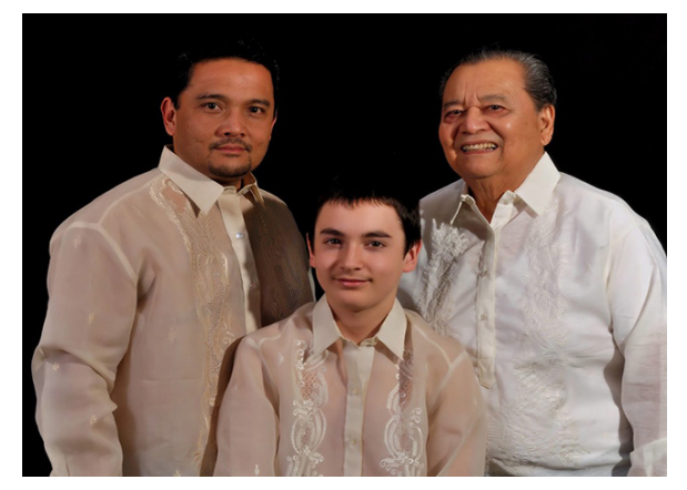
Family portrait in traditional barong tagalog shirts

Business attire, similar to that worn in Western countries, is common in addition to traditional formal wear. In general, in a business environment, conservative dark-colored suits are appropriate for both men and women. Filipinos will not remove their suit jackets unless the most important or senior person does so first.<sup>58</sup> Suits, ties, and grooming are important considerations. It is recommended that earrings not be worn by men, and facial hair groomed when dressing for business. The barong tagalog , or simply barong , is the traditional and formal dress shirt for men. The barong features intricate embroidery and is worn untucked.<sup>59</sup>