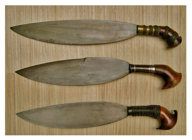
The Moro barong short sword

Much has been made of the Tausug warrior culture, with its historical propensity toward violence and warfare. Tausug men are commonly portrayed as fierce warriors who are always armed with a Moro Kris sword dagger, Barong knife, or in more recent times, firearms. The Tausug male's role as protector is foremost and accounts for the popularized image of a well-armed warrior.<sup>80, 81, 82</sup> Modern weaponry and firearms did not become readily available until aftermath of World War II, when massive amounts of weapons were left in the region by Japan. Once these weapons were introduced to the culture, they became a mainstay in the region.<sup>83</sup> Firearms