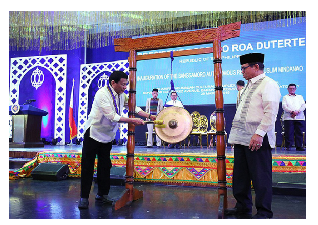
Religion and Government

Muslims regard the Quran as sacred and it should be treated with respect. Do not touch the Quran with dirty hands. Keep the Quran off the floor. If sitting on the floor, hold the Quran above the lap or waist. When not in use, protect the Quran with a dust cover and do not place anything on top of it. In general, Muslims keep Quranic texts on a bookcase's highest shelf. Finally, keep the Quran out of latrines.<sup>18</sup> Old or damaged copies may be properly disposed of in one of two ways. Burning is acceptable if conducted with respect. Quranic texts should not be burned with trash that can be buried. Before burying the Quran, it should be wrapped in something pure and then buried where no one may walk over it.<sup>19, 20</sup>