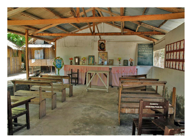
A rural schoolhouse

The academic year in the Philippines begins in June with the start of the rainy season. The school year ends in late March and students are on break through May. The nation has a 2–3-week break during the