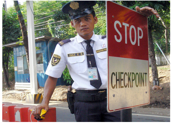
A security checkpoint at Manila airport

Government guidelines state that checkpoints must be well-lit and manned by properly uniformed police officers from the Philippine National Police. When approaching a checkpoint, drivers should slow down, dim headlights, turn on cabin lights, lock all doors, and stay inside the car. Only visual searches are allowed. Drivers do not need to open glove compartments, trunks, or bags. Always keep documents, including driver's license and registration, within physical reach.<sup>56</sup>