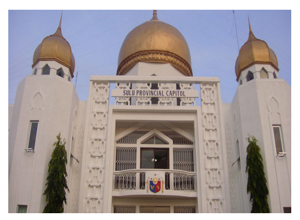
Sulu Provincial Capitol building in Jolo

A severe lack of access and a disconnected judicial structure in the region has created problems for the administration of Islamic law in Muslim communities. This is reflected in the mix of Sharia and customary legal code ( adat ) currently used to administer justice, which is meted out by a datu (headman) rather than Islamic judges seated on the bench of a Philippine Court.<sup>27, 28, 29</sup>