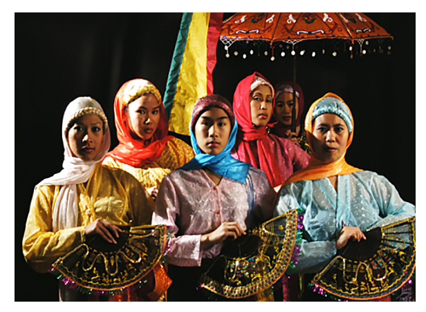
Tausug women in traditional garb

The Tausug, whose name means "People of the Current," represent the largest Islamic ethnic group in the Sulu Archipelago. They are concentrated on Jolo Island, but significant numbers live on the islands of Pata, Marunggas, Tapul, and Lugus.<sup>107</sup> The Tausug often see themselves as superior to other groups and rarely regard themselves as Filipino. Their language is a Malayo-Polynesian dialect written in a Malayo-Arabic script referred to as jawi or sulat sug .<sup>108</sup>