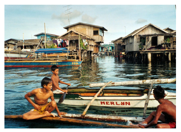
Samal children playing on a boat near stilt houses

The Samal are a predominantly Muslim group concentrated largely in the Sulu Archipelago. Their language, Samalan (Siamal), is one of the oldest in the Sulu Archipelago. Most Sama are fishermen or gatherers of seaweed or shells. Some supplement their incomes by growing crops, mainly rice and cassava, especially those in the southernmost regions. Shipbuilding is an important enterprise, particularly on Sibutu Island.<sup>112, 113, 114</sup> The Sama can be divided into several relatively distinct groups, including the Balangini and the Pangutaran.<sup>115, 116</sup>