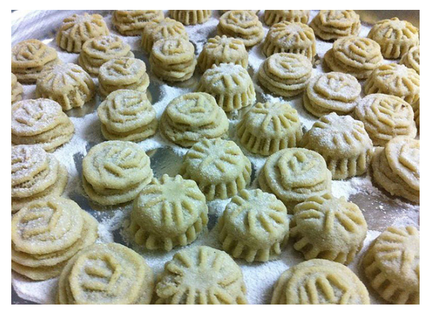
Homemade cookies to celebrate Eid al-Adha

Fasting during the daylight hours of this holy ninth month of the lunar calendar is a requirement for all Muslims, with exemptions granted to the young, old, sick, and pregnant. The lack of food and water may cause grumpiness and fatigue. Often during Ramadan, business hours are erratic and many shops are closed. As in other Muslim areas, non-Muslims should refrain from eating, drinking, smoking, or chewing gum in public during Ramadan. The fast is broken on the first day of the following month with a large and celebratory feast. This day is known as Hari Raya (Eid al-Fitr). People wear their best clothes and visit friends and relatives, as well as venture to