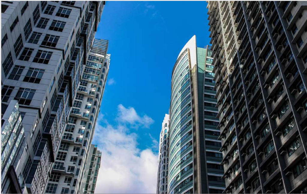
Bonifacio Global City - Philippines