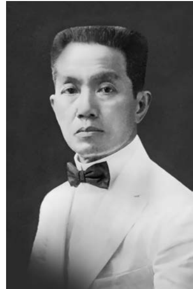
Portrait of Emilio Aguinaldo (1869-1964)

In 1897, Emilio Aguinaldo emerged as the head of the newly formed revolutionary government. He executed Bonifacio, whom he saw as a rival, and mobilized against the Spanish. Once again, the Spanish defeated the rebels and Aguinaldo and his followers were exiled to Hong Kong. 26