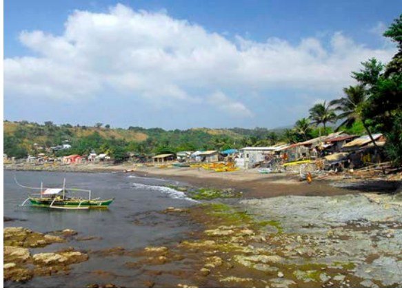
Philippines Fishing VillageE, South China Sea

of the Philippines, partly because its location faces the full brunt of typhoons. 24, 25 The Central Visayas are among the most densely populated islands in the archipelago. The major urban areas in the Visayan Islands are Cebu on Cebu Island and Iloilo City on Panay Island. 26