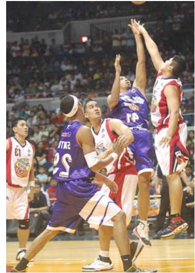
Basketball is a national obsession

Eskrima , along with kali and arnis , is a martial art practiced in the Philippines.