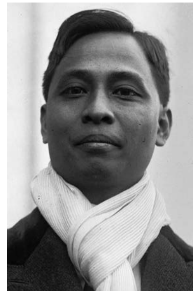
Manuel Roxas, Speaker of H., Philippines

Liberation Party (Hukbong Mapagpalaya ng Bayan), led an insurgency to gain political participation and reform the legislature and security forces. Their struggle weakened and fell into criminal activity by 1951. 50