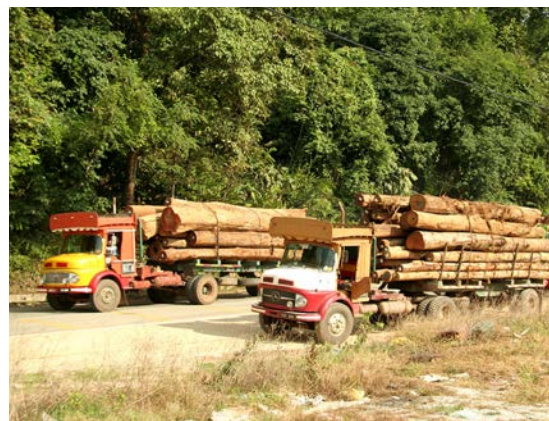
Gua Musang

Ten km (6 mi) north of Manila, fast-growing Quezon City is part of the capital metropolitan area. Named after President Manuel Luis Quezon, the city was the capital of the Philippines from 1948 to 1976. Today, it is home to light industry, expansive resettlement housing projects, and the country's premier university, the University of the Philippines. 84