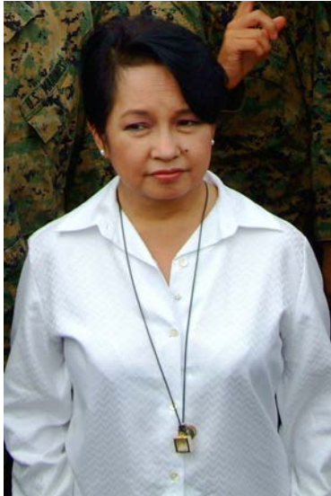
president Gloria Macapagal Arroyo

In 2010, Liberal Party Senator Benigno S. Aquino III, son of Benigno and Corazon Aquino, won the presidential election by a landslide. 91 Aquino's major accomplishment was achieving peace with the Moro Islamic Liberation Front in 2012 after four decades of violence. The deal promised greater autonomy to Mindanao's Muslim region. During Aquino's tenure, the Philippines won a favorable judgment from the international tribunal in The Hague regarding a dispute with China over disputed islands in the South China Sea; China has rejected the decision. However, Aquino's administration faced criticism for economic growth that benefited only the elites and for the sluggish response to the devastating Super Typhoon Haiyan in 2013. 92