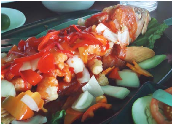
Sweet-sour lapu lapu

Philippine cuisine is as diverse as the many groups that inhabit the archipelago. Malay, Spanish, and Chinese flavors influence indigenous and foreign dishes. Rice and seafood, two of the country's major agricultural products, are staples of the Philippine diet. Most dishes are made with steamed or boiled rice or rice noodles complemented by fish, chicken, beef, or pork (for non-Muslims). 54, 55