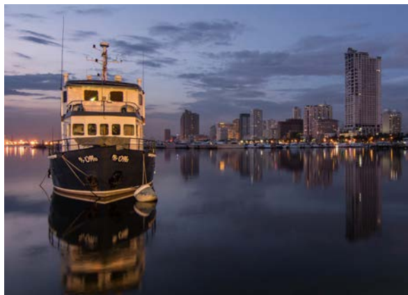
After sunset - Manila Bay

about 17 cities including Manila City, Pasay, Quezon City, and the Makati financial district. In addition to commerce and finance, Manila’s diverse economy includes textile production, food processing, publishing, printing, and tourism. 71, 72, 73 Filipinos get around in vehicles called jeepneys (small buses made of jeep frames), elevated rail, taxis, and private cars. 74 Vehicle emissions are a significant source of air pollution in Manila. 75 Another major concern for the city is addressing the needs of millions of Filipinos who live in shantytowns. 76, 77, 78