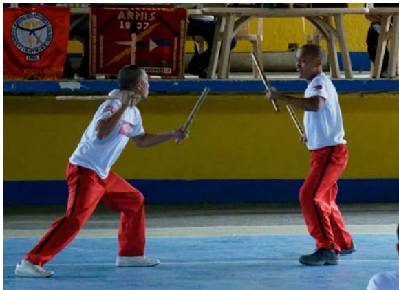
Martial arts in the Philippines