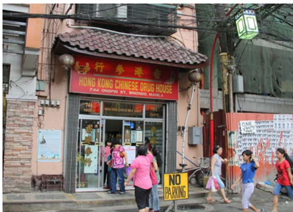
Chinese drug house in Manila

According to a 2012 UN report, the Philippines has the highest rate of methamphetamine hydrochloride (shabu) use in East Asia. 98, 99 President Duterte made the promise of a brutal war on drugs the centerpiece of his 2016 presidential campaign. 100, 101 Within 15 months of Duterte's victory, more than 7,000 alleged drug traffickers and drug users had been killed in encounters with police or in so-called vigilante killings. 102 Human rights groups estimated that up to 13,000 were killed, mostly small-time drug dealers and users, and bystanders, including children. 103, 104, 105 The death of a 17-year-old boy in police custody in August 2017 sparked public protests and demands