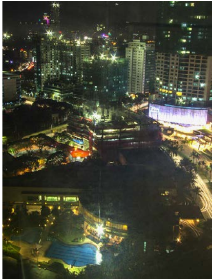
Cebu City 2015

Cebu City, on the eastern coast of Cebu Island, is the oldest city in the country. It was first reached by Ferdinand Magellan in 1521, then in 1565 by Miguel Lopez de Legazpi, who initially made it the Spanish colonial capital. Starting with a rebellion in 1898, the city was a center of resistance to Spanish and US occupation. During WWII, Cebu's port escaped destruction, and the city was rebuilt around it. Today, Cebu is the commercial, cultural, and transportation center of the Visayan region. It is an important education center, home to five major universities. 82, 83