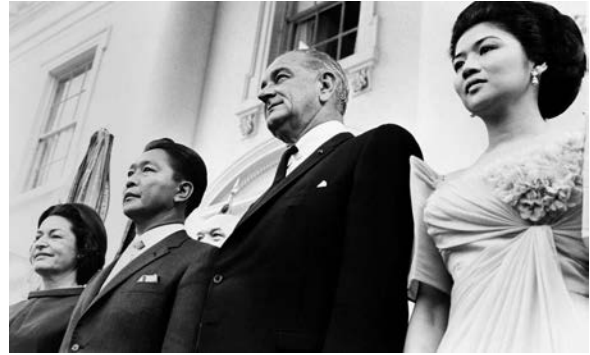
Ferdinand and Imelda Marcos during a state visit at the White House in 1966

During Marcos's second term, economic growth stagnated, optimism faded, and violent crime increased. Socialist insurgents and Muslim secessionists threatened national security. The Muslim rebels were divided into two camps, the Moro National Liberation Front (MNLF) and its splinter group, the Moro Islamic Liberation Front (MILF). Muslim-Christian violence increased in Mindanao and the Sulu Archipelago, where many Christians from the north had migrated with support from the government. 57