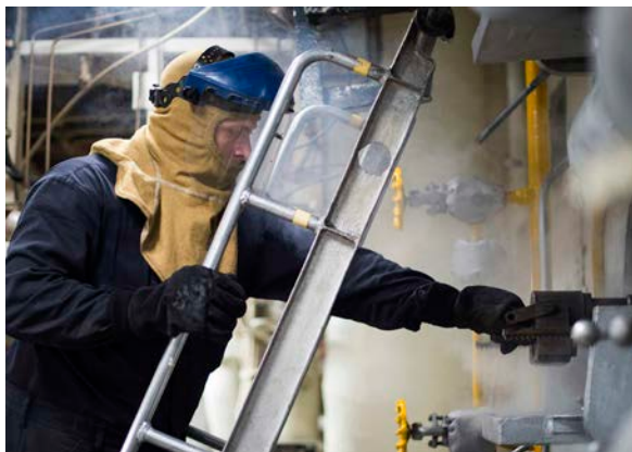
Gas Turbine System Technician.

The Philippines imports 90% of the petroleum it needs. 41 In 2016, crude oil production was an estimated 5,502 bbl (barrels per day) and oil reserves were estimated to be 100 million bbl. 42 The country's main oil and gas fields are located off Palawan Island. 43