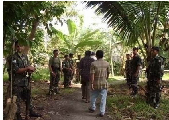
Verification Mission to investigate allegations of landmine use by the Moro Islamic Liberation Front

The MNLF was founded in 1971 with the goal of fighting for an independent Moro nation. 72 The MNLF negotiated a settlement with the government in 1996, ending a decades-long conflict that claimed an estimated 120,000 lives. 73 The peace treaty provided limited autonomy to four provinces in Mindanao under the Autonomous Region of Muslim Mindanao (ARMM). 74 Since the area is only semi-autonomous and the peace negotiations did not address all Moro concerns, low levels of violence continue. Since the settlement, the MNLF has weakened and largely demobilized, but some members splintered off to form the Moro Islamic Liberation Front and Abu Sayyaf. 75, 76