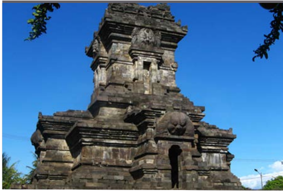
Singosari temple at Singosari

Arab Muslim traders reached the Philippine islands in the 10th century. 12 Between the 14th and early 16th centuries, Islam spread throughout the archipelago, as far north as Luzon. In the northern and central islands, however, Islam never penetrated beyond coastal towns and villages. 13 Filipino Muslims were later called Moros by the Spanish. 14