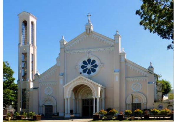
Immaculate Conception Parish Church (Batac, Ilocos Norte)

The Spanish converted most Filipinos to Catholicism through a new colonial social system. They created new state-administered ecclesiastical establishments, co-opted local leaders, protected the interests of Christian converts, and conferred land titles to members of a new social class, the principalia . Jesuits and other religious orders met with little indigenous resistance, and most of Luzon, central Philippines, and coastal Mindanao were converted. The Christianization process destroyed traditional ways of communal land use and ownership, forced different tribes to live together, and broke territorial boundaries. The new cultural community of the lowlands left the Muslims and the upland tribes alienated. 22