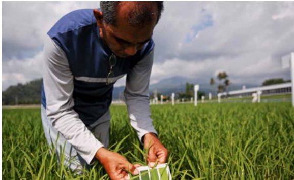
Technician uses a 4 panel leaf color chart

The agricultural sector, which includes forestry and fisheries, has historically been the backbone of the nation's economy. Over 40% of the country's total land area is arable farmland. The volcanic soil is rich and fertile, supporting a variety of crops throughout the year. 5, 6 The main agricultural products include rice, fish, livestock, poultry, bananas, coconut/copra, corn, sugarcane, mangoes, pineapple, and cassava. 7 Rice, coconut,