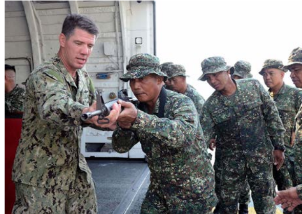
Security Training Command flickr / U.S. Pacific Fleet

After Philippine independence from the United States, the two countries signed the Military Base Agreement (MBA) granting the United States the right to establish bases in the Philippines. U.S. forces used Philippine bases as staging areas during the Vietnam War. Thousands of U.S. military personnel and civilians were stationed in the Philippines. In 1992, the MBA expired, and the Philippine Congress refused to renew it. Although U.S. bases closed, the two countries continued military cooperation on defense issues through a series of agreements. 1, 2, 3