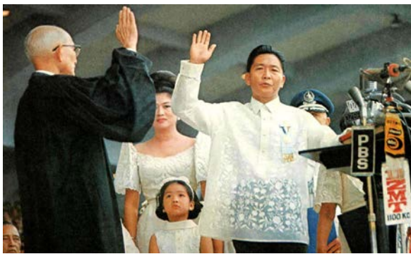
Ferdinand Marcos takes the Oath of Office for a second term before

Citing communist threats and lawlessness, Marcos suspended habeas corpus in 1971. Martial law followed in 1972 and lasted until 1981. Investigations later showed that government agent provocateurs may have orchestrated bombings in Manila and other large cities. In 1973, Marcos gained absolute power through a new constitution. He restricted liberties, suppressed opposition, and consolidated power. Rampant corruption and cronyism in his administration contributed to significant economic decline. 58