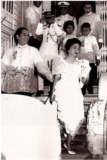
Post-Independence (1946-Present)

The Huk Rebellion (1945-53) marked the first eight years of independence. 49 Elite landowners, many of whom had supported the Japanese during the war, returned to their lands and forcefully demanded back rent from peasants, many of whom had fought the Japanese. To this backdrop, the Huks, by then renamed the People's