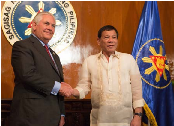
Philippine President Rodrigo Duterte with U.S. Secretary of State

President Duterte's violent and deadly war on drugs is a primary political risk factor for the Philippines. The effort has played well to Duterte's populist base, but has unnerved investors who are needed to sustain the country's robust economy. As the crackdown continues, Duterte's popularity has begun to decline and he has taken steps to distance himself from his policy. His support from the Philippines' legislature remains strong. 128, 129