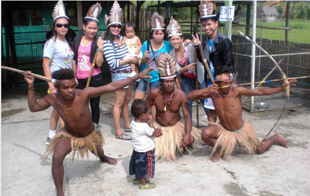
Loay bohol tribes men