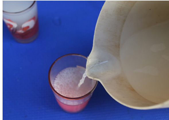
Coconut Wine

morcon (beef prepared with pork fat inside), pochero (beef, chicken, or pork stew with green beans and cabbage), and paella (a rice, seafood, and meat dish). Local Chinese noodle dishes called pancit , rice porridge, and spring rolls are popular. 56 During festivals, holidays, or large get-togethers, families prepare lechon (a whole roasted pig), cooked over coals for several hours. During meals, food is usually brought to the table and eaten buffet style with spoons and forks. 57