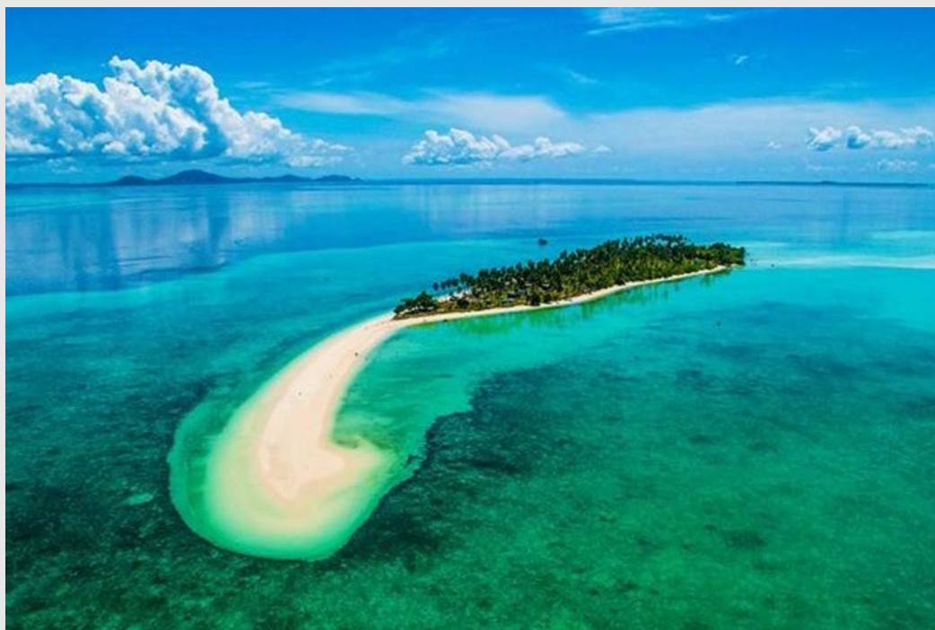
Panampangan Island Sandbar