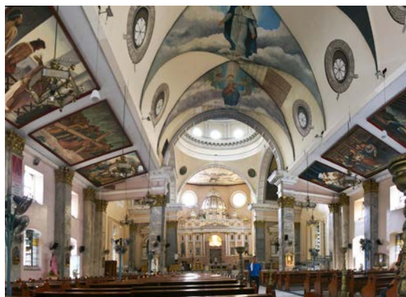
Interior of a Church in Manila

The Philippines claims to be the only Christian nation in Asia. 40 In the 16th century, Spanish colonists converted the majority of Filipinos to Catholicism, the faith practiced by more than 80% of the population. 41 Protestant missionaries made some converts starting in the early 20th century. Today, Protestants, Evangelicals, and other Christian sects, including the Aglipaya and the Iglesia ni Kristo, make up approximately 10% of the population. 42, 43, 44