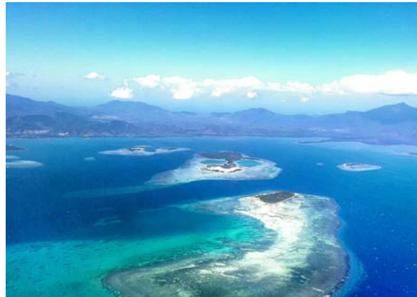
Palau on top

A brief diplomatic crisis erupted in May 2013 after the Philippine coast guard killed a Taiwanese fisherman in the Luzon Strait, which is claimed by both countries. But the two sides established de-escalation procedures for future incidents and agreed on joint use of the waters. 32