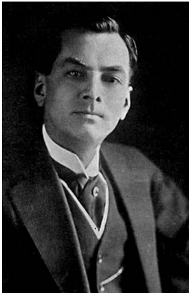
Manuel Luis Quezon y Molina

A new legislative structure was also created. Filipinos held their first elections for the legislative assembly in 1907. The Philippine Assembly (lower house) and the Philippine Commission (upper house appointed by the American president) comprised the bicameral legislature. As a result of the Jones Act of 1916, the Assembly's name was changed to the House of Representatives; the Commission became the Senate, whose members were popularly elected, not appointed. 38, 39