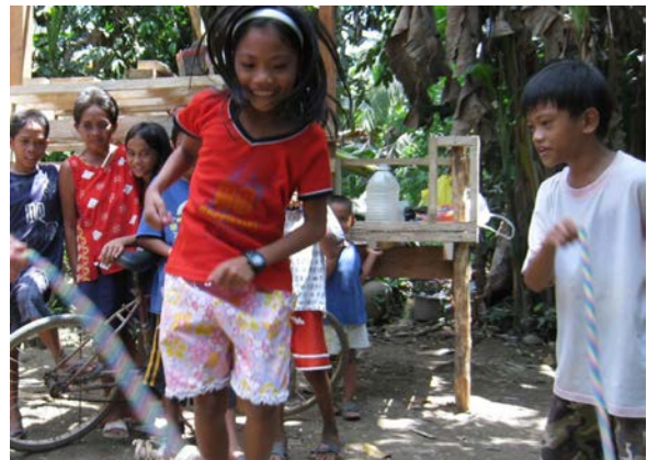
Mindoro

Ethnicity is usually associated with a specific region. Filipino ethnic groups are divided into three main categories: lowland Christians, southern Muslims, and indigenous highlanders. 9, 10 The major ethnic groups in the Philippines are Tagalog (28%), Cebuano (13%), Ilocano (9%), Bisaya/Binisaya (7.6%), Hiligaynon Ilonggo (7.5%), and Bikol (6%). 11, 12