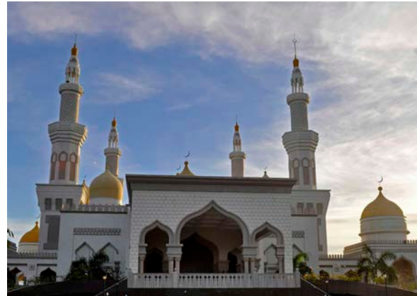
The Grand Mosque, Cotabato City flickr / SIPAT: View from the Edge

In 1380, Arab traders introduced Islam to the Sulu archipelago and some parts of Luzon. By the early 16th century, Islam was practiced throughout the archipelago's coastal regions. Upon the arrival of the Spanish in the 16th century, Christianity was introduced, and Islam was pushed to the southern islands of Mindanao, Sulu, and Palawan, with small communities in Cebu and Luzon. Today, the Sunni Muslims of Mindanao and the Sulu archipelago comprise about 5% of the population. 49, 50, 51