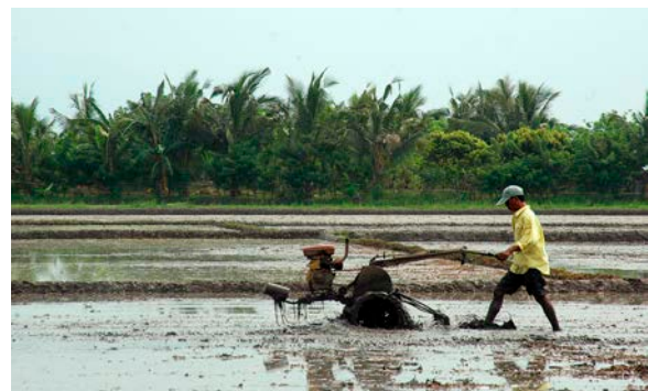
A farmer uses a hand tractor or power tiller

The agriculture sector faces several challenges. Income and productivity are lower than in the industry and services sectors. Productivity and efficiency have seen little growth since the 1990s. The country's agricultural bureaucracy has