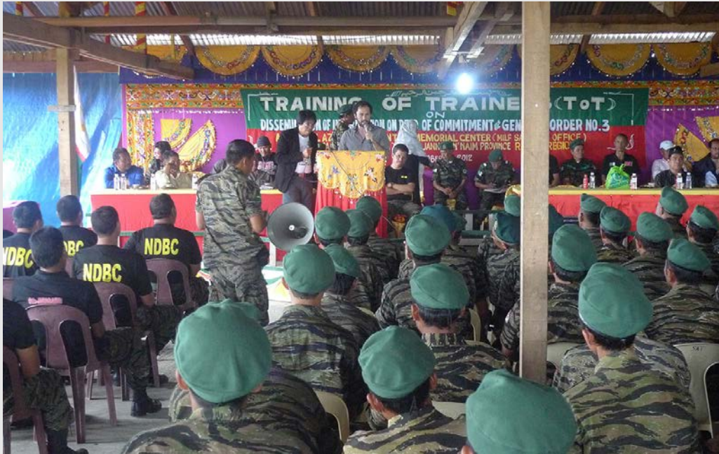
Training on Landmine with the Moro Islamic Liberation Front