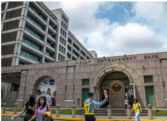
The Asian Development Bank headquarters in Mandaluyong City.

The Central Bank issues the national currency, the Philippine peso (PHP), and conducts banking operations, along with other private and government-owned banks. 83 In November 2017, USD 1 was worth PHP 51.43. 84 The Central Bank's monetary policy aims to promote low and stable inflation and balanced economic growth. 85, 86 The bank sees lower oil prices and weak economic growth as risks to stable inflation. 87