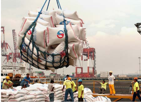
A shipment of rice from Vietnam gets unloaded in Manila, Philippines.

products, mineral fuels, machinery and transport equipment, iron and steel, textile fabrics, grains, chemicals, and plastic. The leading import partners are China, Japan, the United States, Thailand, South Korea, Singapore, and Indonesia. 67