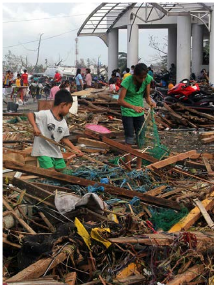
Typhoon Haiyan - Tacloban, Philippines

Deforestation and climate change are two primary environmental concerns. Before 1900, rainforest covered nearly two-thirds of the Philippine archipelago. 93, 94 As late as the 1970s, the Philippines was one of the world's largest tropical hardwood exporters. Today only about 3% of the original rainforest is left. 96 Forests are an important energy source as charcoal and fuel-wood, especially for the poverty-stricken rural population. 97