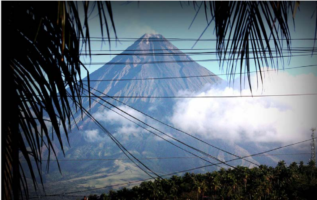
Mayon Volcano