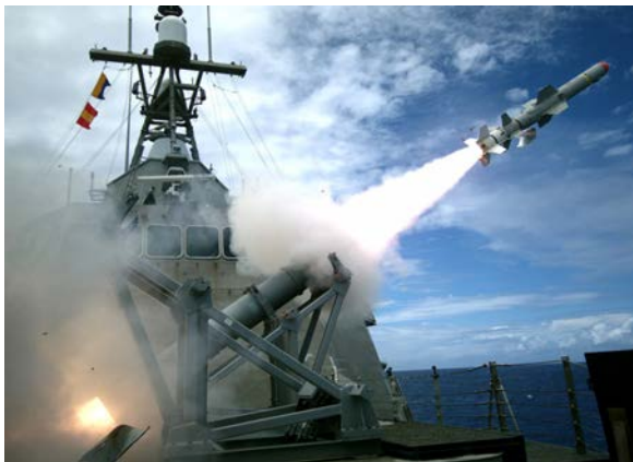
NAVAL EDUCATION AND TRAINING CENTER, Philippines

In the last five years, the United States has allocated USD 300 million in grant funding to provide the Armed Forces of the Philippines (AFP) with equipment, surveillance, reconnaissance, and training, and U.S. personnel continue to advise and assist Philippine security forces. 4, 5, 6 In June 2017, Pentagon officials confirmed that Special