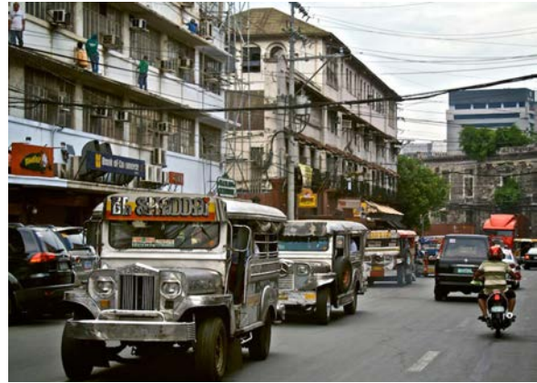
Manila City

Today, Manila is a burgeoning commercial center in one of the world’s most populous metropolitan areas. Metro Manila has