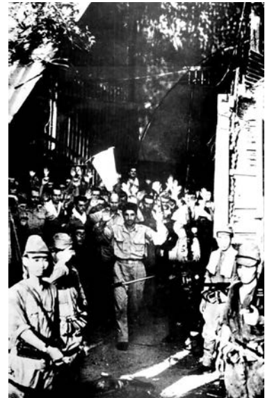
Surrender of American troops at Corregidor, Philippine Islands, May 1942

Japan promised independence to the Philippines, but Japanese authorities began organizing a new government structure to direct civil affairs. Most of the Filipino elite collaborated with the Japanese in order to pass information to the Allies and to protect themselves and other Filipinos from the harsh Japanese rule. 45