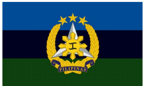
Flag of the Armed Forces of the Philippines

Nacionalista Party leader Ferdinand Marcos defeated Macapagal in 1965 and dominated Philippine politics for the next two decades. During his first term, Marcos implemented many beneficial public works and infrastructure programs that also enriched his allies and friends. He also lobbied the