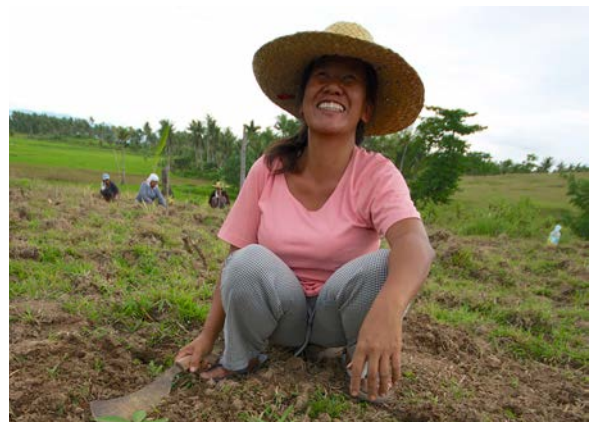
Women of the Farmers' Association in Salvacion barangay work together

In July 2017, President Duterte pledged to implement the Responsible Parenthood and Reproductive Health Law, challenging Catholic opposition and an earlier vote by