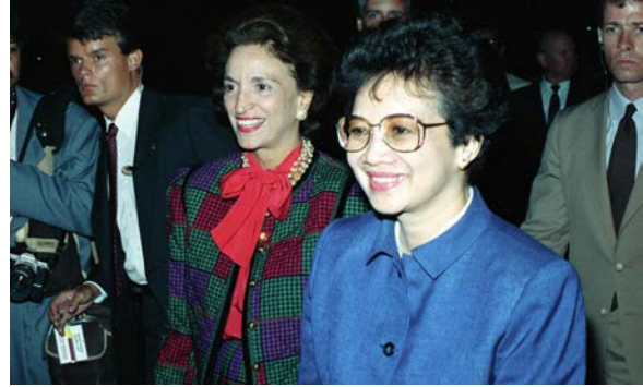
Philippine President Corazon C. Aquino

Fidel Ramos won the presidential election in 1992. 73 Ramos granted amnesty to military rebels, communist insurgents, and Muslim separatists; he also legalized the communist party. 74 In 1996 he made peace with the Moro National Liberation Front. 75, 76 Ramos also focused on rebuilding the economy and restoring investor confidence. Nicknamed “Steady Eddy,” he implemented several deregulation and anti-monopoly measures. 77