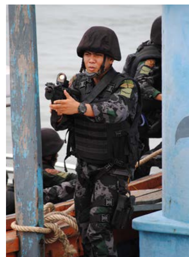
Maritime Special Operations Unit

Despite the Sabah dispute, Malaysia and the Philippines are close partners on economic and security issues. In 2014, Malaysia brokered the Philippines' historic peace agreement with the Moro Islamic Liberation Front (MILF). 48, 49, 50 In June 2017, The governments of the Philippines, Malaysia, and Indonesia initiated a trilateral maritime patrol to combat the threat from local Islamic terror groups. They also agreed to intensify intelligence sharing and strengthen counter-terrorism cooperation. 51, 52