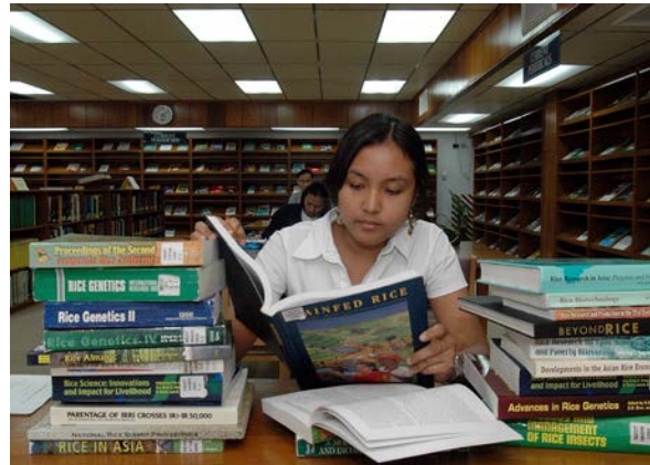
A rich repository of rice research and literature

Philippine literature has its roots intraditional folktales, songs, and poems that were passed down orally over generations. 75 During pre-colonial times, Filipinos used the Baybayin script, which is similar to Sanskrit, to write their oral literature. 76 Most oral literature was transcribed into the Roman alphabet after Spanish colonization. One epic from the northern Luzon region is Biag ni Lam-ang ( Life of Lam-ang ), depicting the adventures of a folk hero. 77