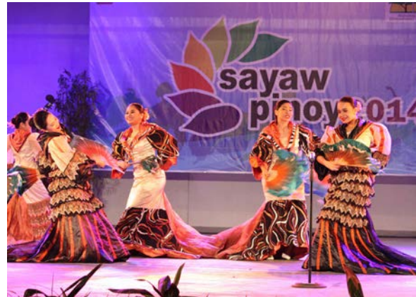
Spaniard dance in Manila

Music and dance are a significant part of daily life. Both western and traditional styles are popular. A genre of music that mixed traditional and western styles, called pinoy , emerged in the 1950s. Although pinoy was initially western songs translated into regional Philippine languages, Filipino composers eventually created their own songs and sounds. Later, pinoy was influenced by other genres such as punk rock and reggae. 86