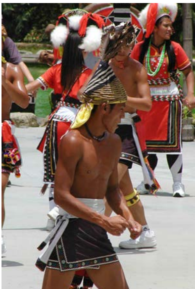
Austronesian people

Human settlement in the Philippines could date as far back as 67,000 years. 1,2 The Aetas, a dark-skinned, short-statured Asian group of hunter-gatherers, migrated to the Philippine islands over a land bridge during the last glacial period about 30,000 years ago. 3