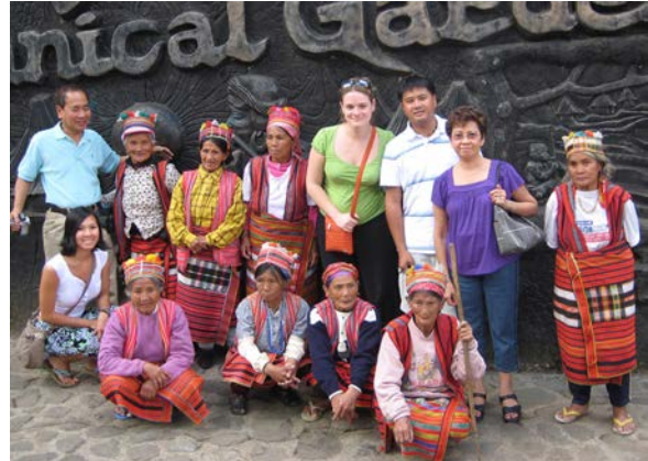
Igorot people outside of the Baguio botanical gardens

The term Visayan refers to people who trace their roots to the central islands of the Visayan region. Cebuano, Hiligaynon Ilongo, and Waray-Waray are subgroups of the Visayan population. 16 High population density and official encouragement prompted some to migrate to Mindanao, where they continue to identify themselves as Visayan. 17, 18