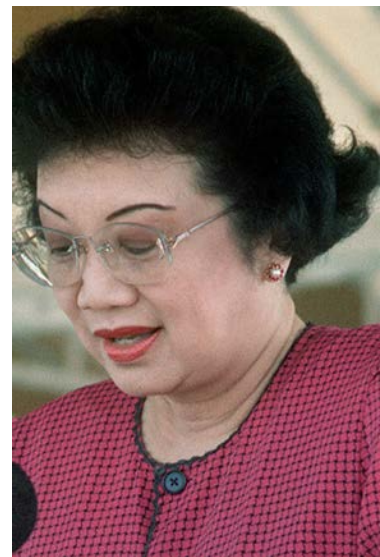
Philippine President Corazon Aquino

Corazon Aquino came to power amid great hopes for reform. 66 She released hundreds of political prisoners; endorsed a new constitution, which limited the president to a single six-year term; and revived an independent judiciary and a freely elected legislature. 67, 68 She also lifted the censorship restrictions instituted during martial law and initiated efforts to recover the hundreds of millions of dollars stolen by the Marcos family. Yet Aquino failed to adequately address the contentious issue of land reform, which was at the heart of Philippine income inequality. 69 Her administration was weak and fractious, and the country did not reach full political and economic stability during her tenure. 70 She survived