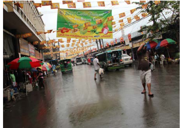
Rainy day in Cebu, Philippines

The climate is directly affected by the northeast monsoon from December to February and the southwest monsoon from May to October. 45 Annual rainfall is heavy in the winter on the east coasts and heavy in the summer on the west coasts. Average annual rainfall ranges from 96 to 406 cm (38 to 160 in). 46 Typhoons can occur throughout the year but most often from July through October. 47, 48