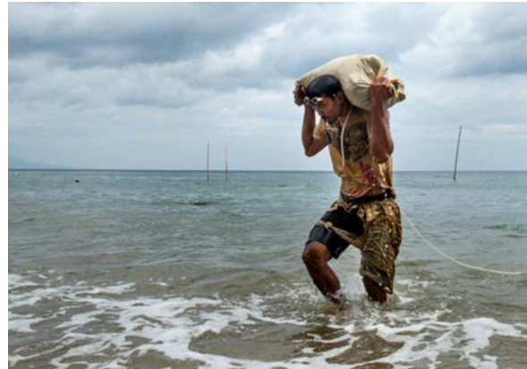
Gold mining in Philippines

The Philippines is rich in mineral resources. Untapped mineral wealth is estimated at over USD 840 billion worth of gold, copper, and chromate deposits. 57 The archipelago also has significant deposits of silver, nickel, coal, sulfur, gypsum, marble, limestone, silica, clay, and phosphate. Most of the minerals (including gold, copper, and chromite) are located in Luzon and Mindanao. 58, 59 The Visayas has deposits of nonmetallic minerals such as marble, salt, sulfur, cement, phosphate, and silica. 60 Mining accounts for less than 1% of the country's GDP, yet constitutes up to 25% of private incomes in mining regions such as Caraga and Mimaropa. 61