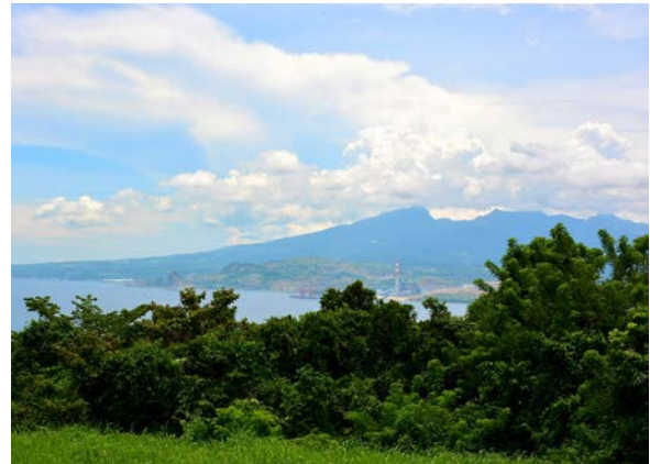
View of Bataan from Corregidor Island

Luzon's topography is characterized by a rugged coast, two mountain ranges, and central plains. The coast is dotted with numerous resorts. Located on the southern portion of Luzon are Manila Bay, the Taal Volcano, Laguna de Bay (the Philippines' largest freshwater lake), and Mayon Volcano. The northern portion of the island is mountainous. It is drained by the Cagayan River. The Sierra Madre Mountains, located along the eastern side from the north to the central part of the country, is the longest mountain range in the country. Running parallel and west of the Sierra Madre, the Cordillera Central range includes Mount Pulog, the highest peak in the range with an elevation of 2,928 m (9,606 ft). 19 The Sierra Madre and the Cordillera Central join to form the heavily forested Caraballo Mountains in central Luzon. 20 The Zambales Mountains are west of the Central Luzon Valley. 21