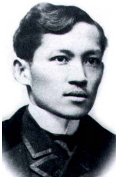
Jose Rizal

In the late 19th century, Filipino students and exiles returning from abroad with modern ideas of nationalism and independence joined the native elite class ( ilustrados ) and rural residents in anti-Spanish revolt. The revolt was divided among two camps: the reform-minded and the independence-driven. One of the earliest nationalist leaders was the Chinese-Filipino reformer Jose Rizal. Rizal was a member of a group called the Propaganda Movement. In 1892, he established the Philippine League ( Liga Filipina ), a non-violent political organization. After Rizal was arrested and exiled to Mindanao, the group split, and some members joined Katipunan , an underground secret society. 24