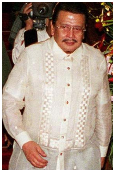
President Joseph Estrada

In 1998, movie star Joseph Estrada won the presidential elections in a landslide amid promises to reduce poverty and spur private enterprise. 78 However, charges of corruption dogged Estrada from the beginning, and he became the first Filipino president to face impeachment. He was ultimately ousted from office in 2001 by insider political maneuvering and massive street protests. 79 His short-lived presidency showed that Philippine political institutions remained susceptible to corruption. 80