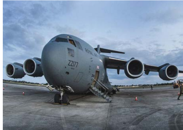
RAF C17 Aircraft Brings Aid to the Philippines.

The Philippine government spends 4.7% of its GDP on healthcare. Filipinos' life expectancy is 68.5 years, with 65 years for males and 72 for females, giving the country a life expectancy world ranking of 121. The major causes of death are heart disease, stroke, and pneumonia. 94, 95 The country's maternal mortality rate is 114 deaths per 100,000 live births, a world ranking of 74. It ranks at 78 in infant mortality, with 21.9 deaths per 1,000 live births. 96