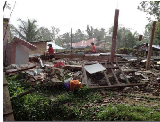
Volunteers working in the rain after an earthquake

The Philippines faces a number of environmental issues including climate change, deforestation, soil erosion, pollution, improper disposal of solid and toxic wastes, coral reef degradation, mismanagement and abuse of coastal resources, and overfishing. 85, 86 The government has made significant progress in environmental conservation and protection, particularly in the area of biodiversity. 87 Nevertheless, existing threats to the environment continue to undermine these efforts. Specifically, land conversion and development combined with expanded farming have taken a toll on the country's forest cover, marine life, and the environment. Mining has contributed to deforestation, soil erosion, toxic waste, and poor quality of air and water in major urban areas. 88, 89 Massive deforestation and desertification increase the likelihood of flooding. 90 Vehicles and factories add to the pollution. 91, 92