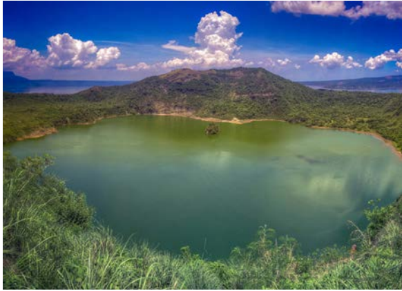
Lake Taal

tributaries and its only outlet is the Agus River, which flows north to Iligan Bay. Lake Lanao is one of the planet’s ancient lakes. Overfishing, pollution, introduced species, and algae contamination have led to the disappearance of many endemic fish species. 61,62