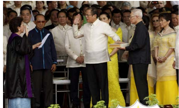
Benigno Aquino III takes the oath of office as the 15th President of the Philippines

By the 2016 election, Filipinos were ready for change. That change came in the form of Rodrigo Duterte, the gun-toting mayor who had rid Davao City of crime. Duterte continued his tough-guy image and promised to fill Manila Bay with the bodies of criminals. In May 2016, Duterte won the presidential election by a wide margin. He immediately initiated a brutal war on drugs that left thousands dead, mostly by death squads and extrajudicial killings. 93 In January 2017, Duterte issued an order expanding access to birth control for poor women. 94 In September 2017, government forces killed Isnilon Hapilon - leader of the ISIS-affiliated Abu Sayyaf militant group who was fighting alongside one of the leaders of the Maute Group - and retook the southern city of Marawi after five months of fighting. 95