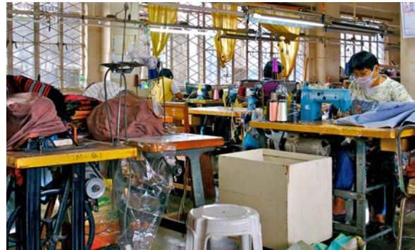
Factory in Philippines

Industry accounts for 30% of the country's GDP but employs only 17.5% of the workforce. 24 The industry sector includes manufacturing, mining and quarrying, construction, electricity, and gas and water. 25 The government has encouraged domestic and foreign investment in industry through tax credits and favorable credit terms. 26 The most important industries are semiconductors and electronics assembly; food and beverage manufacturing; construction; electric, gas, and water supply; chemical products; radio, television, and communications equipment; petroleum and fuel; textiles and garments; non-metallic minerals; basic metal industries; and transport equipment. 27 Challenges in the industry sector include poor infrastructure, supply deficits, and expensive logistics. 28, 29