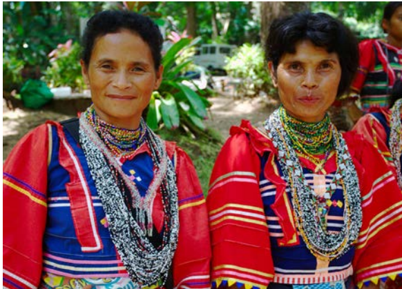
Mindanao Native Women

Filipinos are descendants of Malays who migrated to the archipelago some 30,000 years ago from mainland Asia. The oldest residents, the Negritos, distinguished by short stature and dark skin, are believed to be indigenous to the islands. They constitute a small percentage of the total population. Chinese, Arab, and Indian peoples also migrated to the archipelago over the centuries. Many Filipinos trace their ancestry to these groups and to the Spaniards and Americans who colonized the Philippines between the 16th and