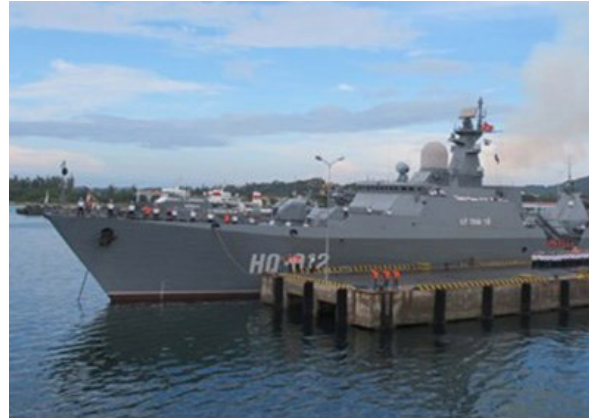
Vietnam Warships Visit Philippines Amid South China Sea Dispute

The Philippines and Vietnam agreed on a strategic partnership in 2015, during the tenure of Benigno Aquino. The two countries have some converging regional interests. They both desire increased economic cooperation with each other and within the Asia-Pacific Economic Cooperation (APEC) forum. They also have an interest in countering China's claims to the disputed waters and islands of the South China Sea. 11 After the 2016 Philippine elections, the Vietnam-Philippines relationship was thrown off-balance by President Duterte's criticisms of the United States - Vietnam's ally - and his apparent desire for closer ties with China. 12