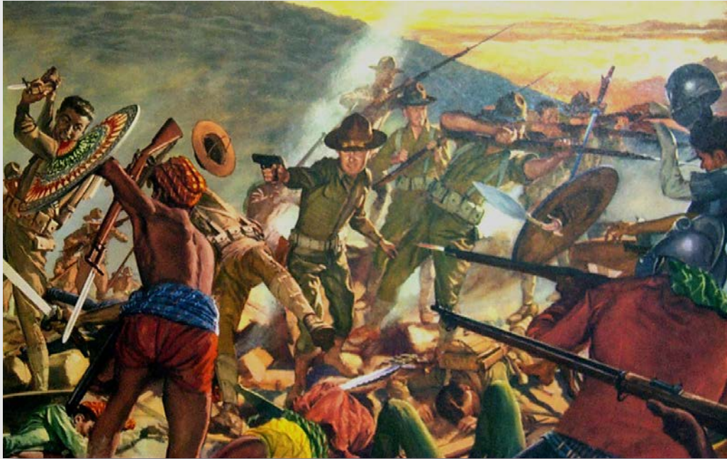
U.S. soldiers battling with Moro fighters