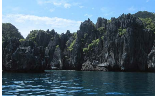
Bacuit Archipelago 29

The Philippine archipelago is surrounded by four tropical seas: the Philippine Sea to the east, the South China Sea to the west and north, the Sulu Sea to the southwest, and the Celebes Sea to the south. Neighbor states include Taiwan and China to the north, Malaysia and Indonesia to the south, and Vietnam to the west. The Philippines' territorial sea claims extend as far as 100 nautical miles from the closest coastline.