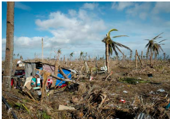
Typhoon Haiyan natural disaster

Poverty is a persistent problem for the Philippines. The government sets the poverty threshold at PHP 21,753 (USD 424) per year. 97, 98 In recent years, the poverty rate has gradually decreased, reaching 21.6% in 2015. 99 Some causes of poverty are the immunity of the farming and fishing sectors to improving economic trends, insufficient family planning, a weak manufacturing sector, and entrenched land distribution patterns that favor the wealthy. 100 External shocks such as natural