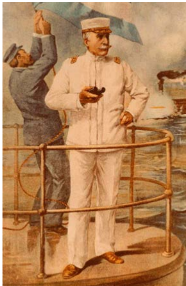
Admiral Dewey at the Battle of Manila

The United States declared war on Spain in 1898 after the U.S.S. Maine mysteriously exploded in Cuba, then a Spanish colony. 27 The war moved to Manila, where Commodore George Dewey defeated the Spanish fleet. 28 Nationalist leader Emilio Aguinaldo returned to the Philippines as a war-time partner of the United States. 29 In exchange for the possibility of Philippine independence, Aguinaldo provided the United States with valuable intelligence and military assistance. Aguinaldo unilaterally declared Philippine independence on 12 June 1898. With Spain's departure, Britain, France, Germany, and Japan sent warships to Manila Bay, sensing a power vacuum. But the United States had no intention to relinquish its newly attained strategic and trade advantages. In the 1898 Treaty of Paris, Spain granted Cuba independence and sold the Philippines to the United States for USD 20 million. 30