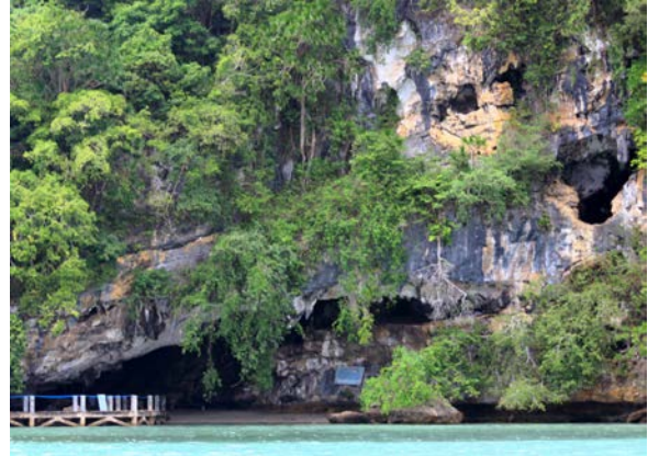
The Tabon Caves

Despite some resistance, the United States worked toward building a democracy in the Philippines. The Japanese occupation during World War II delayed democratization, but the Philippines became an independent state in 1946. The country's constitution and political structures are based on U.S. models. The Philippines has experienced instability since independence because power has generally remained in the hands of a corrupt and abusive oligarchy. Since 1986, Filipinos have ousted two presidents through popular protests and attempted many coups against other leaders. The nation has yet to overcome corruption, poverty, and inequality.