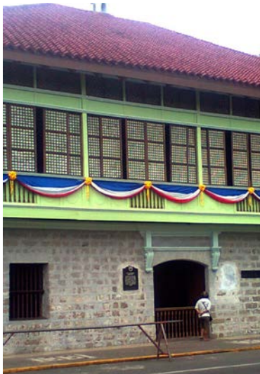
Rizal Shrine in Calamba City

Filipino pasyon (the narrative of the sufferings of Jesus according to Christian