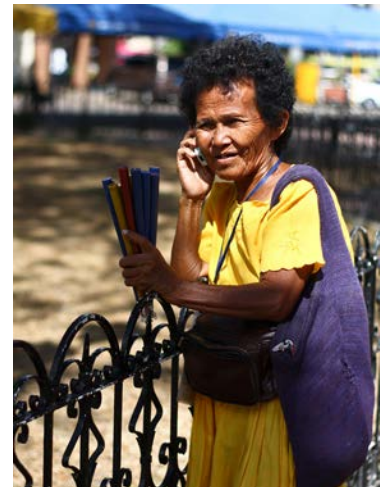
Telecommunications, in the Philippine

The Philippine economy is projected to keep growing robustly. 115 The country is about to transition from lower-middle income to upper-middle income status. 116 The Duterte administration is focused on combatting illegal drugs and corruption as means of poverty reduction and economic growth benefitting all Filipinos. The government's socioeconomic agenda includes comprehensive tax reform, higher investment, improved competitiveness, infrastructure development, and social spending. 117