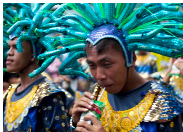
Celebrations in Cebu, Philippines

The formal national attire for men is the richly embroidered barong tagalog shirt. This elegantly stitched, long-sleeved tunic