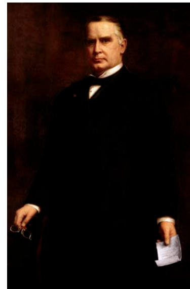
The official Presidential portrait of William McKinley

The American authorities established a new judicial system, civil service, and free public elementary education. 36 Catholicism was disestablished as the state religion. Negotiating with the Vatican, the United States bought vast friar land holdings and redistributed them, mainly to estate owners. Religious orders were allowed to remain. 37