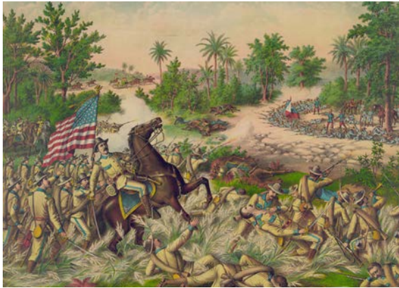
The Battle of Quingua, April 23, 1899

For the next two years, Aguinaldo's guerrillas battled U.S. forces and attempted to create a new government. A revolutionary congress met near Manila and declared Aguinaldo as the president of a new republic. 31 Greatly outnumbered and outgunned, the Filipinos lost 16,000 fighters and at least 200,000 civilians to famine and disease. 32 The United States lost 4,300 soldiers. Aguinaldo admitted defeat in 1901. Most of the guerrillas laid down their arms, though some resistance continued until 1913, particularly among Muslims in the southern islands. 33