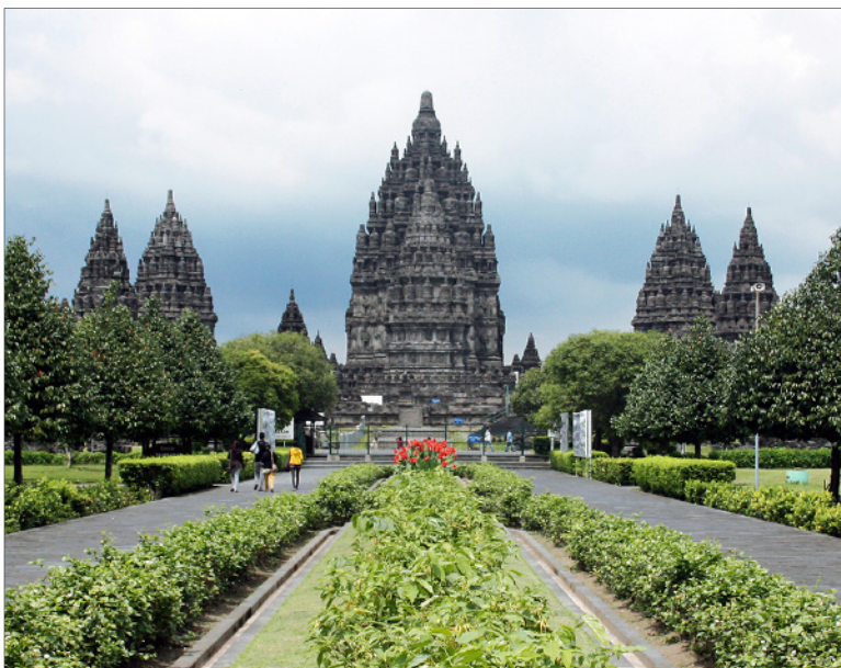
Prambanan Hindu temple

Indonesian archeological artifacts as old as 800,000 years tell a story of many small communities, each adapted to the hunting, fishing, and foraging possibilities of its ecological niche. In Papua and the northern Maluku, evidence of horticulture and trade in plants and animals dates to 20,000 years ago. After the last ice age some 10,000 years ago, certain characteristics spread widely throughout the region: languages, rice farming, long-distance seafaring, pottery making and metal working. 9 For example, ornamental bronze drums crafted in the style of the Dong Son culture, centered in present-day Vietnam, spread to the Indonesian archipelago sometime during the first millennium B.C.E. Some of the drums show figures in possible Chinese or Indian costume, sparking speculation that the original drums may have come via traders from these regions. 10 But the nature of the relationships among island and mainland populations is unknown because of the lack of written records.