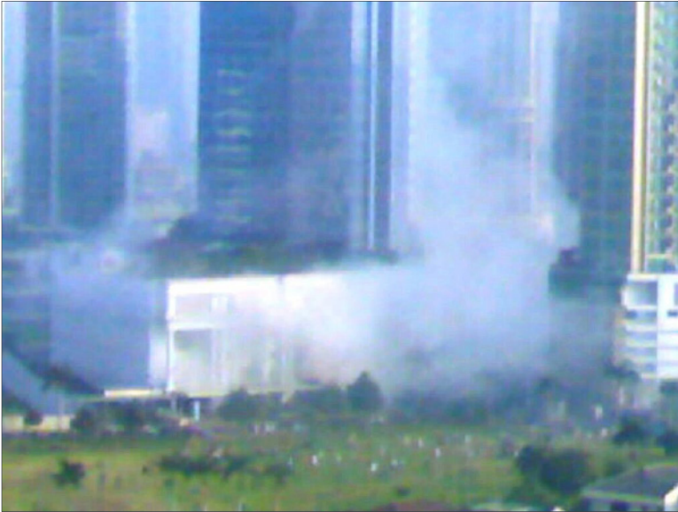
Marriott Hotel bombing

are mounting large demonstrations and garnering international support. Indonesian security forces respond with equal severity to armed separatists and nonviolent protests. In 2011, more than 10,000 central highlanders fled their homes during government security sweeps. 169 In 2012, clashes between police and pro-independence demonstrators grew in number and intensity. 170, 171 In 2013, separatists killed eight soldiers. 172