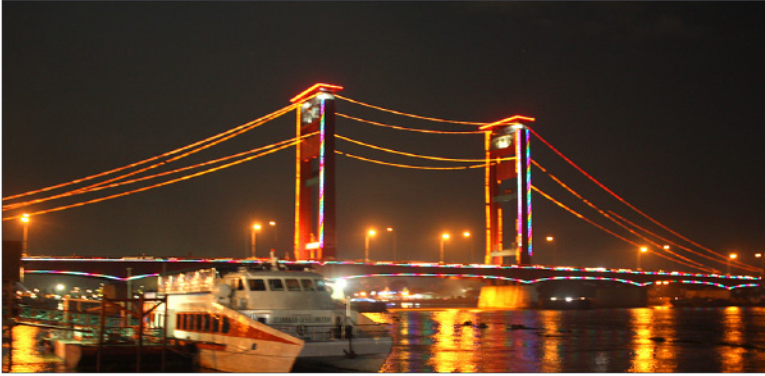
Ampera Bridge in Palembang

Medan is home to one of Indonesia's largest mosques, the Great Mosque. In September 2012, the American Consulate in Medan closed temporarily during several days of protests against the film Innocence of Muslims . 81, 82