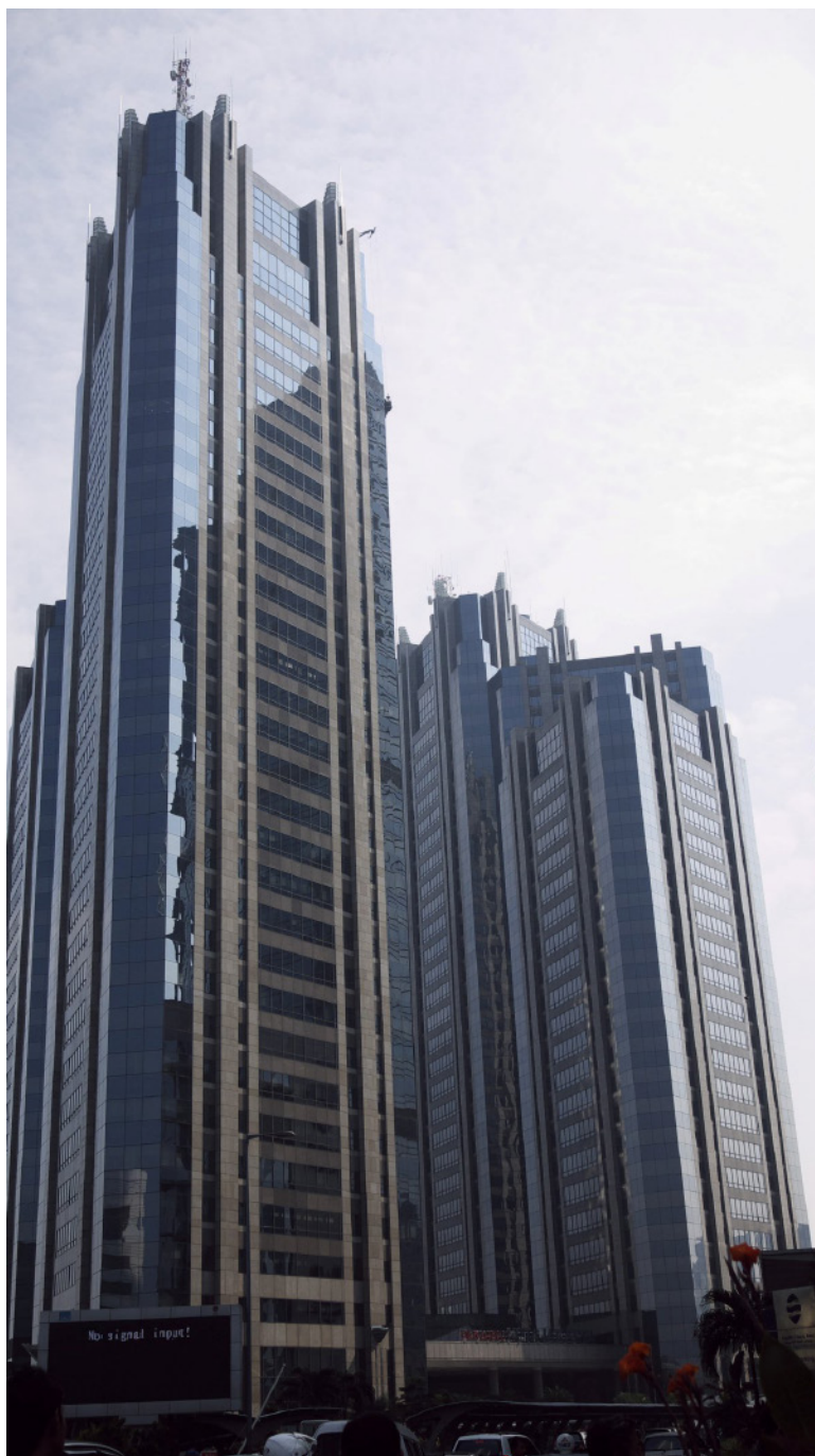
Indonesia Stock Exchange