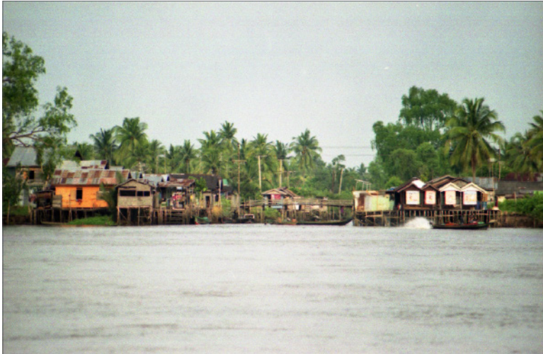
Barito river

The shallow Java Sea lies between Java and Borneo. Exploration is finding undersea gas and oil deposits from northern Java to northeast Kalimantan, which fuel Indonesia's export program. 30, 31 The Celebes Sea contains Indonesia's northern border with the Philippines. 32 Terrorism and piracy in this sea threaten regional stability. 33 Several smaller seas—Molucca, Banda, Flores, Sawu, Timor—surround their namesake islands.