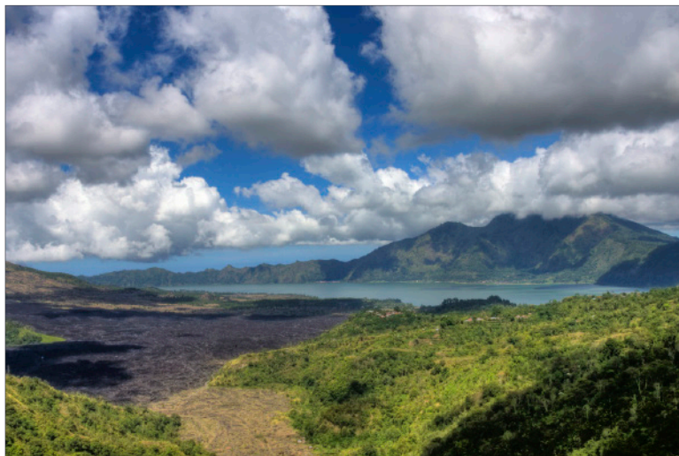
Landscape of Indonesia © Anne Roberts

Indonesia ranks among the world's highest biodiversity-rich countries. It has the world's greatest variety of mammals, palm trees, and swallowtail butterflies; species of reptiles, birds, amphibians, reef corals, and flowering plants are among the most numerous in the world. 6 Indonesia's human diversity is equally impressive. Some 300 ethnic groups and 700 languages characterize its population of 248,645,008—the world's fourth-largest population in 2012. 7, 8 Most Indonesians live south of the equator, inhabiting the four large islands of the Greater Sunda group: Java, Sumatra, Sulawesi (Celebes), and Kalimantan (the Indonesian portion of Borneo). 9 Although the island of Java covers only 7% of the country's area, it is home to 58% of Indonesians. In contrast, only 2% of the population lives in Indonesia's Papuan provinces on western New Guinea, which account for 22% of Indonesia's landmass. 10 Although 56% of Indonesians still live in rural settings, the annual rate of urbanization is projected to be 2% through 2015. 11