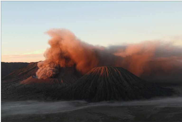
Active volcano in Java