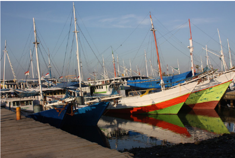
Old harbor in Makassar

Palembang was the capital of the Buddhist Srivijaya Empire from the 6th to the 14th century, and is the capital of South Sumatra today. The city lies on both banks of the Musi River, which large ships can navigate from Sumatra's east coast upstream to municipal deepwater port facilities. 83 Palembang is the center of the country's oil industry. It also has factories that produce fertilizer and cement. 84 Exports transported through the city include rubber, coffee, timber, coal, tea, and spices. 85, 86