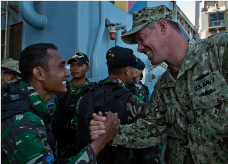
International cooperation