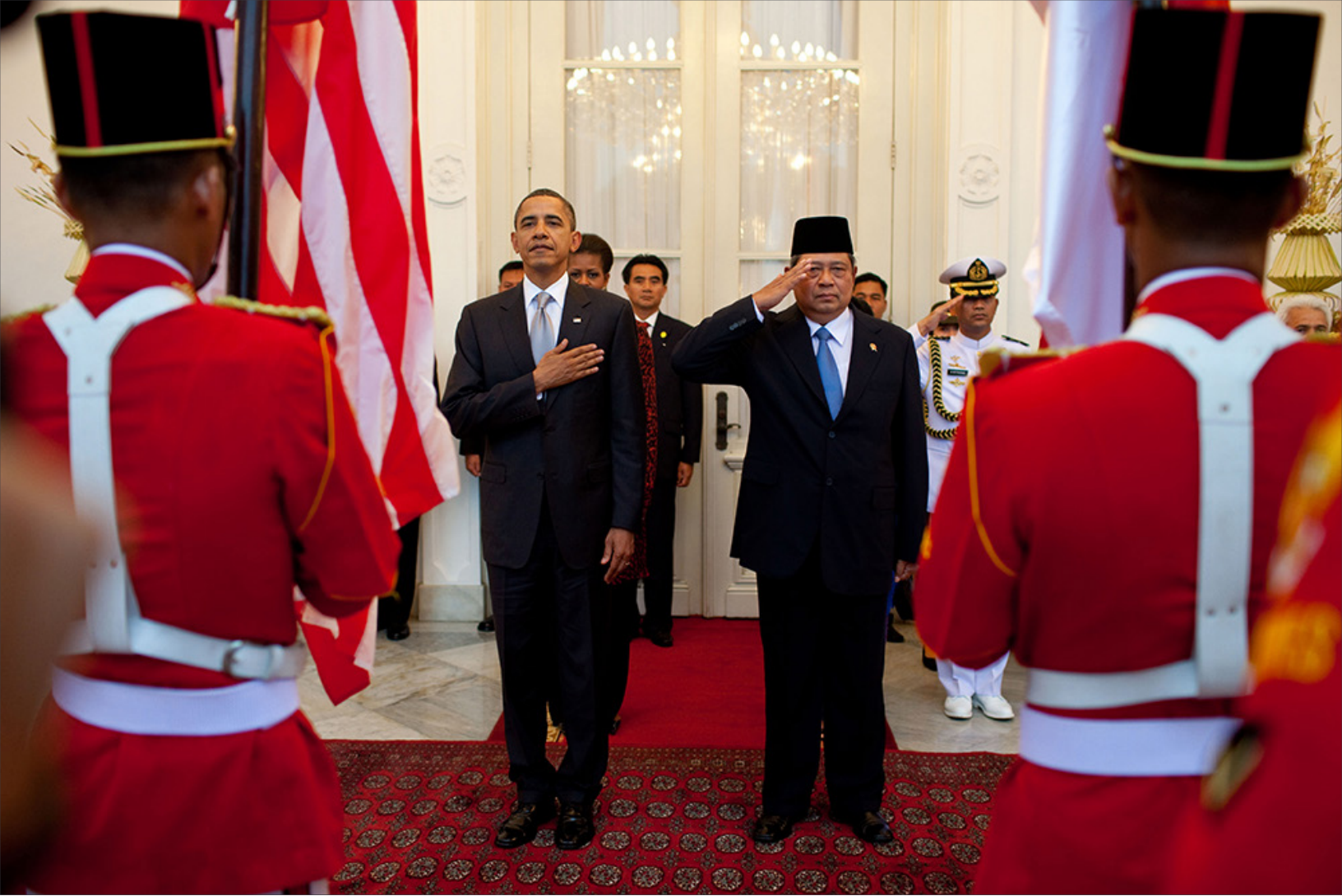
Obama and Yudhoyono