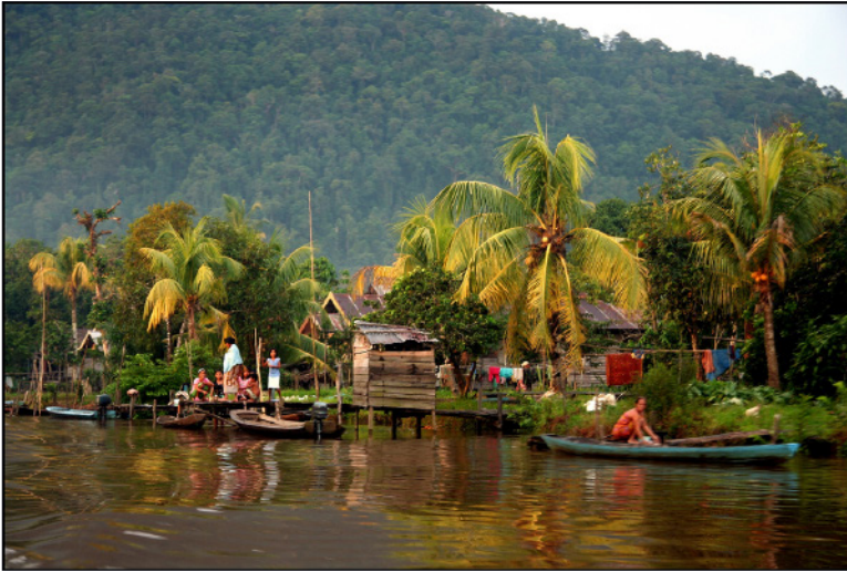
Tropical climate

Australian landmass, supporting New Guinea and the northern Malukus. The Sunda shelf extends from the Asian landmass, supporting Borneo, Sumatra, Java, and the Lesser Sundas. Sulawesi and the southern Malukus lie in a geologically unstable zone where the shelves meet. 20 Indonesia lies on the Ring of Fire, a zone of volcanic activity that accounts for 75% of the world's volcanoes. 21 Indonesia has the world's highest number of deaths from volcanic eruptions. 22