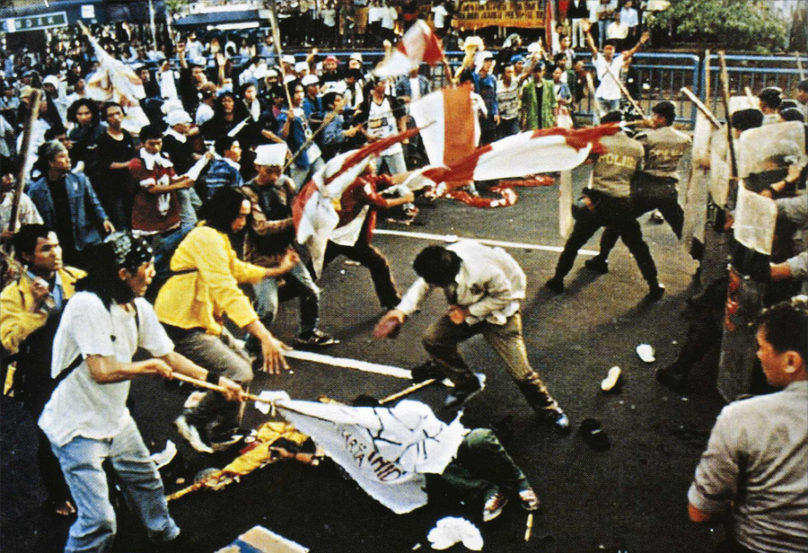
Riots in 1998