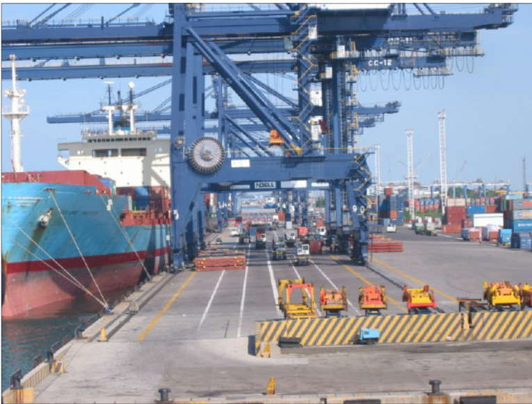
Trading in Growth Triangle

Relations took a turn for the better in 2013 when the PNG leader visited Indonesia. The two governments signed memoranda of understanding on issues related to the extradition of criminals, border security, energy, tourism, and sports. Both acknowledged the importance of increasing trade relations. Indonesia noted that it would be willing to sell weapons and defense equipment to PNG. 62 Tensions flared in early 2014, however, after Indonesia alleged that a PNG military patrol seized 10 Indonesian fishermen, robbed them, and forced them to swim ashore as the PNG troops set the fishing boat ablaze. Five of the Indonesians drowned. 63