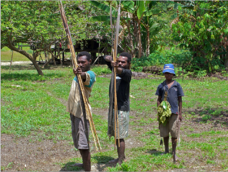
Papuan traditional weapons

trained for colonial administration) by 19th-century Dutch, this ethnic group rebelled up until 1961 against the early modern Indonesian state. 49