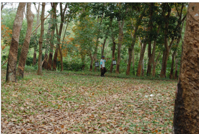
Rubber plantation in Sumatra

The primary tin-mining areas are the islands of Bangka and Belitung and nearby offshore regions in the Strait of Malacca. Nickel is mined in Southeast and Southwest Sumatra, and on Halmahera and nearby small islands in North Maluku. 55, 56