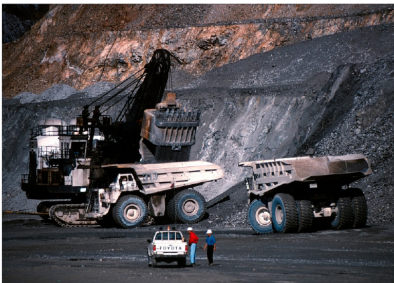
Mining copper and gold in Papua