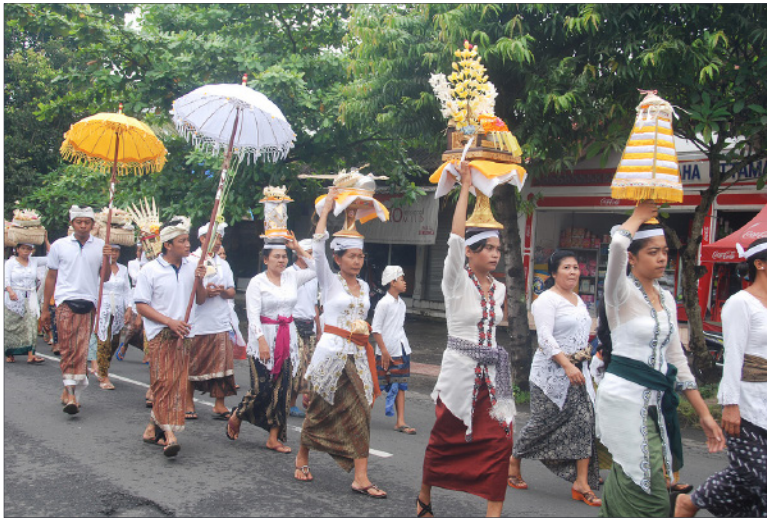
Balinese Hindu ceremony

were known as fierce warriors and ritual cannibals until German Lutheran missionaries began to convert them in the 1800s. 38 Batak languages have an indigenous alphabet that now exists mostly in museums. 39 To the south of the Bataks, on the west coast, live about 8 million Minangkabau, a rare example of a matrilineal Muslim culture in which mothers (not fathers) determine kinship descent lines and property inheritance rights. 40 Some linguists believe that the language of the Minangkabau is the ancestor of contemporary Malay. 41 The resource-rich north coast is home to some 2 million Acehnese, a conservative Muslim people who recently gained political autonomy from the national government. Banda Aceh is remembered as a site devastated by the 2004 tsunami. 42 The Acehnese language is closely related to the Cham languages of Vietnam and Cambodia.