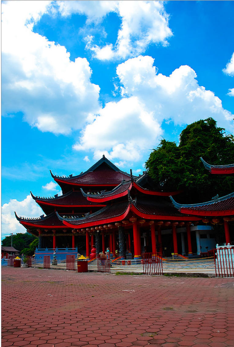
Semarang Old Town

Besides agriculture, tourism, and higher education, Bandung is known for manufacturing textiles, medicines, rubber products, and machinery. A relatively speedy toll road has linked Bandung to Jakarta since 2005. 67 Bandung houses Indonesia's Nuclear Research Center, the Senior Officers Military Institute, and the Women's Police Academy. 68,69 Indonesia's Air Force Materiel Command is headquartered in Bandung. 70