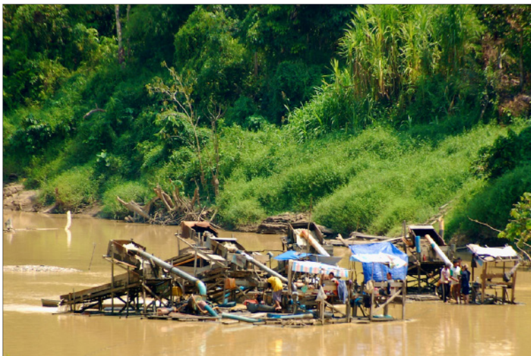
Gold mining in Lake Sentarum