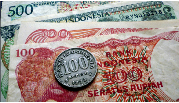
Indonesian rupiah

close or take over more than 60 banks and assume their limited assets and extensive liabilities. 104