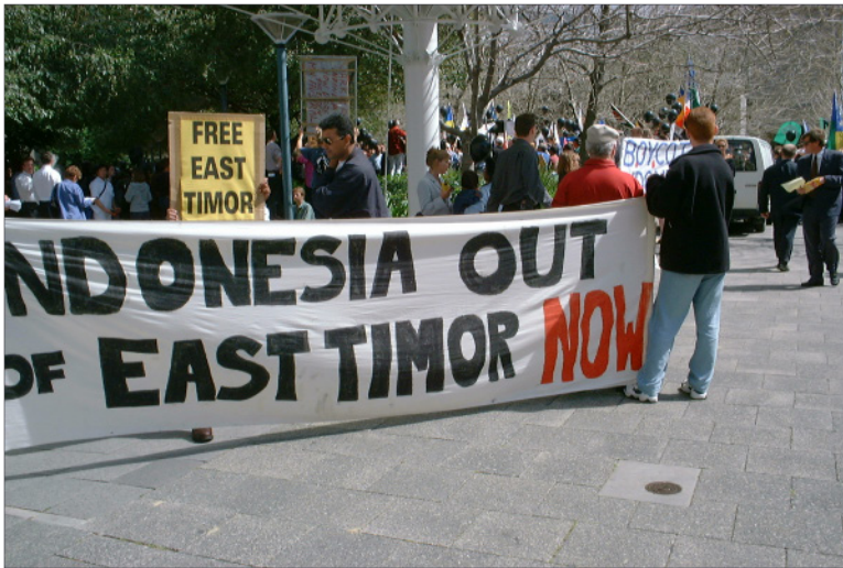
Free East Timor demonstration

competing with Singapore instead. 72 In 2007, the Indonesian legislature (DPR) canceled a signed defense cooperation agreement with Singapore. 73 One natural resource—sand—has become controversial. Indonesia (and Malaysia) banned sea sand exports in 2007, but Indonesian islands continue to disappear (and Singapore continues to grow). 74, 75, 76 In spite of these challenges, relations early in 2014 were generally good and improving. 77