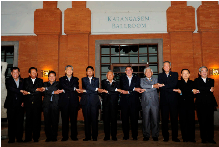
ASEAN annual meeting

Although the United States has some concerns about human rights violations, it remains firmly committed to strengthening its Indonesian partnership. 22 Rising nationalism within Indonesia and increasing religious tensions are other prickly issues that could complicate future relations. 23