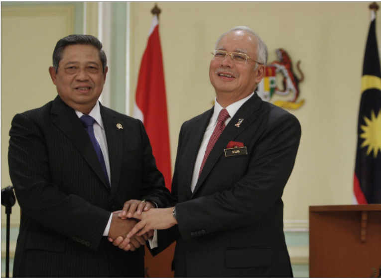
Indonesia-Malaysia relations

Test Ban Treaty in 2012, hoping to lead other ASEAN members by example. 33, 34