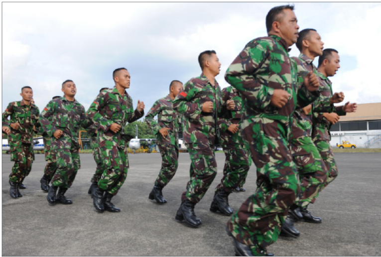
Indonesian soldiers training