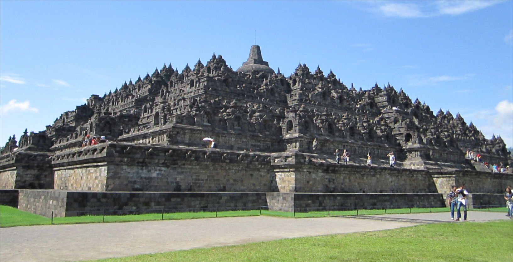
Borobudur 9th century temple