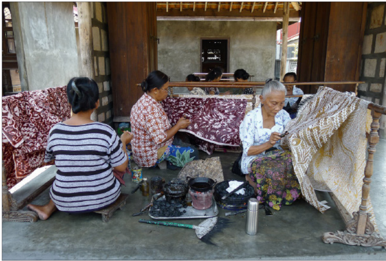
Batik © Stephen Kennedy

screen, producing a shadow effect. 109 The puppets act out stories from Hindu epics, most often the Ramayana (the story of Prince Rama) and the Mahabharata (an account of a great war in northern India around the 13th or 14th century B.C.E.). 110 A typical wayang performance takes place at night and may last until dawn. 111, 112 Wayang earned UNESCO recognition in 2003 as a Masterpiece of Intangible Heritage of Humanity and has spread beyond Indonesia. 113 Dancers also perform to gamelan music, wearing extraordinary masks ( topeng ) that depict characters from Indonesian religion and folklore, such as Barong (a dragon-like creature) and Rangda ( Barong 's adversary, a ferocious-looking witch with bulging eyes). 114 In the hudoq (mask) dance of the Dayak tribespeople in Kalimantan, masks depict rice-eating pests and dreadful beasts that scare away evil spirits to herald the beginning of rice-planting season and celebrate the previous harvest. 115, 116 The carved masks and painted puppets of these performances have become art objects for international collectors.