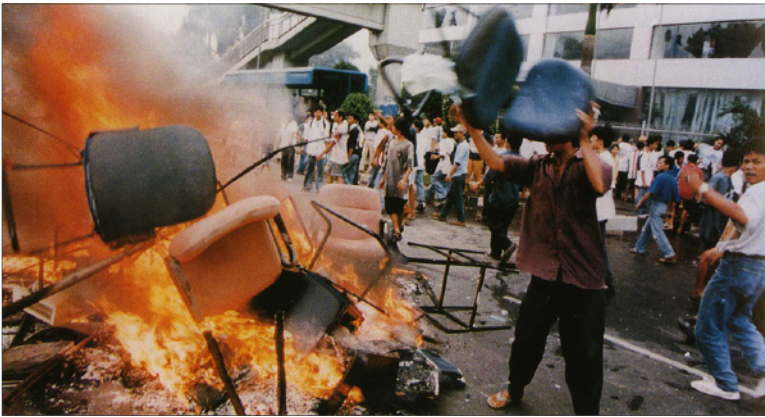
Anti-Chinese riots in 1998