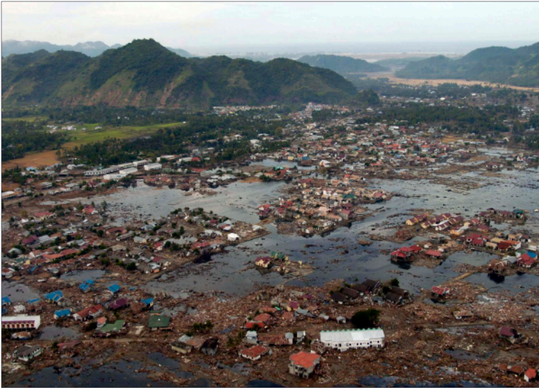
Sumatra after tsunami

in Bali was attacked in 2005, killing at least 26 and wounding more. President Susilo Bambang Yudhoyono blamed terrorists for the attacks and warned that more attacks were possible. 75,76 In 2009, two hotels in Jakarta were bombed. Again, an Islamic group was suspected. Recent attacks in Java have included assassinations, letter bombs, suicide bombers, and bombs. 77