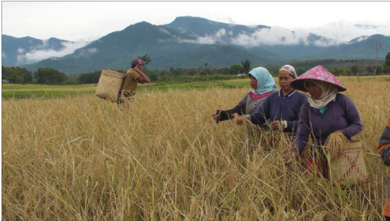
Women harvesting rice

nonreligious topics in schools. They have established city madrasa (Islamic day schools) that embrace modern teaching methodology. 71, 72, 73