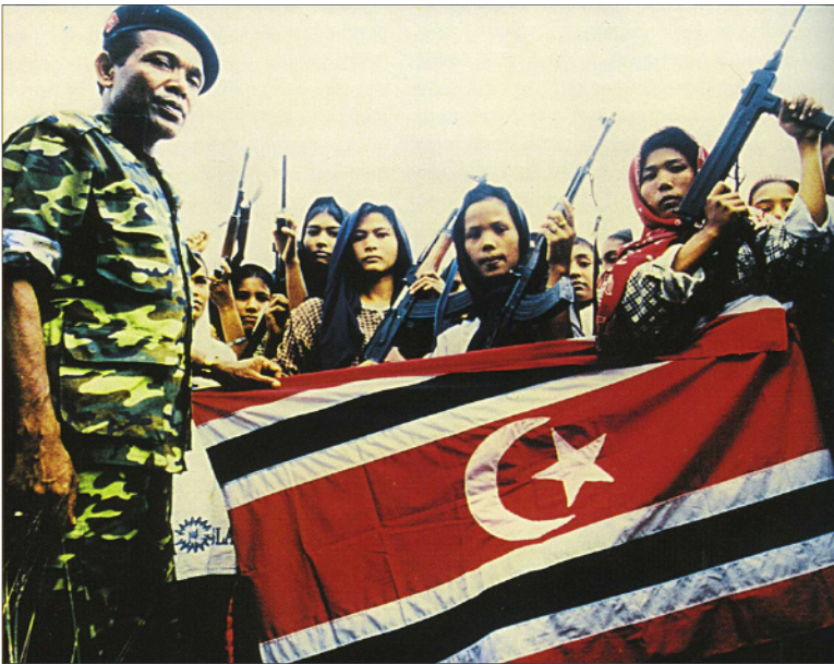
Free Aceh Movement 1999

East Timor was one of the last outposts of the Portuguese overseas empire. A 1974 revolution in Portugal ushered in a new liberal democratic government that was keen to get out of the colonial business. In 1975, shortly after the two largest political parties in East Timor initiated a civil war, Indonesia invaded, fearing the emergence of a leftist state next door to its west Timor province of Nusa Tenggara Timur. 60 A year later, Indonesia declared East Timor its 27th province. But the province did not pacify easily, and Indonesia suppressed resistance movements in East Timor for more than 20 years. Only in 1999, after Suharto was out of power, did Indonesia agree to allow the East Timorese to decide if they wished to be independent. The majority voted for independence. Violence against the separatists preceded and followed the vote, but did not prevent the emergence of the independent nation of Timor-Leste in 2002. 61