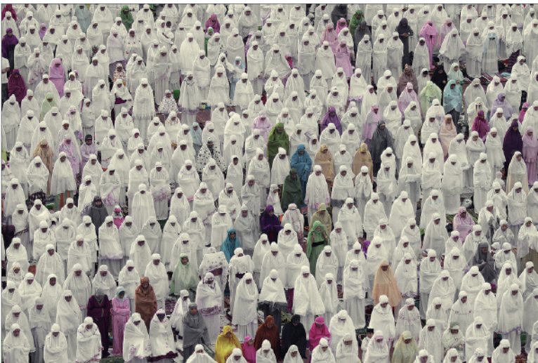
Indonesian Muslims

as does spirit possession. 60, 61, 62 Though Hindu-Buddhist empires once ruled much of Java and Sumatra, Bali is now the only island where Hinduism is a majority religion. Buddhism remains active in areas with Chinese Indonesian communities. Before Confucianism was officially recognized, many Chinese identified themselves as Buddhist. Islam eventually spread over much of Indonesia, while Christianity gained converts first in Catholic Portuguese colonial territories, and later where Protestant missionaries traveled. Indonesia's 2010 census reported 87% of the population to be Muslim, 7% Protestant, 3% Roman Catholic, and 1.5% Hindu. Among the remaining fraction of the population are followers of Buddhism, Confucianism, traditional indigenous religions, and other Christian denominations. 63