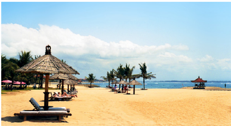
Beach in Bali