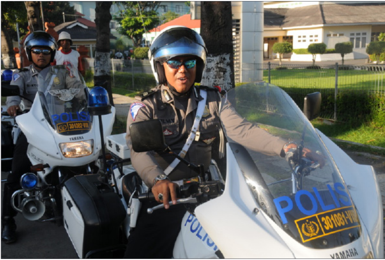
Jakarta police

all of Timor-Leste's foodstuffs come from Indonesia. Indonesia is investing significant sums into infrastructure development in Timor-Leste. A border dispute between the two is ongoing. 92, 93