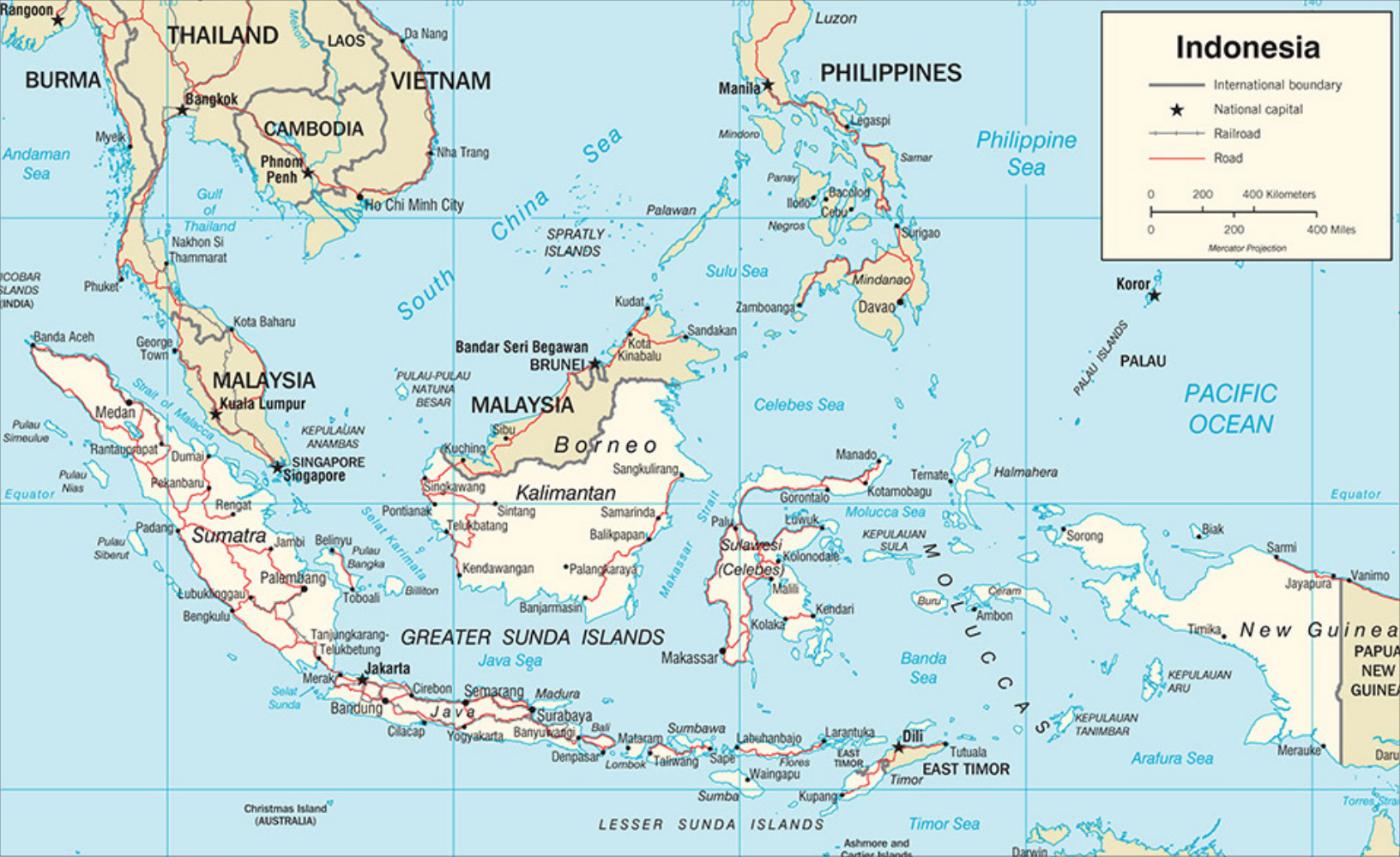
Map of Indonesia