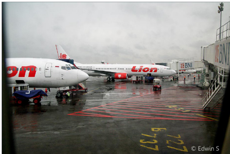
Low-cost carriers

(ASEAN), which was established in 1967 and is headquartered in Jakarta. 68 A long-term goal of ASEAN is to establish a Southeast Asian economic community similar to the European Union (EU), “with free movement of goods, services, investment, skilled labor, and freer flow of capital.” 69 Nevertheless, Suharto’s government protected domestic industries with trade barriers since the mid-1970s. Indonesia is involved in numerous trade disputes before the World Trade Organization (WTO). 70, 71 Since economic decentralization in 2001, local governments continue to impose tariffs, despite the national government’s work to align foreign trade with ASEAN and WTO standards. 72