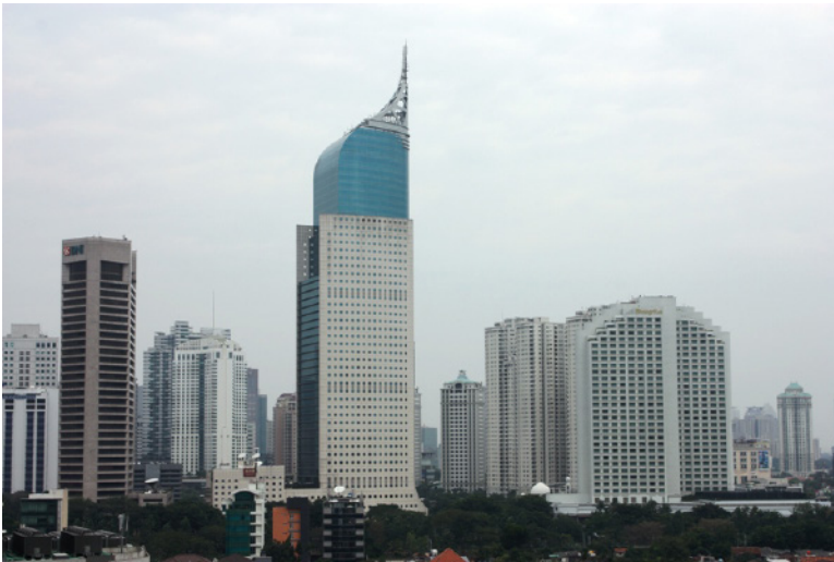
Jakarta financial district