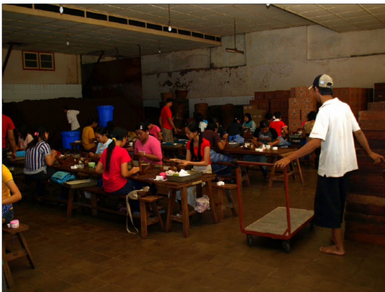
Female factory workers

Education funding has been a recent government priority, reaching 3.6% of annual GDP. 128 Indonesia now reports approximately 94% literacy. 129 However, that figure is nearly 100% among people between ages of 15-24 years old. 130 But less than half of students complete secondary school, producing a poorly trained workforce that is vulnerable to unemployment. 131 Weak support for higher education concerns economic analysts looking for potential research and development to boost industry. 132