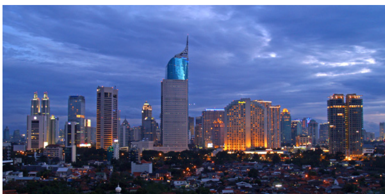
Jakarta skyline