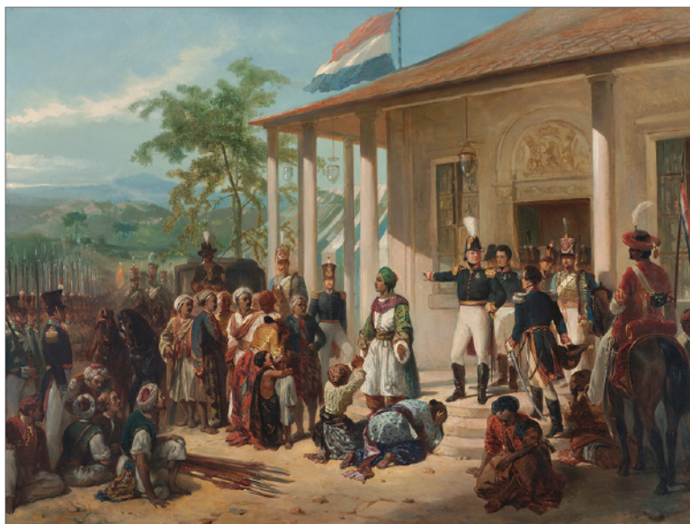
Dutch victory in Java War

Islam was known in Indonesia as early as the eighth century, but 500 years passed before Muslim centers took root among foreign traders in Sumatra’s port cities. Islamic beliefs and practices spread east in fits and starts during the following centuries. 18, 19 In the 15th century, a Sumatran prince and Muslim convert established the sultanate of Melaka (Malacca) on the southern Malay Peninsula. Melaka became the region’s richest and most powerful and trade center, favoring business with other Muslim sultanates. 20 Indonesia’s “Nine Saints” ( wali sanga ) of Islam began their good works on Java during this time. 21 In the 16th century, the sultanate of Demak expanded its claims over what remained of the Hindu-Buddhist Majapahit kingdom. 22 By the end of the century, Hindu nobility had retreated to the island of Bali, and Islam had become dominant throughout most of the archipelago.