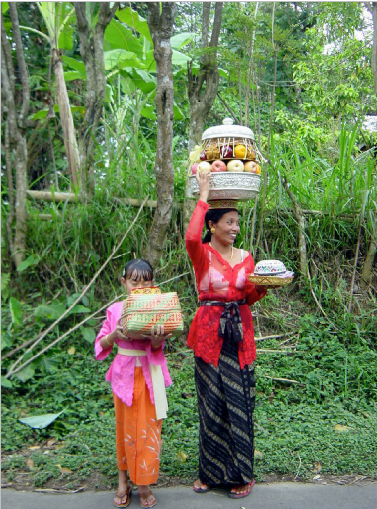
Woman in Sarong © Dylan Alling

from batik or ikat cloth, the sarung cloth is sewn into a tube. The wearer steps into it, pulls it up, and then folds it tight around the waist. On Java and Bali, men and women wear sarungs , with those worn by men often sporting a plaid pattern. On Sumatra and the islands of Nusa Tenggara and beyond, only women wear sarungs . These narrower, longer sarungs can be pulled up to the underarms and worn as dresses. Men in the outer islands may wear an ikat cloth called selimut that wraps around the lower body to the knees. Closely related to a sarung is a kain (cloth), a length of material that can be used as clothing, a backpack, or a baby sling. Women sometimes add a matching selendang (shawl) draped over a shoulder. When women wear a kain or sarung as a skirt, they now top it with a form-fitting embroidered blouse called a kebaya , or a longer, looser baju worn as a tunic over the sarung . Some cultural critics note that the “tradition” of tightly wrapped sarungs that accentuate a woman’s shape and shorten her step is a relatively recent development (like the breast-covering kebaya ). 104