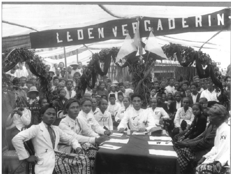
1921 Sarekat Islam meeting

Portuguese, the Spanish, and the English East India Company, as well as with local Muslim trading kingdoms. In 1619, the sultanate of Banten and British forces both besieged the VOC's fortified trade post in Jayakarta. 25 The siege was ultimately broken by VOC reinforcements arriving from Maluku. 26 During the following centuries, the Dutch expanded and consolidated their presence in Indonesia while Britain went on to colonize Malaysia and eastern New Guinea. The bankruptcy and nationalization of the VOC from 1799, combined with the Dutch defeat of Prince Diponegoro in the Java War of 1825–30, spurred the development of the Dutch Cultivation System (or Culture System). 27, 28 The Culture System regulated Indonesian agriculture to create profits for the colonial government. 29, 30 Local farmers were forced to grow cash crops that the government bought at low prices and exported for much higher sale prices. After decades of exploitation, the Dutch implemented the Ethical Policy, a patchwork of social reform programs to improve the educational, health, and economic status of the indigenous population. 31 Though most programs were not effective, schools that were set up to train Indonesian civil servants and doctors eventually produced an educated elite who became the leaders of nationalist movements within the archipelago. 32