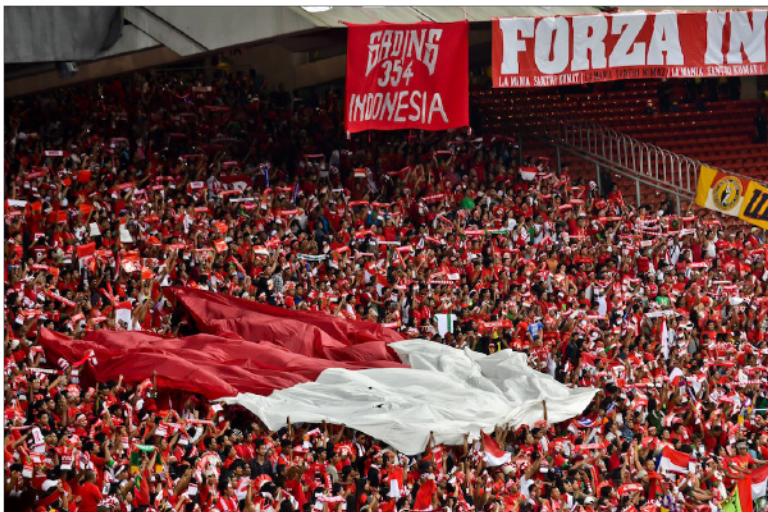
Indonesia soccer fans