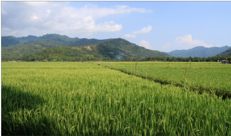
Rice fields in Lombok

subsidized pribumi (native Indonesian) businesses, nationalized Dutch business enterprises, and limited foreign investment. It also co-founded the Association of Southeast Asian Nations (ASEAN) to promote a regional free-trade area, and has borrowed heavily from foreign sources to finance development projects and government debt. When oil prices declined in the 1980s and economic growth slowed, Indonesian manufacturing moved toward the export of non-oil goods. 10