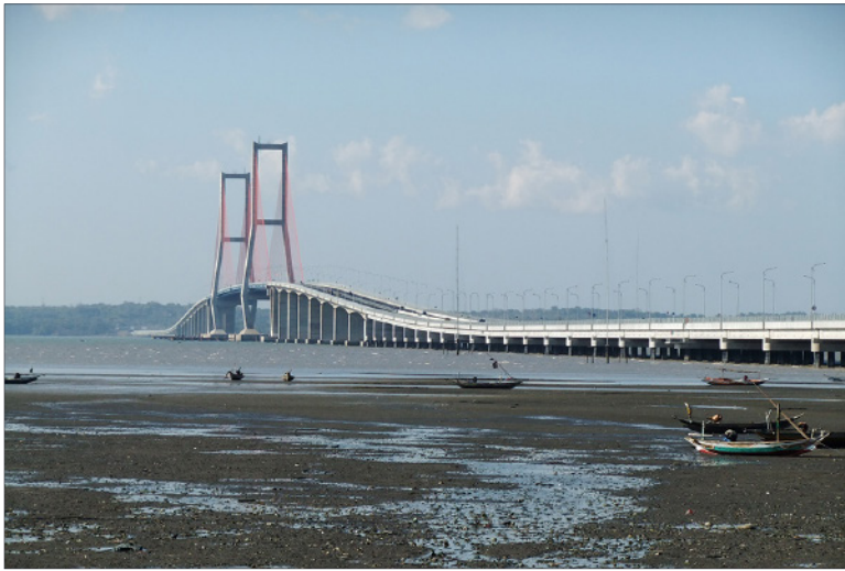
Longest bridge in Indonesia

Forestry Ministry to plant in Jakarta Bay, in an attempt to halt saltwater seepage inland and into city water supplies.) 57 An organizational problem confronting the city is a law enforcement structure that is unable to handle protests. 58, 59