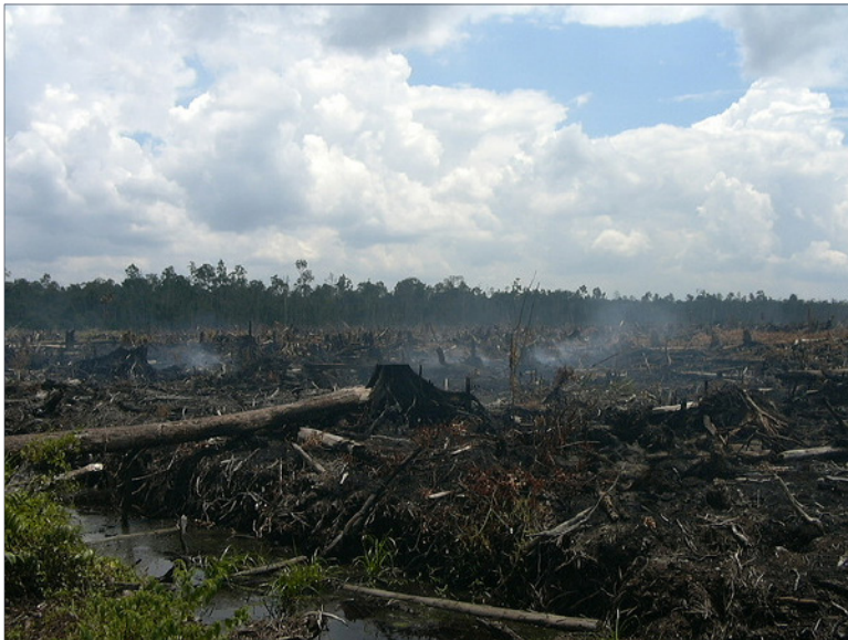
Illegal burning of forest