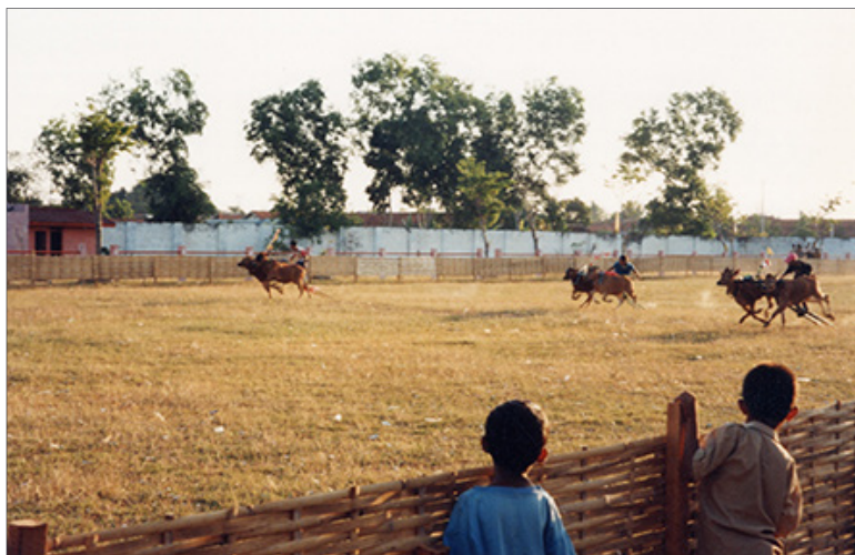
Bull racing in Madura

modified Latin script, it is “indisputably the language of government, schools, national print and electronic media, and interethnic communication.” 20, 21