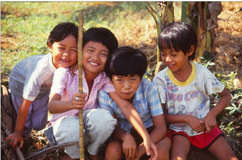
Javanese children

Indonesian society is generally communal and hierarchical. Meeting the obligations of family and community is more important than satisfying individual desires. The basic principles which guide life include the concepts of mutual assistance or “gotong royong”, consensus or “mufakat” and consultations or “musyawarah”. 7 In cities, gotong royong might be carried out through a neighborhood cleanup, whereas in villages it might be getting together to construct a house. 8 In a consultative process known as musyawarah mufakat , meetings may go on for days until a dispute is settled to the satisfaction of all. 9 10 Direct and open disagreements between people are rare, and politeness is valued and expected. 11,12 A strong sense of hierarchy suffuses social relationships. Great respect is paid to elders. 13 Social status is reinforced through deferential forms of behavior and address, through patronage networks, and through a paternalistic assumption of welfare for those of a lower rank. 14 The concepts of malu (social shame or losing face), gengsi (doing things for the sake of appearances), asal bapak senang (keep the boss happy), and memojokan (having no way to save face in a situation) shape social interactions every day. 15