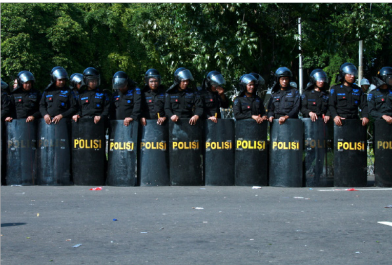
Anti-Riot Police

164 New Guinea natives often attack Javanese immigrants, and Sumatrans turned on a Balinese migrant community in Lampung in 2012. 165, 166