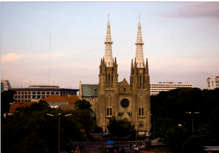
Church building

They have also been the object of much resentment and the victims of prejudice. In the Jakarta riots of 1998, many were murdered by other Indonesians. 54