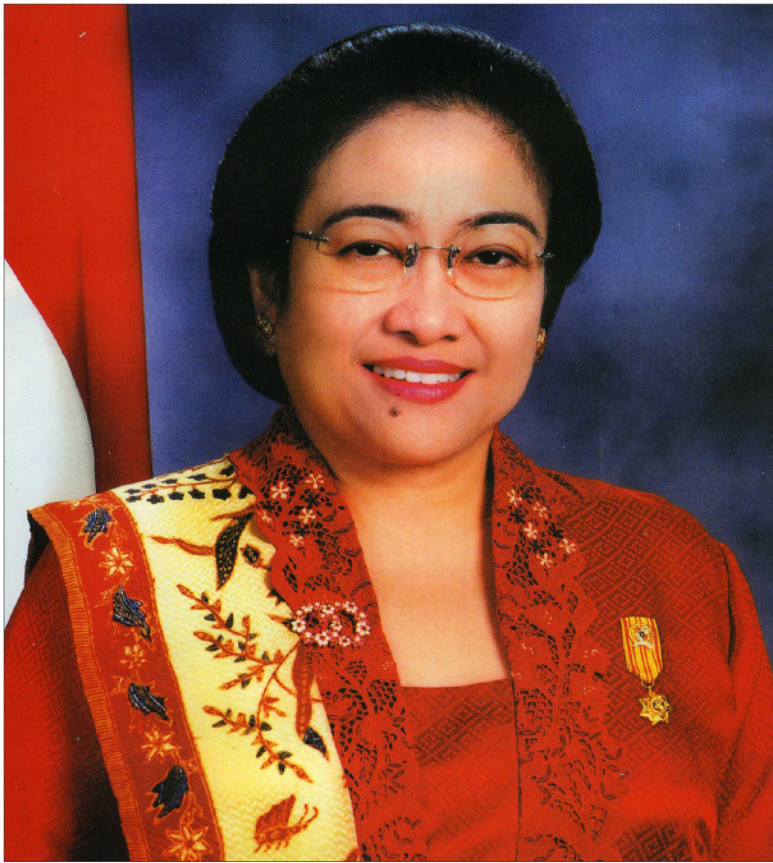
Megawati Sukarnoputri

the region's extensive mineral wealth makes independence a highly undesirable option for the Indonesian government. 65, 66 Government security forces killed two resistance leaders in separate incidents in 2012. 67, 68