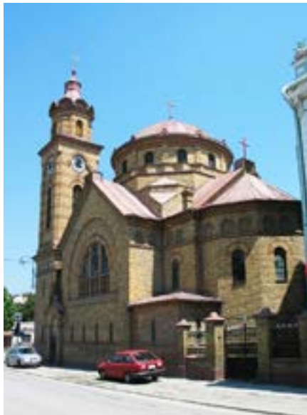
Romanian Orthodox Church in Vršac