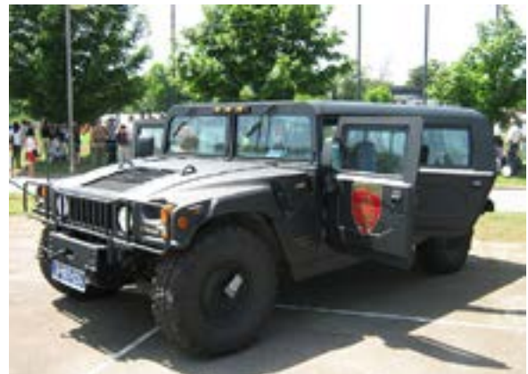
Counter-Terrorist Unit vehicle

Transnational terrorism threatens Serbia as it does other states located between the Middle East and Western Europe. In Serbia, the movements of terrorists, weapons, and narcotics are facilitated by the porous borders it shares particularly with Kosovo and Bosnia and Herzegovina. Serbian intelligence reported that Islamist recruiters are most active in the Albanian-Muslim region of southwestern Serbia, and issued a list of suspected terrorists and terrorist organizations. 162, 163, 164 In 2014, Serbia made changes to its criminal code, outlawing unauthorized participation in wars or armed conflicts abroad. 165, 166