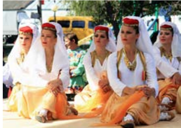
Serbian dancers in traditional costumes

The Serbian constitution of 2006 affirms the protection of national minorities. The constitution also protects the use of minority languages and prohibits linguistic discrimination. Serbia ratified the European Charter for Regional or Minority Languages and recognizes the following 10 languages: Albanian, Bosnian, Bulgarian, Croatian, Hungarian, Romany, Romanian, Ruthenian, Slovak, and Ukrainian. 12, 13 Children can receive primary and secondary education in the language and culture that correspond to their ethnic group or nationality. 14 The northern province of Vojvodina, which is the most multiethnic and multi-linguistic region in the country, recognizes six official languages. 15