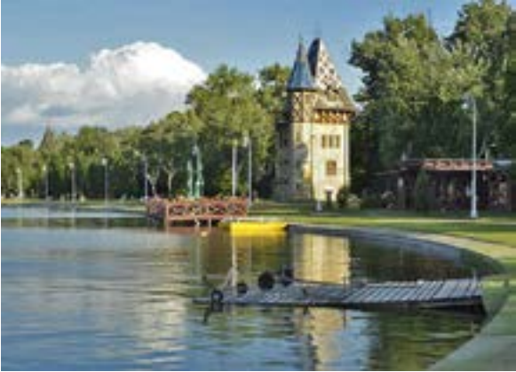
Lake Palić

The natural lakes in Serbia are generally small and are primarily located in Vojvodina. Most are either glacial remnants or oxbow lakes formed by river meanderings and rugged terrain. Lake Palić is a salt lake, located in Vojvodina , near the town of Subotica . The lake is a nature reserve and a home to rare species of orchids. The largest artificial lake, created by a hydroelectric dam, is Đerdap, located on the Danube. 44,