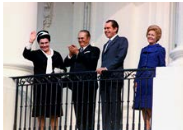
Richard Nixon with Tito at the White House in 1971

Under Tito's leadership, Yugoslavia pursued a socialist agenda; the League of Communists controlled the Skupština (National Assembly). Yugoslavia maintained close ties with the Soviet Union until a split from Moscow in 1948. After the split, Tito established a foreign policy of nonalignment. A distinctive Yugoslav communism, or "Titoism," replaced Stalinism. 104 Yugoslavs could work or travel freely, and the country's standard of living was higher than most socialist states. This system maintained Yugoslavia's unity during Tito's rule. 105, 106