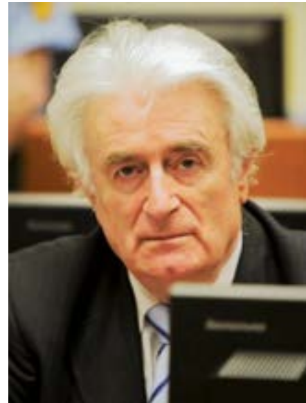
Karadžić in March 2016

In December 2017, the ICTY in The Hague ended investigations and prosecutions after 24 years of operation and 161 indictment. 184