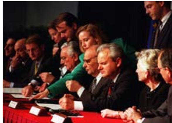
Milošević, Izetbegović and Tuđman signing the Dayton Peace Accords on 14 December 1995

In 2007, the International Court of Justice ruled that the mass killing in Srebrenica was genocide and cleared Serbia of direct responsibility. However, the court's president stated that Serbia could and should have prevented the genocide, and ordered Serbia to hand over Ratko Mladić, who had been indicted for the genocide by the International Criminal Tribunal for the former Yugoslavia (ICTY). 30 In 2011, Mladić was arrested by Serbian authorities and put on trial by the ICTY. 31, 32 In November 2017, Mladić was found guilty of genocide and war crimes and sentenced to life in prison. 33, 34