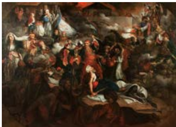
The Conquest of Belgrade (1844–45), by Katarina Ivanović

During the 1778–1791 war in which allied Russian and Austro–Hungarian forces faced the Ottomans, the Serbs revolted once again. Some Serbs served as soldiers and officers in the Habsburg armies and learned about military tactics and