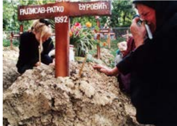
Women mourns at a grave at the Lion's cemetery in Sarajevo

After Bosnia-Herzegovina declared independence, Bosnian Serb forces backed by the Serb-dominated Yugoslav Army launched an offensive on Bosnia's capital, Sarajevo. 120 The campaign of "ethnic cleansing" of Bosnian Muslims by paramilitary Serbian troops drove Muslims from their towns and villages and subjected them to imprisonment in concentration camps, murder, and other atrocities. 121 In April 1992, Sarajevo became a worldwide symbol of the brutality of the Yugoslav wars. In response, the UN Security Council imposed strict economic sanctions on Serbia. 122, 123,