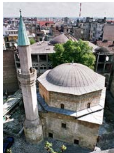
The exterior of the Bajrakli Mosque, Belgrade

Serbia is a secular state but religious affiliation is one of the defining characteristics of Serbia's ethnic population. According to the 2011 census, nearly 85% of the population belongs to the Serbian Orthodox Church. Ethnic Croats and Hungarians in Vojvodina are predominately Roman Catholics (5%). In southern Serbia, ethnic Albanians, Bosniaks, and Roma are Sunni Muslims (3%). Slovaks residing in Serbia are mostly Protestant Christians (1%). The rest of the population includes Jews, Buddhists, agnostics, members of Eastern religions, and a variety of so-called non-traditional religious groups such as Jehovah Witnesses, Mormons, Christian Baptists, and others. 44, 45, 46