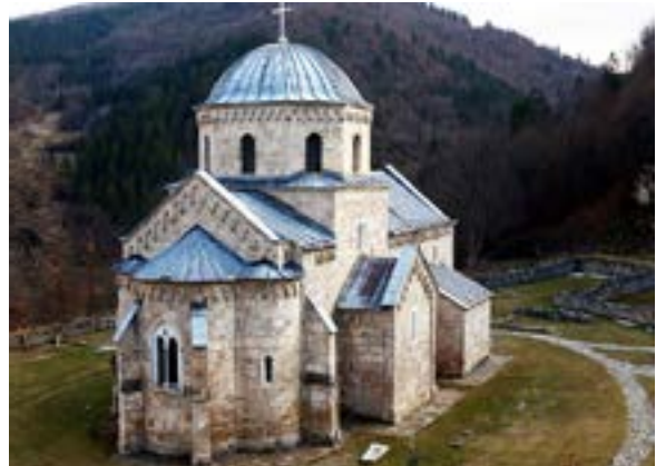
The Gradac Orthodox Monastery lies above the river Gradačka

The Serbs arrived in the Balkans in the 6th century CE and adopted Christianity. A succession of strong rulers established a Serb empire that dominated the Balkan Peninsula by the 12th century CE. The region was conquered by the Ottoman Turks in the 14th century, leading to 300 years of Turkish rule and the Christian-Muslim enmity that persists today. 2, 3, 4 After numerous anti-Ottoman uprisings and European wars, Serbia became an autonomous principality in 1815 and an independent kingdom in 1875. 5