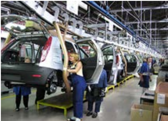
FIAT production line: motor vehicles are the leading export product of Serbia factories connected to the automotive industry have been built in Serbia with foreign investments. 29, 30, 31

The most important industrial sector in Serbia is the automotive industry, which accounts for 10% of exports and employs more than 40,000 people. The auto industry was resurrected with foreign investments and Serbian capital from smaller businesses, totaling more than EUR 2 billion (USD 2.42 billion). The government offers benefits and tax incentives to investors who hire more than 100 workers and invest more than EUR 8.5 million (USD 10.28 million) in Serbia. The automotive industry attracts more FDI than any other manufacturing sector. 28