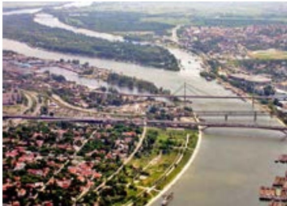
Sava River: Overview of the three Belgrade bridges

In the early 2000s, two industrial accidents occurred on the Tisa’s tributaries in northwestern Romania. Wastewater containing up to 120 tons of cyanide and heavy metals were released into the Lăpuş River, then flowed downstream into the Someş and Tisa rivers in Hungary, before entering the Danube. 36, 37