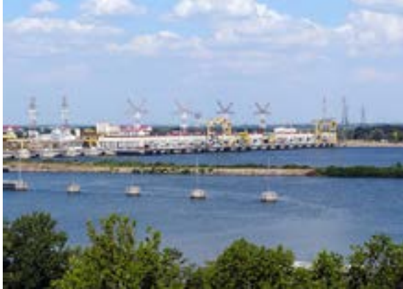
Đerdap 1 hydroelectric power station

basins are owned and managed by subsidiaries of the national power utility company. The mines supply lignite (soft brown coal) to two power plants that produce 50% of Serbia's electricity. 46