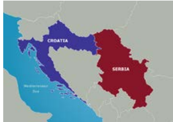
Location map of Serbia and Croatia DLIFLC

Croatia declared independence in June 1991. The large ethnic Serb minority rejected the new state. A bitter war soon broke out. Croatian Serb forces, aided by the Serb-dominated Yugoslav People's Army, laid a three-month siege to the town of Vukovar (Bukovar) and bombarded the historic city of Dubrovnik to gain Croatian territory that would eventually become a part of a Greater Serbia. 60, 61, 62 By 1995, Croatian forces regained momentum and territory, causing 200,000 ethnic Serbs to take refuge in Serbia. 63, 64, 65