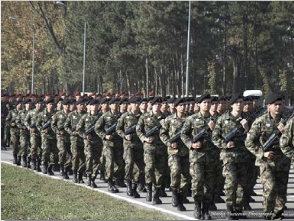
Military Parade, Belgrade