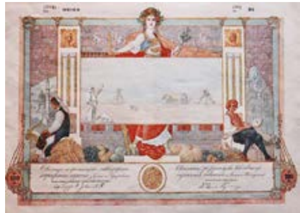
Bond of the Kingdom of Serbs, Croats and Slovenes for the liquidation of the agro-debts from Bosnia and Herzegovina, 1921

The Kingdom of Serbs, Croats, and Slovenes was founded on 1 December 1918. It was ruled by King Peter Karadjordjević until his death in 1921; he was succeeded by his son, Alexander I. The new kingdom included Serbia and Montenegro, the South Slav territories of Dalmatia, Croatia-Slavonia, Slovenia, Bosnia and Herzegovina, and Vojvodina. 89, 90, 91 The period between the wars was a march toward economic modernization, particularly industrialization. Political infighting and nationalist struggles, however, plagued the kingdom. 92