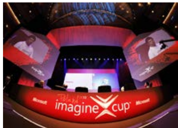
ImagineCup software design presentation

In recent years, creative and knowledge-based industries such as information technology, advertising, publishing, motion pictures, music and video productions, architectural services, and outsourcing have been of increasing