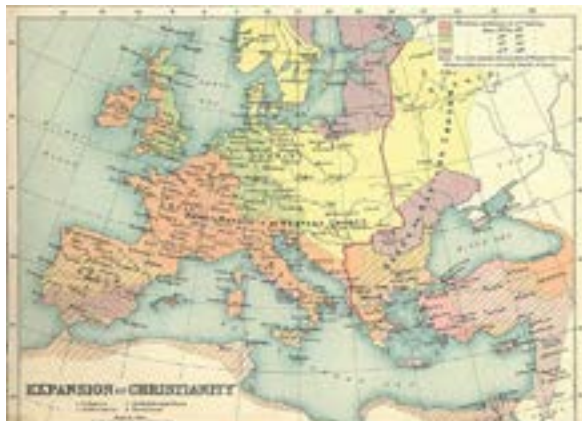
Expansion of Christianity, division between Eastern and Western churches

In the 11th century, the first Serbian kingdom began to emerge in present-day Montenegro. Around 1036, Stefan Vojislav proclaimed loyalty for Rome and began to bring the Serbian tribes under his control. In 1077, Zeta, as the land was called, became a kingdom under Constantine Bodin, who ruled as a Catholic. After Bodin’s death, the state dissolved into civil war and power started to shift back to Raška. 16