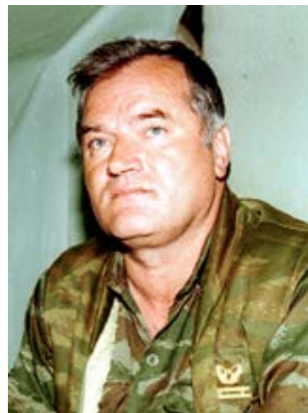
Ratko Mladić in Sarajevo in 1993

In 1995, the Bosnian Serb military and political leaders Ratko Mladić and Radovan Karadžić were indicted by the ICTY for their role in masterminding and overseeing the Srebrenica genocide. Mladić lived in Belgrade where he enjoyed the protection of President Milosevic until his fall from power in 2000. He spent the next eight years hiding in Serbia. 172, 173, 174