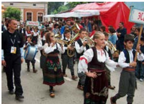
Guča Trumpet Festival

charges for domestic violence are often not prosecuted due to a lack of evidence or victims' refusals to press charges. 81, 82