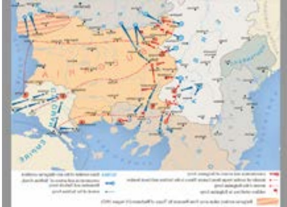
Map of the Second Balkan War

Macedonia was divided between the victorious allies. 76, 77