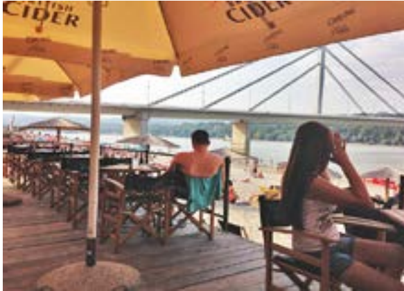
Beach on the Danube in summer

In most areas, the climate is continental, with hot, humid summers followed by cold, relatively dry winters. Mid-summer temperatures in the northern part of the country average about 22°C (71°F), while January temperatures average about -1°C (30°F). In the mountainous southern part of Serbia, average mid-summer temperatures are cooler (roughly 18°C, or 64°F). 21