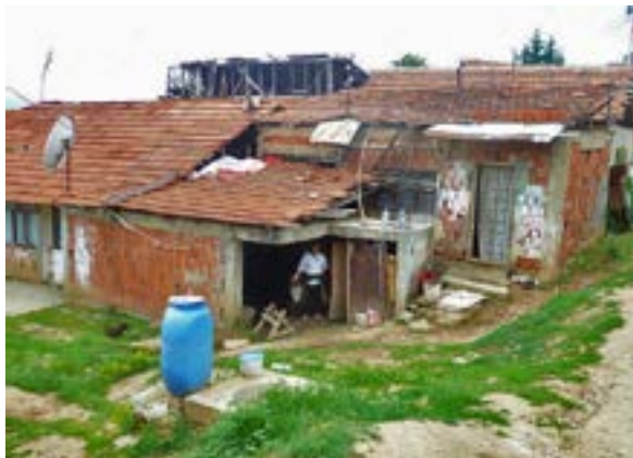
Poverty: Roma housing in Vranje

Serbia has made steady improvement on the human development index over the years, yet its progress is the slowest in the region. In 2016, Serbia climbed to 66th place out of 188 countries and ranks among countries with high human development. 98 GDP per capita in 2016 was USD 5, 426, 99