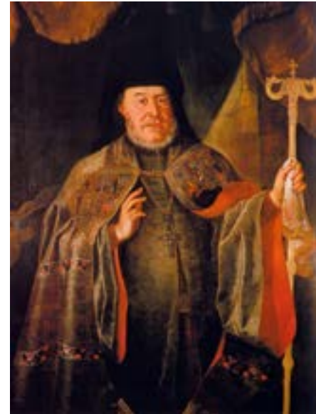
Serbian Patriarch Arsenije IV, leader of the Second Great Serbian Migration in 1737

weapons. 50 The war ended with the Sistova (1791) and Jassy (1792) treaties granting the Serbs a degree of autonomy. The Turks also agreed to expel the Janissaries from Belgrade. However, the agreements were not enforced and turmoil persisted in the region. 51