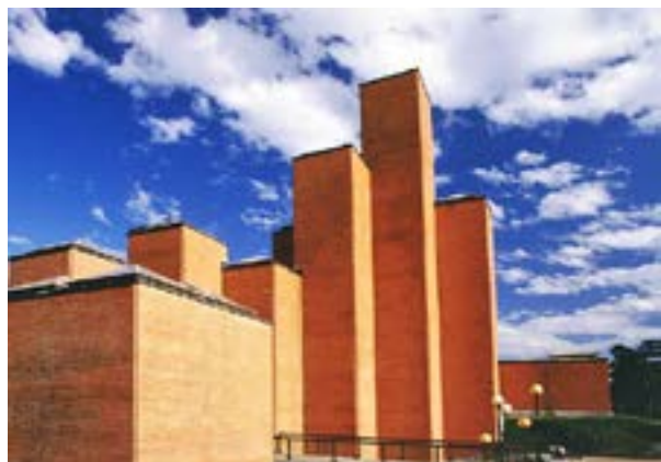
Museum of Genocide in Kragujevac

Kragujevac's most famous contribution to the global economy was the Koral automobile, which was imported to the United States as the Yugo between 1985 and 1992. 79, 80 Zastava was one of Yugoslavia's most successful industrial complexes, producing everything from Kalashnikovs to Yugo cars, until the wars and trade embargoes of the 1990s crippled production. The plant, which lies