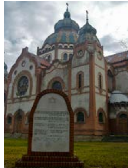
Synagogue in Subotica

In 2016, the parliament adopted a law on restitution of heirless and unclaimed Jewish property seized during the Holocaust. The law grants the Jewish community close to EUR 1 million a year for a 25-year period. During World War II, close to 90% of the Jewish population was killed in Nazi occupied Serbia, putting the total death toll at about 16,000. 53, 54