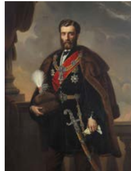
Prince Mihajlo Obrenović, Prince of Serbia during 19th century

Mihajlo Obrenović (Michael III), a son of Miloš, became prince in 1860. He liberalized the constitution and in 1867 successfully pressured the Turks to withdraw all garrisons from Serbian cities. Industrial development began around this time, and a new class of peasant proprietors emerged. Educated in the West but retaining his father's autocratic approach, Mihajlo and Serbian intellectuals of the time envisioned a South Slav confederation, and Mihajlo organized a regular army to prepare for liberation of Turkish-held Serbian territory. However, he was eventually assassinated (with the suspicion that Karađorđević supporters were involved). 67, 68, 69