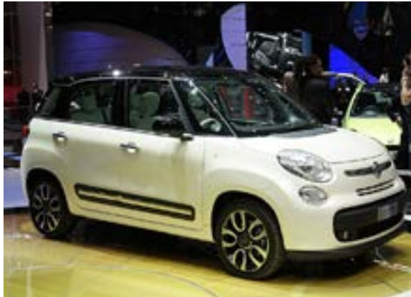
Fiat 500L manufactured in Kragujevac

Serbia is a member of the Central European Free Trade Agreement (CEFTA), whose objective is to expand trade and investment among its members. Serbia has free trade agreements with Russia, Belarus, Kazakhstan, and Turkey, and is a member of the European Free Trade Association (EFTA) with Norway, Switzerland, Iceland, and Liechtenstein. The United States and Japan give preferential duties on certain imports from Serbia. 59