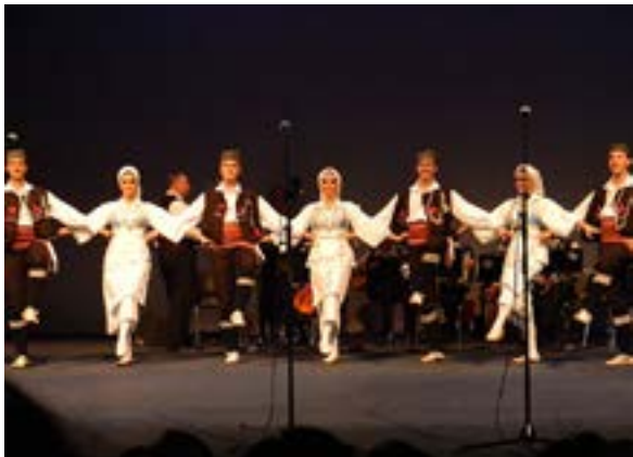
Serbian traditional dance from Gnjilane

Another famous director is Aleksandar Saša Petrović, who was twice nominated for an Academy Award for best foreign film when Serbia was still part of Yugoslavia. 93 Currently, Serbia is emerging as a popular destination for movie producers, offering a diverse landscape, architecture, and experienced film crews. 94