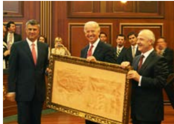
Thaci, Biden and Sejdiu with Declaration of Independence of Kosovo

In April 2017, Prime Minister Aleksandar Vučić, whose Progressive Party won a landslide victory in 2014, won the presidency. Shortly afterwards, Vučić appointed Ana Brnabić to succeed him as prime minister. 166 Brnabić, the first woman to hold the job, quickly set to work to implement administrative reforms and prepare Serbia for eventual EU membership. 167