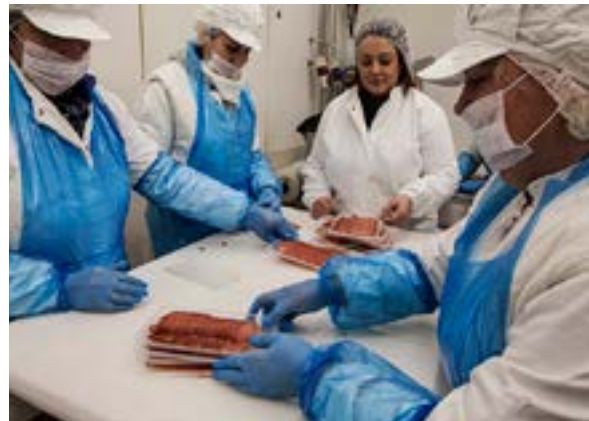
Food processing factory

There are more than 4,500 businesses in the food processing industry; about 75% of these companies employ fewer than ten employees. Currently, foreign companies own more than 90% of the food processing