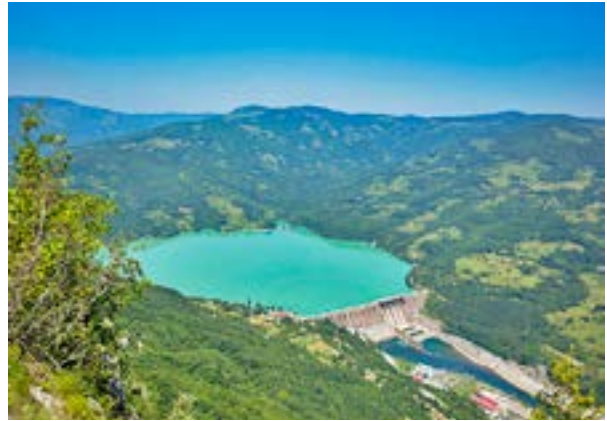
Hydroelectric Power Perucac Drina Dam, Drina River

The Tisa River is the longest tributary of the Danube. The river flows south through Hungary before entering Vojvodina. The Tisa is connected to the Danube by its natural course and through an extensive series of canals that help irrigate the fields of Vojvodina. 33 The river is famous for a natural phenomenon called “The Blooming of the Tisa,” in which a unique species of aquatic insect, the Tisa mayfly, comes to life. 34, 35