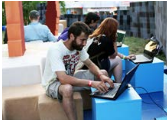
Serbian internet users

The Directorate of Police and the Security-Information Agency (BIA) participate in regional counterterrorism and countering violent extremism conferences and training exercises. Serbia is a partner in the Global Coalition to Defeat ISIS and the coalition's Foreign Terrorist Fighter Working Group. Since the beginning of the migrant crisis, Serbian counterterrorism efforts have focused on upgrading border security and tracking and vetting refugees and migrants who cross Serbia. Serbia also cooperates with Interpol and Europol on counterterrorism activities. 167, 168