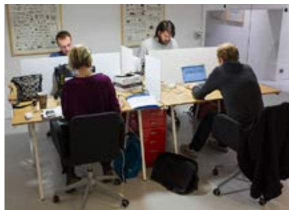
Young employees working for Namics

Unemployment rates fluctuate between 12% and 16%, but the youth unemployment rate is around 50%. Much of the potential workforce is underqualified to participate in the economy due to a lack of proper education. However, expected years of schooling stands at 14.4. 106, 107 The adult literacy rate is 98.84%, with a small difference between males and females. 108