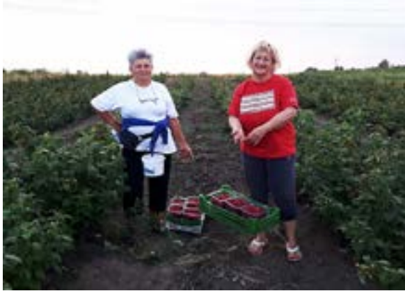
Serbia is the world's second largest producer of raspberries DLIFLC

and sheep represents about one-third of Serbia's agricultural production. 14, 15