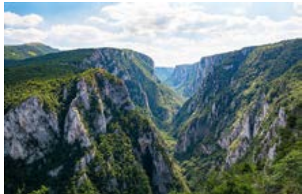
Lazar's Canyon in eastern Serbia

In south-central Serbia, the terrain is more hilly than mountainous. The Šumadija hills, which means, "forested area," range from 600 to 1,110 m (2000–3,500 ft). This formerly wooded area has been cleared for agricultural cultivation. The hills are the most prominent physical feature in this region, which was the heart of the medieval Serbian empire. 17 The area is famous for its ancient vineyards and winemaking; Serbia's royal vineyard and cellars were located here. The region is also known for its plums. 18