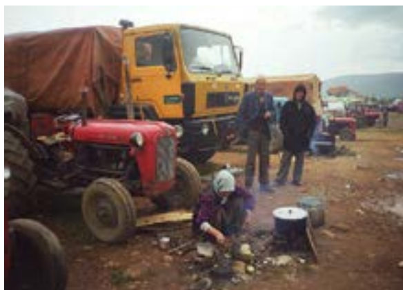
Kosovo Albanian refugees in 1999

In July 1995, Bosnian Serb forces systematically killed over 7,000 Bosnian Muslim boys and men in the town of Srebrenica in eastern Bosnia and Herzegovina. In response, NATO conducted a month-long bombing campaign against Serb forces in Bosnia and Herzegovina. The bombardment and the collapse of the Bosnian Serb resistance brought the Bosnian Serbs to the bargaining table. 125, 126, 127 In December 1995, in Dayton, Ohio, Bosnian Serbs accepted a series of agreements that ended hostilities in Bosnia. The agreement led to the lifting of economic sanctions and to economic recovery. 128, 129