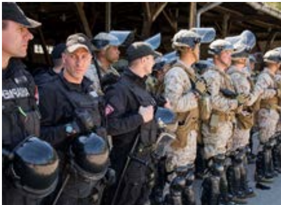
Joint anti-terrorism and security operation training

The Security-Information Agency (BIA) is the national intelligence agency of Serbia. The agency is responsible for research, collection, assessment, and dissemination of security-intelligence data. It runs counter-intelligence operations as well. 160 The BIA was founded in 2002, inheriting some of the staff that worked for the notorious State Security Service, whose predecessor was the Yugoslav Secret Service. 161