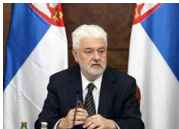
Mirko Cvetkovic, pro-EU Prime Minister

Serbia continued to resist the UN plan to set Kosovo on the path to independence, but in February 2008, Kosovo declared itself independent. 157 Serbia and Russia rejected the move while 70 nations, including the United States, supported Kosovo's independence. 158, 159