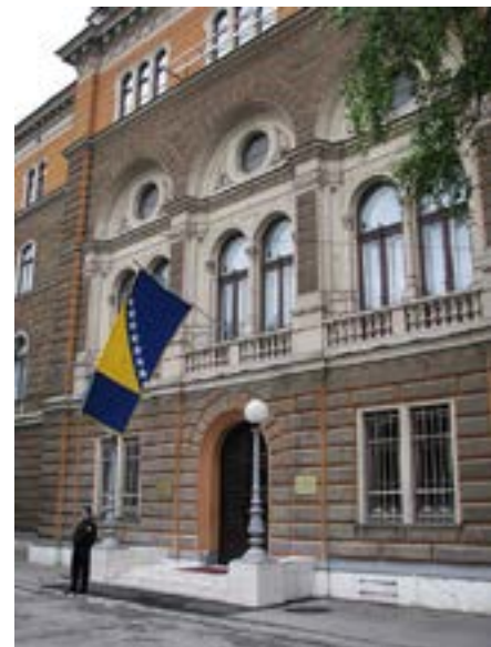
BiH Presidency Building, Sarajevo

On 27 April 1992, Serbia and Montenegro joined in passing the constitution of the Federal Republic of Yugoslavia (FRY), a country that was only a fraction