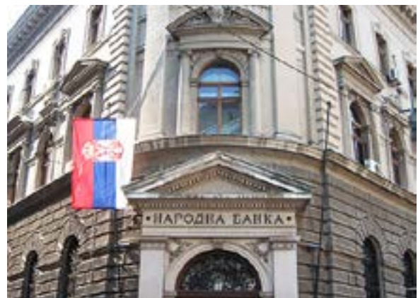
Old headquarters of The National Bank of Serbia (NBS), Belgrade

Banks in Serbia offer some of Europe's highest interest rates on deposits. Foreign banks offer high interest on accounts in Serbian dinars. 89 No U.S. banks operate in Serbia. The state-controlled bank, Komercijalna Banka, has strong relations with U.S. banks. 90