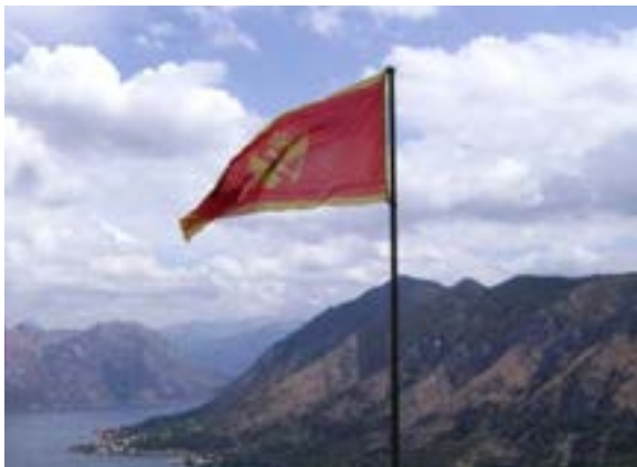
Montenegrin flag at the Bay of Kotor

After Montenegro recognized Kosovo's independence in October 2008, relations between the two countries soured. Serbia expelled the Montenegrin ambassador but Montenegro did not reciprocate. In January 2010, after Montenegro announced its decision to establish formal diplomatic relations with Kosovo, Serbia again protested by recalling its ambassador to Podgorica. 123, 124 The president of Montenegro called the Serbian reaction “emotional” and explained that