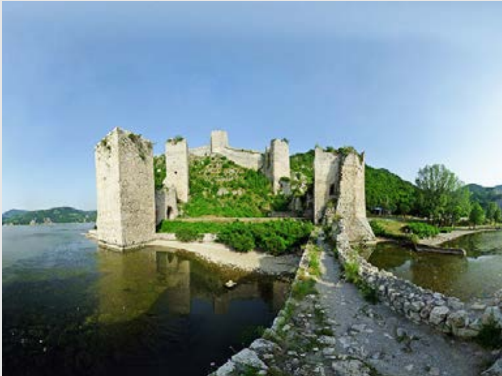
Golubac Fortress guarding the Danubian frontier of the Balkans