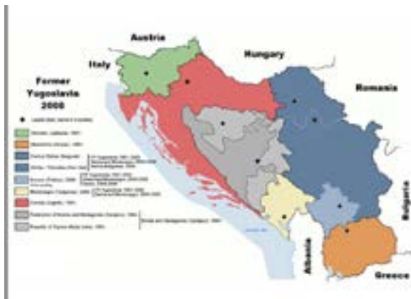
Former Yugoslavia 2008

lifting economic sanctions and offering aid. 144, 145