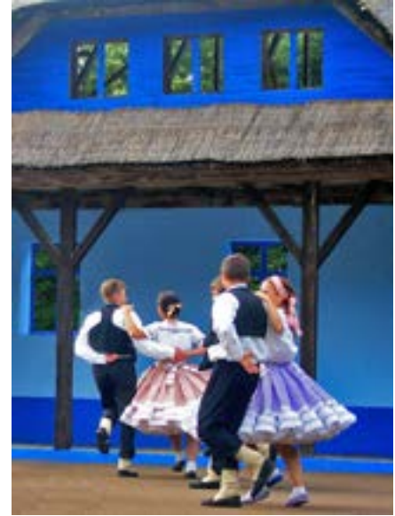
Slovaks dancing in Vojvodina

Ukrainians settled in Vojvodina in the 18th and 19th centuries. Ukrainians are Orthodox Christians. Ruthenians, a national minority who may have originated in Ukraine, settled in Vojvodina in the 17th century and are Greek Catholics. Ukrainian is not an official language, but education in Ukrainian is available to an extent in Vojvodina. 25