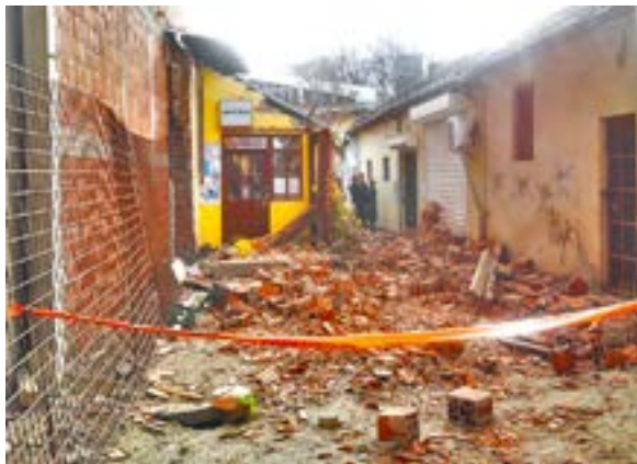
After an earthquake, Kraljevo, Rashka

Much of Serbia is a seismically active region that experiences occasional earthquakes. Earthquake severity is classified as medium. The areas most prone to heavy shaking are in the Kopaonik Mountains region. 101, 102 The most damaging earthquake to affect Serbia in recent times was a magnitude 5.3 quake in the Kopaonik Mountains in September 1983 that destroyed more than 1,000 buildings and dwellings in the surrounding region. 103 In 2010, an earthquake measuring 5.4 magnitude quake hit central Serbia