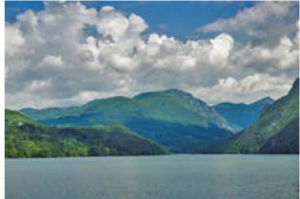
Perućac lake

Most of Serbia's rivers drain into the Danube (Dunav in Serbian), which enters Serbia from Hungary and flows across the country toward Romania and the Black Sea. The Danube is the second longest river in Europe. It flows through 10 countries and 4 capital cities. The widest part of the river is 5.5 km (3.4 m). 26 In the past, the Danube marked the border between Serbia and the Austro-Hungarian Empire. Today, the Danube still defines parts of Serbia's borders. To the west, the river separates Serbia from Croatia for most of their shared border. To the east, the Danube forms part of the boundary between Serbia and Romania, as it traverses the Iron Gate gorge on its way to the Wallachian Plain. 27