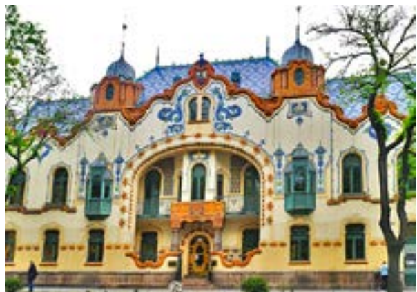
Reichel Palace, Subotica DLIFLC

Subotica is a market city for the fertile fields of the Bačka region, the area of Vojvodina lying west of the Tisa River and north of the Danube River. Leading industries include electrometallurgy, plastics, pharmaceuticals, machinery, and metal furniture. 87