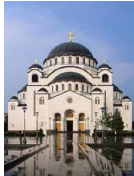
Serbian Orthodox Church: Cathedral of Saint Sava

The Serbian Orthodox Church dates back to the consecration of Prince Rastko Nemanjić (St. Sava) as first Archbishop of Serbia in 1219. Through its history, the church has come to represent Serbian nationalism, most notably during the centuries of Ottoman rule. Until 1766, the religious center of the Serbian Orthodox Church was the Kosovo city of Peć, which is one reason many Serbs are opposed to Kosovo's independence. 38, 39, 40 In March 2018, the Serbian Orthodox Church decided to add the words "Patriarchate of Peć" to its name to strengthen its ties to Kosovo. 41