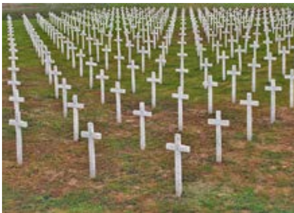
Memorial Cemetery in Vukovar

Both Croatia and Serbia have filed suits before the International Court of Justice in The Hague, accusing each other of genocide. 71 In 2013, the United Nations' Yugoslav war crimes tribunal in The Hague acquitted two Croatian generals charged with ethnic cleansing of Serbs, leaving Serbs embittered. 72