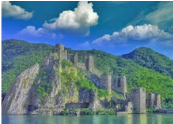
Golubac Fortress

The travel and tourism industry includes the restaurant and leisure activities sectors, hotels, travel agents, airlines, and other tourist-supported transportation services. 70 In 2016, the travel and tourism industry contributed 2.3% to Serbia's GDP. Over half a million tourists visited Belgrade in 2017. There has been a steady increase in the number of tourists from the United States, China, Turkey, Greece, Israel, and Serbia's neighbors. 71, 72 The most visited tourist spots are Belgrade, Novi Sad, the