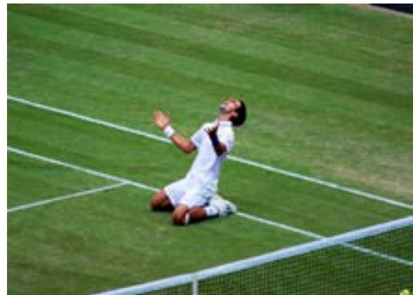
Djokovic celebrates by following his victory in the semi-finals of the 2011 Wimbledon Championships

Basketball is tremendously popular. In 2018, Serbia