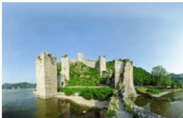
Golubac Fortress guarding the Danubian frontier of the Balkans

By the early 20th century, Serbia's growth upset the balance of power in the Balkans, leading to the start of World War I. After the war, the Serbs and other South Slavs joined in the Kingdom of Yugoslavia. 6 During World War II, Serb partisans fiercely resisted Axis occupation. After the war, communist leader Josip Broz Tito remade the country into a socialist federal republic of coexisting Serbs, Croats, Slovenes, Bosnians, Macedonians, Montenegrins, and Albanians. 7