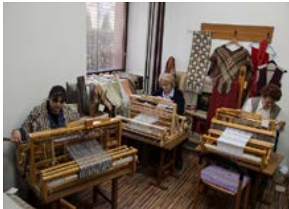
Serbian weavers

Aero-East Europe with its headquarters in Kraljevo manufactures light airplanes for the purpose of photo shooting, aerial spray, aerial border and traffic control, flying ambulances, and more. The company manufactures new SILA models (Serbian Industry of Light Aircraft) and provides maintenance and repairs of light aircraft. 36 In 2013, Serbia entered into partnership with Etihad Airways to form Air Serbia, after reorganizing and rebranding the former national air carrier Jat Airways. 37, 38