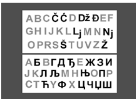
Serbian Latin (top) and Cyrillic alphabet (bottom)

are often restricted to informal housing and settlements. 32, 33 During World War II, the Nazis viewed Roma to be racially inferior, similar to the Jews, and subjected them to forced labor, internment in concentration camps, and mass murder. 34