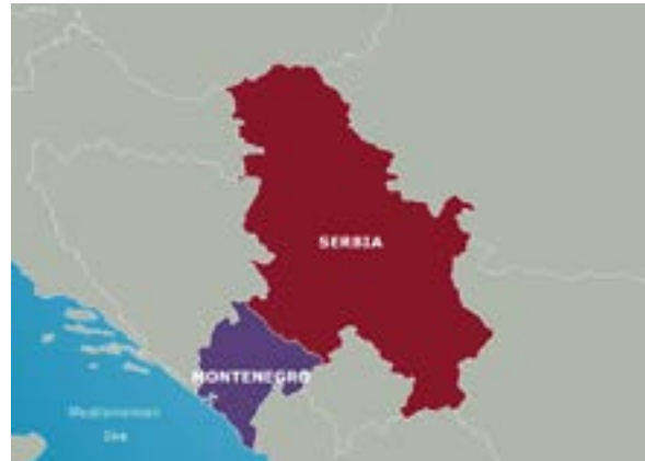
Location map of Serbia and Montenegro DLIFLC

Serbs and Montenegrins share the same language, Orthodox Christianity, and culture, but Montenegrins have a separate identity. In May 2006, Montenegro voted to secede from the union with Serbia and establish a separate nation. Ethnic Serbs, which constitute a third of the population, opposed the split. A month later, Serbia recognized Montenegro as a sovereign state. 121, 122