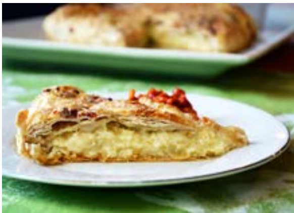
A slice of Gibanica

Bread has long been a staple of most meals and is associated with many Serbian Orthodox religious rituals. Krsna Slava , which is a celebration of the patron saints of Serbian families, is celebrated with slavski kolać , a circular bread loaf, which often has religious or family seals imprinted on the upper crust. 61 Burek is a savory pastry filled with cheese, ground meat, or mushrooms, that can be found in pastry shops and bakeries. 62, 63