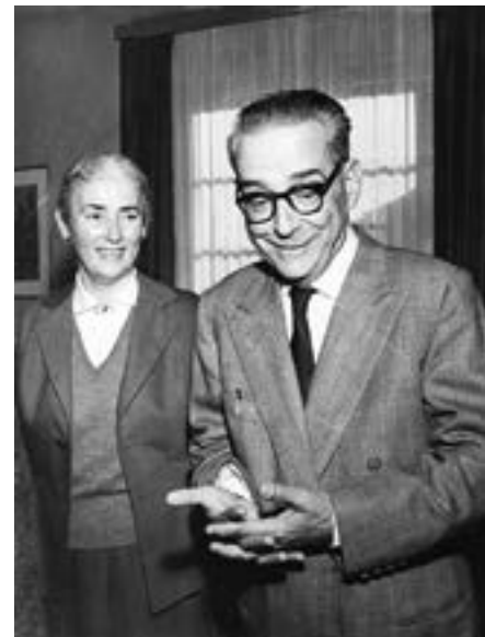
Nobel Prize winner, Ivo Andrić

Ivo Andrić, who won the Nobel Prize for Literature in 1961, attracted international attention to Serbian