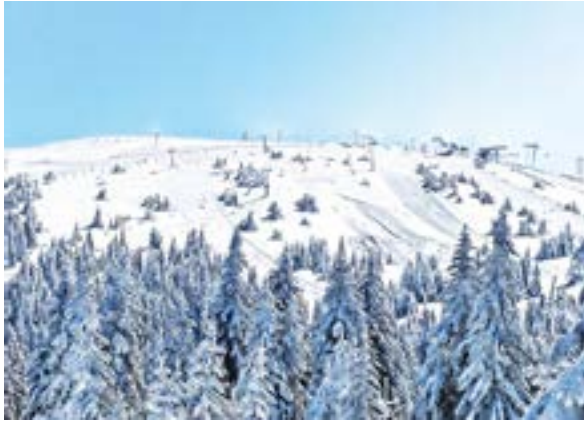
Kopaonik mountain in winter

Mountains, which belong to the eastern sections of the Dinaric Alps (Dinardi). 12