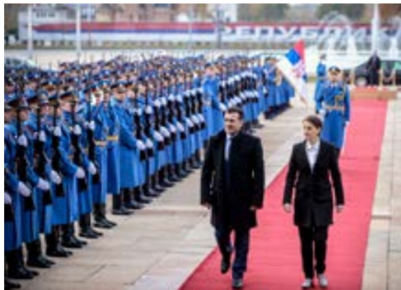
Macedonian Prime Minister Zoran Zaev on an official visit to the Republic of Serbia

Since 2015, Serbia has tightened control of the southern border and formed special units that patrol the border with Macedonia to prevent the smuggling of refugees and migrants into Serbia. 114