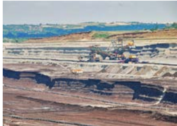
The Tamnava West lignite mine funded by the EBRD and the European Investment Bank

Domestic production and FDI are the major sources of Serbia's sustainable growth. Since 2000, Serbia has received USD 29 billion in gross FDI. EU companies account for almost 75% of the cumulative FDI stock in Serbia. Finance and manufacturing, real estate, and transport have attracted the largest amounts of FDI. The Serbian government established a series of measures aimed to attract foreign capital. Serbia has the lowest corporate tax rate in Europe (10%) and several agreements with different countries regarding double taxation. 91, 92, 93