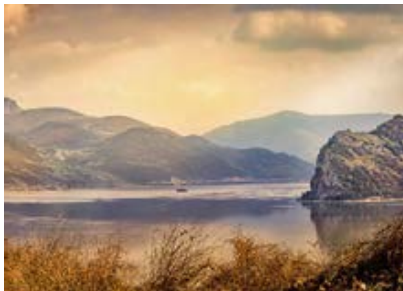
Danube River

The 3 km-long (2 mi) Iron Gate gorge system consists of four narrow gorges. It was considered un-navigable because of its rapids, towering cliffs on both sides of the river, and a large rock reef called Perigrada, which blocked nearly the entire width of the river. The construction of the Sip Canal and a parallel railway in 1896 allowed boats to be towed through the gorges. The construction of two locks, the Iron Gate dam, and the hydroelectric power plant in 1972 finally tamed this stretch of the Danube. 28, 29 Today, river cruises pass through the gorges, offering tourists a spectacular experience. 30