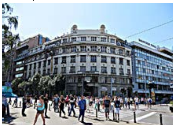
Jugoexport building, Republic Square, Belgrade

Following the successful completion of the IMF program in 2018, Serbia has begun to transform its stalled economy into a functional market economy. Economic confidence has improved, domestic and external trade as well as industrial activity have gone