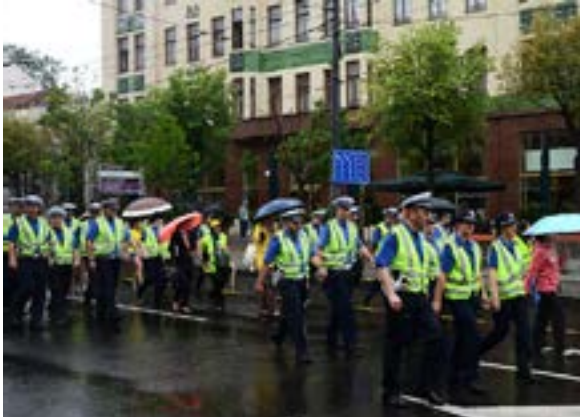
Serbian Police officers

Serbia plans to increase defense spending by nearly 20% in 2018 in order to modernize the armed forces and upgrade equipment. 149, 150