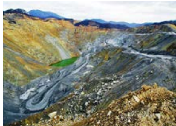
Veliki Krivelj mine is a large copper mine located in Bor District

Serbia's mining industry enjoys strong government support. The Ministry of Natural Resources, Mining and Spatial Planning is responsible for the mining sector. The industry produces primarily copper, iron, and steel, with significant production of gold, lead, coal, salt, and selenium. Other important natural resources are oil, gas, iron ore, zinc, antimony, chromite, silver, magnesium, pyrite, limestone, and marble. 50