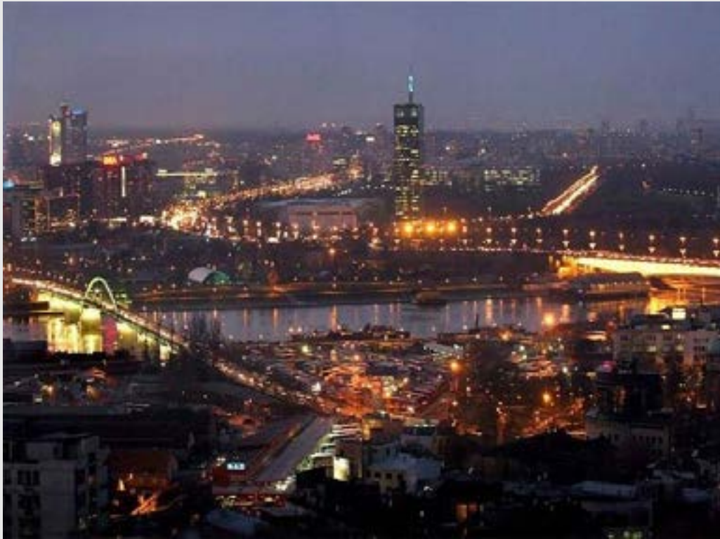
New Belgrade at night-financial center of Serbia