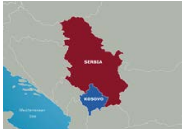
Location map of Serbia and Kosovo DLIFLC

Kosovo poses a big challenge for Serbia. Because Serbs view Kosovo as the birthplace of the Serbian nation and the historic seat of the Christian Orthodox Church, Serbia did not recognize Kosovo's independence, despite its recognition by 116 other countries, including 23 of 28 EU members (Spain, Slovakia, Cyprus, Romania, and Greece do not recognize Kosovo). Serbia also blocked Kosovo's membership in the United Nations and UNESCO with the backing of its allies Russia and China. 90, 91, 92