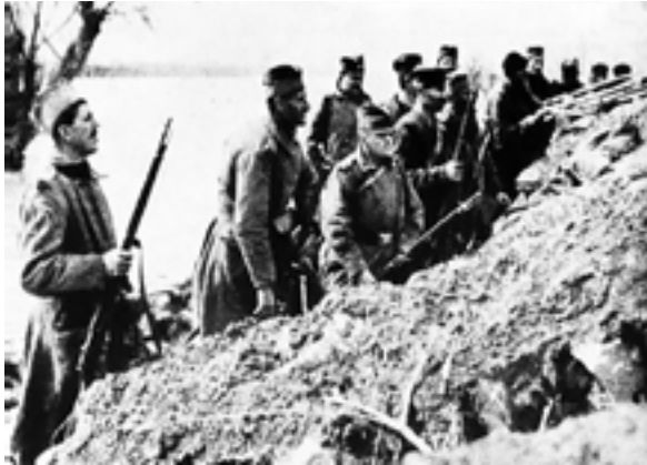
Serbian infantry on Ada Ciganlija during the First World War