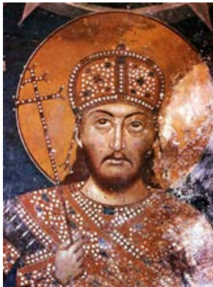
Serbian tzar Stefan Dusan the Mighty