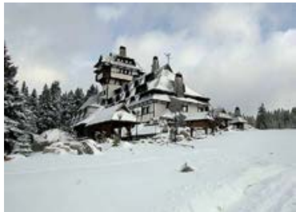
Ski Resort, Kopaonik

Serbia's main rivers include the Danube, Drina, Morava, Sava, and Tisa. Natural lakes are rare, and most are located in the north. 24 More than 90% of surface waters (rivers and channels) enter the country from outside through the Danube, Sava, Tisa, Drina, and other, smaller rivers. The other 8% of surface water originates inside Serbia. 25