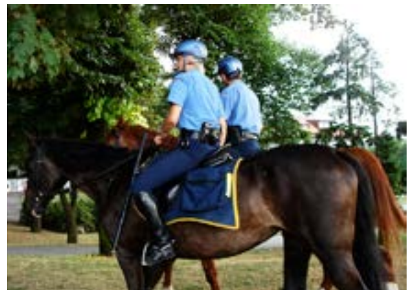
Serbian mounted police

The General Police Directorate is divided into 27 territorial units and 15 organizations. Some of the organizations within the directorate include traffic police, border police, anti-terrorism and counter-terrorism units, criminal police, uniformed police,