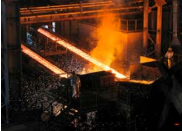
Metal work and machine building industry