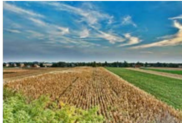
Farmland in Northern Vojvodina region

The northern Vojvodina region is dominated by a flat fertile plain, ranging in elevation between 60–100 m (200–350 ft). This fertile region lies in the southern part of the Pannonian Plain, the remnant of an ancient inland sea. The Pannonian Plain is one of the most agriculturally productive area of Central Europe, covering all of Hungary, northern Serbia and Croatia, eastern Austria, and southern Czech Republic. 8, 9