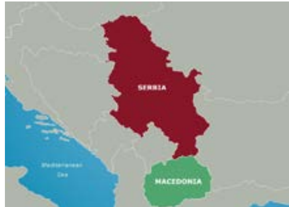
Location map of Serbia and Macedonia DLIFLC

Macedonia, one of the only two former republics that experienced a nonviolent separation from Yugoslavia in 1991, recognized Kosovo's independence on 9 October 2008, together with Montenegro. 110 After the announcement, the Macedonian ambassador was expelled from Serbia. Macedonia didn't reciprocate and welcomed the Serbian ambassador to stay. 111, 112 The two countries retained their economic ties and Serbia remains one of Macedonia's top export markets. 113