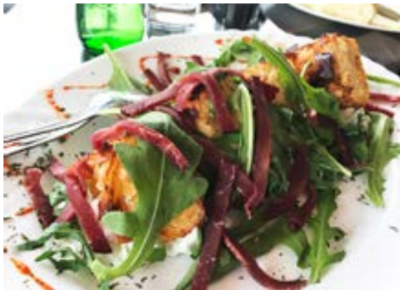
Serbian cuisine DLIFLC

Serbian cuisine is a mix of culinary traditions from Greek, Bulgarian, Turkish, Italian, Hungarian, German, and Austrian dishes. These influences have extended over large parts of the Balkans, and thus many Serbian dishes have similar counterparts in neighboring countries. 55, 56