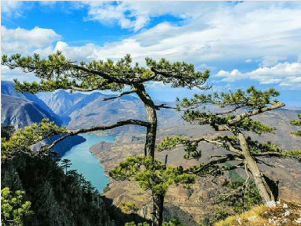
Tara National Park in western Serbia