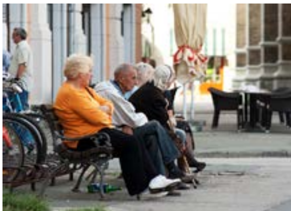
Serbian elders

Serbian society has been influenced by Central Europe (Germans, Hungarians), Eastern Europe (Bulgarians, Romanians, Ukrainians), Southern Europe (Albanians, Greeks); and by smaller groups such as Roma (gypsies), the South Slavic ethnic groups of the Balkans (Croats, Bosniaks, Macedonians, Bunjevaks, etc.), and more. 7