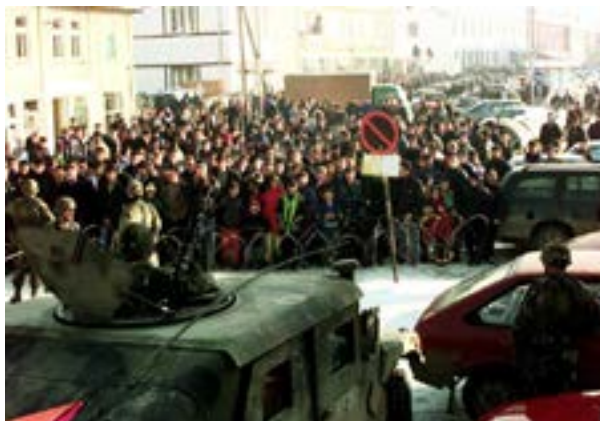
KFOR is the NATO-led, international military force in Kosovo on the peacekeeping mission

dispatch the military to protect Serbs in Kosovo. 100, 101 Later that year, France’s release of Ramush Haradinaj, a former leader of the Kosovo Liberation Army on a Serbian arrest warrant for war crimes committed during the 1998-99 Kosovo War, raised tensions between the two countries. When Haradinaj was elected prime minister of Kosovo in September 2017, Serbian nationalists were enraged. 102, 103, 104 In January 2018, a prominent Kosovo Serb politician was assassinated in the Serbian-controlled part of Mitrovica, threatening to destabilize the region and prompting a Serbian walkout of a meeting with representatives from Kosovo in Brussels. 105