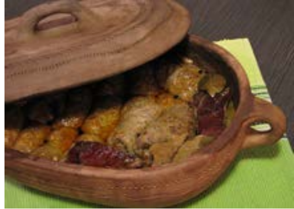
Serbian Sarma, a national specialty, made of chopped meat with cabbage leaves

Popular meat dishes include sarma , grape leaves or fermented cabbage leaves rolled around minced meat and other fillings; ćevapi , grilled rolls of minced pork or beef served with a dairy cream called kajmak and chopped onions on the side; podvarak , roasted pork with sauerkraut and onions; and pljeskavica , spicy grilled pork or beef patties served with onions. 59, 60