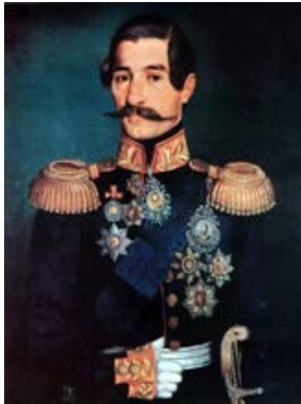
Aleksandar Karađorđević was the Prince of Serbia between 1842-58

In 1842, Alexander Karađorđe, son of Karađorđe Petrović, became prince of Serbia. Alexander surrounded himself with oligarchs and attempted to improve the principality's education, legal system, and economy, but his efforts were undermined by corruption and abuse. His rule faced opposition from discontent peasants as well as from a growing intelligentsia demanding a Western-style of government. Alexander further lost popular support by not supporting Russia in the 1853-56 Crimean War. In 1858, he was forced to abdicate. 66