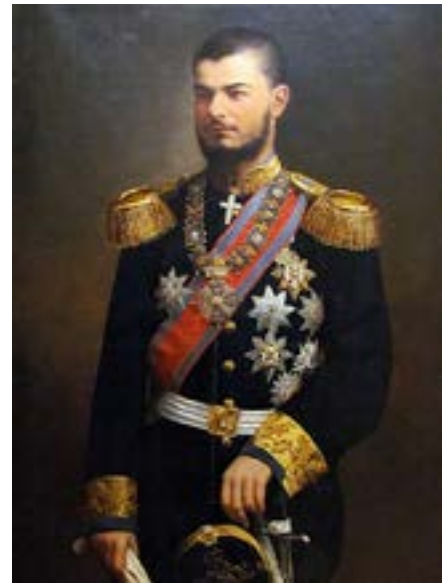
King Alexander I of Serbia 1894

King Milan's only son, Aleksandar Obrenović, assumed the throne in 1893 at the age of 17. His authoritarian reign was unpopular due to scandals, arbitrary rule, his pro-Austrian views, and exclusion of members of the popular pro-Russian Radical Party from his cabinet. Despite strong official disapproval, Aleksandar married his mistress, the widow of a Bohemian engineer. The royal couple was assassinated by army officers in the palace in Belgrade. King Aleksandar was the last of the Obrenović dynasty. 73