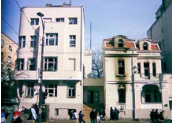
American Embassy after February 21, 2008 in Belgrade