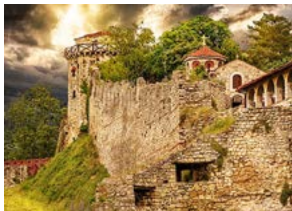
Jakšić's Tower of Belgrade Fortress, Belgrade

Belgrade occupies the area mostly south of the Sava and Danube rivers and is divided into 17 municipalities. Of these 10 municipalities represent the urban core of the city, while the rest are suburbs and rural regions. Stari Grad, which simply means “Old City,” is one of the smallest of these municipalities. It is the city's cultural and historical heart and includes the parkland area around Kalemegdan, the National Museum, and the National Theater. 53, 54 Belgrade Nikola Tesla Airport is the busiest airport in Serbia. The international airport is located in the city of Surčin 18 km (11 m) west of Belgrade. 55