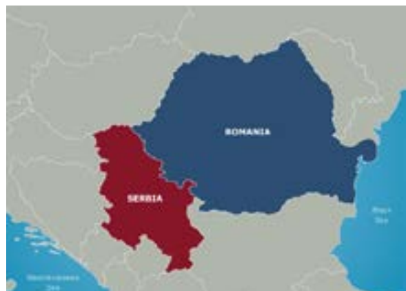
Location map of Serbia and Romania DLIFLC

Relations took a positive turn as the two countries committed to improve relations. 126 In 2017, the president of Montenegro was confident that Montenegro's accession to NATO would not hurt relations with Serbia, and by the end of the year, during an official visit to Serbia, the president of the Montenegrin parliament stated that relations between the two countries had reached their highest point in a decade. 127, 128