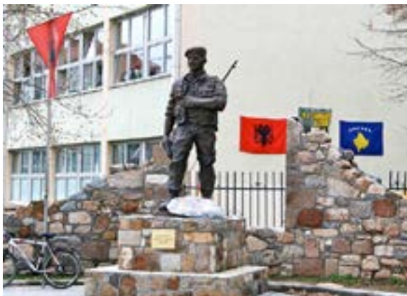
War memorial in square in Mitrovica, Kosovo

Serbia has to reach a legally binding treaty with Kosovo on the normalization of relations, as a condition of joining the European Union. However, formal recognition of Kosovo's independence is not required. Since the tide is turning for Serbia to choose the European Union over Kosovo, Serbia will have to overcome the last legal obstacle to recognition by amending the constitution, which describes Kosovo as part of Serbia. 93, 94