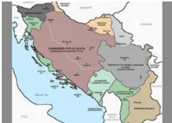
Axis occupation and partition of Yugoslavia during World War II

From 1939 to 1941, Serbia and most of the Balkans were on the periphery of World War II. In the spring of 1941, the Yugoslav government negotiated a pact with Germany and formally aligned itself with the Axis powers, in exchange for Nazi promises to not violate Yugoslav sovereignty. Two days later, a coup against Prince Regent Pavle and the Yugoslavian civilian leadership repudiated the pact. An angered Adolph Hitler ordered an attack against Yugoslavia. Despite resistance by