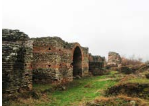
Late Roman site in Justiniana Prima, near Lebane, 6th century

The origins of the Serbs and Croats are still in dispute but it is accepted that they were two distinct tribes with intertwined histories and a similar Slavonic language. The Slavonic-speaking peoples began to migrate to the Balkans in the 6th and 7th century when the region was under the rule of Constantinople. 12, 13