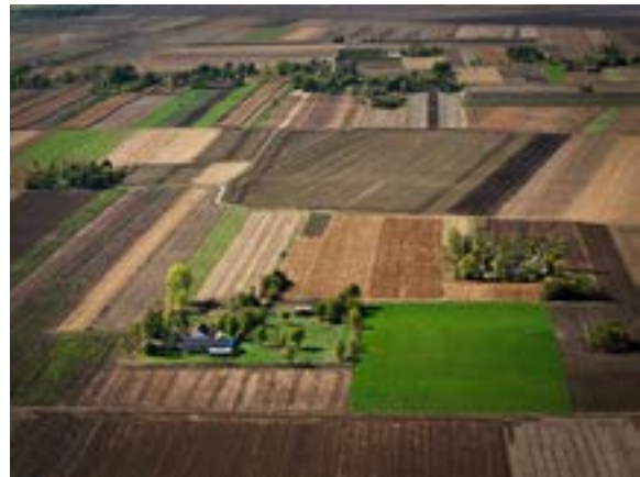
Vojvodina is known as Serbia's breadbasket: Over 40% of Serbia is arable land

Agriculture is at the heart of Serbia's economy, accounting for close to 10% of the country's GDP. 10 Almost 60% of the land is used for agriculture and nearly 85% of this land is located in the northern part of the country, in Vojvodina. Only 10% of Serbia's arable land is owned by the government; about 20% of the workforce is employed in agriculture. Compared to other sectors, the agricultural workforce is unqualified and has low motivation because of low wages. Most private land is owned by farming families who cultivate small plots that cover up to 19 acres. Large agricultural companies and commercial family farming are in the minority. 11, 12 According to the UN Food and Agriculture Organization, Serbia's irrigation systems require modernization. Currently, less than 4% of the country's arable land is irrigated. 13