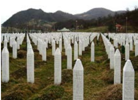
Gravestones at the Potočari genocide memorial near Srebrenica

On 25 May 1993, the UN Security Council established the International Criminal Tribunal for the former Yugoslavia (ICTY). This was the first war crimes court established by the UN and the first international war crimes tribunal since the establishment of the Nuremberg and Tokyo tribunals after WWII. The Tribunal focused on the most serious crimes of the 1990s wars in Bosnia and Herzegovina, Croatia, and Kosovo. 168