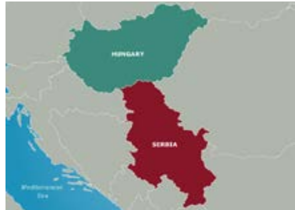
Location map of Serbia and Hungary DLIFLC

Hungary and Serbia share a long history, particularly in Vojvodina, which was once part of the Kingdom of Hungary. 79 As a NATO member, Hungary was the only neighbor that participated in the 1999 NATO air campaign in Serbia during the Kosovo War (Bulgaria and Romania joined NATO in 2004). 80 Hungarian airfields were used during the last weeks of the air campaign, but the government refused to let NATO use Hungary as a staging area for a ground invasion. 81, 82