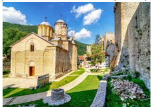
Manasija monastery

Serbia has been called a well-kept secret of European tourism and one of Europe's top tourist destinations. 74 The country is endowed with national parks, nature reserves, and protected landscapes that offer a variety of activities such as hunting, fishing, skiing, and extreme sports. The Đerdap (Djerdap) National Park on the Danube River features diversified plant and animal life, an 8,000 year old archeological site, and fortresses. 75 Another tourist attraction is the Resavska Pećina Cave in eastern Serbia, which is 4.5 km (2.8 m) long and features stalactites, stalagmites, halls, and flowstone waterfalls. 76 Medieval monasteries and churches, some of which are UNESCO World Heritage Sites, museums and galleries, food and music