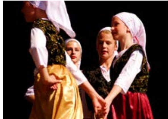
Bosniak girls dancing a traditional Bosniak kolo

Bosniaks (Bosnian Muslims) are the majority ethnic group in parts of the southwestern region, adjacent to Montenegro and Kosovo; Bosniaks constitute 2% of Serbia's population. Bosniaks began to move to the region to escape persecution after parts of Montenegro were taken back from the Ottomans in the 18th century. In the early 1990s, approximately 75,000 Bosniaks left the area as a result of ethnic cleansing. The Bosnian language is the official language of three municipalities and is taught in some public primary schools. 19, 20