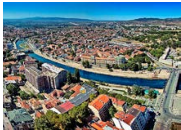
Areal view of Niš

Located on the Nišava River, Niš is the principal city of southeastern Serbia; the city was founded in 279 BCE, making it one of the oldest in the Balkans. 67 It was named by the Celts after the Nišava River, which means the Fairy's River. The city is the birthplace of the Roman Emperor Constantine the Great, who later founded the city of Constantinople (modern-day Istanbul) as the capital of the Eastern Roman Empire. 68, 69