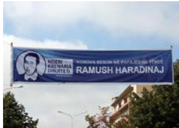
Bann

Despite promises and ongoing negotiations, emotions in the region are still high. In January 2017, a train running between Belgrade and Mitrovica was painted in Serbian colors with “Kosovo is Serb” written on the train cars. Kosovo’s president threatened to oppose any attempt to annex Kosovo’s Serb-majority territory, and Serbia’s prime minister threatened to