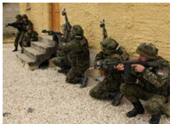
Serbian soldiers securing a building during a Decisive Action Training