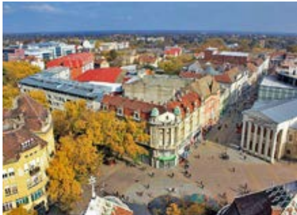
Subotica Town Hall

Subotica lies near the Hungarian border in the northern part of the Autonomous Province of Vojvodina in northern Serbia. It is a major city along the Belgrade-Budapest rail and road corridor and considers itself an international city. 82