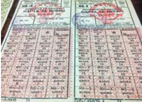
Yugoslav ration stamps for milk, 1950

On 29 November 1945, Yugoslavia was reborn as the Federal People's Republic of Yugoslavia, a federation under the leadership of Tito and the Communist Party of Yugoslavia. It included Serbia, Croatia, Bosnia-Herzegovina, Montenegro, Slovenia and Macedonia. In 1963, the federation was renamed the Socialist Federal Republic of Yugoslavia (SFRY) and Tito was proclaimed president for life. The SFRY constitution gave Bosnia and Herzegovina, Macedonia, and Montenegro separate and equal republican status, with Kosovo and Vojvodina as autonomous provinces. 102, 103