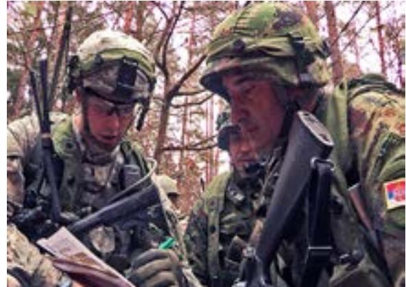
U.S. Army, U.S. Air Force and Serbian Army forces participate in a training exercise

Serbia-U.S. military relations are improving. In 2006, the Serbian military began a partnership with the Ohio National Guard, which included several joint training programs in both countries. 22, 23 In September 2017, members of the Ohio National Guard and the Serbian Armed Forces conducted the second annual Cyber Tesla exercise, a joint cyber security exercise, in Ohio and Serbia. 24 In November 2017, Serbian and members of the 173rd Airborne Brigade trained together in a military exercise that was designed to strengthen ties between Serbia and NATO. 25, 26