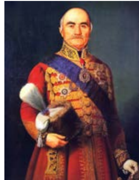
Miloš Obrenović, Prince of Serbia 1780-1860

At the time, a Serbian scholar, Vuk Stefanović Karadžić, revised the Cyrillic alphabet for Serbian use, compiled a grammar book, and created a Serbian dictionary. Neither the church nor the state supported his work. However, he helped Serbian culture make significant progress, which eventually served to solidify a national consciousness. 61