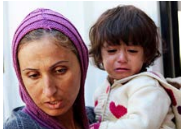
A minority woman and her baby

and special measures that prevent and eliminate discrimination based on sex and gender, provide a definition of the principle of equality, and prohibit discrimination on various grounds. Since then, Serbia has adopted policies and action plans and ratified international and national conventions intended to prevent discrimination and violence against women and improve the status of women. 76 In 2017, President Vučić appointed Ana Brnabić, a gay woman, to be the prime minister of Serbia. 77