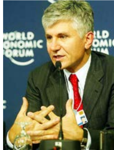
Zoran Djindjić, Prime Minister from 2001 to 2003

NATO intervened, again, heavily bombing civilian and infrastructure targets in Serbia and Montenegro proper. 132, 133 The Kosovo War ended on 10 June 1999 when NATO and Serbian commanders reached an agreement to cease hostilities. 134, 135 A month before the signing of the agreement, the UN War Crimes Tribunal in The Hague indicted President Milošević for crimes against Kosovo’s ethnic Albanians, which included forced expulsions and killings of civilians. 136, 137 At that time, thousands of Kosovo Albanians were living as refugees in Albania, Macedonia, or Montenegro. 138 More than 200,000 Kosovo Serbs and other non-Serbs fled from Kosovo to central Serbia. Although Montenegro was a partner with Serbia in what remained of Yugoslavia, Montenegrin leaders distanced themselves from Serbia’s actions in Kosovo. 139, 140