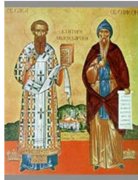
Serbian Orthodox icon of St. Sava and his father St. Simeon

The first Serbian state was founded in 1168, in Raška by Stefan I Nemanja, the founder of the Nemanjić dynasty, which ruled for 200 years. Stefan I held much of the Balkans until 1185. His son, Stefan II Nemanja, strengthened Serbia by maintaining friendly relations with Rome and religious loyalty to Constantinople. In 1217, Pope Honorius III recognized Serbia's political independence and gave Stefan II the title of "King of Serbia, Dalmatia, and Bosnia." His brother, Rastko, was canonized in 1219 as St. Sava and became the first archbishop of Serbia. 20, 21 During the 13th century, the Nemanjić Dynasty grew in strength, moving its frontier southward. In 1282, Skopje, in present-day Macedonia, became the new Serbian capital. 22