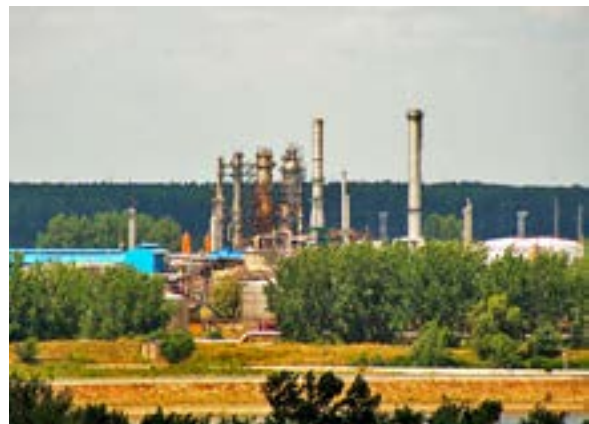
Petroleum refinery

Industry accounts for 40% of Serbia's GDP. The main industrial sectors include automobiles and tires, base metals, furniture, food processing, machinery, textiles, pharmaceuticals and chemicals. 26 At the beginning of 2018, Serbia saw the steepest increase in industrial production