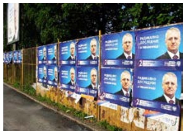
Vojislav Šešelj, president of the Serbian Radical Party

According to the Chairman of the Information Association of Serbia, Serbia does not have Computer Emergency Response Team that can provide rapid response to cyber security threats and attacks. 174 Internet-based crime is rising and few cybercrimes are prosecuted, mainly because of the difficulty of tracking hackers. 175