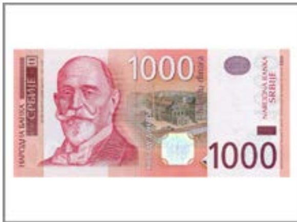
1000 Serbian dinar banknote

Since the disintegration of Yugoslavia in 2003, the Serbian dinar (RSD) has been Serbia's currency, replacing the Yugoslav dinar. 79 In March 2018, the dinar was trading at RSD 96 per USD 1 and RSD 118 per EUR 1. 80, 81 Inflation dropped from 7.7% in 2013 to 1.9% in early 2018. 82, 83