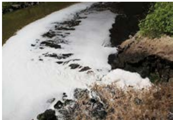
Untreated sewage and mine waste-water pollution near Vreoci

Serbia has the second highest rate of premature deaths due to air pollution in Europe. 92 Among the biggest contributors to environmental degradation and air pollution are coal mining and coal-burning power plants. 93 According to a group campaigning to end coal burning in Europe, the levels of air pollutants in the Western Balkans are two-and-a-half times above the safety limits for air quality recommended by the World Health Organization. 94