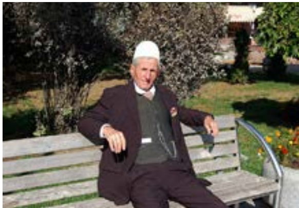
Albanian man with his fez

Albanians dominate several municipalities in southern Serbia, in the regions that border eastern Kosovo, and constitute less than 1% of the total population. Albanians migrated to today's southern Serbia after the Ottoman conquests. The Albanian language is the official language of three municipalities. The majority of Albanians are Muslim. 16 Albanians suffer from hidden discrimination and a high level of intolerance. 17