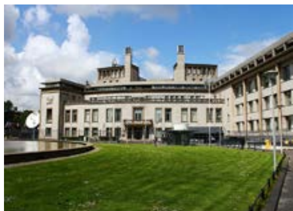
The International Criminal Tribunal for the Former Yugoslavia building in the Hague

In 1999, while the conflict in Kosovo was still ongoing, the ICTY issued arrest warrants and indictments for President Slobodan Milošević and other high-ranking Serbian officials for crimes committed against Kosovo Albanian civilians. It was the first time that an international criminal court indicted a sitting head of state. 175