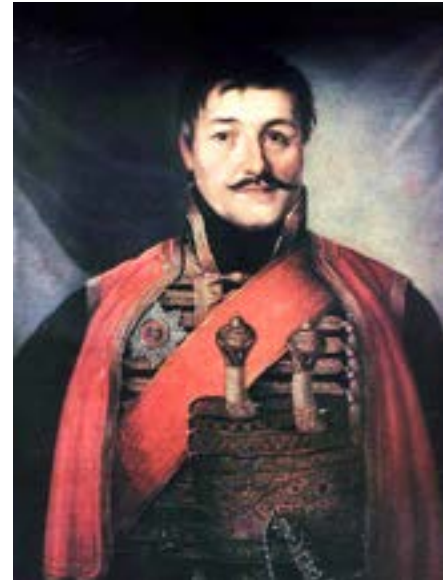
Portrait of Đorđe (Karađorđe) Petrović

Following the Janissary chiefs’ ( dahis ) reign of terror and the assassination of the Turkish governor of Belgrade, rebel leaders organized villagers and hajduci into armed units and met to decide on a course of action. Karađorđe Petrović (Black George), who was a village leader ( knez ) with military experience from fighting in the Austro-Turkish war, was elected leader of the Serb national liberation movement. He would later become the founder of the Karađorđević dynasty. 53