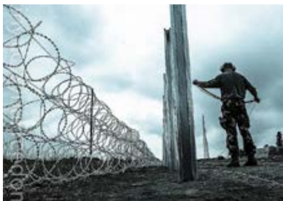
Hungarian Defence Force installing barbed wire on the Hungarian-Serbian border

Hungary's recognition of Kosovo's independence in 2008, triggered a recall of the Serbian ambassador to Hungary. The two countries resumed friendly relations after the ambassador returned to Budapest a few months later. 83, 84