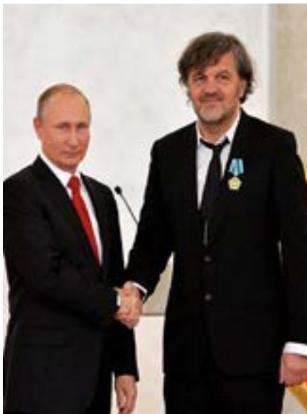
Vladimir Putin awarded the Order of Friendship to Serbian film director Emir Kusturica

soundtrack for the nationalistic sentiments of the Milošević era. Turbo-folk's popularity ebbed after Milošević's fall in 2000. Although many Serbs continue to view turbo-folk with contempt, others view it as a unique music of the region. 90, 91