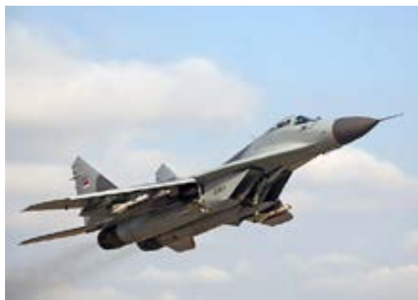
Serbian MiG-29 with pair of R-60 (AA-8 Aphid) missiles

Serbia and Romania enjoy very strong relations that are going to improve further, according to the president of Romania and the two countries' foreign ministers. 129,