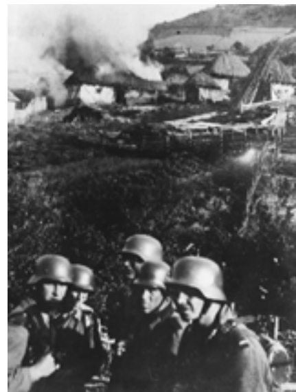
Germans set fire to a Serbian village near Kosovska Mitrovica

A communist-led partisan group headed by Josip Broz Tito and remnants of the Royal Yugoslav Army doggedly fought Axis occupiers and Croatian collaborators. 99 The German response to the resistance was to kill the civilian Serbs of Bosnia and Croatia. In 1944, Yugoslavia was liberated by the allied forces. 100,