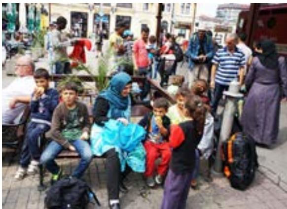
Refugees in Serbia

hardline of these groups is the Serbian Radical Party (SRS), whose platform in the past has promoted the use of force to stop Kosovo from seceding from Serbia. The leader of the SRS, Vojislav Šešelj, spent nearly a decade in custody in The Hague before the International Criminal Tribunal for the former Yugoslavia (ICTY). In 2016, he was acquitted of war crimes, and a month later he was elected to the parliament. A UN appeals court in The Hague convicted him of crimes against humanity in April 2018 and sentenced him to 10 years in prison. 176, 177 Members of parliament who wanted him to be expelled were threatened by his supporters. 178 In a 2018 poll that asked Serbs what the government should do about Kosovo, 10% of respondents favored military intervention. 179