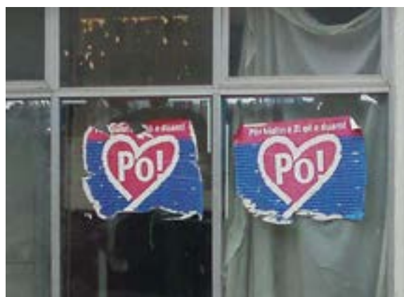
Albanian language poster for Montenegro referendum

In May 2006, Montenegrins narrowly approved a referendum to separate from Serbia, and in June, Montenegro declared independence. Serbia quickly recognized independent Montenegro and declared itself an independent sovereign state. Kosovo was declared an integral part of Serbia in the constitution. 153, 154 In December, NATO admitted Serbia to the Partnership for Peace program and the Euro-Atlantic Partnership Council. 155, 156