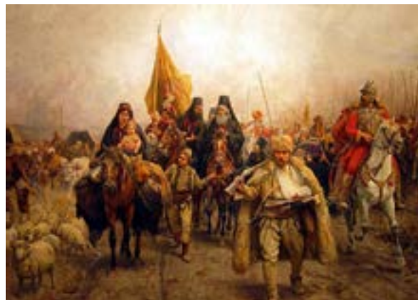
Migration of the Serbs to the north in 1690 by Serbian painter Paja Jovanović Wikimedia Commons

Although some Serb peasants organized into small armed groups ( hajduk/hajduci ) that resisted, the majority remained subjects of the Ottoman sultans for the next 300 years. 40