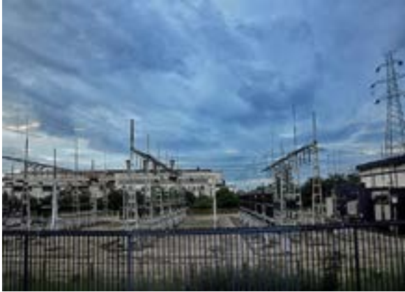
U.S. Steel Serbia

Serbia's copper ore and precious metal (gold and silver) mines are located in the region around Bor in the Carpathian Mountains. Rudarsko-Topioničarski Basen Bor (RTB Bor Group) has been operating the mines and the smelting operations for more than 100 years. Copper products remain an important contributor to Serbia's trade balance and copper extraction in the Bor and Majdanpek mines is expected to continue for the next 50 years. 51