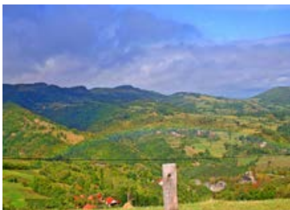
The Serbian - Bosnian border

Since the Dayton Accords of 1995, Serbia's relations with Bosnia and Herzegovina have been relatively stable, but emotions are still raw. In 2015, Serbia's Prime Minister, Aleksandar Vučić, was chased away by angry stone-throwing Bosnians when he attended a memorial service marking the 20th anniversary of the Srebrenica massacre. 36, 37