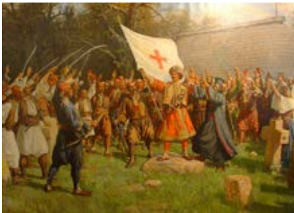
The Uprising at Takovo (1889), by Paja Jovanović

With the support of Russia, Karađorđe commandeered the first phase of the uprising (1804–1806), which ended when the Serbs captured Belgrade and negotiated a settlement with the sultan. The second phase lasted two years (1806–1808), as the Serbs renewed the fight against the abuses of the Janissaries. In 1808, the state council introduced a constitution and elected Karađorđe as a hereditary leader. The third phase started in 1809 when another war broke out between Russia and the Ottomans. After the Turks reached a settlement with Russia, they were free to attack the Serb rebels. In 1813, the Turks took Belgrade; Karađorđe and his men were forced to retreat across the Danube into Hungary. Later on, the Turks offered amnesty to Serb rebels and reappointed the returning leaders to their old posts. 54, 55