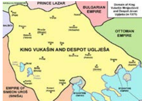
The Battle of Maritsa: Domain of King Vukašin Mrnjavčević and Despot Jovan Uglješa in 1371

After Dušan's death in 1355, the Serbian state began to disintegrate. While the South Slavs fought among themselves, the Ottoman Turks began marching toward the Balkan Peninsula. In 1371, in response to the Ottoman threat, the king of the southern Serbian lands, Vukašin Mrnjavčević, and his brother, John Uglješa of Serres, led their army to fight the Ottoman Sultan, Murad I, in modern-day Bulgaria. During the Battle of Maritsa River (also called the Battle of Marica), the Serbian army was decimated and both brothers were killed. For the next few decades the Ottomans continued to solidify their rule over the Balkans. 27, 28