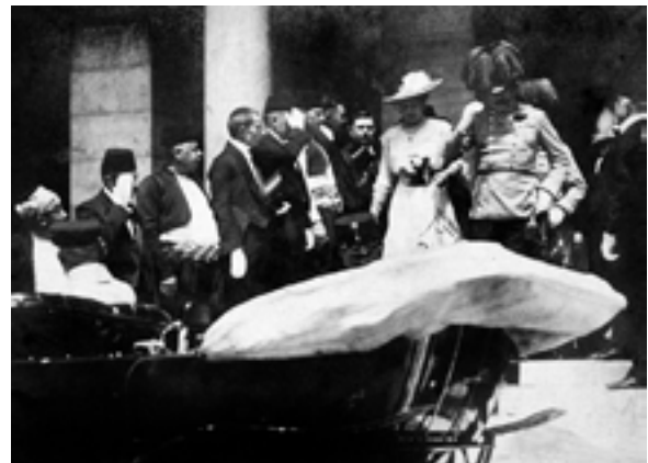
Archduke and his wife just prior to the assassination

For most Serbs, the Habsburgs (Austria-Hungary) were seen as an obstacle to a new Serbian kingdom. When the heir to the Austrian throne, Archduke Franz Ferdinand, made a state visit to Sarajevo on 28 June, 1914 (the day Serbs commemorated the battle of Kosovo), Gavrilo Princip, a young Bosnian Serb, assassinated Franz Ferdinand and his wife. This event turned out to be the spark that ignited World War I. 82