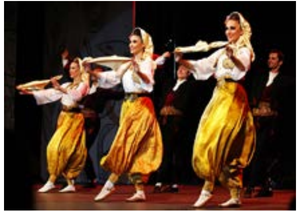
Folk dancers

Orthodox Church competed for influence against the Greek Orthodox Church which was based in Istanbul. In the northern province of Vojvodina, Hungarians followed the Roman Catholic Church while some belonged to Calvinist Protestant groups. Today, Serbian national identity is Eastern Orthodox. 3