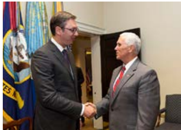
President Vučić with Vice President Pence

After the U.S. recognition of Kosovo in February 2008, relations between the countries soured and Serbia recalled its ambassador to Washington. 11, 12 The U.S. embassy was overrun by protestors and parts of it were torched. 13 In October 2008, Serbia's ambassador returned to Washington. 14