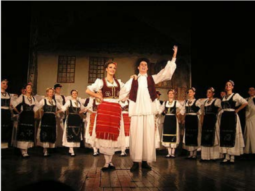
Serbian folk dancers