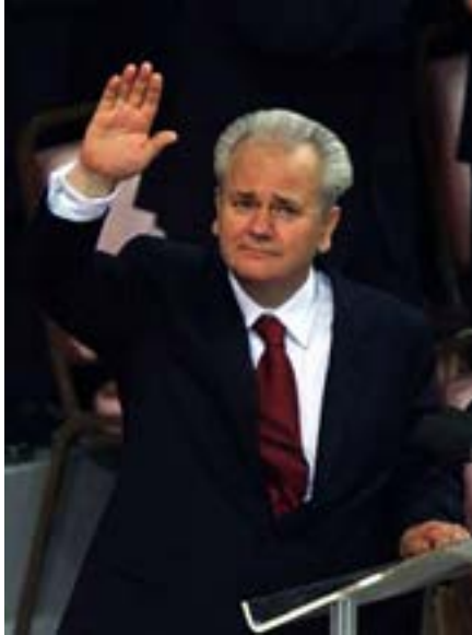
Slobodan Milošević

After Tito's death in 1980, Yugoslavia's federation continued for another decade. During those years, inflation grew, the economy deteriorated, and political and ethnic conflicts intensified. Kosovo Albanians demonstrated in favor of a republic and integration into Albania; Slovenia and Croatia demanded greater political autonomy. 107, 108