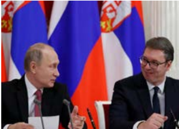
President Vučić seeks Putin's advice on tensions with Kosovo Voice of America

dispute with Croatia, and show progress in the development of the status of the Community of Serb Municipalities in Kosovo. The timeframe for accession is 2025. 186, 187