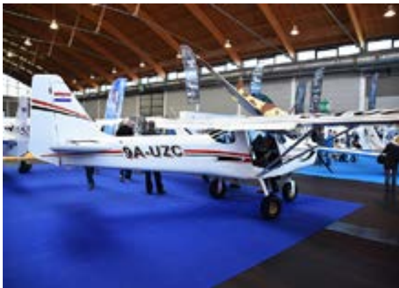
Aero-East Europe Sila manufactured in Serbia

companies that operate in Serbia. Some of the foreign companies that invest in Serbia are PepsiCo, Coors, Coca-Cola, Nestlé, Heineken, and Carlsberg. 34, 35