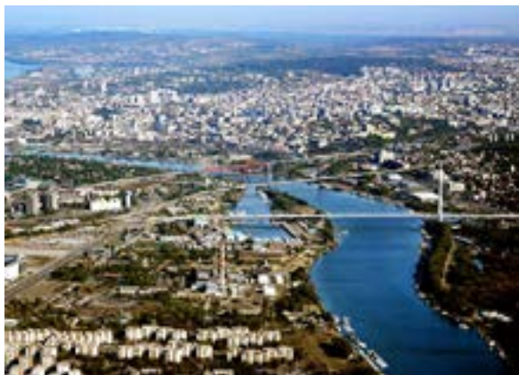
Panoramic view of Belgrade

Kalemegdan, by combining the words kale, which means city, and megaden, which means field. The fortress is situated atop the hill at the confluence of the Danube and Sava rivers and remains the city's most famous landmark. 50, 51