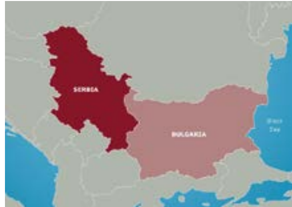
Location map of Serbia and Bulgaria DLIFLC

Despite a long history of bloody conflicts going back to the 10th century, Bulgaria and Serbia share friendly relations and the Cyrillic alphabet. The two countries have focused on improving their economic relations, with a special emphasis on the defense industry and the economic situation of their border communities. 50 Cooperation on road infrastructure focuses on the upgrade of the Niš-Sofia highway and the construction of Corridor X—the trans-European highway—which will improve the connection of Belgrade to Sofia and Istanbul. 51, 52 The two countries also cooperate in the fields of energy, communication, education, and culture. 53, 54