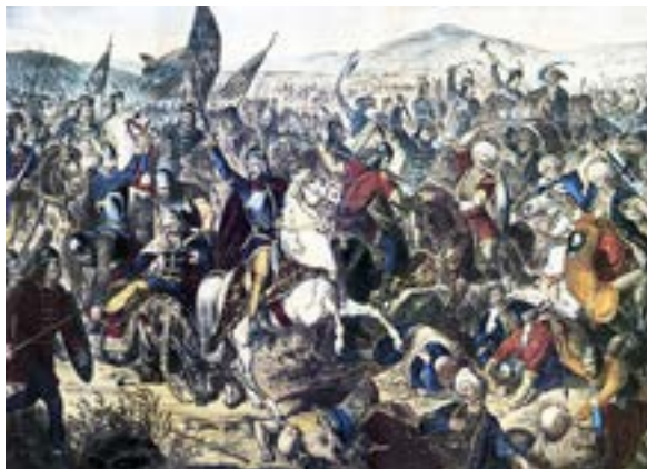
The Battle of Kosovo and the Collapse of Serbia

On 28 June 1389, Prince Lazar Hrebeljanović, the strongest regional lord in Serbia, led an army of Serbs, Bosnians, Albanians, and Hungarians to meet the forces of Sultan Murad I at Kosovo Polje (Kosovo Plains). After Murad I was killed by a Serbian noble, Murad's son surrounded the Serbian army; Prince Lazar was killed, and the Serbs suffered a bitter defeat. 29, 30 The Battle of Kosovo was immortalized in legends and heroic ballads, and became a part of Serbia's national mythology. The battle is commemorated as a national holiday every year on 28 June. 31