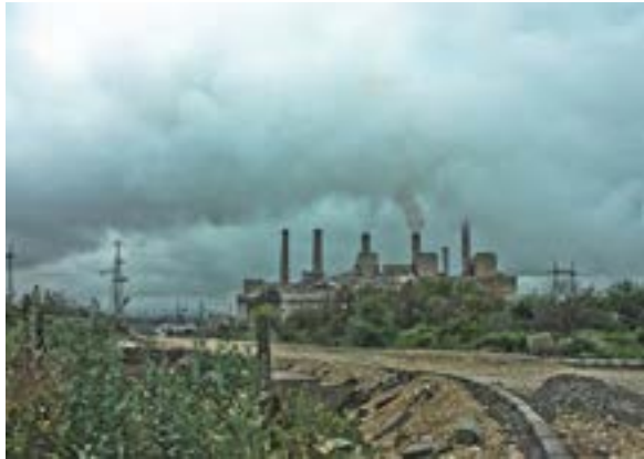
Air pollution, Kosovska Mitrovica

Serbia's host of environmental concerns involving soil, air, and river pollution attest to years of poorly regulated industries and waste management as well as the damage inflicted on the country during the war in 1999. For example, NATO's bombing of the oil refinery in Novi Sad contaminated the Danube River and its sediment as well as the surrounding soil and groundwater. Other bombings that targeted chemical plants and warehouses of chemical raw materials and the burning of oil tanks had a devastating effect on the environment and on