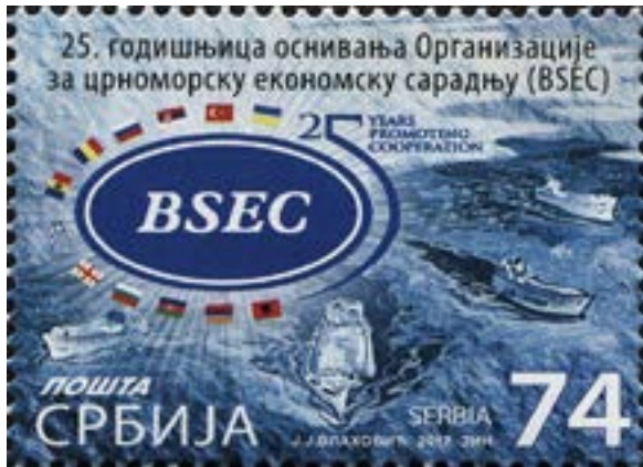
Organization of the Black Sea Economic Cooperation, 2017 post stamp of Serbia

Serbia's economic reform efforts have been paying off. 3 In 2017, GDP annual growth rate was 2.5%, amounting to USD 37.16 billion. Growth has been especially strong in the manufacturing-driven industrial sector. Serbia's economy depends on manufacturing and exports, and is supported by foreign direct investment (FDI). In 2016, Serbia was the world's number one destination for FDI as a percentage of GDP. 4, 5, 6 In February 2018, Serbia successfully completed a USD 1.32 billion three-year program with the International Monetary Fund (IMF). 7, 8, 9