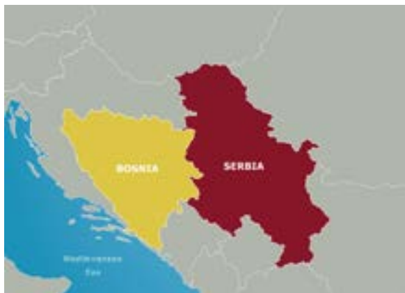
Location map of Serbia, and Bosnia and Herzegovina DLIFLC

In March 1992, more than 60% of the population of Bosnia voted for independence. Bosnian Serbs, who accounted for about one third of the population, boycotted the referendum. Shortly after the vote, with support of the Yugoslav People's Army and Serbia, Bosnian Serbs declared the territories under their control to be a Serb republic within Bosnia and Herzegovina. Bosnian Croats followed by declaring their own republic with the support of Croatia. A bloody war broke out between Bosnian