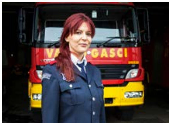
A female firefighter

Opank , in plural opanaci , are traditional leather shoes with curled, upturned toes fastened to the feet by ankle straps. These shoes are usually worn in rural Serbia. 74 The šajkača , the Serbian national cap, is made of wool and can be worn in winter or summer. The hat became a symbol of the Serbian Army in World War I and of the