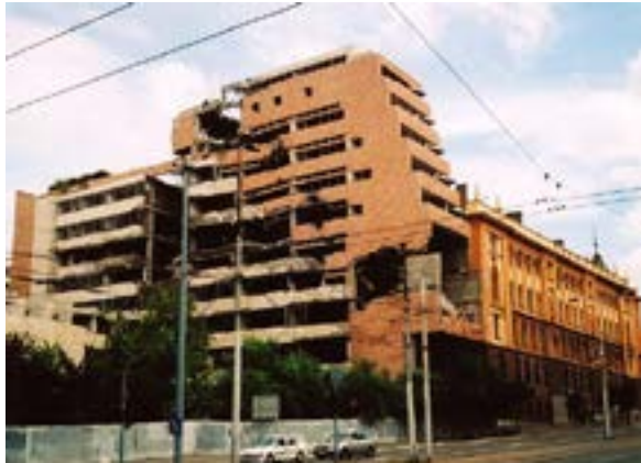
Ministry of Defence building damaged during NATO bombing

a state that Serbia does not recognize, and resolve its border dispute with Croatia among other issues. 2, 3