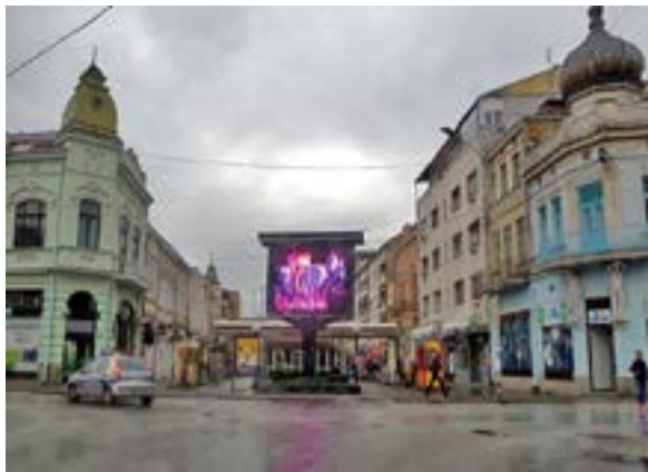
Central Kragujevac

Kragujevac, Serbia's fourth largest city is the center of the Šumadija region, which is located in central Serbia. The city was built on the banks of Lepenica River, a tributary of the Morava. Kragujevac became Serbia's political, cultural, academic, health, military, and economic center after it was declared the capital of Serbia in 1818, following the second uprising against the Ottoman Empire. During this era, Serbia's first newspaper was founded in Kragujevac. With the relocation of the capital to Belgrade