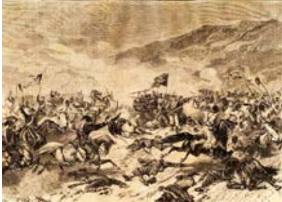
The Morava Battles August 1876

the Ottoman Empire and fought the Turks along with the Serbs and Montenegrins. The Russo-Turkish War ended with the Treaty of San Stefano in 1878, which was replaced four months later by the Treaty of Berlin. Serbia and Montenegro received independence from the Ottoman Empire and Serbia made some territorial gains in the southeast. 70, 71, 72