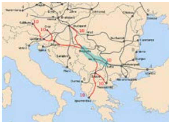
Map of Corridor X between Belgrade and Sofia

them. 55, 56, 57 Bulgaria, already an EU member, has pledged to support Serbia's accession to the EU. 58, 59