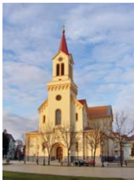
Zrenjanin Cathedral of the Saint John of Nepomuk

The Islamic community is divided between the Islamic Community of Serbia, with its seat in Belgrade, and the Islamic Community in Serbia, which is centered in Novi Paza. The Islamic authority in Belgrade appoints teachers of Islam in public schools. 47