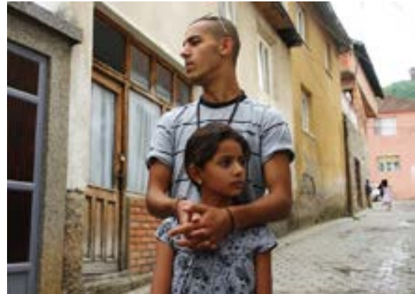
Roma gypsies in Serbia

The Roma people, also called Romani, and sometimes gypsies—which is considered a racial slur by most of the Roma population—are believed to have originated in the Punjab and Rajasthan regions of the Indian subcontinent. The three groups of Roma in Serbia are distinguished by their languages: Erli, Gurbet, and Kalderash. There is a general consensus that the Roma population in Serbia is underrepresented in official statistics, and they may represent as much as 10% of the total population. Roma are not the majority population in any municipality, but a significant number reside in several municipalities in southern Serbia. Because Roma usually adopt the religion of their host country, the Roma in Serbia are Roman Catholics, Eastern Orthodox, and Muslim. They also preserve some aspects of their indigenous religion. Most Roma live in extreme poverty and the illiteracy rate is as high as 80%. 30, 31 The Roma population faces discrimination and harassment, and they