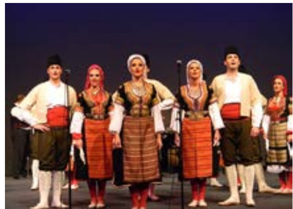
Serbian folk dancers in traditional costumes

Serbs dress similarly to other Europeans. Traditional folk dress is mostly restricted to cultural festivals. In the past, traditional clothing revealed ethnic identity and differentiated between rural and urban populations. Several items of traditional Serbian dress continue to be marketed. 73