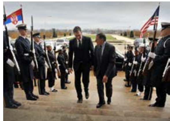
President Vučić and U.S. Secretary of Defense Leon Panetta in Washington, D.C

Despite disagreements with Serbia over Kosovo and Serbia's relations with Moscow, the United States continues to support Serbia's efforts to join the European Union and withstand pressure from Russia. Since 2001, the United States has awarded close to USD 800 million in aid to Serbia to help stimulate economic growth, strengthen the justice system and democratic institutions, and promote good governance. U.S. aid also aims to strengthen Serbia's exports