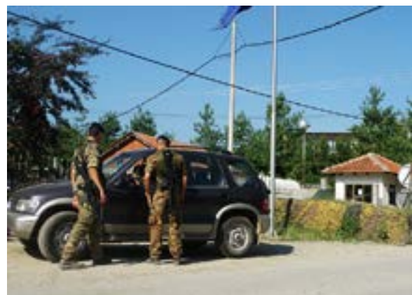
Italian patrol at entrance to Rugova Gorge

Serbia's accession to the European Union is conditioned on significant economic reforms, progress in freedom of expression and the media, the rule of law, the fight against corruption and organized crime, and the normalization of relations with Kosovo. Serbia will have to adopt stalled laws on anti-corruption, resolve its border