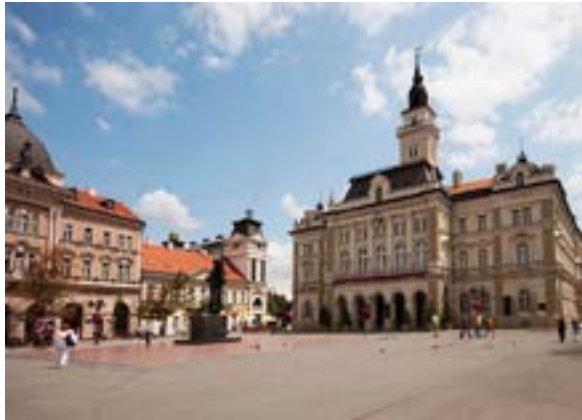
Novi Sad City Centre

river cruises in its harbor. The city is also one of Serbia's industrial centers. 60, 61