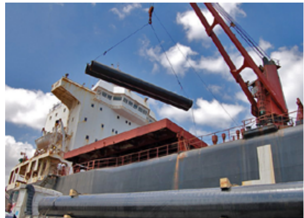
Pipe unloading for Arabic Gas Pipeline Project, Tartus

In 2015, Syria produced an estimated 111,600 barrels of refined petroleum products per day, yet consumed approximately 134,000 barrels per day in 2016. As of 2017, it produced approximately 3.74 billion cubic m (132 billion cubic ft) of natural gas per day and consumed approximately the same amount. As of 2018, Syria's crude oil reserves were numbered at 2.5 billion barrels and its natural gas reserves estimated to be 240.7 billion cubic m (789.7 billion cubic ft). Those amounts are significantly smaller than the reserves of its neighbor Iraq and its ally Iran. 51 Most of the country's power stations use natural gas and most known oil reserves are located in the east, near its border with Iraq. 52, 53, 54