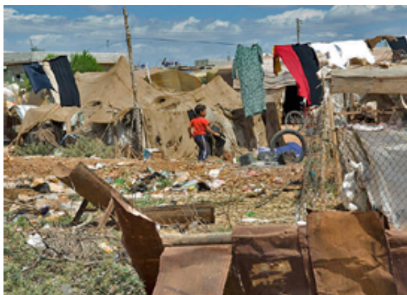
Poverty in Syria

According to the United Nations, Syria's human development index declined noticeably after the start of the civil war, going from 0.631 in 2013 to 0.572 the following year. In 2017, Syria's score was 0.536, with a ranking of 155 out of 189 countries. 108 Life expectancy at birth is 75.2 years, with 72.8 years for males and 77.2 for females. The infant mortality rate is 14.4 deaths per 1,000 births, with 16.6 deaths for males and 12.2 for females. The maternal mortality rate is 68 deaths per 100,000 births. 109