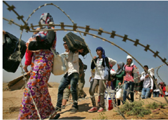
Displaced Syrians

a religious minority. Antigovernment factions such as the Syrian Democratic Forces (SDF) and Kurdish militias have been suspected of engaging in population displacement. The Syrian government has displaced Sunni communities in efforts to shift demographics. The Syrian government and other armed factions have also used checkpoints to control the movements of the population. The government has obstructed Syrians from obtaining passports, instituted exit visas, and closed border crossings. 88, 89