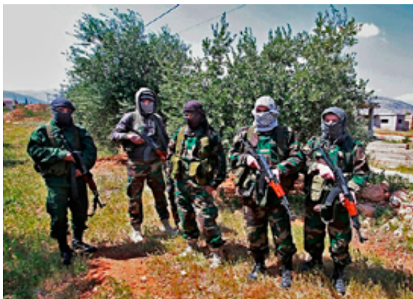
Hezbollah fighters

Hezbollah has been on the U.S. Department of State’s list of terrorist organizations since the list was created in 1997. 107 Although Hezbollah was officially founded in Lebanon in 1985, its members are suspected of carrying out the attacks on the Marine Corps barracks and the U.S. Embassy in Lebanon in 1983. The Syrian government has been a patron of the group, and the group has sent its fighters to assist the Syrian government during the civil war. Hezbollah is a Shia organization