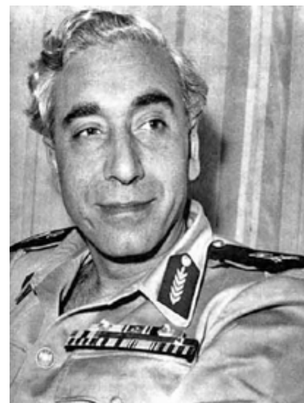
Amin al-Hafiz, the Ba'athist military leader was overthrown in a coup in 1966

Over the next few years, two factions within the Ba'ath party—one that promoted Arab nationalism and a slow approach to socialism, and another that was more concerned about advancing socialist reforms than re-establishing Arab unity—battled for supremacy. The former group became known as the pan-Arab Nationalists while the latter was referred to as the Regionalists. In 1966, Amin al-Hafiz, the Ba'athist military leader and the most powerful figure among the Nationalists, was overthrown in a bloody coup. Salah al-Jadid, the military leader of the Regionalists, became the Ba'ath Party leader. Hafez al-Assad, Hafiz's fellow Alawite military colleague, took over as Minister of Defense. 74