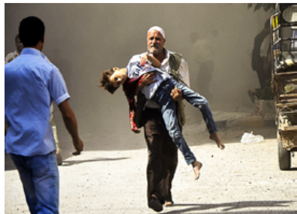
An elder man trying to save a child who was hit by an Assad death barrels

The Syrian government lacks the will and ability to investigate suspected human rights abuses or punish those responsible. The government targets human rights workers and organizations through harassment, arrest, and execution. The government has been accused of killing and torturing thousands of prisoners at its Saydnaya Prison. Mass extrajudicial executions, mass graves, and a possible crematorium conceal the prison’s death toll. The Syrian government has been responsible for administering exceptionally cruel torture to its detainees at facilities across the country. 84, 85, 86