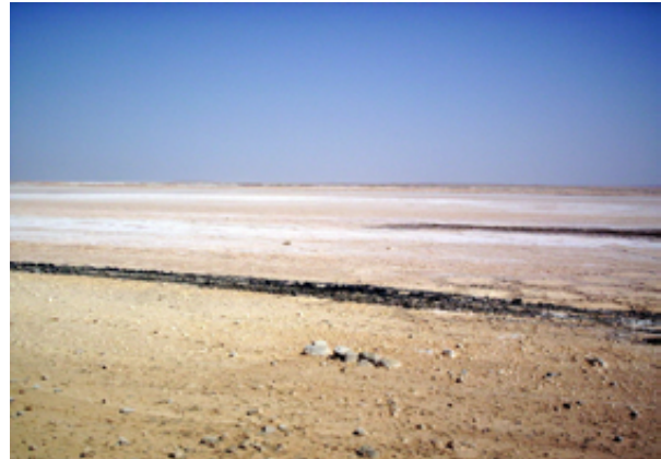
Lake al-Jabbul going dry in August leaving salt crystals

The largest natural lake in Syria is Lake al-Jabbul, a seasonal saline lake located to the southeast of Aleppo. Other saline lakes are located outside the cities of Damascus and Al Hasakah. A small freshwater lake, Lake Muzayrib, lies to the northwest of Daraa. 55