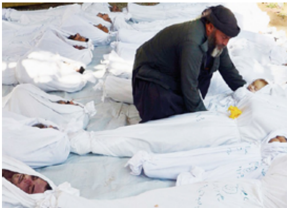
Victims of chemical weapon used by the Syrian government

war. 101 As of April 2018, the United Nations has attributed four chemical weapons attacks to the Syrian government and one to ISIS. According to the U.S. government, Syria has used chemical weapons over 50 times. The Syrian government has used Sarin and chlorine gas while ISIS has used mustard gas. 102, 103