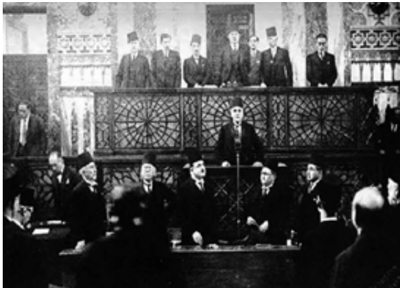
The inauguration of President Hashim al-Atassi in 1936

The French mandate over Syria, under the auspices of the League of Nations, asserted that the French government would help Syria prepare for eventual self-governance. However, in the view of most Muslim Syrians, the French continuously failed to expedite this process. In 1925, a Syrian nationalist revolt, initiated by Druze rebels in southern Syria, erupted and continued to simmer for two years. 50