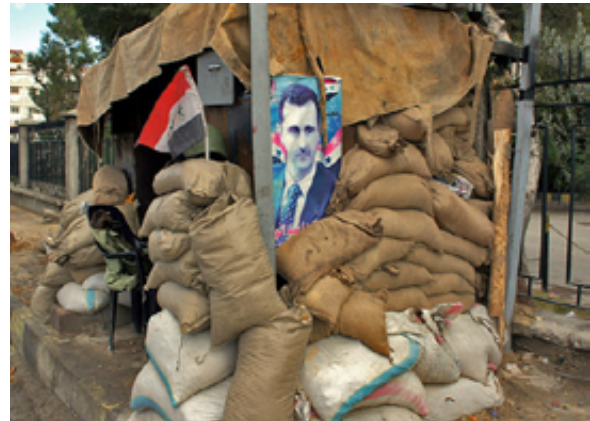
A poster of Bashar al-Assad at a checkpoint in Damascus

Syrian citizens have no role in choosing their form of government or government officials. The Syrian government is unaccountable for its actions, unable to govern or provide basic services to most of the country, and unable to protect its citizens. The government's attacks on civilian infrastructure show a disregard for the lives of its citizens. Foreign entities have significant influence over the government and population. Government-controlled territory is administered by self-serving local militias under weak supervision. Syria will likely emerge from its civil war with Bashar al-Assad remaining in power. Assad will govern over an economically devastated Syria, and will likely spend years consolidating power through the same oppressive tactics that the Assad family has used to maintain control since the 1970s. In the long term, the Syrian government will be subjected to the will of the actors who kept Assad in power; Russia, Hezbollah, and Iran will demand a return on their financial and military contributions to Assad's government. The international community will have little motivation to help the Syrian government with rebuilding and infrastructure projects as a result of Assad remaining in power. 125, 126, 127