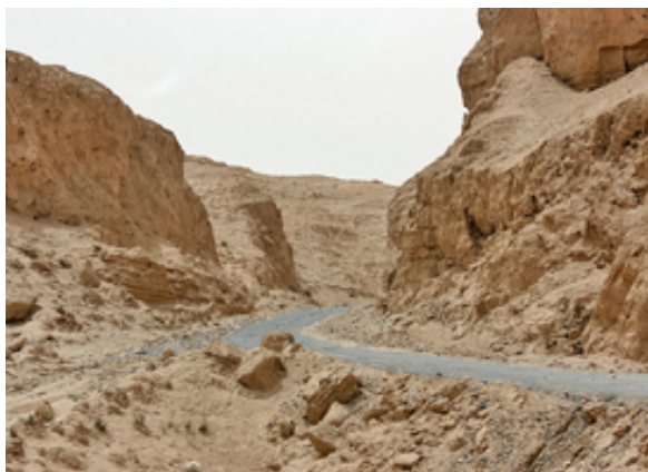
Phosphate rock mines near Palmyra

Before 2011, Syria was one of the world's leading producers of phosphate rock, used primarily in making fertilizer. 58 Most of Syria's phosphate rock comes from desert mines located southwest of Palmyra. Syrian phosphate is attractive to European importers because it contains very little cadmium, a toxic metal. Other mining and mineral processing operations within Syria include cement, gypsum, marble, and silica. Steel was