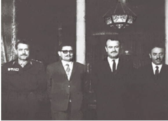
Hafez al-Assad with Sunni members of the political elite

a diplomatic, peacekeeping role, but this soon evolved to active military support for the Christian right against the Palestinian and Muslim left. By 1978, Syria had switched sides and was supporting the Palestine Liberation Organization (PLO) and the Muslim militias. As the civil war began to subside in the late 1980s, Syria controlled a large part of Lebanon. Syria pledged in the 1989 Ta'if Accord to withdraw its forces to the eastern Bekaa Valley of Lebanon by the end of 1992. Ultimately, this pledge was not fulfilled—Syrian soldiers remained in Lebanon for another 16 years. 86, 87, 88