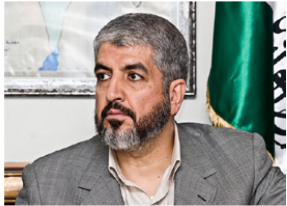
Hamas leader, Khaled Meshaal

stance toward Syria caused a rift with another one of its longtime patrons: Iran, which provided Hamas with an estimated USD 50 million a month in 2012. Hamas and Iran resumed normal relations in 2017. 112, 113, 114 The U.S. Department of State has listed Iran as a state sponsor of terrorism since 1984, and the department has listed Hamas as a terrorist organization since 1997. 115, 116 Hamas and Hezbollah are split over competing allegiances in the Syrian Civil War, yet maintain good relations with each other. 117