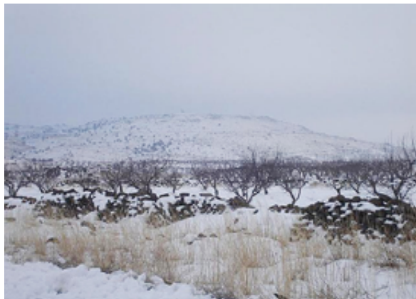
Tell Qeni (1803 m) is the highest point of Jabal al-Druze

The Jabal al-Nusiriyya mountain range rises from Syria's coastal plain to form a rugged boundary parallel to the coast. The peaks of the Jabal al-Nusiriyya average 1,212 m (3,976 ft), with a high point of 1,524 m (5,000 ft) marking the northern end of the range. 20 The range's western slope, indented with deep ravines, receives significant moisture from the Mediterranean Sea. Numerous historical castles and fortresses built by either Arabs or Crusaders are located in the mountains