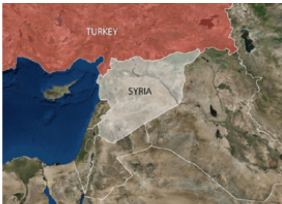
Map of Syria and Turkey DLIFLC

Historically, diplomatic relations between Turkey and Syria have been poor. Syrians considered the Turkish-run Ottoman Empire as an adversary and participated in the Arab rebellion during World War I. In 1939 Turkey annexed Hatay Province, located in northwest Syria, which was a part of the French Mandate for Syria. The Syrian government still considers the province Syrian territory, and periodically brings up the unresolved dispute. Turkey has constructed dams upriver from Syria,