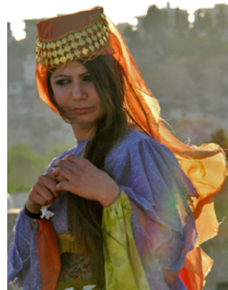
A Syrian woman wearing shambar decorated with embroidery, glass beads and fringes

The traditional garment of women in Syria is the thob , a single-color cotton robe or dress with triangular sleeves. The robe can be decorated with colorful embroidery around the neckline, the chest and on the sides. Wealthy women wear a silk kaftan , a floor-length coat, over their dresses. Women accessorize their dresses with a cotton or wool belt, wound around the waist several times. The shambar is a large silk scarf women use to cover their head. The edges of the scarf are decorated with embroidery, glass beads, fringes, and silk tassels. Each village and region features different motifs, types of stitches, and colors to demonstrate visibly the identity of the woman wearing the garments. 67