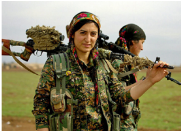
Kurdish YPJ fighters

Women's rights are a priority in Kurdish-controlled northern Syria. Both men and women participate in their local government entity. The Women's Protection Units (YPJ) is an all-female Kurdish militia. At first, the YPJ was established to defend the Kurdish population, but its role expanded to anti-ISIS operations. Women's rights offices have been established to resolve disputes and enforce women's rights. 69, 70