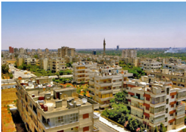
City of Homs

Before the advent of Islam, Homs was a hub for Christianity. Although much of the city's older architecture and layout no longer exist, a small Christian population remains there to this day. The city is home to a mosque built in honor of Khalid ibn al-Walid, a revered Arab general known as "the sword of Allah." Al-Walid famously brought Islam to Syria in 636 CE. In nearby Jabal al-Nusiriyya is Krak des Chevaliers, a major regional monument that served primarily as a medieval fortress during the Crusades. 77