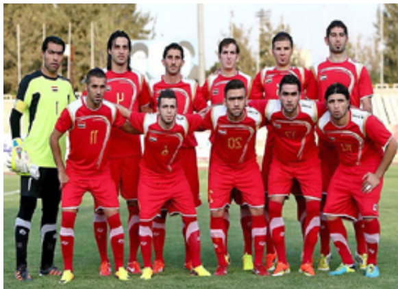
Syria National Football Team in 2015 AFC Asian Cup qualification

The Institute for Sports Education administers athletic affairs in Syria. Soccer is the country's most popular sport, with karate and weightlifting also popular. 81 The national soccer team, known as the Qasioun (a mountain in Syria) Eagles, came close to qualifying for the 2018 World Cup for the first time but failed to reach the tournament after losing to Australia. The team had to play its home games in Malaysia because of the ongoing civil war. Not all Syrians support the team, because of its links to the government. There are