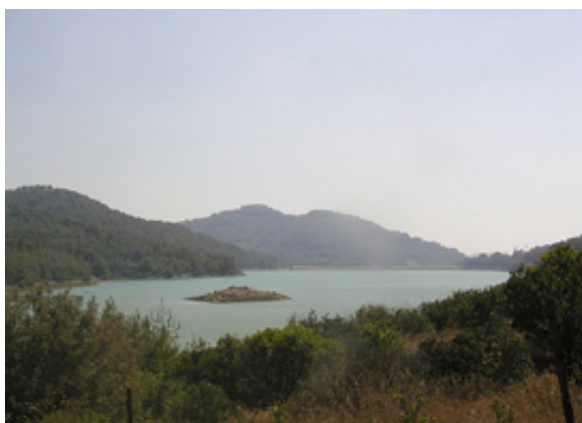
Al-Kabir River

The Al-Kabir River forms a substantial segment of the Syrian-Lebanese border, which runs roughly east-west from the northern end of the Lebanon Mountains to the Mediterranean coast. Fed by mountain springs and snowmelt, the river flows westward through the coastal Akkar Plain and empties into the Mediterranean Sea. Pollution from raw sewage and agricultural and industrial chemicals has detrimentally affected the river, which remains an important source of water in the region. 54