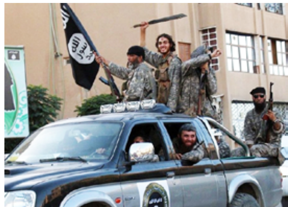
ISIS fighters parade through Raqqa in 2014

Sunni terrorist organizations operating in Syria want to replace the Syrian government with a Sunni caliphate, or theocracy. ISIS fighters have attacked and killed people from religious minorities and Sunni Muslims who do not adhere to their extreme interpretation of Sharia law. 47