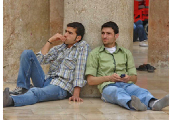
Unemployed men sitting in Damascus

Syria's unemployment rate is approximately 50-55%. By comparison, the 2010 rate was 8.6%. 119, 120, 121 During the first four years of the civil war, approximately 538,000 jobs were lost each year. 122 In addition to high unemployment, Syria is beset by a lack of skilled labor, as many who fled the country after the start of the war were professionals, skilled workers, and intellectuals. 123 In Damascus, the job market is severely affected by corruption and cronyism. 124