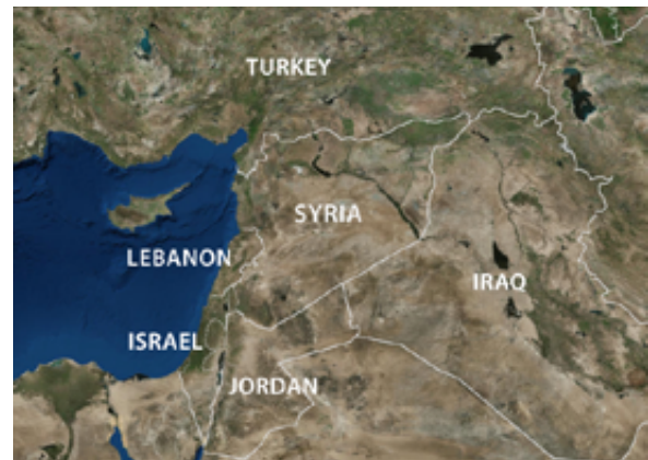
Map of Syria and its border countries DLIFLC

Syria shares borders with five neighbors: its northern border is with Turkey; to the east and southeast, lies Iraq; to its south is Jordan; and on Syria's far southwestern edge lies the Golan Heights region, which Israel has occupied since 1967. The Golan Heights, a central part of Syria's ongoing territorial dispute with Israel, is a strategically valuable region that includes three main tributaries of the Jordan River, a major water supply for Israel. The Golan Heights border between Syria and Israel measures 76 km (47 mi). Lebanon, which also claims a portion of the Golan Heights, lies between the Mediterranean Sea and Syria's western border. 7 Syria's short Mediterranean coastline (180 km or 110 mi) begins at Lebanon's northern border and runs to the southern border of Turkey. 8