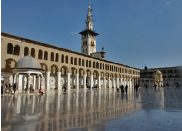
Umayyad Mosque in Damascus

Muslims, followers of Islam, believe that Allah (God) revealed his word to a series of prophets, concluding with the Prophet Mohammed and the Quran in the 7th century CE. All Muslims adhere to the five pillars of Islam: a declaration of belief, prayer, charity, fasting, and completing the pilgrimage to Mecca. After Muhammad's death in 632 CE, Islam split into two branches over the question of who would be his successor. Sunnis favored an associate of Muhammad, but Shias wanted a descendant of Muhammad to be named as a successor. Unable to find a resolution to this matter, the two branches of Islam continue to exist separately to this day. 41, 42, 43