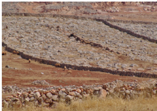
Drought, Deir Sounbol, Idlib

Syria's climate and geographic location make it vulnerable to a variety of natural disasters, including droughts, floods, earthquakes, dust storms, and sandstorms. 107, 108, 109 Syria is also prone to periods of limited rainfall, and with its inherently hot and dry conditions, it occasionally suffers devastating droughts. 110, 111