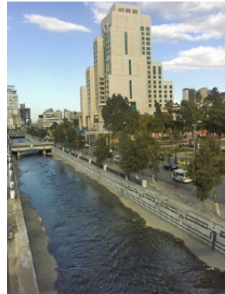
Barada River, Damascus

Originating in the Anti-Lebanon Mountains, the Barada River supplies water to Damascus, the capital of Syria. As the river approaches Damascus from the west, several ancient channels direct its flow across a large expanse of land, creating the Al-Ghutah Oasis. The Fijah Spring augments the river's flow before it reaches Damascus. Beyond Damascus, the river drains into the desert. 50, 51