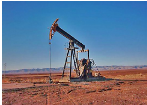
Syria's Rumeilan Oil Fields

Petroleum and natural gas are Syria's most important natural resources. In the 1980s, large oil fields were discovered in eastern Syria and oil soon became a significant force in the economy. 36 The Syrian government formed partnerships with international oil companies, including ConocoPhillips and Shell, to assist in the development of its oil industry. Crude oil became the dominant Syrian export, destined mainly for European countries. 37, 38