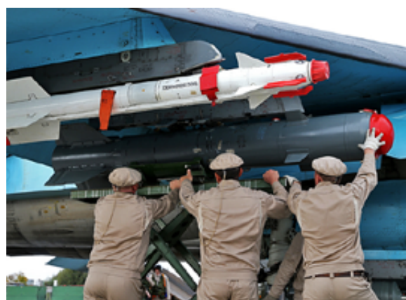
Russian air group personnel in Syria fitting a KAB-500KR guided bomb on an Su-34 jet based in Khmeimim Air Base

Russia entered the Syrian conflict in 2015 and is allied with the Iranian and Syrian governments. Russia has declared that its objective is to fight ISIS, but most of its air strikes are on anti-government militias and targets, such as the October 2016 Russian airstrike on a Syrian rebel hospital. Russia has provided the Syrian government with political and military assistance. 70, 71, 72 Russian military contractors entered the civil war in 2015, and there may be up to 8,000 Russians, including 4,000 mercenaries, fighting in Syria. In 2017, Russia announced that it reached an agreement to establish a permanent airbase in Syria. 73, 74