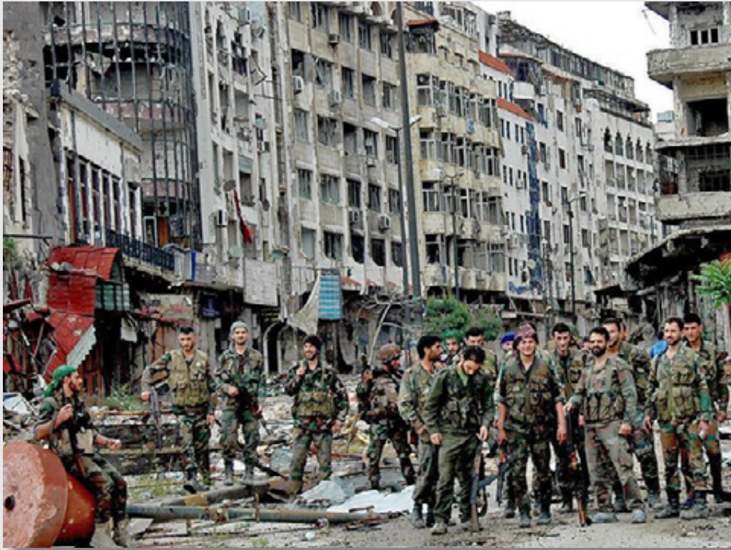
Free Syrian Army's fighters in front of the damaged buildings, Damascus