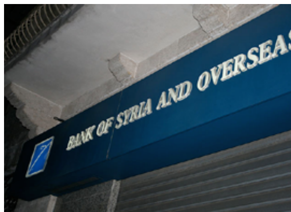
Bank of Syria and Overseas

Most foreign investment in Syria focuses on the massive reconstruction efforts as the civil war apparently winds down. The projected costs of reconstruction are far greater than the country's financial resources, making reliance on external financing all but necessary. 95 It will take an estimated USD 200 billion to rebuild Syria's cities. 96, 97, 98