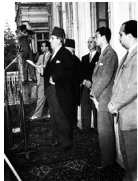
Quwatli declaring Syria's independence from France, 17 April 1946

As Europe slipped into World War II, Syria became a base of operations under Allied control. After the French government fell to Germany in 1941, the British and the Free French Forces proclaimed Syrian independence upon entering Syria, and Syrians quickly set up a government. In 1945, the French delayed the transfer of control of the armed forces in Syria, bombing Damascus when the Syrians refused to negotiate a treaty and establishing French rights within Syria after independence. Winston Churchill threatened to use British forces to aid the Syrian government if the French attacks did not stop. In 1946, the French finally left Syria, and to this day, Syrians celebrate Evacuation Day every April 17, marking the end of the French occupation. 53, 54