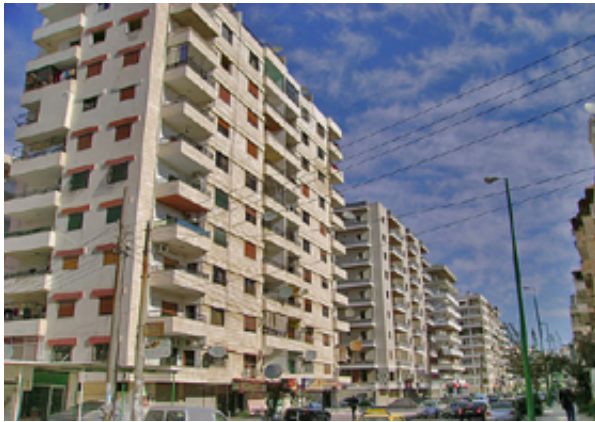
A modern neighborhood in Latakia

Located on Syria's northern Mediterranean coast, Latakia is the country's chief port city. The natural harbor has been important in regional maritime trade since the time of the Phoenicians (3,000 BCE). Numerous earthquakes and prolonged battles between Muslims and Christian crusaders severely damaged much of the city's ancient architecture. Today, the Roman ruins of the Temple of Bacchus and the Triumphal Arch are virtually the only remaining artifacts. 85