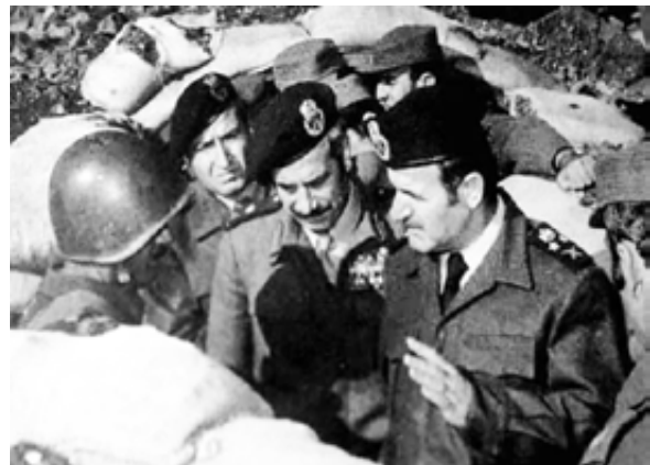
President Hafez al-Assad and Mustafa Tlass on the Golan front

By 1971, Assad had firmly consolidated his control of the Ba'ath Party and the Syrian government. In March, he became president. He quickly bolstered relations with Egypt, Libya, and the Soviet Union, using Moscow as a source of military support for rebuilding Syria's armed forces. 80