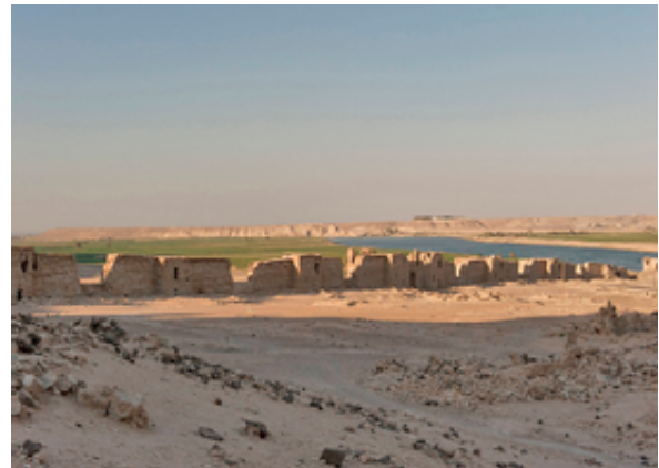
Eastern Plateau, Dayr az Zawr

East of the western mountains and the Ghāb Depression, northern Syria largely consists of semiarid to arid plateaus, with vegetation ranging from agricultural crops to grass and scrub. In the north and northeast, the Euphrates River and its tributaries intersect the plateau and carry precious water through the region, allowing for agricultural development and human settlement. The al-Jazīrah Plain sits in the far northeastern region of the country. Located between the Euphrates and Tigris Rivers, this expanse of grassland is an important agricultural region, particularly for cereal grain crops. As the northern region of Mesopotamia, the al-Jazīrah Plain extends southeastward into Iraq. 25