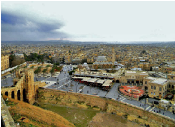
Ancient Aleppo

Before 2011, major components of Aleppo's local industry included textile manufacturing, most famously silk and food processing (predominantly nuts and dried fruits). The city was a market for regional agricultural produce, heavily supported by the nearby Euphrates River and al-Assad reservoir to the east. Aleppo was also an important regional transportation corridor. It was also a center for intellectual pursuits, as it was home to a major university, several madrassas,