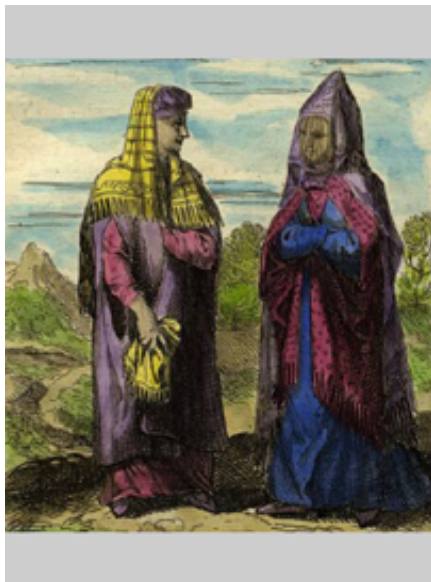
Syrian women during Ottoman Syria, 1683

The Ottoman Empire era in Syria lasted almost 400 years. Agriculture improved and Aleppo thrived as a trading center with Europe. Damascus gained a special role in the Ottoman world because of its position as the starting point for Muslims embarking on the annual pilgrimage to Mecca. 40, 41