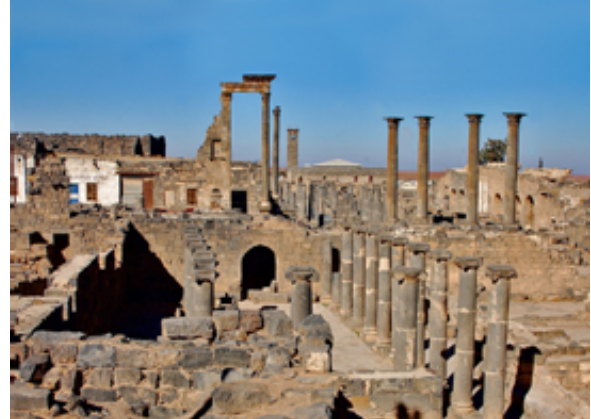
Heritage site in Bosra damaged by shelling and crossfire

In February 2011, at the beginning of the civil war, graffiti calling for an end to the Assad regime appeared on walls in the town of Daraa. The two 15-year-old boys who painted the graffiti were detained and tortured by the security forces. Since then, visual and digital art has been a popular form of political expression among young artists. 78