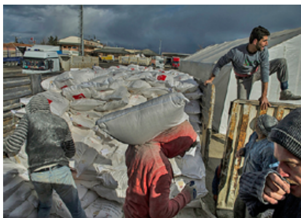
Flour provided by the Turkish Red Crescent for Syria

India, Brazil, and China are also trying to position themselves as key players in rebuilding Syria in efforts to gain access to its natural resources and recoup losses incurred from the conflict. India has invested in Syrian healthcare and China in its energy, telecommunications, and infrastructure. 100 For its part, Syria hopes to use foreign investments to balance the influence of Gulf states that have been supporting the anti-Assad rebels. 101, 102, 103