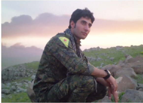
Kurdish YPG Fighter

Most Kurds are Sunni Muslims. They are less conservative than the Shia Arab majority in that they recognize women's rights and do not discriminate against other religious or ethnic groups. 18 In 1962, the Syrian government conducted a census, and anyone who did not register became a non-citizen. The census resulted in about 190,000 Syrian Kurds being formally identified as foreigners by the Syrian government. These foreign Kurds subsequently became ineligible for government services such as education. The Syrian government restricts the use of the Kurdish language and Kurdish media. Kurdish militias have organized within Syria, such as the Peoples Protection Units (YPG), which is under control of the Kurdish Democratic Union Party (PYD). During the civil war, the PYD gained control of northern Syria and formed a semi-autonomous region called the Democratic Federation of Northern Syria, or Rojava. The Kurds are considered allies of NATO. 19, 20