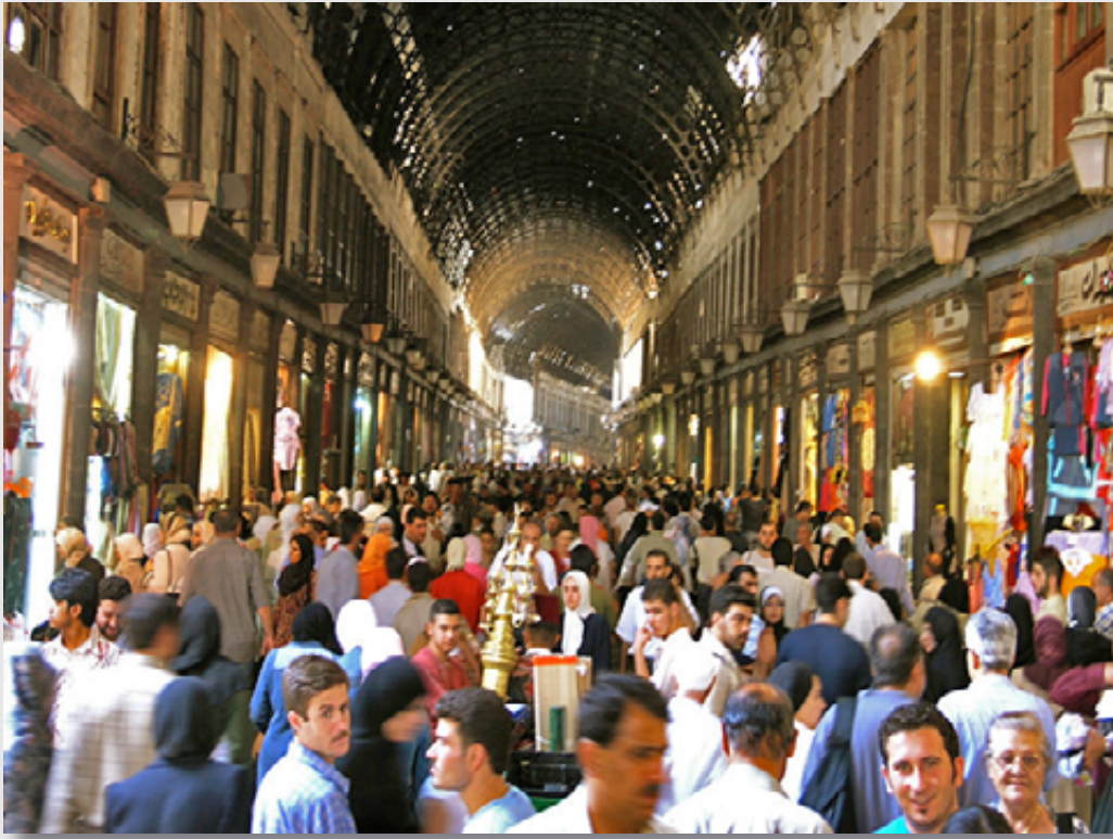
Crowded market in Damascus