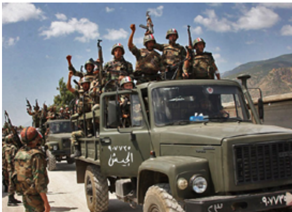
Syrian Army soldiers standing on their military trucks shouting slogans in support of Syrian President Bashar Assad

The Syrian Arab Army has its roots in the Mandate Volunteer Force, which was founded in 1920 and run by a French officer corps; the Syrian army, in its current form, was created when Syria became independent from France in 1946. The army is the largest branch of service, and the country's senior national military positions are occupied by army officers. Administration of the army is carried out by seven regional commands. The army started the civil war with about 220,000 soldiers, but its current strength may be as low as 25,000. There were about 300,000 reservists before the start of the civil war. Many soldiers have defected or been killed in the conflict since it began in 2011. Alawites hold many of the army's senior leadership positions. 48, 49