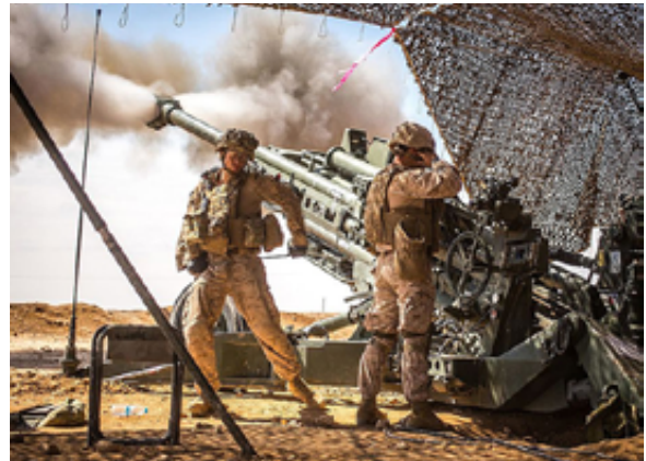
U.S. Marines in northern Syria, March 2017

The United States has about 2,000 military personnel deployed to northeastern Syria in order to fight ISIS but has also occasionally struck pro-government militias. 75 The United States has fought ISIS through airstrikes in support of Kurdish and Arab militias and by embedding troops with allied militias. 76 In 2018, a U.S. outpost was attacked by hundreds of pro-Syrian militants and Russian mercenaries backed by armor and artillery; there were no U.S. casualties, but hundreds of pro-Syrian militants, including Russian citizens, were killed. 77 In December 2018, the U.S. government began planning the withdrawal of U.S. forces from Syria. 78, 79