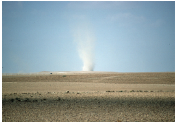
Dust storms, Anderin Flickr / AlxVuk

northwestern Syria burst. The flood wiped out five villages in its wake and killed 80 people. 117, 118 In December 2018, torrential rains in northern Syria led to floods that destroyed parts of 11 refugee camps for people displaced by the civil war, leaving tens of thousands without shelter. 119, 120