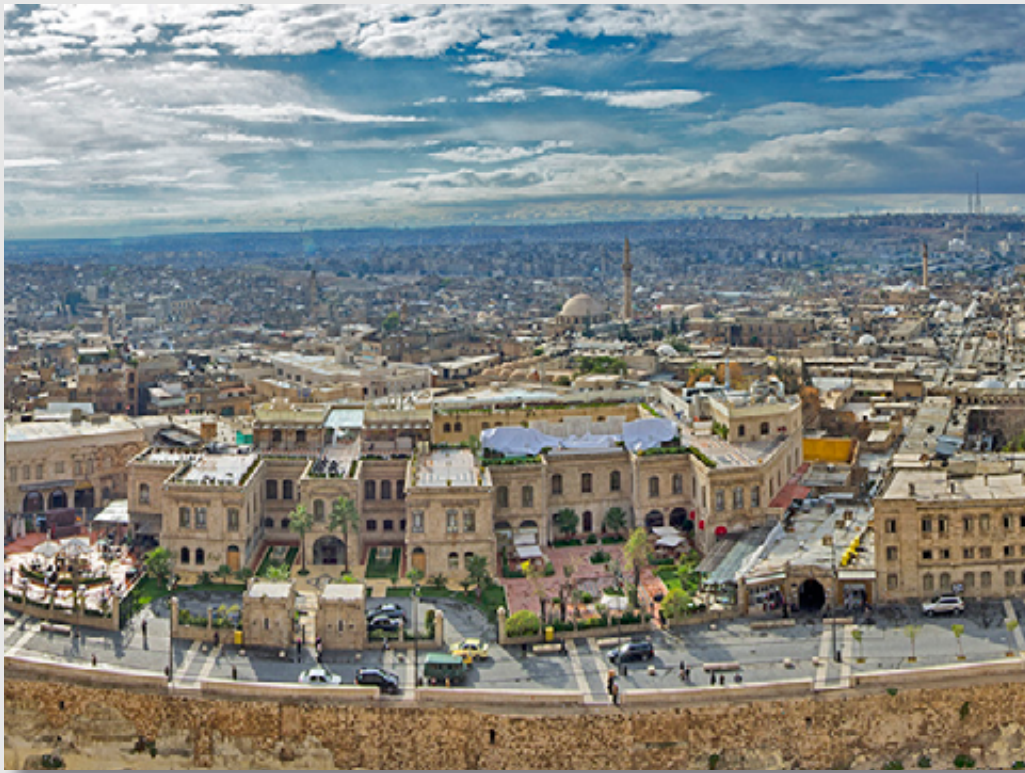
Ancient section of Aleppo City