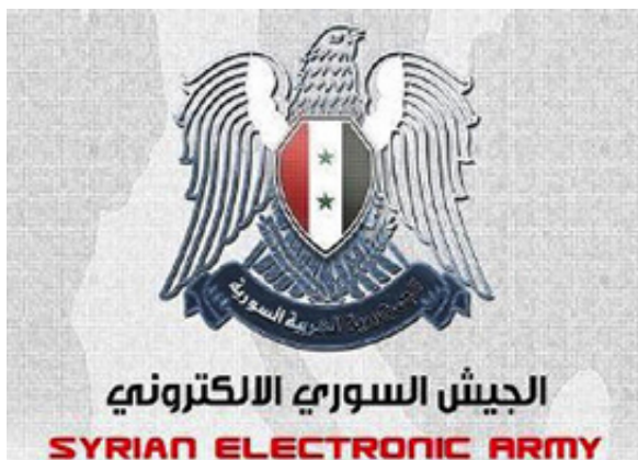
Coat of arms of the Syrian Electronic Army

The Syrian Electronic Army (SEA) is a group of pro-Syrian computer hackers attempting to spread misinformation and discontent through hacking government, economic, and social media accounts and websites. The group started its cyber attacks in 2011, targeting entities that were against the Syrian government or deemed to be supportive of Syrian rebels. Some of the organizations that were hacked include the U.S. Marine Corps, the Associated Press, NPR, 60 Minutes, FIFA, and the BBC.