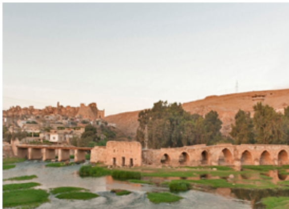
The Roman Bridge on the Orontes River

The Orontes River, or Nahr al-Asi, is an essential water source for western Syria. Originating in Lebanon, the Orontes enters Syria near Homs Gap and flows northward through the Ghāb Depression and into Turkey, where it empties into the Mediterranean. 46 On its route, the river supplies the Syrian cities of Homs and Hama; each city uses dams to direct irrigation water into their respective regions. 47 Lake Qatinnah, a reservoir located southwest of Homs, is supplied by the Orontes, as is