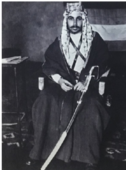
Faisal entered Damascus with his forces, and in 1920 was named King of Syria

In 1916, the British and French had signed the Sykes-Picot agreement, a document that carved out spheres of influence in the Middle East once the war would end and the Ottoman Empire would be dissolved. Under the agreement, Syria and Lebanon would fall within the French mandate. 46