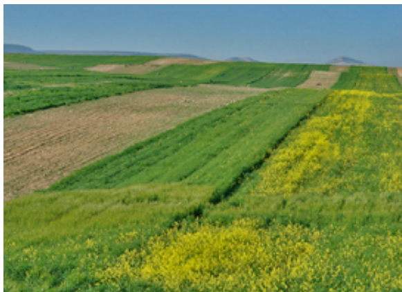
Farm land in Hama

Before 2011, Syria was considered the breadbasket of the Middle East. 10 The livelihoods of approximately 46% of the population were connected to agriculture. Well-established government subsidies promoted stability by providing seeds and purchasing crops. 11 The main agricultural products included wheat, cotton, barley, tomatoes, sugar, citrus, potatoes, olive oil, apples, cattle, sheep, poultry, and eggs. 12 Despite its productivity, Syria's agriculture sector was also a victim of decades of mismanagement. Monoculture (producing a single crop as opposed to many) and chemical use degraded soil and improper irrigation increased water salinization. Overgrazing has also posed a problem by causing desertification of the steppe. 13