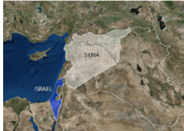
Map of Syria and Israel DLIFLC

There are no diplomatic relations between Israel and Syria, as technically, the two countries have been at war since Israel's independence in 1948. The two countries have engaged in armed conflicts in 1948, 1967, 1973, and 1982. 23, 24 The Israeli annexation of the Golan Heights is a contentious, unresolved dispute between the Israeli and Syrian governments. Israel seized the Golan Heights during the 1967 Six-Day War and maintained control of the territory after the Yom Kippur War of 1973.