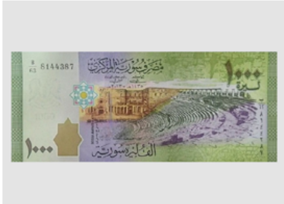
1,000 Syrian pound (SYP)

Syria’s national currency is the Syrian pound (SYP). As of February 2019, USD 1 was worth SYP 514.9. 85 Since the start of the civil war, the SYP has lost over 90% of its value. 86 In 2017, the inflation rate was 28.1% and the public debt was 94.85% of GDP. 87