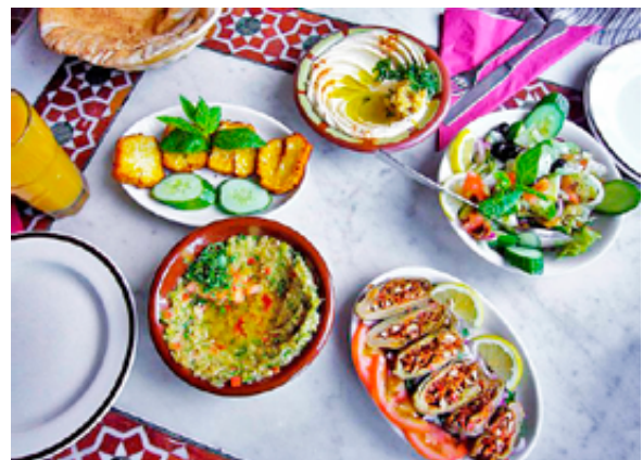
Syrian typical meal: makkous, tabbouleh, hummus, haloumi and baba ganouj with pita bread

Syria's cuisine is influenced by the culinary traditions of the Middle East, Greece, Turkey, and the Mediterranean's southern region. The country's position on the historical Silk Road opened it to influences from East Asia. Meat dishes mostly utilize lamb and chicken, although most people cannot afford to eat meat every day. Islam forbids the consumption of pork. Fresh fish is available along the Mediterranean coast. Shish kebabs, shawarma , kibbeh (dumpling stuffed with meat and vegetables), rice, salads, stuffed zucchinis, and yogurt are popular dishes. Tomatoes, pomegranates, dates, figs, and potatoes are common.