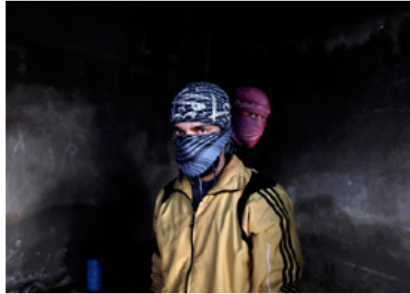
Syrian rebels making bombs to be used against the government forces, at their post in Maaret Misreen

The effects of sectarianism are widespread in the conflict and are amplified by power struggles among factions. Iran has contributed Shia militants in support of the Syrian government. Iraqi Shia militants, members of the Popular Mobilization Front, have also joined the government's side. ISIS and Hayat Tahrir al-Sham (which has links to al-Qaeda) are Sunni terrorist factions operating in Syria. Sunni terrorists target Shia Muslims, Alawites, Christians, Yezidis, Kurdish militias, and uncooperative Sunnis. The Free Syrian Army consists of Sunni personnel who deserted from the Syrian army to oppose the government. Kurdish militias are operating in northern Syria, leading to tensions between Syria's Arab population and the Turkish government; yet Kurdish militias have cooperated with Arab militias as members of the U.S.-backed Syrian Democratic Forces. 96, 97