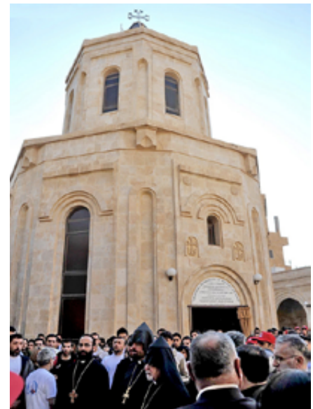
The memorial to the Armenian Genocide at the Martyrs' Memorial Church, Deir ez-Zor

The Assyrian community was also persecuted by the Ottoman Empire during World War I, claiming the lives of 15 million Christians. 32 Assyrians are descendants of the ancient Assyrian empire and live throughout the Middle East. About 40,000 Assyrians lived in Syria before the start of the civil war. Assyrians speak Syriac; a language is related to Aramaic. Assyrians