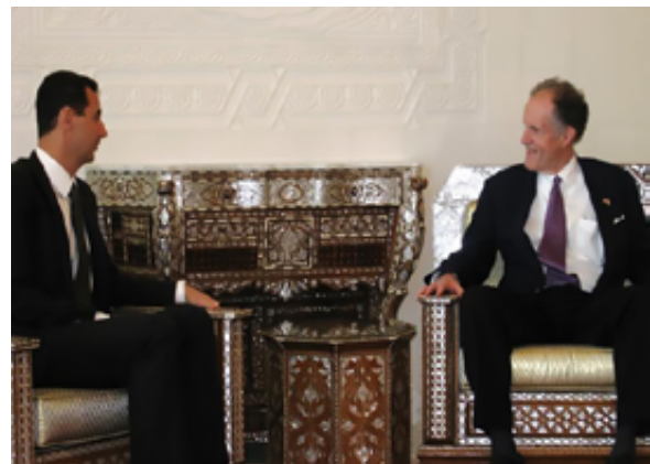
Bashar el-Assad meeting with U.S. Senator Kaufman in 2009

The United States and Syria collaborated on regional issues in the 1990s, but relations soured in the 2000s due to Syria's support of Iraq and the Palestinian insurgency, as well as Syria's interference in Lebanon's affairs. The Syrian government hosted visits from high-level U.S. officials in 2005, 2007, and 2009. U.S.-Syrian relations improved between 2009 and 2011, but the civil war propelled the United States to call for President Bashar al-Assad to step down. 11, 12 In 2018, the United States