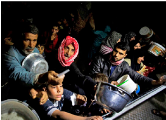
Displaced Syrian people waiting for food

private vendors were used to provide water to the population, but these sources were unreliable and overpriced. 119, 120, 121