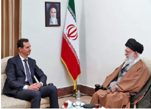
President Bashar al-Assad meeting with Iran's supreme leader Ali Khamenei, 25 February 2019

death triggered massive street protests in Lebanon against Syria's continued presence in the country. These demonstrations, collectively named the Cedar Revolution, were augmented by increased international pressure on Syria to uphold a 2004 United Nations Security Council resolution calling for all foreign nations to pull their forces out of Lebanon. 96, 97, 98