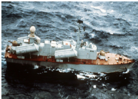
Syrian Osa II (Project 205U) craft

Syria's navy is the smallest of the armed forces, consisting of only a few thousand personnel. The primary mission of the navy is coastal/port defense, but submarine warfare is a priority as well. The Naval Infantry consists of about 1,500 personnel and three ships. Coastal defenses include artillery batteries and surface-to-surface missile batteries. Russia established a small naval base in Tartus in the 1970s; in 2017, Russia announced an expansion of the base and an extension of its lease