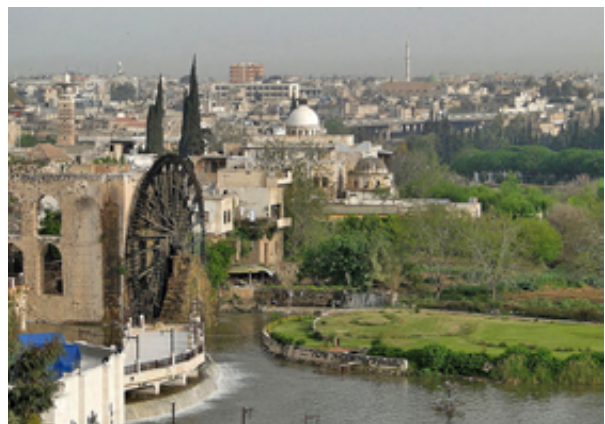
Medieval waterwheels, known as noria in Hama

Hama is located north of Homs in the Orontes Valley. The Orontes River flows through the center of Hama, providing for the city's famous gardens and tree-lined riverbanks. Along the river, the city retains a number of huge medieval waterwheels, known as noria —formerly used to irrigate the surrounding region. Like Homs, Hama serves as a marketplace and processing center for the produce grown in the fertile Orontes Valley; major