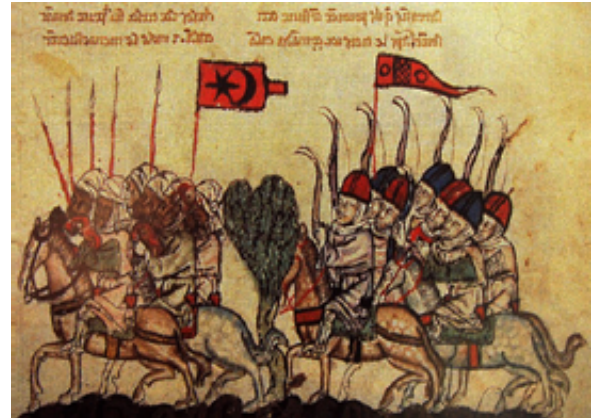
The 1299 Battle of Wadi al-Khazandar: The Mongols under Ghazan defeated the Mamluks

The successors to the Ayyubids were the Mamluks, a dynasty founded by Turkish generals of slave armies, who were able to stop the initial invasions of the Mongols in 1260 and extend their dominance through Syria to the Euphrates River in the 1300s. A second Mongol invasion, under the leadership of Tamerlane (also known as Timur), was more successful. Tamerlane invaded Syria in 1401, devastating Aleppo and Damascus. After the Mongols left Syria, the Mamluks reclaimed their lost territories but were left vulnerable when the Ottoman Turks under Sultan Selim I invaded in 1516-17. 38, 39