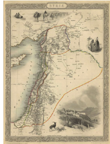
1851 map of Ottoman Syria, showing the Eyalets of Aleppo, Damascus, Tripoli, and Acre

After the Young Turk revolution in 1908, relations between Turks and Arabs worsened. Arab nationalist political parties began to emerge in Syria and Egypt. The Ottoman Empire's entrance into World War I as allies of Germany, Bulgaria, and Austria-Hungary (collectively known as the Central Powers) gave hope to Syrian Arab nationalists that independence would be obtained after the war. 45