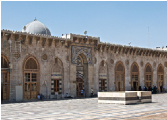
Syrians at the Great Mosque of Aleppo

Syria has no official religion. The U.S. government estimates that about 74% of Syria's population is Sunni Muslim, consisting of Arabs, Kurds, Circassians, Chechens, and Turkmen. About 13% of the population is Shia, including Alawites and Ismailis. Shia Muslims live in rural areas, mostly in the provinces of Aleppo and Idlib. Druze are estimated to be 3% of the population, and about 10% of the population is Christian. However, because of the civil war, many Christians have fled