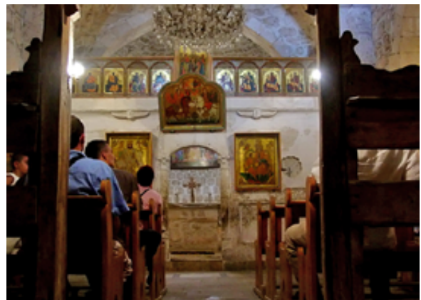
Chapel at Mar Sarkis, Maaloula

The Christian community in Syria dates back to the earliest days of Christianity. About 10% of the Syrian population observes Christianity, most belonging to one of the Eastern branches of the faith, such as the Orthodox Church of Antioch, the Melkite Catholic Church, the Syriac Orthodox Church, or the Armenian Apostolic Church. There is a minority of Roman Catholics and Protestants. Most Christians live in or near Syria's largest cities. 53 Much of the Christian population left the country over the course of the civil war because religious extremists threatened and targeted the Christian population. ISIS subjected Christians to forced conversions, displacement, taxation, assassination, and execution. Dozens of churches have been destroyed by government artillery and air strikes and by ISIS. 54, 55, 56