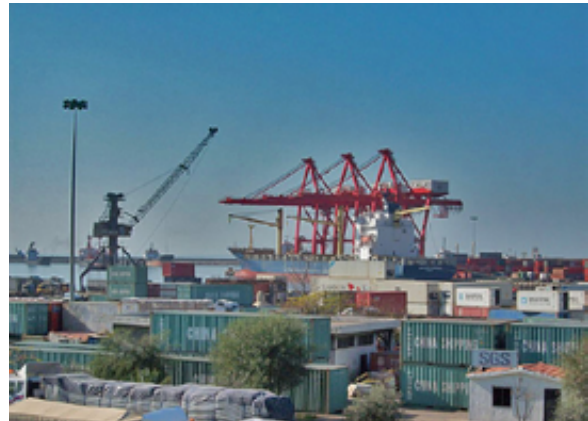
Cargo ships at the Port of Latakia

In 2017, Syria had a trade deficit of USD 3.3 billion. 66 International sanctions and the war-crippled economy have stifled both exports and imports. Exports have decreased by as much as 90%. The country's major export partners are Lebanon, Iraq, Jordan, China, Turkey, and Spain. The main exports are crude oil, minerals, petroleum products, fruits and vegetables, cotton fiber, textiles, clothing, wheat, and meat and live animals. The major import partners are Russia, Turkey, and China. The main imports are machinery, food, livestock, metal products, chemical products, plastics, yarn, and paper. 67, 68, 69