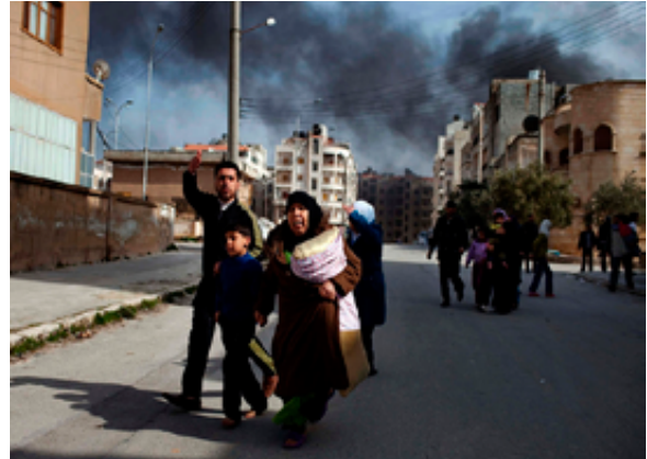
A Syrian family escaping from fierce fighting between Free Syrian Army fighters and government troops in Idlib, 2012

The main participants in the civil war have been the Syrian government, Syrian Kurds, Islamist rebels, the Islamic State terrorist group, and rebel groups backed by Western interests. The conflict has also drawn in international players such as Iraq, Iran, Russia, Saudi Arabia, Qatar, Turkey, and the United States. 113, 114, 115 After losing territory and momentum at the beginning of the conflict, the government has regained the upper hand with substantial military help from Iran and Russia. As of late 2018, Assad controlled over half the country, including the main population centers, the Mediterranean coast, and key natural gas fields. The international community is increasingly accepting that Syria's future will include Assad's continuing leadership. 116, 117 In December 2018, the United States began planning the withdrawal of its forces from Syria. 118, 119