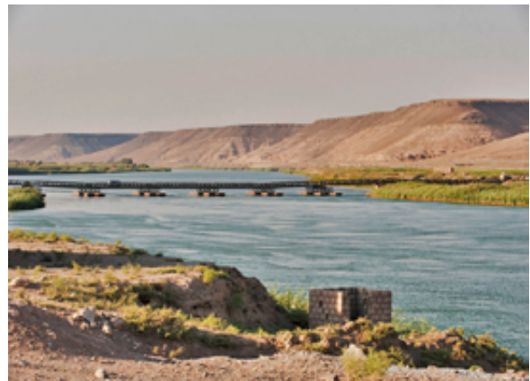
Euphrates River: A floating point connecting the west bank to the Mesopotamia, Halabiye

The Euphrates River, or Nahr al-Furat, is the principal water source in Syria, responsible for roughly 80% of the country's water supply. 41 Although only a fraction of its length is in Syria, the Euphrates is the country's longest river flowing for 710 km (440 mi) inside Syria. In north-central Syria, a large dam on the Euphrates feeds the massive Buhayrat al Assad reservoir, also known as Lake Assad. At roughly 60 km (37 mi) in length, the reservoir is the nation's largest body of water. 42 Constructed in the 1960s and 1970s, the Euphrates Dam (also known as the Tabaqa Dam) allows for intensive irrigation and serves as a source of hydroelectric power. 43 To the east, the Balikh and the Khabur rivers flow southward into the Euphrates as left-bank tributaries. 44 Seasonal waterways, or wadis, may also flow east and west into the Euphrates from the desert. 45