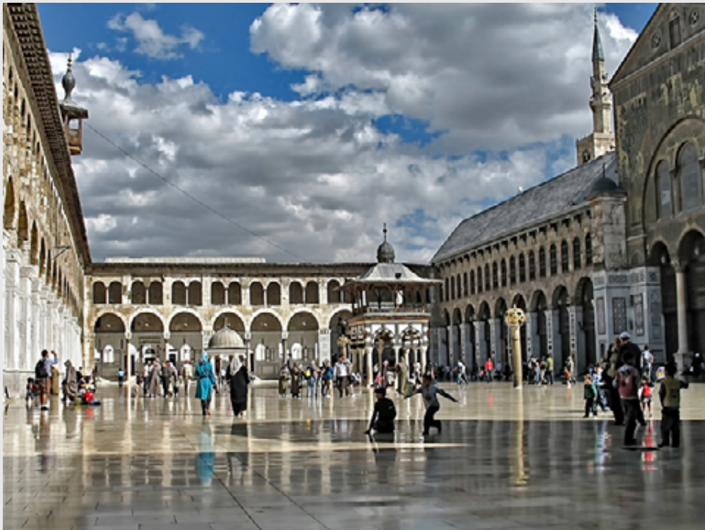
Umayyad Mosque in Damascus