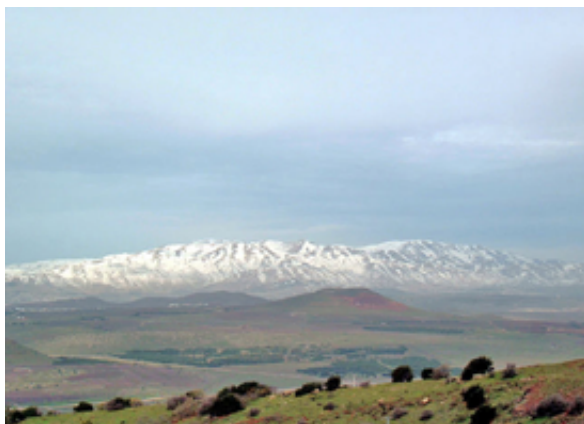
Snowy Mount Hermon

Syria's mountains generally run parallel to the Mediterranean Sea, in a north-south direction. The highest point within Syria is Mount Hermon (also known as Jabal al-Sheikh), topping out at 2,814 m (9,232 ft). With average altitudes of at least 1,000 m (3,280 ft), the mountains tend to experience significant rainfall in the winter and mild weather in the summer. 15, 16