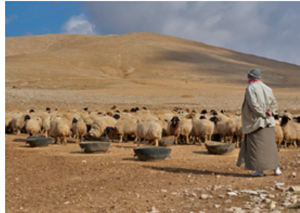
Shepherd grazing his sheep

Before the onset of the conflict, livestock constituted 40% of agricultural production and was responsible for 20% of employment in rural areas. Since the outbreak of hostilities, ownership of the country's livestock herds has decreased by roughly half. Military maneuvers in rural areas have prohibited shepherds from grazing their flocks and many livestock owners have sold their animals to generate desperately needed income. 21, 22 Herders also lack animal feed and veterinary services such as vaccinations. 23