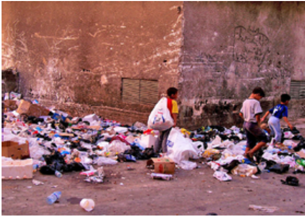
Polluted city by wastes

Deforestation, resulting from the demand for timber and wartime fuel shortages, and the overgrazing and unsustainable development of rangelands in the steppes has led to serious soil degradation. 101, 102, 103 With the removal of trees and surface vegetation, many areas were exposed to erosive forces, which has heightened the risk of desertification. About half of the country's surface area is estimated to be affected or threatened by desertification. 104