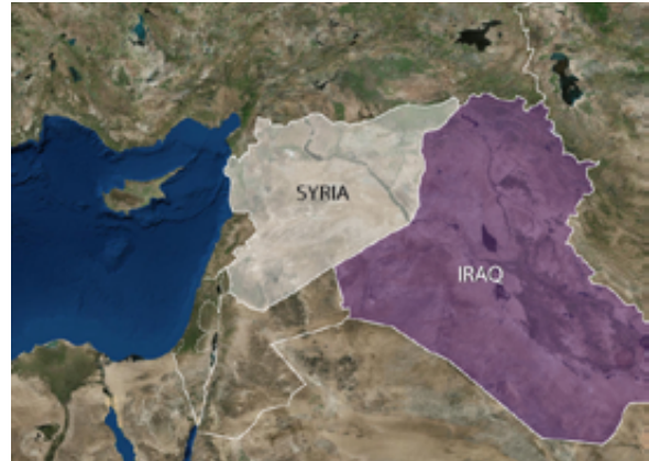
Map of Syria and Iraq

Hafez al-Assad and former Iraqi president Saddam Hussein were enemies. Syria supported Iran during the Iran-Iraq war in the 1980s, and Syria was a member of the coalition forces that removed the Iraqi military from Kuwait. Relations between the two countries improved in 1998 when Syria sought to counter close Israel-Turkey ties. In 2006, Iraq and Syria re-established ties after a two-decades-long absence of diplomatic relations. Iraq is one of Syria's major export partners. 43, 44, 45 In 2011, Iraqi prime minister Nuri Kamal al-Maliki called for President Assad to leave office. In 2018, in coordination with the Syrian government, Iraqi warplanes struck ISIS targets within Syria. 46, 47