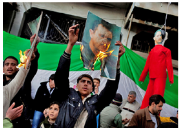
A demonstration against Bashar Assad regime Idlib in 2012

Waves of unrest and government turmoil, known as the Arab Spring, spread across the Middle East in 2011. Syria initially appeared to be immune to the unrest under the autocratic rule of Bashar al-Assad. However, after the fall of Egyptian president Hosni Mubarak, demonstrations broke out in Syria. Security forces killed protestors in the southern city of Daraa, triggering a violent uprising that steadily spread across the country and continued into 2019. 110, 111, 112