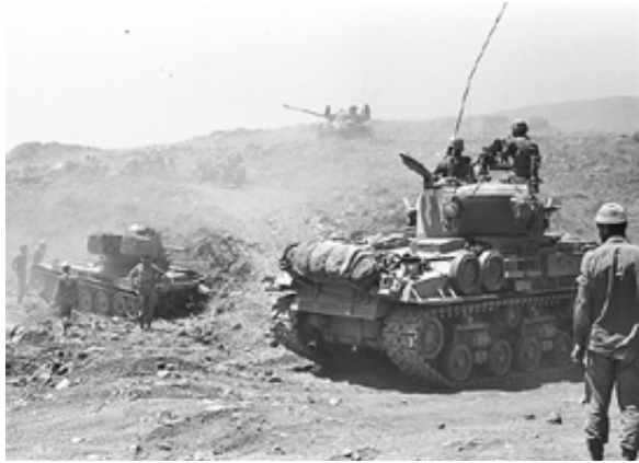
Israeli tanks advancing at the Golan Heights, Six-Day War

Hafiz and Assad, who found themselves on the defensive. Assad, whose views were closer to the moderate nationalists than the fervently socialist Jadid, focused on placing key supporters in the military leadership. Jadid's support came from the civilian political structure. 75, 76, 77