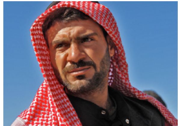
Syrian Arab: A Bedouin man

The largest ethnic group in Syria are Arabs, comprising about 90% of the population. The majority are Sunni, making up about 70% of the population. Sunni Arabs are also the main supporters of the rebel groups in the civil war. 7 Syria's Arab-speaking includes the Bedouins, a group of tribal, nomadic herders. 8, 9, 10