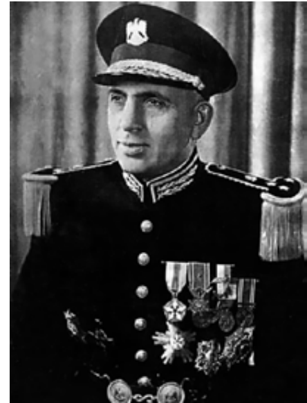
Adib Bin Hassan Al-Shishakli established a military dictatorship in 1951

In March 1949, military forces loyal to Army Chief of Staff Husni al-Za'im removed President Shuhri al-Quwatli from office in the first of a long series of coups d'état—three in 1949 alone. 56 The motivation for these coups emanated from the divisive issue of Syrian political unity with Iraq, a complicated proposal that exposed the geographic, religious, and political divisions among the Syrian population. 57, 58