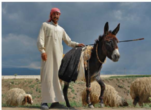
Syrian man in abaya and hatta

Traditional men's wear includes a white cotton shirt, sometimes decorated with embroidery, and cotton pants ( shirwal ). The most important garment is the abaye , a wide cloak worn over the clothes. Men's headdress ( hatta ) can be made of cotton or silk. The agal is the rope that holds the headdress in place on the head. Men also wear a hat ( taqiyye ) under the headdress to hold it in place. 68