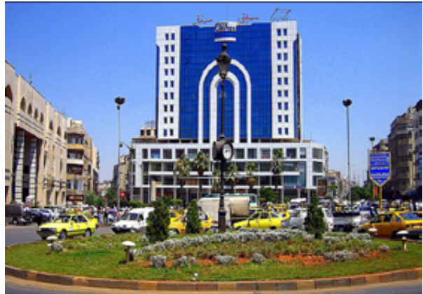
City Centre and the Old Clock Tower in Homs

Homs is situated in the Orontes River Valley, part of Syria's western region. The Homs Gap lies directly west of Homs, making the city a major transit point for travel between the coast and the interior, as well as between Aleppo and Damascus. The Orontes River and nearby reservoir, Lake Qatinnah, are essential for supplying the city and the fertile farmlands in the surrounding region. Local produce ranges from fruits and vegetables to grains, such as wheat and corn, and cotton. 76