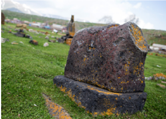
Yazidi cemetery

Yezidis are a Kurdish ethnic and religious minority spread out throughout the Middle East. Before the civil war, there were 80,000 Yezidis in Syria. Yezidis isolate themselves from other communities and observe strict rules of conduct and a caste system. Yezidism combines doctrine from Christianity, Judaism, and Islam with beliefs that are unique to Yezidis. It is not possible to convert to Yezidism, and converting to another religion results in ostracism from the community. In 2014, ISIS kidnapped Yezidis in Iraq and trafficked them to Syria to sale or enslavement. Thousands of Yezidi women kidnapped by ISIS are missing in Syria. 57, 58, 59