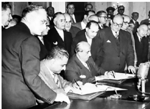
Nasser signing unity pact with Syrian President, Shuhri al-Quwatli, forming the United Arab Republic, February 1958