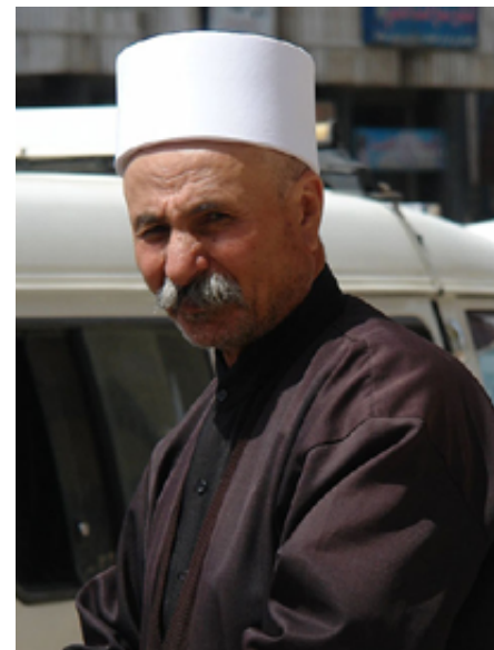
Druze man in Suweida

The term "Druze" refers to both an ethnicity and a religion that has communities throughout the Levant. The Druze religion includes the belief in reincarnation and the veneration of a collection of holy messengers. The Druze community keeps to itself and does not accept converts. An estimated 3% of Syria's population is Druze, mostly in southern Syria. The government allows the Druze population to operate public schools. 21, 22, 23 Although there were Druze uprisings in 1860 and rebellions against the French Mandate government, the Druze adopted policies of neutrality and self-defense during the civil war. Because of these stances, the Druze communities of southern Syria have suffered minimal impact from the conflict. 24, 25