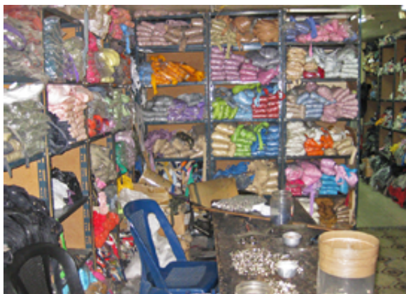
Zipper shop and factory

Before the civil war, Syria's primary industries were petroleum, textiles, food processing, beverages, tobacco, phosphate rock mining, cement, oil seeds crushing, and automobile assembly. Much of the pre-conflict industrial production involved mineral and energy resources such as refined oil products, fertilizers, cement, and other industrial materials. The two largest manufacturing segments were textiles and clothing, along with food and beverage processing. Since 2011, the conflict has taken an immense toll on the manufacturing sector, causing it to shrink