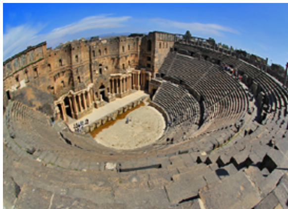
The Roman Theatre at Bosra, dating from the 2nd century

For much of the latter half of the second millennium BCE, Syria was a battlefield upon which numerous dynasties clashed. 5 The Hittites fought the Egyptians for control over the area during in the 13th century BCE. 6 By the end of the 11th century BCE, different tribes, known collectively as the Aramaeans, ruled the area. By the late 8th century BCE, the Assyrian kingdom gained control of the Aramaean's lands. 7, 8, 9 The Assyrians were then defeated by the Babylonians near the end of the 7th century BCE, and the Babylonians were subsequently defeated by the Persians. 10, 11, 12