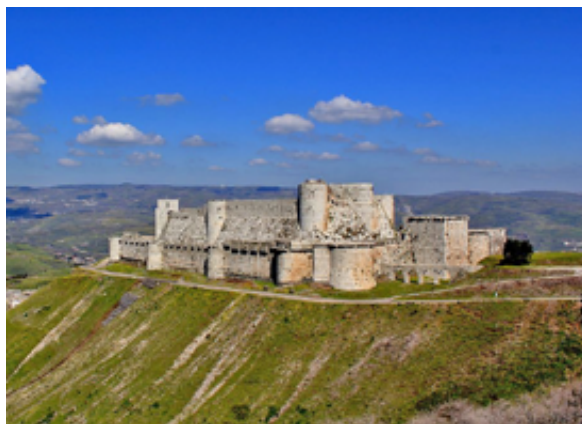
Le Krak des Chevaliers

The civil war has wreaked havoc on Syria's priceless historical heritage. In 2015 and 2017, IS militants damaged or destroyed significant parts of the ancient Roman ruins of Palmyra. 74 The imposing Krak des Chevaliers crusader castle was heavily damaged by aerial bombardments when the Syrian army retook it from rebels in 2014. 75 Many museums and archeological sites were plundered and looted. 76