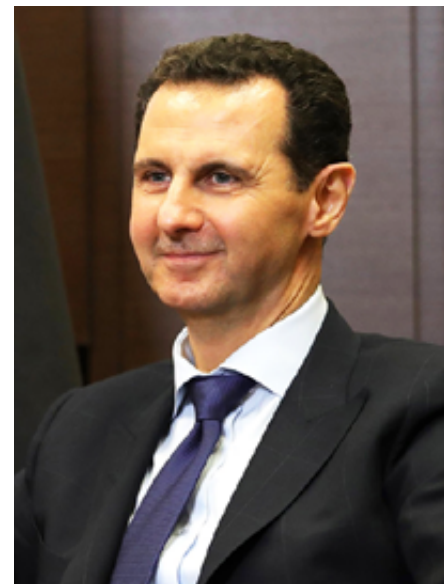
President Bashar el-Assad

In 2005, Assad's government came under intense pressure from Western and Arab countries after former Lebanese Prime Minister Rafiq al-Hariri was assassinated by a car bomb. Syria was widely suspected of having played a role in the assassination. 95 Hariri's