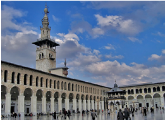
Umayyad Mosque in Damascus

In 636, Damascus surrendered to Hazrat Khalid Ibn al-Walid, one of the Prophet Muhammad's generals, and by 640, the remainder of Syria was firmly under the control of Arab Muslim forces. 21 The first governor of the Syrian territories selected Damascus as his capital. 22, 23