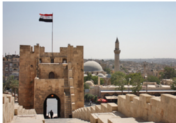
View of Citadel and City of Aleppo

The Syrian Civil War has devastated Aleppo. 70 The conflict reached a disastrous highpoint in 2016 when government forces fought a fierce month-long battle to retake the eastern region of the city from rebels. The clash killed hundreds, left entire neighborhoods in ruins, created thousands of refugees, and set off a daunting humanitarian crisis. Many of the Old City's historic structures, including the citadel and souk, were severely damaged or destroyed. 71, 72 Aleppo has begun to recover slowly, but basic services are still lacking, and once-thriving industrial facilities remain shuttered or destroyed. 73, 74 Of the pre-war population of 3.2 million, less than 2 million remains. 75