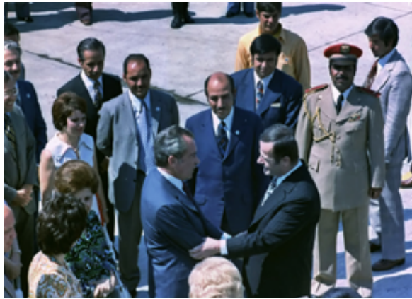
President Hafez al-Assad greeting U.S. President Nixon in 1974

The United States recognized Syria and established diplomatic relations with the country in 1944. Diplomatic relations ceased from 1958 to 1961, when Syria was a part of the United Arab Republic (UAR). This was a short-lived union of Syria and Egypt into one country with Cairo as its capital. The U.S. suspended diplomatic relations again from 1967 to 1974 because of the U.S. government's support for Israel during the Israeli-Arab Wars. The first U.S. president to visit Syria was Richard Nixon