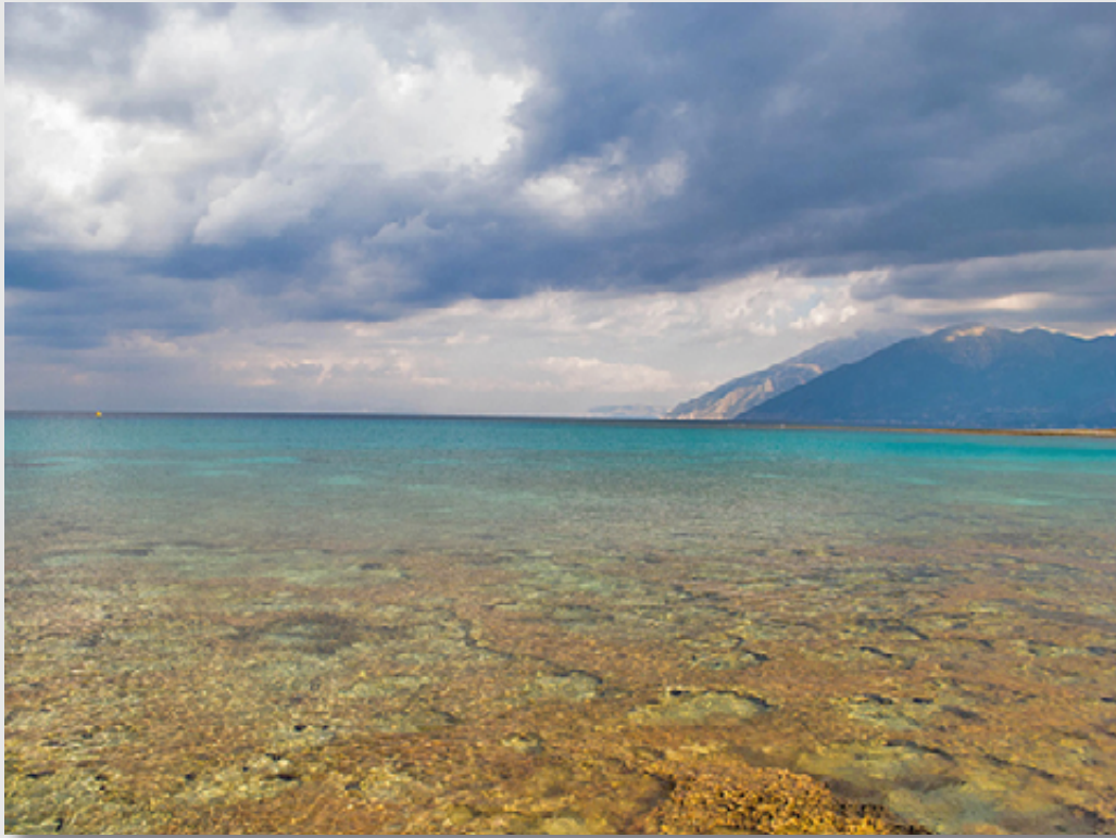
Mediterranean Coast of Syria