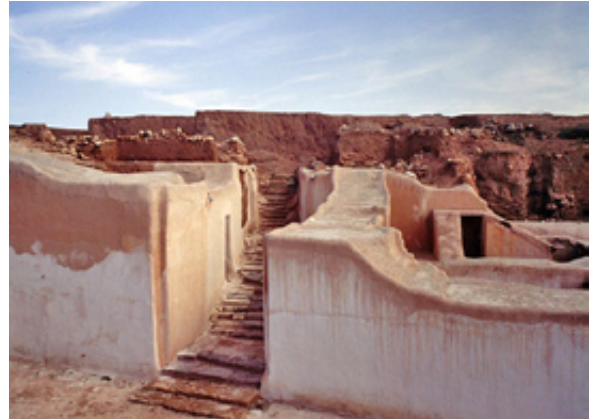
Ruin of Ebla kingdom's royal palace

The centuries between 3500 and 3100 BCE saw the rise of the first cities in western Syria. The discovery of the Ebla kingdom's archive, a collection of correspondence written on clay tablets and dating to around 2400 BCE, revealed a sophisticated civilization that had extensive trading links stretching as far as Egypt, Iran, and the Aegean Sea. Ebla was destroyed by invading Amorites around 2000 BCE. 2, 3, 4