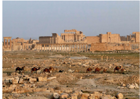
Ruins of Palmyra, a World Heritage Site

With ancient historical sites, various religious shrines, and a warm Mediterranean coastline, Syria had a burgeoning tourism industry before the civil war. Five Syrian locations are World Heritage Sites, including ancient sections of Damascus and Aleppo, the nation's two largest cities. Most travelers to Syria came from neighboring Middle Eastern countries. 71, 72 In 2010, Syria hosted over 8.5 million tourists. 73