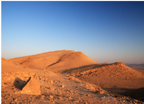
View of the Syrian Desert

Moving south from the Euphrates River basin, the terrain transitions from steppes into the Syrian Desert, which comprises most of southeastern Syria and extends into Iraq and Jordan. The terrain in this region is dry, rocky, and largely barren, although there are occasional oases and some patches of scrub grass. Small populations of Bedouin, nomadic pastoralists, live in this area. 26 Originating in the southwest, a few low elevation mountain ranges extend across the desert plateau toward the