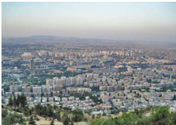
View of Damascus

Historically, most of Syria's population has lived in rural areas. More urbanized nations such as the Greeks, Romans, and Islamic empires left their mark in Latakia, Tadmur, Damascus, and Aleppo, which were trade centers over the centuries, but the urbanization rate was slow. In the past few decades, however, urbanization has accelerated, and the rural-to-urban ratio in population is approaching 50%. Urban populations have settled mainly in sections of the Fertile Crescent, with the highest densities found in the northwest, northeast, and southwest. The lowest density areas are the desert steppes, inhabited by oasis dwellers and the Bedouin . 57