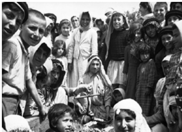
Alawites celebrating at a festival in Baniyas

Officially, Syria is a secular nation; the country has no official religion, and the constitution provides a measure of religious freedom. However, since they took over the government in the 1970s, Alawites have been disproportionately appointed to senior-level government and military positions. Alawites have supported the Syrian government, which in turn has made the Alawite community a target of anti-government rebels. Many Alawites support the Syrian government out of self-preservation, fearing a backlash from the Sunni-dominated Syrian rebels. 90, 91, 92