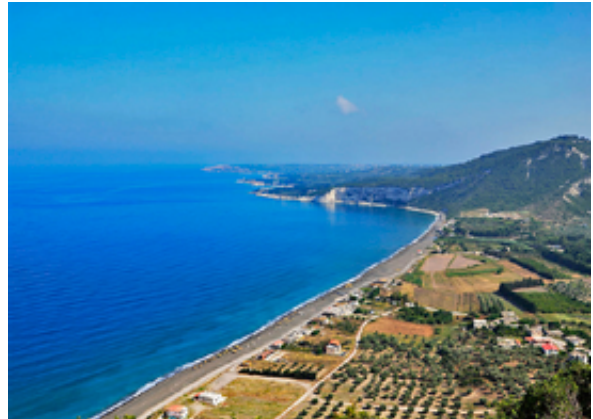
Mediterranean Coast in Latakia

Bounded by mountains to the immediate east, a narrow coastal plain runs along Syria's Mediterranean coast, from Turkey in the north to Lebanon in the south. The width of the plain varies according to the reach of the nearby mountains; the plain is widest in the north, near the port city of Latakia, and in the south near the Lebanese border. Owing to its extremely fertile soil and Mediterranean climate, the coastal plain is the site of intense agricultural development and is densely populated. The terrain along the coastline varies from sandy shores to rugged, rocky headlands and cliffs. 14