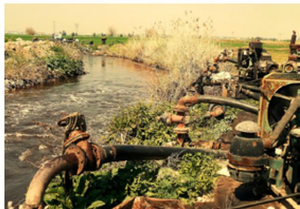
Farmers pumping from the Qwaq River, south of Aleppo

Before the onset of the civil war, the country's many environmental concerns stemmed from overuse or mismanagement of the limited land, water, and timber resources. 95, 96, 97 The civil war has exacerbated Syria's environmental problems. The fighting has depleted or destroyed many of its natural resources and severely degraded the environment. Syrian authorities have neglected environmental protections, and essential resources like water have become tools of war. The warring parties have sought control of dams and reservoirs, and the Syrian government has been accused of contaminating and cutting off Damascus's water supply, in addition to bombing strategic water facilities. 98, 99