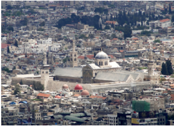
City of Damascus

Damascus is the capital of Syria and the nation's center for government, commerce, and culture. It has an estimated 1.6 million people living in the city proper, in addition to 2.6 million living in the greater metropolitan area. 58 The city lies within the irrigated oasis of al-Ghutah. Damascus is commonly referred to as “al-Sham,” Arabic for “north” or “left,” because of its location relative to Mecca and the Arabian Peninsula. One of the oldest continuously inhabited cities in the world, Damascus is an intercontinental crossroads of the Middle East with a long history of trade and cultural exchange. The city's population has rapidly expanded in recent decades, causing its infrastructure, water supply, and services to experience significant strain. The region also suffers from pollution problems. Furthermore, urban sprawl has eliminated much of the surrounding farmlands and vegetation. 59, 60