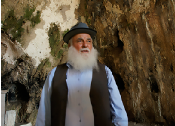
An Alawit priest

Alawites are Syria's largest religious minority; President Assad comes from an Alawite family. Most of Syria's Alawites live on the coast and in urban centers such as Damascus, Homs, and Latakia. The Alawites follow a variation of Shia Islam and view themselves as a moderate Shia branch. They separated from Shia Islam more than a millennium ago. Their religious practices and beliefs are secretive and closely guarded. They do not practice the five pillars of Islam. 48 The Alawite community