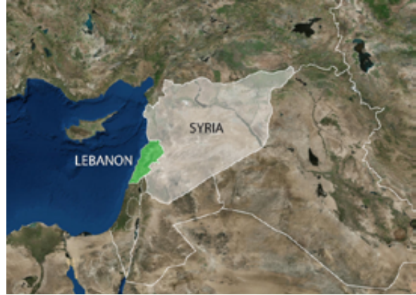
Map of Syria and Lebanon DLIFLC

conducted airstrikes in northern Lebanon against anti-Syrian government forces. Hundreds of thousands of Syrian refugees have fled to Lebanon. Lebanon distanced itself from Syria during the Syrian Civil War, but Hezbollah has lobbied the Lebanese government to strengthen its ties with Syria. 29, 30, 31 In 2017, the Lebanese Army conducted an anti-ISIS operation in Lebanon, near the Lebanon-Syria border, while the Syrian army and Hezbollah conducted a similar operation on Syria's side of the border. 32