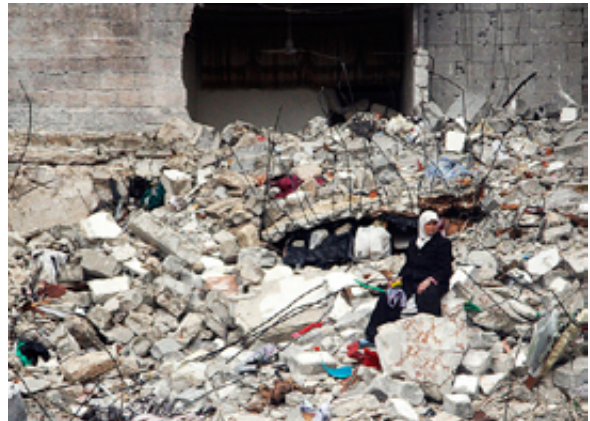
A Syrian woman sitting on the ruins of her house, Aleppo

The civil war in Syria has caused over 400,000 deaths and displaced approximately half of the country's population. Sustained destruction to medical facilities and other infrastructure has caused a drastic deterioration in the health and standard of living for the civilian population. An unintended consequence of Western economic sanctions has been to limit the availability of medication and medical supplies. It is estimated that the breakdown of the health system has caused more deaths than the actual fighting. 105, 106, 107