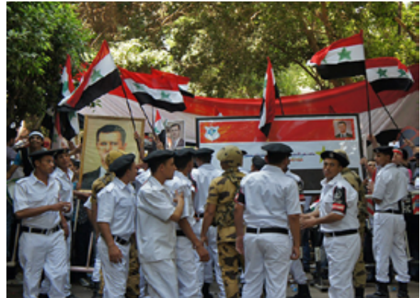
National Defense forces

The National Defense Forces (NDF) is a coalition of militias that support the Syrian government and has been integrated into the Syrian security forces. NDF fighters receive training from Iran, and support and oversight from the Syrian military. Many NDF units are militias that operate locally, and unit capabilities vary; some units have advanced weaponry and operate as a small army, while others operate more like gangs. Many NDF fighters are attracted by opportunities to loot secured neighborhoods, while others join out of fear of the Sunni-dominated Syrian rebels. The NDF has been accused of inflaming sectarian tensions and massacring Sunnis. 54, 55, 56