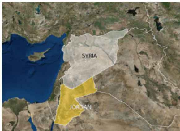
Map of Syria and Jordan

Jordan and Syria both participated in the 1948 Arab-Israeli War and the 1967 Six-Day War, but Jordan did not participate in the 1973 Yom Kippur War (also called the October War). 33, 34 Jordan cut diplomatic relations with Syria in the 1960s because of Syria's support for the PLO, but relations resumed in 1967. 35 Syria invaded Jordan in 1970 in support of the Palestinian Liberation Organization, which was based in Jordan at the time, but Jordan defeated the Syrian invasion force. 36 Jordan has