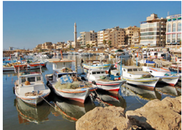
Syria's Mediterranean climate, Tartus

Forming a barrier between the humid Mediterranean coast and the arid eastern plateau, the mountain ranges in Syria's west help shape the country's climate. Specifically, the dual mountain chains of the Jabal al-Nusiriyya and the Anti-Lebanon Mountains prevent Mediterranean winds and rains from passing into Syria's interior. Thus, the climate of the coastal plains and western slope tend to be wetter and milder than that of the eastern slope and plateau, which experience drier conditions and greater extremes in temperature. 32, 33