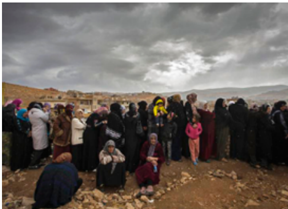
Syrian refugees in the town of Arsal

In 2020, Syria's GDP is projected to grow by a rate of 3% and the inflation rate is estimated to be 12%. 127 Economic growth and stability will be challenged by ongoing armed conflict, fragmented governmental authority, compromised or lost infrastructure, massive government debt, and the depletion and displacement of the country's population. 128, 129