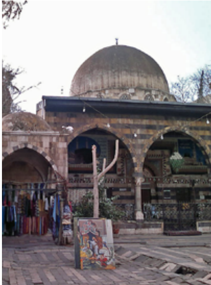
An ottoman market near by Al Takiya Al Sulaimaniya, Damascus

The Syrian Turkmen (also called Turkoman) are a Sunni Muslim group concentrated in northern Syria. The Turkmen community came to Syria from central Asia in the 11th century CE. Ethnically and linguistically, they have more in common with their Turkish neighbors than they do with their Arabic rulers in Damascus. With a population estimated at anywhere between 500,000 and 3.5 million, the Syrian government has traditionally viewed them as a threat. Subsequently, the Assad regimes adopted policies that discriminate against the Turkmen with a view to suppressing any possible resistance to their rule. This has exactly the opposite effect, and Syrian Turkmen militias have been fighting against the Syrian government and ISIS in the civil war. The Turkish government has provided training for the Syrian Turkmen militias. 26, 27, 28