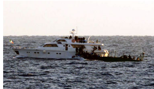
Blockade of Gaza

Israel has blockaded the Gaza Strip since Hamas seized control of the territory in 2007. As a result, the Gaza Strip's economy has suffered significantly. 288 Many Palestinians rely upon illegal smuggling operations along the Gazan-Egyptian border to provide their needs.