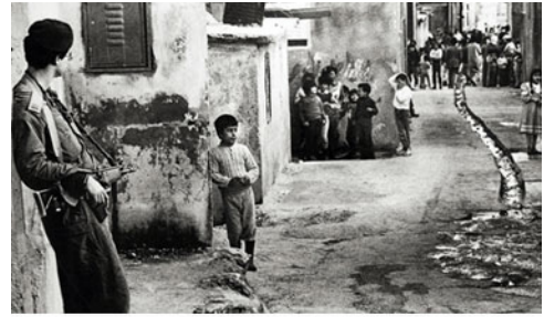
Watching stone throwers

A series of negotiations between Israeli and Palestinian representatives culminated in the 1993 signing of the Oslo Accords, creating the Palestinian Authority (PA) and providing for Palestinian control of the Gaza Strip and the West Bank. Under terms of the agreement, the PLO renounced the use of terrorism. The following year, Yasser Arafat became the first leader of the Palestinian Authority. 267, 268 Confident in his position, at the 2000 Camp David Summit he flatly rejected terms offered by Israeli Prime Minister Ehud Barak that would have created an independent Palestinian state. 269, 270