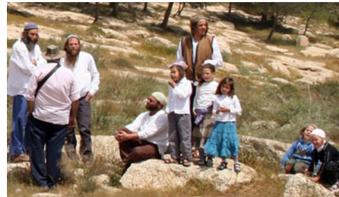
Jewish Settlers

Those who believe in Judaism consider the patriarch Abraham to be the founder of their religion, a belief they hold in common with Muslims. According to Jewish tradition, Abraham made a covenant with god. His people then abandoned their polytheism for a strict monotheism in which their god Jehovah was elevated to the position of the sole deity. But it was the prophet Moses who established the rituals and laws that defined the Jewish religious system. The Old Testament serves as the primary religious text of Judaism, supplemented by the Talmud and other Hebrew works. Jewish religious life centers upon the Sabbath, observed from sunset on Friday until sunset on Saturday. Services in Jewish synagogues consist primarily of readings from religious texts and prayer. 357, 358