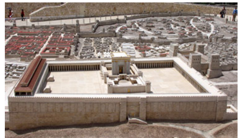
Model of Temple Mount

Much of what we know about the history of the region has relied upon Biblical accounts in the Old Testament and has been substantiated by archaeological and historical research. Archaeological evidence suggests that prehistoric peoples populated the area and engaged in agriculture as far back as 8000 B.C.E. 165 By 2750 B.C.E., the ancient Phoenicians had founded Tyre in modern Lebanon and settled along the eastern Mediterranean coast, including what is today the Gaza Strip, and named their territory Canaan. 166 By 1250 B.C.E., the ancient Israelites began their conquest and settlement of Canaan, setting in motion centuries of conflict. 167