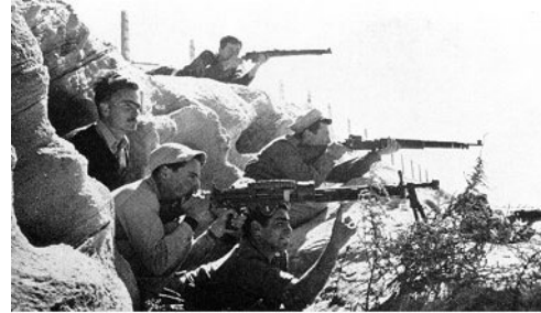
Haganah fighters

After the war, Jewish paramilitary organizations turned against British authorities, resorting to attacks aimed at driving the British out of Palestine. Simultaneously, large-scale Jewish immigration to Palestine resumed, as many European Jews who had witnessed the Holocaust turned to Zionism. 223 The British administrators cracked down on Jewish militants and accused Zionist leaders around the world of cooperating with terrorist groups in Palestine, naming the Haganah among these groups. This marked a continued deterioration of relations between British authorities and the Zionist movement. 224