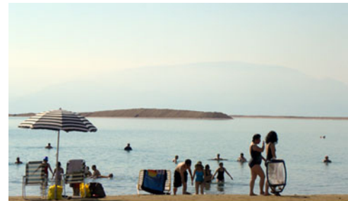
Dead Sea

At 418 m (1,371 ft) below sea level, the water surface of the Dead Sea is the lowest point on Earth. The Dead Sea is also among Earth's saltiest bodies of water. The eastern half of this water-covered depression on the Jordan River is part of Jordan. The western half is split, with the northern portion belonging to the West Bank and the southern portion to Israel. The Dead Sea has been drying up in recent years as upstream water diversions on the Jordan and Yarmuk rivers have reduced the amount of water flowing into it. It is estimated that the Dead Sea has shrunk by one-third from its historical levels. 17 In reaction to this increasing problem, Israel, Jordan, and the Palestinian Authority (PA) signed an agreement in May 2005 authorizing a feasibility study for a canal project linking the Red Sea to the Dead Sea. Water from the project would be made usable by the installation of desalination plants. One additional expected benefit would be hydroelectric power generated by the gravity flow of Red Sea water to the Dead Sea. 18