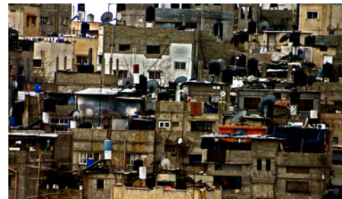
Tulkarm Refugee Camp

Of the 4.2 million residents of the West Bank and the Gaza Strip, almost 2 million live in refugee camps within the Palestinian Territories (about 771,000 in the West Bank; more than 1 million in the Gaza Strip). 78, 79 The United Nations established almost all the 27 refugee camps during and following the 1948 Arab-Israeli War. Today most of the facilities continue to be administered by the UN Relief and Works Agency for Palestine Refugees (UNRWA), which has become the largest UN agency. 80