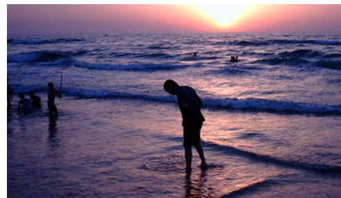
Mediterranean Sea

Stretching from the Atlantic Ocean in the west to the Asian shores of Turkey and the Levant in the east, and separating much of Europe from North Africa and the Middle East, the Mediterranean Sea is one of the most