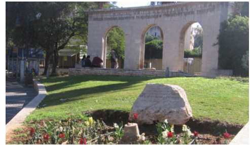
Monument to Rothschild

From 1876 to 1877, Palestinian parliamentarians from Jerusalem, elected under the new Ottoman Constitution, attended the first session of that body in Istanbul. This was the first time in many centuries that Palestinians had a degree of representation in their governance. 194, 195