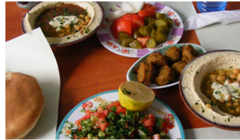
Palestinian cuisine

Palestinian cuisine reflects the region's turbulent history, drawing upon traditions from the empires that vied for control of the area. Arab, Persian, Egyptian, Turkish, and European influences have merged with local traditions to create a unique culinary tradition. Despite the small area of the Palestinian Territories and historical Palestine, there are discernable regional variations in Palestinian dishes. For example, Gazans are known to use more hot spices and to rely more