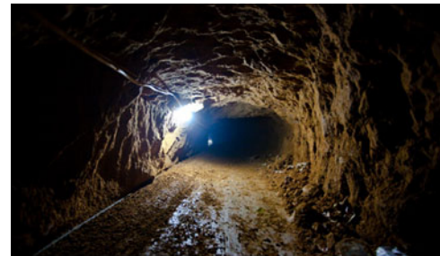
Border tunnel

After the 1948 Arab-Israeli War, Egypt gained control of the Gaza Strip and administered the territory until the 1967 Six-Day War with Israel. Under the terms concluding that regional conflict in which Syria and Jordan also lost territory, Israel occupied the Gaza Strip and the Sinai Peninsula up to the Suez Canal. 419 The Suez Canal, completed in 1869, is an important shipping lane connecting Africa and Asia through 100 miles of Egyptian desert. 420 Egypt regained control of the canal in 1974 through negotiations with Israel brokered by U.S. Secretary of State Henry Kissinger. 421 In 2011, in a move that alarmed Israel, Egypt allowed Iranian warships to pass through the waterway en route to Syria. 422