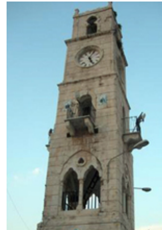
Ottoman tower near Nablus

With the advent of World War I in 1914, Arabs saw an opportunity to gain their independence from the Turkish Ottoman Empire. The Palestinians were no exception. In correspondence dated January 30, 1916, Sir Henry McMahon, British High Commissioner of Egypt, and Sharif Sayyid Hussein bin Ali of Mecca, leader of the Arab Revolt, agreed on the establishment of a postwar independent pan-Arab state carved out of the Arab provinces of the Ottoman Empire. But on May 16, 1916, the governments of the United Kingdom, France, and Russia secretly signed the Sykes-Picot Agreement, reneging on promises to the leaders of the Arab Revolt and placing the Arab provinces of the Ottoman Empire under British and French control. Palestine was divided between areas under British administration and those designated as an international zone. 202, 203