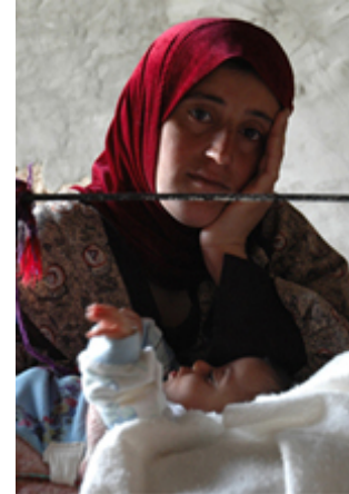
Woman with baby

Palestinian society typically relegates women to the domestic sphere and frowns upon women entering the workforce. Women are expected to honor their fathers and husbands through obedience and submission. 383 Although women have been actively engaged in the organizations and movements aimed at Palestinian liberation, Palestinian authorities have not made gender issues a major priority. 384 Estimates indicate that nearly one-quarter of Palestinian women suffer domestic abuse. Those claiming sexual abuse must endure virginity tests, even against their will. Honor killings, in which male family members murder their female relations if they are thought to have dishonored the family, are treated lightly. 385