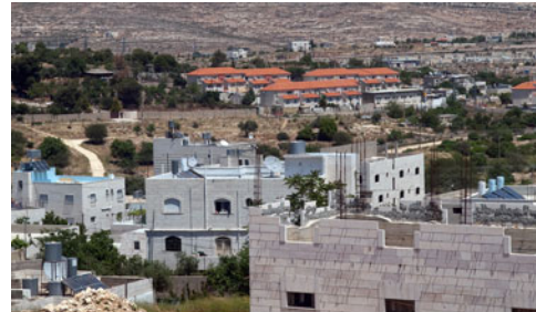
Qiryat Arba settlement

Islamic and Palestinian terrorist groups are not the only such organizations operating in the region. Loosely organized Jewish militant groups also have been responsible for terrorist attacks. Perhaps the most notorious group is Kahane Chai. It was formed in the early 1990s, with roots in the Kach Party, an ultra-nationalist Zionist political party in Israel. Popular among the Jewish settler communities, the group was believed to have carried out a number of attacks on Palestinian civilians. The group is known to have imported military weapons and munitions from international sources, including the United States. Their strength is estimated at about 100 personnel and is believed to be centered around the Jewish settlement of Qiryat Arba near Hebron. The group is known to have used charitable fronts to collect funding in the U.S. and among other Western diaspora communities.