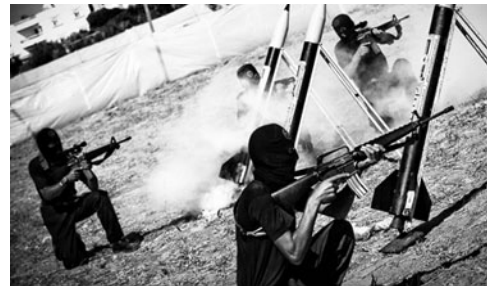
Hamas militants

In the Gaza Strip, all the police agencies are filled with Hamas-affiliated militants and terrorists. The Civil Police is staffed by those police who were already in uniform when Hamas seized control of the Gaza Strip in 2007 and were not affiliated with Fatah. Other members were drawn from the Executive Force, an armed Hamas faction. The Security and Protection service provides VIP protection. The Internal Security Service operates as Hamas' intelligence agency. It is known to harass pro-Fatah citizens and operatives. The National Security branch serves as a tripwire 473 and border security unit. 474