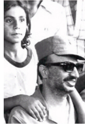
King Hussein of Jordan

The following year, Lebanese militia, aided by Syrian forces, massacred thousands of Palestinian refugees at the United Nations-administered Tel al-Zaatar Refugee Camp in northeast Beirut. The PLO had refused to allow an evacuation of the camp, despite a months-long siege, effectively using the refugees as human shields. During the Lebanese attack, the PLO intentionally shelled fleeing refugees in hopes of blaming their deaths on the Lebanese forces. But Western journalists present during the assault reported that the Palestinian forces were well aware that their shells were landing on refugees and refused to cease fire. 261