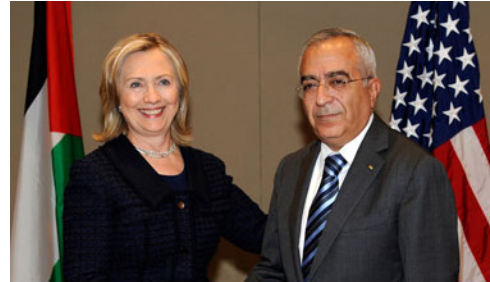
PM Fayyad and Sec. Clinton

The security situation in the Palestinian Territories is unlikely to improve significantly in the immediate future. Although talks between the Palestinian Authority and Hamas in late 2011 seemed to have paved the way for elections in 2012, indications at the time of this writing are that the elections will be delayed, perhaps indefinitely. 335 This could easily ruin the developing reconciliation movement between the two Palestinian factions, leaving the two territories under rival governments. If so, the Palestinian economy will continue to flounder.