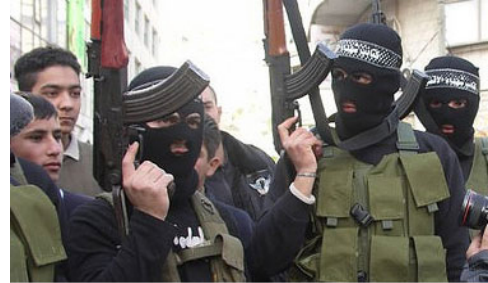
al-Aqsa Brigade terrorists

The group was active in the clashes between pro-Fatah and pro-Hamas elements during the conflict that followed the 2006 election. 476 Al-Aqsa's Gaza units were crushed in the early stages of the Fatah-Hamas conflict. Many either joined Hamas or affiliated themselves with local clan militias. After Hamas seized control of Gaza, many Al-Aqsa operatives were integrated into the Palestinian Authority's security forces. But the organization continues to carry out terrorist attacks. 477 Smaller groups emerged after 2007, claiming affiliation with Al-Aqsa. Some of these emerging groups also are associated with Hizbullah, including the Imad Mughniyeh Group. 478, 479