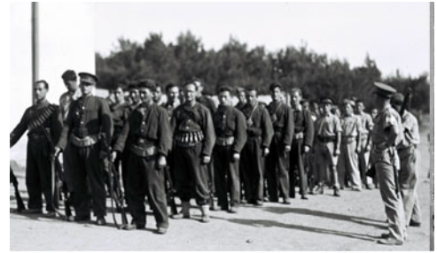
Special Night Squads

Protesting British administration and ongoing Jewish immigration, Palestinians revolted and resorted to armed conflict during the second half of the 1930s. 213 In an attempt in July 1937 to calm Palestinian unrest, the Palestine Royal Commission in Britain (also known as the Peel Commission) proposed the division of the British Mandate into a Jewish state, an Arab state, and British-controlled enclaves, including Jerusalem. The proposal called for the forcible transfer of populations to ensure that the states were divided strictly along ethno-religious lines, but it failed to quiet the discontent. Subsequently, in the late 1930s, British authorities established military courts and a counterinsurgency paramilitary unit to deal with Palestinian militants. 214, 215, 216