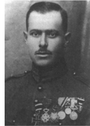
Fawzi al-Qawuqji

In December 1947, the Arab League established the Arab Liberation Army (ALA), an armed force of irregulars drawn from member states. The force was under the command of Fawzi al-Qawuqji, an Arab nationalist who had served as an officer in the Ottoman Army during World War I and the colonial French-Syrian Army before defecting to the Arab revolutionary movement. 228 The following month, the first contingent of the ALA arrived in Palestine and launched an attack on the Jewish settlement of Kfar Szold, which was repulsed by a joint British-Haganah force. 229 Later in 1948, the Haganah stopped an ALA attack on its base at Mishmar HaEmek, effectively neutralizing the Palestinian militants. 230