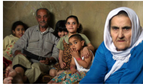
Refugees in Lebanon

Lebanon is home to about 500,000 Palestinian refugees and hosts a dozen UN-administered refugee camps. 434 The country also is the base of operations for numerous Palestinian and international terrorist organizations. These groups played a significant role in the 1975–1990 Lebanese civil war and have subsequently clashed with the Lebanese government on occasion. 435