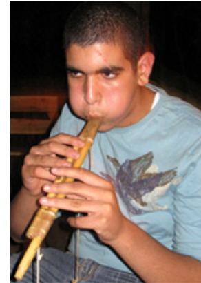
Palestinian flute

Another clarinet, the arghul , is a single-reed instrument with double pipes of unequal length. 398 The shabbaba is a reed flute with five or six holes. It is historically associated with shepherds and folk music but, like other woodwinds, has been used in contemporary music. 399 The darbukah , shaped like a goblet, is a small hand drum common throughout North Africa and Western Asia. Along with the daff , a singled-headed drum also common in much of the Islamic world, the darbukah supplies a dynamic and energetic beat for Palestinian music. 400, 401