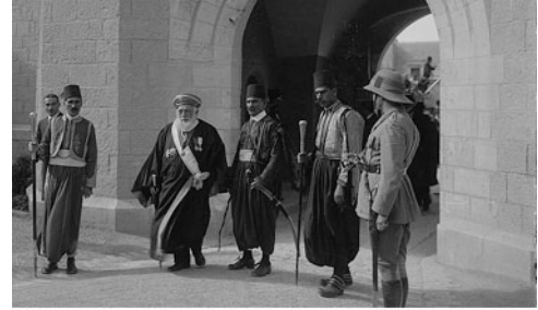
Public Domain Chief Rabbi during Mandate

The First Palestinian National Congress met in Jerusalem during early 1919. The delegates sent correspondence to the Paris Peace Conference firmly rejecting the Balfour Declaration and demanding full independence for Palestine, which they considered part of Syria. 206 Despite this appeal to the Wilsonian principle of self-determination, the demand was unmet.