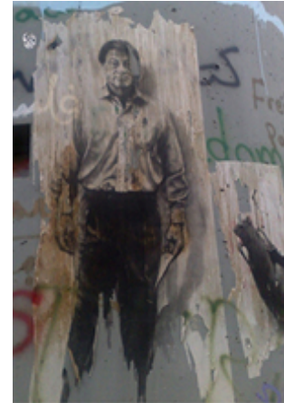
Wall art: Mahmoud Darwish

Perhaps the most renowned contemporary Palestinian writer is the late poet Mahmoud Darwish. His poetry expressed a defiant resistance to Israeli occupation of the Palestinian Territories, as exemplified in his 1988 poem “Passers Between the Passing Words.” 387 Although Darwish lived abroad as part of the Palestinian diaspora, his works supplied the lyrics for much of the Palestinian nationalist-oriented contemporary music. A member of Yasser Arafat’s Palestine Liberation Organization, Darwish left his position in the organization in protest of the signing of the Oslo Accord, accusing Arafat of selling out his people. 388