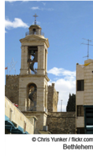
Bethlehem

Compounding the city's security situation are the four refugee camps within the municipality or nearby: al-Duheisha, al-Aroub, al-Aida, and Beit Jibrin. These camps have a combined population of more than 29,000 refugees. 77 The camps are prime recruiting grounds for the various Palestinian militant and terrorist organizations.