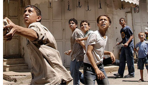
Palestinian unrest

The security situation in the Palestinian Territories is one of the world's most unstable.. The terrorist organization Hamas serves as the de facto government of the Gaza Strip. Terrorists associated with Hamas and Fatah are active in the Gaza Strip and the West Bank, launching artillery attacks from within the Territories. Israeli Defense Forces frequently make incursions into the Palestinian Territories, targeting terrorists, demolishing buildings, and causing collateral damage. Fighting among the various Palestinian militants exacerbates the insecurity.