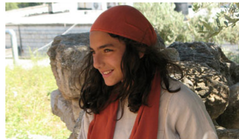
Girl in traditional clothes

Though many Palestinian youths and men commonly wear Western attire, older and more conservative men wear kaffiyehs , traditional headdresses. 377 Such headdresses originally functioned as protection from the sun; however, in the modern context the kaffiyeh serves as a symbol of Palestinian nationalism. The late Palestinian leader Yasser Arafat was seldom seen without a kaffiyeh . 378, 379