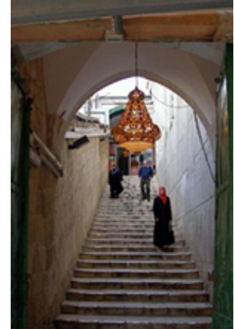
Tombs of the Patriarchs

The Palestinian Territories have long been contested space. Ethnic groups, religious groups, and empires have vied for control of this strategically important area. Abrahamic faiths (including Judaism, Christianity, and Islam) consider these territories to be part of their holy land. As such, ancient animosities continue to define internal and external relations. The most profound of these is the struggle between the Palestinians and the Israelis. The former are a people of mixed ancestry, with familial connections to the ancient Phoenicians and Arabs, and are primarily followers of Islam. (There is a small population of Christians among the Palestinians.) The latter are overwhelmingly Jewish and trace their lineage to the ancient Jewish kingdoms of Judah and Israel. They believe that their god set aside this land for them exclusively. But in the modern context, most of their families arrived in the area only in the last two centuries. Throughout the ages, these two peoples have lived alongside one another while their relationship has vacillated between acceptance and outright hostility—the theme of much of their recent history.