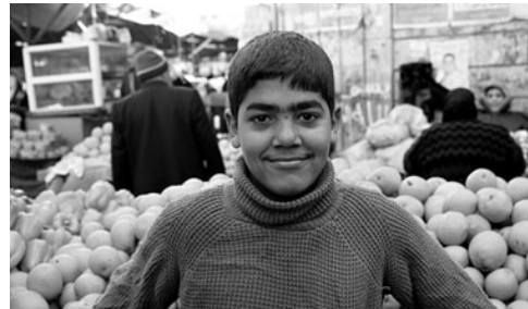
Ramallah market

The Palestinian service sector accounts for nearly 83% of GDP, and employs 56% of the workforce in the West Bank and 79% of the workforce in the Gaza Strip. 308, 309 Social services, healthcare, and government are the key service components. Government accounts for more than one-quarter of the