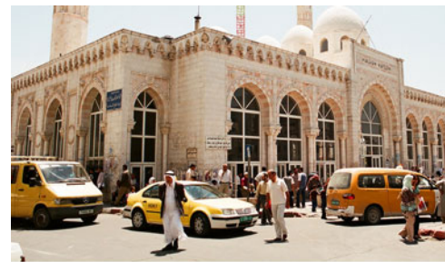
Mosque in Ramallah

Islam is a monotheistic religion, meaning that its followers believe in a single deity. The Muslim community, or umma , calls this deity Allah. The Arabic term islam means “to submit” or “to surrender.” Therefore, a Muslim is one who submits to the will of Allah. 339 Muslims believe that Allah revealed his message to the Prophet Muhammad, a merchant who lived in Arabia from 570 to 632 C.E. They consider Muhammad to be the last in a long line of prophets including Abraham, Moses, and Jesus. Allah’s message, as relayed by Muhammad, is delivered in the Quran, the sacred text of Islam. Additional doctrinal guides include the Hadith , a collection of the sayings of Muhammad, and the Sunna , which describes the practices of Islam by way of Muhammad’s example. 340, 341