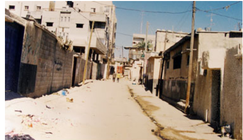
Open sewers in refugee camp

The major environmental concerns facing the Palestinian Territories relate to the availability of fresh water, which is inadequate to provide for the needs of the Palestinian people. Compounding the matter is the increasing salinity of aquifers, poisoning what little fresh water does exist. Improper sanitation in the major cities and refugee camps has further contaminated water resources. Recurrent droughts, soil degradation, and desertification also have been problematic. 163, 164