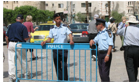
Police officers in Bethlehem

One provision of the Declaration of Principles ("Oslo Accords") signed in 1993 by Israel and the PLO was to amalgamate more than a dozen Palestinian forces from the various militant and terrorist organizations into a national security force under the auspices and command of the Palestinian Authority. But most of these paramilitary groups retain their membership in and their loyalty to the various organizations (e.g., Fatah, al-Aqsa Martyrs Brigades). Hamas' military wing serves as the sole security force for the Gaza Strip. 455, 456