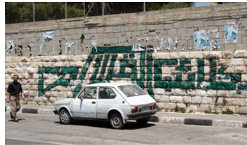
pro-Hamas graffiti

Formed in 1987 at the beginning of the First Intifada, the group is based primarily in the Gaza Strip. Hamas seeks to liberate Palestine and create an Islamist state under shari'a law. Its armed wing, the Izz al-Din al-Qassam Brigades, was established in 1992. Under the political leadership of Khaled Mashal, Hamas seized control of the Gaza Strip in early 2007, after the fighting that emerged when Hamas won the 2006 Palestinian legislative elections. The de facto Hamas government for the Gaza Strip is headed by Ismail Haniyah. Although the group's political leaders had been based in Damascus since 1999, the unrest in Syria forced them to relocate to Doha, Qatar, and Cairo, Egypt. Hamas receives most of its funding, training, and resources from Iran and Syria via its connections with Hizbullah. 484