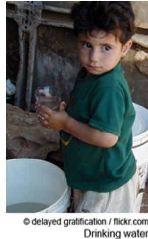
Drinking water

Another subterranean water source, the mountain aquifer, lies east of the coastal aquifer beneath the Samarian Highlands and Judaeen Hills. Much of the mountain aquifer recharges itself, but many of the natural discharge areas lie within Israel. Thus, a high percentage of mountain aquifer water is used by Israel, which has been an ongoing concern for the Palestinian Authority. This fact has severely complicated efforts to establish an Israeli-Palestinian peace. 21