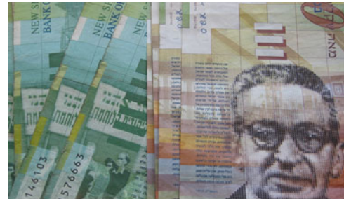
Israeli New Shekels

Since Hamas seized control of the Gaza Strip in 2007, Israeli banks have withdrawn from business in the Palestinian Territories and are severely restricted in their business with Palestinian banks. This has shaken the Palestinian financial market and essentially rendered the ILS not viable in the Palestinian Territories. 329 The banking situation in the Gaza Strip is highly unstable. In March 2010, Hamas militants raided a Bank of Palestine branch and seized a reported USD 400,000. As a result, at least one international bank closed branches in the Gaza Strip. 330