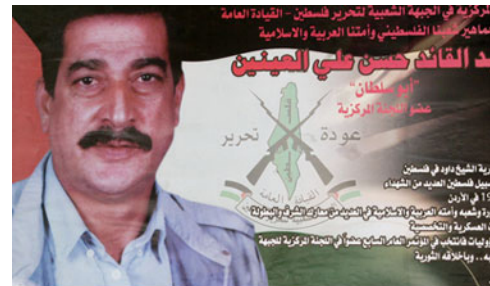
PFLP-GC poster

Also known as the Jihad Jibril Brigades, this group formed in 1968 when Ahmed Jibril rejected the PFLP's more moderate position on negotiating with Israel. The Syrian-based organization operates primarily out of Lebanon and is active in the refugee camps there. 499 The group espouses a Pan-Arabist, nationalist, left-wing ideology. It has been active in Libya and Egypt, and conducted attacks in Scandinavia and Germany. The PFLP-GC pursues training with other groups and is thought to have received flight training from Libya