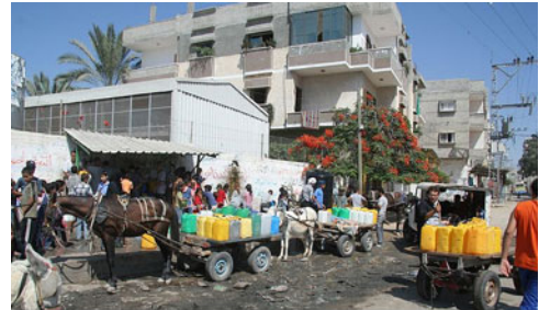
Khan Yunis

The city is a major commercial center located in the southcentral sector of the Gaza Strip along the ancient trade route to Egypt. Including the population of the refugee camp of the same name, the Khan Yunis community is the second-largest Palestinian city, with an estimated 200,400 residents. 29 The official refugee numbers account for nearly 72,000 of that figure, roughly 36% of the population. 30