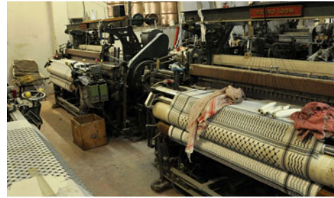
Textile factory

The industrial sector employs 16% of the Gazan workforce and 28% of the West Bank workforce. It provides nearly 14% of the Palestinian Territories' GDP. Major industries include food processing, quarrying, small-scale manufacturing, souvenirs, and textiles. 302, 303