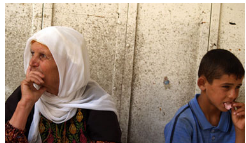
Palestinian poverty

Unemployment rates in the West Bank and the Gaza Strip are among the highest in the world. More than 24% of the workforce in the West Bank and about 40% in the Gaza Strip are unemployed. Of 199 countries (Monaco is ranked 1st with an unemployment rate of 0%), the West Bank is ranked 171st and the Gaza Strip is ranked 185th. 333 The unemployment rate is higher among those