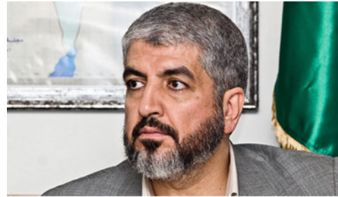
Khalid Mishal

Although Jordan has frequently served as an intermediary in Palestinian-Israeli negotiations, the Jordanian government is adamantly anti-Islamist and has pursued a hard-line position against Hamas. But in the wake of talks between Jordan's King Abdullah II and Hamas leader Khalid Mishal in early 2012, the prospects of warmer relations between Jordan and Hamas have arisen. 426