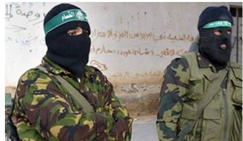
Hamas Terrorists

Yasser Arafat, long the face of the Palestinian liberation movement, died on 11 November 2004 from a brief but acute illness. Shortly thereafter, Mahmoud Abbas, Arafat's successor as chairman of the PLO, was elected president of the Palestinian Authority. 272, 273