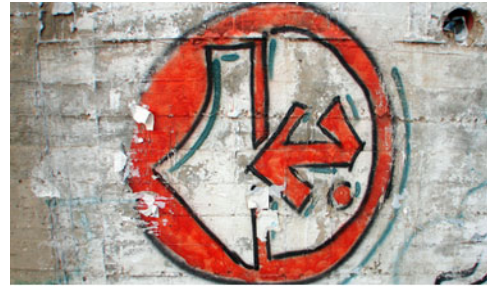
PFLP graffiti in Nablus

One of the older Palestinian terrorist organizations, the PFLP was formed by George Habash in 1967. Its military wing is known as the Abu Ali Mustafa Brigades. The group espouses a secular, Marxist-oriented ideology that envisions the destruction of Israel and a social revolution based on Palestinian self-determination. Their belief is that such a situation will usher in a utopian democratic society. The group receives aid from Syria and Iran, and has historical connections with Iraq and Libya as well. 493