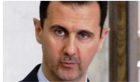
Syrian President Assad

The turbulence gripping North Africa and the Middle East in the aftermath of the Arab Spring of 2011 has created an unstable and unpredictable environment throughout the Levant. Palestinian terrorist organizations that have historically relied upon Syria for funding and arms face the uncertainty of whether such support will continue if the Assad regime falls. 505