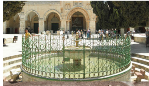
Al-Aqsa Mosque

By 638, Arab Muslims were pushing into the territory and gradually wrested control from the Byzantines. Beginning in 661, the Umayyad caliphs ruled Palestine from Damascus. During this time, the Muslim rulers constructed the Dome of the Rock and the al-Aqsa mosques, both built upon the ruins of the Jewish Temple. 176, 177