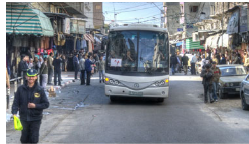
Gaza City

This city serves as the administrative center for the de facto Hamas government that currently controls the Gaza Strip. Located on an important trading route connecting Egypt with Palestine and points beyond, Gaza has a long history as a crucial port. Control of the city has changed hands among the various empires of the ages including the Egyptians, Assyrians, Babylonians, Greeks, Romans, Byzantines, Arabs, and Israelis. The city fell to the Ottomans in 1517. Still, its proximity to Egypt provided close cultural ties, and the city and surrounding area served as a frequent sanctuary for Egyptian political dissidents. With the dismantling of the Ottoman Empire in the aftermath of World War I, the city came under the control of the British, who had seized it following the Third Battle of Gaza on 7 November 1917. 22 It became an