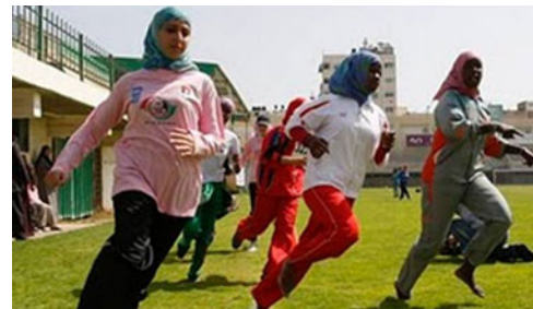
Soccer in Gaza

Since 1996, the Palestinian Territories have officially competed in the Summer Olympics. Although competitions between Palestinian and Israeli teams have been strained since Palestinian terrorists massacred Israeli athletes during the 1972 Olympic Games in Munich, today Israel trains Palestinian