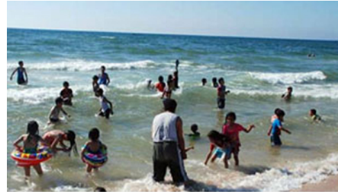
Gazans at the beach

The coastal plain extends all along the Gaza Strip coast, with the widest portion extending 40 km (25 mi) inland. Most of the people in the Palestinian Territories live in this region. 7