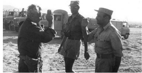
Egyptian and Israeli Generals

On October 6, 1973, in a surprise joint attack upon Israel launched on a major Jewish holiday, Egypt and Syria pushed into the Sinai and Golan Heights. Israel responded by driving the Syrians back to the outskirts of Damascus and cutting off the Egyptian Third Army in the Sinai—significantly weakening the Palestinians’ staunchest supporters. 258