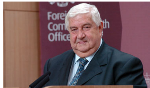
Syrian FM al-Muallem

Syria hosts about 500,000 Palestinian refugees in a dozen UN-administered camps. 445 During its 29-year military presence in Lebanon until 2005, and then through its intermediaries therein, Syria funded and armed numerous Palestinian terrorist groups operating in southern Lebanon. 446, 447