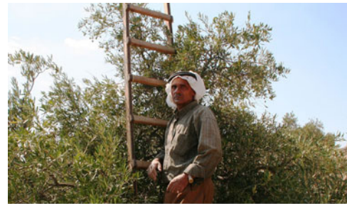
Olive Harvest near Nablus

According to the Palestinian Central Bureau of Statistics, more than 72% of imports in 2008 were from Israel. 319 The main imports were chemicals, consumer goods, construction materials, food, and petroleum, totaling USD 3.6 billion. The most important export commodities comprise fruit, olives, stone, and vegetables; however, they only generate about USD 518 million, leaving a trade deficit of more than USD 3 billion. 320, 321 For the 2008 fiscal year, foreign direct investment was a mere USD 1.34 billion. The security issues plaguing the region make it unlikely that this situation will improve soon. 322