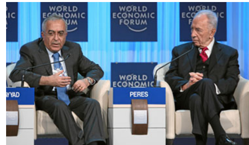
Fayyad and Peres

Relations between Israel and the Palestinian Authority have been a source of mutual frustration and animosity, but have progressed some over the years. Yet the relations between Israel and Hamas remain tenuous at best. Because Israel does not consider the Palestinian Territories an independent state and the Territories do not operate as such, it is difficult to characterize Palestinian-Israeli relations as those between two independent states. Rather, their interactions are currently more akin to the internal relations between two entities (or three, given