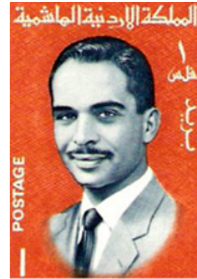
King Hussein of Jordan

In a pre-emptive strike in June 1967, Israel attacked gathering Arab forces and destroyed the Egyptian air force on the ground. Occupying the Sinai Peninsula, the Gaza Strip, the West Bank, and the Golan Heights, the Israeli Defense Force also delivered a major blow to Palestinian aspirations for an independent state. At the subsequent Khartoum Conference of August–September 1967, Arab delegates rejected a secret Israeli offer to return the occupied territories in return for a peace agreement. 247, 248