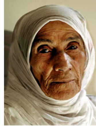
Elderly woman

Although Palestinian athletes' movements within and out of the Territories are restricted by the Israeli occupation, the Palestinian Territories have fielded Olympic teams. Professional soccer is the most developed sport.