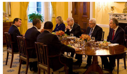
Middle East meeting

Within minutes of the establishment of the modern state of Israel, the United States recognized the new nation. 407 From that instant, the United States has long been an ally of Israel and has played a leading role in negotiations between Israel and Palestinian factions, especially the Palestine Liberation Organization (PLO) and later the Palestinian Authority. Today, as part of the so-called “Quartet”—the European Union, the United Nations, Russia, and the United States—American diplomats have actively sought the means to bring