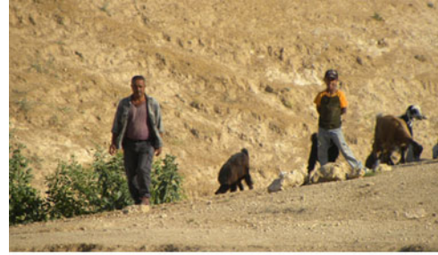
Palestinian shepherds

Agriculture, once the backbone of the Palestinian economy, accounts today for about 4% of gross domestic product (GDP) and employs about 16% of the workforce in the West Bank and 5% in the Gaza Strip. 296 The loss of territory in the 1948 Arab-Israeli War, along with Israeli-imposed restrictions on water usage and access to markets, have contributed to agriculture's decline. About 17% of the land in the West Bank and 29% of the land in the Gaza Strip are suited to growing crops. Major agricultural products include beef, dairy, flowers, fruit, olives, and vegetables. Agricultural exports are primarily flowers, fruit, olives, and vegetables, most of which are sold in the Israeli market. 297, 298