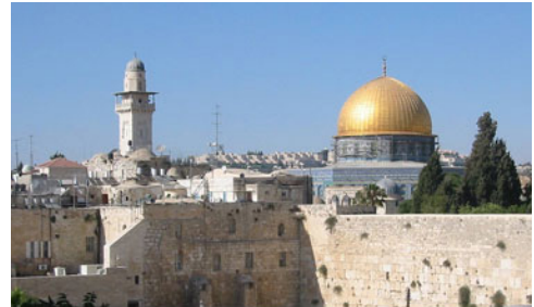
Dome of the Rock

Egyptian mastery over Palestine continued for more than two centuries until 1517, when the Turkish Sultan Selim I conquered Mamluk Egypt, including Palestine. He