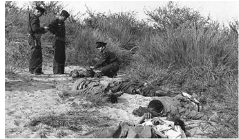
Operation Black Arrow

The Law of Return, passed by the Israeli parliament (Knesset) in 1950, declared the right of all Jews to immigrate to the new Jewish state and provided assistance with settling therein, profoundly altering the demography of Israel and creating a need for additional land. 237 To the detriment of the Palestinians, infighting among the Arab states further weakened hopes of regaining independence. Following rumors that Lebanon and Jordan were discussing a joint peace agreement with Israel separately from their Arab allies, Palestinian militants assassinated Jordan's King Abdullah I in 1951 while he visited the al-Aqsa Mosque in Jerusalem. This drove a wedge between the Jordanian monarchy and the country's large Palestinian refugee community. 238, 239, 240