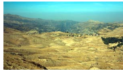
Bekaa Valley

Soon after war broke out in 1914, Mount Lebanon lost its autonomy when the Ottomans placed the mutasarifyya under direct rule. A blockade on the eastern Mediterranean cut off the Lebanese ports from food supplies, while 2 years of poor harvests and locust swarms struck the country. As many as 150,000 to 300,000 people died from the resulting famine. 134