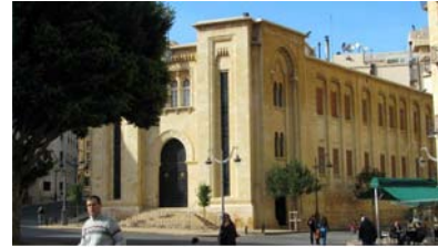
Parliament building, Beirut

In 1926, Greater Lebanon's Representative Council, an elective body, ratified a national constitution. 136 Although it has been amended numerous times since its ratification, this document continues to provide the framework for Lebanon's government. Article 95 of the constitution proved important in Lebanese history, because it guaranteed that "temporarily" Lebanon's religious communities "[would] be equitably represented in public employment and in the composition of ministries." 137