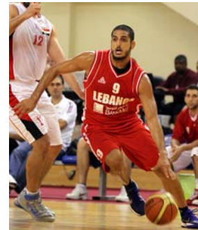
Lebanese basketball player

Lebanon loves football (soccer), the national sport. The Lebanese Premier League, the nation’s highest level of competition, fields 12 teams. 328 Each team has a sectarian identity aligned with the religious affiliation of the team’s ownership. Because of increasing crowd violence during weekend matches, the Lebanese Football Association banned spectators from 2007 to 2012. Instead, games were played in front of television cameras in eerily quiet stadiums. Though the ban has been partly lifted, crowds are carefully screened before entering the stadium, and it is not unusual to see only a few hundred people in the stands. 329, 330