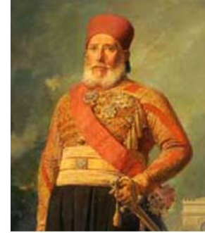
Portrait of Ibrahim Pasha

A turning point for Lebanon came in 1831, when the forces of Ibrahim Pasha, the son of Egyptian viceroy Muhammad Ali, occupied the Syria-Lebanon region as part of a campaign of military expansion against Ottoman rule. During the next decade, tensions elevated between Lebanon's Maronite and Druze communities. A contributing factor was Ibrahim Pasha's policy of conscripting Maronite and other Christian villagers to help fight against rebellious Druze populations in Syria. 125 Ottoman forces (with British assistance) ultimately turned back Pasha's army in 1840. Although Druze and Maronite forces had united against Pasha's forces in 1840 (prior to the Ottoman/British intervention), policies implemented after his defeat led to further sectarian strains between the Druze and the Maronites. 127