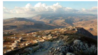
View over Nabatiyé

This predominantly Shi'ite capital city of the Nabatiyé Governorate is located in the southern section of the Lebanon Mountains, near the point where the Litani River turns westward in its final stretch before reaching the Mediterranean. Nabatiyé is a market town for the surrounding countryside, which traditionally has been Lebanon's primary tobacco-growing region. 62 During the July–August 2006 Israel-Hizballah conflict, Israeli missiles and bombs either destroyed or heavily damaged 100 buildings in Nabatiyé and its surrounding region (based on United Nations satellite data). 63