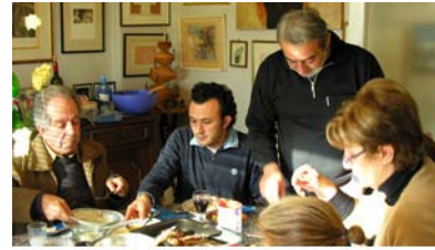
Family dinner

Being associated with an organized religious sect is crucial in Lebanese society. Children born to parents of different religious sects are assigned to the sect of the father. In addition, a child born to a Lebanese woman and a non-Lebanese father is not considered a Lebanese citizen. Yet the child of a Lebanese father and a non-Lebanese mother does gain citizenship, as does the mother after 1 year of marriage. This law has been challenged by women’s rights activists, but its repeal faces an uphill battle because some sectarian groups fear that Lebanon’s religious demographic balance will be affected if the law is overturned. 304