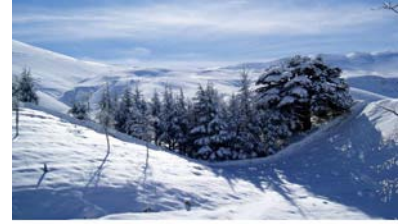
Winter in Lebanon

Winter temperatures range from mild along the coast to frigid at the highest altitudes. For example, Beirut has an average temperature of 14°C (57°F) during January, whereas the average January temperature in Bsharri (in the Lebanon Mountains at an altitude of 1,916 m [6,286 ft]) is only 0°C (32°F). 13, 14 During winter, snow falls on the higher peaks of the Lebanon and Anti-Lebanon mountains as well as in the Bekaa Valley, and often does not melt until early summer. 15