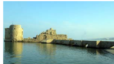
Citadel once Malmuk occupied

From the end of the 11th century through most of the 13th century, the eastern Mediterranean was the stage for a series of Christian Crusades. Tyre, Sidon, and Beirut were conquered and incorporated into the Kingdom of Jerusalem, while Tripoli became the capital of a Crusader county. During this time, the Maronites initiated links with the West, establishing ties with the Roman Catholic Church in 1182 and building strong