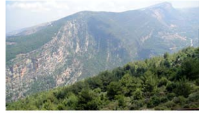
Mount Lebanon

transition to more of a hilly elevated plateau. 5 The highest peaks of the Lebanon Mountains occur in its northern section, topped by Qornat al-Saouda at 3,088 m (10,131 ft). 6 Dahr al-Baydar, a saddle section through which runs the main highway and railroad connecting Beirut to the Syrian capital of Damascus, divides the northeastern from the southwestern sections of the range. 7