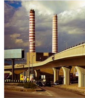
Power plant in Beirut

Lebanon lies in a region full of oil- and natural gas-rich neighbors, but it has no fossil fuel of its own. The nation does generate a small percentage of its energy needs through hydroelectric plants and the burning of biomass, but 97% of its energy and electrical consumption comes from imported oil products and a small amount of coal used to operate two cement factories. All of Lebanon’s oil is refined elsewhere, because the nation’s two refineries have been out of operation since the 2006 Israel-Hizballah war. 231 Lebanon has struggled in recent times to meet its electrical needs, forcing the government to make deals to buy excess electricity from other countries such as Egypt and Iran. 232, 233