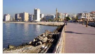
Waterfront of Sidon

To the south and east of the main part of Sidon lie two Palestinian refugee camps. One of these (Ain al-Hilweh) is the largest Palestinian camp in Lebanon, officially housing more than 50,000 people. It is called Lebanon's "most conflict-prone camp." 53, 54 Because Sidon is not nearly as large as Beirut or Tripoli, the Palestinian refugees are a sizable percentage of the city's Sunni majority. Some of the Sidon refugees have obtained Lebanese citizenship, thus enabling them to vote in local elections and making Palestinian concerns a prominent aspect of the city's political landscape. 55