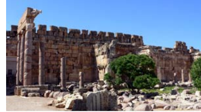
Ancient ruins at Baalbek

Lebanon's impressive ruins from ancient civilizations reflect the many peoples that have shaped contemporary Lebanese society. Unfortunately, diversity can contribute to divisiveness, and Lebanon's political crises, which usually erupt along sectarian fault lines, have frequently been displayed in recent decades.