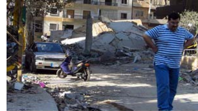
Destruction in Lebanon

Lebanon has been forced to deal with numerous internal and external conflicts and threats since independence. Foremost among the external security issues is the long-running Palestinian-Israeli conflict. Much of the violence of this political standoff has played out on Lebanese soil, which for more than 60 years has served as a base for a well-armed Palestinian resistance movement against Israel. Syria and Iran have been actively involved in Lebanese affairs as well, either through direct military intervention or by means of proxy Lebanese groups.