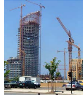
Development in Beirut

Much of the foreign investment that takes place in Lebanon is focused on three business areas: real-estate development, tourism (e.g., hotels), and banking. 267, 268 Some of this inflow occurs through “portfolio investment” in which foreigners purchase stocks in Lebanese companies listed on the Beirut Stock Exchange. This form of investment is particularly important for Lebanon’s financial sector. Of the 10 companies listed on the Beirut Stock Exchange, 6 are Lebanese banks. 269