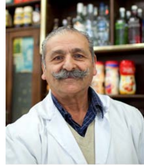
© Andrew McDaniel A shopkeeper in Lebanon

The 1975–1990 Lebanese Civil War significantly damaged Lebanon’s economy and nearly obliterated its infrastructure. Since then, the nation has slowly but steadily rebuilt its economy, though its progress has been reversed at times by periodic political crises, assassinations, and conflicts with Israel. Since 2007, Lebanon’s economy had shown steady growth, even during 2008 and 2009 when much of the world was affected by the global financial crisis. 198 But during 2011, Lebanon’s growth plummeted because of regional unrest and a domestic political crisis that led to a change in government. 199