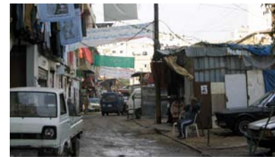
Palestinian refugee camp

The Palestinian refugee population within Lebanon is largely marginalized, with roughly half the refugees living in crowded "camps" mostly within or on the margins of the largest cities. Though the Palestinian refugees have made some legal advances in recent years in terms of private-sector employment opportunities, most Palestinians in Lebanon continue to lack access to state medical and educational facilities or to other state-provided social services. 378 Instead, these services are provided by the