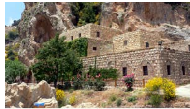
Khalil Gibran museum

Probably the best known writer of Lebanese origin is Khalil Gibran (1883–1931), who was born in the Maronite mountain town of Bsharri and immigrated to the United States as a boy. 310 His most famous work is The Prophet , a collection of prose poetry essays written in English and first published in 1923. It is estimated to have sold over 100 million copies since first publication, making it one of the most popular works of poetry in history. 311 Gibran was a talented artist, and many of his drawings illustrate his writing collections. 312