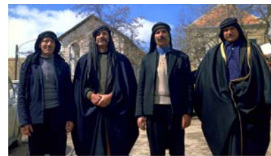
Men in traditional clothing

The hijab —the traditional head covering worn by many Muslim women—is common in Lebanese Muslim villages, but less so in urban areas such as Beirut. Nonetheless, mutual tolerance toward conservative religious dress or more revealing Western styles is characteristic of Lebanese society (for the most part). As frequently noted by foreign commentators, the bikini and the hijab are part of the landscape in many seaside areas of Lebanon. 307