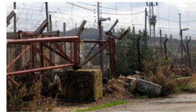
Lebanon - Israel border

Lebanon and Israel have never had formal foreign relations. The two nations have technically been at war for more than 60 years, because no peace treaty ever followed the 1948 Lebanon-Israel armistice. 351 Israel Defense Forces (IDF) have entered southern Lebanon on several occasions since 1948 to counter attacks launched by Palestinian guerrillas (and, in 2006, Hizballah forces) operating there. The area of southern Lebanon between the Israel-Lebanon border and the Litani River is now patrolled by the United Nations Interim Force in Lebanon (UNIFL). Many of the UNIFL forces in the area operate near the so-called Blue Line that represents the line of withdrawal of Israeli troops from southern Lebanon in May 2000.