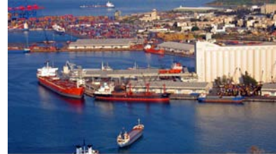
© Ghassan Tabet Trade ships at port in Beirut

Switzerland (the major jewelry and precious stones destination), the United Arab Emirates, France, and South Africa are the leading recipients of exported Lebanese goods in 2010. 242 Saudi Arabia, Turkey, and Syria are also important trade partners. 243