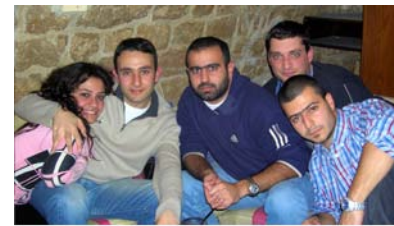
Youth of Lebanon

For most of Lebanon's population, language is not a divisive issue. The country's Christians and Muslims are Arabic speakers in overwhelming numbers. On the other hand, ethnic identity is controversial and contentious. Most Lebanese Muslims and some Lebanese Christians consider themselves as ethnically Arab. But others (mostly Lebanese Maronite Christians) trace their cultural identity to the ancient Phoenicians, and argue that the transition centuries ago to