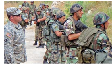
US and Lebanese soldiers

The United States and Lebanon have long had a strong relationship. One component is long-standing cultural ties, perhaps best symbolized by the American University in Beirut, Lebanon's premier institution of higher learning. But ties between Lebanon and the large Lebanese expatriate community in the United States play a role. Lebanon's government has followed a pro-Western stance in its foreign policy, particularly during the Cold War. 339