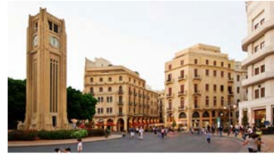
Downtown Beirut

But a devastating earthquake and subsequent tsunami in 551 C.E. began a decline in the city's fortunes. From 635 C.E. until the early part of the 20th century, the city was ruled by a series of Muslim dynasties, interrupted only by a 180-year span in the 12th and 13th centuries when Christian crusaders assumed control. 32