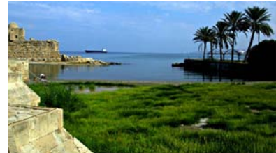
Coast of Lebanon

Along the coast is a narrow coastal plain, which only measures 6.5 km (4 mi) at its widest spot in the Akkar plain near the northern Lebanese border. Further south at Juniyah (just north of Beirut), the coastal plain narrows to just 1.5 km (0.9 mi). Lebanon's rocky shoreline offers no natural harbors or deep river estuaries. 1 The plain consists of river and marine sediments that sustain Lebanon's citrus orchards, most of which are in the southern and northern portions of the plain. 2, 3, 4