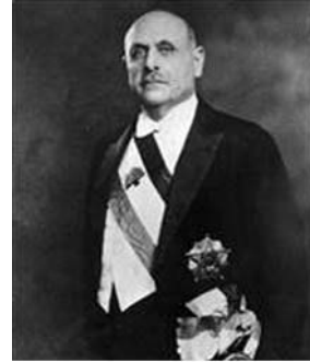
President Bishara al-Khouri

Bishara al-Khouri, a Maronite, served as Lebanon's first president. One of the more far-reaching events during his years of power was the 1948 Arab-Israeli war. Lebanon joined four of its Arab League neighbors in this conflict. After briefly crossing the Israeli border, the Lebanese battalions were forced back. An armistice was signed in March 1949, which closed the Lebanon-Israel border. Lebanon was left with roughly 140,000 Palestinian refugees after the 1948 war, a group that remains there today. 144