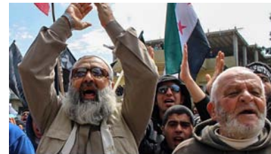
Sunnii men protesting

Lebanon's numerous religious sects (sometimes referred to as confessional groups) define the underlying basis of political power in Lebanon. Eighteen groups are officially recognized. 295 Four are branches of Islam, with the two largest being the Shi'ites and the Sunnis. The Shi'ites are the predominant sect in most of southern Lebanon, the Bekaa Valley, and areas in and south of Beirut. Sunnis are the majority in parts of North Lebanon, the southern Bekaa region, west Beirut, Tripoli, and Sidon. 296