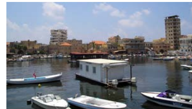
Waterfront of Tyre

Along with Sidon, Tyre was one of the two great Phoenician city-states lying in what is today southern Lebanon. The city was originally built on an island just off the southern Lebanese coast. Since 333 B.C.E., Tyre has been connected to the mainland via a land bridge built by Alexander the Great's engineers during a siege of the city. 56 Like its northern neighbor Sidon, Tyre was known in Phoenician times for its mollusk-derived purple dyes. Tyre's seagoing traders traveled throughout the Mediterranean region, often founding new trading centers in far-off lands. Many substantial ruins still exist in Tyre from the later Roman era. In 1984, these archaeological treasures were declared a UNESCO World Heritage site. 57