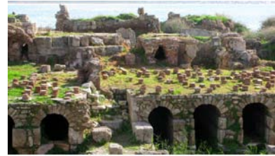
Ruins of Roman baths

During Lebanon's Roman Era, Phoenician fell out of use as the vernacular language, replaced by Aramaic. Among the educated, Greek was the scholarly language. Most of Phoenicia became part of the Roman province of Syria, although the important port cities of Sidon and Tyre were allowed to be self-governing. 102 The port cities' thriving trade within the Roman Empire and points east fueled a period of economic prosperity and construction of public works. During this time, the cities of Heliopolis (modern Baalbek) and Bertyus (Beirut) rose in prominence. 103 Today, the ruins of the elaborate Roman temple complex at Baalbek continue to draw visitors to the Bekaa Valley city.