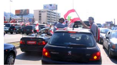
Cedar Revolution demonstration

The Syrian situation reached the point of crisis in February 2005 after former Prime Minister Hariri was killed in a car-bomb blast. Many Lebanese immediately suspected Syria of directing the assassination. Hariri opposed Syria's efforts to have Lebanese President Lahoud's term extended beyond its constitutional limit. According to a later UN Security Council report, Hariri had told some legislators 6 months before his assassination that Syrian authorities had threatened his life. 180