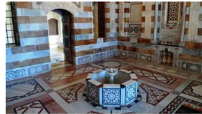
Inside an Ottoman palace

During three months in mid-1860, Lebanon witnessed the worst sectarian violence it had yet seen. What began as a class rebellion in the Maronite region of Kasrawan evolved into a bloody religious war that enveloped much of Mount Lebanon. Thousands of people perished, many of whom were Maronites, and hundreds of villages were razed. The 1860 violence was the culmination of intermittent sectarian fighting that started in 1841. 128 There were several causes for these sectarian rifts.