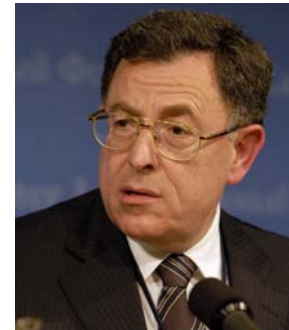
Prime Minister Fouad Siniora

After Syria's departure from Lebanon, the Lebanese political landscape divided into two groupings of political parties, one anti-Syrian and the other pro-Syrian. Over time, the former came to be known as the March 14 Alliance and the latter as the March 8 Alliance (both named after the dates of key rallies during the Cedar Revolution). Parliamentary elections in 2005 swept the March 14 partisans into power. Hizballah, a key member of the March 8 group, leveraged their enhanced political position after the war with Israel and threatened to topple the government of Fouad Siniora (elected Prime Minister by the March 14 Alliance) unless given a greater role in the government. 189, 190