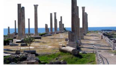
Greek ruins in Lebanon

Lebanon is a small country with an expansive history. The civilizations and empires that have marked Lebanon by either conquest or migration are giants in world history: the Phoenicians, the Greeks, the Ottomans, and the French, among others. But Lebanon as a separate, independent nation-state is a relatively recent entity. The struggle to find a national identity in a social and political structure that divides along sectarian lines is the theme of recent Lebanese history. But equally important is the role that neighboring nations and refugees have played in shaping conflicts that have plagued Lebanon since 1948.