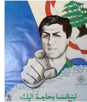
Poster of Bachir Gemayel

U.S. military forces (mostly Marines) and troops from several other Western nations entered Lebanon in August 1982 as part of a Multinational Force (MNF) overseeing the PLO's departure from Lebanon. Violent events that September in Beirut caused the MNF to be redeployed, with the land-based forces headquartered at Beirut International Airport. In April 1983, the U.S. Embassy in West Beirut was car-bombed by terrorists, leaving 63 dead. Just over 5 months later, the U.S. Marine barracks at Beirut International Airport was targeted in a car bombing, killing 241 Marines and wounding more than 100. 165