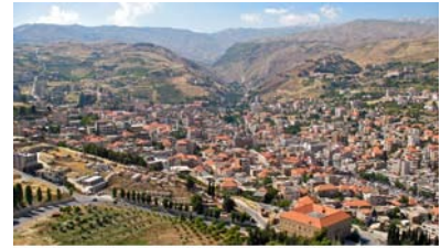
View over Zahlé

Zahlé is the largest city of the Bekaa Valley and the largest Lebanese city outside the coastal region. The city actually lies above the valley floor on the eastern side of the Lebanon Mountains, in a region known for its vineyards, wineries, and arak distilleries ( arak is an aniseed-flavored brandy, similar to the Greek ouzo and Turkish raki ). 59 In the summer, Zahlé serves as a resort for city dwellers, conveniently accessible via the Beirut-Damascus road that runs a few kilometers south of the city. The local population is primarily Christian, with Greek Catholics the dominant sect. 60, 61