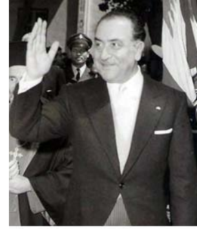
General Fuad Shihab