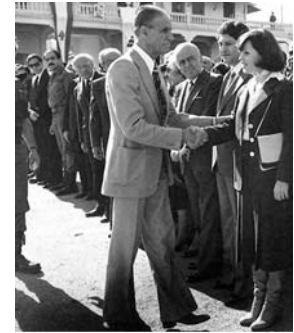
Pierre Gemayel

Today, the period between 1975 and 1990 is usually referred to as the “Lebanese Civil War,” although the extensive role played by non-Lebanese parties (e.g., Palestinians, Syrians, Israelis) made this conflict much more than simply a war between rival Lebanese factions. The beginning of Lebanon’s decade and a half of virtually unrelenting violence traces back to April 1975, after an assassination attempt on Pierre Gemayel, Bachir’s father. The Phalangists retaliated by massacring a busload of Palestinians. 156 Shortly thereafter, the streets of Beirut became a deadly war zone, with Muslim, Druze, Palestinian, and leftist forces on one side fighting against Christian Maronite militias on the other. The former groups were loosely associated and dubbed the Lebanese National Movement, while the latter (dominated by the Phalangists) called themselves the Lebanese Forces. The zu’ama , Lebanon’s long-time family bosses of the religious sects (who had always found common ground in order to preserve the traditional power structure) could not halt the fighting, nor could the government and army act. 157 Therefore, Lebanese citizens on both sides were forced to align with communal militias for protection. 158 Beirut in particular became deeply divided, with its neighborhoods run by local militia leaders. 159