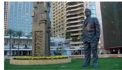
Rafik Hariri memorial park

(Traditionally, the prime minister position is reserved for a Sunni Muslim, not a Maronite like Aoun.) In early 1989, Aoun led the Lebanese armed forces in a military offensive against the Lebanese Forces, and subsequently the Syrian forces located in Lebanon. This led to some of the most intense fighting during the entire civil war. After the Taif Agreement was signed, Aoun refused to accept it because it allowed Syria to stay in Lebanon. Instead, he resisted his dismissal and once again battled the Lebanese Forces until a cease-fire was called in July 1990. 171 Three months later, Lebanese Government forces, with Syrian assistance, forced Aoun to surrender. 172 He went into exile in France a few months later. 173 With his departure, Lebanon's long civil war, a period of massive destruction and extensive loss of life, finally came to a close. 174, 175