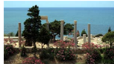
Ruins at Byblos

The Phoenicians spoke a common language, but they were far from unified. There was no Phoenician empire; rather, Phoenicia comprised a number of coastal city-states. 86 Among the most important of these Phoenician settlements were Byblos, Tyre, and Sidon. The Phoenician city-states emerge in the historical record around 1200 B.C.E., but ample evidence shows that these seaports had existed for centuries (or millennia in the case of Byblos) prior. For example, Byblos was exporting cedarwood, wine, and olive oil to the Egyptian pharaohs during the third millennium B.C.E. in exchange for gold and other items. 87, 88, 89