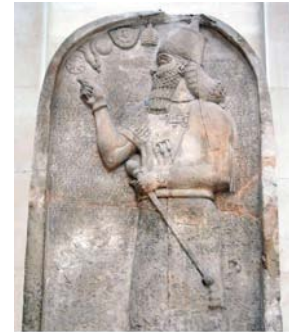
Carving of Assyrian king

But the Phoenicians' skills as traders, artisans, and seafaring navigators did not extend to military prowess. In addition, the fragmented city-states left each port city vulnerable to attack from large invading armies. In 877 B.C.E., one such army—that of Assyrian ruler Ashurnasirpal II—reached the Phoenician coast and placed the Phoenician city-states under a subordinate vassal status. 94 Over the following 270 years, the Phoenician cities periodically rebelled against Assyrian domination, with little success. The Assyrians destroyed Sidon in 676 B.C.E. for one such rebellion. 95