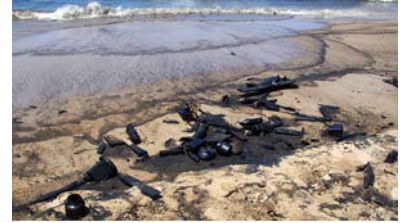
Oil spill on the Lebanese coastline

Lebanon is a highly urbanized nation, with an estimated 88% of the population living in cities. Half of this urban population lives in Greater Beirut, consisting of the city proper and its northern and southern suburbs. 75 One effect of this growing urbanization has been an increase in the pumping of groundwater from coastal aquifers to meet the water demands of the cities. As aquifer levels have fallen, saltwater intrusion has become a concern. Additionally, the amount of untreated sewage from coastal urban areas has increased because Lebanon's strapped budget has not allowed for the development of urban water treatment systems to keep pace with the growing amounts of wastewater and solid waste. 76 Adding further complexity to Lebanon's water issues is preliminary evidence that the nation's average snow and rain levels have been declining since the mid-1960s. Whether this decline in average precipitation is a result of global climate change is impossible to say, but the short-term effect has been decreased levels of flow in Lebanon's rivers and springs. 77