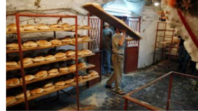
© Julien Harnais Bakery in Lebanon

Currently, the manufacturing and industry sector is estimated to represent between 11–16% of Lebanon's GDP. 222, 223 The biggest component is food and beverage processing, which accounts for about one-quarter of both the industrial sector's workforce and its total output. 224 Bakeries make up the largest share of the workforce in the food and beverage processing component. 225 Non-metallic mineral products—primarily construction materials such as cement, concrete items, and cut stone—are the next largest industrial component in terms of output, followed by fabricated metal products (the majority of which were structural metal items for the construction industry). These latter two categories, along with wood products, are usually combined as the building materials industry, and together they account for nearly 24% of Lebanon's industrial output. 226 Furniture construction is one of Lebanon's largest industrial/manufacturing components in terms of employment, but its overall contribution to total industrial output (6.7%) is relatively limited. 227