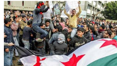
Syrian protesters in Lebanon

Certainly, Lebanese politicians and citizens for many years after independence did not believe that Syria had an interest in seeing a politically independent Lebanon. The Syrian government did not establish diplomatic relations with Beirut until 2008, the first formal move signaling that Syria recognized Lebanese sovereignty. 346