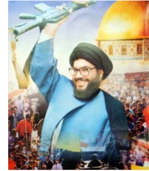
Poster of Hassan Nasrallah

more than four years later, indictments were handed down by the Special Tribunal, naming four members of Hizballah as part of the assassination plot. Hizballah leader Hassan Nasrallah immediately denounced the indictments, discredited the Special Tribunal's motives, and vowed that none of the four men would ever be arrested to stand trial. 375