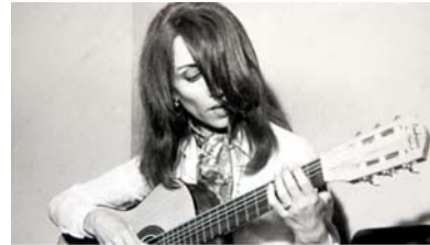
Fairuz playing guitar

Lebanon's most famous musical performer is the singer Fairuz (born Nuhad Haddad in 1933), who burst onto the Lebanese musical scene in the 1950s and became a household name after her first public performance at the Baalbek International Festival in 1957. By the early 1960s, she was a star performer not only in Lebanon but throughout the Arab world and beyond. For much her early career, she worked with Assi and Mansour Rahbani, brothers who composed the songs for the musical plays that she performed in. 319 During the war years (1975–1990), her song Behebak Ya Libnan (“I Love You, Lebanon”) became an anthem of hope. 320 Fairuz has continued to perform into the 2000s, often collaborating with her son Ziad Rahbani on songs that incorporate jazz stylings. 321