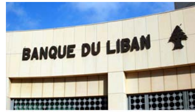
Bank of Lebanon

Lebanon's banks attract deposits in numerous foreign currencies, particularly U.S. dollars (USD). The Lebanese pound (LBP) is the national currency, although the ubiquitous USD is commonly used in retail transactions and has become a second currency within the country since its Civil War. Automated teller machines (ATMs) at banks and other locales dispense both currencies. 257