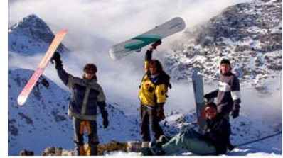
Snowboarding in Lebanon

Tourism is a major component of Lebanon's economy. The World Travel and Tourism Council estimates that Lebanon's tourism industry will supply USD 4.3 billion to the nation's economy in 2012, around 10% of GDP, and will directly employ 9.5% of the nation's workforce. 247 Tourist levels had been increasing until 2011, reaching nearly 2.2 million visitors in 2010 (roughly half Lebanon's total population). This number dropped by nearly 25% in 2011, in part because of the unstable political situation in Syria, which provides the only land border crossings into Lebanon. 248 Typically, nearly one-quarter of tourists visiting Lebanon arrive via Syrian border crossings. 249 The drop in the number of tourists led to an 11% drop in the hotel occupancy rate and a nearly 14% decline in average room rate, thus compounding the loss of tourism revenues. 250