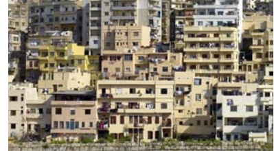
Apartments in Tripoli

But within this GNI figure lie regional disparities. For example, the North Lebanon and South Lebanon governorates have higher poverty rates than the rest of the country. 285 Though high poverty rates are often most common in rural areas (Lebanese rural areas, such as Akkar in the north, follow this trend), the city of Tripoli actually has one of the highest poverty rates in Lebanon. 286, 287 Tripoli's economic decline and widespread poverty has fueled social problems in its poorer neighborhoods and further heightened a violence-prone sectarian rift between the city's Alawites and Sunni Muslims. 288, 289