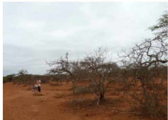
Denbella Saden in Yabero Flickr / Climate Change, Agriculture

67 In the Eastern and Western Lowlands (including the Danakil Depression), where elevations are generally below 1,500 m (4,921 ft), temperatures range from about 29°C (85°F) to an oppressive 50°C (122°F). Humidity can also be high in the lower regions of western Ethiopia, especially in the deep river basins. 68, 69, 70, 71, 72