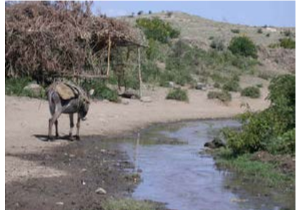
Awash River Basin

Pollution, especially in Addis Ababa, is a serious concern. 172 Most of the air pollution is caused by aging motor vehicles. 173, 174, 175, 176 In addition to air pollution, the capital is plagued by garbage and waste pollution. Garbage collection and disposal is a longstanding problem. About 35% of the city’s solid waste is never collected; rather, it is dumped wherever people find space. 177, 178, 179, 180 Water and sanitation problems are also severe. The current sewer system in the capital is woefully inadequate for the needs of an expanding population. 181 Approximately 60% of Ethiopians have no access to adequate sanitation facilities. 182 In Addis Ababa, roughly 4% of households have access to improved non-shared toilets. Ninety percent of households use non-improved toilets, including open pit latrines. About 26% of households in the city have no toilets, so residents must use rivers, ditches, and open spaces to dispose of human waste. 183, 184 Addis Ababa is home to over half of the country’s industrial activity. These businesses emit pollutants that enter waterways or the atmosphere. 185, 186