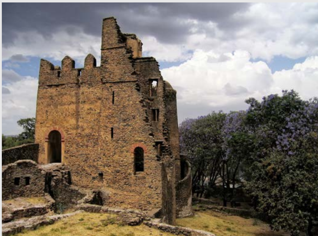
Fasil Ghebbi, Gondar