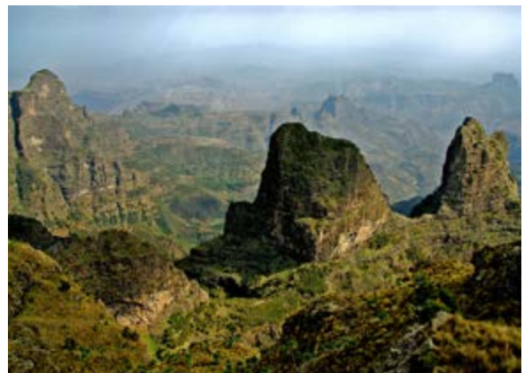
Simien mountains

The Ethiopian Highlands are usually described as a plateau region, but large parts of the region are mountainous. Ras Dejen is the highest peak in Ethiopia at 4,620 m (15,157 ft) rising in the Simen Mountains northeast of the city of Gonder in the northern Western Highlands. 50, 51, 52 The Bale Mountains, including Mount Batu and Tullu Demtu, tower over 4,000 m (13,123 ft) and lie to the south on the other side of the Great Rift Valley. 53, 54 The Choke Mountains lie between Addis Ababa and Lake Tana. 55, 56 Overlooking Ethiopia's sprawling capital of Addis Ababa is Mount Entoto. Although not one of Ethiopia's highest peaks, it is famous as the location of the palace of Menelik II, who moved his capital to the area in the 1880s, before becoming emperor. 57