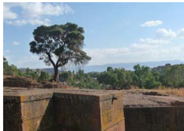
Church of St. George

Although Ethiopia has natural and cultural attractions that could form the basis of a strong tourism industry, the country's civil wars, droughts, famines, and conflicts with its neighbors have made it difficult for extensive tourism development to take hold. In 2011, only 523,000 travelers visited the country, placing it 17th in international visitors among African nations. 95 The primary cultural attractions are in the northern part of the Western Highlands in the ancient imperial capitals of Aksum, Gonder, and Lalibela. Lake Tana and its island monasteries are another attraction, as are the wildlife parks of the Great Rift Valley and the ancient walled city of Harer in the Eastern Highlands. 96, 97