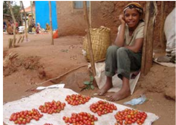
Oromo Girl with Tomatoes

Ethiopia is one of the world's poorest countries with a per capita income of approximately USD 370. 118 Even when measured against the rest of Sub-Saharan Africa, Ethiopia has an extremely low standard of living, ranking 173rd out of 195 countries. 119 Although progress has been made in eliminating poverty, in 2012 approximately 37% of Ethiopians survived on less than USD 1.25 per day. Roughly 72% managed on USD 2 per day. 120, 121 Some progress has been made in major indicators since 1980. Life expectancy is now at about 61 years (58 for men vs. 63 for women), and the mean years of schooling is 2.4. 122, 123 Less than half of the total population is literate. Only 57% of males and 41% of females over the age of 15 are able to read and write. 124