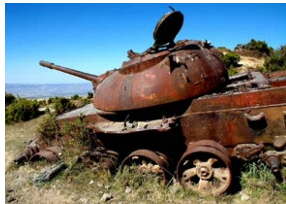
Remains of Civil War

Peace, unfortunately, did not last for long. In 1998, Eritrean forces occupied the Badme border region, which, like the rest of the Ethiopia-Eritrea border, has never been formally demarcated and was still claimed by both countries. 147 War broke out and lasted for more than 2 years. A peace agreement was signed in December 2000, but the underlying border issue has yet to be resolved and tensions between the two countries are still high, as reflected in cross-border incursions by both sides. 148