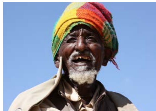
Tigray farmer

The Tigray, located mainly in northern Eritrea in Tigray province, have shared the political and military dominance of the empire with the Amhara. Every ruler since Menelik I was either an Amhara or a Tigray. 49 50 Their language is Tigrayan (Tigrigna), a Semitic language. 51 Most Tigray are farmers and Coptic Christians. Churches are a central feature of community and daily life. The Tigray are easily distinguished by their unadorned white clothing, which many still wear as a sign of their Christian faith. 52 Many Tigray live in Eritrea and, by some accounts, the leaders of the Eritrean independence movement mostly came from this group. 53