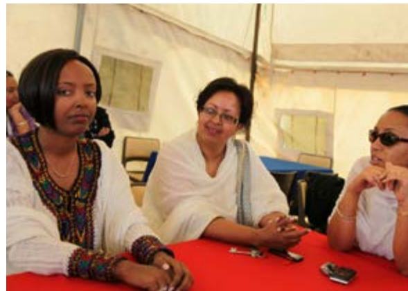
ILRI Addis Staff Traditional Dress

Western-style clothes are common in cities, but traditional clothes are worn in the countryside. 128 Clothing in the cooler highlands tends to be heavier, while in the warmer lowland regions light cotton is common. 129 A universal item of clothing for Ethiopians is the shammas , a type of cotton shawl. 130, 131 Shammas made from a heavier weave are known as gabis , whereas netellas are made from a light, gauze-like cotton fabric. On formal occasions, men wear the netella around their waist. Shammas are often white and bordered with colorful pattern pieces ( tilets ). 132, 133 White is also a common color for women's dresses ( abesha kemis ), as well as men's long shirts and accompanying trousers. 134