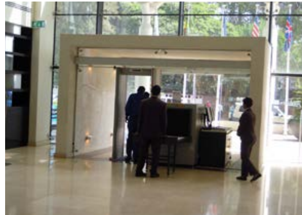
Security Check

the country is likely to remain stable in the short term. 183 Although concerned with human rights issues, the international community continues to support the current government. 184 In the most recent elections in 2015, the sitting EPRDF government emerged victorious. 185