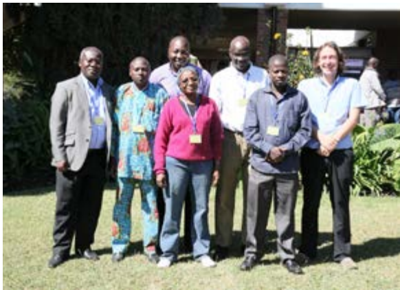
Agricultural Development Workshop Flickr / Climate Change, Agriculture

Formal relations between the United States and Ethiopia began in 1903. Since then, relations between the United States and Ethiopia have traditionally been close, except during the Derg years of the 1970s and 1980s. After the fall of the Mengistu ( Derg ) government in 1991, relations quickly improved and full ambassadorial ties were re-established in 1992. 13, 14, 15, 16 Since then, the U.S. government has spent hundreds of millions of dollars supporting the Ethiopian government and people with