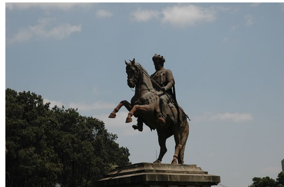
Statue of Menelik II

In the late 19th century, Menelik II, King of Shewa became Emperor and permanently moved the center of power to the Central Highlands, making Addis Ababa his capital. 66, 67, 68 The Ethiopian empire remained divided into the independent states of Tigray, Amhara, and Shewa until the middle of the 19th century. 69, 70 A new military leader, Kasa Haylu, gained control of the three regions from his base in Amhara. Shortly thereafter, Haylu was crowned Emperor Tewodros II, the first emperor in several centuries to lay claim to all three regions of a unified Ethiopia. 71,