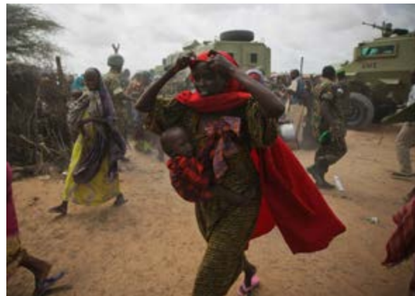
Famine in Somalia

Politically fractured Somalia is a major focus of Ethiopian foreign and military affairs. The Ethiopian government has deployed troops backing the Somali government. 79 Much of southern Somalia fell under the control of the Islamist insurgent group known as al-Shabaab. 80 Ethiopia worried that the group would threaten Ethiopia's stability, thus Ethiopian troops invaded Somalia in 2006, attempting to reinstate the Transitional Federal Government (TFG). 81 Although the attempt limited terrorist influence in the region, it was widely unpopular with the Somalis. Frustrated with inaction by the TFG, Ethiopia withdrew its forces in 2008, but reentered Somalia in 2011 to battle the insurgent group al-Shabaab. 82 Ethiopia's actions received mixed international responses, but by 2015, 4, 400 Ethiopian troops remained in Somalia as part of the African Union Mission in Somalia (AMISOM). 83, 84, 85