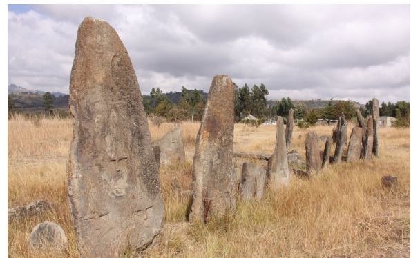
Bek'oji, Oromia

Ethiopia's upper Great Rift Valley has often been referred to as the "cradle of humanity" due to the number of important fossils discovered there. 16,17 The most famous of these discoveries occurred in 1974 in the lower Awash River valley, where the fossilized skeleton of a new species ( Australopithecus afarensis ) was unearthed. This fossilized skeleton has been dated to 3.2 million year old, and for