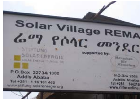
Solar Energy

Ethiopia presently has no oil or natural gas fields in production. Recently, a London-based oil company announced they had struck oil near the border with Kenya, and projected that Ethiopia could have 2 to 3 billion barrels of oil reserves. The company is also conducting explorations in the areas of Ogaden, Omo, and Gambella. 50 African Global Energy announced an oil and gas discovery in 2013. 52 The country has large reserves of oil shale, especially in the Oromia Regional State, which have captured the interest of various foreign companies. 53 A Brazilian oil company is also planning exploration in Ethiopia. 54 The Ethiopian government plans to form the Petroleum Development Enterprise to develop oil and natural gas reserves in cooperation with private firms. 55 Ethiopian-based Tullow Oil began drilling its first well in January 2013. 56, 57