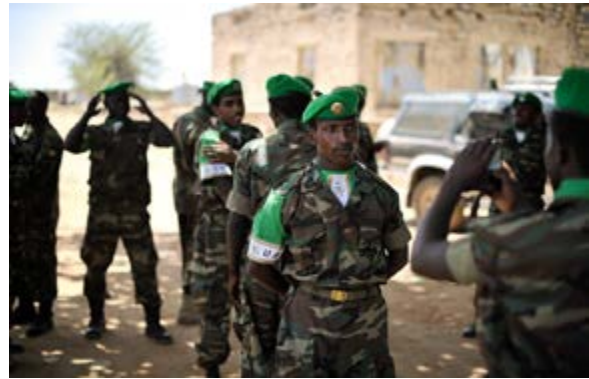
Ethiopian Soldiers

The Ethiopian National Defense Force (ENDF) is composed of four branches: the Ground Forces, Air Force, Police, and Militia. 118 With its approximately 182,000 personnel, it is one of the largest military forces in Africa. 119, 120 The Army (Ground Forces), with its estimated 150,000 troops, composes more than 80% of the entire ENDF. 121, 122 The persistent threats to national security, as well as the activity in Somalia, have helped the army maintain a high state of readiness with good rapid response capabilities. The army is also experienced in guerrilla tactics. Its air force, with approximately 2,000 troops, is charged with protecting national air space and supporting ground forces. In addition, it plays an active role in national emergencies. The Air Force has 81 fixed and rotary wing aircraft along with air-to-air missiles. The main operating base is at Debre Zeit, near Addis Ababa. 123, 124, 125 Morale within both the Army and Air Force is low and there are recent reports of numerous defections to Eritrea. 126, 127