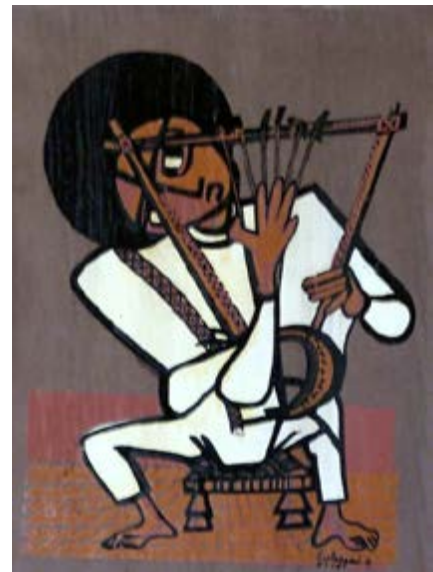
Paintings on Walls

Classical Ethiopian painting follows one of two styles: that of the religious tradition of the Ethiopian Orthodox Church and that of the secular folk art tradition. 161 Church wall-painting has a long history in Ethiopia, as far back as before the seventh century. A distinct characteristic of Orthodox Christian iconic imagery is its two-dimensional linear “folk” style. 162 Good characters are shown in full face, with both (overlarge) eyes visible. Evil characters are displayed in profile and have only one eye visible. Black lines clearly delineate the contours of characters. 163, 164, 165