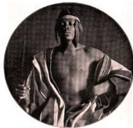
An Ethiopian Chief

Sometime around the seventh century B.C.E., people speaking the Semitic language Ge’ez established a community in the Northern Highlands, in the region now known as Tigray. 22, 23 Several hundred years later, an important kingdom emerged around the modern city of Aksum. 24 The Aksumite kingdom, which developed between the second century B.C.E and the second century C.E., was a trading center, facilitated by its ties to the Red Sea port of Adulis. 25, 26, 27, 28 Around the beginning of