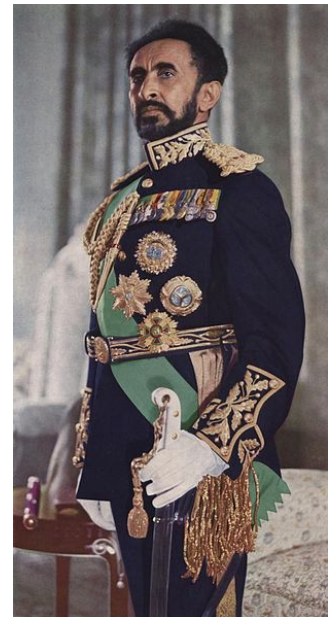
Haile Selassie

Italy, under Benito Mussolini, acted upon its ambitions to control Ethiopia. In October 1935, Italy invaded Ethiopia from its bases in Eritrea. In April 1936, the