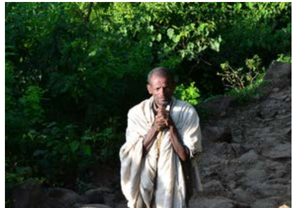
Amhara Man

The Amhara, members of the Cushitic people, are the second-largest ethnic group in Ethiopia. 34, 35 They trace their origins to Menelik I, the son of Solomon and the Queen of Sheba, although many regard this as more legend than fact. 36 Their traditional homeland is Ethiopia's central highlands plateau, and they are the dominant group in the Amhara National Regional State. 37, 38 The Amhara and the Tigray have dominated Ethiopia's political and military elite, except during the Italian occupation. Although their political power has waned since 1974, the Amhara remain a dominant force in the nation. 39 The Amhara are mostly Coptic Christians and have been since Christianity came to Ethiopia in about the fourth century. Their lifestyle has changed little in several thousand years. They are primarily farmers using oxen to plow their fields and relying on rain for water. 40, 41