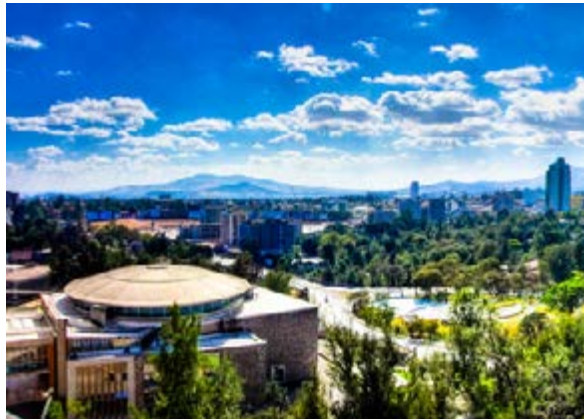
Addis Ababa skyline

Addis Ababa, the national capital, sits on a plateau about 2,400 m (7,874 ft) above sea level and is the third-highest capital city in the world. It is the fourth-largest city in Africa and the only city of any size in Ethiopia. Its population is greater than the combined population of the next nine largest cities. Addis Ababa, whose name means “New Flower” in Amharic, is barely 120 years old. 112, 113, 114, 115 It is the cultural,