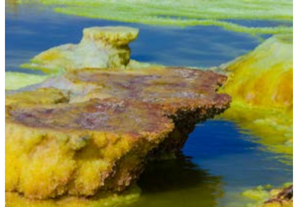
Danakil Depression-Afar-Ethiopia

At the other extreme is the Danakil Depression, a deep basin along Ethiopia's border with Eritrea. Not only is this one of the lowest locations in Africa at approximately 120 m (394 ft) below sea level, it is also a volcanically active area filled with fissures, lava lakes, geysers, and hot springs. Massive salt deposits in the Depression, left from the evaporation of an inland sea, are now a source of livelihood for the nomadic Afar people who eke out a living in this hostile setting. 58, 59, 60