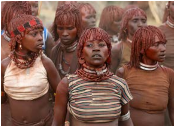
Ethiopian Tribes

Ethiopia is home to more than 70 ethnic groups, speaking 83 different languages that are subdivided into 200 dialects. 10, 11 The main ethnic groups include the Oromo (34%), the Amhara (27%), the Somali (6%), the Tigray (6%), the Sidama (4%), the Gurage (3%), the Welaita (2%), the Hadiya (2%), the Afar (2%), the Gamo (2%), and the Gedeo (1%). 12