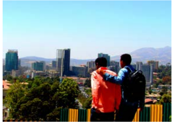
Ethiopia's Infrastructure

Continued economic growth also depends on reducing the nation's trade deficit and raising exports. Currently, Ethiopia's debt is equal to roughly 24% of GDP. 134 In order to accomplish these ends, Ethiopia must overcome several obstacles. The nation must increase its competitiveness on a global scale. Ethiopia must also improve its business climate in order to encourage more investment. Easing trade regulations could reduce transport, which would also improve margins and encourage more trade. Ethiopia has been able to keep inflation under control for the last two years and continuing to do so will be key to future growth. 135