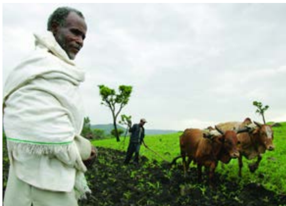
Ploughing with Cattle

Only 25% of Ethiopia’s arable land is under cultivation. Most farmers are small landholders who rely on rain for irrigation. 17, 18 Much of the nation remains highly vulnerable to drought, especially the area near the border with Somalia. 19 Grains are grown on over roughly 81% of the country’s acreage devoted to non-permanent crops. The primary grains are teff (a small-seed cereal that is similar to millet and used to make injera , an Ethiopian flatbread), maize (corn), sorghum, and wheat. Other