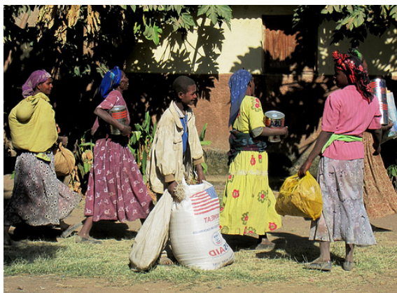
Ethiopians receiving help from USAID

Poverty-driven food shortages, recurrent drought, and soil degradation continue to afflict Ethiopia. 159 In 2001 drought forced the government to appeal for international food aid for over 3 million of its citizens. As the year progressed, the number of Ethiopians affected by the famine reached 4.5 million. In 2012, famine once again gripped the nation as the Belg rains, which usually occur between February and May, failed to materialize. Nearly 4 million Ethiopians were in need of humanitarian aid to survive. 160 The Somali region was the hardest hit, followed by Oromiya, Tigray, and Amara. Continued food shortages in 2013, led to social unrest, and in 2014, famine again threatened the nation after two years of below-average rainfall. 161 El Niño induced drought in 2015 led to further serious risk to the country's stability and by 2016, more than 10 million people required emergency food assistance. 162, 163