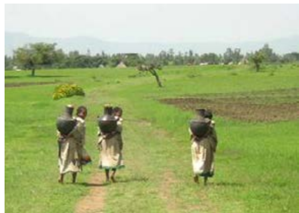
Ethiopian Women

Women occupy a low status in Ethiopia. In 2014, the nation ranked 127 out of 142 countries on the Gender Gap Index. 146 Despite constitutional guarantees of equal rights for men and women, considerable gender gaps persist in education, economic power, inheritance of property, and political participation. 147, 148, 149 The Ethiopian government has endorsed a policy of speeding up the process by which women can participate equally with men in society, in politics, and in the economy. 150