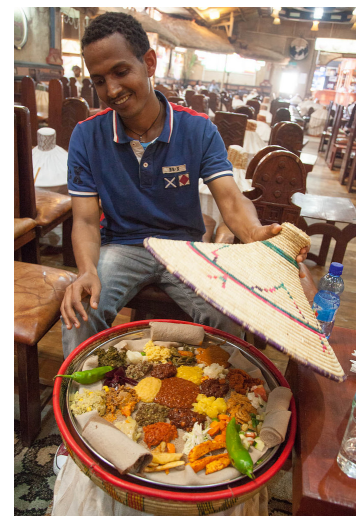
Ethiopian Cuisine

If there is a national dish of Ethiopia, it is wot , a thick stew containing meat or vegetables. 107, 108, 109 A key ingredient of qey (red) wot and other Ethiopian dishes is berbere , a red spice mixture containing chili peppers, ginger, cloves, allspice, cardamom, turmeric, cumin seeds, and other spices. 110, 111 A less spicy type of wot that does not include berbere is alitcha wot . 112, 113 Niter kibbeh , a clarified butter containing ginger, garlic, cardamom, and other spices, is also an essential element of