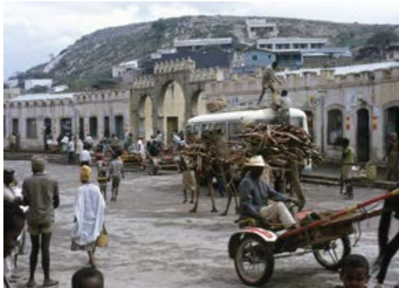
Dire Dawa

Dire Dawa, meaning “empty plain” in Amharic, is an apt description of the dry, mostly flat expanse north, east, and west of the city. 121 The city’s population is composed mainly of ethnic Oromo, Somali, and Amhara. 122, 123 Dire Dawa was a long-time caravan center. It began its modern development in 1904 when it became the rail terminus for goods from the port of Djibouti. Today, Dire Dawa exists primarily as a trading center for the surrounding region. Major industries include textiles, cement factories, and coffee- and meat-canning plants. 124 The Dechatu River divides the city and is prone to flooding during the rainy season between June and September. The worst flood in the city’s history occurred in August 2006, leaving 250 dead and 10,000 homeless. 125, 126, 127