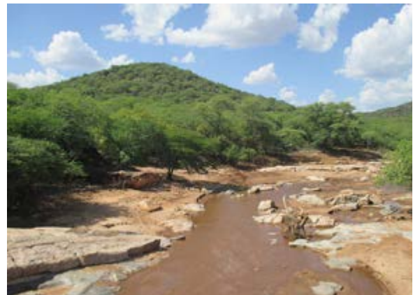
Dawa River

Some rivers in the Western Highlands flow eastward into the Great Rift Valley. The most important by far is the Awash River, which originates west of Addis Ababa and enters the Great Rift Valley near the city of Nazret. It then flows toward the northeast to terminate in Lake Abbe on the Djibouti border. 102, 103 The lower stretch of the Awash River is a world-renowned archaeological site where Lucy, perhaps the most famous hominid fossil (if no longer the most ancient), was found. 104, 105