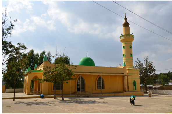
Mosque in Addis

Islam is a monotheistic religion and its followers believe in a one God. The Muslim community, or umma , uses the Arabic term for God, which is Allah. The Arabic term islam means “to submit” or “to surrender.” So a Muslim is one who submits to the will of Allah. 96 Muslims believe that Allah revealed his message to the Prophet Muhammad, a merchant who lived in Arabia from 570 to 632 C.E., through the angel Gabriel. They consider Muhammad as the last in a long line of prophets that includes Abraham, Moses, and Jesus. Allah’s message, as relayed by Muhammad, is delivered in the Quran, the sacred text of Islam. Additional doctrinal guides include the Hadith , a collection of the sayings of Muhammad, and the Sunna , which describes the practices of Islam by way of Muhammad’s example. 97