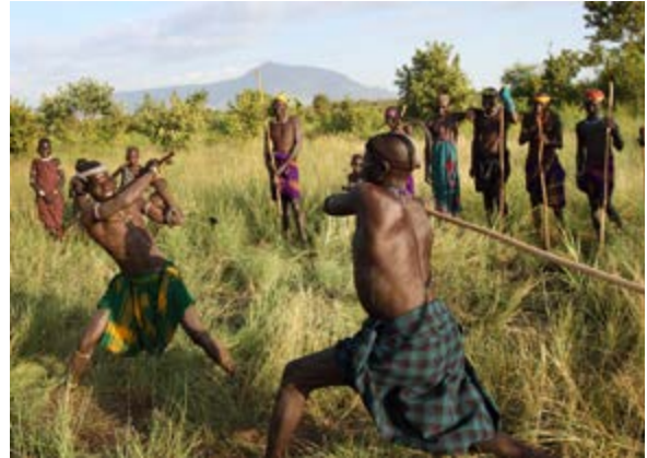
Ethiopian Tribes

The central Ethiopian government has long been dominated by members of the Amhara ethnic group. The present governing coalition, the Ethiopian People's Revolutionary Democratic Front (EPRDF), is an alliance of parties representing the Oromo Peoples' Democratic Organization (OPDO), the Amhara National Democratic Movement (ANDM), the Southern Ethiopian Peoples' Democratic Movement (SEPDM), and the Tigrayan Peoples' Liberation Front (TPLF). 134 Recognition of Ethiopia's ethnic diversity led to the creation of nine ethnic states or regions. According to the 1994 constitution, each of these regional states has the right to secede. 135 Most of the states remain somewhat autonomous, although they rely on the federal government for economic and security needs. 136 This situation has not freed Ethiopia of ethnic strife. 137, 138, 139 Armed insurgent groups have formed to protect their ethnic groups' interests.