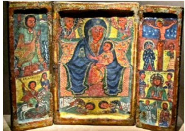
Three-piece Christian panel

Ethiopia may be the world's oldest Christian nation. 75 Some historians point to Biblical references that the apostle Matthew brought Christianity to the region. 76 According to established accounts, two brothers brought Christianity to the region early in the 4th century C.E. Shortly thereafter it became the official state religion. 77, 78, 79