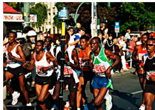
Ethiopian Runners

Like much of the world, Ethiopians are avid soccer players and fans. The Ethiopian national team (nicknamed the Walya Antelopes) has had limited success in recent decades. Until 2013, the team had not qualified for the African Nations Cup since 1982, and it has never qualified for the World Cup. 174, 175