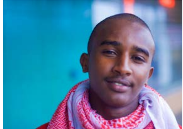
Somali Boy

The Somali people are located primarily in southeastern Ethiopia and have close associations with groups in Somalia. Nearly all are Sunni Muslims. 42, 43 Somalis trace their lineage through their fathers and are organized into clan-families, clans, lineages, and sub-lineages. 44 Because of lineal ties between Ethiopian Somalis and their relatives in Somalia, conflicts can spill across the border into Ethiopia. 45 The Ogaden National Liberation Front (ONLF) is a group of Somali nationalists fighting for self-governance in the Ogaden region of eastern Ethiopia. 46 They carry out ambushes and guerrilla raids against the Ethiopian military and are suspected of being involved in several bombings in Addis Ababa. 47, 48