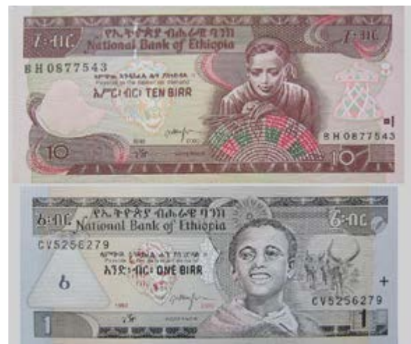
Ethiopian Bank Notes

Ethiopia's unit of currency is the birr (ETB). In May 2015, USD 1 was equal to 20.5 birr. 106 The birr is divided into 100 cents, with Ethiopian coinage based on units of 1, 5, 10, 25, and 50 cents. 107 The birr is one of Africa's most stable currencies, although it remains vulnerable to fluctuations against hard currencies such as the euro and the U.S. dollar. 108, 109