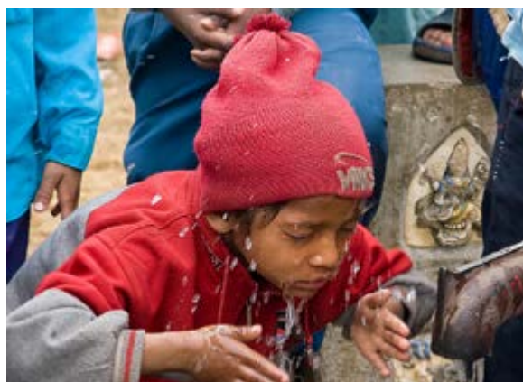
Water Security

Ethiopia is sometimes referred to as the "water tower" of Africa due to its significant number of rivers, including the Blue Nile. This river is a major tributary of the Nile River that flows through 11 countries. 166 The Nile Basin is home to 200 million people, and that figure is projected to double by 2030. 167 Egypt has historically controlled the bulk of water supplies in the Nile Basin. As early as 1957, Ethiopia declared that it would develop water resources under its sovereignty, though it lacked the technical expertise to divert Blue Nile waters. 168 Climate change is affecting both water and food security in Ethiopia, which depends on water access for irrigation and energy. 169 Water supply meets only about half the demand in the capital, which had less than 12 hours a day of water service in 2011. 170