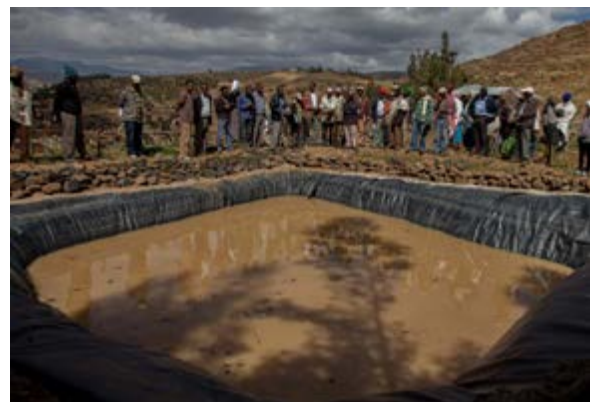
Water Harvesting Structure

Even the most casual observers of world affairs are likely aware of the devastating famines that have gripped Ethiopia in recent decades. Less well known is the political fallout from major drought/famine events. The famine of 1974 paved the way for the military coup that allowed the Derg to come to power. 156 The worsening state of hunger and food insecurity in the region is a potential source of instability. In 2011, the famine was referred to as “the most severe food security emergency in the world today” by USAID. 157 The situation continued through 2013, when Ethiopia rated at extreme risk on the Food Security Risk Index. 158, 159 In 2016, the nation continued to rank among the world’s least food-secure nations. 160