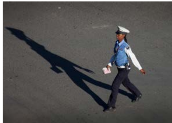
Community Police Officer

Ethiopia's 16, 700 -member Federal Police Force is under the auspices of the Federal Police Commission. 108, 109 Each of the nation's nine states also has a regional police force under civilian authorities. The total number of these regional forces is about 34, 000 . 110, 111 Local militias also operate with varying degrees of coordination and cooperation with the police forces. 112 The Federal Police play a major role in border security and internal security, particularly in counterterrorism. The Anti-Terrorism Task Force cooperates with the National Intelligence and Security Service (NISS). 113