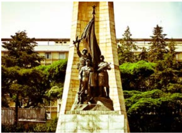
Derg Monument

In 1977-78, the Mengistu-led Derg leadership initiated a particularly brutal response to terrorist attacks being carried out by a rival socialist movement in the country. The Red Terror, as this governmental counteraction came to be known, resulted in the deaths of thousands of people. 124, 125, 126