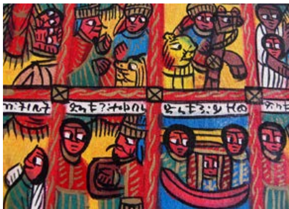
Ethiopian Painting

By 1960, Haile Selassie was entering his fourth decade of rule. Increasing discontent with the slow pace of economic development began to fester, especially among the country's college students. 109 An aborted coup d'état in 1960 was staged by the Imperial Bodyguard, but was quickly foiled by the country's military. This signaled that Haile Selassie's reign was increasingly vulnerable to challenge. 110 Student protests intensified during the decade; uppermost among the protesters' concerns were official corruption and the lack of progress on land reform. 111 A devastating famine in 1972-74 triggered a series of teacher, student, and taxi strikes, as well as mutinies in the country's armed forces. 112 Reforms were initiated, but they came too late to reverse the damage. 113, 114, 115