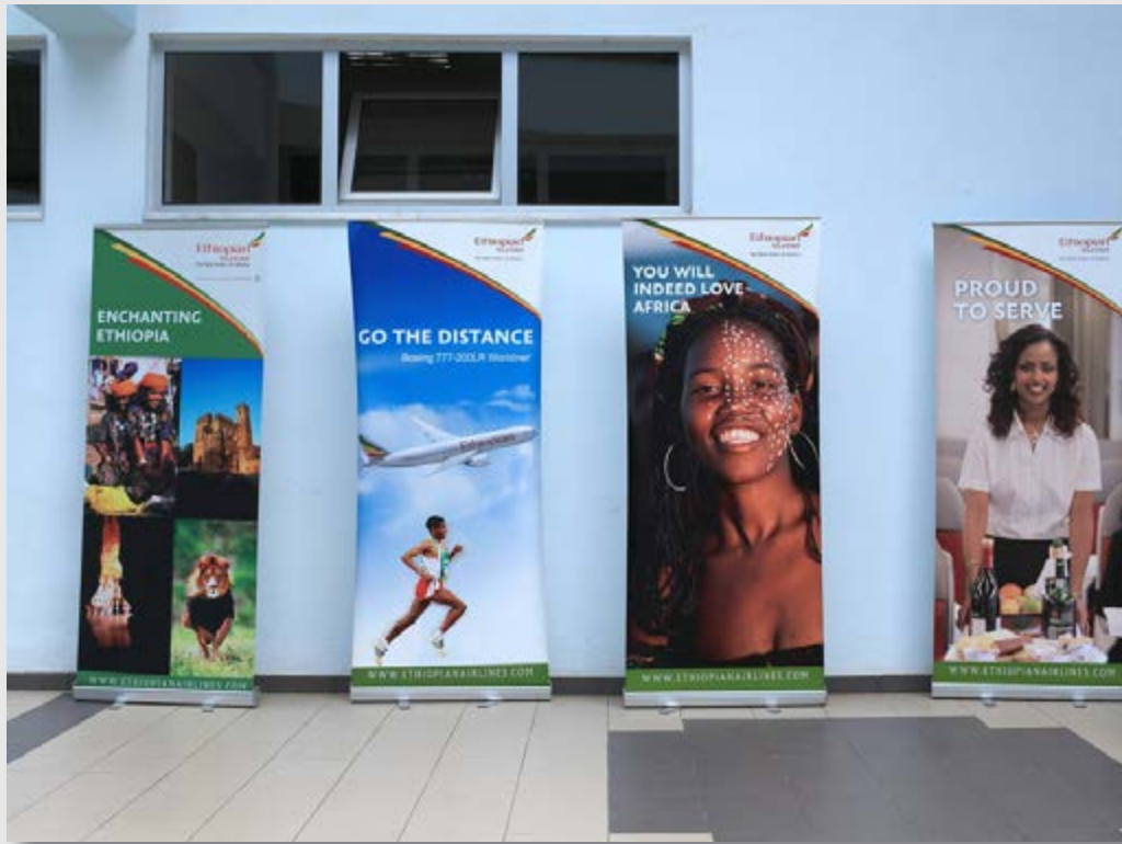
Ethiopian Airlines Formation center