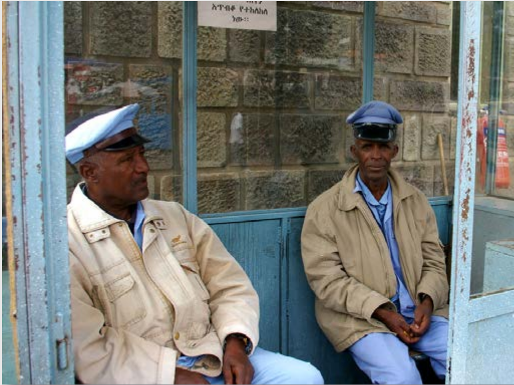
Security Men