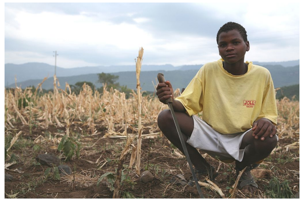
USAID Drought Response Flickr / USAID

Ethiopia is prone to flooding mainly linked to torrential rains. The deep canyons of some highland rivers, such as the Abay, prevent serious flooding in the upper stretches; yet, these and other rivers are prone to flood in regions where the banks are not as high. Flooding is more common in July and August, although flood season in the Gambella region falls between August and September. Heavy seasonal rains between March and June can also cause floods. 199 Several regions around the