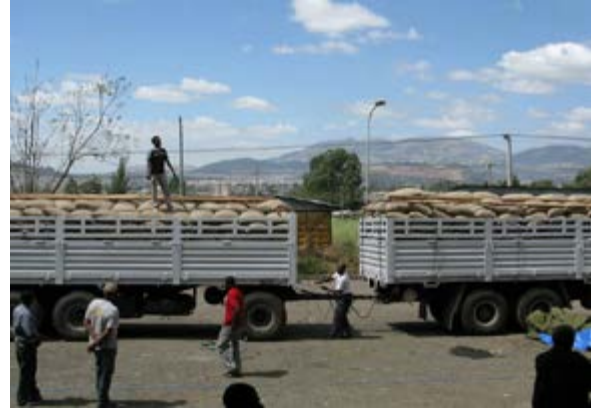
Export Kavy do Djibouti

Relations between Ethiopia and Djibouti are strong and deep. 25, 26, 27, 28 When Eritrea became an independent nation in 1993, Ethiopia lost its only Red Sea port access, but continued to use the port at Assab in Eritrea. 29 When tensions between the two nations erupted into war in 1998, Ethiopia lost all access and turned to Djibouti for a resolution. The Port of Djibouti became Ethiopia's access to sea trade and now handles 100% of Ethiopia's maritime traffic. 30, 31 Nearly 90% of the Port of Djibouti's imports and exports are Ethiopian in origin. 32, 33 The two countries are further linked economically by their joint ownership of the railroad running from Addis Ababa to Djibouti. Despite its close connection to Ethiopia, the Djibouti government tries to maintain a cordial relationship with Eritrea, which at times has proved a delicate balancing act. 34, 35, 36