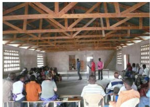
Ethiopian Delegates in Kenya

Although there has been frequent cross-border violence between rival ethnic groups in recent years, Kenya and Ethiopia have a long tradition of generally peaceful relations. 62 Today, they enjoy cordial bilateral relations due to a shared perception of threat posed by Somalia. 63, 64 Much of the border violence is related to the custom of cattle- and sheep-rustling by