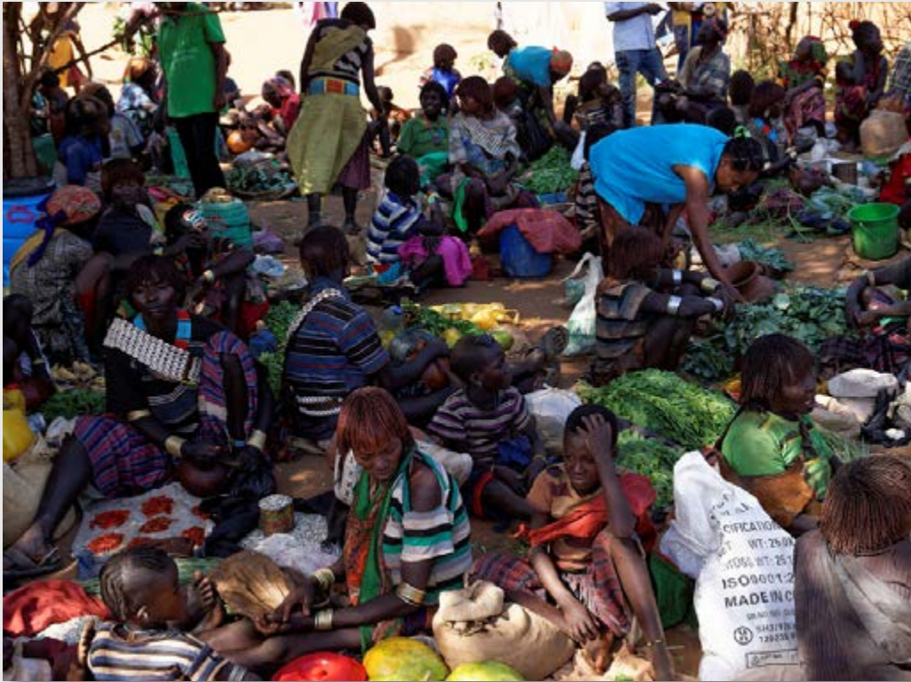
Jinka Market