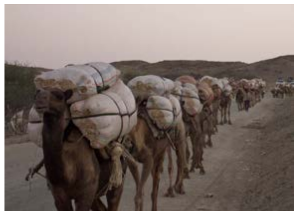
Salt Trade Caravan 38

Other products that bring in significant amounts of Ethiopian export revenues are oilseeds, leather, pulses, meat and meat products, fruits and vegetables, live animals, qat , gold, and cut flowers. 78 79 Approximately 38% of exports during 2013–14 were destined for Europe, with the largest markets in Switzerland, The Netherlands, and Germany. About 35% of exports went to Asian markets, with the largest shares going to China, Saudi Arabia, Israel, and the United Arab Emirates. About 23% of Ethiopian exports found their way