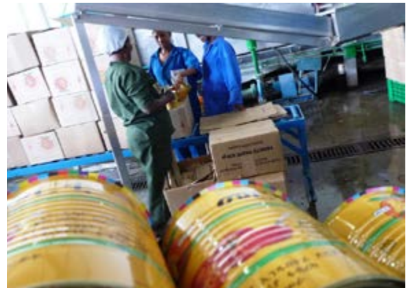
Tomato Canning

Ethiopia's industrial and manufacturing sector is quite limited, and accounts for only 10% of GDP and employs 18% of the labor force. 37, 38 The sector consists mostly of simple agro-processing activities and the production of basic consumer goods. 39, 40 The textile industry, employing approximately 30,000 people, accounts for 36% of the manufacturing sector. The major products include cotton and nylon fabrics, as well as acrylic yarns, woolen blankets, and sewing thread. 41 However, these products are of limited export value. 42 Leather (in the form of goat and sheepskin) is the only significant export. 43 Addis Ababa is the center of much of Ethiopia's industrial and manufacturing activity. 44 Other industries include food-processing, beverages, chemicals, metals processing, and cement. 45