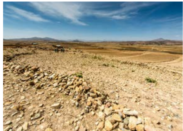
Adi Gudom Landscape

Ethiopia is roughly twice the size of Texas and has one of the most varied and rugged topographies in Africa. 18, 19 The country is divided into four geographic regions. Much of the nation is a high plateau, punctuated by mountain ranges and river chasms. This region, known as the Ethiopian Highlands, is further divided into western and eastern sections by the Great Rift Valley. Except for parts of the Great Rift Valley and some of the river canyons, the Highlands region lies above 1,500 m (4,921 ft). 20, 21, 22 The more extensive Western Highlands extend northward into eastern Eritrea. 23, 24 All of Ethiopia's population centers (including the capital, Addis Ababa) are located in this region. 25, 26 The Ethiopian Highlands are the nation's primary agricultural area. 27, 28, 29