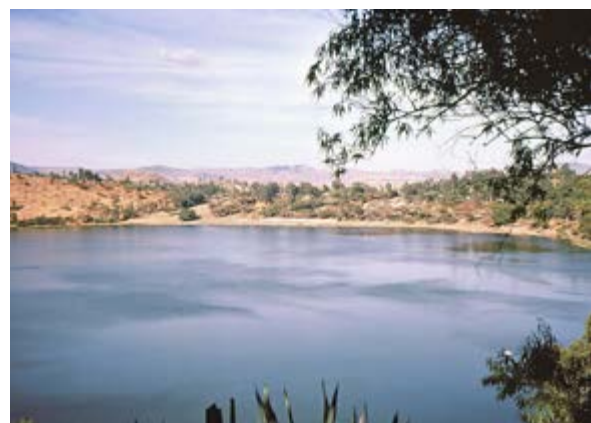
Debre Zeyit

Lake Tana, set within the northern Ethiopian Highlands south of the city of Gonder, is Ethiopia's largest lake. 89 It is famous as the source of the Blue Nile (Abay) River, which originates at the lake's southern end, near the city of Bahir Dar. This freshwater lake is a major fishery for the surrounding region. Within the lake are 37 islands, many with churches or monasteries. 90, 91