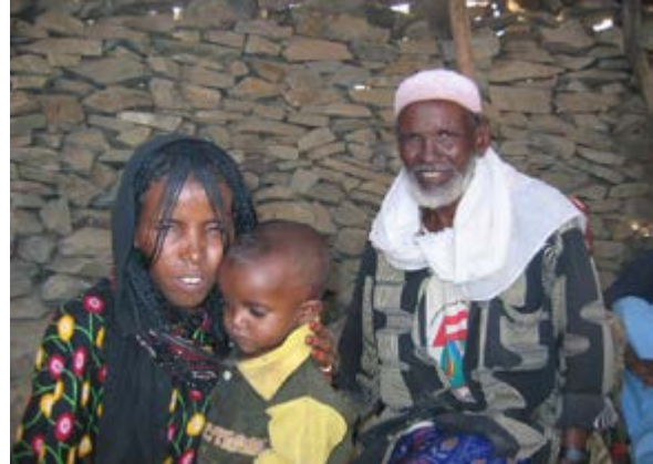
Afar tribe

was the dominant livelihood. Little is known of their origins, but there are two main divisions: the Red Afar ( Asayahumara ) and the White Afar ( Adoyahmara ). 55 Their language and culture share elements with the Somalis and the Oromos. 56 The Afar are mainly Sunni Muslims, although they continue to practice some of their traditional animistic beliefs. 57 As nomads, they spread Islam. 58 Though some remain nomadic, others have been forced to diversify their livelihood and adopt a sedentary life because of livestock losses from drought and other factors. 59