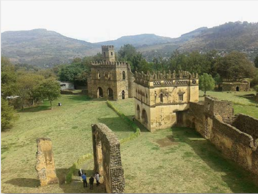
The Castles of Gondor Flickr / UNESCO Africa