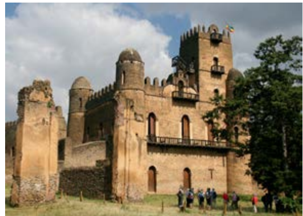
The Camelot of Africa

About the same time, the Ethiopian empire faced a new threat from the south. The Oromos, who are a nomadic pastoralist tribe related to the Somalis, began migrating northward and westward from the region of modern-day Kenya. 50, 51, 52 As a result, the Ethiopian empire and its revenues contracted. An Oromo state developed between the Christian Ethiopians of the Western Highlands and the Muslim Sultanate of Adal. Eventually, a wall was built around the Adal capital of Harar, but the city soon found itself completely surrounded (if not invaded) by the Oromo migrational onslaught. 53, 54