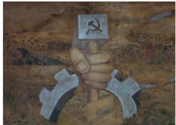
Derg Communist Artwork

There are at least four armed insurgent groups operating within Ethiopia: The Afar Revolutionary Democratic Union Front (ARDUF), the Ethiopian People's Patriotic Front (EPPF), the Ogaden National Liberation Front (ONLF), and the Oromo Liberation Front (OLF). 140 The ARDUF, also known as the Ugugumo, is a militant group of ethnic Afar that has been operating in the Afar region since 1993. This group has been responsible for the kidnapping of foreign tourists in recent years. 141, 142 The group poses no serious risk to the federal government, but is a source of local instability. 143 The EPPF engages only in low-level activity, including raids on government convoys. 144