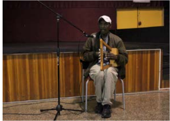
Ethiopian Dance Workshop

Ethiopia has a diverse musical tradition. Christian music began in the sixth century and is still sung in the Ge'ez language. Religious music remains popular throughout the nation and is sung in many of the major languages including Amharic, Oromo, and Tigrayan. 166 The roaming singers known as azmaris (“minstrels”) have a long tradition within Ethiopia. Over centuries the azmari repertoire has evolved from music for religious liturgies to more secular themes, with lyrics often improvised. 167 They traditionally accompany themselves using a masenqo (one-string bowed lute), often with the additional backing of drums, krar (bowl-shaped lyre), and flute. 168, 169 Azmari music typically is played using one of four pentatonic scales (five notes per octave). 170