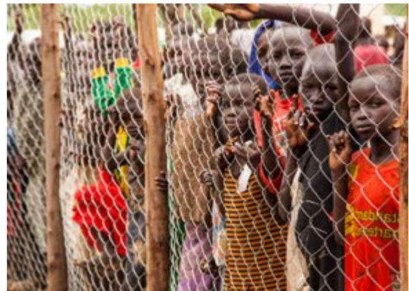
Sudanese Refugee Boys

There has been little time to build a clear strategy toward the new nation since the establishment of South Sudan in July 2011. Twelve memoranda of understanding were recently signed between representatives of the two nations. The memoranda include issues of trade, transportation, education, and strategic partnership relations. Sudan and Ethiopia agree to establish a free trade zone on their border. 92 Although the two nations remain committed to working together to forge peace and security in the region, Ethiopia is concerned about lingering issues between Sudan and South Sudan that could create problems. 93 Both nations also agree to collaborate on increasing joint border security. 94 One issue complicating relations is the large number of refugees from South Sudan in Ethiopia's Gambella region. In January 2015, there were approximately 300, 000 South Sudanese in Ethiopia, mostly ethnic Nuer. The refugees strain Ethiopian resources and represent a potential source of conflict with Ethiopian Nuer tribes. 95, 96