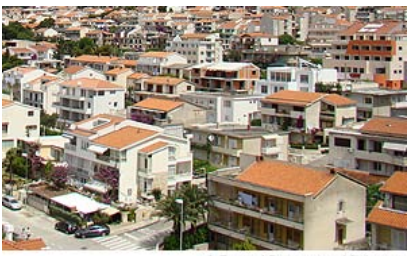
Makarska, Croatia

Croatia's economy has rebounded significantly since the civil war of the early 1990s left much of the country's economic infrastructure in tatters. Nonetheless, the nation's economy faces several persistent hurdles. Privatization of state-owned businesses has moved slowly, in part because of public resistance that mounted after several early sales were made at below-market-value prices to politically connected private business enterprises.<sup>283</sup> Croatia's