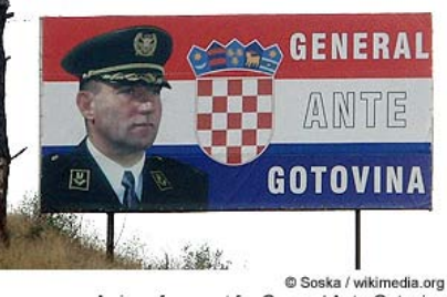
A sign of support for General Ante Gotovina

In February 1992, a United Nations Protection Force (UNPROFOR) that would ultimately include 39,000 troops entered Croatia. Initially, their mission was to protect demilitarized protected areas (western Slavonia, eastern Slavonia, Krajina) where Croatian Serbs were either a majority or substantial minority of the population. Ultimately, the UN forces would also monitor the so-called "pink zones," regions outside the protected areas and controlled by the JNA.<sup>193</sup>