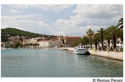
City shoreline in Split

Split, the second largest city in Croatia and the most prominent city in the southern region of Dalmatia, is a major transportation center and ferry hub located on a small peninsula with a deep sheltered harbor. It is best known for the ruins of Roman Emperor Diocletian's retirement palace, a UNESCO World Heritage Site, which was completed in the early 4th century C.E. The palace eventually developed into the urban center, and the city expanded beyond the walls of the palace by the