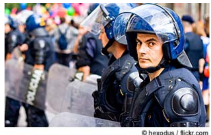
Riot police in Zagreb

For a decade and a half, Croatia has been free of attacks by terrorist organizations. The only attack by a global terrorist group occurred in 1995, when an Egyptian Islamic militant group carried out a bomb attack on a