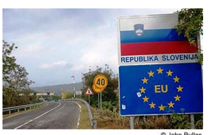
Solvenia border crossing

The most contentious issue between Croatia and Slovenia has been the status of their land and maritime borders. While the land border issues are relatively minor, the maritime border, which cuts through Piran Bay, has become a sticking point between the two nations.<sup>355</sup> Slovenia has argued that it must have "territorial contact" with international waters in the Adriatic.<sup>356</sup> This dispute dates back to the breakup of