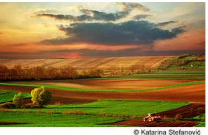
Pannonian Plain from the Serbian side

The Pannonian Plain is a vast flatland with scattered rolling hills spreading across most of Hungary and parts of Romania, Serbia, Bosnia and Herzegovina, Croatia, Slovenia, Ukraine, the Slovak Republic, and Austria. Between 12 and 4 million years ago, this plain was closed off from the sea and was the site of a large