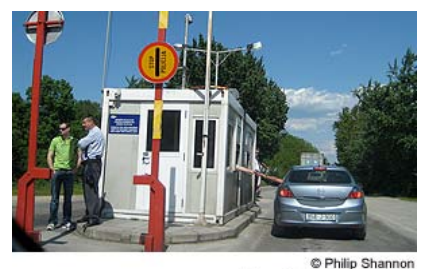
Bosnia border crossing

The 932-km-long (579-mi-long) border between Croatia and Bosnia and Herzegovina is each country's longest boundary with a neighboring state.<sup>362</sup> Bosnia and Herzegovina's border with Croatia includes a tiny stretch along the Adriatic coast. This slice of coastline, occupied by the small tourist-oriented village of Neum, severs Croatia's land connection between the southeastern-most part of Dalmatia (including the