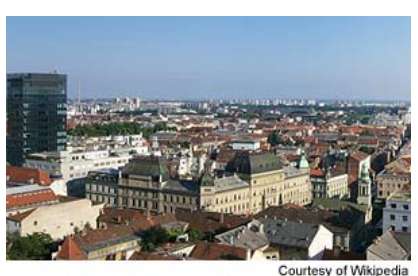
Panoramic view of Zagreb

The recorded history of Zagreb dates back to 1094, with the founding of a diocese by the Hungarian King Ladislaus. The religious settlement Kaptol developed as a city center on one hill, and the secular Gradec settlement developed on the other. In the 16th century, the area was first designated the capital of Croatia; at this time, much of the region was either under the control of the Ottoman Turks or under siege by Ottoman forces.<sup>50</sup> During the 17th and 18th centuries,