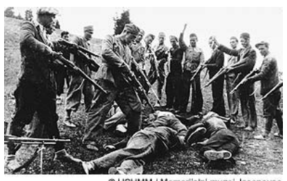
Ustasa militia point their rifles at a group of bodies

World War II came early to the Balkans, commencing in April 1939 when Italian forces overran Albania. A subsequent Italian invasion of Greece in 1940 failed badly, forcing Mussolini to request assistance from his German allies. Under threat of German invasion, the previously neutral Balkan nations of Romania and Bulgaria soon thereafter aligned themselves with the Axis powers under the Tripartite Pact. Put under similar pressure, Yugoslavia eventually signed the