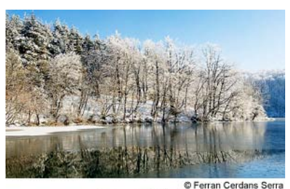
Winter in Plitvice Lakes National Park

Two distinct climate zones exist in Croatia: Mediterranean and continental. The Mediterranean climate affects the low-lying land along the Adriatic as well as the islands, with mild, short, rainy winters when average temperatures range from 2 to 8 °C (36 to 46 °F) and dry, sunny, warm summers with average