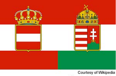
Flag of dual monarchy

In 1881, the Vojna Krajina was disbanded, three years after the region ceased to be a "military frontier" when Austria-Hungary assumed control of Bosnia and Herzegovina from the Ottoman Empire. This region, which even after the establishment of the dual