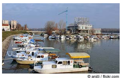
Dunabe river, Vukovar

The Danube has its origins in the Black Forest of Germany and flows easterly through nine more countries for 2,850 km (1,770 mi) before emptying into the Black Sea. It is navigable by river ships for the majority of its length and forms the northern two thirds of the border between Croatia and Serbia.<sup>35</sup> Vukovar is the largest Croatian town and river port on the Danube and was nearly destroyed during the early 1990s war.