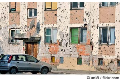
Vukovar apartment building

Croatia is a country with one foot firmly planted in the Balkan agrarian way of life while the other foot is in post-industrial European society. One can drive through rural areas of northern Croatia and see small farms being worked without machinery, as they have been for centuries. Meanwhile, a little to the west, along the Istrian and Dalmatian coast, lie popular tourist areas that are a magnet for wealthy vacationers from Western Europe. Zagreb, the nation's capital, is a vibrant city