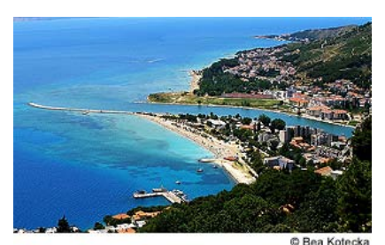
Adratic sea-view from Fortica

The turquoise waters of the Adriatic Sea are the crowning jewel of Croatia; fishing is a locally important industry, while diving, kayaking, windsurfing, sailing, snorkeling, and sunbathing are just a few of the many coast-based activities that help support a thriving tourist industry. In summer, the water temperature can reach 23 °C (73 °F).<sup>30</sup> The Adriatic is the northernmost gulf of the Mediterranean Sea and lies between the Italian and Balkan