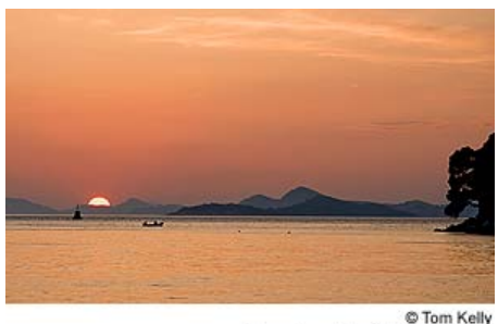
Sunset on the Adriatic Coast

Coastal Croatia is marked by a continuous lowland continental coast dotted with numerous offshore islands. Together with the mountainous interior areas to the east, much of the central and southern parts of this region have long been collectively known as Dalmatia, and thus the coastal stretches are frequently referred to as the Dalmatian coast.