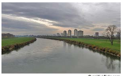
Saba river, Croatia

The headwaters of the Sava rise in the Julian Alps in Slovenia. The river then flows southeast through the Slovenian capital of Ljubljana and the Croatian capital of Zagreb before it eventually empties into the Danube River at the Serbian capital of Belgrade. The Sava runs through Croatia for 510 km (317 mi) and forms the border with Bosnia and Herzegovina for 311 km (193 mi) of that distance. The Sava is the Danube River's second largest tributary and is one of Europe's most