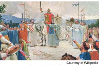
Crowning of the Croatian king Tomislav

Ancient Croatia fell under the control of both Greeks and Romans. From the late 4th century through the 5th century, the lands of the weakened Roman Empire were invaded by a succession of armies from the north and east. Vandals, Visigoths, Huns, and Ostrogoths were just some of the groups that swept through the Roman regions, often leaving destruction in their wake. The Roman Empire, which had formally split into eastern and western parts in 395, was unable to survive intact