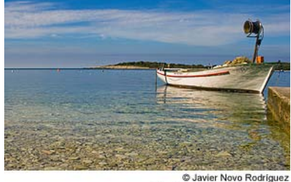
Shallow rocks in Una River

The Una rises in the mountainous Lika region of Croatia and flows for 19 km (12 mi) before entering the karst mountains of Bosnia and Herzegovina. The river briefly forms the border between Croatia and Bosnia and Herzegovina in this mountainous region and then does so again for a more extended portion before draining into the Sava River.<sup>46</sup> It has a total length of 214 km (133 mi). While the upper and lower parts of