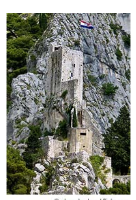
13th century Mirabella Fortress

Situated near the northwestern tip of the Balkans, Croatia has long been within the boundaries of larger kingdoms, beginning with the Roman Empire and continuing with the Hungarian, Austrian, and Ottoman Empires. Despite the numerous divisions of the Croatian regions between these larger powers and the regional distinctions that are the legacy of the past,<sup>103</sup> Croatia is not a recent political creation. The first Croatian kingdom dated back to medieval times and consisted of most of modern-day Croatia. In the 20th century, Croatia was amalgamated into Yugoslavia, a multi-ethnic state that was part of the communist Eastern Bloc, though it charted an independent course. When Yugoslavia fell apart in the 1990s, civil war ensued and it took outside forces to restore the peace. Today, Croatia is once again an independent nation.