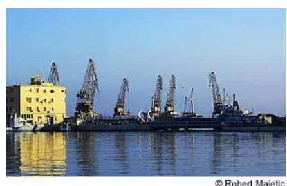
Rijeka ship yard

Croatia's textile and apparel manufacturing has traditionally been a major component of the nation's manufacturing sector. Recent years, however, have seen a steady decline in the industry, both in terms of revenue/production and number of workers employed.<sup>227</sup> In 2003, for example, over 13.6% of all of Croatia's workers in manufacturing were employed in the textile and apparel industry. Five years later, in 2008, this percentage had slumped to slightly more than