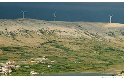
@ Lan Llovd Wind farm

Croatia has limited fossil fuel resources, insufficient to meet the nation's domestic energy needs. Crude oil production has been on a steady decline since the mid-1990s. But, consumption had risen during that period, resulting in an increasing need for imported oil. Natural gas production has been relatively steady, but demand has nonetheless outstripped domestic supply for many