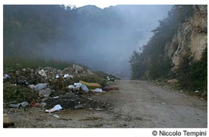
Pollution in Croatia

Natural hazards in Croatia include earthquakes, floods, drought, high winds, windstorms, extreme temperatures, and wildfires.<sup>79</sup> Croatia and adjacent regions constitute an active earthquake zone with an average of 65 temblors per year and one that exceeds Richter magnitude 6 every two years; small tremors occur regularly, mostly in coastal areas.<sup>80</sup> The 1667 earthquake that destroyed most of Dubrovnik is probably the best-known temblor to strike Croatian