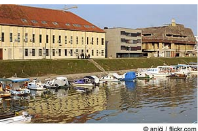
The Danube river in Vukova

aside lingering animosities. Such a reconciliation process is in both nations' interests as they work to establish closer ties with the rest of Europe. The massacres and atrocities inflicted by both sides during the war years have been an ongoing obstacle to normalized relations. The hurdle is partly due to the persistent tit-for-tat demands for war crime tribunals against leading Croatian and Serbian political and army