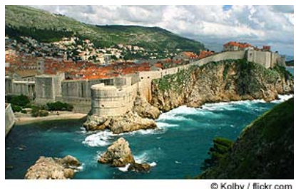
Stari Grad Dubrovnik

Dubrovnik, today famous for its grand city walls and fortress towers, began as a Roman settlement that later became highly prized as a maritime port by Venice, Hungary, and the Ottoman Empire. As the independent "Respublica Ragusina" (Republic of Ragusa), Dubrovnik developed into a great mercantile power with land and sea trade routes across the Balkan Peninsula and beyond. This "South Slav Athens" flourished until a destructive 1667 earthquake killed