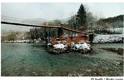
Bridge over Kupa river

The Kupa forms part of the border between northwest Croatia and southeast Slovenia and flows into the Sava at the city of Sisak.<sup>44</sup> The karst region within Croatia that drains into the Kupa contains a large quantity of high quality spring water, which is quite vulnerable as well as strategically important to western Croatia.<sup>45</sup>