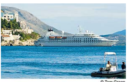
Cruise ship in Dalamtia

Croatia's negative trade balance makes the nation's tourism industry all the more important for ameliorating the nation's balance of payments ledger. The sector is also an important source for jobs within the country.<sup>251</sup> Since 2007, an average of over 9.3 million foreigners have visited Croatia each year, more than twice the nation's total population. The large majority of these visitors are from other European nations, with Germany and Italy the leading source nations for Croatian tourist