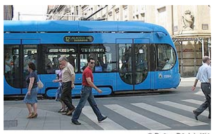
Tram in Zagreb

Croatia has an extensive rail network with varying capacity to handle freight traffic. Over 2,700 km (1,700 mi) of railroads connect most of the major cities. However, Istria is only linked to the rail systems in