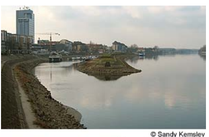
Drava river along Osijek

The Drava River is the fourth longest and fourth largest tributary of the Danube, rising in the Italian Alps and flowing through Austria into Slovenia.<sup>40</sup> It then enters Croatia from Slovenia, forming most of the Croatian border with Hungary before joining the Danube downstream from Osijek.<sup>41</sup> Twenty-two hydropower dams, three of which are located in Croatia, have changed its floodplains from their natural state. Considerable degradation is evident along the free-