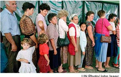
Refugees waiting in line for food

Although fighting ended in 1995, Croatia still grapples with the aftermath of its bloody years of conflict. (In Croatia, the fighting between 1991 and 1995 is today known as the Croatian War of Independence or the Homeland War. Ethnic Serbs, on the other hand, are more likely to refer to the conflict as a civil war.<sup>395</sup>) At the beginning of 2010, the United Nations High Commissioner for Refugees estimated that over 76,000 refugees from Croatia, the vast majority of whom were