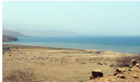
Eritrean coastal plain

Bordering the Red Sea, the coastal plains stretch from the country's northernmost point near Sudan to its southeastern border with Djibouti. This strip of hot, dry land is generally narrow in the north, where it measures between 16 and 80 km (10 and 50 mi) wide. It is bounded on the west by a prominent ridge that forms the eastern limits of the central highlands. 9