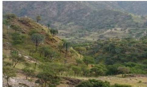
Countryside near Gash Barka

Approximately 80% of the Eritrean population depends on agriculture and animal husbandry. 35 But less than 5% of the land is arable because most regions suffer from poor soils and hot, arid conditions. 36, 37 The widespread demand for farmland, pasture, firewood, and fodder has stretched the country's limited resources, especially as the population has grown. Over time, overuse of cultivable areas has led to degradation,