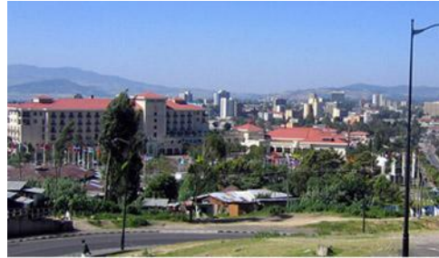
View of Addis Ababa

In late 1935, Italy again attempted to seize more Ethiopian territory, and it finally captured the capital, Addis Ababa. 61 On 9 May 1936, Fascist Italy, led by Benito Mussolini, reported to the League of Nations in Geneva that Italian forces in Abyssinia (as Italy then called Ethiopia) had restored peace to a “troubled” province. In the 6-month campaign, Mussolini’s son-in-law, Count Galeazzo Ciano, had commanded an air squadron, and poison gas was used against noncombatant