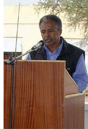
President Isaias Afwerki

In the following months, Isaias Afwerki and the National Assembly worked together to improve the welfare of Eritreans and the standing of the nation. Their first concern was internal policy. The National Assembly worked diligently to improve the nation's infrastructure, creating roads and electricity grids, extending the phone system, and establishing schools and hospitals. It also drew up a provisional constitution creating laws and policies to protect human rights and repair the economy. A more complete version of the constitution was approved in 1997.