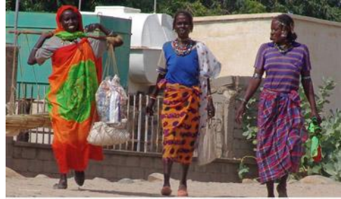
© Charles Roffey Women in Barentu

But because of traditional attitudes and practices, as well as the policies of Isaias Afwerki's government (most notably its failure to implement the constitution), the rights of Eritrean women have not always been observed. Today, women in Eritrea generally retain a lower status than men, especially in rural areas, and they face many specific challenges (e.g., fewer opportunities for education and skilled employment). 198 They also are prone to unique health risks associated with pregnancy, childbirth (which often occurs inside the home), and the cultural practice of female genital mutilation (FGM). 199