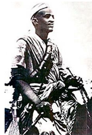
Hamid Idris Awate, 1961

The postwar period in Eritrea was characterized by political strife and economic stagnation. Throughout the 1950s, the Eritreans—particularly Muslims—were repressed by the Ethiopians, who resented Eritreans’ wartime collaboration with the Italians and British. In several breaches of the Eritrean constitution, the Ethiopian government instituted repressive measures targeting the Eritrean Muslim community, and it banned political parties (1955) and trade unions (1958) in the state. These and other measures provoked resentment among Eritreans of all classes and religious backgrounds. Their dissatisfaction grew to dissent. In 1956, dock workers at the port of Massawa held several demonstrations. On 10 March 1958, a general workers’ strike broke out in Asmara and other Eritrean towns. 65