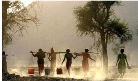
Women fetch water in rural Eritrea

Once Eritrea gained independence in 1993 after three decades of war with Ethiopia, the Eritrean economy rebounded with an average yearly growth rate of 10.9% between 1993 and 1997. But when a border dispute ignited 2 more years of fighting, the growth rate fell to -13.1% in 2000. 95, 96, 97 Although the initial growth in gross domestic product (GDP) was mirrored by progress in infrastructure and the standard of living, the return to hostilities with Ethiopia deterred foreign investment and disrupted bilateral trade. 98