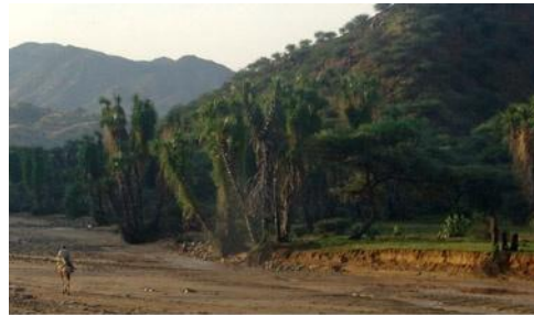
Dry river bed of the Gash Barka

The clearing of forests for timber, firewood, fodder, and farmland has resulted in widespread deforestation. Eritrea has lost many of its native and economically viable woodlands, leaving limited areas of natural forest intact. 39 In many highland areas, cultivation occurs on steep slopes with shallow soils. 40 This practice, combined with deforestation, has contributed to soil erosion, a process that has long afflicted the region. Because rainfall is often highly variable, torrential rains can wash away soils while droughts contribute to further desertification. Unsustainable farming and overgrazing practices also have led to erosion and desertification. All these factors have contributed to the decline of regional biodiversity, and a number of wildlife species are either vulnerable or endangered. 41