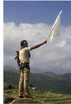
EPLF Liberation soldier, 1991

During the 1998–2000 border war and since, Eritrea and Ethiopia have assisted insurgent groups acting against the other country’s government. 314, 315 Eritrea has supported the Oromo Liberation Front (OLF) and the Ogaden National Liberation Front (ONLF). 316 Based in eastern Ethiopia, the ONLF is composed of ethnic Somalis who seek to form an independent state of Ogaden. 317 The group is responsible for numerous deadly attacks on Ethiopian military units and foreign workers. 318 Ethiopia, on the other hand, has served as a meeting ground for the Eritrean Democratic Alliance (EDA), a coalition of 13 opposition groups seeking to overthrow the Eritrean government. 319