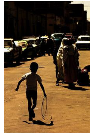
Boy in Asmara

By most accounts, cycling is the national sport. The Italians introduced it during the colonial era, and the first Giro d'Eritrea, or Tour of Eritrea, was held in 1946 while under British administration. Locals were not allowed to participate in the race. But in 2001, independent Eritrea resumed the annual Tour tradition, which today features approximately 100 professional cyclists and thousands of amateur riders and enthusiasts. In its current form, the Tour of Eritrea is 1,100 km (685 mi) long in 10 stages, including a challenging climb from coastal Massawa to the highland city of Asmara—a rise of 2,400 m (7,875 ft). 212 The Tour is the largest and most popular of many organized cycling events, and is known for its unique challenges, including intense heat, roaming camels, and “rock-throwing baboons.” Apart from local contests, the Tour de France is one of the most popular televised events for Eritrean spectators; it is broadcast live on government-run television. 213