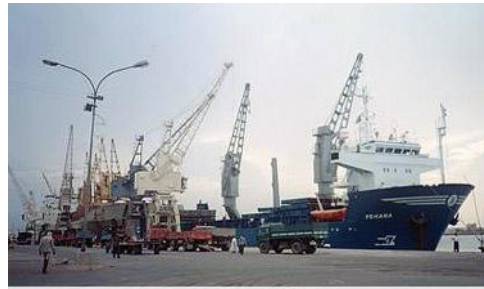
© Hans van der Splinter & Mebrat Tzehaie Port in Massawa, 1996

Eritrea occupies a strategic location on the Red Sea, one of the world's busiest shipping routes. 1 Some scholars believe that the Eritrean region was once part of a larger area that ancient Egyptians referred to as the "Land of Punt." This legendary trading center was described in Egyptian lore as a source of precious metals and exotic goods and animals. 2 For much of its known history, Eritrea formed a portion of the Ethiopian Empire. The Italians formally applied the name "Eritrea" when they colonized it in the late 19th century, and based the name on a modified version of the Latin name for the Red Sea, Mare Erythraeum . 3 The country's modern borders are largely a legacy of the colonial era, although its southern border with Ethiopia remains under dispute. 4, 5