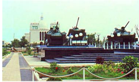
War Memorial in Massawa

Over the next 10 years, Ethiopia initiated several military offensives in an effort to take control of Eritrea and quell the resistance movement. Border areas were seized, but the Ethiopians were unable to completely subdue the Eritrean province. In 1988, forces of the Eritrean People's Liberation Front (EPLF) began to win battles. 72 They took Afabet (headquarters of the Ethiopian Army) and, in 1989, the important town of Keren (Eritrea's second-largest city). 73 These victories were followed by the fierce battle for the port of Massawa in 1990. 74 As the Eritreans grew stronger, Ethiopian resistance to Mengistu and the Marxist government began to grow as well. The Ethiopian People's Revolutionary Democratic Front (EPRDF) emerged as a united opposition front to defeat Mengistu.