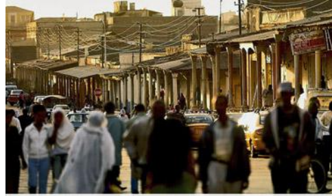
Street in Asmara

As of 2010, Eritrea did not possess proven reserves of oil or natural gas. 147 The country imports all its petroleum. In 2009, it consumed approximately 5,000 barrels a day. 148 Because of shortages, the government rations petroleum supplies. Non-commercial gasoline consumers are most affected by this measure. In 2007, gasoline sold for USD 11 per gallon in the capital, at a time when more than half the population was thought to be living on less than USD 1 per day. 149