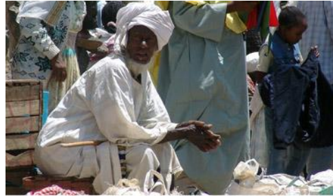
Man waiting for a bus in Asmara

independence in 1993, local industrial production had ceased, and its remaining factories were badly in need of repair and investment. After a short period of post-independence growth, the industrial sector has been stifled by war and lack of investment—although certain industries, such as fish processing, have demonstrated potential. 121 In addition to food processing, the country's industrial activity today centers on beverage products, textiles and clothing, light manufacturing, salt, and cement. 122 In 2010, industry accounted for 22.5% of GDP with an estimated growth rate of 8%. 123 Most industrial production takes place in Asmara and in and around Massawa.