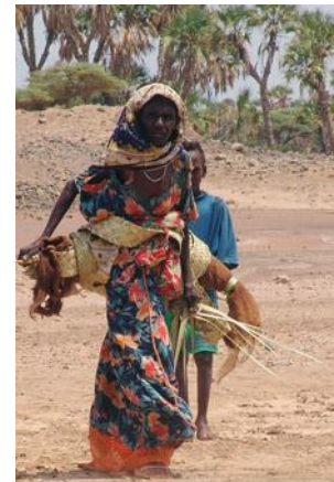
Mother and son in southern Eritrea

Modes of dress vary according to location and ethnic group. In cities, Western clothing is common for men and women; this may include suits, pants, blouses, dresses, jeans, and t-shirts. In rural areas, clothing styles are more traditional, and certain types of dress or grooming habits are associated with specific groups. In the predominantly Christian highlands, Tigrinya women traditionally wear white cotton dresses with decorative hemlines and matching white shawls. The dresses are often wraps made from a single large piece of fabric. Men may wear white pants and a long white shirt that reaches to the knees, as well as a shawl around the shoulders. Such garments are often worn on ceremonial occasions. Tigrinya women also are known for their unique braided hairstyles. 202