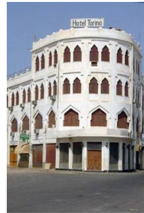
Ottoman architecture in Massawa

In 1270, an Amhara nobleman from the south, Yekuno Amlak, seized the Zagwe throne and proclaimed himself the first king of the new Solomonic Dynasty. Claiming to be a descendent of King Solomon and the Queen of Sheba, Yekuno ruled until 1285, when his son, Yagba Siyon, came to power. After Yagba's death, the dynasty suffered several years of conflict as various descendants of Yekuno fought for the throne. Around the beginning of the 14th century, the dynasty instituted a practice that persisted until the mid-16th century: all male descendants of Yekuno, except for the ruling emperor and his sons, were imprisoned for life in a mountaintop fortress. Thereafter, when the reigning emperor died, his firstborn son took power and his other sons were subsequently imprisoned with the rest of the male descendants. 55