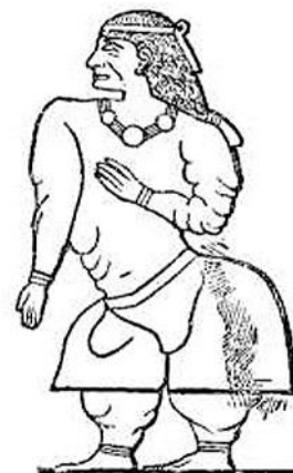
Queen of Punt, 1886

The first mention of "Punt" dates to the fifth dynasty of ancient Egypt (c. 2400 B.C.E.). Some scholars believe that the name referred to the modern Eritrea region. Relief paintings at that time show ostriches, antelopes, and copper-skinned slaves bearing ivory, ebony, and coffers of gold and frankincense from Ta Netjer (Punt), or "god's land." Nobles from Punt visited courts of the pharaohs. Subsequent Egyptian pharaohs, such as Mentuhotep of the 11th dynasty (c. 1980 B.C.E.) and Ramses III of the 20th dynasty (1260 B.C.E.), visited Punt. They traveled by two well-known routes. The first was an overland route that followed the Nile River to Sudan and then tracked further south to Punt. The second route was by the Red Sea, sailing south from Egypt to modern Massawa. Near the end of the final Egyptian