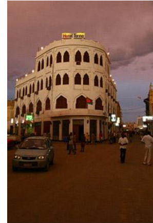
© Eric Lafforgue Sunset in Massawa

However, the protracted conflict with Ethiopia and the government's strict economic and social controls have deterred most visitors and investors, and prevented the industry's growth. Today, tourist activity is mostly limited to Asmara, where hotels and services are available and crime rates are quite low, especially for the greater region. To travel outside the city, foreign visitors must apply to the government in advance, and such permits are not always granted. 158 Besides Asmara, services and infrastructure (such as hotels) remain limited to larger cities and are often nonexistent in rural areas, where poverty is rampant. Furthermore, land mines are still present in many areas, and political and security situations remain tense. For these reasons, tourist activity is relatively low. In 2009, tourism made up less than 2% of Eritrea's GDP. 159