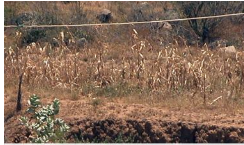
Crops in drought, Eritrea

Approximately 80% of Eritreans earn their livelihood from agriculture or animal husbandry. But in 2010, the agricultural sector accounted for only 14.5% of GDP. 115 The disparity between the sector's large, dependent workforce and its minimal economic output helps to explain the country's high poverty rate. In fact, most agricultural and pastoral activity is for subsistence, with limited surpluses available for market. The central highlands region is the area