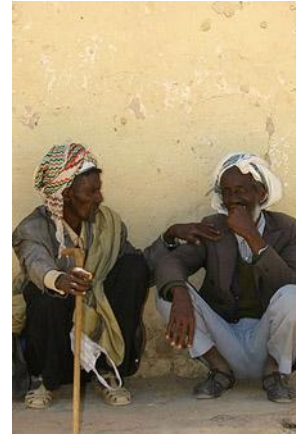
Men in Massawa

Because of its ethnic diversity, Eritrea is a multilingual society. Many citizens have a working knowledge of two or more languages. Under British rule in the early 1950s, Tigrinya, Arabic, and English were in use. In 1952, Tigrinya and Arabic became the official languages when Ethiopia adopted Eritrea as a federated territory. 183 The national language of Ethiopia, Amharic, took precedence by 1956 when it became the official language and was subsequently introduced in Eritrean elementary schools. 184