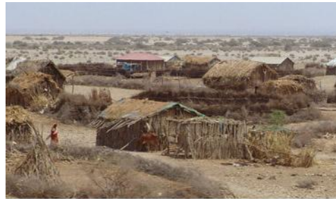
Houses in the Eritrean desert

The Eritrean Army remained mobilized along the Ethiopian and Djiboutian borders in 2011. Neither Eritrea nor Ethiopia appeared willing to compromise in order to formally resolve the boundary issue. Their dispute continued to affect the security of the greater Horn of Africa, a strategically important region. Eritrea's military mobilization near Djibouti and its support of insurgent groups threatened the stability of neighboring governments, particularly the Somali Transitional Federal Government (TFG).