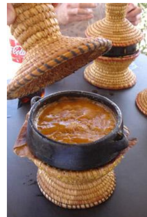
Spicy chickpea dish

Other meat dishes include tibsi (sliced lamb cooked with butter, onion, and garlic), capretto (roasted goat), and gored gored ( berbere -spiced beef). Fish, often charcoal-baked, is more frequently found in coastal areas such as Massawa. Meatless sauces include a lentil curry called alicha and a chickpea porridge known as shiro . 209 Various Italian dishes—including lasagna, spaghetti, and pizza—are served in restaurants, especially in Asmara. Likewise, Italian espressos, macchiatos, and cappuccinos