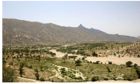
Site fo the Battle of Keren

During the war years, 1941–1945, Eritrea was a province of British Ethiopia, and the ports of Massawa and Assab became staging areas for the British Asian fleet. Under the U.S.–UK “Lend Lease” program, Britain provided the United States with bases in Asmara (army) and Massawa (navy) in exchange for war materials. After the war, Eritrea lost its importance to Britain. British forces withdrew, leaving a skeleton civil affairs administration. Meanwhile, the country suffered