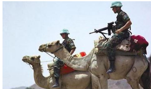
UN soldiers on camels

The country's promising development suffered a disastrous setback in the form of a renewed conflict with Ethiopia, which erupted in 1998 and continued for over 2 years. After initially developing normalized relations in the post-independence era, the countries went to war over a dispute concerning economic issues and the demarcation of their border. The intense conflict left approximately 100,000 Eritrean and Ethiopian soldiers dead and displaced up to 25% of the Eritrean population. Moreover, the country's developing economy and infrastructure suffered significant damage, largely because of Ethiopian occupation of some of Eritrea's most economically viable areas. 77, 78 The countries signed a peace treaty on 12 December 2000, but tensions remained high. 79