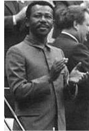
Mengistu Haile Mariam, 1986

During the economic stagnation of the early 1970s, a Soviet-backed Ethiopian movement, the Worker's Party of Ethiopia, produced a leader: Colonel Mengistu Haile Mariam. Mengistu claimed a connection to Emperor Haile Selassie through an ancestor who had been a tribal midwife at Selassie's birth. In a palace coup on 22 August 1974, the aging Haile Selassie was seized from his bed and taken to a secret location. A hastily assembled Revolutionary Council ordered the execution of 59 members of the royal family. In early 1975, Selassie died under suspicious circumstances and was secretly buried under a palace latrine. 68