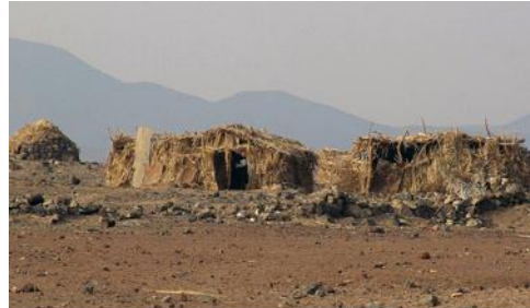
Homes in Assab

Food security remains a pressing issue in Eritrea, where droughts, conflict, lack of economic development, and government restrictions have contributed to frequent shortages. Eritreans rely on limited food rations and subsistence agriculture. As the economy has stagnated and militarization efforts have monopolized the country's limited resources, it is estimated that more than half the population lives below the poverty line. 330 According to reports, the national