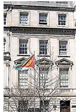
Eritrean Embassy in Washington D.C.

Throughout this time, Isaias Afwerki’s government grew increasingly isolated. In 2005, Eritrea asked the United States to halt its aid operations to the country. 84 That request came as part of the government’s stated policy of self-reliance, which has led to the rejection of significant sums of foreign aid from international organizations. The policy also has been cited as the driving force behind the institution of governmental controls on the economy. 85 Many observers have questioned the government’s isolationist approach, particularly because drought and the effects of war have frequently limited the country’s food supply in recent years. 86