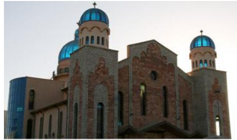
Cathedral in Keren

Although it was recognized and often administered as a distinct region, Eritrea endured generations of foreign occupation and Ethiopian control before emerging as a self-governed nation in 1993. This hard-fought independence has engendered a deep aspiration for self-determination, which the government has reinforced to promote national identity.