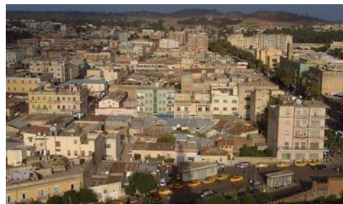
© Charles Fred View of Asmara

The Eritrean government's defensive mentality manifested in yet another border disagreement in 2008—this time with Djibouti. In June of that year, an armed conflict between troops on each side of the border resulted in numerous fatalities and injuries. In December 2009, the UN placed sanctions on Eritrea for failing to resolve the border conflict with Djibouti and for supporting Islamic militants in Somalia: specifically, the al-Shabaab terrorist group. 92,93 The situation further