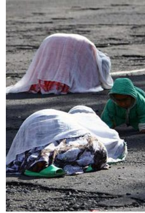
Women praying in Asmara

Islam and Christianity are the main religions in Eritrea. Although official data is unavailable, the population is thought to be divided almost evenly between Muslims and Christians. The vast majority of Eritrean Muslims practice the Sunni form of Islam. Sufis, who follow a mystical form of the religion, are a minority. 188 Most Christians belong to the Eritrean Orthodox Church, an offshoot of the Ethiopian Orthodox Church. There also are small communities of Roman Catholics and Protestants. Other religious minorities include Seventh-Day Adventists, Jehovah's Witnesses, and Baha'is. 189 Indigenous religions, including animism, are practiced among certain ethnic groups, particularly the Kunama.