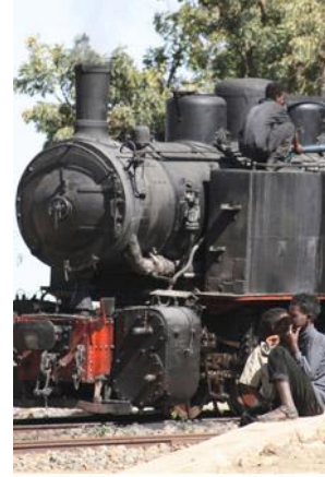
Children near a steam train

Eritrea's transportation network was initially developed during the Italian colonial era. 160 The nation's notable railway, which stretches approximately 306 km (190 mi) between Massawa, Asmara, and Akordat, was completed in 1932 under Italian direction. 161 The 30-year war for independence significantly damaged the nation's infrastructure, including the railway. After independence, the country made substantial efforts to repair and expand its transportation network, even during the 1998–2000 conflict with Ethiopia, which caused further destruction. A major focus of the “national service” and “cash-for-work” programs has been road construction. 162