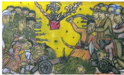
The Battle of Adwa, tapestry detail

Under the ambiguous Treaty of Wuchale (1889), Italy, who had the strongest footing in eastern and northcentral Ethiopia, gained Eritrea as a protectorate. 58 Eager to connect Eritrea and Ethiopia with Italian Somaliland in the south, the Italians launched a military bid to capture all of Ethiopia. At the Battle of Adwa, 1 March 1896, Emperor Menelik II forced the Italian expeditionary army out of central and southern Ethiopia. The Italians did manage to keep a foothold in the northern province of Eritrea. 59