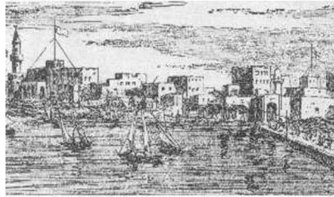
View of Massawa, 1890

The history of the Eritrean region is closely linked to that of Ethiopia, the country's southern neighbor and former sovereign. Eritrea's location on the Red Sea, which narrowly separates the African and Asian continents south of Egypt, played a major role in its historical development. It was susceptible to influxes of people and ideas from North Africa (mainly Egypt), the Middle East, and Europe. The country's mixed population of Christians and Muslims is a legacy of such movements. The religions reached the Eritrean region shortly after they developed: Christianity came in the early second century C.E. and Islam in the early seventh century. Although the region was often incorporated into larger regional kingdoms or empires, its coastal areas were frequently controlled or occupied by foreign entities. Through contact or conquest, the region absorbed Greek, Arab, Ottoman, Italian, British, and other influences over the centuries.