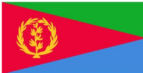
Flag of Eritrea

Strategically located at a southern naval choke point on the Red Sea, the heavily militarized African country of Eritrea has been important to the security interests of numerous nations, including the United States, Great Britain, and Israel. 217, 218 However, foreign relations with the impoverished country have sometimes been strained because the United States, the United Nations, and the African Union believe Eritrea is abetting terrorists. 219, 220