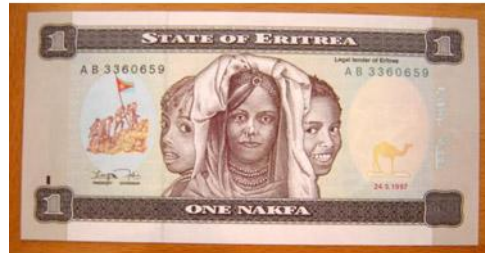
Eritrean currency

All banks and financial institutions in Eritrea are owned and operated by the government. This includes the National Bank of Eritrea (the country's primary financial institution), the Commercial Bank of Eritrea, the Housing and Commerce Bank of Eritrea, the Agricultural and Industrial Bank of Eritrea, and the Eritrean Investment and Development Bank. These are all centered in the national capital (although some have branches), and their services account for a major share of the nation's service-sector activity. 132