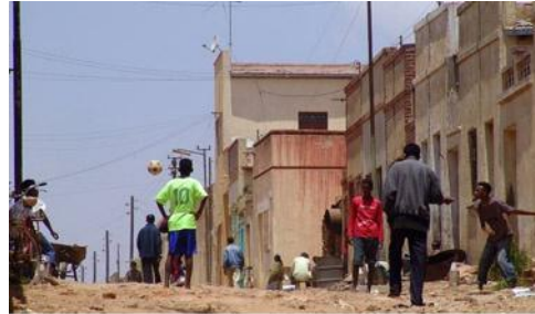
Boys play soccer in an Asmara street

President Isaias Afwerki has stated that the government will return to market-based economic policies when the conflict with Ethiopia has been resolved and the country has better established itself. If this were to occur, the nation would seem poised for development, particularly in its mining and tourist industries. Since the country remains in a state of neither peace nor war, however, the government's repressive social and economic policies have stifled growth and investment and caused many Eritreans to seek refuge abroad. The primary goal for much of the remaining population is mere subsistence, as food shortages and agricultural instability remain pressing issues.