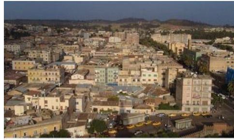
View of Asmara

Asmara, the capital, is situated at a high altitude (2,347 m or 7,700 ft) in the northeastern region of the highland plateau. It has an estimated population of 435,000 and is the largest of the six major Eritrean cities. 17 Asmara is a picturesque, clean, and generally safe city with palm-lined streets. Well defended during the conflict with Ethiopia, the city retains its historic architecture, much of which demonstrates Italian influence. 18