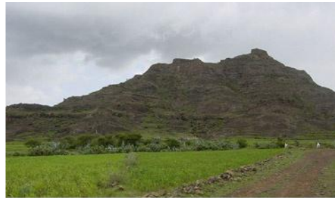
Eritrean central highlands

This region consists of a high, southcentral plateau that branches into mountain ranges in the north. As a whole, the highlands region is an extension of the Ethiopian Plateau, and it narrows as it stretches south to north, ultimately reaching the Sudanese border. Much of the southcentral plateau lies at a minimum of 2,000 m (6,500 ft), and several of its steep ranges reach higher elevations. Emba Soira, the country's highest point (3,018 m or 9,902 ft), is in the southeastern portion of the highlands region. In the north, a few peaks reach above 2,500 m (8,200 ft). The plateau is intersected by gorges and river valleys, and on its eastern edge, it descends into a striking cliff along the coastal plains. On its west, it slopes downward into rugged hill country. 13 The region is cooler, wetter, and more fertile than the rest of the country; it is home to up to half the population. 14