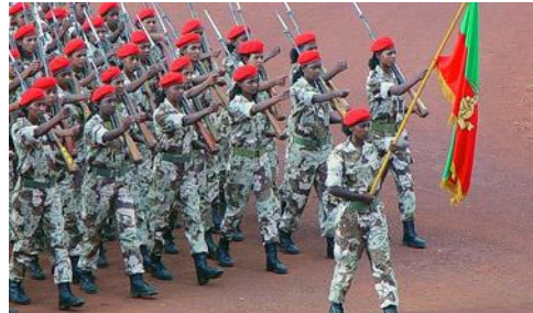
Female Eritrean soldiers

The army has five major bases at Assab, Asmara, Dahlak, Massawa, and Sawa. 292 The navy—supported by Israeli Super Dvora MkII patrol boats and Soviet OSA II class patrol boats—is headquartered at a modern base in Massawa, with other bases in Assab and Dahlak. 293, 294 The air force operates bases at Asmara and Massawa. 295