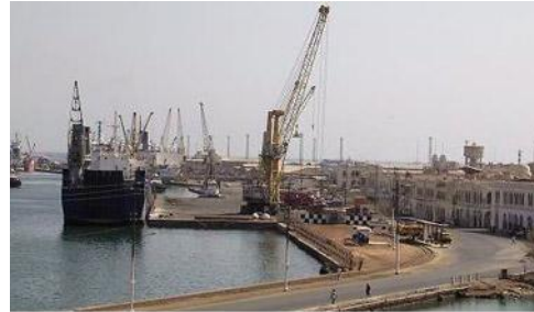
© Hans van der Splinter & Mebrat Tzehaie Dockyard in Massawa

Eritrea's trade activity has been severely disrupted by its ongoing border dispute with Ethiopia, as well as the government's related economic restrictions. Ethiopia had been a major destination for Eritrean exports, but the border has been closed for years. 140 Since Eritrea lacks a sufficient domestic food supply and a diversified industrial base, it relies heavily on imports, particularly food, fuel, machinery, and military, India, and Russia. 141 In recent years, Eritrea has expanded its trade ties with neighboring Sudan as a result of improved bilateral relations. 142 Its major import partners were the EU, the United States, the United Arab Emirates, Saudi Arabia, and India. Major exports include livestock, sorghum, textiles, food and small manufactures; the main imports are machinery, petroleum products, food, and manufactured goods. 143