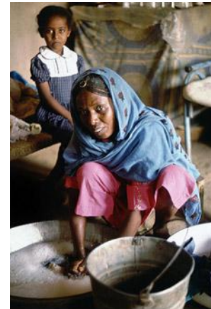
Mother and daughter in Keren

In 2010, Eritrea's annual average per capita income was approximately USD 600, making it one of the world's poorest countries. 106 Its 2009 human development index (HDI) score—a measure of national well-being based on average income, life expectancy, literacy, and educational attainment—ranked the country 165 out of 182 countries, below its neighbors Sudan (150) and Djibouti (155) but above Ethiopia (171). 107 Although the nation has shown some improvements (e.g., reductions in the rates of infant mortality and HIV prevalence), the Eritrean population remains vulnerable to food insecurity and undernutrition. 108 The government has disallowed independent evaluations of social indicators in recent years. 109