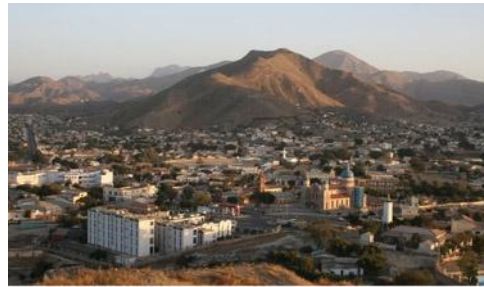
View of Keren

At an elevation of 1,372 m (4,500 ft), the city of Keren (Cheren) is northwest of Asmara in the central highlands. It is the roof garden of Eritrea. The city is a major agricultural and dairy center for the region, and has a population of approximately 75,000. 27 A variety of fruits and vegetables are produced on its numerous small farms, and it is especially known for its potent chili peppers. Keren's dairy herds produce milk, butter, and cheese. The city's population is mostly Muslim. 28 The British defeated the Italian army during the Battle of Keren in 1941. 29