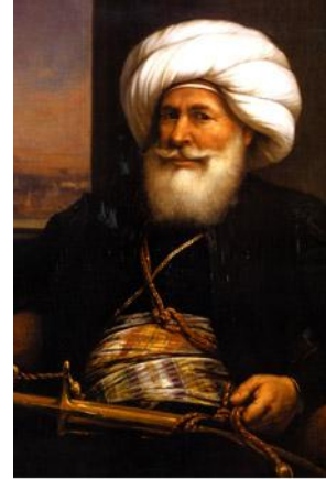
Muhammad Ali Pasha, 1830

financed by the Franco-British-Egyptian Suez Canal Company. After 15 years, the Suez Canal's engineer, Count Ferdinand de Lesseps (1805–1894), witnessed the opening of the waterway in 1869. Thereafter, the Red Sea ports of Massawa and Assab acquired new importance for European powers, who were poised to assert their ambitions. 56