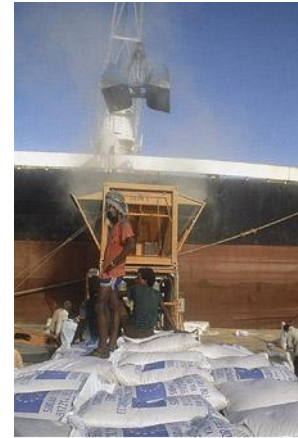
Unloading cereal in Eritrea

The United States’ relations with Eritrea have since been strained. The United States continues to provide substantial aid to Ethiopia, which the United States considers a “strategic partner” in international efforts to combat terrorism. 246 In late 2006, the United States supported Ethiopia’s invasion of Somalia to oust the ruling Council of Islamic Courts (CIC) (also known as the Islamic Courts Union), an extremist Islamist movement that the United States linked to the al-Qaeda terrorist network and the related al-Shabaab organization. 247 A United Nations group subsequently reported that the Eritrean government was giving military aid to Islamist insurgent groups in Somalia. These groups have tried to overthrow Somalia’s Transitional Federal Government (TFG), which replaced the CIC and which Ethiopia and the United States supported. 248 Although the Eritrean government denied these accusations, in 2007 the United States threatened to designate it a state sponsor of terrorism. 249