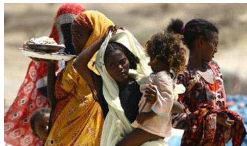
Afar women and children, Dahlak Islands

The population comprises nine recognized ethnic groups: the Tigrinya, Tigré, Saho, Bilen, Kunama, Rashaida, Beni Amir, Nera, and Afar (Danakil). The Tigrinya make up approximately 55% of the population and benefit politically and economically from being the largest group. Most are Orthodox Christians and primarily occupy the highlands of the country, while all the other groups live mostly in lowland areas. Historically,