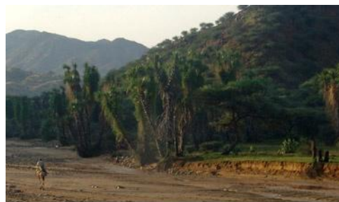
Dry river bed of the Gash Barka

Eritrea has four major rivers, all of which flow into Sudan. The Setit River, also known as the Tekezé, is the only river that flows year-round; the others are seasonal and dependent upon rains. The Setit originates in Ethiopia and flows along the western portion of the Eritrean-Ethiopian border before crossing into Sudan. It is not navigable. The Anseba and Barka rivers arise in