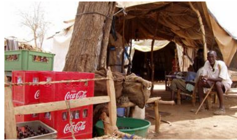
Man in refugee camp

The military fills its ranks through a mandatory national service program that requires all capable Eritreans from ages 18–40 to perform 12 to 18 months of service. Within this age range, men 18–40 and childless women 18–27 either actively serve in the military or work in civil service/development programs. 303, 304, 305 On the civil side of the program, national service may include work in schools, government facilities,