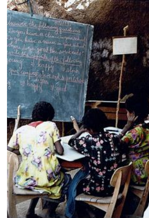
Girls study English

In addition to unifying its diverse ethnic groups, Eritrea's struggle for independence promoted greater gender equality. More than one-third of the Eritrean People's Liberation Front (EPLF) forces were women, the majority of whom fought in the guerrilla war, and some filled leadership positions. 192 In doing so, they faced unique challenges, including the potential of being raped by enemy soldiers. Furthermore, many of them married and gave birth between rounds of fighting. Their commitment and courage led many counterparts to describe them as the "moral backbone" of the resistance army. 193