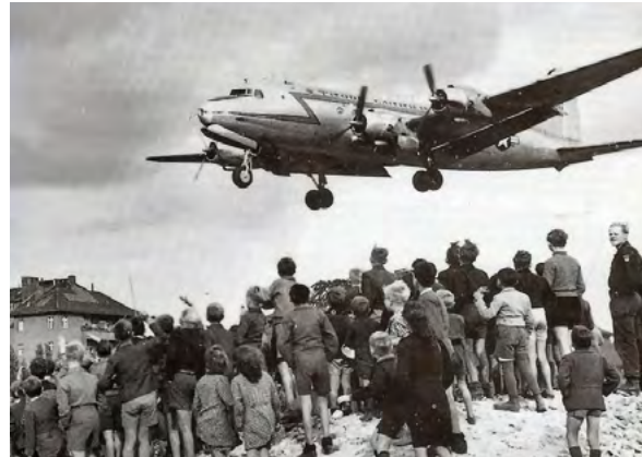
A Douglas C-54 Skymaster land at Tempelhof

In June 1948, U.S. and British policymakers introduced the new Deutsch Mark to West Berlin in order to manage economic recovery efforts and control the black market. In response, the Soviets introduced the Ostmark in East Berlin and blocked all land access to West Berlin. The United States and Britain responded by conducting an airlift of food, fuel, and water to the residents of the besieged city through an air corridor that started in West Germany. The Allies also organized a counter-blockade of East Germany. The crisis ended when the Soviets lifted the blockade a year later. The crisis solidified the division between Western and Eastern Europe. 127