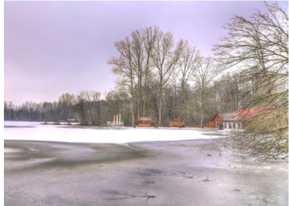
Winter in Hücker Moor Lake

The coldest month of the year is January; the average temperature is around 2°C (36°F) in the north and -2°C (38°F) in the south. Winters in southern Germany can be very cold, especially at the higher elevations. Temperatures as low as -10°C (5°F) are sometimes recorded. July is the warmest month. Temperatures range from 16-18°C (61-64°F) along the northern coast to approximately 19°C (67°F) in the south. The temperature can climb as high as 35°C (95°F) during the summer months. 17, 18