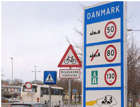
Entering Denmark from Germany at Kruså

The two countries are planning to connect Denmark with Continental Europe by building an 18 km (11 mi) long road and rail tunnel. The Fehmarnbelt fixed-link will be the world's longest undersea tunnel; it will have four-lane road and a two-track electrified railway. The fixed link will cut travel time between Hamburg and Copenhagen from four and a half hours to three hours. The project is expected to open for traffic in 2028. 61, 62, 63