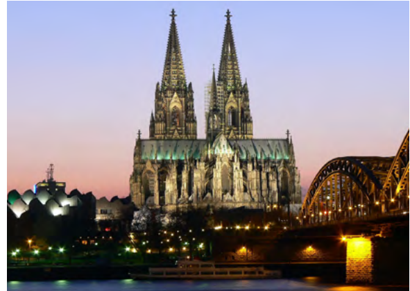
Cathedral of Cologne

In the 8th century, Charlemagne made the city an archbishopric, and by the 10th century its ecclesiastical status overshadowed commerce. The city remained under the control of the archbishop until 1288 when it became a free imperial city. 79 Cologne joined the Hanseatic League and continued to prosper. In 1388, Cologne became the first city university in Europe. 80 The French took Cologne in 1794 and lifted the prohibition of Protestant services and the presence of Jews in the city after dark. 81