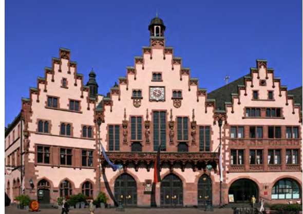
City Hall of Frankfurt

Frankfurt lies along the Main River in western Germany. Because of its location on a major river, the city has long been an important transportation hub and inland shipping port. Today, more than 180 different nationalities live in the city. About one-third of the people who live in the city do not hold a German passport. 89, 90