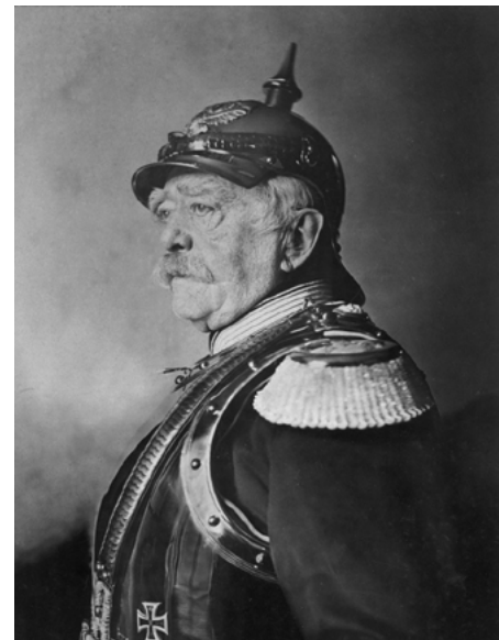
Otto von Bismarck

The Second Reich (German Empire), whose creation was orchestrated by Prussian statesman Otto von Bismarck, consisted of 4 kingdoms, 5 grand duchies, 13 duchies and principalities, and 3 free cities. Bismarck became the first imperial chancellor of the new nation. 62, 63 The empire possessed a military second only to Russia's in size and efficiency. The economy, fueled by rapid industrialization, was the world's strongest. The population increased, and nationalism grew as the people began to form a single German identity. Liberal parties rose to power and began a series of reforms designed to reduce the power of the Catholic Church. 65, 66, 67