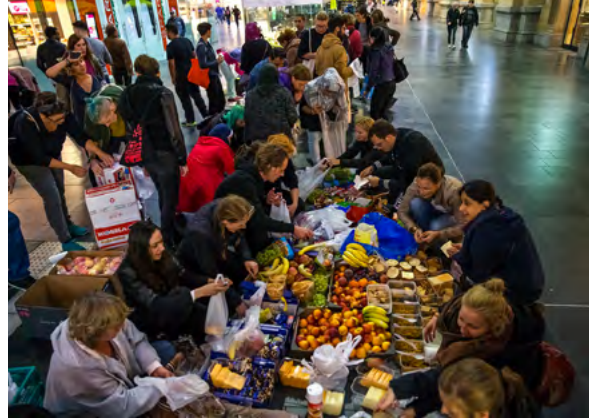
Train of Hope - preparing supplies for refugees, Frankfurt

as a threat to the German way of life and a strain on financial resources. 150 Anti-immigrant demonstrations raised the specter of Nazi extremism and xenophobia and stirred fears and anxiety among much of the population. 151 Attacks against immigrants and refugees increased. 152, 153 At the same time, sex crimes and attacks on Germans by migrants have inflamed the situation. 154, 155, 156