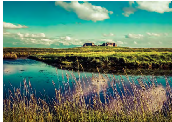
Plains in Northern Germany

The northern region of Germany is a vast lowland plain stretching from the border with Denmark to the cities of Köln and Hamburg. Many of the nation's major cities, including the capital, Berlin, are located in this region. Elevations rarely reach 200 m (656 ft). 5 The landscape of the northernmost section is covered with wide expanses of sand, marshlands, and mud flats. The soil, along the southern part of the plains near the Ruhr Valley is particularly fertile. Much of the region's western section was formerly covered with coarse grasses and heather. Peat bogs cover much of the land, stretching toward the northwestern coastal regions. Many of these bogs were reclaimed, and the land is now used for agriculture. Located in the Lüneburg Heath, the highest point in the Northern German Plane is Wilseder Hill (Wilsdeder Berg), which has an elevation of 169.2 m (554 ft). 6, 7 Moorland sheep, known as Heidschnucke, graze the heathland. 8