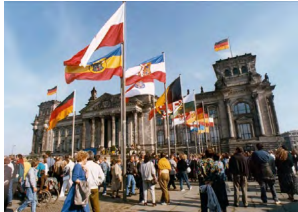
German day of unity, 1990

In November 1989, as the Cold War was thawing, crowds in East Berlin gathered at the Berlin Wall demanding to be allowed entry into West Berlin. On 9 November East Berlin's communist leadership relented, and thousands of East Germans jubilantly entered West Berlin. The following year, East Germany's communist party suffered a resounding defeat in the elections. The new government launched unification negotiations with West Germany and found an enthusiastic supporter of reunification in Helmut Kohl, the West's chancellor. In July, the two countries adopted a single currency. The Soviets ceased their opposition to reunification, and on 3 October 1990, East and West Germany were reunited with Berlin as capital. After national elections the following month, Kohl became reunited Germany's first chancellor. 135, 136, 137