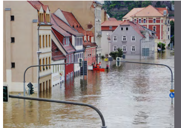
Flooding after heavy fall rains

The most common natural disasters in Germany are related to storms and flooding. 113 Rains and heavy snowmelt can cause local rivers to overflow. 114 Following a rapid winter thaw in 2011, many of the nation's rivers, including the Rhine, Mosel, and Oder, overflowed their banks and inundated many parts of the country. 115 In 2013, heavy rains throughout the nation caused many of the rivers to rise and overflow their banks causing serious flooding. The Rhine was closed to barge traffic due to high water levels and many river cruises had to be cancelled. The Danube reached its highest level in 500 years. The Elbe River crested and overflowed its banks. 116, 117 In 2014 and 2016, storm systems dumped record-breaking rainfall again, causing deadly floods in many regions. 118, 119, 120