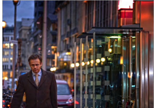
Businessman walking home in Berlin

German unemployment keeps dropping. 93 Nationally, the German unemployment rate hovers around 4%. About 65% of Germans between the ages of 15 to 74 hold a paid job, a higher percentage than the Organization for Economic Cooperation and Development (OECD) average of 61%. 95 The rate for men (78%) is higher than for women (69%). Unemployment is uneven throughout the country. 96 Unemployment is lowest in the southern states of Bavaria and Baden-Württemberg. 97 Youth unemployment, ages 15 to 25, is 7%, higher than the national average but the lowest in the European Union. 98