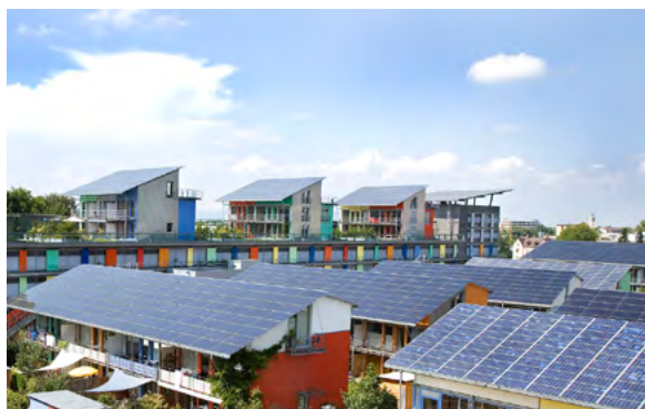
Solar Settlement with the Sun Ship: Freiburg Wikimedia / Andrewglaser

The industrial sector employs approximately one-quarter of the German labor force and accounts for roughly 30% of the country's GDP. 30 In addition to large manufacturing firms, much of this sector is comprised of small to medium-sized enterprises (SME). These SMEs are the nation's largest employer; SMEs currently employ nearly 16 million people. SMEs account for 55% of Germany's economic output. 31