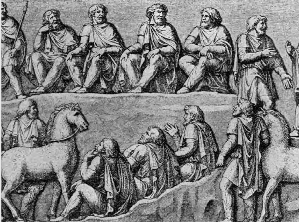
Column of Marcus Aurelius, 193 CE