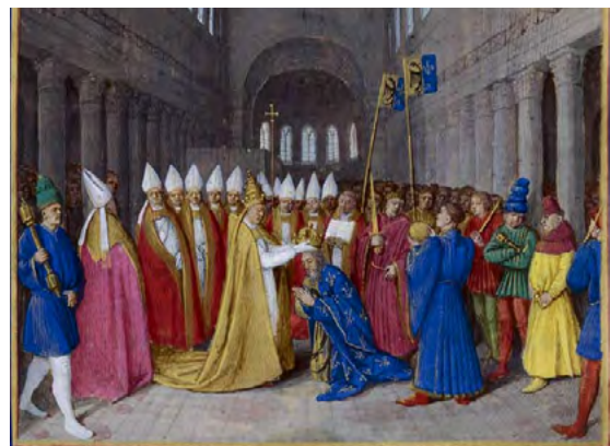
Charlemagne was crowned emperor by Pope Leo III

In 800, Pope Leo III crowned Charlemagne as the Emperor of Rome, the first in a line of emperors who would rule German territory until 1806, when Napoleon invaded the empire and abolished it. Charlemagne gained control of Bavaria, Lombardy, and Saxony during his reign. By the early 900s, the empire covered most of Western Europe. 21