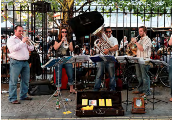
Musicians

The traditional genres of Volksmusik originated in Germany's southern mountain regions. Folk music is often played with harmonicas, guitars, and horns. Volksmusik music is generally played with accordions and brass bands; the tuba provides the signature sound. 121, 122