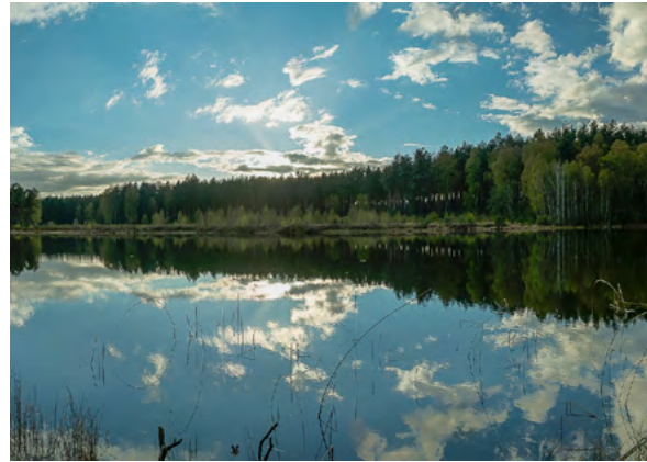
Lake Müritz

Germany does not have many lakes. Most of the shallow lakes are located in the lowlands of the northeastern region. The largest natural lake is Lake Müritz. 30 Lower Saxony is home to Dümmer and Steinhude lakes. Most of the remaining lakes are in the southern state of Bavaria, including Lake Constance, known locally as Bodensee, Lake Konstanz, and the German Riviera. Lake Constance is Europe's third-largest lake and is famous for its mild climate. 31 It is about 65 km (40 mi) long and 13 km (8 mi) at its widest point. The lake's average depth is 90 m (295 ft), but its maximum depth is 252 m (827 ft). Over half of the lake lies within Germany's borders, and the rest of it lies in Austria and Switzerland. 32, 33