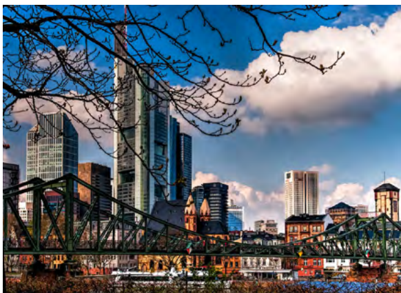
Iron bridge in Frankfurt

Frankfurt was founded as Franconovurt around the end of the 8th century, but the region has been continuously inhabited since 3000 BCE. 91 The city's castle was a royal residence of the East Frankish Carolingians from the 9th century through the Middle Ages. Frederick I was elected king there in 1152. In 1356, Roman Emperor Charles IV made the city the permanent site for the election of future German kings. 92 Frankfurt became a free imperial city in 1372. The Frankfurt Börse, the stock exchange, opened late in the 16th century. The Swedes occupied the city in 1614 following the defeat of the Holy Roman Empire in the Thirty Years' War. 93, 94 Napoleon made it the seat of government for the Confederation of the Rhine in 1806. In 1810, Frankfurt was named the capital of the Grand Duchy of Frankfurt. After Napoleon's defeat in 1815, the city again became a free city. Between 1816 and 1866, the city served as the German capital before Prussia annexed it in 1866. 95