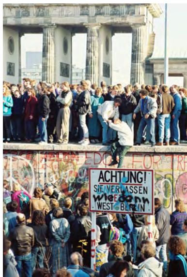
People atop the Berlin Wall on 9 November 1989

On 9 November 1989, the demolition of Berlin Wall began. The wall had divided the city since 1961 to East and West Berlin, with Checkpoint Charlie as the only gateway where East Germany allowed Allied diplomats, military personnel, and tourists to pass into Berlin's Soviet part. 5 Less than a year later, on 3 October 1990, the signing of the German Unification treaty reunited former East and West Germany into the Federal Republic of Germany (FRG). 6, 7