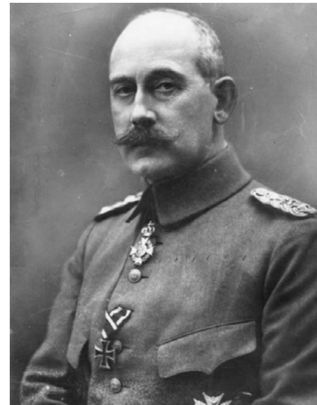
Portrait of Prince Max von Baden

After the Battle of Amiens, which concluded on 12 August 1918, the German commander advised the government to begin peace negotiations. The new German chancellor, Prince Max von Baden, agreed, but the German commander, Erich Ludendorff, rejected the plan. In response, von Baden persuaded the Kaiser to remove Ludendorff. The German situation further deteriorated. A mutiny broke out on the navy battleship Kiel in October and spread throughout Germany. 84 The government resigned, and on 9 November 1918, Kaiser William II fled to the Netherlands. Prince Max von Baden turned over his powers to the government, which formed the German Republic with a provisional civilian government. Two days later, the Germans signed the armistice ending the war. 85, 86, 87