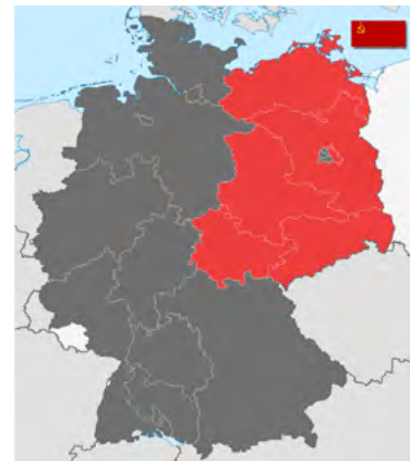
Soviet occupation zone

The Weimar Republic (1918-1933) replaced the German Empire after Germany's defeat in World War I. Following an economic collapse, the rise of Nazi Germany brought about the Third Reich (1933-1945), World War II, and the Holocaust. After Germany's defeat in World War II, the country was divided into four occupation zones, the American, British, French, and Soviet zones of occupation. Eventually, the zones controlled by the United States, Great Britain, and France became West Germany (FRG). The Soviet Occupation Zone became the German Democratic Republic (GDR), commonly known as East Germany. Berlin, the former German capital, which was located in the Soviet-controlled zone, was divided into East and West Berlin. Bonn became the provisional capital of West Germany. 3 In 1955, West Germany joined the North Atlantic Treaty Organization (NATO), and in 1957, it was one of the six founding members of the European Economic Community, the forerunner to the European Union. 4