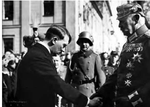
Paul von Hindenburg and Adolf Hitler on the Day of Potsdam, 21 March 1933

In 1933, Hitler called for new elections. In spite of their terror-filled campaign tactics, the Nazis failed to gain a majority, forcing them to join with the German National People's Party (DNVP). 102 The Reichstag passed the Enabling Act, allowing Hitler to ignore the constitution. Hitler then formed the Third Reich and began the Nazi revolution. The Nazis purged communists, socialists, democrats, and Jews from civil service and universities. Hitler disbanded trade unions and established the Gestapo. When President Hindenburg died in 1934, Hitler, in defiance of the constitution, combined the offices of chancellor and president to further increase his power. 103, 104, 105