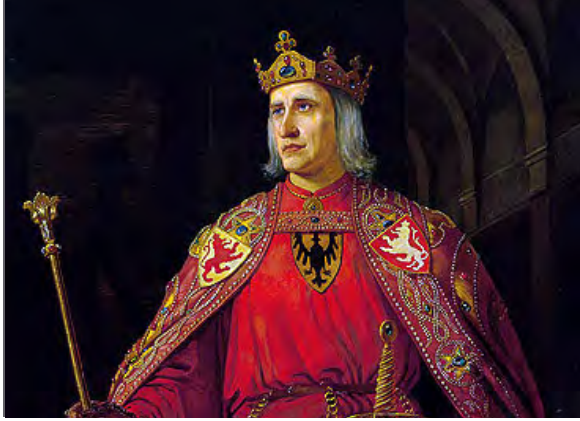
Rudolf I of Habsburg

In 1273, Hohenstaufen rule ended with the election of Rudolf of Habsburg as king. Until the middle of the 15th century, the throne alternated between three families—the Luxembourgs, the Wittelsbachs, and the Habsburgs. During the 14th and 15th centuries, Germany began to prosper. Its location helped the country grow into a major commercial and industrial center. 39, 40