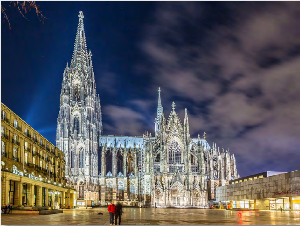
Cathedral of Cologne