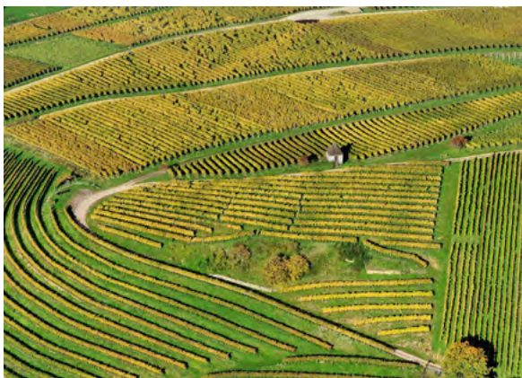
Aerial view of vineyards at Markgräflerland

The country is able to meet approximately 90% of its domestic food needs and is the third largest food exporter in the world. 12 Germany's produces a variety of agricultural products including potatoes, grains, sugar beets, fruits, vegetables, and livestock. 13, 14