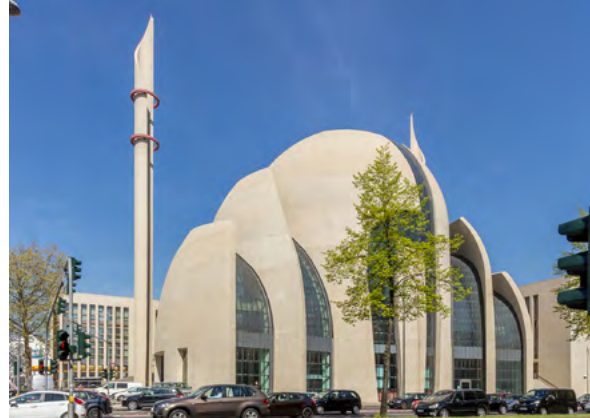
Cologne Central Mosque

Muslim population is growing because of Angela Merkel’s “open-door” immigration policy. 4 The influx of foreigners and refugees revealed cracks in the national social fabric. Anti-immigrant, particularly anti-Muslim, sentiments sharpened the divide between those who view themselves as “truly German” and immigrants. Right-wing parties are on the rise and violence occasionally erupts, forcing Germany to continue to reflect on its Nazi past. 5, 6, 7 The nation is also still addressing the problems created by the unification of East and West Germany. 8, 9