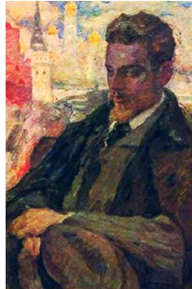
A portrait of Rilke

Herman Hesse is one of the most widely read German authors; Hesse won the 1946 Nobel Prize winner in literature. Hesse's most popular novels are Siddhartha (1922) and Steppenwolf (1927). 96 Other famous authors who made their mark on the literary world are Heinrich Böll; who won the Nobel Prize for literature in 1972; Thomas Mann who won the Nobel Prize for literature in 1929; the playwright Bertolt Brecht; and Christa Wolf, who came from East Germany. 97 Günter Grass, author of The Tin Drum and winner of the 1999 Nobel Prize in literature, wrote about the Nazi-era and became the literary voice of post-war Germany. 98