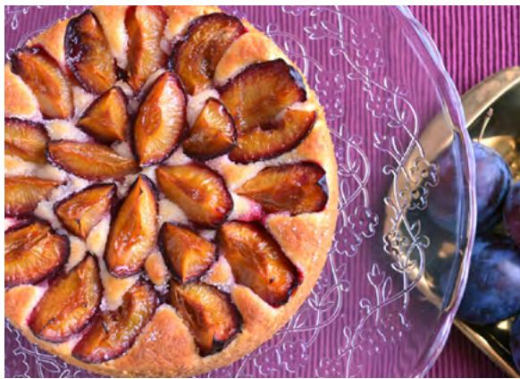
Pflaumenkuchen - plum cake

Traditional desserts include cakes and pastries known as Strudel . Popular choices are Käsekuchen (cheese torte), Pflaumenkuchen (plum cake), and Apfel Strudel (apples and raisins cooked in a light pastry). 65 One of the best-known desserts is the Schwarzwälder Kirschtorte (Black Forest fudge), a chocolate cake layered with whipped cream and cherries topped with sour cherries and chocolate shavings. 66