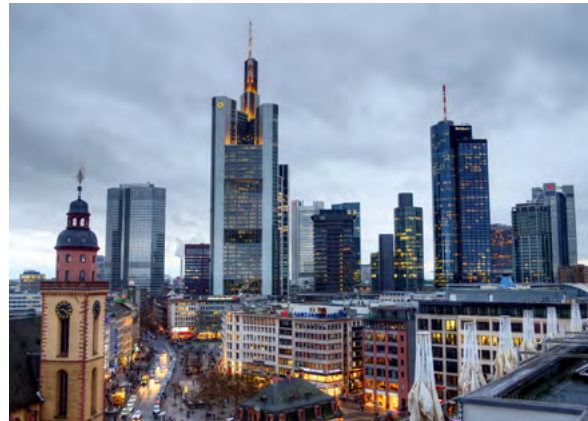
Skyline of Frankfurt city

The economy is strong. Germany is Europe's largest creditor, the world's fourth-largest economy, and it has the fastest growing economy among the G7 nations. 142 Economic gains have been greater in the western regions where citizens enjoy a higher standard of living than those in eastern Germany. Unemployment is higher in the east than the west. 147, 148, 149