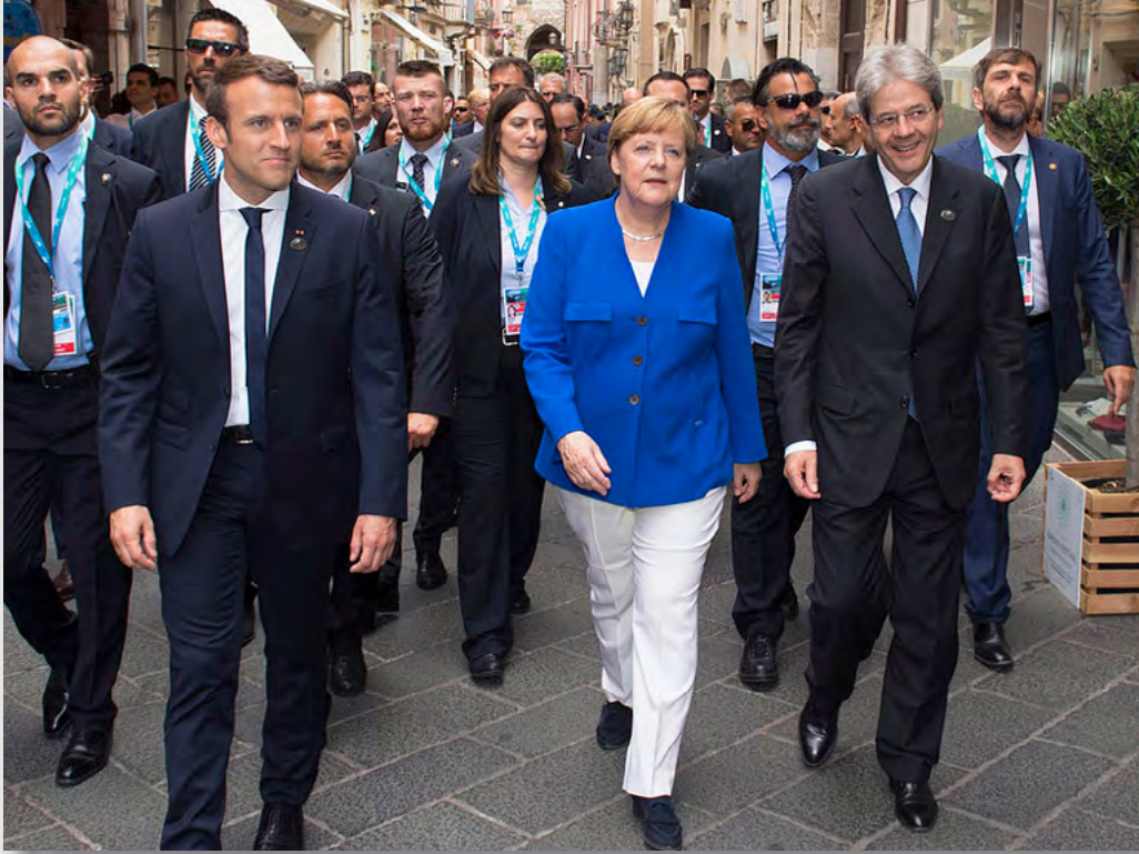
Summit G7 in Taormina, Angela Merkel with other European leaders