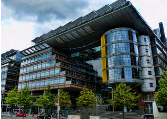
Daimler Chrysler building in Berlin

Low unemployment and government spending will foster private consumption. Low interest rates, immigration, and robust labor demands will sustain residential investment and push up wages, but business investment is set to strengthen only gradually. 104 A recent scandal in the auto manufacturing industry - the rigging of emissions software and allegations of cartel building - have caused a drop in investor confidence. It is still too early to determine the long-term effects of this scandal. 105