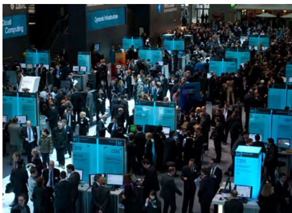
IBM stand during CeBIT 2010 at the Hanover fairground

Trade is a key aspect of the German economy. Germany accounts for about 9% of all international trade, and the country is the world's largest exporter and importer. 62, 63, 64 Germany accounts for more than half of the European Union's international trade. Approximately 25% of the nation's income comes from international trade, and about 20% of all jobs depend on international trade. Germany joined the World Trade Organization (WTO) in 1995. 65