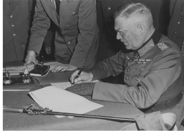
Keitel signs surrender terms, 8 May 1945 in Berlin

Roma, and the mentally ill—whom the Nazis considered “unworthy of life.” By 1942, the Nazis had developed highly efficient means of extermination in the Auschwitz death camp, after replacing carbon monoxide with the poisonous insecticide Zyklon B. At the height of the gas chambers operations, they were killing 6,000 Jews each day. 120