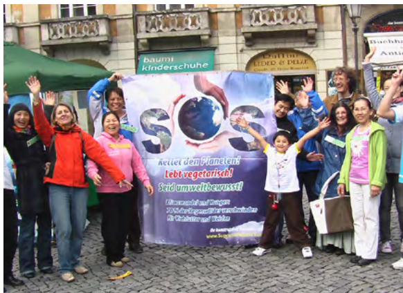
Protest against global warming in Munich

Climate change is a growing concern since it can raise the probability of extreme weather events including floods, drought, heat, and cold. 121 Extreme hot and cold temperatures can cause serious health risks and death. In 2003, extreme heat caused numerous deaths in the nation, particularly among the elderly. Rising temperatures in the cities and falling water levels in the summer can affect groundwater levels. 122 Extreme cold has also been responsible for deaths, particularly in the southern regions around Munich. On 6 January 2014, Germany recorded its coldest temperature; in the eastern state of Saxony, the temperature dropped to -28^{\circ}\text{C} ( -18^{\circ}\text{F} ). 123, 124