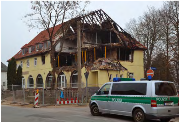
The fire-damaged house used by the Nationalsozialistischer Untergrund in Zwickau

Germany has led European sanctions and condemnation in Response to Russia's 2014 annexation of Crimea and ongoing support for separatist fighters in eastern Ukraine. 121 In 2015, Germans began to feel the effects of the war in Syria when over one million refugees streamed into their country. The foreign policy priorities of the U.S. administration, especially the expectation that NATO allies honor their commitment to spend at least 2% of their GDP on their militaries, have changed the way Germans discuss security issues. Military spending among NATO allies increased their spending by a combined USD 46 billion in 2017. 122, 123