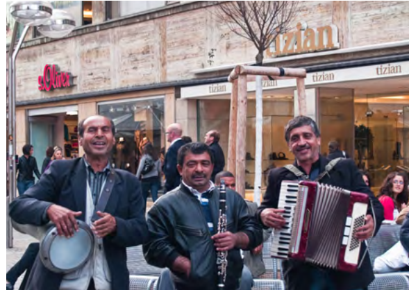
Turkish immigrants playing music in Stuttgart

Germany is the second most favored destination in the world for immigrants after the United States. 22 Since 2015, more than a million migrants arrived in Germany, many of whom remain undocumented. The 2016 Integration Law is intended to regulate the rights and responsibilities of legitimate asylum seekers. 23, 24 The influx of war refugees from Syria and economic migrants from Asia and Africa has brought the number of people with a "migrant background" to 18.6 million. 25