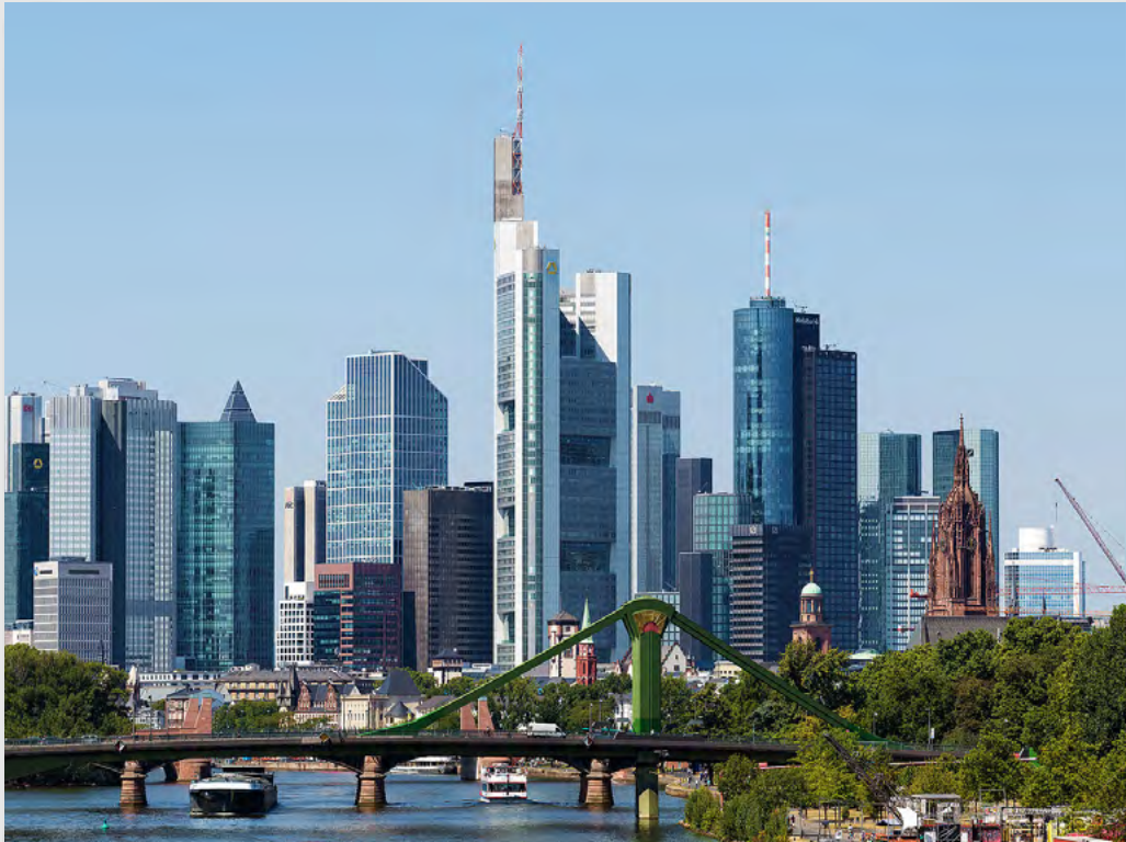
Frankfurt, the financial capital of Germany