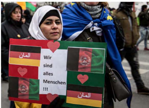
An Afghani woman demonstrating against deportation

in public pools. Some states forbid civil servants and teachers from wearing any religious symbols. 43, 44