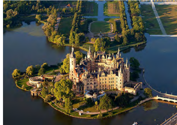
Schwerin Palace on its island at Lake Schwerin

In 2017, tourism accounted for approximately 4% of Germany's GDP. 74 The travel and tourism industry employs 14% of the workforce. Germany's tourism is based on cultural assets such as museums, arts, and festivals. The cruise and adventure tourism sectors are growing. 75, 76