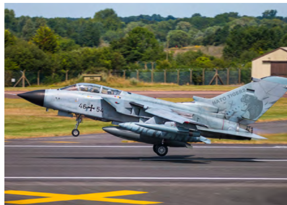
German Air Force Tornado IDS

Personnel receive high levels of training, particularly in cooperation with NATO forces. Pilots receive much of their training in the United States or Italy. 116