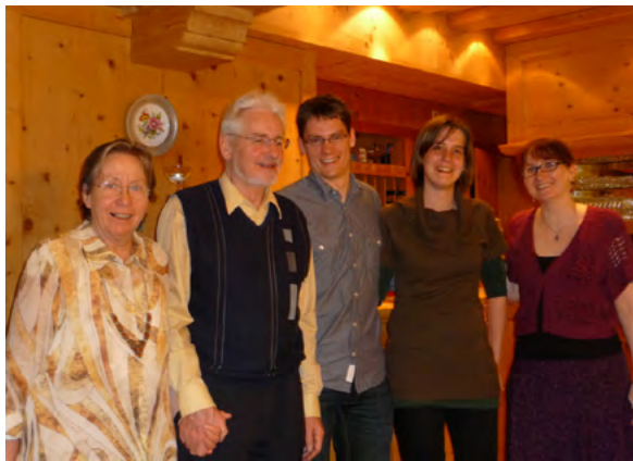
Family trip to Schwangau in Bavaria

In recent years, Germany’s population has been shrinking because the country’s birth rate has been declining, while the death rate has been rising. 10 For many people in this high-performance society, the focus on career success has led to a de-emphasis of family life. Many Germans have no interest in getting married or having children. 11 As the population ages, nearly one in five Germans is now 65 or older. 12 Due to record immigration numbers in recent years, including more than one million asylum seekers, and a slight increase in birthrates, Germany’s population hit a record high in