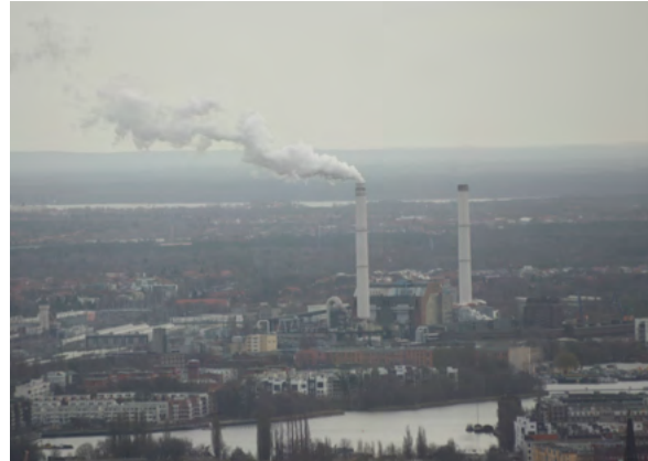
Air pollution in Berlin