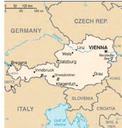
Map of Austria

Germany and Austria share a common history and language. The two nations have strong ties concerning economic, cultural, and academic exchanges. Nearly 30,000 Germans study in Austrian universities and 8,000 Austrians study in Germany; most degrees and certifications are mutually recognized. Due to their shared language, the media and publishing markets of both countries are interconnected. The Austrian state broadcaster often airs the same programs as German TV stations. Germany is Austria's most important economic partner. Austria-based German firms employ nearly 100,000 Austrians. Both countries call for a fair distribution of refugees among EU member to resolve the refugee crisis. 40, 41