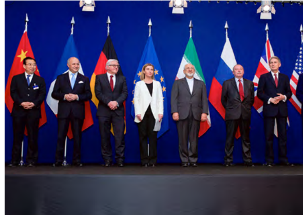
Negotiations about Iranian Nuclear Program, April 2015

Germany is committed to defending the euro currency and ensuring the stability of the EU. Chancellor Angela Merkel's austerity stance during the Greek financial crisis angered some nations, but Germany's economic leverage in the EU means it has significant influence over the measures taken to help Europe recover from the European debt crisis. 3, 4 The euro crisis, also called the European debt crisis or the Eurozone debt crisis started in 2009 when Greece was going to default on its debt, then affected Ireland, Italy, Spain and Portugal as the euro came under pressure from large national debts that required an enormous rescue package from the European Union, led by Germany and France. 5