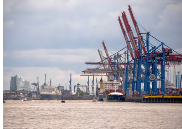
Port of Hamburg

Germany's global exports in 2016 included motor vehicles (18% of total exports), machinery and computers (16%), electrical equipment (10%), pharmaceuticals (5.7%), medical equipment (4.8%), plastics (4.6%), aircraft and spacecraft (3.5%), along with iron and minerals. 66 Germany's main export partners in 2015 were the United States, France, the United Kingdom, the Netherlands, and China. Germany imported most of its goods from the Netherlands, France, China, Italy, Poland, and the United States. Main imports included machinery, data processing equipment, vehicles, chemicals, oil and gas, metals, electric equipment and pharmaceuticals. 67, 68, 69