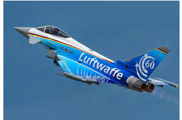
Eurofighter Typhoon EF2000 of the German Air Force

The military has 180,000 active personnel and 30,000 reservists. Since 1994, the Bundeswehr has been involved in defense and peacekeeping missions as part of UN or NATO forces; the Bundeswehr also participates in humanitarian missions. 101, 102