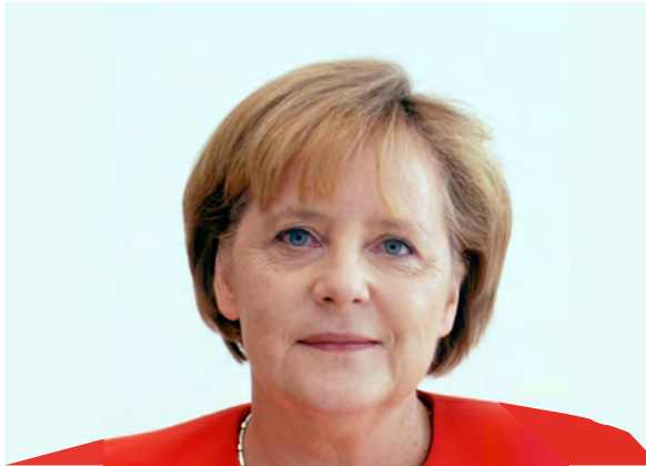
Chancellor Angela Merkel

he focused on economic reforms, but the economy continued to worsen. In 2005, challenger Angela Merkel, who grew up in East Germany and was the candidate of the Christian Democratic Union Party (CDU), defeated Schröder. Under the leadership of Germany's first female chancellor, prosperity returned. Merkel was re-elected chancellor in 2009 and again in 2013. 135, 136, 137 In September 2017, Merkel won a fourth term as chancellor of Germany. The far right Alternative for Germany (AfD) won a little over 12% of the votes and entered the lower house of parliament, the first far-right party to do so since before WWII. 142, 143