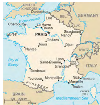
Map of France CIA

French-German diplomatic relations have been more a matter of pragmatism than a true affinity for each other. Cultural, political, and historical differences underlie many of the divisions between the two countries. Relations have often been fraught with mistrust, frustration, and misunderstanding. Since Germany's reunification in 1990, the partnership with France has been more fragile than ever. The two nations continue to cooperate on defense issues. 64, 65