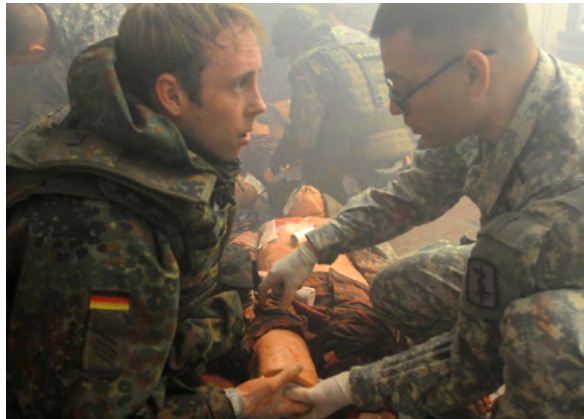
U.S. and German medical training

In spite of these developments, most Germans continue to support centrist politicians and policies. After the 2017 elections, many Germans took to the streets to protest the success of the far right AfD (Alternative for Germany), which won 12% of the votes, enough to enter the Bundestag. 157, 158