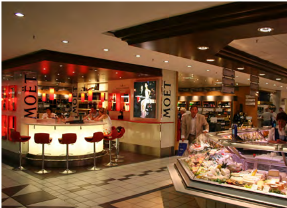
The 6th-floor food hall at Kaufhaus des Westens, Berlin

Traditional German meals often revolve around three staples: bread, meat, and potatoes, but contemporary cuisine is lighter and more international. 50, 51, 52