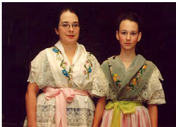
National costume of the Sorbs in eastern Germany

German nationality depends on a person's Blutrecht , or blood right . 26 This means that a child must have at least one German parent who is a German national. A change in German law, which took effect in 2000, allowed some immigrants to claim dual citizenship and obtain a German passport. 27 In 2014, a new citizenship law came into effect that allowed children of immigrant parents, who have lived in Germany for at least eight years and attended German school for six years, to claim dual citizenship. Those who do not meet these requirements have to choose one nationality. 28