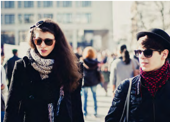
People's Daily Attire

Suits, sports coats, and long pants are typical business attire for men. Women often wear skirts, dresses, or pants suits. Jeans and t-shirts are typical casual attire, especially among the young. 70, 71