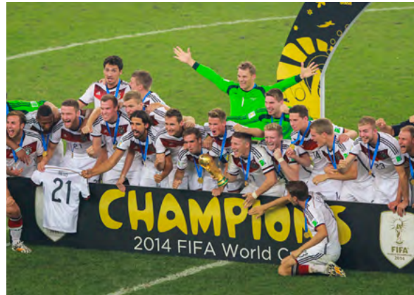
Germany, winner of the 2014 FIFA World Cup

Handball has been a popular sport in Germany for over a century. Germany's national handball teams won the men's world championship in 1978 and 2007 and the women's world championship in 1993. Currently, 750,000 Germans belong to some 4,400 handball clubs. 146