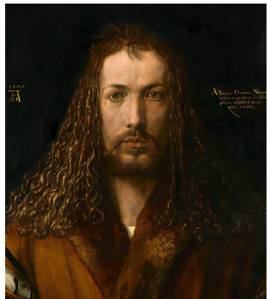
Self-portrait of Albrecht Durer

German painting goes back a thousand years, beginning with works painted by clergy on the walls of churches. Germany's most famous Renaissance artist is Albrecht Dürer (1471-1528). Born in Nuremberg, Dürer worked in a variety of media including engravings, paintings, and drawings. 107 The Augsburg-born Hans Holbein the Younger (1497/98-1543) painted meticulous and realistic scenes of the court of King Henry VIII of England. 108 In the early 19th century, Caspar David Friedrich (1774-1840) exemplified the German Romantic movement with vast landscapes that conveyed the power of