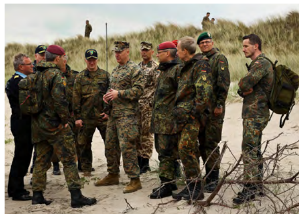
1st Battalion, 23rd Infantry Convoy and German military

Cooperation between Germany and the United States on security issues and NATO are evolving. Germany hosts a large contingent of American forces on its soil. Landstuhl Regional Medical Center (LRMC), the largest military hospital outside the continental United States, which serves as the first stop for US troops wounded in action, is located in Germany. 21 The only two military regional commands stationed outside the United States are located in Stuttgart (USEUCOM and USAFRICOM). German troops receive training in the United States and participate in joint exercises. 22