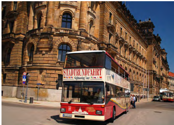
Dresden touristic tours

Germany is the seventh-most popular world destination for tourists, the second-most popular destination for European travelers, and the most popular destination for young Europeans. In 2016, more than 80 million international visitors spent a night in Germany. Visitors from European countries accounted for almost three-quarters of international overnight stays. In addition to leisure travel (60% of the market), Germany has become Europe's most popular business travel destination (25% of the market). Non-European visitors come