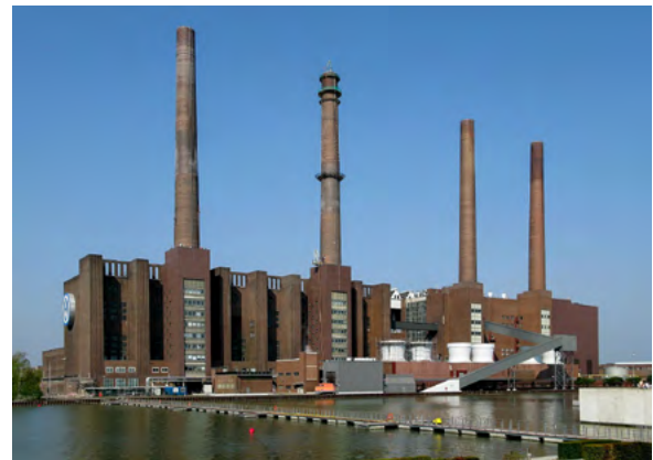
Volkswagen AG headquarters in Wolfsburg

Germany is the most industrialized nation in Europe and the third-largest manufacturer in the world. 23, 24 Key industrial products include steel, coal, cement, chemicals, machinery, vehicles, electronics, and automobiles. Shipbuilding and textile manufacturing are also important. 25, 26 Germany's industries weathered the economic downturn in Europe better than most countries in the Eurozone. 27, 28, 29