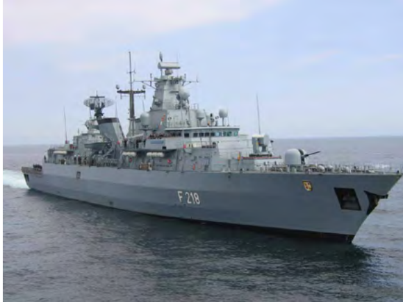
Anti-Submarine Warfare frigate

The German Navy ( Deutsche Marine ) is the smallest branch of the German military. The navy has a fleet of 80 vessels including nuclear-powered submarines, frigates, corvettes, mine warfare vessels, and patrol craft. Its forces have been deployed in support of UN missions. Most of the naval operations involve cooperation with NATO and the EU. 110, 111