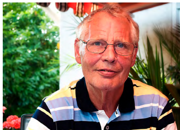
Stay at home dad

Germany's family policy has created a number of problems for women and families. The "additional earner" marriage policy means that German fathers work more following the birth of their children. The husband generally receives tax credits and lower tax rates while the wife loses about three-quarters of her income as the "supplementary" earner. This frequently means that women become part-time workers since there is no incentive for her to continue her professional career. 91