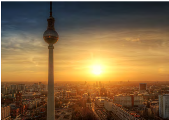
Skyline of Berlin

Economic growth is expected to remain stable, and the unemployment rate is expected to fall to 3.7% by the end of 2018 or early 2019, well below the OECD average. The introduction of a federal minimum wage in 2015 did not slow the decline in unemployment and wages will likely continue to grow. 99, 100 The average household net-adjusted disposable income per capita is USD 31,925 a year, more than the OECD average of USD 29,016 a year. However, there is a large gap between the richest and poorest, as the top 20% of the population earn more than four times as much as the bottom 20%. 101