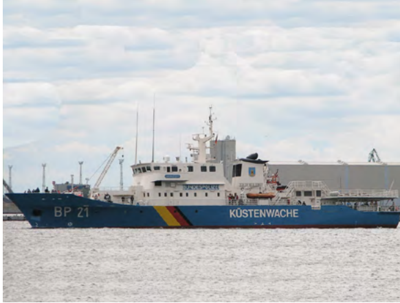
Bundespolizei cutter BP 21 Bredstedt

buildings, embassies, and more. There are 30,000 officers and 10,000 support personnel in BPOL. After the Munich Olympic massacre in 1972, the counterterrorist unit known as Grenzschutzgruppe 9 (GSG 9) was established. 93, 94, 95