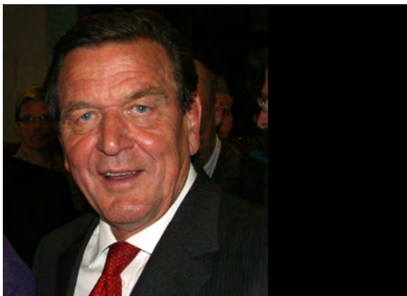
Gerhard Schröder

Reunification created serious challenges for the country. The economy of former East Germany was in shambles. Unemployment was high. The infrastructure needed repair and modernization. Social differences between unified Germany's eastern and western regions created additional problems. People from the east viewed western Germans as arrogant and insensitive. Those in the west found their eastern compatriots backward and unmotivated. As the cost of rebuilding former East Germany soared, the economy