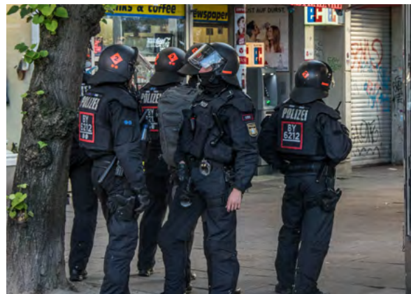
Police patrolling Hamburg during the G20 Summit, in 2017

Extremism on the left and the right is on the rise. 124 Members of the neo-Nazi terror cell, the National Socialist Underground (NSU), managed to kill 10 people, rob banks, plant bombs, and evade the authorities for 13 years before they were caught and put on trial in 2011. 125, 126 There is a substantial risk of politically or ideologically motivated crimes by foreigners and violence between the Turkish and Kurdish communities. 127 The effects of the failed 2016 coup in Turkey have also affected the security situation in Germany. 128