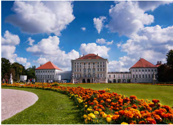
Schloss Nymphenburg palace in Munich, Bavaria

16th century. Protestants were not allowed to become citizens of the city until the 19th century. 61, 62