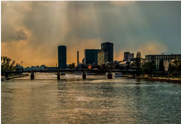
Frankfurt am Main

Germany has a low level of economic, financial, and political risk. 129 Its economic growth is expected to remain strong, and the low unemployment rate will likely continue to fall. Tax revenues are expected to provide the government with surplus funds, but that surplus will narrow somewhat due to rising oil prices. Poverty rates will likely remain low due to growing labor demands. Training programs for immigrants may help boost the economy. 130