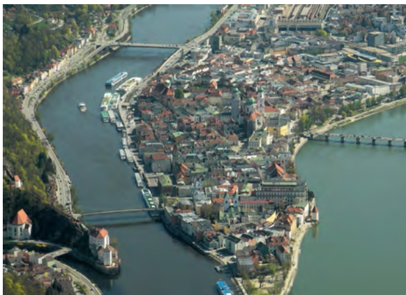
Danube river, aerial view of Passau

All of the major rivers in Germany flow northwards, except for the Danube, which flows from west to east. 21 The nation's longest river is the Rhine. The Rhine River originates in the Swiss Alps and courses 865 km (538 mi) through Germany. 22, 23 The river is one of Europe's most important waterways and has historically been used to ferry passengers and goods. The Rhine is lined with some of Europe's most famous old cities and modern industrial cities. The middle portion of the river was once heavily fortified and remnants of old castles can be seen today. 24