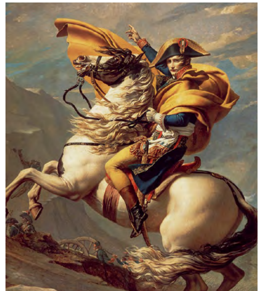
Napoleon Bonaparte

In 1806, Napoleon united the German region west of the Rhine by forming the Confederation of the Rhine and abolishing the Holy Roman Empire. In 1813, an alliance of Prussian, Austrian, and Russian forces defeated Napoleon at Leipzig and drove the French out of Germany. In 1814, diplomats gathered in Vienna to redraw the borders of Europe and create a permanent form of government for Germany. The new boundaries gave Austria, Bavaria, and Prussia a key role in the German Confederation. The Habsburg emperor presided over the legislative assembly, the Reichstag. 54, 55, 56