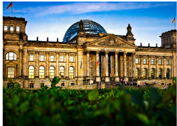
House of parliament - Reichtag, Berlin

The working-age population is expected to decline in the coming years. This trend suggests that Germany's continued economic strength will depend on foreign workers. Increased numbers of immigrants could fuel more dissent. Already, fractures are apparent as Germany tries to come to grips with growing anti-Islamic and anti-immigrant sentiments. 137, 138, 139