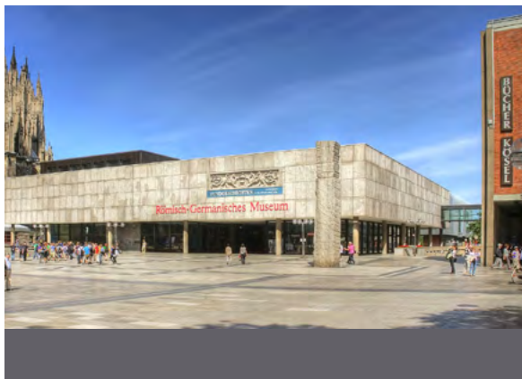
Roman Germanic Museum, Cologne

Cologne became part of the Prussian empire in 1815. World War II left the city in ruins and the population dropped from 769,000 to only 40,000. Cologne was rebuilt and now it is an economic and cultural center, with a high-tech economy, including telecommunications. 82