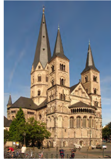
The Minter a church in Bonn

Although there are no official statistics on the religious makeup of Germany, estimates suggest that 27% of the population is Protestant, 29% Catholic, and 5.5% Muslim. Approximately 65% of the Muslim population is Sunni. Furthermore, 70% of the refugees and asylum seekers who arrived in Germany since 2015 are Muslims. Jews, Buddhists, Hindus, Yazidi, Sikhs, Baha'i, Jehovah Witnesses, Mormons, and Scientologists make up about 1% of the population; approximately 33% of the population claims no religious affiliation or adherence to another faith. 39, 40, 41