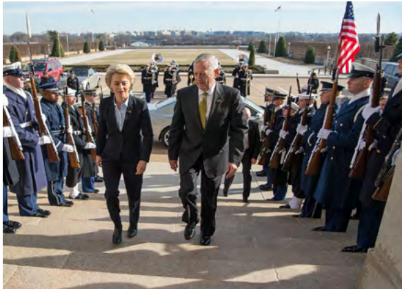
U.S. Secretary of Defense James Mattis with German Federal Minister of Defence Ursula von der Leyen in the Pentagon

Germany has a strong relationship with the United States. The partnership between the two countries is of paramount importance to Germany's foreign policy, security, and economy. Issues that shape relations between the two countries include regional and global security, economic opportunities, and cultural ties. 18