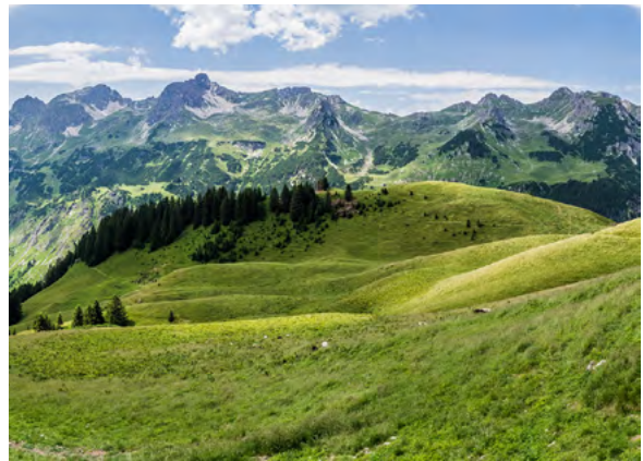
Algäu Alps

The triangular-shaped region of Germany's Alpen Foreland covers the southernmost section of the nation. From west to east, the region measures approximately 400 km (249 mi) in width while its maximum north-south width is about 150 km (93 mi). The elevation rises gradually from about 400 m (1,312 ft) along the Danube River to the foothills of the Alps at 750 m (2,461 ft). The Alps Mountain Range stretches along Germany's borders with Switzerland and Austria. The western Alps are referred to as the Algäuer Alps; the Bavarian Alps are in the center, and the Salzburg Alps are to the east. Many of the peaks in the Alps rise to least 2,000 m (6,562 ft). The highest peak in the country, the Zugspitze (2,963 m (9,718 ft), is located in the Bavarian Alps. 13, 14