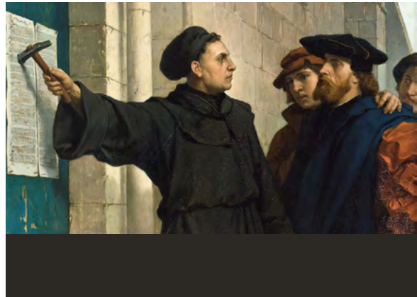
Martin Luther posting his 95 theses in 1517

In October 1517, a monk named Martin Luther posted his 95 theses on the gate of All Saints' Church in Wittenberg and forever changed Germany. His ideas revolutionized the relationships between man and God and questioned the church's dogmas. The Catholic Church fought against Martin Luther's ideas, but they quickly spread throughout Germany and the rest of Europe, aided by the movable type printing press, which was perfected in the mid-15th century by another German, Johannes Gutenberg. 41, 42 The era was marked by violence and wars, including the Knights' War of 1522 and the Peasants' War of 1524, in which 100,000 peasants from southwestern and central Germany perished. 43, 44