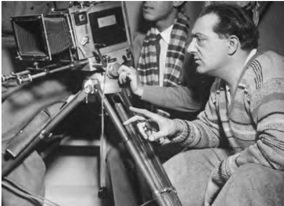
Film director Fritz Lang

German films influence the way Germans see themselves and understand their history. 101