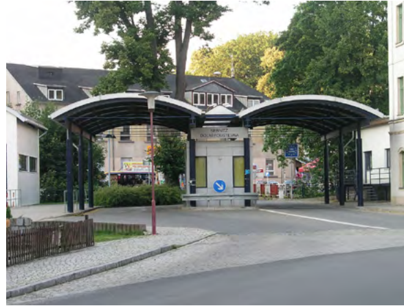
Border crossing point Dolní Poustevna from German side

The Czech Republic was established in January 1993 after the breakup of the former Czechoslovakia. 47 For nearly two decades, relations with Germany were strained, mostly because of the Nazi legacy and mutual atrocities the two people inflicted on one another during World War II. 48 By 2008, most disagreements between the two countries were settled. 49, 50