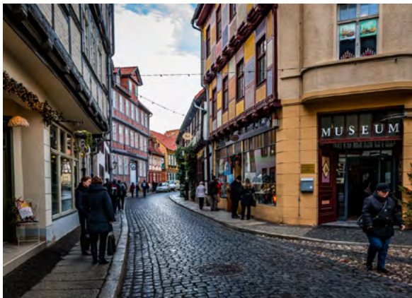
Street scene in Quedlinburg, Saxony-Anhalt

Germans have one of the highest standards of living in the world. The United Nation's Human Development Index rates Germany as one of the world's most developed nations, ranking sixth out of 187 countries that were studied. 85 Life expectancy is nearly 81 years, thanks in part to a healthy and active lifestyle and universal medical coverage. 86, 87 The average German completes about 13 years of schooling, which partially accounts for the generally higher wages in the nation. 88, 89