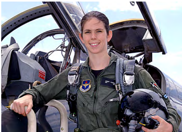
Ulrike Flender, the first female combat pilot