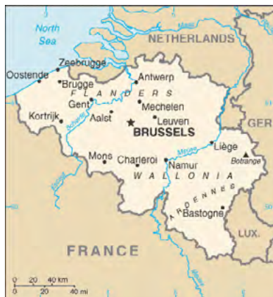
Map of Belgium CIA

Germany and Belgium have close ties; Belgium was one of the first countries to resume diplomatic relations with Germany after World War II. There are frequent high-level visits between the two countries and both agree on the need for continued integration in the EU. Since 2014, Belgium has implemented many economic reforms based on the German government's policies. The two countries have strong cultural relations that promote student exchanges, cultural projects, and the use of German in schools and universities. 42