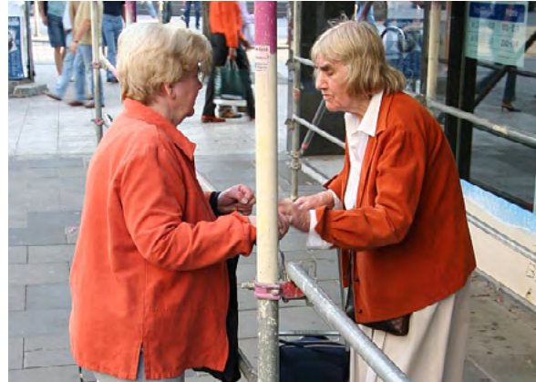
Aging population in Hamburg