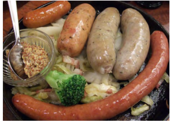
Bratwurst, one of the most popular foods in Germany

pig's stomach with onions and carrots), Schnitzel (breaded and fried meat cutlets), Schweinbraten (roast pork), and Sauerbraten (roast beef marinated in vinegar). 60, 61 Common vegetable dishes include cabbage served a number of ways such as Sauerkraut (fermented and pickled cabbage), Rotkohl (red cabbage), and braised red cabbage with apples. Kartoffeln (potatoes), are served as a salad, fried, or stuffed. 62, 63, 64