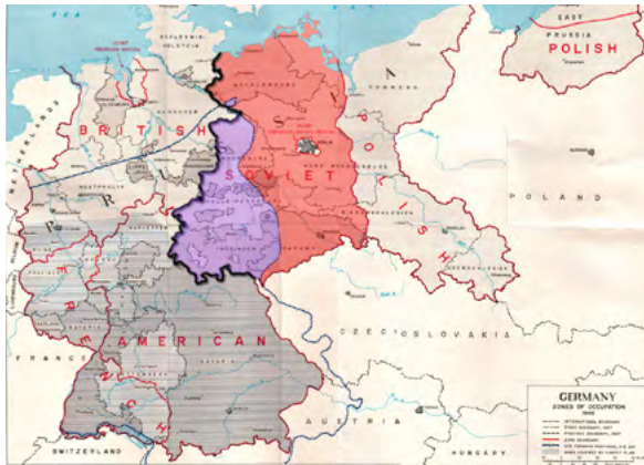
Map of the occupation zones of Germany in 1945

Germany surrendered in May 1945. The country lay in ruins, and its infrastructure was destroyed. The German state no longer existed. The major Allied Powers: the United States, Great Britain, France, and the Soviet Union divided Germany into security zones. The western two-thirds of the nation fell under the control of the United States, Great Britain, and France. The eastern third of the nation, including the capital of Berlin, went to the Soviets. Berlin was also divided among the four Allied Powers. 123, 124, 125