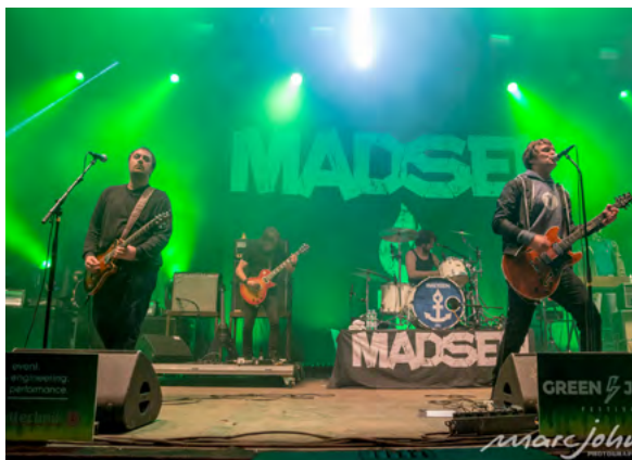
Green Juice Festival, August 2017 in Stadtteil Vilich, Bonn

Germany has a long and colorful music tradition. Around 10% of the population is involved in a musical activity. There are more than 21,000 choirs and thousands of orchestras and other musical groups in the country. Each year, Germany hosts more than 30 major music festivals. Germany is also home to more than 80 opera houses, many of which are funded by the government. 116