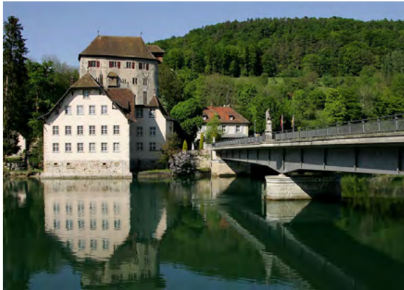
Rötteln castle, seen across from Kaiserstuhl (Switzerland)

Relations between Germany and Switzerland are cordial but tampered by tensions over Switzerland's insistence on maintaining its banking secrecy laws. In 2008, concerns over tax evasion by German citizens prompted the German finance minister to demand that Switzerland be placed on a blacklist. 85 Germany demanded more concessions from the Swiss, who would not be moved, and compromise appears elusive. 84, 85