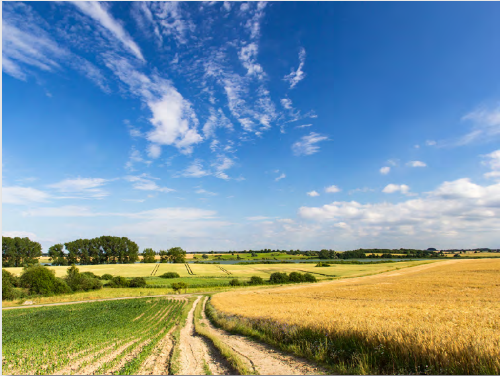
Wheat fields in Bildern Flickr / Marlis Börger