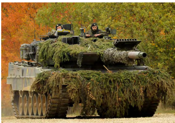
German Army Leopard II tank

The German Army has approximately 45,000 soldiers, supported by about 130,000-145,000 reservists. 107 Structural reforms emphasize flexible light forces and adaptability. The deployment of troops is a controversial topic in Germany. 108