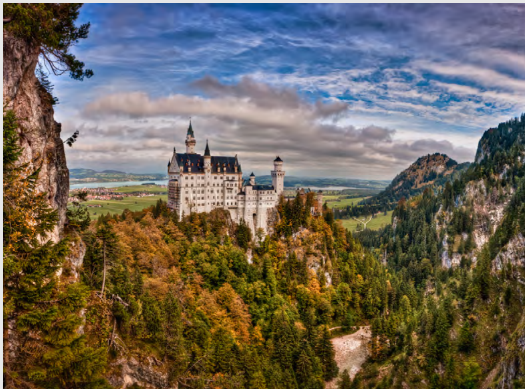
Schloss Neuschwanstein. Palace in Bavaria