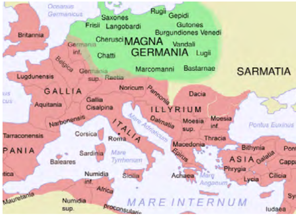
The Roman Empire in 116 AD and Germania Magna

Germanic tribes arrived in the area of modern-day Germany in approximately 100 BCE. Around 50 BCE, Roman forces attacked Germanic tribes that were east of the Rhine River. The Romans maintained the borders of their empire east of the Rhine and south of the Danube after repeated defeats. 14, 15, 16