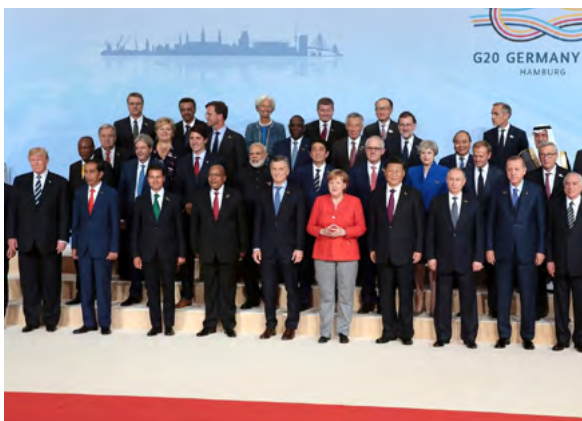
Germany hosted the G20 summit in Hamburg, 7-8 July 2017

Since the British voted in June 2016 to leave the EU, Germany had to redefine its position in Europe by assuming the leadership role over Europe for the first time in the post-World War II era. 6, 7, 8 Under Chancellor Merkel, Germany plays a leading role in the response to climate change, energy security, nuclear nonproliferation, the refugee crisis, and terrorism. The country values international peace and multilateralism. Germany contributes the most to the EU's budget, and is the third largest contributor to the UN. Germany supports the Middle East peace process, and helped the five permanent members of the UN Security Council reach a nuclear deal with Iran in 2015. 9, 10, 11