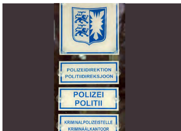
Bilingual signs German-Frisian at the police station in Husum

Other languages recognized under the European Charter for Regional or Minority Languages, and spoken in Germany, include Sorbian, North Frisian, and Sater Frisian. Danish is spoken near the Germany-Denmark border, and Romani is spoken by the Roma people. Immigrant languages such as Turkish and Kurdish are spoken by a fraction of the population. 35,