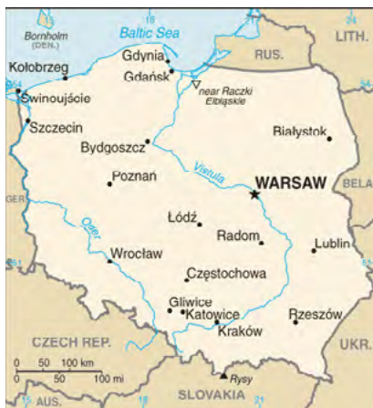
Map of Poland CIA

In 2016, Germany and Poland celebrated the 25th anniversary of the signing of the German-Polish Treaty on Good Neighborliness, Friendship, and Cooperation. Poland is one of Germany's key partners in the EU. The German minority in Poland is one of Poland's largest national or ethnic minorities. A deputy in the Polish Parliament represents the German minority. 77 Chancellor Merkel's mother was Polish, which has helped bilateral relations. 78