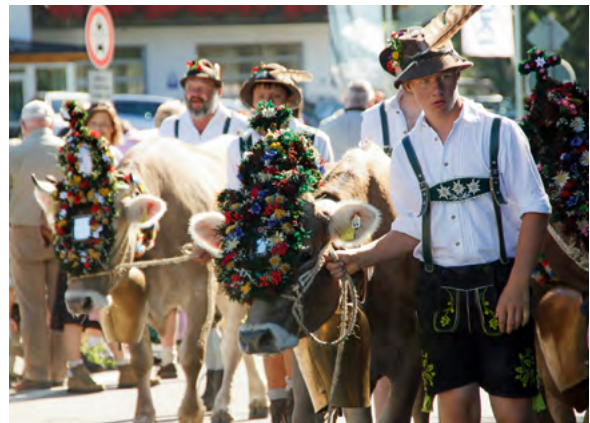
Men's Bavarian traditional leather pants

The Dirndl is a dress Bavarian gathered at the waist with a tight-fitting bodice. The garment is worn over a cotton blouse and an apron. The Dirndl is commonly seen in Bavaria, especially during Oktoberfest. When the Dirndl was popularized by the Austrian emperor near the end of the 19th century, the rough cotton material that typified such garments gave way to finer materials such as silk, satin, and brocade. Women generally wear the Dirndl with clunky-heeled felt shoes adorned with decorative buckles. 77, 78, 79