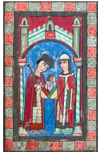
Henry V, Holy Roman Emperor (1086-1125)

The last Saxon king was succeeded in 1024 by a Salian from a Frankish tribe. The Salians established an alliance with the Catholic Church, but by 1075, this alliance weakened. War raged throughout the German kingdom between 1077 and 1122, further weakening the German king. 29, 30, 31