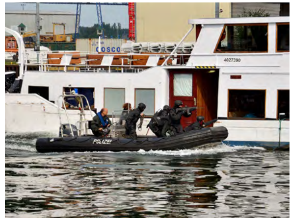
SEK operators raid a hijacked ship during a public exhibition

The Kriminalpolizei (Kripo) handles serious crimes such as assault, murder, rape, and grand theft. Kripo officials do not wear a uniform. The Schutzpolizei conduct daily law and order activities. Most of the states have special Autobahnpolizei (highway patrol), which is responsible for patrolling major highways. The Bereitschaftspolizei are trained in crowd control and can deploy water cannons and armored vehicles. Most state police agencies have a Wasserschutzpolizei (waterways police), which patrols rivers, coastlines, harbors, and large lakes. 98, 99