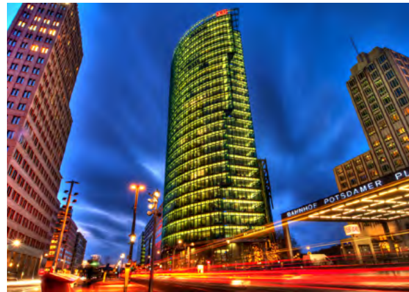
Skyscrapers at Potsdamer Platz in Berlin

Problems in the Eurozone and low interest rates are risks for the German banking industry. 81 Changing regulations and persistent earning pressure are ongoing challenges for German banks. 82 Slowing growth in the European Union means German banks are likely to suffer as they try to stimulate growth. However, low unemployment and a resilient economy stabilize banks' operating environments. 83