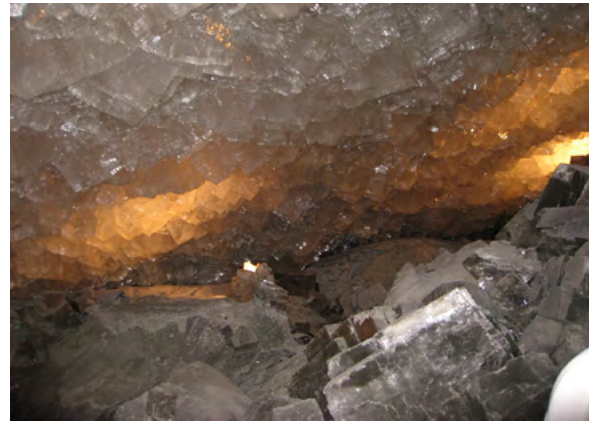
Potash salt mining in Merkers-Kieselbach, Thuringia

Germany has a few natural resources and must rely on imports. 54 Natural resources include coal, natural gas, iron ore, copper, nickel, potash, and salt. 55, 56 Most of Germany's hard coal mining operations are located in the Ibbenbüren, Ruhr, and Saar coalfields. 57 Lignite coal operations are located in four regions: the Rhineland around Cologne, Aachen, and Mönchengladbach; the Lusatian region in southeastern Brandenburg and northeastern Saxony; the Central region in southeast Saxony-Anhalt; and the Helmstedt region of Lower Saxony. 58 The copper mines are located in the Marsberg, Sauerland, and North Rhine-Westphalia regions. 59 The most abundant resources are arable land and timber. 60, 61