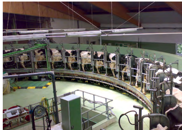
Milking carousel in a farm in Großberkmannsdorf

Germany is the largest food market in Europe. However, agriculture plays a small role in the economy, accounting for 0.6% of GDP and employing only 1.4% of Germany's labor force. 10 The agricultural sector is small, but it is highly mechanized, and productivity is high. Nearly half of Germany's land is used for agriculture. Large farms have replaced traditional family farms. 11