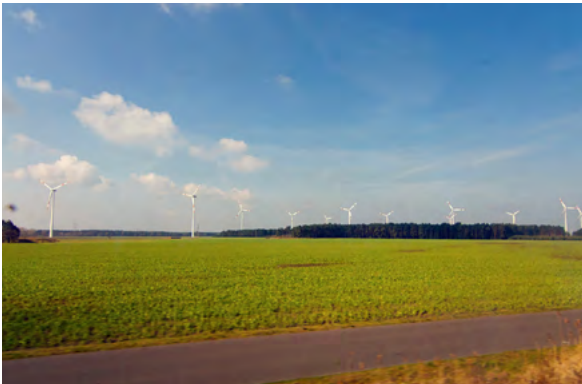
Wind turbines in Brandenburg

Germany is increasing its utilization of renewable energy. 43, 44 In 2016, 32% of the nation’s energy needs were met by renewable energy sources such as wind and solar power. 45 In the first half of 2017, Germany generated 35% of its power from renewable sources. Germany now leads the world in solar energy production. 46, 47