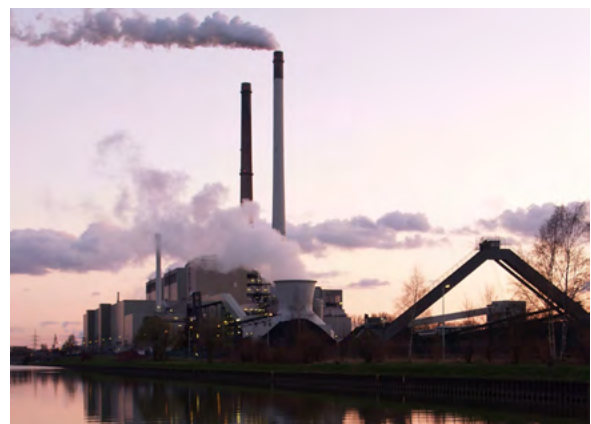
A coal power plant in Datteln

Germany faces a number of environmental challenges; chief among them is pollution. 101 The main contributors to air pollution are emissions from coal-burning industries, industrial overdevelopment, and vehicle exhausts (NOx). In 2013, the European Union told Germany that it must reduce air pollution. 102 Some of the recommendations called for banning cars from city centers, use of alternative fuels, transition to electric vehicles, enforcement of stricter testing and controls, and more space for bicycles and public transportation. 103 In 2017, Germany was facing court action if it did not take radical steps to reduce nitrogen dioxide pollution, which exceeded the limits in 28 areas of Germany, including Berlin, Munich, Hamburg, and Cologne. 104