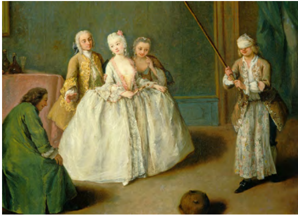
Topfschlagen game Flickr / Pietro Longhi

The three-player card game known as Skat was first played in the early 1800s when Napoleon's soldiers would compete with Saxon students in the town of Altenburg. Another popular card game, known as Doppelkopf (two heads), is similar to Skat . Skat is more popular in the south, while doppelkopf is popular in the north. 147, 148