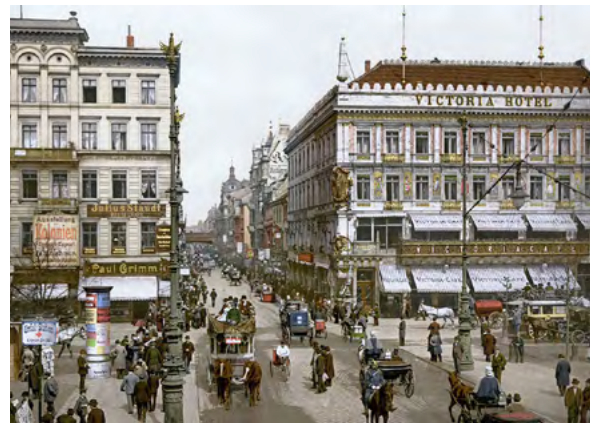
Berlin in 1871

Berlin is Germany's capital and largest city. The city was founded in the 13th century, but recent archaeological discoveries suggest that the region may have been inhabited earlier. 39, 40 In 1709, it became the capital of Prussia. Berlin was named the capital of the German Empire (Deutsches Reich) at the founding of the Second Reich in 1871. 41, 42 When the Weimar Republic replaced the German Empire at the end of World War I, Berlin remained the national capital. 43, 44