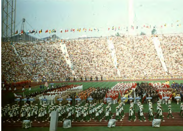
Olympic Stadium- 1972 Summer Olympics, Munich

hosted two Olympics, one in 1936 in Berlin and another in 1972 in Munich. 135, 136