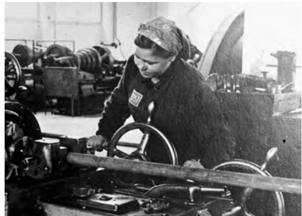
Woman working at the Auschwitz concentration camp

As soon as the Nazis took power, they began a policy of ridding Germany, and later all of Europe, of Jews. In 1933, the regime decreed that Jews could not hold civil service positions in Germany. In 1935, the Reichstag passed The Nuremberg Laws, The Reich Citizenship Law that took away the right to citizenship from Jews, and the Law for the Protection of German Blood and German Honor, which banned marriage and sexual relations between Jews and Germans. 114 During the night between 9 and 10 November 1938, the Nazis organized attacks on Jews and Jewish businesses all over Germany, Austria, and parts of Czechoslovakia in what is called Kristallnacht (Crystal Night or Night of the Broken Glass). In some places, the attacks lasted several days. 117