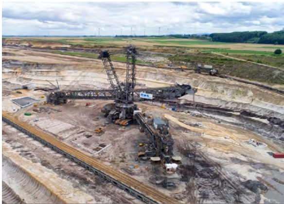
Brown coal facility in Lucherberg

Germany is Europe’s largest energy consumer and one of the top-10 energy users in the world. To meet its energy demand, Germany imports petroleum and natural gas. Petroleum imports arrive through five pipelines and four seaports. 34, 35 Germany is one of the world’s top oil refiners. 36, 37, 38