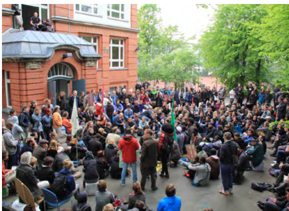
Refugee welcome center in Hamburg