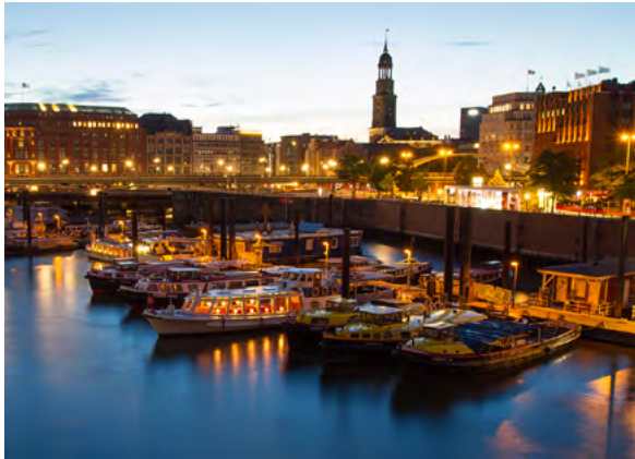
City of Hamburg

Hamburg, Germany's second-largest city is located on the Elbe River in north Germany. It is the location of Germany's largest seaport and a major commercial center. It is also the nation's major industrial city. 50 Few foreigners live in the city, which retains much of its unique culture evolving out of its years as an independent medieval state. The city is predominantly Protestant (75%). The remainder is Catholic with a small Muslim population. Only about 1,000 Jews reside in the city, a legacy of the Holocaust and World War II. 51