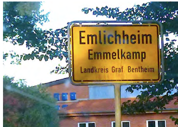
Sign in standard German (top) and low German (below)

There are as many as 250 regional variations of German. The three major dialectal divisions are: Low German ( Plattdeutsch ), which is spoken in the lowlands of the north; Middle German ( Mitteldeutsch ), with its many variations is spoken in the central region; and the Bavarian-Austrian dialect ( Bayrisch Osterreichisch ), which is spoken mostly in southern Germany. 33 The Alemannic dialect, common in southwestern Germany, has significant variations from the Hochdeutsch, and it has three subdivisions. 34