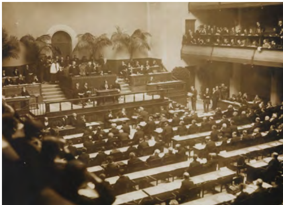
Official opening of the League of Nations, 15 November 1920

After the war, Germany was plagued by food and fuel shortages and widespread discontent. In 1919, Germans voted for democracy. An assembly convened in the small town of Weimar in February to draft a new constitution. The result was the creation of the Weimar Republic and a document that looked much like the constitutions of other European democratic republics. Meanwhile, the Allies were meeting in Versailles, France, to finalize the terms of Germany's surrender. 88, 89, 90