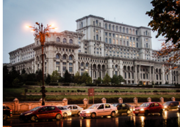
Palace of Parliament, Bucharest

main economic center of Walachia and its capital in 1659. 58, 59, 60 Between 1821 and 1859, the city was the site of several popular uprisings. With the unification of the principalities of Walachia and Moldavia, Bucharest became the capital of the Romanian state in 1862. It became the capital of modern-day Romania when Transylvania joined the union. 61, 62 Between 1916 and 1918, Germans occupied Bucharest and Romania's government was transferred to the city of Iași. 63, 64 When Bucharest became the capital again at the end of World War I, the city once again became the most important city in the nation. 65