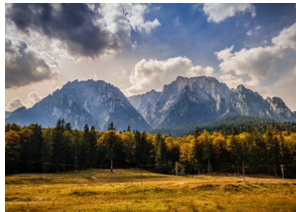
Bucegi Mountains, Carpatians

Romania can be divided into three geographic regions of approximately equal size: mountains (31%), hills (33%), and plains (36%). 13, 14 The Carpathian Mountains extend approximately 967 km (600 mi) across Romania and can be subdivided into the eastern, southern, and western ranges. 15 The eastern range extends south from Romania's border with Ukraine to the Prahova Valley. The highest peaks in this range rise to approximately 2,303 m (7,556 ft). On the western fringe of this range are the volcanic Oaş and Harghita ranges. 16, 17 The southern range, known as the Transylvanian Alps, is bordered by the Prahova River Valley on the east and the Timiș and Cerna river valleys on the west. The peaks in this range are the highest in the Carpathian Range. The two tallest peaks are Mount Moldoveanu at 2,544 m (8,346 ft) and Negoiu at 2,535 m (8,317 ft). 18, 19 The western range extends between the Danube and Someș rivers. The Iron Gates, a narrow channel that funnels the Danube River, lies in this range. 20, 21