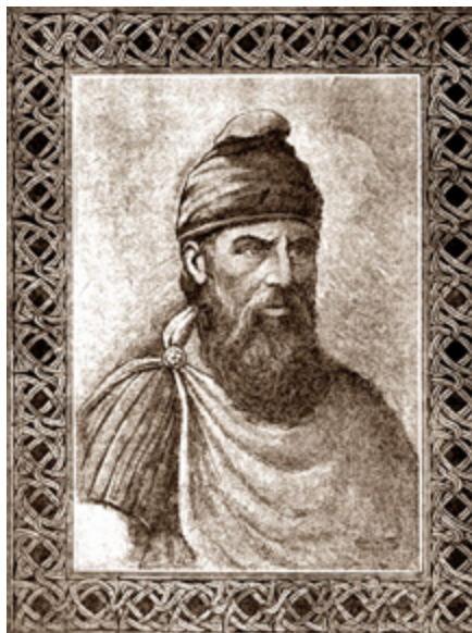
Dacian king Decebal

Between 2200 and 1200 BCE, Thraco-Getian tribes moved into the region. These settled agriculturalists lived primarily along the coastal regions of the Aegean Sea. In the sixth and seventh centuries BCE, the Greeks established a series of port settlements along the Black Sea coast and began trading with the Getians. In the third and second centuries BCE, the Romans expanded into the region. Their arrival united the Geto-Dacian tribes who opposed the Romans. The Roman leader Julius Caesar, was so concerned about the Geto-Dacian union that he planned to march against them but was assassinated before he could mount his campaign. That same year, the leader of the tribal confederation, Burebista, was assassinated and the tribal union dissolved. 16, 17, 18