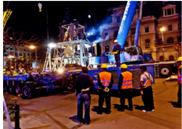
Workers moving a statue from Piata University, Buchares

Unemployment hovered around 7% for several years. 99 In January 2017, adjusted unemployment rate decreased to 5.4%, the lowest unemployment rate since 2008. This number, however, may underestimate the number of Romanians out of work. 100, 101 The labor market in Romania is characterized by low levels of employment and high inactivity rates. Because of demographic changes, the working age population is shrinking. 102, 103, 104