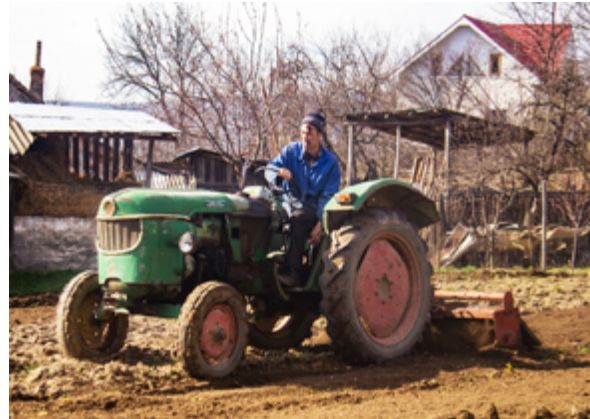
Tractor plowing the field in the spring

Agriculture, although underdeveloped, continues to play a major role in the economy. 9, 10 There are more than 5 million farmers in Romania. 11 Agriculture accounts for roughly 12% of GDP (Gross Domestic Product) and employs 28% of the labor force. 12, 13, 14 The main crops are wheat, corn, barley, sugar beets, sunflower seeds, potatoes, and grapes. 15, 16 Although Romania exports agricultural products, the nation does not produce enough food to meet domestic demand. Romania is a net food importer, relying on imports to supply 70% of its food needs. The farms are often small, averaging about 2 hectares (4.9 acres). 17 Farm productivity is typically low. Many farms are subsistence operations that provide for the needs of the family but contribute nothing to the general economy. Farms often lack modern technology and farming methods are outmoded. 18, 19