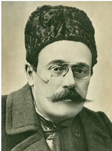
Ion Luca Caragiale

78 His contemporary Mihail Eminescu was broadly influenced by Hindu and German thought, which he melded into his Romanian roots. Eminescu elevated poetry in the nation and became one of Romania's most notable poets. 79, 80