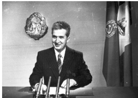
Nicolae Ceaușescu, A Romanian communist leader

By the late 1980s, Romania was a virtual police state. 102, 103 The people were in desperate straits, and dissatisfaction with Ceaușescu soon boiled over into revolution. On 19 December 1989, Ceaușescu ordered his security forces to fire on protesters in Transylvania. Demonstrations then spread to the capital of Bucharest. The army abandoned Ceaușescu on 22 December and joined the protesters. Ceaușescu and his wife were captured as they tried to escape from Bucharest. On Christmas Day, they were tried and convicted of mass crimes against the people and executed. 104, 105, 106, 107 The Communist Party withered with Ceaușescu's death. 108, 109