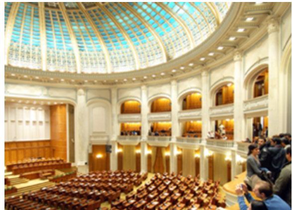
The session room of the Chamber of Deputies of Romania

Romania is Europe's second poorest nation. Its economic future seems somewhat uncertain, due to the mass exit of Romanians from their country. Romania's population has decreased by 4.5% between 2011 and 2015 (2.5 million people have left the country). Only Syria surpasses the migration rate of Romania. The brain drain is creating a severe talent shortage for employers who cannot fill positions that require highly skilled workers.