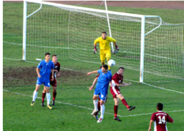
Soccer game

Romania's most popular sport is soccer, and fans flood to the many soccer stadia throughout the country to watch local leagues compete. More than 100,000 players in 3,000 soccer clubs participate in the sport. 104, 105 The Romanian national team has played in seven World Cups, most recently in 1998. 106, 107 In addition, the team has made numerous appearances in the European Football Championships. 108, 109 Tennis was popularized in Romania by Ilie Nastase, who received international acclaim in the 1970s. Nastase won seven major championships, including two singles trophies. Approximately 16,000 Romanians in 130 clubs play tennis. 110, 111