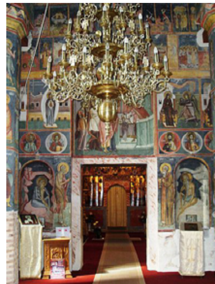
Interior view of the Snagov monastery

Romania's earliest literary works, traced to the fifteenth century, were based on religious texts. In the late 1600s, the Romanian monastery in Snagov became a regional center of literary activity. In the seventeenth century, works shifted primarily from religion to historical pieces. 75 In the 1700s, stories of social oppression and decadence of the ruling Ottomans dominated Romanian literature. One of the most significant works of the time is the Minei (Lives of Saints). Lyric poetry was also popular at this time, especially in the form of love songs. 76 Vasile Alecsandri, whose work included old Romanian folklore, was one of Romania's most accomplished poets of the second half of the nineteenth century. 77