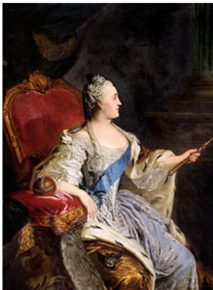
Empress Catherine the Great (1729-1796)

At the beginning of the eighteenth century, Russia was extending its influence in Europe to include the principalities of Walachia and Moldavia. The Russian czar, Peter the Great, attempted to seize Moldavia in 1711, but Turkish forces foiled the attempt. This move prompted the Turks to place Greek princes, known as Phanariots, on the throne of the two principalities, thus bringing Walachia and Moldavia more securely under Turkish control. Corrupt princes, however, wreaked havoc and brought the principalities to the brink of starvation. 52