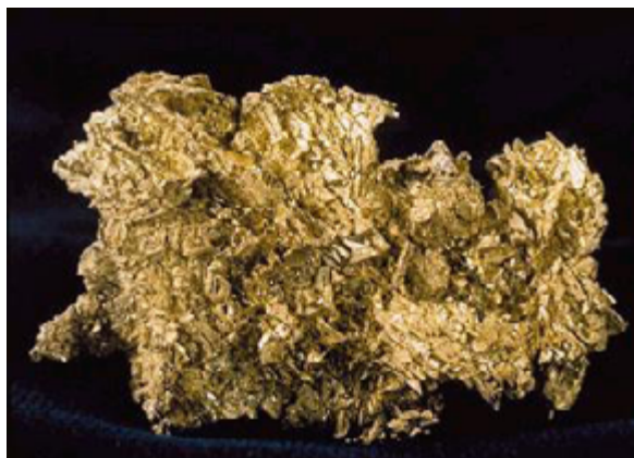
Romania, the largest gold deposit in continental Europe

Romania is a net electricity exporter. 49 Approximately 30% of its electricity is generated through hydroelectricity, 20% comes from the nation's 2 nuclear reactors, and the remainder comes from fossil fuels. 50, 51 Plans are under way to construct 2 additional nuclear energy plants, which will increase electrical production from nuclear energy to 40% by 2020. 52