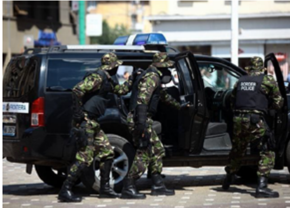
Romanian border police

The Romanian National Police (Poliției Române) is the nation's main civilian law enforcement authority. Under the Ceaușescu government, the National Police was a paramilitary state security force. The Romanian National Police has been reorganized and now reports to the Ministry of the Interior. The police has also demilitarized and closely resembles other European police forces. They are a civil law enforcement force. 84, 85 The public regards the police as one of the most