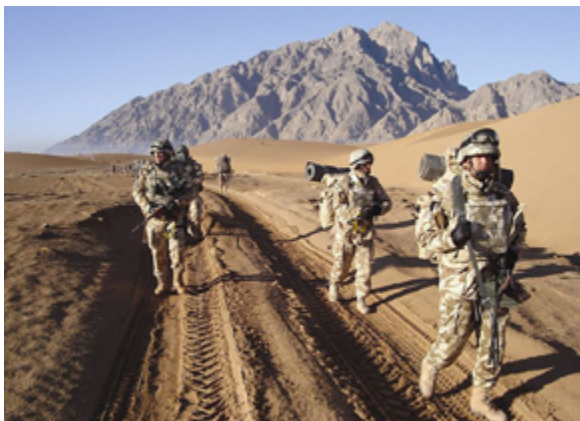
Romanian Land Forces on a Patrol mission in Afghanistan

The largest of the forces is the Romanian Army, which has roughly 55,000 active duty soldiers and an additional 15,000 reserves. 105 Romania's land forces are further divided into several other units including the infantry, artillery, and mountain infantry. 106 Combat readiness and force sustainment are problematic. About 150 Romanian troops are available and able to deploy on short notice. Other soldiers are available for deployment as part of the NATO Response Forces (NRF).