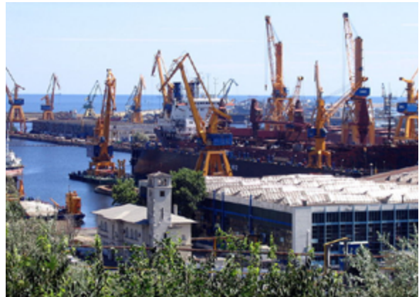
Shipyard in Constanța

Although Romania has an export-driven economy, it has carried a negative balance of trade since 1996. The situation has improved since 2008, when the deficit dropped to a record level, but the imbalance remains. Most of Romania's trade (70%) is with its EU partners. 55 Its largest export partners include Germany (20%), Italy (12%), France (7%), Hungary (5%), Turkey (5%), and the United Kingdom (4%). Major exports include machinery and transport equipment, raw materials, metals, and textiles. 56, 57 Imports include machinery and transport equipment, chemicals, fuels and minerals, metals, and textiles. Major import partners include Germany (19%), Italy (11%), Hungary (8%), France (6%), and Poland (5%). 58, 59