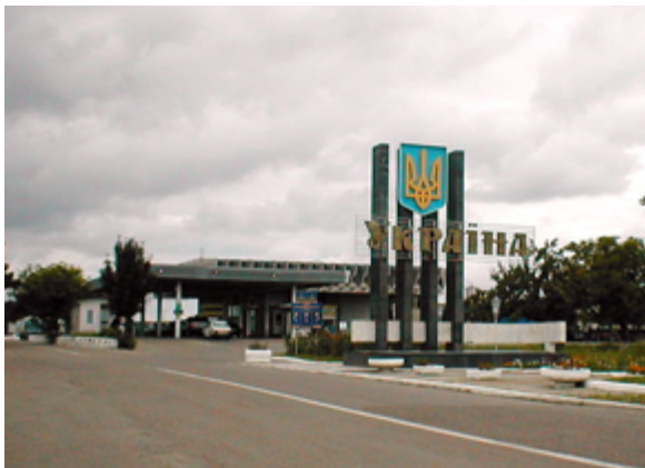
Ukraine-Romania border crossing

Relations with Ukraine were cool in the 1990s and early 2000s, but have improved since the beginning of the current crisis with Russia. 71, 72, 73 In 2009, the International Court of Justice (ICJ) resolved an outstanding territorial dispute over the continental shelf and entitlement to Serpent Island. The ICJ awarded 80% of the disputed territory to Romania, fueling Ukraine's fears that Romania harbored territorial aspirations in the region. 74, 75