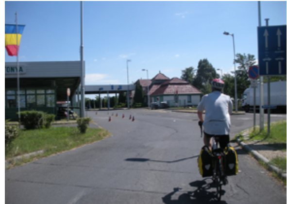
Hungary-Romania border crossing

Romanian-Hungarian political history is based on complicated relations. In the 1970s and 1980s, historical hostilities continued to manifest themselves and relations were tense. Many of the tensions stemmed from Romania's large Hungarian minority. 38, 39 In 2010 relations worsened with the election of a right-wing president in Hungary. One of the Hungarian president's first moves was to pass legislation making it easier for ethnic Hungarians in other countries, including Romania, to obtain Hungarian citizenship.