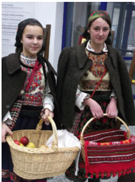
Traditional dresses of Transylvania

Traditional Romanian clothing has remained essentially unchanged for centuries. The basic garment worn by men and women is the chemise, or cămasă, a shirt made from hemp, wool, or linen. In the past, the chemise extended to the ankles for women and was often worn with a dark-colored skirt with red vertical stripes. On top, women wore blouses decorated with beautiful and delicate embroidered designs. Women traditionally covered their heads with a scarf decorated with floral patterns. Women often wore an apron over the chemise. The style of the apron showed regional variations. In Transylvania and southwestern Romania, women wore two aprons, one in the front and one in the back. In the east and southeast, the apron was a single piece of cloth tied at the waist. 63, 64