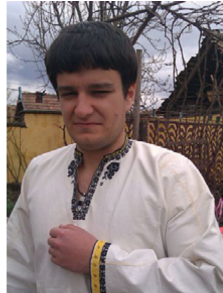
Traditional cămasă

Although the status of women in Romania has improved since the 1960s, a number of challenges remain. 68 According to the Social Institutions and Gender Index, Romania ranks low in gender equality. 69 Among European Union countries, Romania ranks lowest in gender equality. 70 Traditional gender-role stereotypes prevail. Women are expected to take the major responsibility for the household and child rearing. These attitudes have created barriers for women wishing to enter the labor force, especially in occupations typically considered to be reserved for men. 71, 72, 73 Women are also frequent victims of domestic violence. According to recent studies: 22% of women report having experienced domestic abuse sometime in their lives. 74