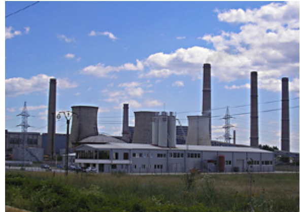
Coal power plant

Romania is the sixth-largest coal producer in Europe. Most of the coal is mined in the Oltenia Basin. The coal is mostly lignite and virtually all is consumed domestically, accounting for 22% of energy consumption. The nation's main coal-consuming power plants are the Turceni, Rovinari, and Mintia-Deva plants. 48