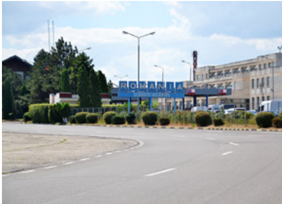
Moldova-Romania border crossing

Moldova and Romania have a long-shared history since Moldova was once a province of Romania. Relations with Moldova have been a central feature of Romanian foreign policy. 52, 53 When Moldova declared independence in 1991, Romania was the first state to recognize it on the same day. During the first half of the 1990s, the prospect of reunification was raised, even though it was not taken too seriously by the Romanian political leadership. 54