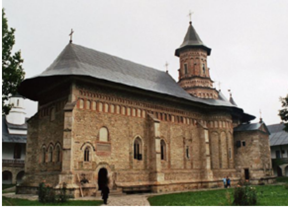
Romanian Orthodox church, Vânători-Neamț

years of communist rule in Romania, the Orthodox Church cooperated closely with the government. This allowed the Church to maintain its existence and remain active. After the fall of Nicolae Ceaușescu and the end of communism, the Orthodox Church experienced a revival. 42, 43 The Romanian Orthodox Church is closely aligned with the current government. As a result, it often receives special benefits. The Church is also the most trusted institution in the country. 44 Today the Church is building new church buildings, some of which are being paid for with government funds. 45, 46