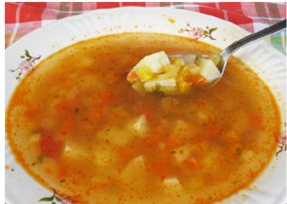
Ciorbă de cartofi, potato soup

Romanian cuisine reflects Romania's Turkish, Hungarian, Slavic, and Greek influences. 50, 51 The main meal of the day is typically served midday and includes several courses. The first course is often soup made with meat, noodles, or vegetables. A favorite soup is ciorbă de burtă , a soup made from tripe and flavored with garlic. 52 Borș , a thick cabbage soup made with bran, is a traditional favorite. 53 Ciorba is another favorite soup made with lamb, mushrooms, and leeks or any other meat or vegetable. 54 Many of the soups are served with hot peppers on the side, to be nibbled along with a spoonful of broth. 55