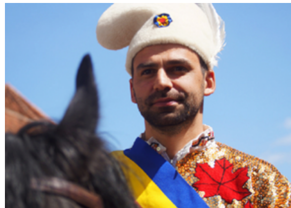
Young Brasov

Most ethnic Hungarians live in northwestern Romania. They are subdivided into two main groups: the Magyars and the Szeklers. Historically, Hungarians were nobles, granted land and title by the Hungarian king. 16 The Germans live mostly in Transylvania. They, too, can be subdivided into two main groups: the Saxons and the Swabians. The Saxons arrived in the 12th century by invitation of the Hungarian kings to help defend the region against invading Tatars and Turks. The king granted the Saxons complete administrative authority of the Sachsenboden region, which helped them establish their superior position in the region. 17 The Swabians came to Romania in the 1700s and are concentrated in the Banat region. 18