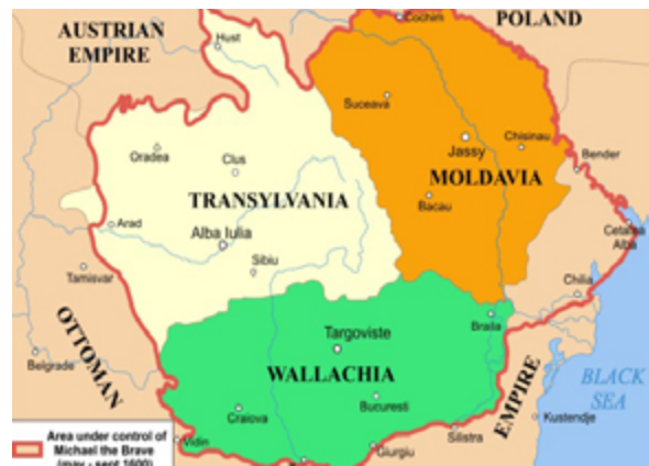
Moldavia, Transylvania and Wallachia

The newly established principalities of Walachia and Moldavia continued to strengthen in the 1300s even as Hungary asserted its sovereignty over both principalities. Although the prince of Walachia acknowledged Hungary's sovereignty, the head of the Eastern Orthodox Church in Constantinople established an ecclesiastical seat in Walachia. This recognition by the Church helped Walachia free itself from Hungarian rule in 1380. 31, 32