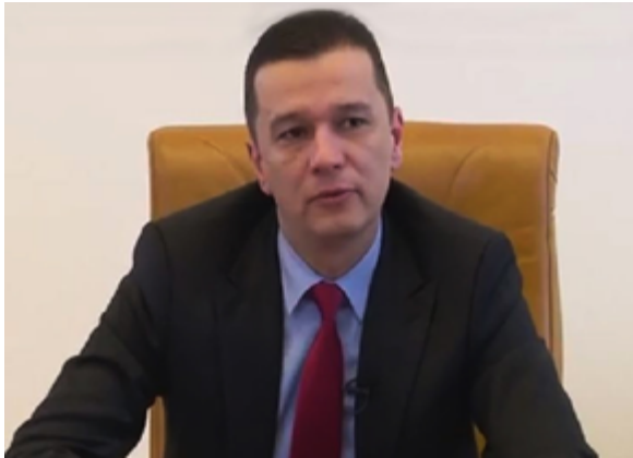
Romanian Prime Minister Sorin Grindeanu

seal Ponta's fate. After the fire, more than 20,000 demonstrators took to the streets to protest corruption and government malpractice; these demonstrations forced the resignations of Ponta and his government on 4 November. 133, 134, 135 The president quickly named former EU commissioner Dacian Ciolos as the new prime minister. 136 On 15 November, Ciolos named his new government, which continued in office until the elections in December 2016. 137