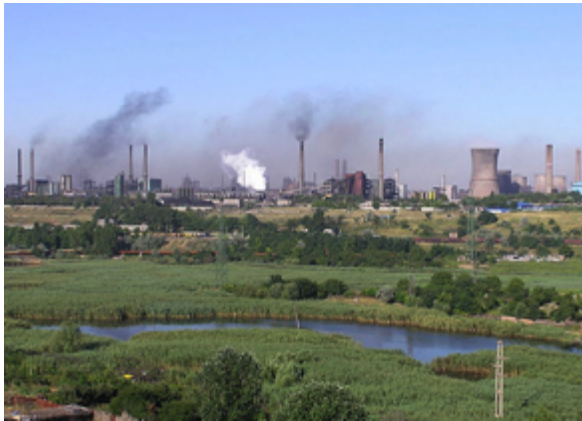
Arcelor-Mittal Steel Works

Romania's manufacturing and industrial centers are located mainly in Arad, Bucharest, Hunedoara, Iași, Oradea, Reșița, and Timișoara. 29, 30 Romania's industrial sector accounts for roughly 36% of GDP and employs 28% of the labor force. Main industries include electric machinery and equipment, textiles and footwear, light machinery, auto assembly, mining, timber, construction materials, metallurgy, chemicals, food processing, and petroleum refining. 31 The manufacturing sector has