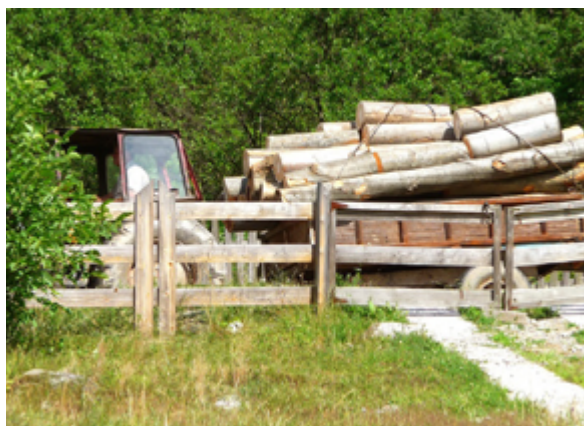
Illegal logging

Romania's fishing subsector continues to decline. High costs following the transition to a market-based economy made it financially prohibitive to maintain the nation's fishing fleets. Since 1995 production has generally dropped. 20, 21 Only 13% of the nation's fish come from marine fishing operations. The remainder come from fish farms (57%) or inland fishing sources (30%) such as lakes and rivers. Roughly 11,000 persons, excluding those who work in fish processing industries, are employed in this subsector, the majority of whom (46%) are subsistence fishers. 22, 23