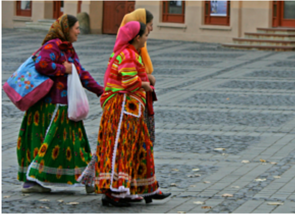
Roma women

Romania's ethnic homogenization policy under President Ceaușescu changed the ethnic makeup of the country. 27 One of the ethnic Germans, Klaus Iohannis, is the current president of the country. 28, 29 Although Hungarians generally resisted emigrating, thousands of Hungarian refugees did cross into Hungary during the 1980s. 30