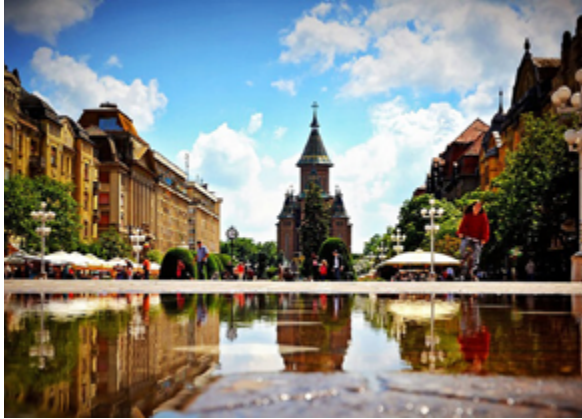
Metropolitan Cathedral, Timișoara

and later became the residence of Charles I of Hungary. The Turks seized control of the city in 1552; it remained under Turkish control until the Austrians seized power in 1716. 95 For the next 200 years, the city was ruled by the Austrian Empire. 96, 97 During Austrian rule, Timișoara was populated mostly by Swabian Germans. In 1920, the city was ceded to Romania under the terms of the Treaty of Trianon. 98 In December 1989, antigovernment demonstrations that swept the city sparked the national revolution that overthrew Nicolae Ceaușescu. 99, 100 Today, the influences of the many groups that ruled the city is evident in its cosmopolitan flair. Timișoara, a major cultural center, is home to the University of Timișoara and has a state theater, an opera, an orchestra, and a ballet company. The city remains a major commercial and industrial center. 101, 102