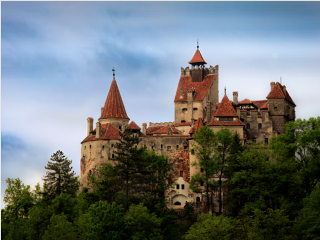
Bran Castle, Home of Vlad III Dracula Built in 1212