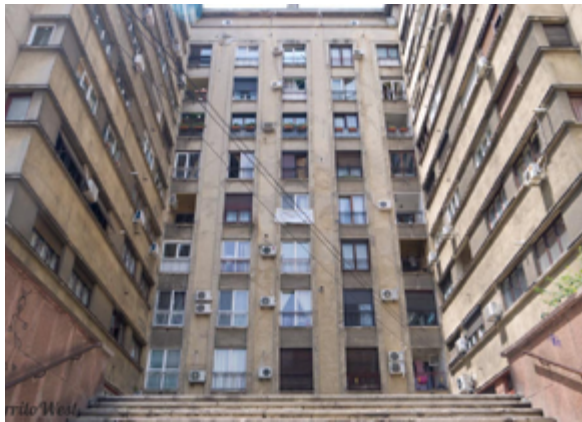
Apartment complex in Bucharest

Although the standard of living in Romania has risen over the last 20 years, the country has one of the lowest standards of living in the EU. 83, 84, 85 Nevertheless, according to the Human Development Index, Romania is a High Development country, ranking 54th out of 187 countries. 86 Life expectancy is nearly 75 years (71.5 for men and 78.6 for women), which places the nation 109th in the world and on a par with Saudi Arabia and the Gaza Strip. 87 Healthcare access has improved but remains available mainly to