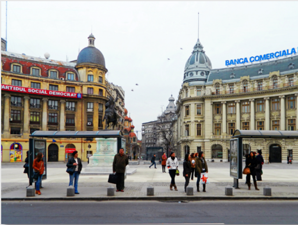
University Square, Bucharest