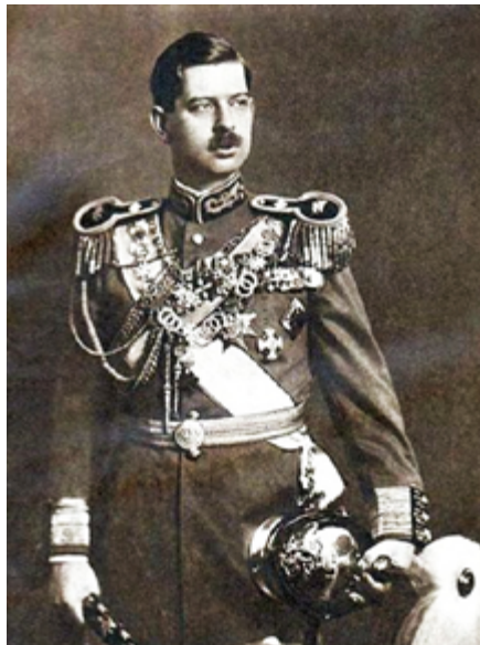
Carol II King of Romania in 1938

As a result of treaties signed at the end of World War I, Romania more than doubled its territory, which now included Transylvania, Dobruja, Bessarabia, northern Bukovina, and part of the Banat. 76, 77 For several years, Romania struggled to adopt a new constitution and enact land reforms. The real challenge, however, came from the battle for power between rival political factions. The nation's new constitution granted greater civil liberties to the population, including citizenship for Jews, male suffrage, and equal political rights. 78, 79, 80