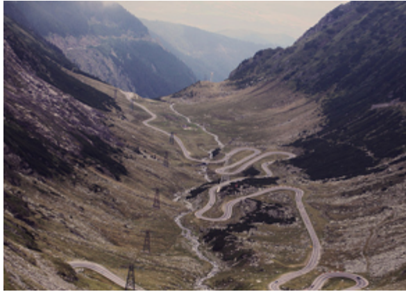
Transfagarasan highway

Mountains. 22, 23, 24 In the Transylvanian Basin, elevations average about 350 m (1,148 ft). Moving eastward toward the Moldavian Plateau, elevations rise to around 500-600 m (1,640-1,969 ft). Toward the southeast lies the Dobruja Tableland with the lowest elevations (250-467 m/820-1,532 ft). 25, 26 The rich soils of the tablelands support significant agriculture. Brown coal and natural gas reserves are also found in the tablelands. 27, 28