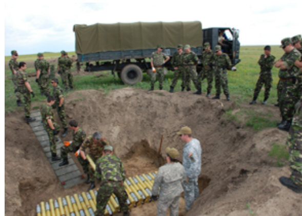
21st TSC EOD techs helping Romania Armed Forces

Romania has been one of the most ardent supporters of the United States in southeastern Europe. 18 In 2011, the two countries signed the "Joint Declaration on Strategic Partnership for the 21st Century Between the United States of America and Romania," focusing on political-military relationships, law enforcement cooperation, energy security, and economic issues. 19 Romania consented to the deployment of a U.S. missile defense system in Deveselu, intended to watch for incoming ballistic missiles fired at NATO countries. 20 Romania also granted the U.S. access to a M.K. Air Base, to be used by the United States for operational support of U.S. forces in the Black Sea theater. 21 Historically, the two nations' intelligence services have enjoyed close cooperation. 22, 23 The United States maintains a strong military presence in Romania, which includes U.S. warships operating in the Black Sea. 24