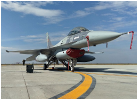
Romanian F-16 at Fetesti Air Base

The Romanian Air Force has a troop strength of approximately 9,700 with a reserve force of 2,500. 109 The Air Force capability is severely compromised by a lack of combat aircraft. 110 It has only 111 fixed wing craft: 16 fighter/interceptor planes, and 16 fixed wing attack aircraft. 111 Adaptability and sustainment are problematic. To date, the Air Force has shown an inability to adapt to change, largely due to economic shortfalls. Low pay and poor incentives make it difficult to recruit and retain