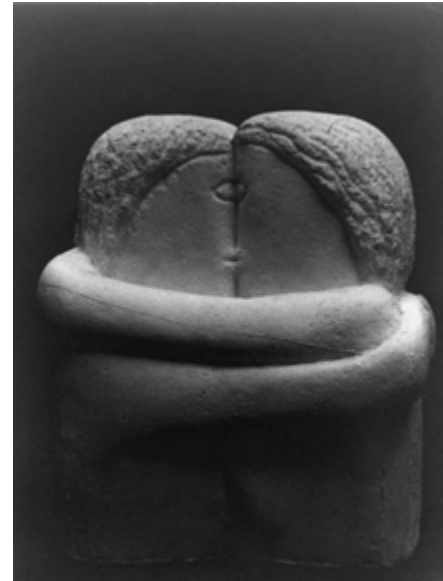
"The Kiss" by Constantin Brâncuși, 1907-08

Romania is known for its folk art and crafts, including handwoven rugs, handmade lace, and wooden furniture. Woodworking remains a strong tradition. Romanians decorate their homes with elaborately carved fences, wooden gates, or other trim work. Some of the designs are carved to ward off evil spirits. Other traditional works include painting religious icons, decorating eggs, and weaving baskets. 91, 92 Weaving is the most common craft in the country. Distinctive family patterns are often handed down through the generations. Many homes still have a loom, and women weave rugs, wall hangings, and clothing. Many of these are adorned with intricately embroidered designs. 93