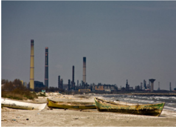
Oil industry in Constanța

Erosion is a major concern in Romania. Poor farming techniques, including infrequent crop rotation, heavy use of pesticides and fertilizers, have severely degraded the soil and fueled erosion throughout the country. 108, 109 Other contributing factors include drought, wind, and floods. 110 In some cases, the land has degraded so significantly that parts of the country, particularly in southern Romania, are threatened by desertification. 111, 112 Climate change, which has sparked more flooding, is also a major factor. Romania's coastal beaches have been eroding for decades. In some areas the shoreline has retreated up to 300 m (984 ft) within four decades. 113