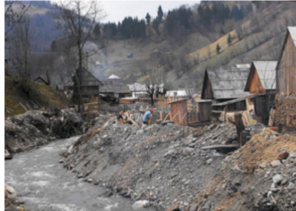
Landslides causing flooding

Romania sits in a seismically active region and experiences roughly 30 earthquakes a year with magnitudes over 3.0 on the Richter scale. Many of these earthquakes are centered near the capital of Bucharest, sometimes referred to as the earthquake capital of Europe. 120, 121, 122 In 1977, a tremor measuring 7.2 on the Richter scale struck near the capital, killing more than 1,500 people and leveling more than 30 buildings. 123 In 2014 a 5.6 quake, whose effects were felt as far away as Bucharest and parts of Ukraine, struck the Vrancea region. 124, 125 In 2015, roughly 12 quakes with magnitudes between 4.1 and 5.5 struck the country. All were centered in the east central region of the nation. 126