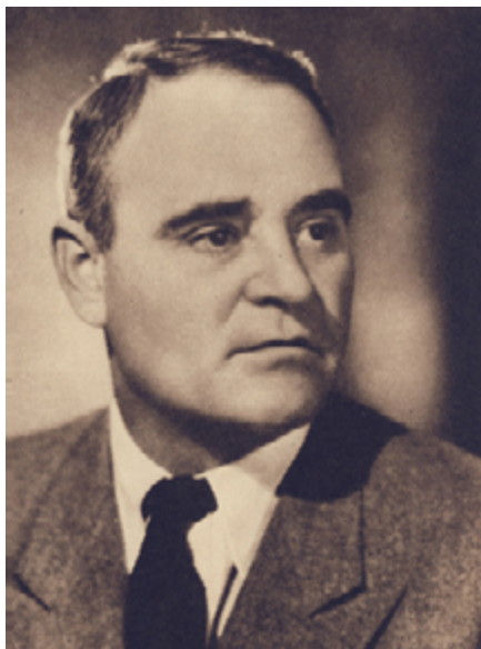
Gheorghe Gheorghiu-Dej, A Romanian communist leader, 1947-1965

By 1948, the Romanian People's Republic had adopted a Stalinist constitution and nationalized Romania's banks and most of the industrial, mining, transportation, and insurance companies. By 1951, 90% of Romania's industries were controlled by the state. Over the next years, the government implemented a series of 5-year plans designed to industrialize the country and collectivize the nation's agricultural sector. 94, 95