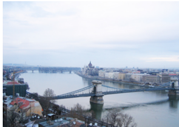
Danube river

The most important river in Romania is the Danube, which forms part of the nation's borders with Bulgaria and Serbia. 41, 42 In Romania, the river flows across the Carpathian Mountains through a narrow pass called the Iron Gate as it courses its way to the Black Sea. Between the Iron Gate and the Black Sea port city of Constanța, the river carries significant numbers of passengers and commercial traffic. 43, 44 Below the Iron Gate, the river slows and continues its southward flow until it reaches the city of Galați, where it veers sharply eastward. Near the Romanian city of Tulcea, about 80 km (50 mi) inland from the Black Sea, the river splits into three sections as it starts to spread out into its delta. 45, 46