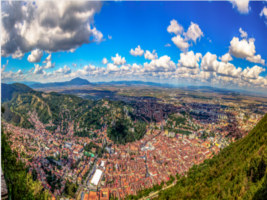
Panoramic view of Brasov