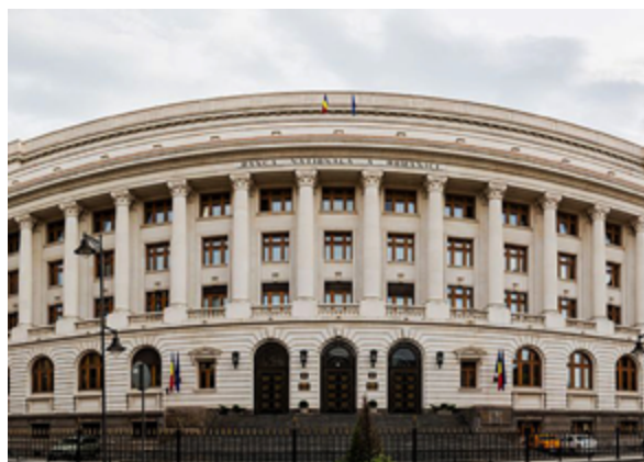
National Bank of Romania, Bucharest

Romania's official currency is the Romanian New Leu (currency code: RON). 71 In March 2017, USD 1 traded for approximately RON 4.29. 72 Prior to 2005, the official unit of currency was the Romanian Leu (currency code: ROL). In 2005, in preparation for joining the EU, the government established the new currency by slashing four zeros from the old ROL in order to bring it more in line with other European currencies. 73 Romania plans to adopt the euro as its national currency in January 2019. 75