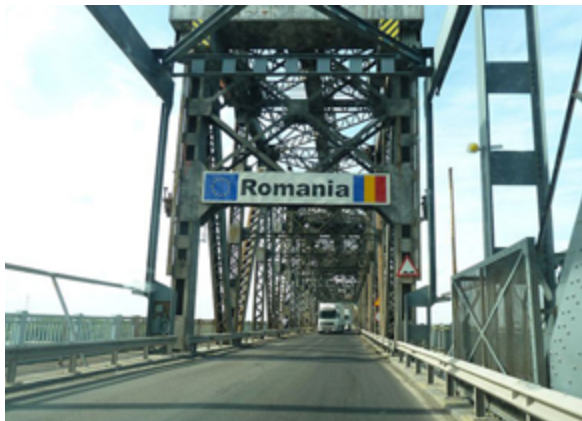
Bulgaria-Romania border crossing over the Danube river

Romania's relations with Bulgaria have historically been tenuous. As both nations prepared to join the EU, competition expanded. After both countries became EU member nations diplomatic cooperation increased and relations warmed. 27, 28 In 2013 the foreign ministers of both countries met to discuss a variety of issues of mutual concern. 29 In April 2015, the two nations signed a protocol of intent to increase bilateral ties through increased tourism. 30