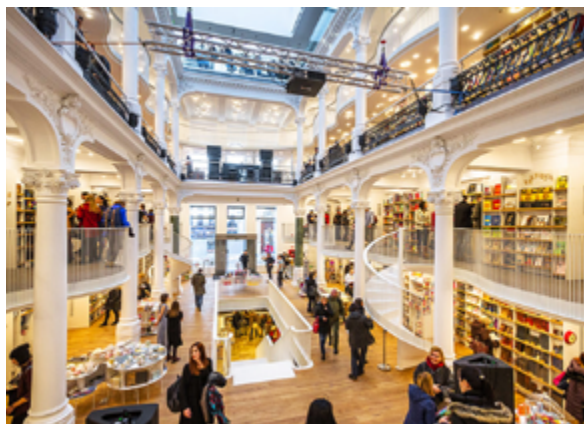
Carturesti Carousel Library, Bucharest

Romania's transition to a market economy has helped the economy grow. 106 The outlook for economic growth in the short term is favorable. Growth is anticipated to be strong in 2017. 107 Other estimates are less optimistic but suggest that growth will be around 3-3.5%. 108, 109, 110 Nevertheless, there are challenges on the horizon that could slow growth. Uncertainty in the Eurozone and a reduced demand for Romanian exports could block growth. A continuation of national political instability could also dampen economic performance. Continuing problems with corruption and issues related to foreign investment could reduce the much needed influx of foreign capital to modernize the oil and gas sectors and manufacturing sector. 111, 112, 113