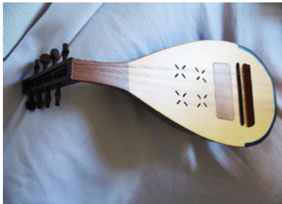
Modern cobza

Romanians love music and on any given evening there may be some kind of concert. Typical folk instruments include the cobza (a stringed instrument resembling a lute), the tambal (a hammered dulcimer), and the flaut (flute). 94, 95 Romanian folk music also incorporated bagpipes, the alphorn, and nai (panpipes). 96, 97 Much of the earliest lyrical music consisted of ballads and bardic verse telling epic tales. 98 Georges Enesco, the famous violinist, is Romania's most well-known classical musician.