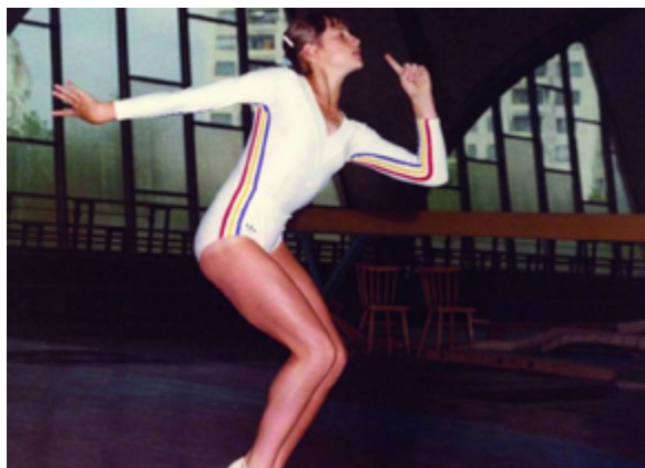
Nadia Comăneci, Olympian

Romania has also achieved international acclaim for its Olympic prowess. Romania has won 72 Olympic medals in gymnastics, 25 of which have been gold. 112 Nadia Comaneci became the first gymnast in history to earn perfect scores for her routines at the 1976 Summer Olympics. Bela Karolyi, the famous gymnastic coach who led Romania's women to two gold medals, defected to the United States, where he now coaches U.S. Olympians. Among the other sports in which the Romanians won medals are wrestling and weight lifting. 113, 114