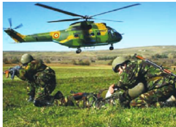
Romanian soldiers during training

Romania has an active military with 73,350-75,000 active duty personnel supported by 80,000 additional reserve troops. 97, 98 The forces are divided into three branches: the army, air force, and navy. 99 The military's capability has been significantly degraded following deployments to Iraq and Afghanistan and ongoing budget problems. 100 Much of the military equipment is obsolete or in disrepair. Romania is actively modernizing and increasing procurement, but a lack of funds has forced the postponement of some programs. 101, 102 In 2007 Romania ended its military draft and all military service is now voluntary in peacetime. In times of war, military service is compulsory. 103 To enlist in the services, applicants must be at least 18 years old. Initial enlistments in all branches of the service are 5 years and reenlistment periods are 3 years in length. 104