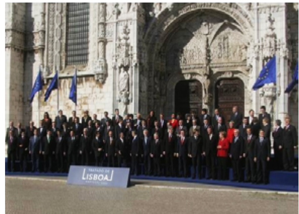
Romania joined the European Union in 2007 and signed the Treaty of Lisbon

Romania continued forging stronger relations with the West. Romania joined NATO in 2004 and the European Union in 2007. 119, 120 In 2004, the newly elected president, Traian Basescu, tackled problems of endemic corruption. 121 Romania's oligarchs were unhappy with Basescu's efforts and, in 2007, launched a campaign to remove him. The Social Democratic Party (PSD) asked the courts to impeach Basescu, but the court refused. In response, parliament voted to suspend the president, pending an impeachment referendum. 122, 123 The referendum for impeachment failed. Prime Minister Calin Popescu-Tariceanu and his government refused to step down. 124