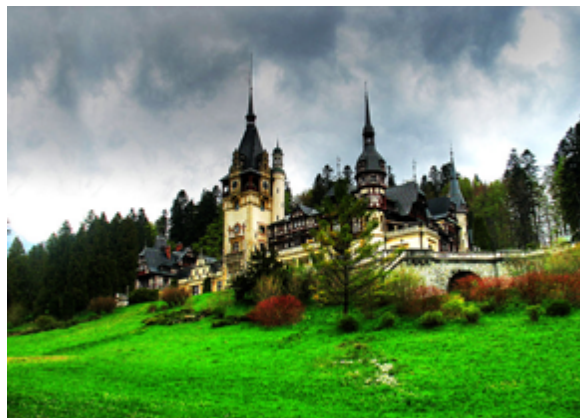
Peleş Castle

Tourism is one of the most promising sectors in Romania. The nation not only has a wealth of natural beauty and historical architecture, but also one-third of the natural springs in Europe. 67 The top tourist destinations are Black Sea resort spas, which are internationally renowned for curing problems related to arthritis, rheumatism, and internal and nervous disorders. 68 Romania has 70 natural spas, which are said to relieve a variety of disorders and illnesses. 69 Tourists are also attracted to Romania's medieval towns, painted monasteries, and ancient Roman ruins, many of which are UNESCO World Heritage Sites. 70