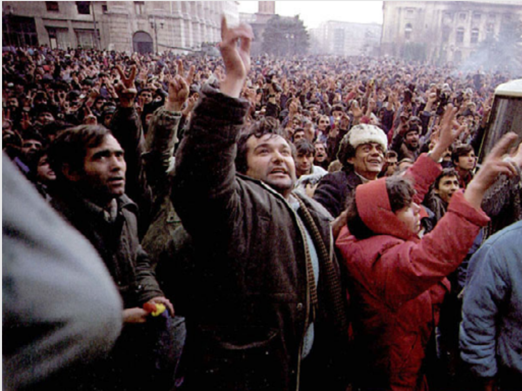
Romanian Revolution of December 1989