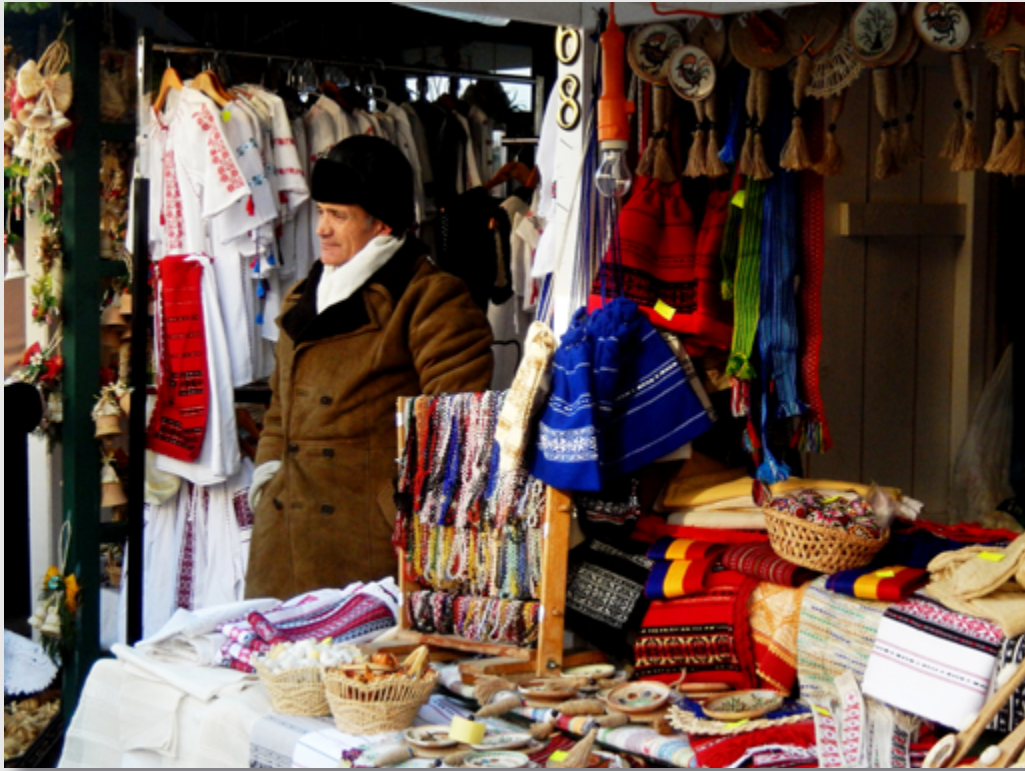
A Vendor selling Traditional Crafts at Piața Universității, Bucharest