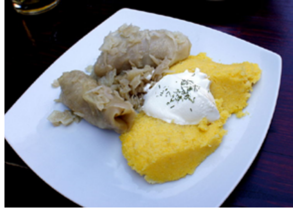
Mămăligă with a spoonful of sour cream and sarmale

often stuffed in cabbage, vine leaves, or poached eggs. 56 Mămăligă is often served with gravy or stew or sometimes on its own alone, topped with sour cream. 57 Another popular choice is sarmale, the unofficial national dish. Sarmale is made with meat wrapped in vine or cabbage leaves. 58, 59 Salad variations include salată roșii (tomato salad) or salată castraveți (cucumber salad). 60