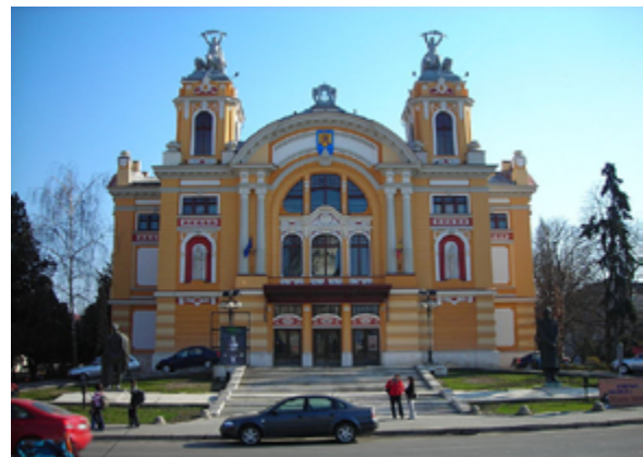
National Theater, Cluj-Napoca

Cluj-Napoca, the historic capital of Transylvania, is located in northwestern Romania. 84 The city has a distinctly Hungarian flavor, a legacy of its years under Hungarian rule. 85, 86 In the late 12th century, the city was known as Cluj. It became the capital of the principality of Transylvania in the 16th century and remained so until the principality was incorporated into Romania. Napoca was added to the city's name in 1974 by President Ceaușescu. 87, 88 During the communist years, Cluj-Napoca industrialized rapidly and became Transylvania's largest city. The city's factories produce ceramics, chemicals, leather goods, and textiles. Cluj-Napoca retains a strong coffeehouse culture and has internet cafes and nightclubs. The city is also home to a major university, several technical and professional institutes, a fine arts institute, and the Gheorghe Dima Conservatory. 89, 90, 91