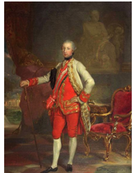
Portrait of Joseph II, Holy Roman Emperor

In 1791, two Romanian bishops petitioned the Austrian emperor for civil and political rights for Romanians. The emperor restored Transylvania as an Austrian territory and ordered the Transylvanian legislature (Diet) to take up the petition. The Diet, while granting the right to practice the Orthodox faith, denied requests for civil and political rights. 49 Things remained relatively quiet until 1847, when the Transylvanian Diet made Magyar (Hungarian) the official language, which fueled protests by the Romanians. 50