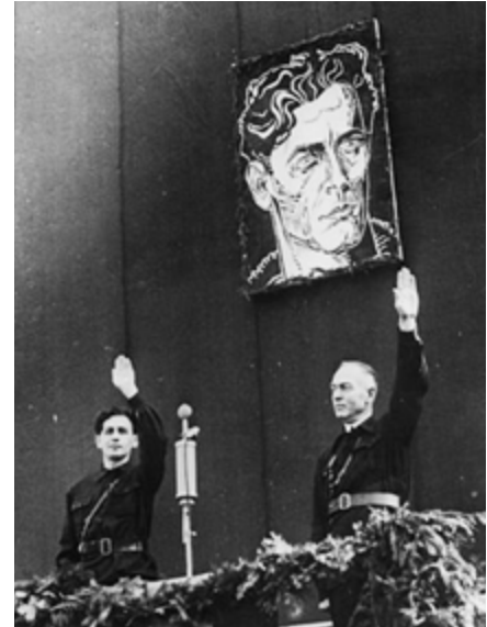
Romanian general Ion Antonescu next to Iron Guard leader Horia Sima in 1940

After the war ended, democrats and communists vied for power. When the first elections were held in 1946, the communists and their associates won 80% of the popular vote, although many regard those results as fraudulent. 91 By 1947, the democratic institutions and liberal economy were gone. The communists quickly eliminated all opposition and forced King Michael to abdicate. On 30 December 1947, they officially proclaimed the formation of the Romanian People's Republic. Over the coming years, Romania would become increasingly isolated from the West and fall under the influence of the Soviet Union. 92, 93