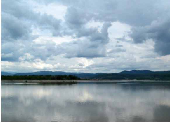
Olt river at Râmnicu Vâlcea

Turnu Măgurele. The river crosses the Transylvanian Alps at Turnu Roșu Pass, the most significant breach in the range. Small boats can navigate the river along its lower course below Slatina. 50