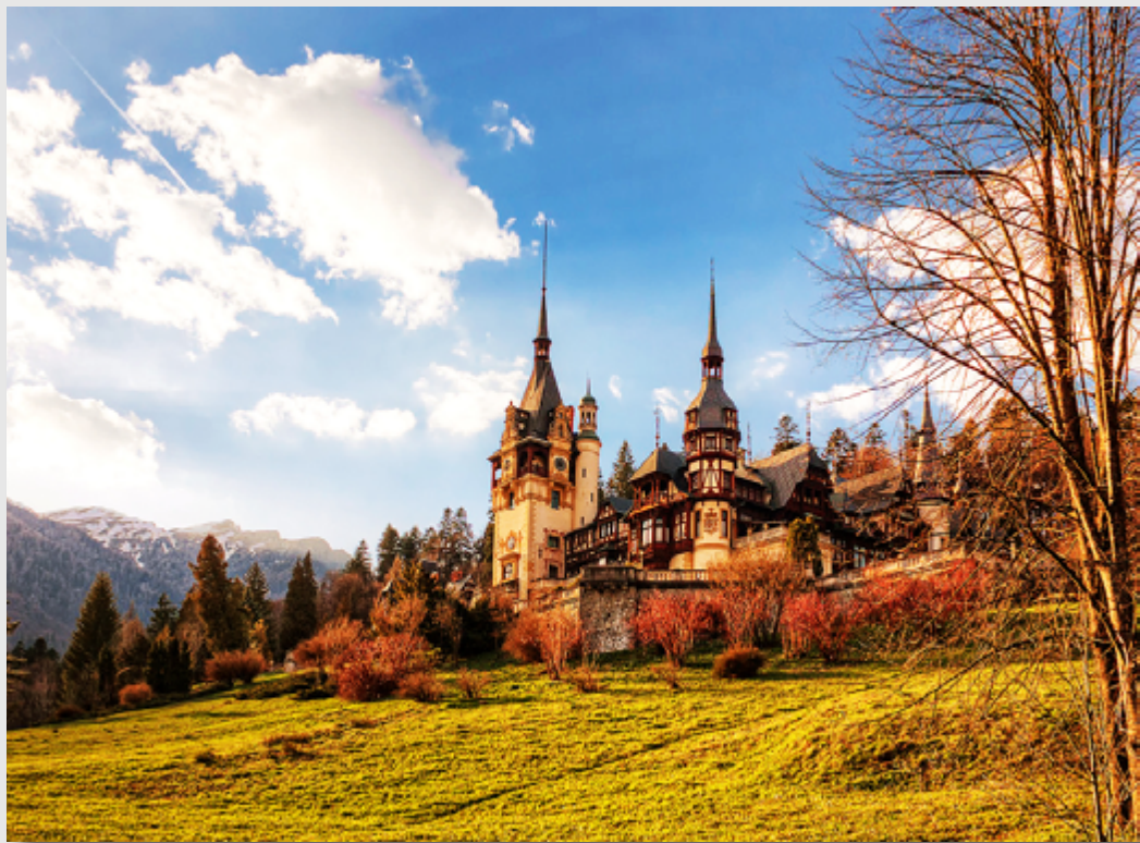
Peleş Castle, Sinaia