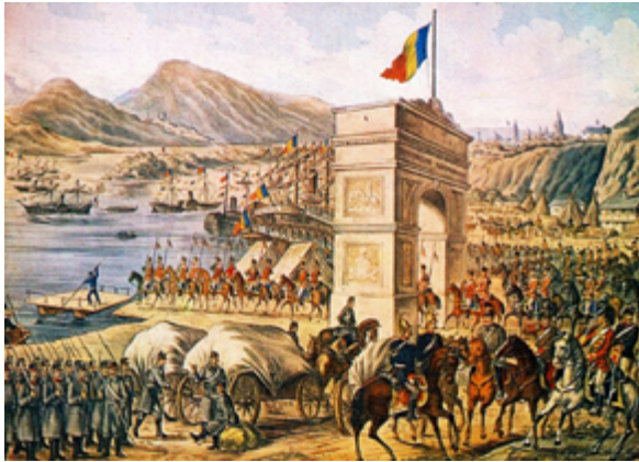
War of 1878, Romanian army entering in Dobrogea Wikimedia / Henryk Dembitzky

Bessarabia. The rest of Europe soon followed suit. In 1881, Romania's parliament proclaimed Romania a kingdom and crowned Charles king. 62, 63, 64