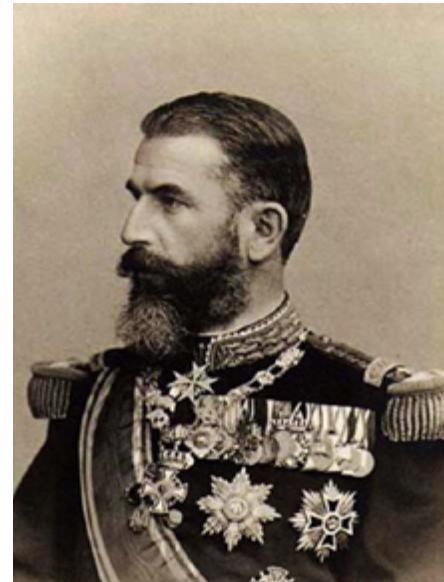
Carol I King of Romania (1839-1914)

Conflict in the Balkans continued and, in 1914, erupted into an international war pitting the Central Powers against the Allies (Russia, Britain, and France). With the outbreak of World War I, Romania hoped to remain neutral, but political realities made this an impossibility. 69, 70, 71 King Ferdinand succeeded King Carol in 1914. Ferdinand's wife, Marie, was the granddaughter of both Russia's czar Alexander II and Britain's Queen Victoria and so, in 1916, Romania abandoned the Central Powers and entered the war on the side of the Allies. 72, 73