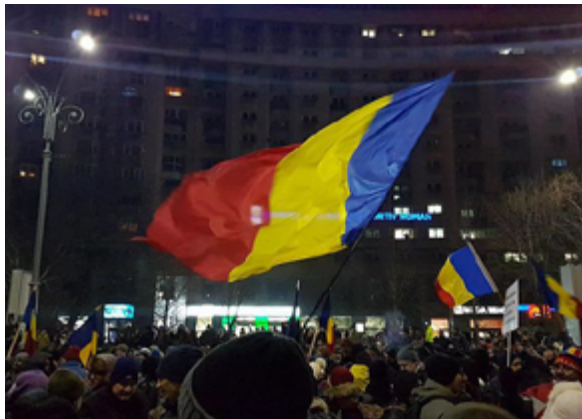
February 2017 Romanian protests

Romania is rated as facing moderate political risk because of several factors. 118, 119, 120 One of the most destabilizing risks is political corruption. Romania has one of the highest levels of corruption in Europe. 121 The nation has implemented a major anticorruption campaign that has extended to all levels of government. Many prominent figures and high-ranking political officials have been implicated, including the prime minister. 122, 123, 124 Although the country's National Anticorruption Directorate (DNA) has investigated thousands of cases, resulting in 1,138 individuals being sent to prison, it has not been enough to cool public outrage. 125 In 2015, one protest brought thousands of demonstrators to the streets of Bucharest and forced the resignation of the Prime Minister, Victor Ponta. 126