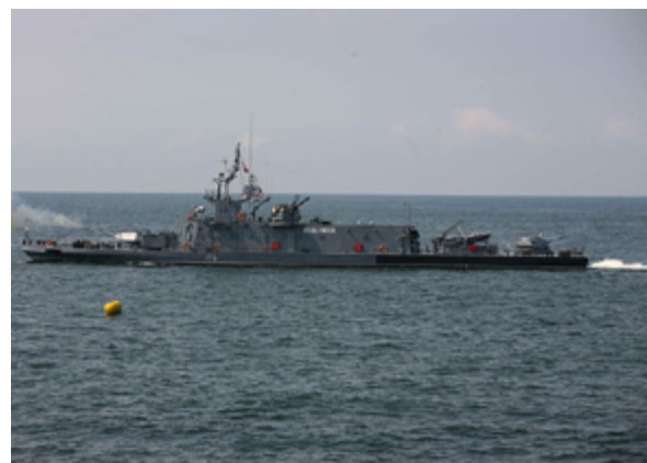
'Ion C. Brătianu' (F-46) of the Mihail Kogălniceanu river patrol

The Romanian Navy has roughly 7,000 active duty sailors and marines and 2,500 reserves. 113 As is the case in the other branches of the armed forces, budget cuts have reduced the effectiveness of the naval forces. 114 The Navy has a total of 48 vessels including 3 frigates, 7 corvettes, 25 coastal defense craft, and 5 mine warfare ships. 115 116 General readiness is low, although the frigates are generally manned and regularly