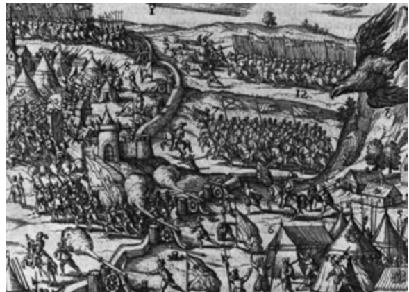
Michael the Brave defeating the Turks in Târgoviște, Oct. 1595

Michael the Brave, a Walachian prince, emerged on the scene toward the end of the sixteenth century. Michael aligned himself with the Hungarian nobles, and by 1600 conquered Moldavia, marking the first time in history that a Romanian prince ruled over all of Romania. Although Michael's rule was short-lived, as was the unification of Romania, a sense of national identity began to emerge among the Romanian people. 41, 42