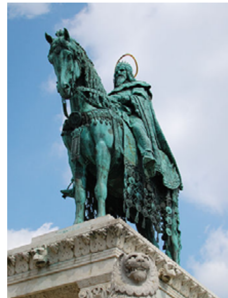
King St. Stephen's modern sculpture, Budapest

The Magyars invited many foreigners to help settle the area. To reinforce their loyalty, the king of Hungary granted the settlers land and commercial privileges, with the caveat that only Catholics could become members of the nobility. Under this feudal system, most Transylvanians became landless peasants. By the 1200s, the Hungarian grip on the region was slipping. The Tatars swept into the region, crushing the Magyars. This only worsened the conditions of the Transylvanian peasants, many of whom were slain by the Tatars. Those who survived were forced to pay even more to their landlords, and more land was seized from the serfs. 27, 28 In 1242, the Tatars withdrew. The Hungarians once again called on foreigners to come and live in the region. Transylvania became increasingly autonomous. By 1288, the noblemen had their own assembly, or Diet. As the nobles continued to act without restraint from the king, the situation among the serfs worsened. Many Romanian peasants decided to