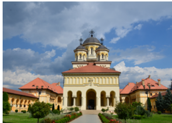
Orthodox Unification Cathedral of Alba Iulia

Romania is a secular country with constitutional guarantees of freedom of religion. No religious group receives government funding, though some may get limited tax benefits. 33 In spite of its secularism, Romania has been identified as the sixth most religious nation in the world, and the church is Romania's most trusted institution. 34, 35 The Eastern Orthodox Church (82%) is the largest religious group and includes the Romanian Orthodox, Greek Orthodox, and Russian Orthodox denominations. 36, 37 Roughly 6% of the population is Protestant and 4% Catholic. There are small numbers of other religious groups, including Muslims. 38 The Catholic population consists largely of the Hungarian Magyars, the Roma, and the Swabian Germans. The Protestant population consists of the German Saxons (most of whom are Lutheran) and the Calvinist Szeklers. 39