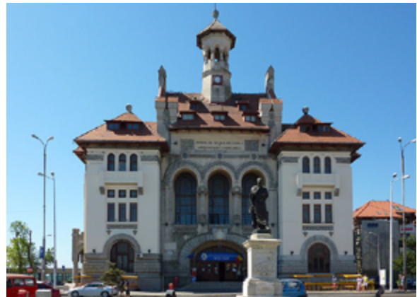
National History Museum in Constanța

The city of Constanța in southeastern Romania on the Black Sea is the nation's principal port city. A canal connects the city to the Danube River, which has heavy import and export activity. 103 According to legend, the city traces its origins back nearly 2,500 years when Tomis, as it was then known, was established by Jason and the Argonauts after finding the Golden Fleece. 104, 105 Constanța became part of the Roman Empire in the first century BCE. The city had an unsettled history. Between the sixth and 15th centuries it was invaded by Goths, Huns, Avars, and other tribes. In 1878, the city again became part of Romania. The contemporary city, in addition to being a favorite Black Sea resort, is also a major cultural and arts center. Its archeological museum houses one of the most important collections of artifacts in the nation. 106 Shipbuilding and fishing are among its major industries. 107