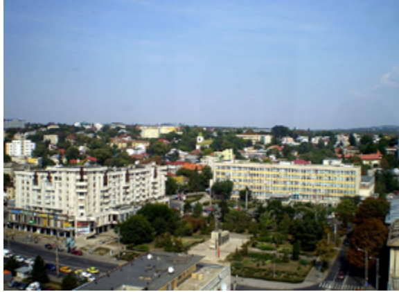
Independence Square, Iași

served as the Moldavian capital from 1564 to 1859. 78, 79 The city fell to the Ottoman Turks in the early sixteenth century. As Ottoman power waned in the nineteenth century, Prince Alexandru Ioan Cuza took control and united the principalities of Moldavia and Walachia in 1859. 80, 81 The city flourished in the latter half of the 1800s, becoming a center of intellectual and cultural life. It served as the temporary capital of Romania between 1916 and 1918 when German troops occupied the national capital of Bucharest. 82, 83