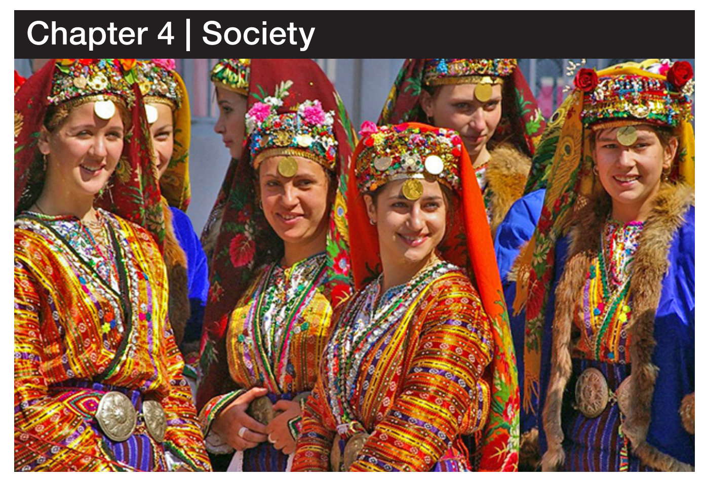
Bulgarian folk dancers in traditional clothing.