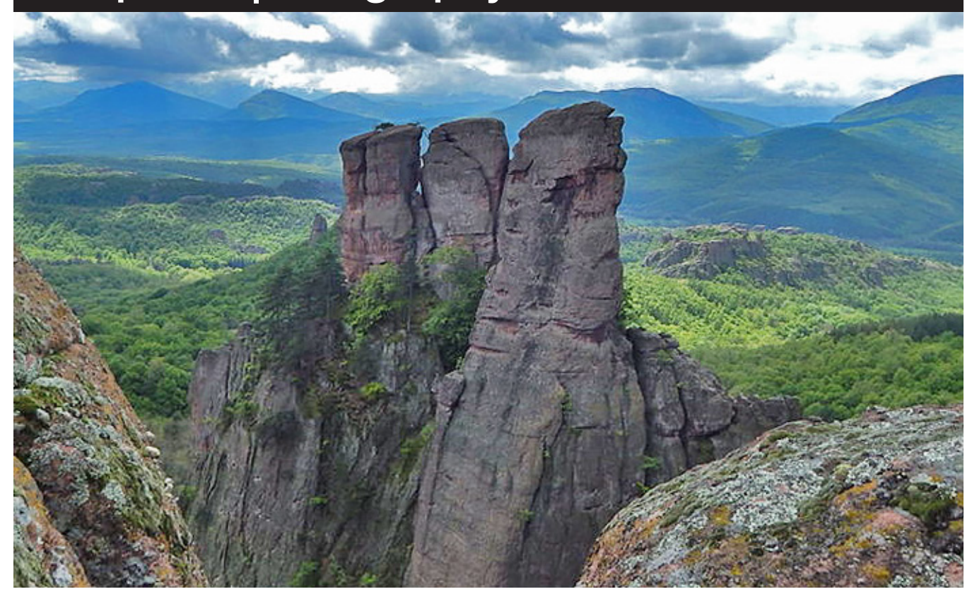
The Belogradchik Rocks of the Balkan Mountains.