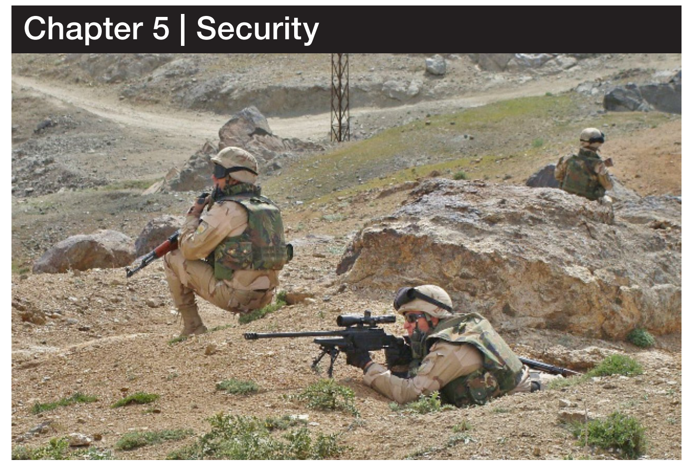
Bulgarian troops in Afghanistan.