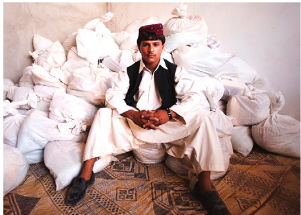
A guard sitting atop donations bound for needy families in Nawa, Ghazni Province, during Eid al-Fitr

Ramadan (or Ramazan) is the ninth and holiest month of the Islamic calendar. During this time observant Muslims fulfill the third pillar of Islam—fasting (known in Afghanistan as ruzah ). During Ramadan, Muslims demonstrate their piety and devotion to the Islamic faith. Tradition requires that adults abstain from eating, drinking, and smoking during daylight hours for 30 days. Restrictions also apply to sexual intercourse. Only the young, sick, elderly, and pregnant or nursing women are exempt from fasting. Non-Muslims should avoid eating and drinking in public during fasting hours of the day, as such activities are seen as disrespectful and rude.