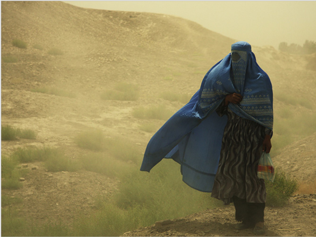
Woman with burqa in a light sandstorm, near Balkh, northern Afghanistan