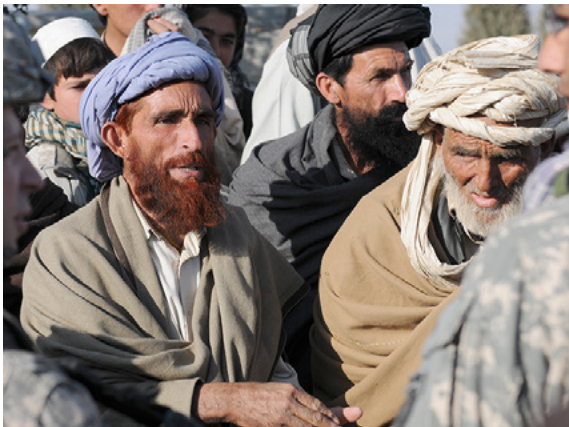
Afghan tribal elders in the village of Shabo Khel, Khost Province

On a larger scale, a dispute between clans or tribes over resources or a breach of honor may lead to violent clashes and vendettas, primarily among Pashtun families and tribes. While the tradition of honor-based revenge ( intaqam in Dari) is Pashtunwali, other ethnic groups, such as Tajiks and Uzbeks, also become embroiled in such conflicts. 462 Sometimes these feuds can take years to resolve. 463 Nonetheless, tribal factions will unite against an outside threat, even if they are involved in an internal feud.