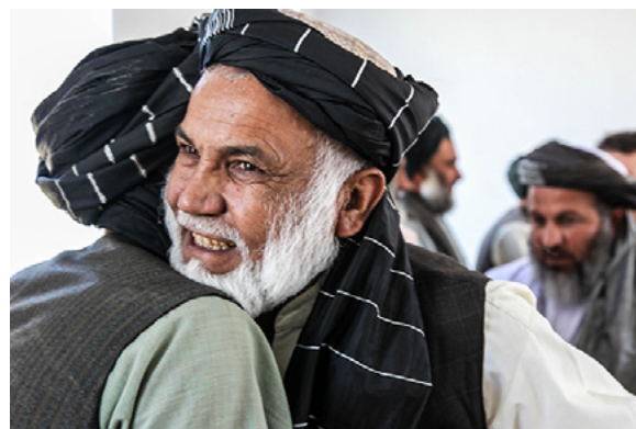
Afghan men embracing one another, Kandahar

It is customary to exchange a series of friendly greetings before conducting any business. Expressing concern about health and family is important. The time a task will take is not as important as accomplishing the task. An Afghan's sense of personal space is different from that of most Westerners. Foreign visitors should not be surprised if someone of the same sex stands very close to them in a professional context. Stepping back may be considered offensive.