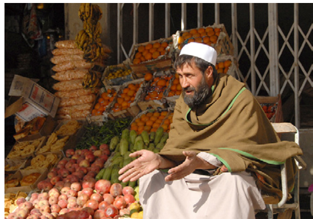
Fruit and vegetable vendor outside his store in the Wardak Province central market, Maidan Shar

Men typically handle all matters involving money, including selling crops at the market, buying essential goods, and holding legal ownership of the family's assets. 419 They also provide protection, instill discipline, and engage in social and political interactions outside the home. 420 Men are more likely than women to help with farming and tend to livestock, but this is not always the case. For example, in less segregated areas, women may be heavily involved in various tasks related to crop