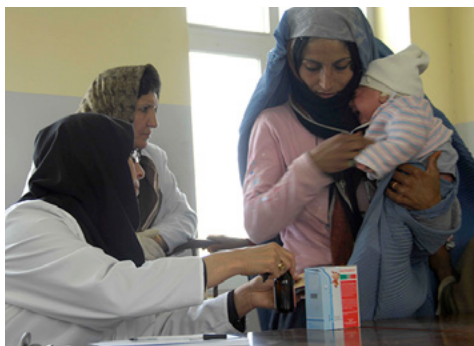
Female Afghan National Army doctor providing medicine to a mother for her infant at a free clinic in Ahmadi village

without the assistance of a midwife or trained medical practitioner, and maternal mortality in Afghanistan remains among the highest in the world. 401