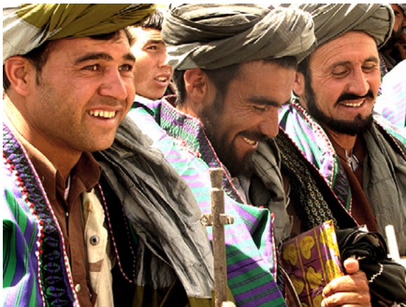
Former Taliban fighters preparing to hand over their rifles to local officials during a reintegration ceremony in Ghor province, central Afghanistan

Nearly half the Afghan population is made up of Pashtuns. 168 Although Pashtun tribes live in pockets throughout the country, they dominate a vast crescent-shaped region that stretches from the western frontier, across much of the south, to the Eastern Highlands. Many Pashtuns also populate the nearby northwestern region of Pakistan. Afghan Pashtuns are Sunni Muslims who maintain a strong sense of common identity that is bound by pashtunwali , a moral code that promotes honor and its defense. While there are at least seven tribal subgroups, the largest confederations are the Ghilzai and the Durrani. 169 Apart from President Ashraf Ghani, who is Ghilzai Pashtun, Afghanistan's rulers have nearly all been from the Durrani tribe. 170 In general, Pashtuns earn their livelihood through farming and animal husbandry. Many Pashtun tribes are nomadic, engaging in a continuous migration throughout the Afghan-Pakistani borderlands. The Taliban is comprised almost completely of Pashtuns—and its leaders are mostly Ghilzai Pashtuns. 171