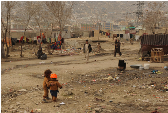
Two Afghan children playing in a refugee camp outside of Kabul

Regarding gross domestic product (GDP), Afghanistan is among the poorest countries in the world. 123 Over the last two decades, armed conflict and political upheaval have set the Afghan economy on a rollercoaster of downward and upward swings. 124 Widespread poverty, unemployment, and political corruption are continuing economic challenges. Until recently, the country experienced a period of steep economic decline following the cutbacks in coalition forces that began in 2011. 125 Between 2011 and 2014 the number of registered new firms dropped by over 50%. 126 As of late 2016, increasing regional instability continues to hinder recovery and reconstruction efforts. 127 With nearly 68% of the country under the age of 25, the fighting and sluggish economy is causing the loss of future potential. Large numbers of young Afghans are leaving the country in search of a better life. 128, 129, 130, 131