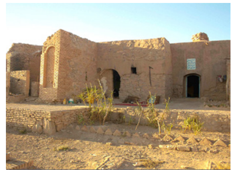
Sayed-Mokhtar Shrine, Herat city

Shrines, or ziarats , are a common sight throughout the country. These commemorative markers may consist of tombs or reliquary complexes, or modest mounds of dirt or stones. They typically honor saints, venerated holy men such as pirs , or shahids (martyrs). Afghans believe that the ziarat of a pious saint or martyr is a channel of communication with Allah. Foreigners may enter the ziarat , but they should be aware of the sacred and sensitive nature of these places; mosque etiquette applies in the ziarat .