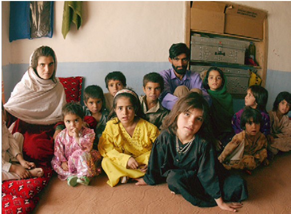
An Afghan Pashtun family sitting together in their home in Kabul

Once married, a woman moves into the home of her husband’s family. From that point on, she belongs to that family and must obey, in particular, her husband and the senior female. Of course, the composition of a household may vary according to tribe and socioeconomic status. Nuclear family households grouped within extended family settings are also common. Younger members of wealthy families are more likely to move out and start their own households. 467