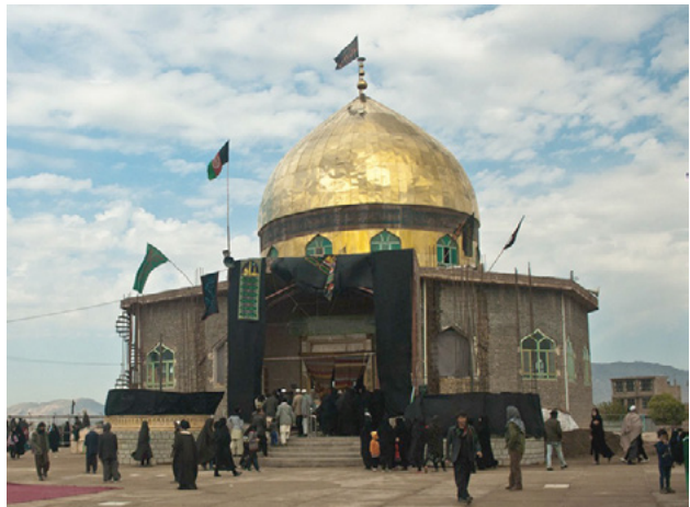
Locals entering a mosque in Herat during Ashura, a time of mourning for Shi'a Muslims

While the Sunni and Shi'a schools share a belief in the fundamental tenets of Islam, their split resulted in diverging practices and beliefs. Over time, several more sects emerged. Today, Sunnis comprise approximately 85% of the global Muslim community, and the Sunni branch of Islam is the state religion. 210 In Afghanistan, Sunni Muslims make up 85-90% of the population, while Shi'a account for 10-15%. 211 Afghan Shi'a Muslims, including the Hazara, live primarily in the central provinces, but they also live in the nation's major cities. Traditionally relegated to menial jobs, Hazara frequently complain of discrimination from the Sunni-majority society. 212, 213, 214 Ismaili Muslims, a sect within the Shi'a branch of Islam, live in central and northeastern Afghanistan. Western Dari-speaking Tajiks and Pashtuns are often referred to collectively as Farsiwan, or speakers of Persian Farsi. They are also predominantly Shi'a Muslims. 215