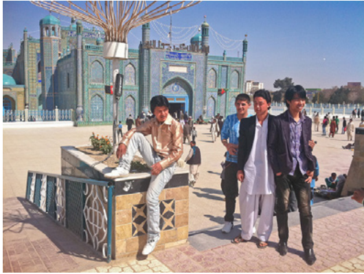
Dressed up for Nowruz, Mazar-e Sharif, Balkh Province, northern Afghanistan

The draw of celebrators is mixed. Shi'a pilgrims come to pay their respects to what is a holy place for them. Others make the journey purely to enjoy the festivities. Legend draws those seeking disability cures to a makeshift structure located at the shrine's western wall, known as the Chiba Khana (House of Forty). Supplicants will sleep there every night of the holiday to be cured of whatever ails them or their children. 290