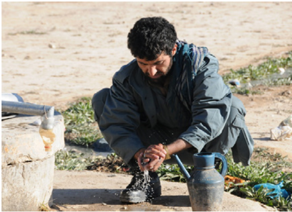
A member of the Afghan National Police (ANP) washing his hands at a well in Bala Boluk, Farah Province

Prior to prayer, Muslims are required to perform wudu (a ritual cleansing). This purification process typically involves washing one’s hands, face, arms, neck, and feet, as well as rinsing out the mouth and nose. 235 Cleansing is not solely intended for purposes of physical cleanliness—although this, too, is important. Rather, the rite is meant to spiritually and mentally prepare the participant to perform a holy action in a pure and concentrated state. A Muslim can break this state of ritual purity through several acts: defecating or urinating, breaking wind, or, for many Muslims, simply touching a person of the opposite sex. The necessity of performing multiple daily prayers encourages Muslims to maintain ritual purity throughout the day. Mosques often have facilities where Muslims can cleanse prior to prayer.