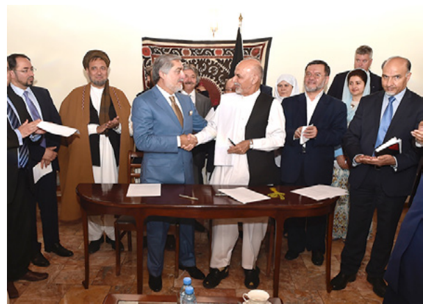
Afghan presidential candidates Abdullah Abdullah (left) and Ashraf Ghani (right) after signing a joint declaration to form the National Unity Government

Since 2014, the National Unity Government (NUG) of President Ashraf Ghani and his chief executive officer Abdullah Abdullah have governed Afghanistan. The U.S. brokered the power-sharing arrangement to ensure stability after the contested presidential elections. With the withdrawal of international troops, a still unprepared Afghan army struggled to combat the Taliban. 96 The NUG worked to bolster its national forces with local militias and continued the trend of appointing warlords to government positions. Among those is Ghani's first vice president, General Abdul Rashid Dostum. In late 2016, the international community endorsed the continuation of the NUG, which was set to expire, through President Ghani's full term. 97, 98 As of late 2016, the Taliban controlled more areas of Afghanistan than at any time since 2001. 99