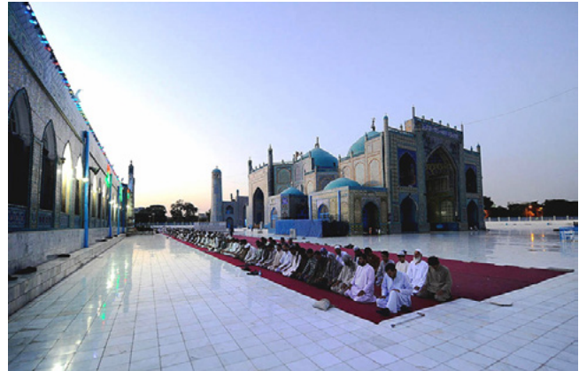
Men praying at the Blue Mosque in Mazar-e Sharif

Mosques ( masjid ) play a vital role in Afghan society. Every village in Afghanistan has at least one mosque. Friday is the one-day weekend and holiday for Afghans. Like Sundays for Christians, Fridays have a religious significance. Muslim males are expected to participate in the Friday prayer and listen to special sermons from the mullahs. Foreigners should not interrupt the sacred Friday prayer, which takes place at midday; they should, if possible, avoid entering mosques altogether during this time.