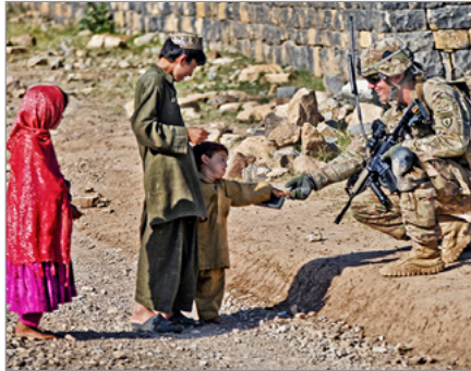
U.S. Army corporal greeting an Afghan boy, Khowst Province

Afghan street children are the legacy of decades of war and a system struggling to cope with the swelling numbers of jobless in urban areas. Afghanistan has one of the world's youngest populations. Nearly half of its 33 million people are under the age of 15. 362, 363 In Kabul alone, tens of thousands of children as young as 6 years old beg and hawk assorted items on the street. Primarily boys, these young street vendors can be persistent. 364, 365 Despite the government's efforts to clamp down on begging, it remains widespread. 366