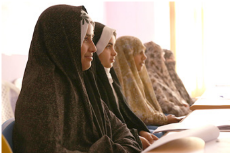
Women attending a photojournalism course, Farah City

Muslims mosques are sacred spaces, and they should be respected as such. When foreigners visit a mosque, they should ask permission to enter. The dress code requires modesty and dignity. Clothing should always be loose fitting. As a rule, the more rural the region, the more one should be covered. Once inside the mosque, non-Muslims should not touch books or walls (especially the western corner where people direct their prayers).