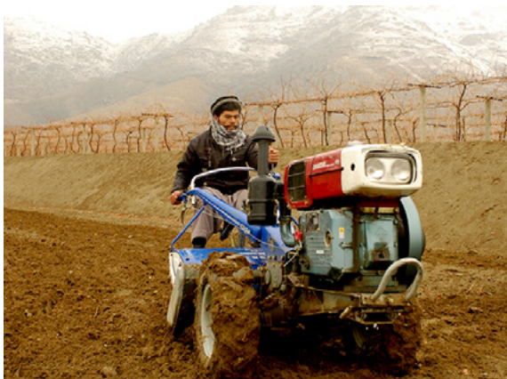
New two-wheel tractors, replacing oxen and human labor, allowing for multiple crops per year

Prolonged conflict has left much of the country’s irrigation infrastructure in disrepair. Farm and grazing lands are unsafe because of landmines and unexploded ordnance. Furthermore, severe drought frequently hampers agricultural production. After the Taliban was overthrown, reconstruction teams worked to reduce crop vulnerability to drought. 380, 381 Such efforts have entailed repairing irrigation systems and introducing drought-resistant seeds. 382 To further develop