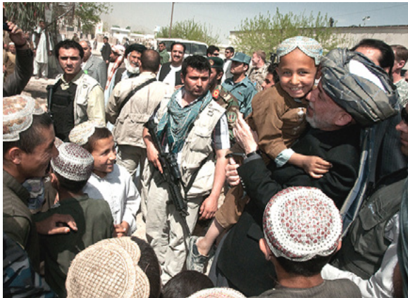
President Hamid Karzai greeting villagers in Tarinkot, a Pashtun-dominated region, 2010

As a historic crossroads for diverse populations, Afghanistan is home to approximately 40 ethnic groups who speak over 50 separate languages or dialects. 165 Many of these groups are ethnically or linguistically related to communities in surrounding countries. An Afghan's identity is not just defined by a common cultural or genetic group, but also by tribes, families, and geographic regions, or even occupations. Ethnicity dominates the political landscape in Afghanistan. It has become so politicized that it may be considered rude to inquire about someone's ethnic identity. Generally speaking, the Pashtun-dominated south and the Tajik- and Uzbek-dominated north represent the ethnic division of power in the country. 166, 167