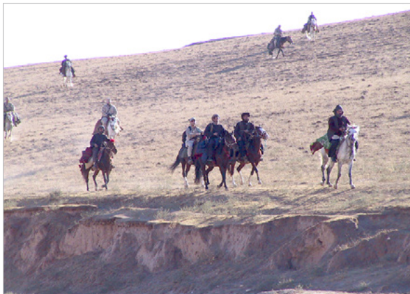
U.S. Army soldiers and U.S. Air Force combat controllers ride with Northern Alliance forces, October 2001, Dari-a-Souf Valley, Balkh Province

In the weeks following 9/11, teams of U.S. Special Forces entered Afghanistan and formed coalitions with Northern Alliance resistance fighters. Within three months, through cavalry-style assaults and targeted air strikes, they had overthrown the Taliban regime. In the process, many al-Qaeda leaders were killed or forced into hiding. This allowed Afghan opposition groups to assume power and form a transitional government. On 9 October 2004, Hamid Karzai, head of the interim government, won the first democratic presidential election in Afghan history.