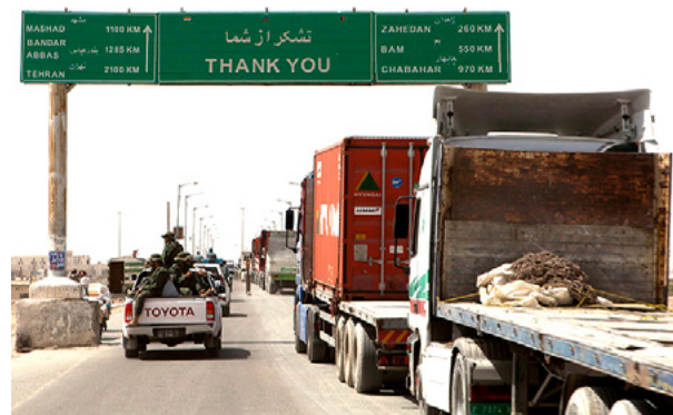
Trucks waiting at the Afghan-Iranian border crossing in Zaranj, southwestern Afghanistan

One success has been the completion of Highway 1, or the Ring Road, in 2016. The 3,360 km (2,088 mi) stretch of paved road wraps around the heart Afghanistan and connects many of the provincial capitals. As such, it is a frequent target for Taliban roadblocks and attacks. 342 Most of Afghanistan’s national and private airlines are designated unsafe by the U.S. and various foreign entities.