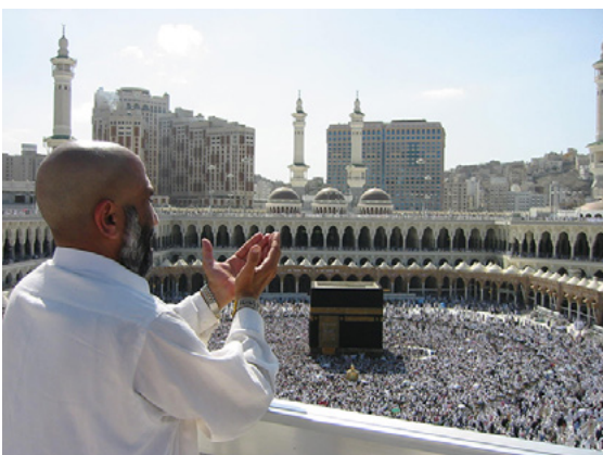
A pilgrim at Masjid al-Haram (the sacred mosque), Mecca

Performing the hajj is one of five central duties for Muslims who are able and can afford to go. The pilgrimage ritual begins on the 7th day of Dhu al-Hijjah (the last month of the Islamic year) and ends on the 12th day. A person who is unable to make the journey can appoint a relative or friend to go as a “stand-in.” In 2015, about 24,250 Afghan pilgrims flew the roughly 7,400 km (4,600 mi) from various Afghan cities to Mecca with subsidies from the Afghan and U.S. governments. 253, 254 Those who have