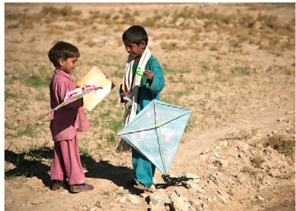
Children playing with kites given to them by Afghan Local Police officers in a village in Farah Province

Honorific titles such as Ghazi (military rank), Sardar or Khan (leadership position), or Agha or Mir (religious position) are earned; men and women alike should use these titles when addressing such men, as in Sardar Mohammad Ismail Khan. 492 Finally, sayb (sir) and sayb-e (ma’am) are often added to the end of a name or title out of respect, such as Mir-sayb or Smith-sayb.