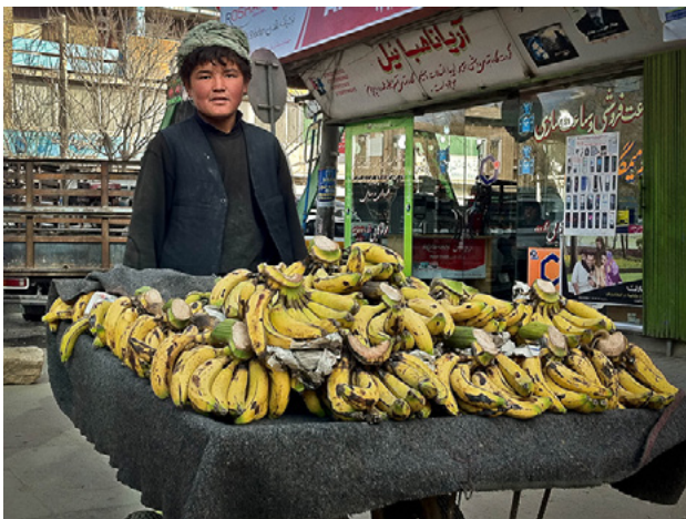
Hazara boy selling bananas in the Shahr-e Naw neighborhood of Kabul

The mountainous region of central Afghanistan is home to another Dari-speaking ethnic group, the Hazara, who make up about 9% of the population. They are said to be descendants of Genghis Khan’s soldiers, and the word hazar translates to “one thousand”—the size of the smallest unit of the Mongolian military. 178 Hazaras are seasonal migrants who typically fill the lowest-level jobs in cities. 179 Most Afghan Shi’a belong to the Hazara group, who were treated particularly harshly under