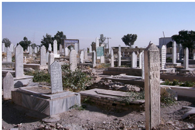
Cemetery in Gaza Ghar, Herat

In essence, Muslim burial rites are universal, regardless of ethnic affiliation. The deceased must be buried within 24 hours, but never at night, and cremation is not an option. Bodies must be washed first and then shrouded in clean linen; in Afghanistan this is done by close relatives of the same sex. Women are shrouded in extra linen to conceal their face and further cover their torso. To maintain the segregation of the sexes, deceased men and women