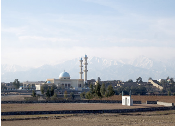
Minarets rise above the landscape in Jalalabad, Nangarhar Province, eastern Afghanistan

Jalalabad, the capital of Nangarhar Province, is located in a strategically important region of eastern Afghanistan. Situated on the Kabul River, the city lies on the bustling trade and transportation route that runs through the Khyber Pass from Kabul to Pakistan and the Indian subcontinent. Because of its location, the Jalalabad region has been occupied for millennia and has often served as a military outpost and command center. In the modern era, Britain, the Soviet Union, and most recently the U.S., have stationed troops in Jalalabad, which was also a Taliban stronghold until 2001. 56, 57, 58 While ISIL-Khorasan (ISIL-K) presence in Afghanistan is small, as of early 2017 the militant group had an established footing in Nangarhar Province. 59, 60