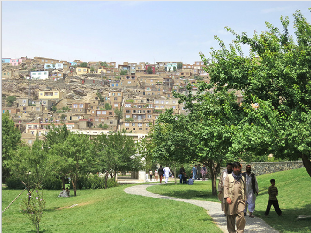
Bagh-e Babur gardens, Kabul, one of the earliest surviving Mughal gardens and a UNESCO World Heritage site