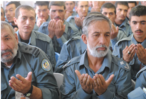
Basic Patrolmen praying before graduation, their hands open in the qunut posture of supplication, Kandahar

Islam heavily influences a person’s daily routine in Afghanistan. Foremost among daily rituals, Muslims are required to perform a series of prayers, known in Afghanistan as namaz (the second pillar of Islam). Traditionally, these prayers are performed at five approximate times of the day: before dawn, midmorning, midafternoon, at sundown, and after sundown. Whether a man folds his hands during prayer or places them on his thighs identifies him as either Sunni or Shi’a, respectively. Muslims are