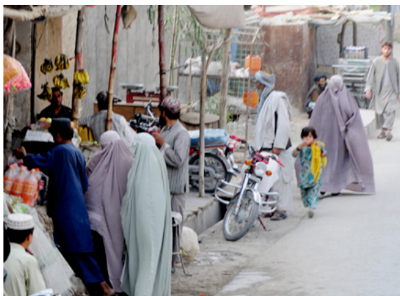
Bustling market in the Panjwai District of Kandahar Province, southern Afghanistan

An important tradition in rural Afghanistan is market day—when traders, craftsmen, and farmers gather to engage in commerce. At these gatherings, farmers can sell their marketable surplus and buy goods or resources that they cannot produce themselves. The bazaar usually takes place in the largest town or village in the region. In addition to promoting commerce, the market serves as a communal meeting place and a venue for the exchange of information.