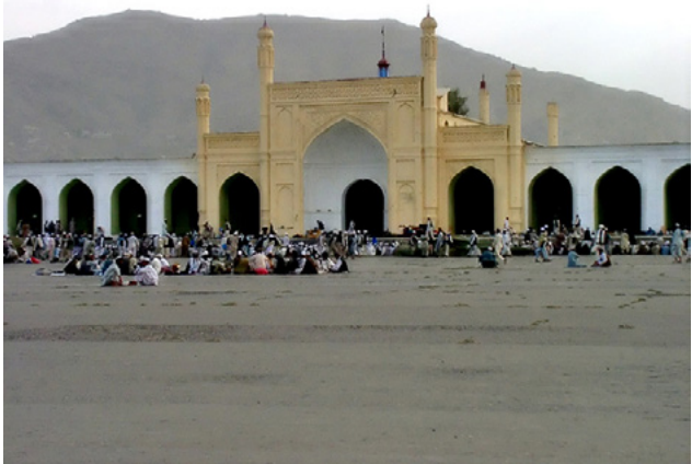
Id Gah Mosque in Kabul, the chief religious mosque in the country

Visitors should take care not to disrupt or walk in front of Muslims in prayer; this is thought to invalidate the prayers and will upset the worshipper. The presence of dogs in a mosque is considered a desecration.