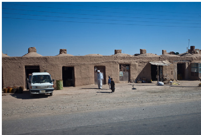
Houses on the road to Herat

In urban areas, families may live in modern houses or apartments. Poor migrants often live in makeshift structures in city slums. In rural areas, traditional mud-brick and stone houses predominate and are built in clusters. Rural villages are traditionally fortified with exterior walls and, in some cases, towers. Nomadic populations generally live in tents or yurts.