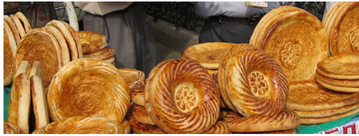
Tajik obi non (naan), a thicker flatbread

As in the majority of Afghan homes during mealtime, utensils are not typically used at restaurants. Instead, food is eaten using the right hand or scooped up with bread. Afghans eat three types of bread: naan, obi naan, and lavash. Naan is made from wheat and is generally an oval shape and baked. Obi naan is shaped more like a disk and has a thicker texture than naan. Lavash is distinguished by its thinness. 354