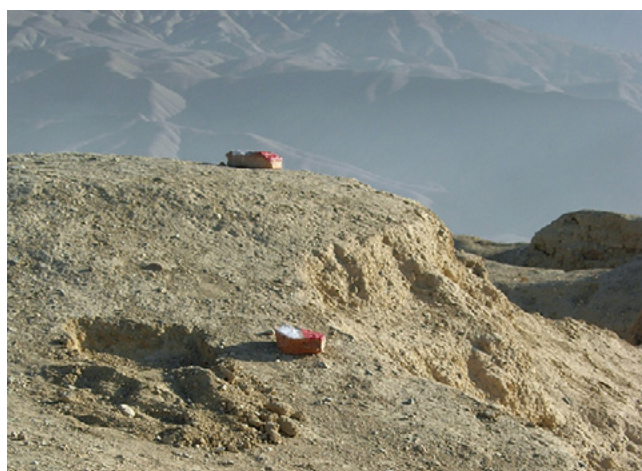
Minefield, Bamiyan

From the Soviets to the Taliban, numerous factions have used landmines and IEDs in Afghanistan. High estimates place the number of landmines scattered throughout the country in the millions. 448 While aggressive demining operations continue, the amount of mine-contaminated land increased between 2014 and 2015. 449, 450 The resurgent Taliban continue to place mines and pressure-plate IEDs along main roads and highways, and around