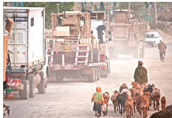
U.S. National Guard convoy escorting Afghan-owned cargo trucks along Highway 1, one of Afghanistan’s most dangerous roads, Parwan Province

Beyond city limits, road conditions are particularly bad. Destruction of the nation’s roads and bridges leave large sections of the country physically isolated. While over 10,000 miles of roads and highways were built between 2002 and 2014, much of it has since worn away or been damaged by improvised explosive devices (IEDs). 426 Most roads in rural areas are unpaved; in remote areas, there are often no roads at all, only trails. Afghan vehicles are typically old and poorly maintained, and drivers are often unlicensed.