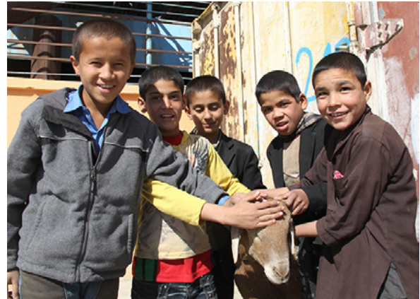
Boys from the Allaudin Orphanage in Kabul

as Mohamad Nasim. The less common name is considered the proper name—in this case, Nasim; informally, Afghans usually use this first name. In formal situations, Afghans are identified by their first name(s) and their father’s name. For example, Mohamad Nasim walade Amad Khan translates to “Mohamad Nasim son of Amad Khan” ( walade means “son of”).