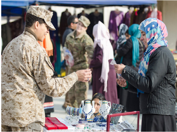
Bargaining, a customary practice in markets and bazaars

For the most part, prices in Afghan bazaars are not fixed, and customers are expected to haggle over the price. Depending on the item and vendor, the bargaining process may be lengthy and involved, so patience and calm are required. Some vendors may offer tea to customers.