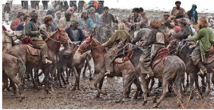
Buzkashi players

the champions of buzkashi , a horse-mounted sport, while Uzbek women are known for making high quality rugs. 183 Though Turkmen number only about 200,000, they contribute a significant amount to the Afghan economy. Their carpets and pelts made from karakul sheep wool are among Afghanistan's most important exports. Formerly nomadic