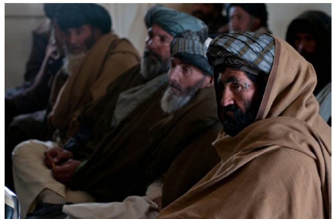
Local village elders from the Surri area of the Shinkai District in Zabul Province, at a shura

Afghan family networks extend into larger social units based on lineage, ethnicity, tribal affiliation, location, or other shared traits or interests. This extended solidarity network is known as an Afghan's qawm . This term is somewhat fluid and varies according to tribe, ethnic group, and region. Foremost, a person's qawm is often based on his or her family or clan, or tribal affiliation. Members of a qawm may trace their heritage to a common ancestor. A qawm may also refer to a specific village or region. In cities, qawm can refer to a profession or other common identity, such as Dari-speaking qawms in the west. 456, 457 Finally, Afghans may identify with more than one qawm . These social units have historically organized and identified Afghans and provided cooperative social bonds. A qawm is typically governed by a council of elder males, or jirga . 458, 459, 460