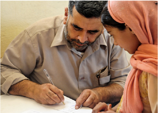
Afghan doctor writing a prescription for a patient, Farah Province

Historically, lack of healthcare and sanitation services, the physical effects of war, and the maintenance of strict cultural taboos all contributed to serious health risks for the country’s population, particularly in outlying areas. For example, Afghanistan has one of the highest levels of child malnutrition in the world—about 41% of children under 5 suffer from malnutrition. 396