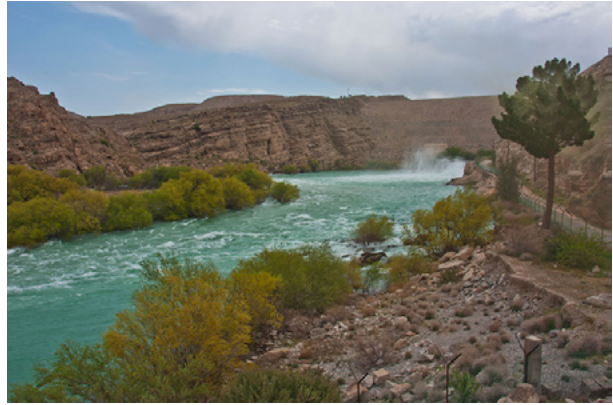
Kajaki Reservoir, a holding tank for the Kajaki Dam powerstation, on the Helmand River, southern Afghanistan

Afghanistan's most important rivers are the Amu Darya, the Kabul, the Helmand, the Farah, and the Harirud. Nearly all flow into neighboring Iran or Pakistan, making international water-sharing disputes are common. 23, 24, 25, 26 Forming a long section of the northern border, the Amu Darya is Afghanistan's only navigable river. The Kabul, the major waterway in eastern Afghanistan, flows from its source in the Central Highlands into the Indus River in Pakistan. The Helmand and Farah rivers join in southwestern Afghanistan, entering the salty wetlands of the Sistan Depression, on the Afghan-Iranian border. The Helmand, the longest river in the country at 1,400 km (870 mi), and the Farah are critical resources for irrigation water in the south. Flowing westward from the central mountains, the Harirud passes near the western city of Herat and ultimately forms a portion of the Afghan-Iranian border. Afghanistan's lakes are small in size and number; those in the south and west are commonly saline. Streams and lakes are only active after periods of rainfall or during the spring snowmelt. 27