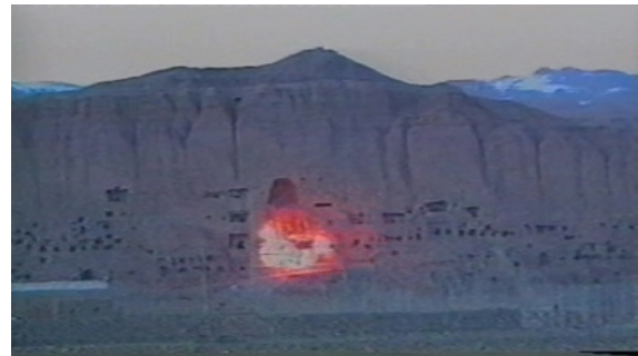
Taliban destroying the Bamiyan Buddha statues in March 2001

In addition, the country's non-Islamic cultural heritage was destroyed. Afghanistan was home to the world's tallest Buddha statues (located in Bamiyan), but the Taliban regarded the statues as a form of idolatry that implied Buddha was equal to Allah. Despite international outcry, in 2001, the 1,500-year-old statues were destroyed with explosives. 82