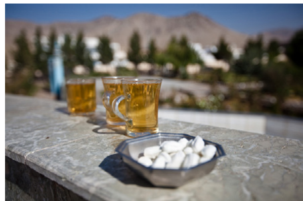
Tea ( chai), the national drink of Afghanistan, typically served with a small dish of sugar

Afghans try to show respect and sympathy for those who find themselves far away from home. Inviting someone for a cup of tea is a way to show hospitality to a visitor. If visitors are offered a cup of tea when meeting Afghans, it should be accepted. If the visitor does not want to drink the tea, it may be left without causing offense. It is customary for Afghans to drink three cups of tea at one sitting. When visiting an Afghan home for tea or a meal, it is appropriate to bring a small gift such as fruit or pastries. 267 Gifts are not expected, however; it is the host's honor to provide for the guest.