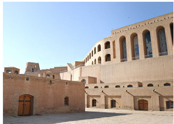
Qala Ikhtyaruddin (the Citadel of Herat), western Afghanistan

Herat is Afghanistan’s third- or fourth-largest city (population estimates range from 272,800 to 477,452). 52, 53 Herat is located on flat river plains north of the Harirud River—a fertile agricultural region that is the economic center of western Afghanistan. The region has been plagued by drought in recent years, and the extremely strong winds that blow through the city in summer months can evolve into dust storms. 54 The border with Iran is less than 80 km (50 mi) away, and Persian culture influences daily life. 55 Most Herat residents are Tajik and speak Dari as well as Pashto. Herat was once the capital of the Timurid Empire, along the Silk Road between Europe and Asia. Traces of more than 2,000 years of rich history can be seen throughout Herat today. The citadel, Qala Ikhtyaruddin, built by Alexander the Great, and the famous Friday mosque, Jama Masjid, with its cobalt blue minarets, are striking examples.