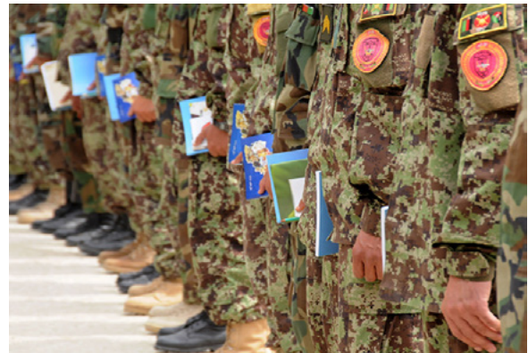
Afghan National Army soldiers, literacy training materials in hand, at the completion of their training at NATO Capital Division headquarters in Kabul

The government in Kabul continues to face growing security threats from insurgents—including the Taliban and pockets of ISIL-K and al-Qaeda—the lasting effects of decades of war, and the region’s long-standing tribal divisions. 103, 104, 105, 106, 107 With the departure of most U.S. and coalition troops in 2014, Afghanistan began to experience setbacks against the Taliban and other armed groups that oppose it, the war on opium, and in reconstruction efforts. 108 Despite $115 billion in aid provided by the U.S. toward reconstruction, counternarcotics, and Afghan National Security Forces training since 2002, Afghanistan has lost territory to the insurgency, unemployment remains high, and poverty persists. 109,110 Many blame endemic corruption and Afghanistan’s inability to sustain its progress without continued international support. 111, 112, 113