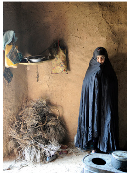
In Adraskan, Herat Province, a woman stands in the corner of her mud house

The eldest women in the family have authority in various domestic matters, such as allocation of chores. They are in charge of the younger women in the household. Women's primary responsibilities are child-rearing, caring for the family, and the many tasks involved in operating the household. In some cases, a woman may work outside the home, although this practice was banned under the Taliban and remains taboo in many communities. Overall, women are required to submit to the will of their fathers, husbands, and other male relatives. Failure to do so may result in domestic violence. 474