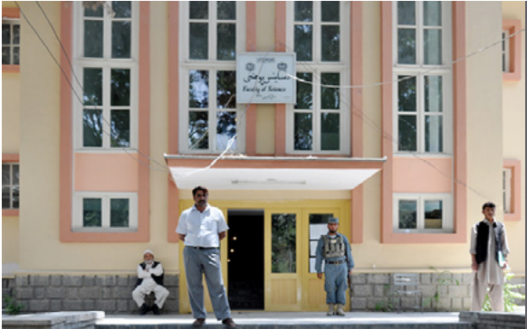
Kabul University Herbarium, housing a collection of preserved native Afghan plants for study

Kabul University, Afghanistan’s premiere institution of higher learning, sustained serious damage during the 1990s. As the frontlines of the civil war shifted toward the city, the campus was closed in 1992 and heavily mined. 329 The university reopened after the Taliban came to power, but classes were taught only in Pashto. When Afghanistan was liberated in 2001, the faculty resumed using Dari as the primary (and traditional) language of instruction. 330