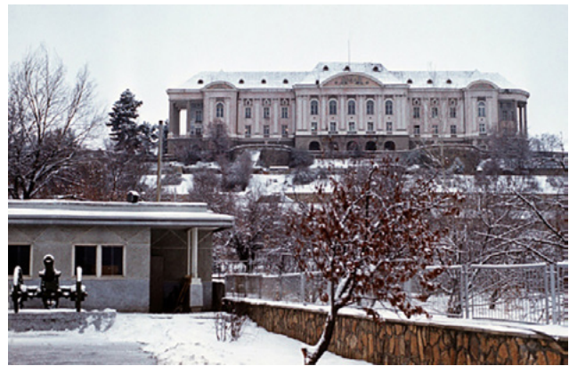
Tajbeg Palace in 1987, once home of the Afghan royal family, later headquarters of the Soviet 40th Army in Kabul

In April 1978, the PDPA overthrew the Daoud government in a bloody coup and established the Democratic Republic of Afghanistan. Its Marxist agenda, which included the introduction of secular education for both boys and girls, quickly drew opposition from powerful families and clans due to its violation of Islamic norms. 70 A friendship treaty with the U.S.S.R. provided the government with enough material support to stave off collapse. The PDPA government ceased following Moscow’s advice, however, as the country’s security deteriorated. In December 1979, the Soviets dispatched large numbers of airborne troops to Kabul on the pretext of a training exercise. The existing head of state was killed, and the Soviets installed a rival, Babrak Karmal. The Karmal government was unable to exercise its power beyond Kabul, and more Red Army troops were dispatched to maintain order.