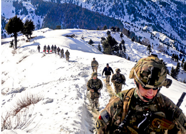
U.S. Army 101st Airborne Division and Afghan border police hiking to an observation point along the Afghanistan-Pakistan border Flickr/The U.S. Army

35°C (95°F) are common in the southern deserts. The northeastern mountain regions, including the Wakhan Corridor, have a subarctic climate characterized by bitter winters that are dry and cold. Extremes of 49°C (120°F) and -31°C (-24°F) have been recorded in Jalalabad and Kabul, respectively. 7, 8