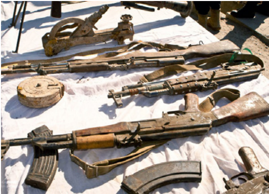
Weapons captured during a counterinsurgency operation in Helmand Province

Centuries of intertribal strife and conflict have instilled Afghans with a sharp and dedicated sense of personal and familial protection. Afghans under the age of 30 have known little else besides conflict, be it from Soviet occupation, civil war, tribal feuds, terrorism, insurgency, or counterinsurgency. Under these circumstances, vast stores of weapons have been brought into the country, and Afghans have been forced to defend themselves in the absence of any rule of law. This readiness to safeguard one’s own is prevalent in rural areas, where the government lacks a strong security presence and local militias wield power. As a result, many men in towns and villages routinely carry firearms and keep personal weapons in their home, despite wide-scale disarmament efforts. 390