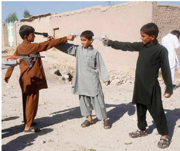
Afghan boys in their best clothing, playing with toy guns on Eid al-Adha, one of the holiest days in Islam, Jalalabad

During celebrations it is not uncommon for Afghans to fire guns, especially in rural areas. For example, gunshots might be fired to mark the beginning or end of Ramadan, the first day of Eid, a marriage, or the birth of a child.