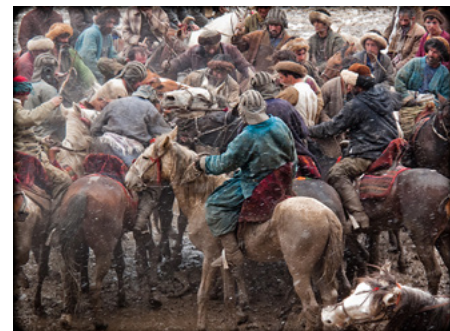
Buzkashi players, some wearing Soviet tanker helmets, in a muddy winter field

Buzkashi (goat-grabbing) is the national sport of Afghanistan. The ancient game—much like rugby on horseback—is played by teams of 10 riders who grapple for the carcass of a goat or calf and take it across the goal line. Uzbeks are considered champions.