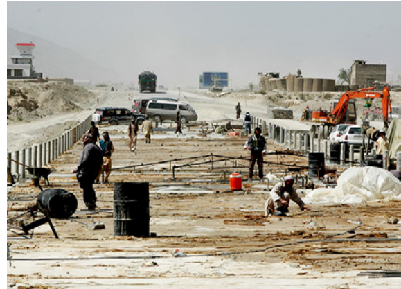
Building the Gardez-Khost road in Jadran, Paktia Province

Prolonged conflict in Afghanistan has severely damaged the existing transportation network and slowed development of new infrastructure. Although reconstruction teams have made substantial progress in building new roads, many roads are in a state of disrepair. 423 The Amu Darya River is the only principal waterway used for transport. 424 A major reconstruction goal is developing an extensive highway network linking Afghanistan’s major cities—Kabul, Kandahar, Herat, and Mazar-e Sharif. Insurgent roadblocks and bombings have set back construction of Highway 1, or the “Ring Road.” 425