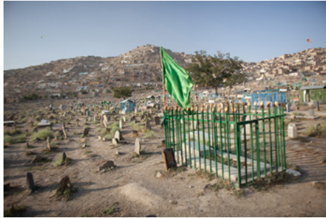
Cemetery, Daykundi Province

Cemeteries are, of course, sacred places and they should be treated with respect. Afghans avoid walking over tombs and visitors should follow this practice. The shahid has special importance in both Islamic and Afghan society. When crossing cemeteries anywhere in Afghanistan, visitors will encounter many tombs that are distinguished with red or green flags. These are the final resting places of Afghan shahids who died defending their country and their beliefs.