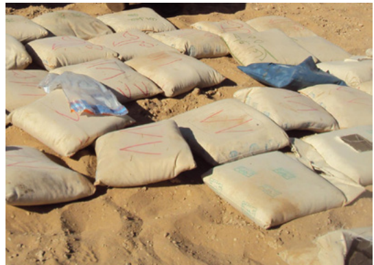
Almost 435 kg (960 lbs) of opium seized by Afghan National Security and International Security Assistance Forces during a vehicle stop

The opium trade, which generates revenues that far exceed the Afghan government's entire annual operating budget, jumped 43% in 2016. 162, 163 Decreased international and domestic security, and eradication efforts are major factors in the resurgence of opium production. While many Afghan farmers have devoted more of their fields to planting wheat in recent years, prices have dropped and it is less lucrative than opium. Poppies are highly profitable in many areas of southern Afghanistan, and farmers claim the profit from poppies is 324 times that of wheat. 164 In the absence of an alternative livelihood for Afghan farmers, poppy cultivation remains difficult to eradicate.