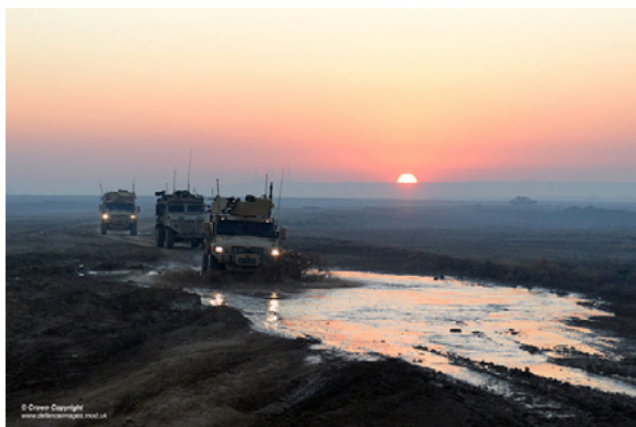
Convoy of British tactical support vehicles, northeast of Lashkar Gah, Helmand Province

Military convoys also share Afghan roads, and drivers should never attempt to pass a military vehicle; speeding up to these vehicles or driving too close may be interpreted as a threat. 428 While some roads in Kabul and a handful of other cities are acceptable for standard sedans, a four-wheel drive vehicle is indispensable outside major cities. That said, driving off-road or at night is extremely dangerous.