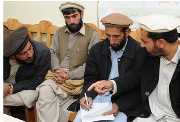
Provincial and district leaders and tribal elders from Kunar and Nuristan provinces conducting a jirga, Kunar Province

As such, rural Afghans are resourceful and fiercely independent. Making up nearly two-thirds of the country's population, they lead a life deeply rooted in tradition. Tribes and families are responsible for protecting their own, and they rely on ancient modes of subsistence to survive. This often lends itself toward poverty and hardship, but also hardiness and relative autonomy. Accordingly, remote areas have long served as a refuge for insurgents who seek to evade government forces or influence. Specifically, the Pashtun-dominated eastern and southern regions of Afghanistan have experienced heavy insurgent activity in recent years. 374