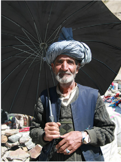
A Tajik man, at a market on the Afghanistan-Tajikistan border

In contrast to the Pashtun, tribal identities have largely broken down among Tajiks. Tajiks live mainly in the mountains of the northeast and in bigger cities such as Herat, Kabul, and Mazar-e Sharif. They organize themselves by lineage, ancestral region, and, for those who have migrated to a city, occupational group. 172 In general, urban and plains-dwelling Tajiks are well educated and work in commerce or as artisans; those living in the mountains are herdsmen or farmers.