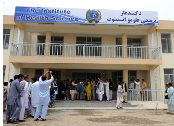
Opening ceremony of the Kandahar Nursing and Midwifery Institute in Kandahar

The Afghan healthcare system, devastated by years of civil war, has improved in recent years due to international aid and reconstruction efforts. NGOs have played a significant role in this process, establishing clinics in various locations throughout the country. Maternal, infant, and under-5 mortality rates have improved, but still are far higher than international averages. 321 The country continues to face medical challenges—lack of qualified personnel, dilapidated facilities, lack of proper equipment, and shortages of clean drinking water and electricity.