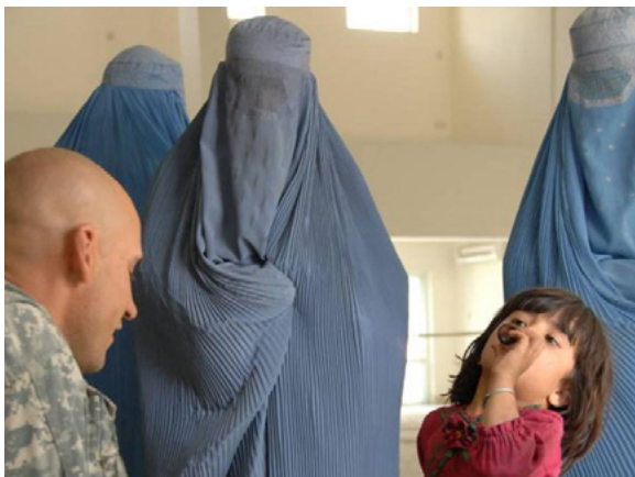
Male-female interaction, with strict boundaries

Shaking hands with women is prohibited. Such an act will likely be considered offensive to them and their family members, especially those who live in rural areas. Usually Afghans politely say “salaam” to women with a small gesture or nod. Afghans generally call women syassar . An unfamiliar male should communicate with a woman through her husband or a close male relative.