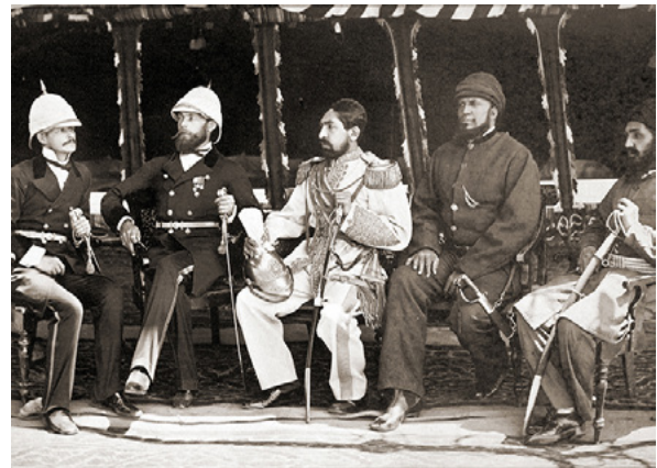
Afghan Emir Mohammad Yaqub Khan (center) with British officers at the signing of the Treaty of Gandamak, ending the first phase of the Second Anglo-Afghan War, 1879

In 1747, Afghanistan was created from a loose group of states when Ahmad Shah Durrani was elected shah (king) by a Loya Jirga (assembly) of Pashtun tribal leaders. Ahmad Shah Durrani consolidated the Pashtun tribes and expanded the Afghan territory to Delhi (in modern-day India) and the Arabian Sea. Pashtun monarchs ruled Afghanistan more or less continuously from 1780. In the 19th century, the British, based in their colonies in India, fought three Anglo-Afghan wars. These wars occurred as part of the “the Great Game,” a prolonged battle for Central Asia waged between Russia and Britain. Neither side was able to completely subdue the country, although they exerted various levels of control on Afghan leaders.