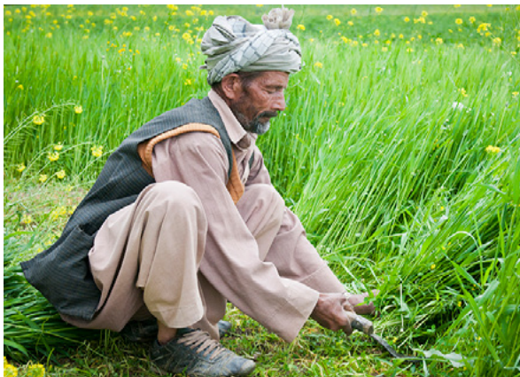
An Alfalfa farmer works his field by hand, Bamyan Province

As they have been for centuries, farming and animal husbandry are the main sources of income for most Afghans. 146 In recent decades, droughts, prolonged conflict, and loss of infrastructure have severely limited the conventional agricultural sector. Once self-sufficient in its production of wheat, a staple food for Afghans, the country now counts wheat flour among its main imports, along with cooking oil, tea, sugar, and moisture-retaining peat for farming. 147, 148, 149