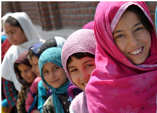
Afghan refugee children outside of their school in Kabul, waiting in line for donations of clothing and school supplies

A variety of other languages are spoken among the country's many ethnic groups, including Balochi, Pashai, Nuristani, and Pamiri and the Turkic languages Turkmen, Uzbek, and Kyrgyz. In areas where the majority speaks one of these languages, it is considered the third official language in the area. Though Nuristani form a single Indo-Iranian linguistic group, they speak five different languages, and many of the Nuristani tribes cannot communicate with one another. 202 The Pashai's 2,000-year-old