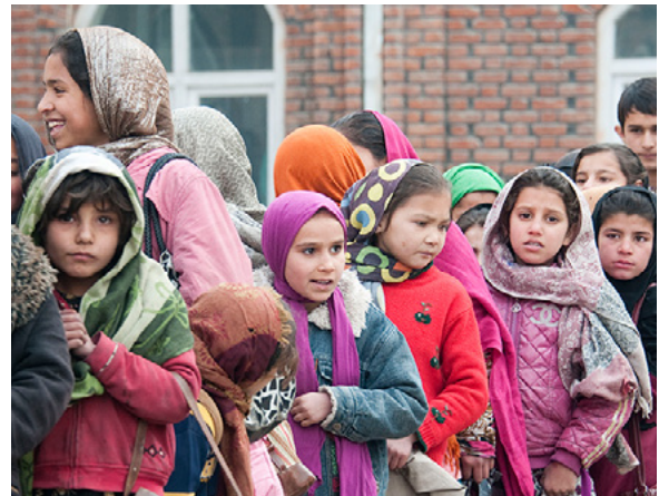
Students at Kabul's Aschiana School, which provides vocational and literacy education to children from the Afghan streets and refugee camps

In 2016 alone, an average of 1,000 Afghans fled their homes each day due to conflict, and the number of refugees returning to Afghanistan topped 1 million. City centers have been unable to accommodate the steady stream of settlers, and the result has been an extensive urban sprawl of tented camps and hastily built structures. These areas typically have little to no employment opportunities and limited public services for refugees. Many living on the outskirts have no access to clean water or healthcare and are dependent on food assistance. 308, 309, 310