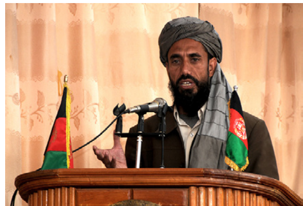
Kunar Province Chief of Justice speaking to a group of mullahs and religious leaders in Asadabad about the rule of law and constitutional rights

Islam is the state religion of Afghanistan and has a strong influence on the country’s government and legal system. The Afghan constitution states that “no law can be contrary to the beliefs and provisions of the sacred religion of Islam.” It also requires the president and vice president of Afghanistan to be Muslim. The constitution does, however, provide freedom of religion, as long as non-Muslim religious minorities practice their faith “within the limits of the provisions of the law.” 229 It also provides