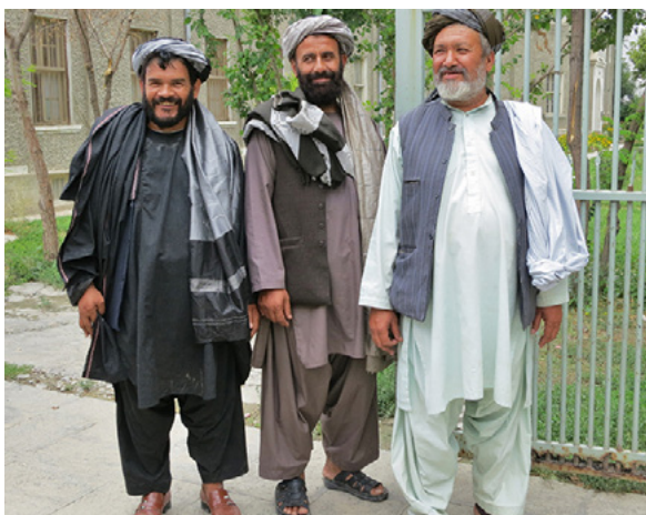
Traditional Pashtun clothing for men, the kameez peraahn wa tonban

Men’s everyday attire consists of a loose-fitting tunic and pants ( kameezperaahn wa tonban ) and a turban head cover. These items are made from materials with solid, dull colors. Vests may be worn over the shirt, and it is common for men to carry a shawl-like garment on their shoulders.