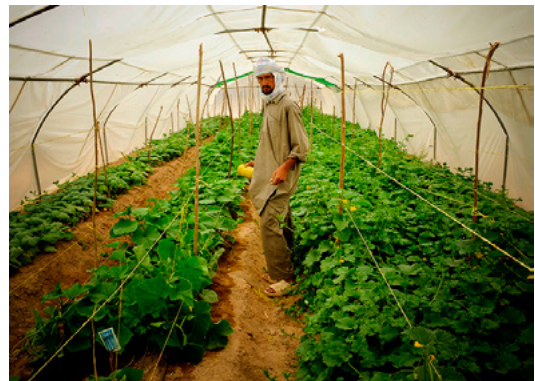
Afghan farmer cultivating his skills at an agricultural school in Farah City

Agriculture and animal husbandry have historically formed the basis of the Afghan economy. Most Afghans continue to work as farmers and livestock herders, or in related businesses. Major conventional crops include grains (such as wheat and barley), cotton, fruits, and nuts. Cultivating opium poppies has become widespread due to its hardiness and high market value. Cattle, sheep, goats, donkeys, and horses are common types of livestock. The first three are especially important for milk production. Other varieties include camels, buffalo, and mules. 269 Some tribes, including Pashtun tribes in the southeast, subsist as nomadic shepherds, migrating in search of grazing land. The production of handicrafts and textiles, such as carpets, is another common economic activity.