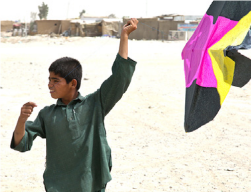
Afghan boy flying a kite, Kandahar

After the fall of the Taliban, social reforms were implemented, but traditional and fundamentalist practices remain prevalent. Although attitudes vary throughout the country, such resistance to change demonstrates the strength of Afghan traditions. Banned during the Taliban reign, many Afghan traditions have endured and flourish today as never before. Afghan music, dance, kite fighting, and buzkashi tournaments are celebrated events again, reinforcing traditions from the many different tribes and languages throughout the country.