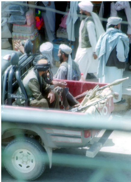
Taliban police patrolling the streets of Herat in a pickup truck, 2001

In 1996, the Taliban, an extremist Islamic group dominated by Pashtuns, seized power over much of the country, including Kabul. 77 The group benefited from assistance from Pakistan's military and financial support from the Gulf States.