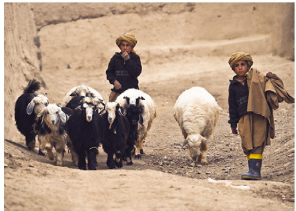
Afghan boys tending sheep and goats in the village of Shabila Kalan, Zabul Province, southern Afghanistan

In mountainous northeastern Afghanistan, communities live in relative isolation. Here live the Kyrgyz and Nuristani. About 200,000 Kyrgyz live in the Wakhan Corridor of Badakhshan Province. They are “vertical nomads,” moving their herds of sheep and goats from low-lying areas in the winter to higher elevations in the summer. They will often use yaks or camels to transport loads during these seasonal migrations. 185, 186 The Nuristani also live in relative isolation in communities perched at high elevations along the river valleys