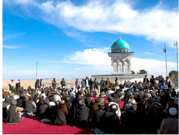
Ziarat-e Shah Maqsd Shrine, northern Kandahar Province, regarded by many Afghans as the third holiest Islamic site in Afghanistan

Afghan women were first allowed to enter certain mosques in Kabul and other large cities in 2008, after segregated spaces were designated for them. 248, 249 But most mosques in urban and rural communities have yet to open their doors to female worshippers. Traditionally, Afghan women have instead exercised their religious faith through activities related to shrines, known as ziarats . Women visit such shrines to pray for blessings of a protective or curative nature. 250 It is also common for women to pray at home.