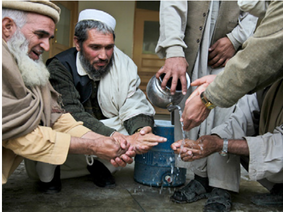
Afghan village elders washing their hands before a meal, Kunar province, northeastern Afghanistan

Afghans maintain an important distinction between the right and left hands. They use their right hand for all public interactions, including shaking hands, eating, drinking, making a payment, presenting or receiving a gift, etc. The left hand is traditionally associated with matters of personal hygiene, and it is considered unclean. It is therefore inappropriate to use the left hand for eating, passing things to others, or gesturing. Even left-handed persons should observe this custom.