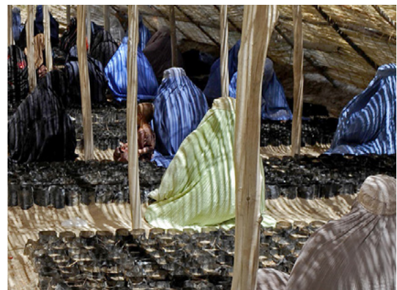
Women planting seeds in at a Qalat nursery greenhouse, Zabul Province

For centuries, most rural Afghans supported themselves and their families as farmers and livestock herders. Approximately 45% of the country is pastureland, which supports livestock owned by settled farmers and nomadic herders. 375, 376, 377 But only 12% of the land in Afghanistan is suitable for growing crops and resources are limited. Historically, the primary farming obstacle has been water, which is most plentiful in the spring. Long ago, farmers developed a variety of techniques to capture water and channel it to their crops. In the northern plains, dams diverted water into irrigation schemes. Throughout much of the rest of the country, Afghans used karez , a Persian technique in which an underground tunnel intersected with numerous vertical shafts