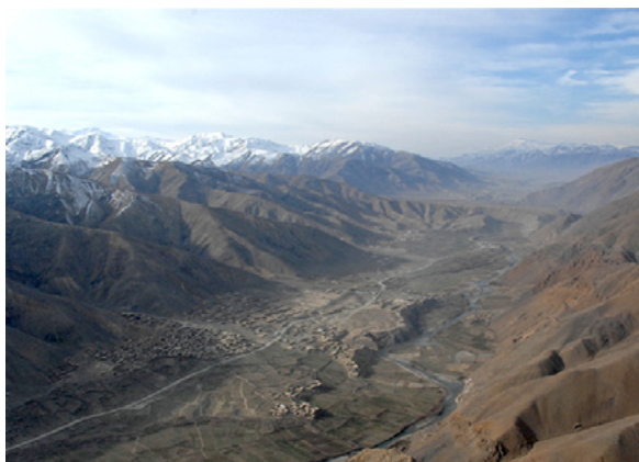
Kajakan Valley, between Jalalabad and the border city of Torkham, Nangarhar Province

Afghanistan can be divided into three distinct geographic regions: the Central Highlands, the Northern Plains, and the Southern Plateau. The Central Highlands include the formidable Hindu Kush Range, the country’s dominant mountain system. It extends in a southwesterly direction from the Wakhan Corridor of the far northeast into the center of the country. High mountain passes are of significant strategic value in the Central Highlands; these include the Shebar Pass and the