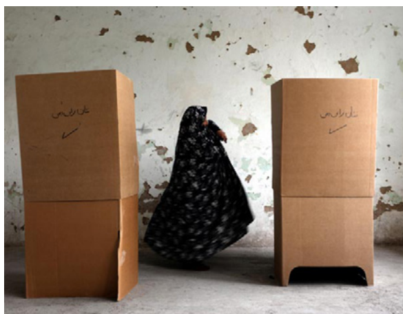
Afghan woman after voting, Herat

Although men and women have equal rights under the Afghan constitution, the country remains deeply conservative and patriarchal. Afghan men participate in politics and relationships with outsiders. Within the family, they are the breadwinners, disciplinarians, and providers for elderly relatives. In general, male family members preside over a woman's life. The head of the household will make all key decisions for a woman: whether she can attend school as a girl, who she marries, and even whether she is allowed to seek professional medical help. 259 When given permission to go out in public, women must typically be escorted by their male relatives.