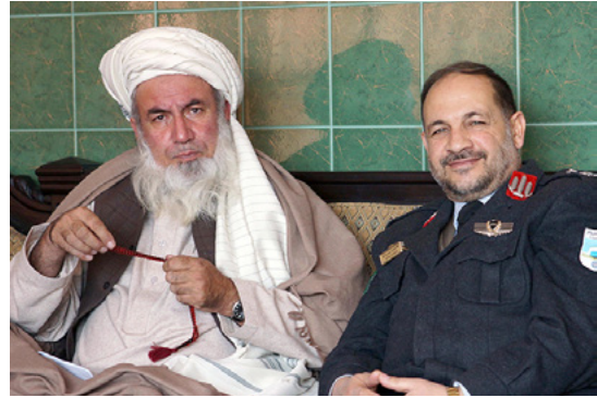
Provincial Governor of Paktia Province with a British Army major discussing insurgent and Taliban reintegration in Paktia province

are forming in response to the onslaught of the Taliban and the deteriorating security situation. 440 In contrast to jirga-directed tribal forces that are typical in Pashtun areas, these private militias do not usually fall under the community authority. Rather, the militias answer to an outside authority, such as powerful local strongmen or warlords. Many of these authorities have been accused of human rights abuses over the years, and the actions of their militias are often predatory. 441, 442, 443, 444 That said, some warlord governors have proved effective in combating the opium trade, bolstering security, and developing the local economy. 445