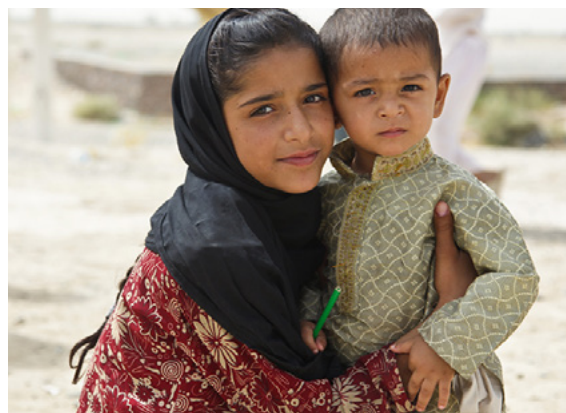
Afghan girl and boy, Kandahar

The birth of a child is a joyous event, especially when the child is a boy. Traditionally, Muslim fathers whisper the shahada (Muslim declaration of faith) into the baby's right ear. 482 This is to ensure these are the first words the newborn hears. In many areas, celebrations include the firing of guns and a feast with family and friends. After the seventh day, Afghans celebrate the shaving of the infant's head, in the Muslim tradition. The Muslim rite of passage for male children is circumcision. Most Afghan boys are circumcised between the ages of two and five. Whether it is celebrated elaborately or simply, it marks the beginning of a boy's life as an adult. 483, 484