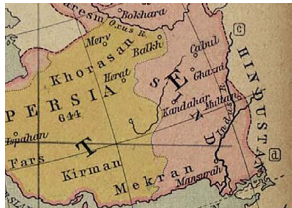
Map of ancient Persia 750 C.E, with Greater Khorasan in gold and Sind in pink, encompassing the area of today's Afghanistan Wikipedia

Human settlement in the Afghan region dates back several thousand years. Historically, it was a crossroads for traffic between the Middle East, Central Asia, South Asia, and East Asia. Accordingly, various waves of migrating peoples and invading armies passed through the area, bringing trade and war. Many of these peoples followed a main trade route that cut through the Hindu Kush Mountains of modern-day Afghanistan. This route formed a section of what would later be known as the Silk Road.