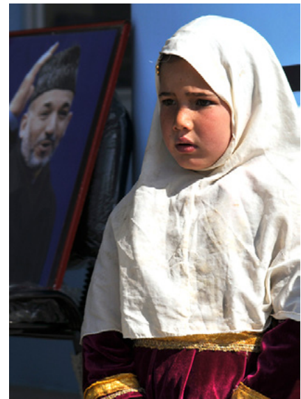
Eight-year-old female student at the opening of a new co-educational school in Herat city

According to the Quran, men and women are moral equals with the same religious obligations. In terms of rights and responsibilities, however, there is a clear division. In predominantly conservative Sunni Afghanistan, women must conform to prevailing patriarchal cultural norms, and there are numerous restrictions on their behavior. Women are typically seen as key to preserving tradition; and they maintain family and social continuity and culture. 244 In areas controlled by the Taliban, the interpretation of Islamic doctrine is more extreme, and the consequences for women who challenge traditional norms are severe. 245 There are a few exceptions among Shi’a minority groups, such as the ethnic Hazara and Sufis, where women participate in the political process and work outside of the home. 246, 247