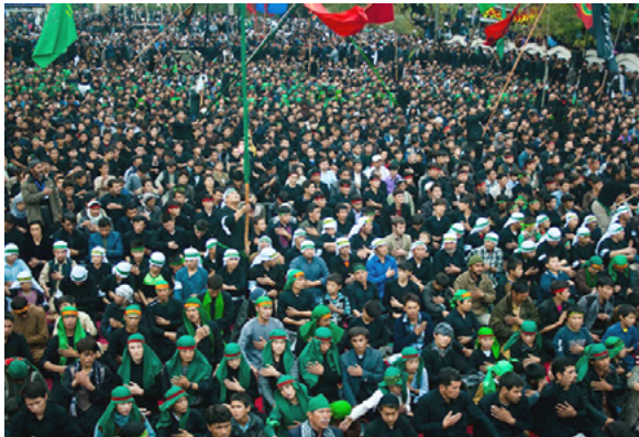
Crowd of Shi'a men during Ashura, wearing black as a sign of mourning and green to commemorate Hussein ibn Ali

Ashura commemorates the martyrdom of Hussein ibn Ali, the son of Ali and grandson of Muhammad, who was killed in the battle of Karbala in 680 C.E. amid power struggles for the caliphate. This day is recognized by all Muslims, but it is especially significant to the Shi'a community. Ashura occurs on the 10th day of the Islamic month of Muharram, a period of mourning for Shi'a Muslims. During this time, Shi'a Muslim men may scourge themselves with various instruments until their backs bleed. Such acts of