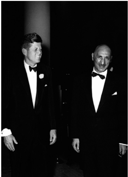
King Mohammad Zahir Shah, the last king of Afghanistan, here with John F. Kennedy at a dinner in the king's honor in September 1963

Among the country's many ethnic groups, which are known collectively as Afghans, Dari and Pashto are the dominant and official languages. 193 Pashto speakers live in large numbers in Afghanistan and northern Pakistan, and the use of the language is generally limited to these regions. Dari, by contrast, can be understood by anyone proficient in Persian Farsi, which, historically, was spoken in an area that extended from the Middle East to India. 194 The name Dari, in fact, dates back only to 1964, when King Zahir Shah, a Pashtun, grew concerned about the political and cultural ascendancy of neighboring Iran. In an effort to assert autonomy, he renamed Persian Farsi "Dari," which is a "medieval literary synonym for Persian meaning 'the language of Court.'" 195 The language is also known as Dari Persian or Afghan Persian. The difference between spoken Persian Farsi and Dari is akin to the difference between European and Canadian French. 196, 197, 198