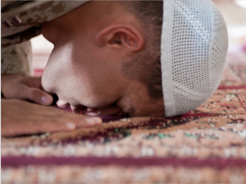
A Muslim U.S. Marine chaplain praying during Ramadan, when he ministers to Afghan Muslims throughout Helmand and Kandahar provinces