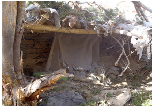
Haqqani network fighter encampment site in Paktika province, cleared by combined Afghan and coalition security forces

Khost is isolated from the rest of Afghanistan to the west by a mountain chain with peaks that reach 3,000 m (9,800 ft); there is only one westward road through to Gardez. To the east, Khost borders the Pakistani province of North Waziristan, where the Taliban subgroup The Haqqani Network is based. 63 Remote districts of Khost Province are used as infiltration points for militants crossing between the two countries. The rocky, wooded border terrain makes security patrols and surveillance extremely difficult. 64, 65