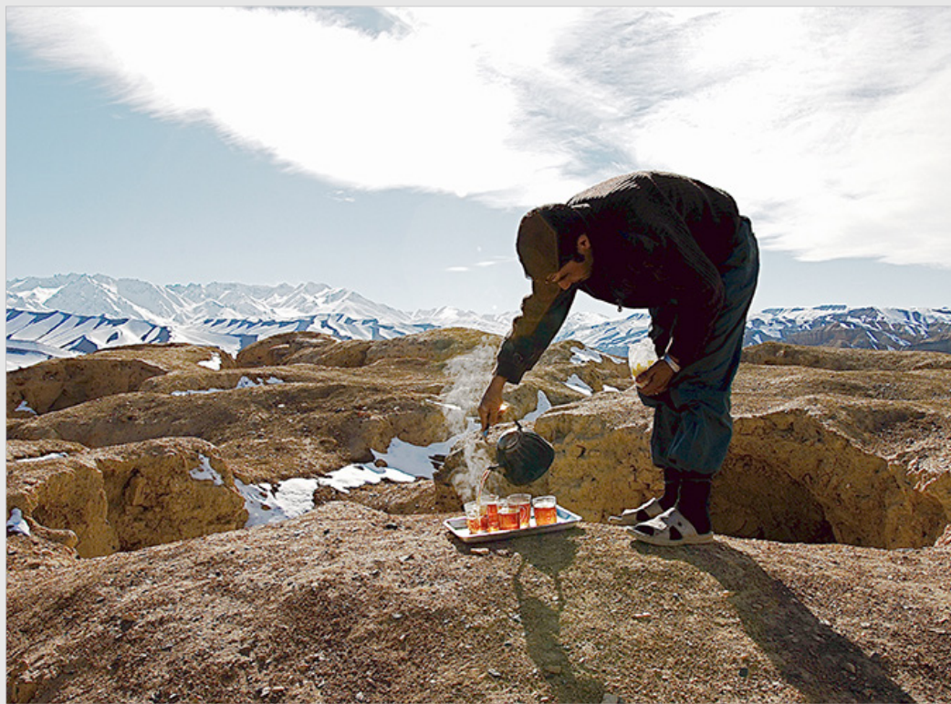
Tea (chai), a key part of hospitality and everyday life in Afghanistan