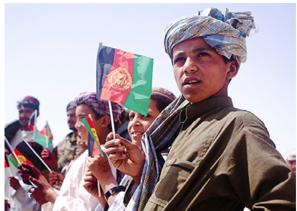
Local children waving Afghan flags during the celebration of Eid Il-Iftar, Helmand Province

Eid means “festival” in Arabic, and Eid al-Fitr or Eid Ramazan (The Feast of the End of the Fast) marks the end of Ramadan. Muslims celebrate the end of the fast with a large, multiday feast with family and friends. One of the holiest days in Islam, Eid Qorban or Eid al-Adha (The Feast of Sacrifice), marks the 12th month of the Islamic calendar. It traditionally marks the end of the Muslim pilgrimage, or hajj , to Mecca. The festival commemorates Abraham’s willingness to sacrifice his son in obedience to Allah. People celebrate their happiness and show forgiveness during the two Eid periods.