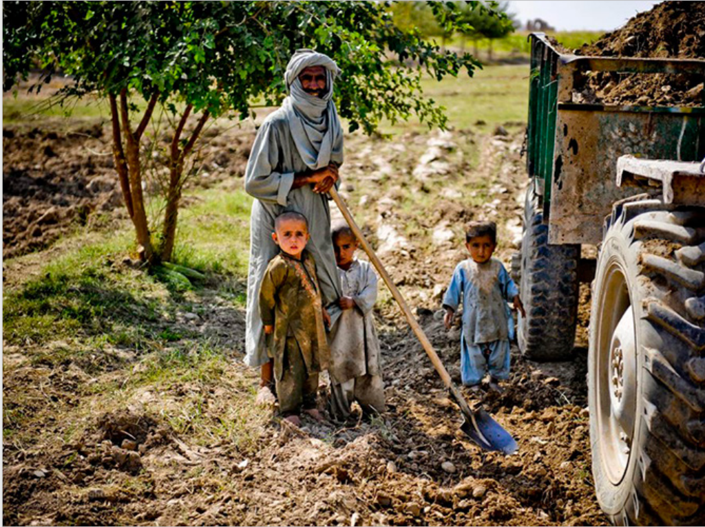
A former opium poppy farmer (now grape farmer) and his family standing beside a tractor, Lashkar Gah, Helmand Province