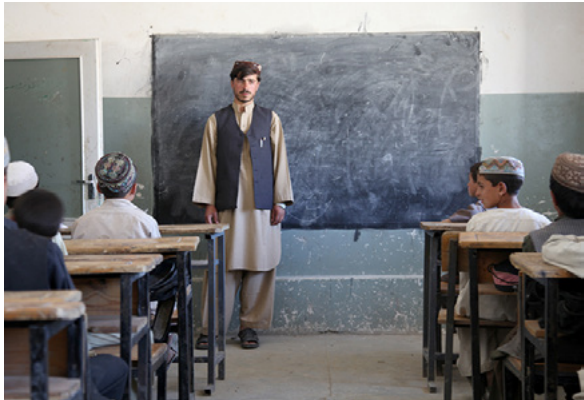
Elementary school teacher in Jalrez, (Maidan) Wardak Province, central eastern Afghanistan

Officially, primary education in Afghanistan is free and compulsory in areas where it is available, but a comprehensive level of enrollment has never been achieved. This remains true today for urban Afghans; the educational opportunities for children in cities depends on the financial status of their families. Children who live in squatter settlements are far less likely to be enrolled than those from families of means, typically because their families need them to work. A family’s proximity to a school is also a significant factor in whether children receive an education. In these cases, girls are more likely to be kept at home than boys because of cultural norms that prioritize male education. 324