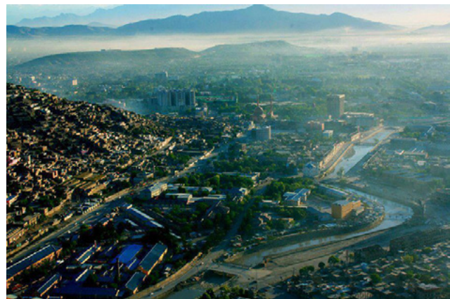
Early morning, Kabul and Kabul River

Kabul is the capital of Afghanistan and by far its largest city. 28, 29, 30 Situated near the eastern border with Pakistan, its nearly 5 million residents represent roughly 41% of the total urban population. 31, 32, 33 Kabul lies between the Hindu Kush mountains at an elevation of about 1,800 m (5,900 ft) along the Kabul River. At the crossroads of north-south and east-west trade routes, Kabul is the center of culture and commerce in Afghanistan. There are 9 universities in the city, 24 television stations, and cell phones are common. 34, 35 From Kabul city, there are major routes that lead to Kandahar, Herat, Jalalabad, and