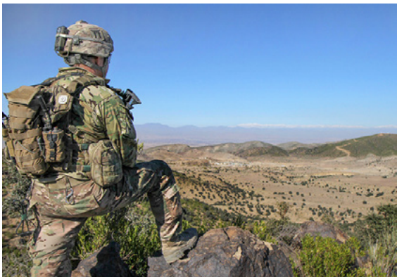
U.S. Army infantry platoon sergeant watching for insurgent activity near the Afghan-Pakistan border, Khost Province

Khost is located on a plateau in eastern Afghanistan, roughly 150 km (93 mi) south of Kabul and 16 km (10 mi) from the Pakistani border. Khost's roughly 160,000 residents are predominantly Pashtun, as is Khost Province as a whole. Khost is one of a few main transit hubs for trade with Pakistan, as well as a waystation for smuggled goods into and out of Afghanistan. Militarily, the city and the surrounding area have been of critical strategic importance over the last 40 years. During the Soviet-Afghan war, Khost was the object of a siege that lasted over 8 years; more recently, it has been a site of key military engagements between U.S. forces and Taliban militants.