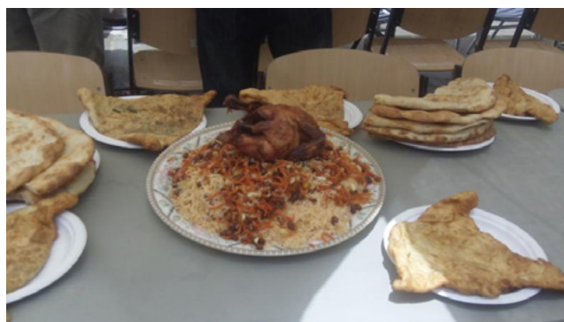
Traditional Afghan meal, with rice, naan flatbread, and chicken

A customary Afghan dish is pilaf ( palau ), which consists of rice, meat (chicken, lamb, or goat), vegetables, nuts, dried fruit, and spices. Carrots, raisins, and lamb are the main ingredients in qabili palau , one of the nation's most famous dishes, but there are many other variations. Meat dumplings, noodle soups, and lamb stews are also popular. Fruits and nuts typically complement all meals because they are common agricultural products. Yogurt, eggs, and other animal products are also staples. Afghan Muslims must ensure that their food, particularly their meat, is halal (much like kosher). Alcohol and pork are strictly avoided in accordance with Islamic tradition. 275