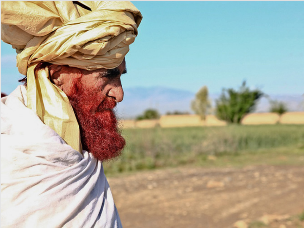
Pashto man with a henna beard, a religiously allowed means of dying hair that may also indicate he has performed the hajj