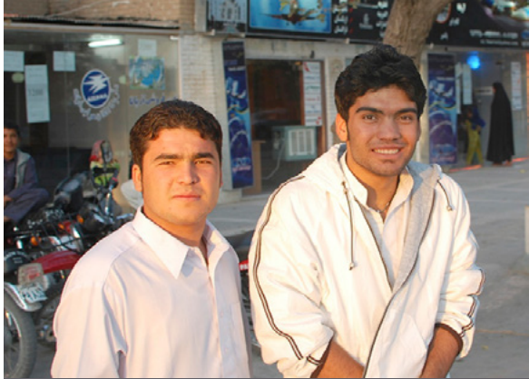
Two young Herati men