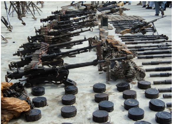
Large weapons cache in Kandahar city, confiscated by Afghan and coalition forces

There is also widespread abandoned and unexploded ordnance in the country; the most affected areas are eastern and southern Afghanistan, particularly Helmand and Kandahar provinces. In 2014, there were 1,296 deaths from mines, IEDs, and explosive remnants of war, though experts believe these numbers are underreported. 454