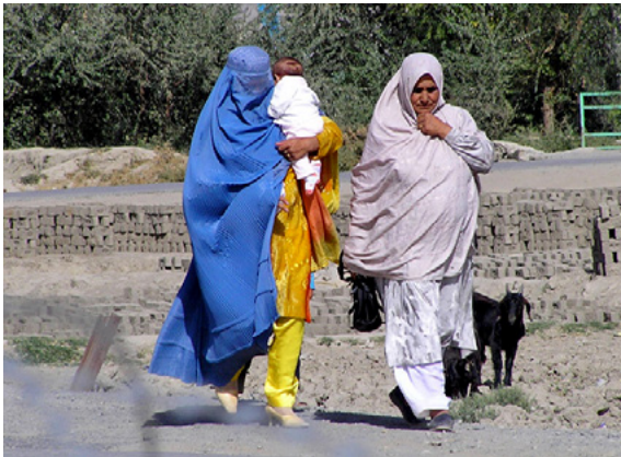
Afghan women near Kabul Airport

Since 2002, moderately successful efforts have expanded medical services to rural areas, focusing on providing reproductive healthcare. Training female doctors and midwives was a central goal of these initiatives since cultural prohibitions prevent Afghan women from receiving healthcare services from men. As a result, between 2002 and 2015 pregnancy-related mortality dropped from 1,600 to 396 deaths for every 100,000 live births. 400 Nonetheless, two-thirds of all women give birth at home