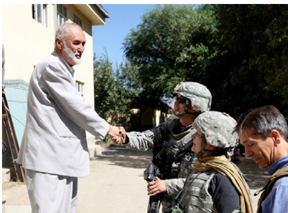
The light handshake, a common formal greeting between men in Afghanistan