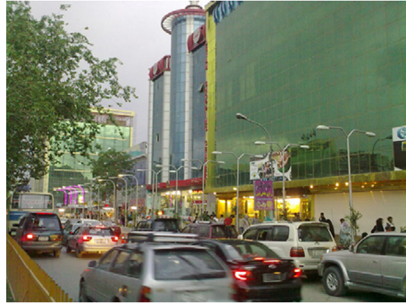
Khair Khana neighborhood of Kabul, extensively redeveloped with new highrises, malls, and modern apartments

Road conditions throughout Afghanistan are hazardous. Urban roads are often in poor condition and may be unlit at night. Accidents are common because many drivers are unlicensed and traffic rules are often neither obeyed nor enforced. The mixture of vehicles, pedestrians, cyclists, military convoys, and animals provides for crowded and dangerous conditions for drivers and pedestrians. 343 Continuous road work and a high volume of vehicles have created enormous traffic jams in urban areas. Traffic is notoriously bad in Kabul, where there are few traffic lights, virtually no signage, and no lane demarcation. 344 Accidents involving foreign nationals may quickly escalate into confrontations. Typically, the foreigner involved is expected to pay for damages, no matter who is at fault. 345, 346