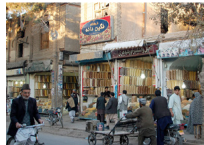
Spice market in Herat

There are various shopping options in Afghan cities, including a handful of shopping malls such as the Roshan Shopping Center, Majid Mall, and Park Mall, all in Kabul. Traditionally, shopping is done at bazaars (open-air markets). Pul-e Khishti Bazaar is Kabul's main bazaar; Kocha-e Murgha (Chicken Street) is popular for its tourist fare of carpets, carvings, knives, and antiques. 356