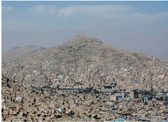
Kabul's urban sprawl, home to nearly 5 million people

populations live in informal—or unplanned—settlements in or around the major cities of Kabul, Herat, Mazar-e Sharif, Jalalabad, and Kandahar. 297