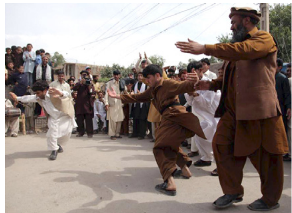
Afghan men dancing at a wedding in downtown Jalalabad, Nangarhar Province

Wedding celebrations are full of color and as lavish as budgets permit. Guests often bring their entire families. In villages, it is necessary to invite everyone or risk losing face in the community. Weddings reflect the specific characteristics of different Dari-speaking groups. For example, Tajik and Uzbek women wear embroidered dresses with distinctive designs. In the case of Uzbeks, the dress is made by members of the groom’s family and typically has a noticeable human-face pattern in the center. 279