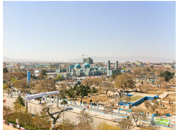
Blue Mosque, Mazar-e Sharif, Balkh Province

Mazar-e Sharif, which means “tomb of the saint,” is revered by Shi’a Muslims as the burial site of the Prophet Muhammad’s cousin, Ali ibn Abi Talab, who established the Shi’a branch of Islam. Whether his remains are housed in the shrine is a matter of dispute, but the site is a significant draw for Shi’a Muslims. 48 The shrine, also known as the Blue Mosque, draws hundreds of pilgrims annually to commemorate Ashura. 49, 50 Shi’a Muslims are often the target of violent sectarian extremists during this time. 51