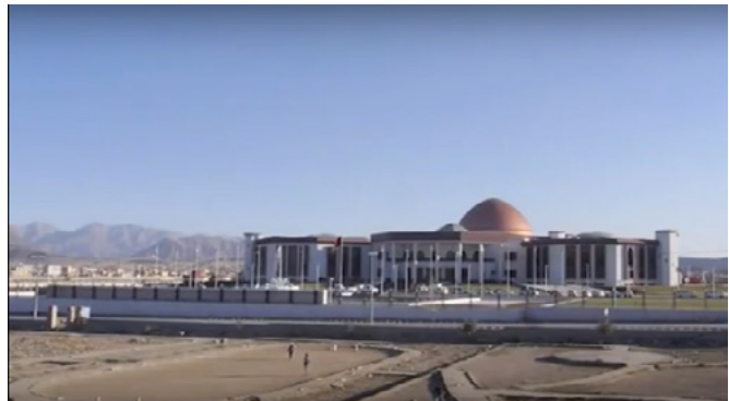
Parliament building in Kabul

Centralized Afghan governments, however, have historically lacked a strong influence outside the capital due to the long-standing tradition of local tribal rule. This pattern largely persists today; the government’s powers remain limited, and local tribal leaders and warlords continue to control many regions of the country. Additionally, the Loya Jirga, a constitutional assembly of thousands of representatives from ethnic, religious, and tribal groups around Afghanistan, wields tremendous influence. It is convened for important matters relating to heads of state, the constitution, and national or regional conflicts, and it may ultimately ratify, or end, the current power-sharing presidential structure. 102