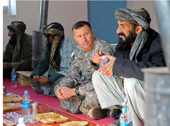
Lunch, Zabul Province, southern Afghanistan

When entering an Afghan home for a meal, it is customary to remove one’s shoes. Meals in Afghan homes are usually served on a cloth or rug on the ground, and cushions may be provided for seating. The hosts will typically direct the guest where to sit, and guests should wait for them to do so. Guests should sit cross-legged and take care not to show the soles of their feet or point them at others, which is considered offensive. 276 Before the meal, it is customary to wash one’s hands.