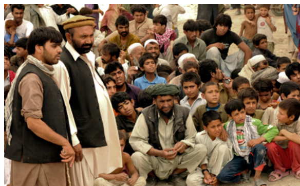
Refugees in Kabul awaiting donations of food, clothes, and supplies from members of the International Security Assistance Force

Afghanistan has experienced a steady stream of returnees since 2002, when roughly 2 million Afghans returned home from Pakistan and Iran after the fall of the Taliban. Many fled during Soviet occupation 20 years earlier. Nearly half the internationally displaced people (IDP) have settled in and around Afghanistan's largest cities. While 90% of the refugees returning from Pakistan settled in the eastern province of Nangarhar, many