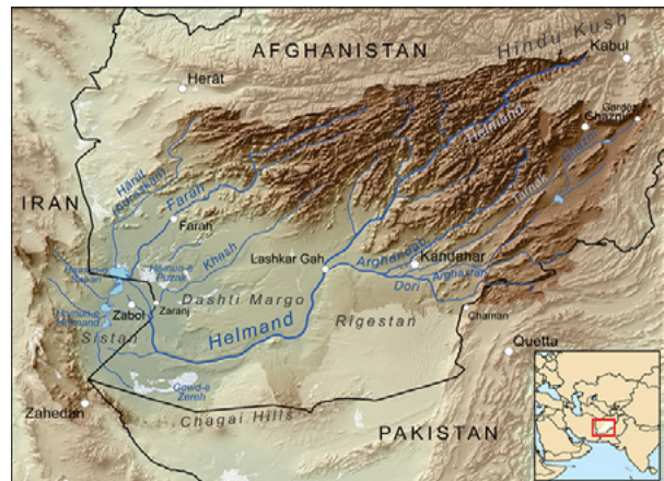
Map of the Hindu Kush mountains, the source of 80% Afghan river water; and the Helmand River drainage basin

Mountains dominate the landscape of Afghanistan, sweeping through the center of the country in a northeast, southwest direction. The 38 summits of the Hindu Kush Range, considered an extension of the Himalayas, rise more than 7,000 m (22,965 ft). 15 The highest is Noshaq Peak, at 7,485 m (24,577 ft). 16 Over 49% of the country's land area lies 2,000 m (6,561 ft) above sea level.