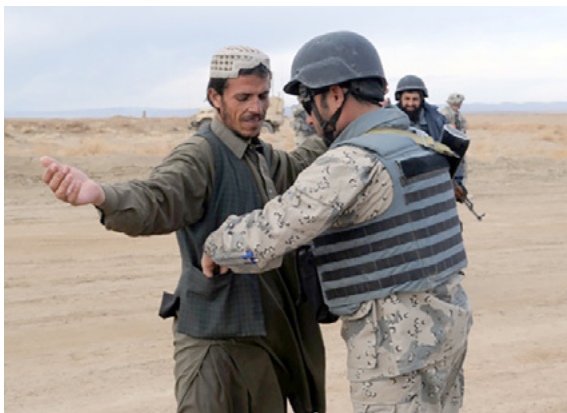
Afghan Border Police searching an individual at a checkpoint near Waza Khwa, Paktika Province

Roadblocks and checkpoints controlled by the Afghan National Defense and Security Forces and random insurgent checkpoints are common throughout Afghanistan; Afghans who travel are familiar with them. 447