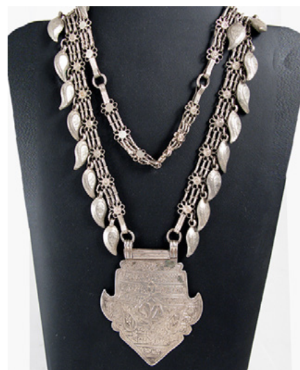
Silver tribal Afghan necklace with etched pendant and mango-shaped amulets

In rural areas, Afghans blend Muslim beliefs with superstitions that predate Islam. Women and children often wear tawiz amulets (protective charms); cowives may wear wolf claws to promote harmony. 485 Some