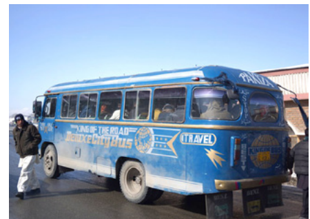
Government-operated Milli bus

Milli buses are the glue that holds Afghanistan together. You can find these government-run buses at transport depots, along with shared taxis. Milli buses don't have a fixed departure time; they leave as soon as they have collected enough passengers. Milli buses also have a per-seat fare, but there are usually more passengers than seats. They are cheaper than any other form of transportation. 353