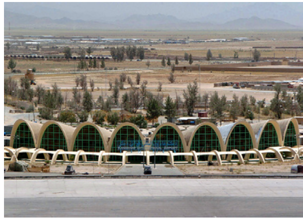
Kandahar International Airport, the country’s second main international airport, used for both military and civilian flights

Located in southeastern Afghanistan, Kandahar lies alongside the Tarnak River on a high desert plain between the foothills of the Central Highlands and the deserts of the Southern Plateau. The city is surrounded by fertile, irrigated farmland, with important regional fruit crops, such as grapes and pomegranates; the entire province of Kandahar is also Afghanistan’s third-largest producer of opium. 38 With a population of approximately 400,000 people, Kandahar is the second-largest city in Afghanistan. 39 Historically, its strategic location on critical trade routes made Kandahar prone to frequent invasion. The city served as Afghanistan’s first capital after Ahmad Shah Durrani unified the tribal nation in the 18th century. His mausoleum is in the city, as is the Khirqah Shrine, which is believed to house the cloak of the Prophet Muhammad. 40 As a main center for Pashtun peoples, the city is home to the Kandahari dialect of Pashto, the soft-voice form of the language. 41