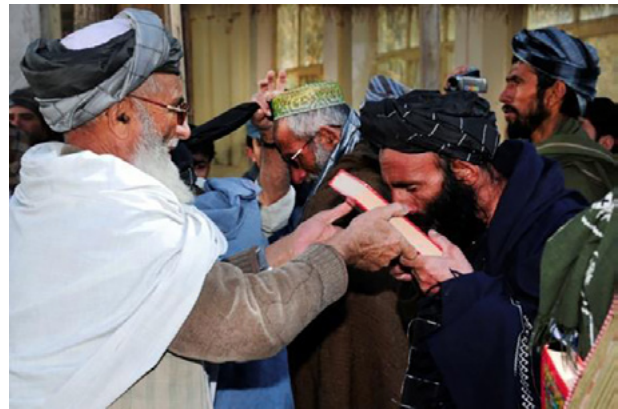
Kissing the Holy Quran, a sign of respect—though not universal among Muslims

The printed Arabic Quran is regarded as holy, and desecrating a copy is a serious offense. 225 As such, Islam’s holy book should be treated with respect. Do not touch the Quran with dirty hands. Keep the Quran off the floor—if you are sitting on the floor, hold the Quran above your lap or waist. When not in use, protect the Quran with a dustcover and do not place anything on top of it. Muslims keep Quranic texts on the highest shelf of a bookcase. Finally, keep Qurans out of latrines. Old or damaged copies can be properly disposed of in one of two ways. Burning is acceptable as long as the process is conducted with respect. Texts should not be burned with trash or other items. The second method of disposal is burial. Before burying the text, it should be wrapped in something pure and then buried where people do not walk. 226, 227, 228 Other texts sacred to Muslims include the Hadith , a collection of the sayings of Muhammad, and the Sunnah , which describes the practices of Islam by way of Muhammad’s example.