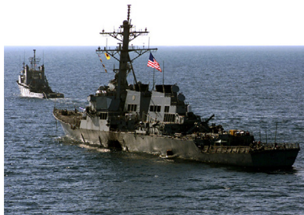
A damaged USS Cole in 2000, after the bombing organized by Osama bin Laden out of his al-Qaeda headquarters in Afghanistan

Osama bin Laden, a source of support for the Taliban, used Afghanistan as a headquarters for his al-Qaeda movement. During this time, he organized attacks on American targets all over the world, including the destruction of U.S. embassies in East Africa and the attack on the USS Cole in Yemen. U.S. efforts prompting the Taliban government to hand over bin Laden were unsuccessful. Moreover, it was unclear if bin Laden's activities could be effectively hampered by targeting his supporters in other