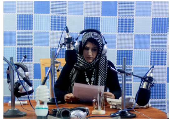
Broadcaster in the sound room, radio station Mozdah FM, Herat

In stark contrast to the days of Taliban rule when television was banned as immoral, Afghanistan has a flourishing media. In 2016, there were 83 local and national television channels, 161 radio stations, and 12 news agencies in Afghanistan. 116 Television programming consists mainly of shows and serials imported from India and other programming modeled after Western shows. But Afghans' low literacy rate (36%), coupled with the high cost of electronics, limits public access to news and basic information. Newspaper readership is low and internet access is scarce; radio is still the main source of news for most Afghans. Radio broadcasts of foreign stations in Dari and Pashto are aired from Kabul, including Deutsche Welle, BBC World Service, Voice of America, and Radio France Internationale.