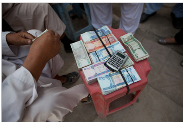
Money changing in a bazaar, Daykundi Province

The main currency of Afghanistan is the Afghani (AFN). In early 2017, the AFN averaged USD 1 to AFN 67. 359 Most of the Afghan economy operates on a cash-only basis, though the use of credit cards has become more common in larger cities. ATMs that accept international cards are scattered around Kabul, and most dispense Afghanis and U.S. dollars. But access to banking facilities is limited and unreliable, and ATMs are also not dependable, so it is a good idea to keep