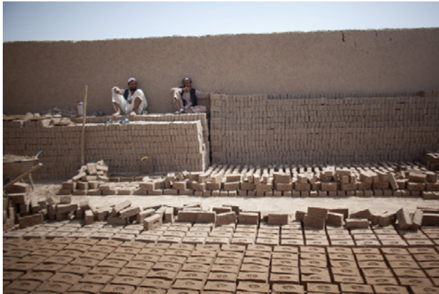
Brick makers, with bricks drying in the sun, in Daykundi Province

Industrial production of any significant size in Afghanistan is limited, as much of its infrastructure remains crippled by war. 141 But services and small-scale industry, such as brick and textile production, account for the bulk of Afghan GDP. 142 Major industrial exports include scrap iron and coal. Afghanistan is also extremely rich in natural resources, including fossil fuels and an estimated $1 trillion in mineral resources, but the deposits remain