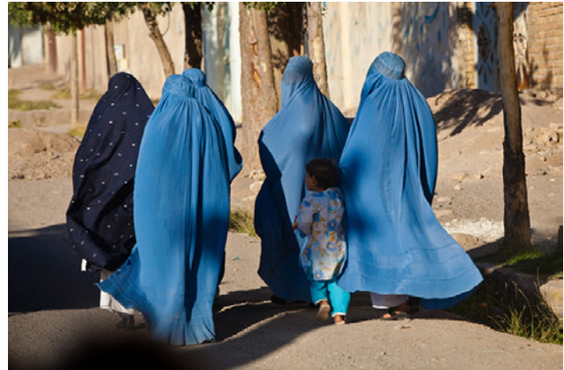
Women and child, Herat

The respective roles of Afghan men and women vary according to their social and financial background, location, and age. A factor in determining gender roles is the extent to which the sexes are segregated, and this varies from area to area. Rural women are typically restricted to their own spaces and daily tasks; they are responsible for raising children, collecting water, cooking, and helping care for animals. Though often hidden from view and subordinate to