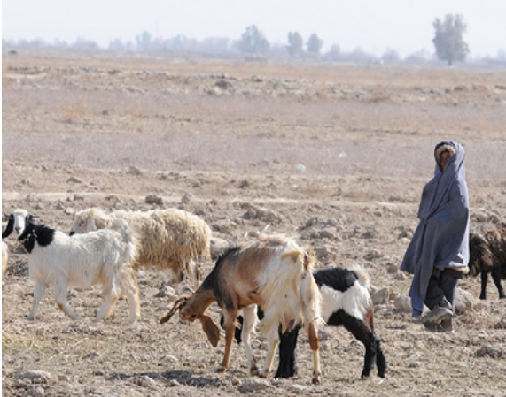
An Afghan girl with a herd of goats on her family’s farm in Dand District, just outside Kandahar City

Afghanistan lacks a clear and consistent national policy for registering and validating land ownership claims. This is due in great part to the population’s historical reliance on informal customs and local legal systems. Furthermore, a history of unjust land distribution policies—many of which benefited the Pashtun majority—also complicates matters. 383 Property disputes are a common cause of conflict within or between families, villages, and tribes. Such conflicts often stoked ethnic or tribal tensions, leading to violent clashes.