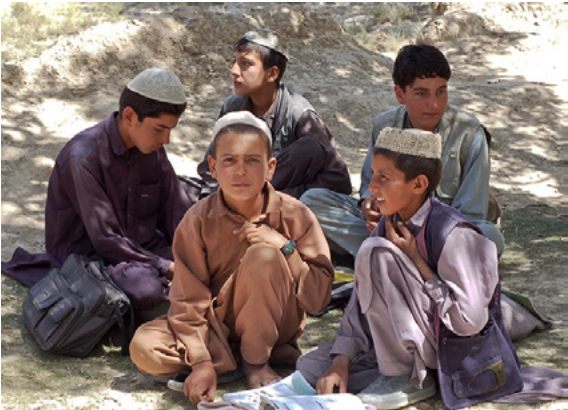
Students sit in the boys’ section of an outdoor school in Bamozai, near Gardez, Paktya Province

Like the nation’s health services, Afghanistan’s education system suffered greatly from prolonged conflict and the fundamentalist policies of the Taliban. For years, girls were prohibited from attending schools, female teachers were not allowed to work, and many educational institutions were closed. During this time, madrassas, Islamic schools that base their curriculum on study of the Quran, became prominent. Before madrassas, students were educated in a village hujra , or community room.