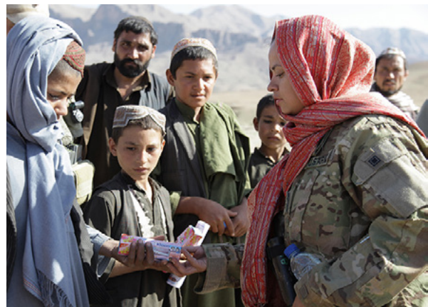
The headscarf or shawl ( chader ), covering the hair and, when necessary, the face

Foreigners should respect the Afghan tradition of conservative attire. Male visitors should not to wear shorts in public or take their shirts off, regardless of the temperature. T-shirts with graphics or text that could be offensive should also be avoided. It is advisable for women to carry a scarf to cover her hair or face in certain situations. Women should also avoid wearing tight-fitting clothing such as leggings, short skirts, short-sleeved shirts, and tight-fitting or low-cut blouses in public.