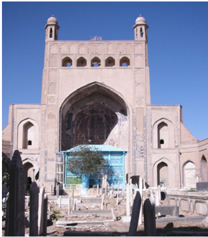
Khwaja 'Abd Allah Ansari shrine, the tomb of Sufi poet Abdullāh Ansari, in Herat

Sufism is a mystical form of Islam. Sufis pursue truth as a path toward a direct, personal connection with Allah. Sufi practices include ritual prayer, meditation, and various ascetic or ecstatic activities. The central figure is the pir , or spiritual leader. Pirs are thought to possess a special charismatic power, known as karamat , as well as the ability to bestow blessings, or barakat . Pirs act as mentors and spiritual guides to groups of students who form brotherhoods around their teachings. The Qadiriya order is a popular brotherhood among Pashtun tribes. Its leadership is hereditary rather than appointed, and pirs are chosen from those who can trace their lineage to the order's founder, Abdul-Qadir Gilani. The Qadiriya believe Gilani was a direct descendant of the Prophet Muhammad. 218