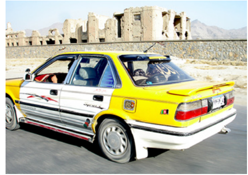
Afghan taxi, Kabul

One of the most common forms of public transportation in Afghanistan is shared taxis. Service within the limits of larger Afghan cities is cheap and easy to find, but traveling between cities can be expensive. Shared taxis do not have set rates or meters, so it is best to negotiate price before getting into a cab. Fares usually depend on the distance covered, but the cost is negotiable. Some shared taxi companies hire English-speaking drivers and mainly service the airport-downtown