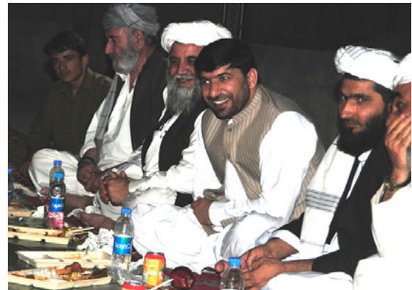
A traditional iftar dinner breaking the daily fast during the Islamic holy month of Ramadan

Large meals are typically served after sunset to offset the rigorous demands of the daytime fast, which may affect some more than others. People may become more irritable or fatigued during Ramadan. Foreigners should be aware of this and be prepared to show patience. In general, the pace of everyday life slows considerably during the holy month. It is also important for foreigners to avoid causing embarrassment during Ramadan. They should not smoke, eat, drink, or chew gum in public during daylight hours.