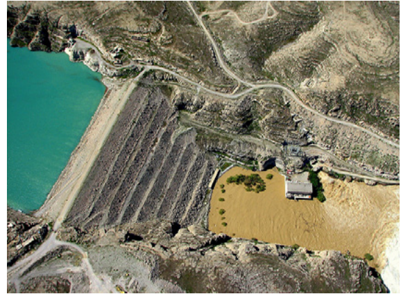
Kajaki Dam powerstation, on the Helmand River, southern Afghanistan

Afghanistan has one of the lowest rates of electricity usage in the world. As of 2015, only about 38% of Afghans, mostly living in urban areas, had access to electricity. Household backup generators are used to supplement the frequent periods of interruption (to ease the load on generating plants) and outages. Afghan rivers, fed by snow and glacial melt from the Hindu Kush, offer tremendous domestic hydropower potential. But many of the larger plants built in the 1950s and 1960s have fallen into disrepair. 152, 153 Existing dams generate only a quarter of the power used domestically. 154