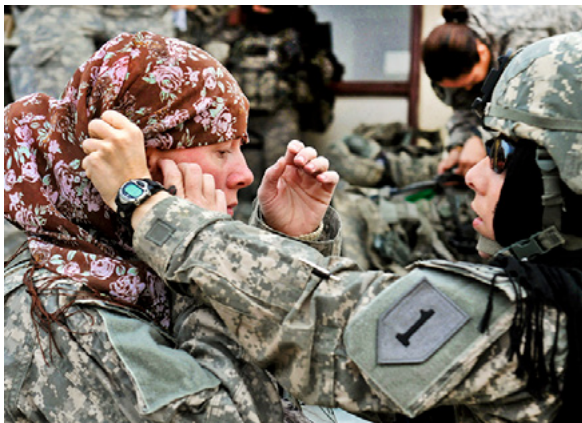
Female U.S. Army soldiers covering their hair before taking part in a shura

Following Islamic and tribal customs, traditional Afghan dress is conservative. In public, Afghan women are often completely concealed per local custom. Many wear a black or blue chadri , extensive, loose-fitting garments that cover the entire body.