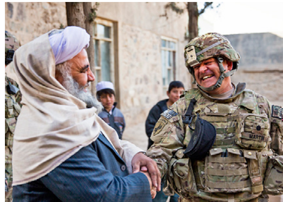
U.S. Army Lt. Colonel with with a local leader in Farah Province