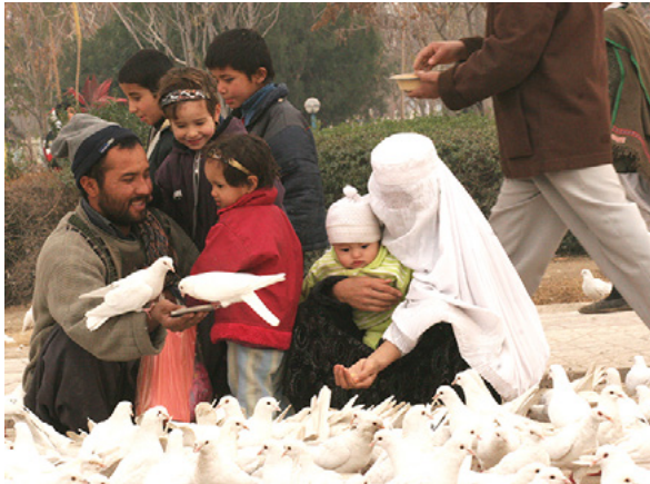
A family at the the Shrine of Imam Ali ibn Abi Talib feeding white pigeons, considered to be sacred, Mazar-e Sharif

Both boys and girls contribute to the household from a young age. In addition to performing household and agricultural chores, boys may seek paid employment outside the home (in areas where it is available). Girls typically help their female elders cook, wash, and care for younger family members. Educational opportunities vary according to a family's means and location, with priority given to sending boys to school. Often the family is faced with the difficult choice between an education for their child and keeping the