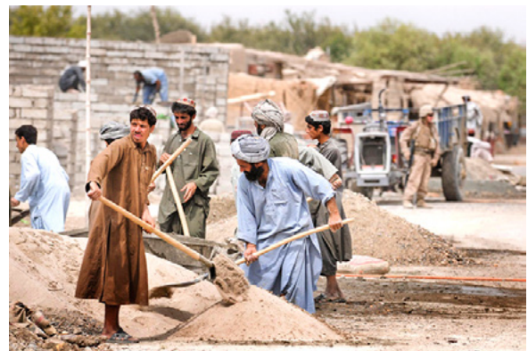
Afghans constructing new buildings which will expand the bazaar in the Nawa District of Helmand Province

Afghan cities, most notably Kabul, have experienced high-end development projects since 2001. Some observers note that most of these projects have benefited a small class of wealthy citizens and upper-level government and military officials. 311 Kabul has turned into a two-tiered city. While some Afghans have found well-paying jobs with international companies or non-governmental organizations (NGOs), most work for a dollar or two a day, and others cannot find a job at all. Unemployment among Afghanistan's urban poor is a growing concern for city governments. 312, 313, 314, 315