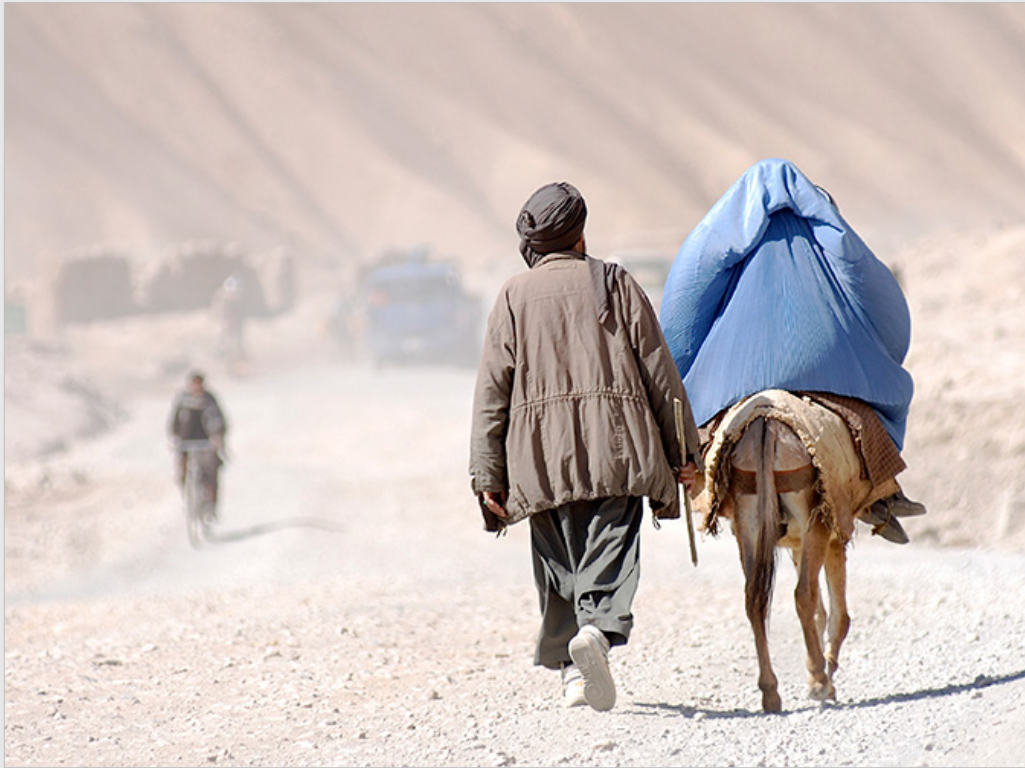
A woman in a burqa rides along a rural road, a man at her side