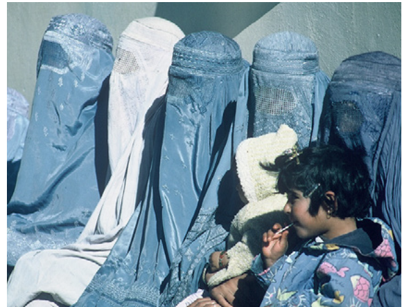
A group of women wearing burqas

In some cases, an Afghan man will have more than one wife. (Islamic law allows men to marry up to four women at the same time.) In general, a man may marry more than one woman if he is wealthy and can support them or if a man’s existing wife has not borne a son. In other instances, a man will marry a second wife of his choosing after marrying the first in an arranged marriage; a man may also marry a young woman in the hopes of producing more children. 468 According to Islamic law, the husband must treat his wives equally. 469 The practice of taking more than one wife, however, has become less common over the last 20 years.