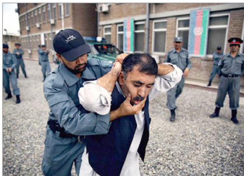
Afghan National Police officers from the Anti-Narcotics Quick Reaction Force (ANQRF) carrying out a stop and search scenario exercise intended for drug traffickers

Violent crime, such as kidnapping, car theft, highway robbery, and drug-related violence, has become more common in cities. In some cases, these acts are carried out by people posing as law enforcement or Afghan Army officers. 367 While Afghan cities are generally safer than rural areas, violence has risen since 2014, in large part due to increased insurgent activity, civil unrest, and poverty. 368 Suicide bombings and coordinated attacks against government offices, foreign embassies, and U.S. military installations are on the rise. Marketplaces are