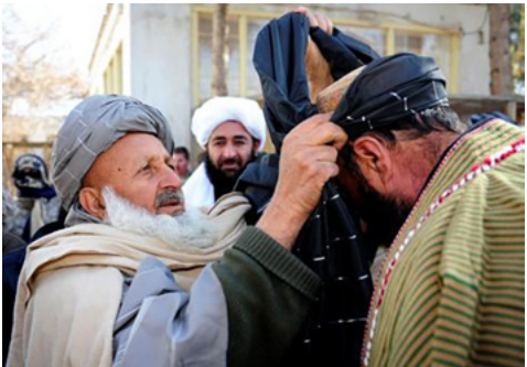
A tribal leader wrapping a turban around a former insurgent’s head as a sign of his acceptance back into society, Tarin Kot, Uruzgan Province

In the Tajik-, Uzbek-, and Turkmen-dominated rural areas of western and northern Afghanistan, small militias are prevalent and increasing in number. These local “irregular” armed groups