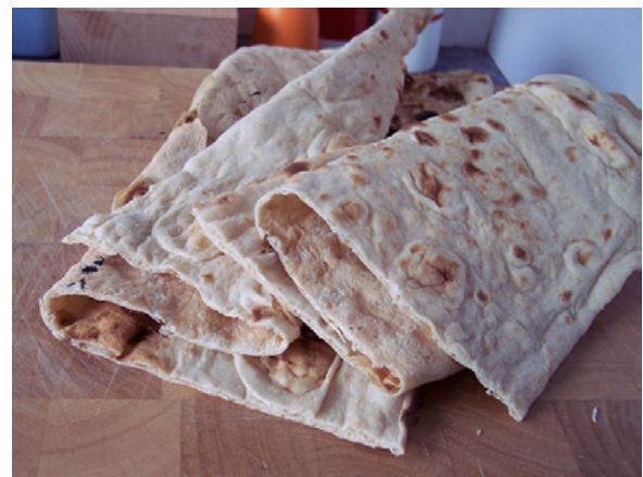
Naan-e Afghani, traditional flatbread often sprinkled with cumin, caraway, or poppy seeds

The Afghan region has been exposed to many different culinary influences throughout its history. As most Afghans are farmers and livestock herders, cereals and animal products are staples of the Afghan diet. In general, an Afghan meal usually consists of tea, naan flatbread, rice, and a main dish containing meat, such as lamb, goat, chicken, or beef. A much-loved street food is bolani (filled bread), a turnover-style flatbread filled with a variety of vegetables. 274