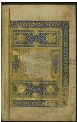
Front page of the 13th-century epic Mathnawi-Walters Art Museum

In the north, ethnic groups are fluent Dari speakers while the native tongue for those living in the south and southeast is Pashto. Although Pashto is the language of the largest ethnic group in Afghanistan, Dari, the mother tongue of the second largest ethnic group, is the lingua franca of most Afghans. It is generally necessary to speak Dari to communicate with others from different groups.