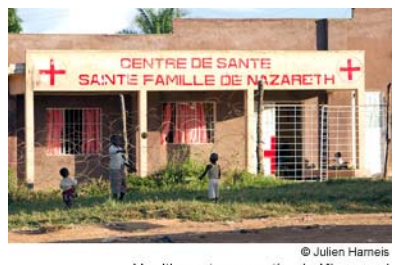
Health center reception in Kisangani

Medical services are scarce throughout the D.R.C., including the Lingala region. There are fewer hospitals, clinics, preventive services, physicians, nurses, and supplies in the countryside than in the more populated urban areas. Clinics or hospitals may not be sanitary. Often, health conditions may require evacuation to another country in order to check into a hospital and receive reliable care.<sup>272, 273</sup>