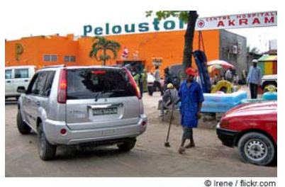
Busy street in Kinshasa

Even though it is customary to drive on the right side of the road and use international road signals in the D.R.C., driving is risky. In Kinshasa and throughout the country, roads are unimproved. In addition, driving habits are erratic, streets are overcrowded, and pedestrians clog the roadways.<sup>223</sup>