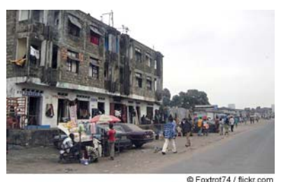
Streets of Kinshasa

Several reasons lie behind the general urban migration