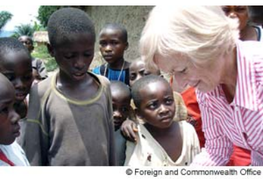
Kids greeting a visitor

When you are meeting a Congolese person for the first time, wait for an introduction to be made, if possible. If no one introduces you, it is acceptable to make your own introduction. Between men, a handshake generally will follow. It is not appropriate to shake hands with a woman until after she first extends her hand. Visitors should note that the customary handshake in the Congo region is soft, rather than firm and energetic as would be expected in a