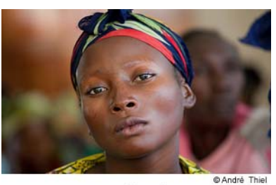
Congolese woman from Kivu

meals, and caring for the welfare of family members. The role that men hold is important but narrower. It consists mainly of hunting and also clearing the forest so that the family can farm and cultivate crops.<sup>304,305, 306</sup> Above all, men serve as family decision-makers, a role not available to a woman unless her husband has died or can no longer support his family.