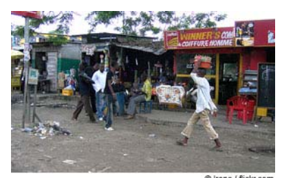
Streets of Kinshasa

Because of deteriorating economic conditions, street crime is common in Kinshasa. It is relatively safe to travel through some parts of the city during the daytime, but not at night. The U.S. embassy advises people to roll up their windows before driving and keep their doors locked. Members of street gangs may pose as police officers in order to rob people. In general, to avoid becoming a victim of crime—from petty burglary or