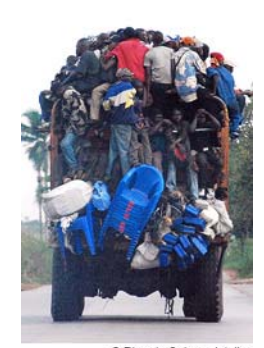
© Ricardo Cabrera letelier Transportation to Matadi

Public transportation such as bus or taxi service mostly serve urban areas. All public transportation, both urban and rural, is considered unreliable and unsafe. This includes airline and rail transportation.<sup>269</sup>