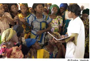
Doctor talking to villagers from Bukavu

Traditionally, most Lingala speakers have not learned the language as their primary, or first, language.<sup>103</sup> Within the Lingala linguistic region, there are numerous primary languages that are spoken. Most of these fall within the Bantu language family (of which Lingala is also a member) or the Adamwa-Ubangi family. Among the most prevalent of the Bantu languages are Mongo-Nkundu, Teke, and Ngando. The latter two are spoken across a large portion of the central Congo Basin, while