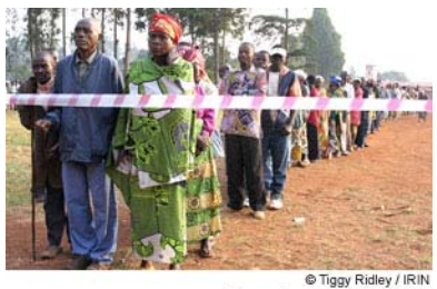
Congolese waiting to vote

Each province has an elected provincial assembly, in which the members elect candidates to serve in the national assembly. Provincial representatives are typically in charge of political and administrative functions for their region. At the same time, elections often involve bribery and pressure from organizations (such as militia or police) outside the officially elected government. They may exert force when necessary to