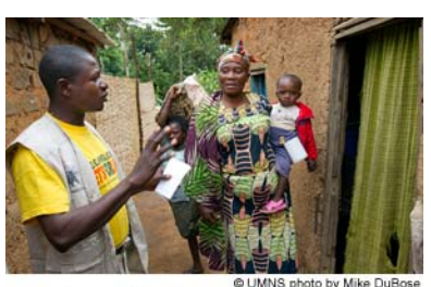
Home in Bongonga community of Lubumbashi

The Family Code law (which came into effect in 1987 during the Mobutu regime) limits a woman's authority by allowing a husband to own the property that belongs to his wife. This is true even if the husband is absent from the home. The Code legitimizes polygamy and exempts husbands from the responsibility of providing support for their wives and children.<sup>312</sup>