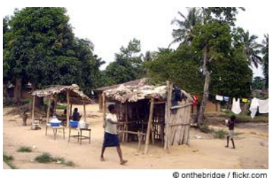
Road in Kisangani

Property distribution in the D.R.C. was based on ancestral rights to occupy the land, but this changed radically during the Mobutu regime. In 1973, the Mobutu government passed the Bakajika land law, thus overturning people's traditional rights to their ancestral lands. Although the Belgian colonial government that preceded Mobutu could appropriate and sell vacant land, it lacked authority to take over land that was already