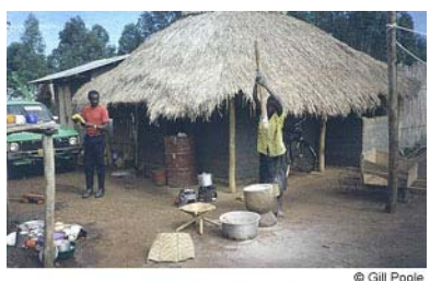
Rural home in eastern Congo

Many people who live in the forest may be evicted from their lands or be subject to the illegal logging of their forests, which they depend upon for resources. They end up with no way to obtain food, medicine, or shelter. In general, workers must devote long hours to farming and agricultural jobs simply to survive. They receive little in return beyond basic sustenance.