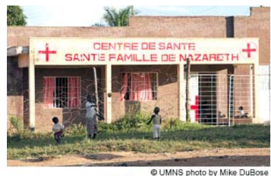
Public health center in Lubumbashi

Hospitals in Kinshasa are better than those in other cities or in rural areas of the D.R.C. because better equipment and sanitation procedures are available to them. Still, even in hospitals in Kinshasa, the care is unreliable due to a lack of adherence to international regulations. It is not, for instance, advisable to get a blood transfusion