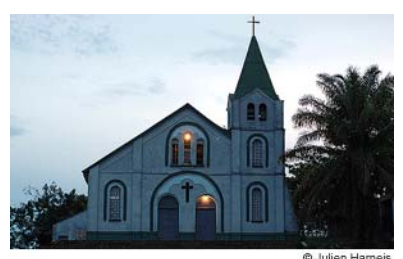
Kindu church at dusk

Most of the churches in the D.R.C. are found in the cities. The Church of Christ Evangelical community reports that out of its 87 country-wide congregations, 30 are located in Kinshasa. It also has a large and active presence in rural areas.<sup>141, 142</sup> The Church of Christ in the Congo, Presbyterian Community, has a total of 186 congregations throughout the D.R.C.<sup>143</sup> Mission churches of various other denominations are also sprinkled