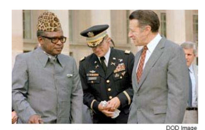
President Mobutu with the Secretary of Defense

In November 1965, General Joseph Mobutu—who had played an instrumental role in the 1960 coup deposing Lumumba—headed another coup that resulted in his becoming the nation's president.<sup>64</sup> Soon thereafter, Leopoldville, the capital of the Republic of the Congo, was given the new African name of Kinshasa. Mobutu, who would rule for over 30 years, also would later rename the nation as the Republic of Zaire and call