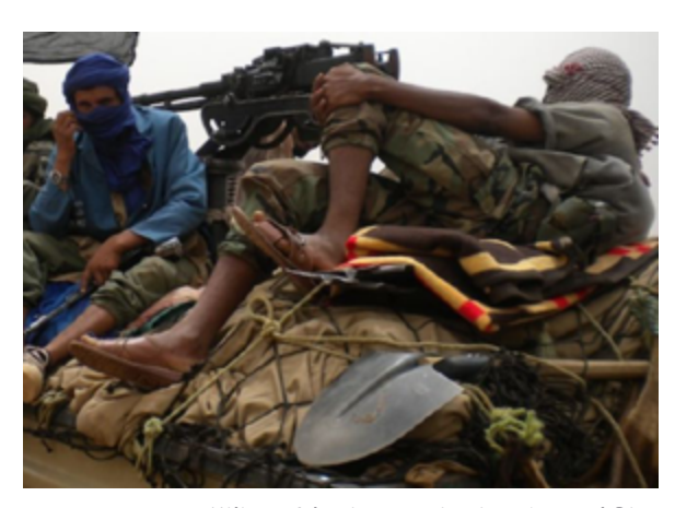
Militant Islamist organization, Ansar al-Dine

Even though a peace agreement was signed between the Malian government and the Tuareg rebels in 2015, terrorist organizations such as Ansar al-Dine and al-Qaida in the Islamic Maghreb (AQIM) were not part of the agreement and continue to operate in Northern Mali.<sup>27</sup> As a consequence, extremist organizations based in Northern Mali impose harsh punishments on the local population and have the ability to carry out attacks on targets throughout the country. Prominent incidents have inflicted casualties