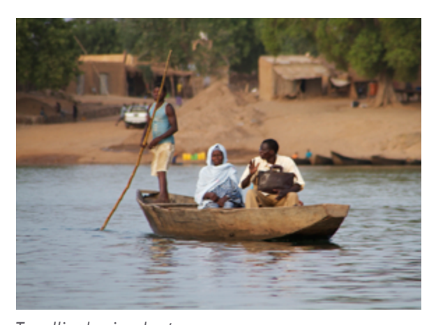
Travelling by river boat

Most Malians outside Bamako do not own cars or motorbikes. In southern Mali, people tend to travel by river boat; camels are typically used in the north. The nation has a colonial-era railroad, as well as airports and roads built and maintained with foreign funds and expertise. Government-operated buses are the most common form of transportation, providing service from Bamako to other major towns. Due to security concerns, buses travel in convoys with police and military protection.<sup>40</sup>