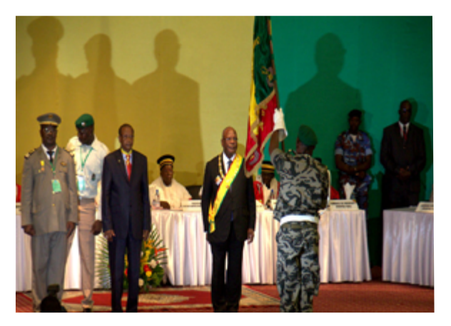
Inauguration ceremony of the President of the Republic of Mali

Mali is a semi-presidential republic with three branches of government: an executive branch, a legislative branch, and a judicial branch. <sup>55</sup> The executive branch consists of an elected president, who is the head of state and commander-in-chief of the armed forces; the president appoints a prime minister, who in turn appoints the cabinet. Presidential elections are held every five years. The legislative branch consists of the 147 elected members of the unicameral National Assembly; members