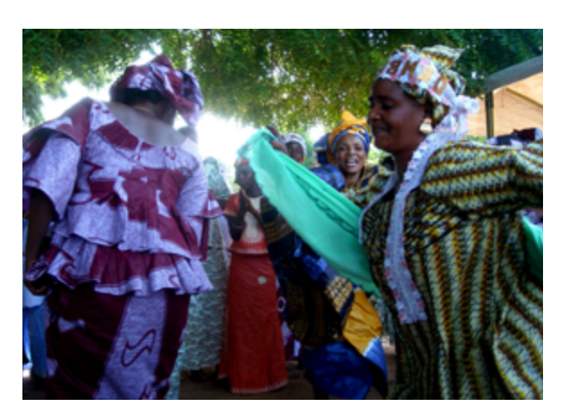
Malian wedding ceremony

The Malian government recognizes both religious and civil marriages. Religious wedding traditions vary widely across the country, by region and ethnicity, and are more common in rural areas. Religious weddings are presided over by a local religious leader, and a religious marriage has the same legal rights and protections as a civil marriage. Recordkeeping and documentation of religious marriages aren't as stringent as civil marriages, especially in rural areas. A local government official