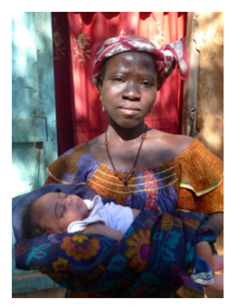
Mother and her infant

The celebration of a child's birth varies by ethnicity, religion, and region. Typically, women will not publically announce their pregnancy for the first few months. Many women give birth at home and do not receive prenatal care due to a lack of medical facilities, especially in rural areas. Many delay medical treatment until there is an obvious emergency.41 Mali has the second highest infant mortality rate in the world-100 out of 1000 infants die before they reach their first birthday and 1 in 26 women die from pregnancy complications. 42 The high cost of medical treatment, lack of transportation to specialized care, and shortages of blood products and medication make childbirth especially dangerous. Only half of the population lives within 5 km of a medical treatment facility, and not all of those