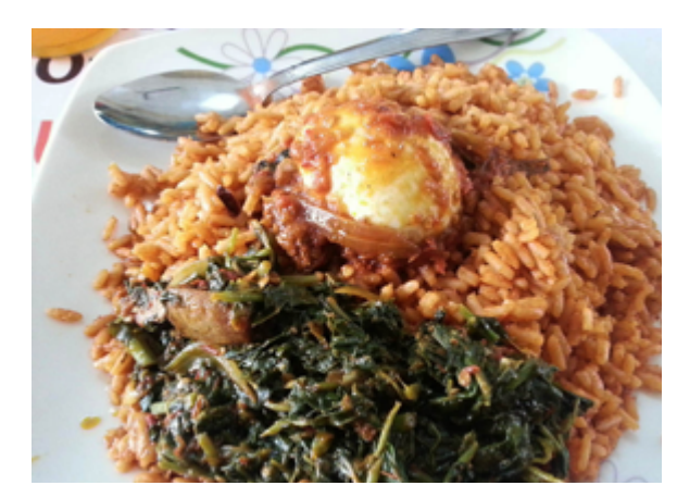
Zamè, red rice served with egg and vegetable

For dinner guests, the host might prepare zamè, which is cooked red rice served with beef and vegetables. Another popular dish to serve guests is juka, which is a brown, couscous-like grain that is grilled with peanut powder. Juka is typically served with an onion, eggplant, and beef soup. Drinks include teas such as hibiscus or lemon grass and watered fruit juices such as guava or tamarind. In Bamako and other city settings, a wider variety of dishes are common, including fried fast foods, such