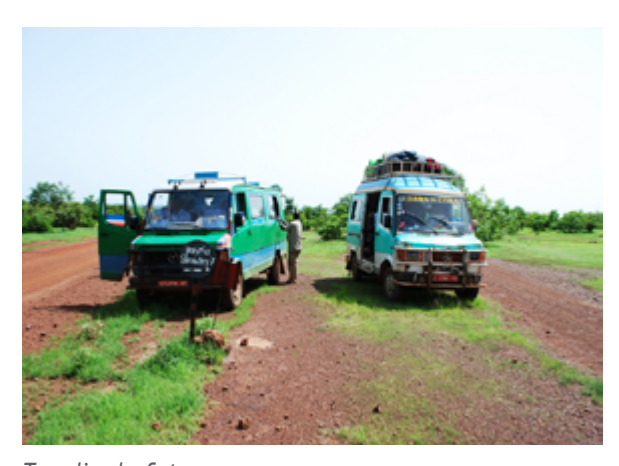
Traveling by Sotrama

Buses that link major cities are available, as well as more affordable pickup trucks and van-taxis called sotrama. The US Department of State has warned US citizens to avoid using all public transportation, including sotramas, and to refrain from driving motorbikes. If a taxi is hired, it is best to negotiate a rate ahead of time and give the driver very specific directions to the destination.<sup>27, 28, 29</sup>