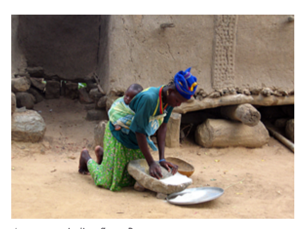
A woman grinding flour, Dogon

Cooked grains—traditionally millet, corn, sorghum, and more recently rice—are staples of the Malian diet. Fonio, a type of grain, is used to prepare couscous, porridge, cakes, bread, or a doughy pancake.<sup>21</sup> Typically, this is served with a sauce made from plants, such as leaves, onions, or okra, or with a protein such as peanuts or fish that is dried, then smoked or fermented. Tigadegena (peanut butter sauce) is also a popular accompaniment.<sup>22</sup> Vegetables and fruits include squash,