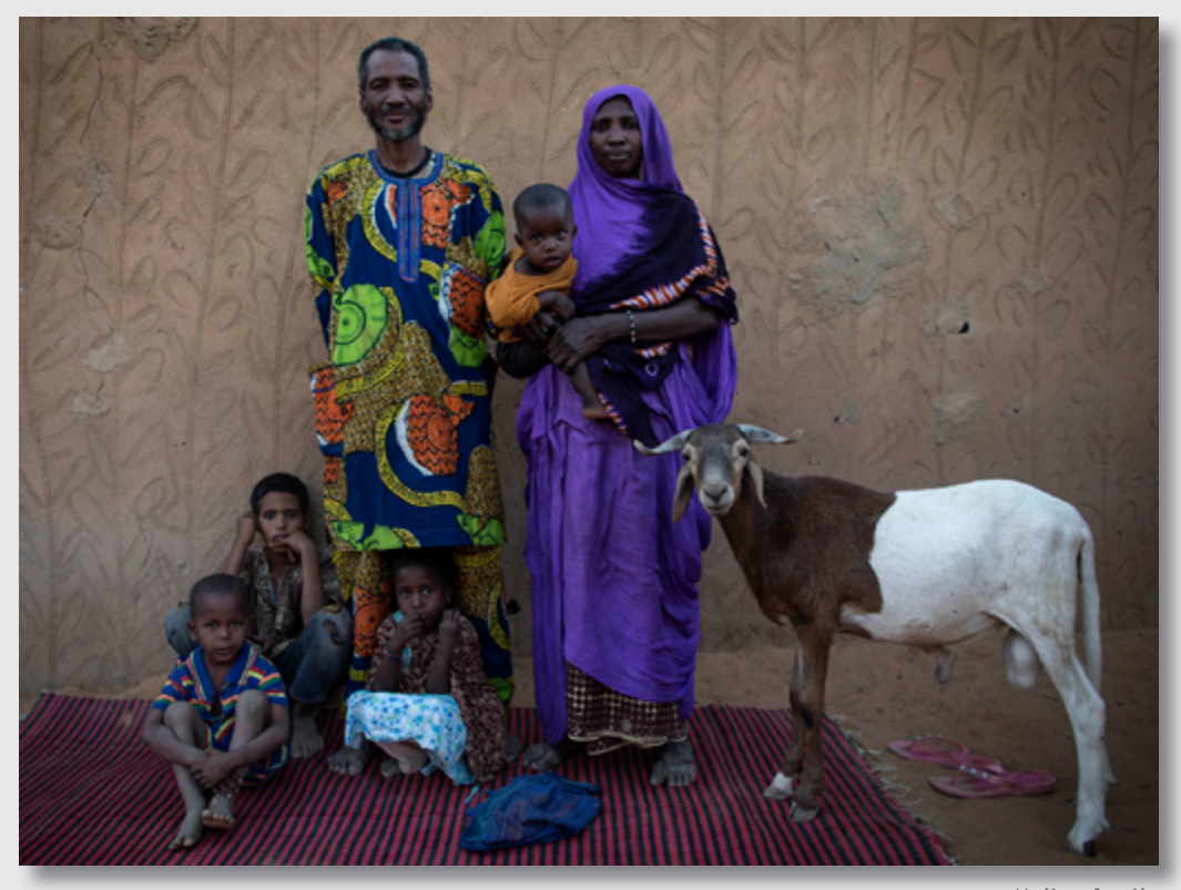
Malian family