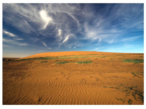
Malian Sahara

The Sahara in northeastern Mali includes the shifting sand dunes of Erg Chech, the salt deposits of Taoudenni, and the rocky plains of the Tanezrouft reg.<sup>12, 13</sup> To the east and north is the Iforas Massif with an elevation of about 600 meters (2,000 feet); the eroded sandstone plateau extends from the Ahaggar (Hoggar) Mountains of the central Sahara (a massif is a large mountain mass or a group of connected mountains).<sup>14, 15</sup>