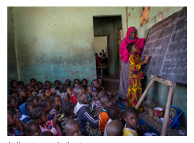
Malian students in the class

Educational opportunities remain a challenge in rural Mali where only an estimated 38.7% of the population is literate.<sup>38</sup> Underlying factors include living conditions related to extreme poverty, the high cost of education, distance from home to rural schools, the reliance on child labor during the agricultural season, and negative perceptions about the value of education. Unfortunately, access to primary and secondary education for young girls in many rural Malian communities is restricted due to social, cultural, and