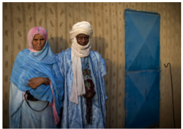
An elderly couple

their future economic situation. 20, 21, 22