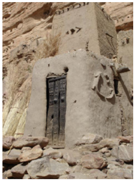
Crocodile Totem worshipped by Binou sect in Dogon society

Though the traditional religions of Mali have no formality, most of them profess a belief in a spiritual being or power that animates the universe and all things on the earth. Many beliefs are passed down through oral traditions, which are central to the culture of its adherents. Special spiritual abilities accrue to certain social identities, such as storytellers, healers, or religious leaders. Deceased ancestors and spirits can play a critical role in religion, as well as the connection between violating social norms and misfortune. Traditional religions are practiced throughout Mali but are most prominent in rural areas. Many Christian and Muslim believers integrate aspects of traditional religions in their religious beliefs and ceremonies. <sup>20</sup>