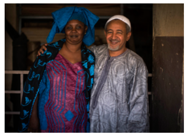
A happy Malian couple

Most Malian ethnic groups are patrilocal, meaning women live with their husbands' families after marriage. During the first years of marriage, a low standing within their new households makes life difficult for women. Daughters usually live with their parents until marriage. Some young women live with relatives or work in wealthy households as domestic employees until they find a spouse.<sup>30, 31</sup>