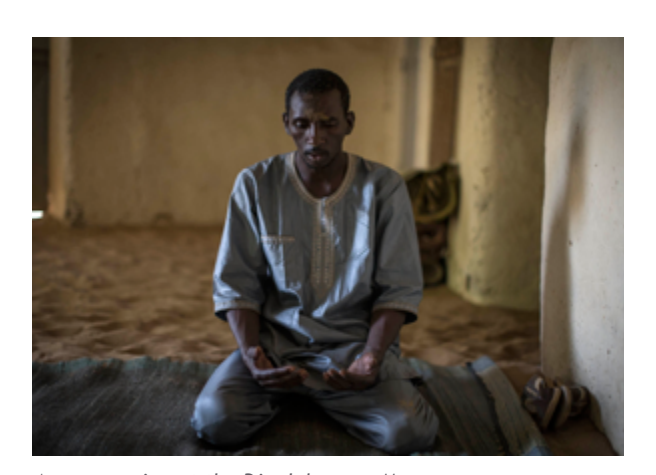
A man praying at the Djoulabougou Mosque

Religion strongly influences the daily lives of Malians. Predominantly Sunni Muslim, mosques are the center of social and cultural life. Many Muslims continue to incorporate traditional beliefs and practices of ancestor worship in their practice of Islam. The majority of Malians commonly attend religious ceremonies outside their own religion, especially baptisms, weddings, and funerals.<sup>31</sup> The Malian people interact cross-culturally every day, and the Muslim majority are tolerant of and respectful toward religious minorities.<sup>32, 33</sup>