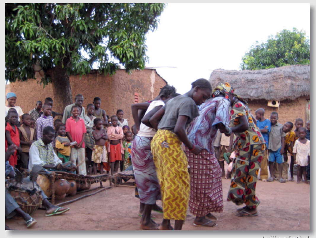
A village festival