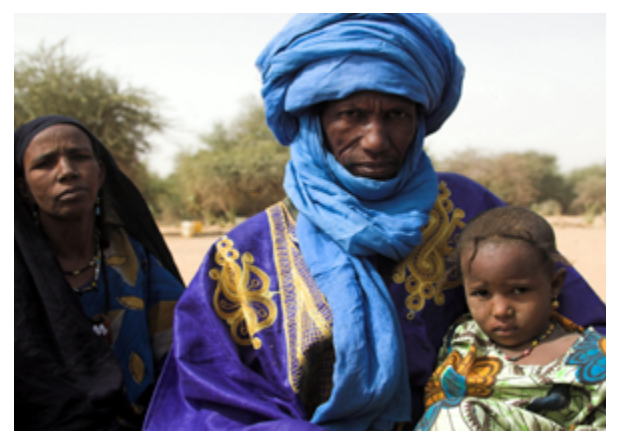
Malian family dressed for Eid ul-Adha

Tabaski, also known as Eid al-Adha, commemorates the willingness of Ibrahim to sacrifice his son Ishmael to Allah. Tabaski is one of the most important religious holidays in Mali and takes place over the course of two days. Fathers slaughter a sheep and buy new clothing and shoes for their wives and children. Portions of the slaughtered sheep are shared with neighbors and those who are unable to afford a sheep.<sup>40</sup>