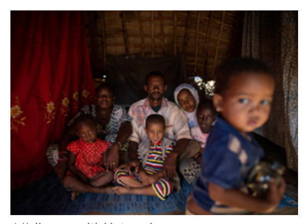
A Malian man with his two wives

Under Malian law, a man is permitted to marry up to four wives, but his first wife must consent before he marries any additional wives. A man must be able to provide for any additional wives and all of his children. Marrying an additional wife has been a major cause of divorce in Bamako. Wives typically share food preparation and other chores, but some men often maintain separate households for their wives. High-income urban families often employ live-in domestic workers. Working