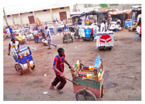
Street vendors

Travelers can find a variety of fruits and vegetables in Mali's open-air markets.<sup>33</sup> Street vendors also sell fruits and vegetables door-to-door, but quality and price depend on the season.<sup>34</sup> Many fruits and vegetables, like peanuts, are available year-round; others are seasonal. Almonds, hazelnuts, and pistachios are usually only sold in stores and are more expensive.<sup>35</sup>