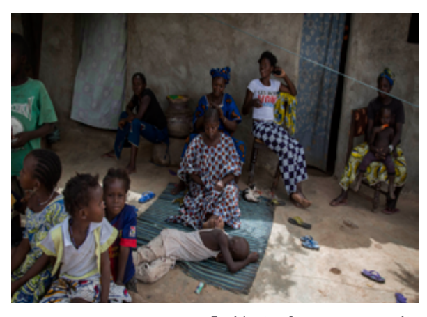
Residents of a poor community

Mali is one of the poorest countries in the world. Approximately 50.4% of the population lives below the poverty line. 59 While the poor in wealthy countries often have government-provided safety nets, most Malians must depend completely on informal social networks when they need economic assistance. Malians help one another survive through a traditional gift economy called dama. In dama, giving stems from maaya, "being human." A person gives help without expecting anything specific in return, and a gift helps not only the recipient but also the community. 60, 61