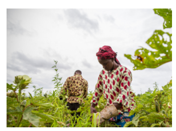
Farmers harvesting okra in the village of Loulouni

Several factors have led to this situation. The conflict in northern Mali led an estimated 475,000 Malians to flee to southern cities and surrounding countries.<sup>8</sup> As of 2014, 61,627 people had not found a permanent solution to their displacement.<sup>9</sup> Drought and population growth have amplified the issue of food insecurity.<sup>10</sup> Another factor centers on the perceived economic opportunities in Mali's cities; Malians aged 15-39 typically migrate to find work. Once employment is obtained, remittances help support rural families and local economies.<sup>11</sup>