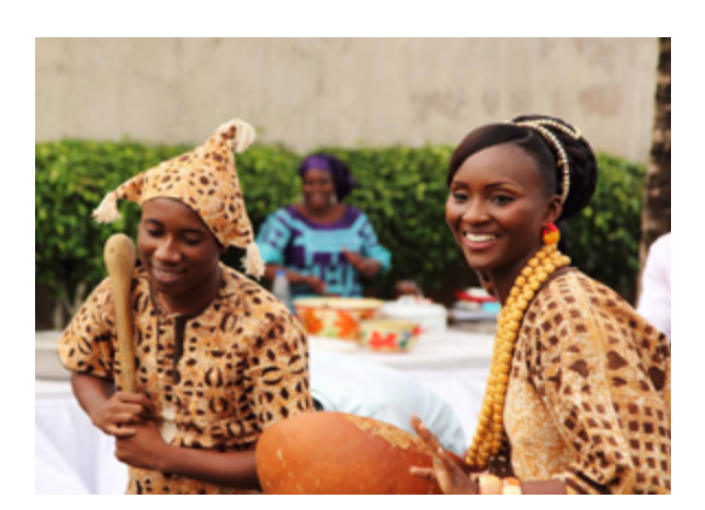
Senufu People

The Senufo constitute about 10.5% of the population and include the Mamara Senufo-speaking Minyanka and the Bomu. They live mostly along the border with Burkina Faso and Côte d'Ivoire where their ancestors ruled the historical kingdom of Kenedóugóu. They are farmers and retain strong traditional religious beliefs. 73, 74, 75