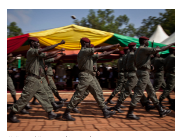
Malian soldiers marching at the ceremony for the Independence Anniversary, Bamako

Independence Day celebrations take place in the capital, Bamako, along the Boulevard of Independence. The festivities are broadcast on television and include a military parade. In villages across Mali, people watch parades, visit cultural exhibits, and listen to traditional music in public spaces. Cultural exhibits compete for prizes. Young people collect money to pay for parties held the night before Independence Day. Such parties include music, dancing, eating, and staying up all night.39