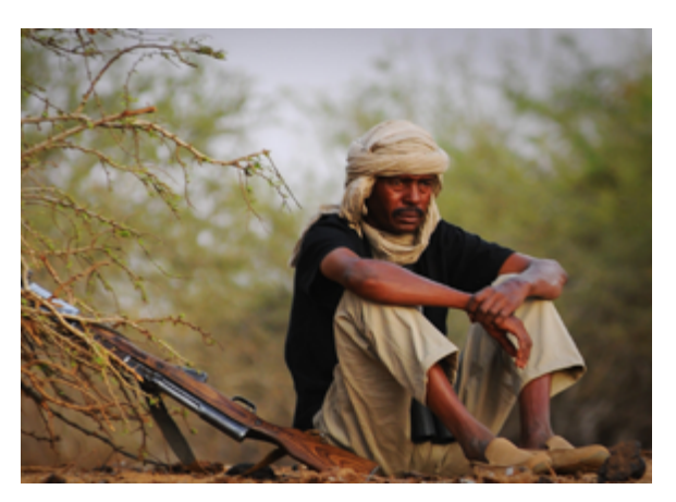
Carrying a gun

Much of the street crime prevalent in Mali stems from extreme poverty. Great caution should be taken as criminals can be violent, often threatening their victims with firearms or knives. Physical assault is not uncommon. Carjacking has also increased in recent years, and there have been multiple reports of false traffic stops made by individuals posing as police officers.<sup>48</sup>