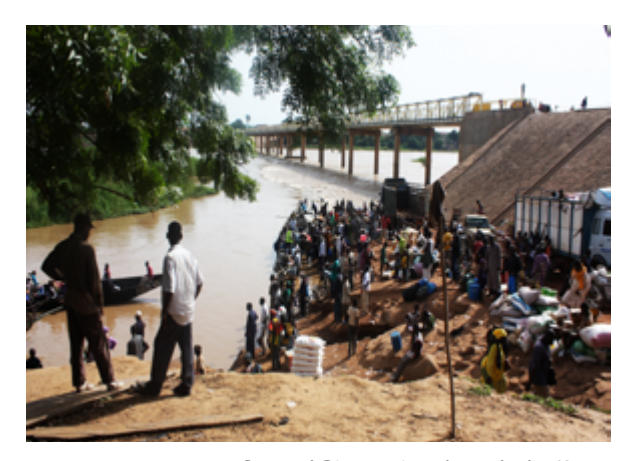
Senegal River going through the Kayes

The Senegal River is the other major river in southwestern Mali. It begins at the confluence of the Bakoye and Bafing rivers near Bafoulabé and flows northwest past Kayes to become the border between neighboring Mauritania and Senegal. The Manantali Dam, 90 km (56 mi) upstream and southeast of Bafoulabé, forms a large reservoir, which supplies water and hydroelectricity. Since 1972, Mali, Mauritania, and Senegal, through the Organization for the Development of the