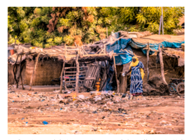
Burning trash being a major part of the pollution in Mali

Air and water pollution are worsening, especially as cities are increasingly unable to deal effectively with waste management. Many do not have sewers, and residents often dump their sewage into the Niger River, which is dangerously polluted.<sup>11</sup> The government is working to address these challenges.<sup>12, 13</sup>