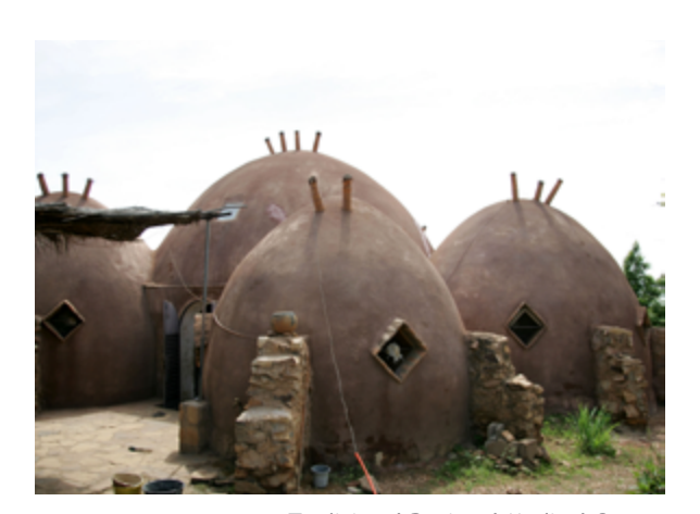
Traditional Regional Medical Center

Traditional medicine remains the primary health resource for most Malians. Local healers use their extensive knowledge of medicinal plants, socio-cultural norms, religious beliefs, and witnessed experiences that are handed down from generation to generation to diagnose and treat physical, social, or spiritual imbalances.<sup>32</sup> A high percentage of illnesses and deaths in Mali are attributed to communicable diseases and parasites transmitted through unsafe drinking water and inadequate sanitary conditions.<sup>33</sup>