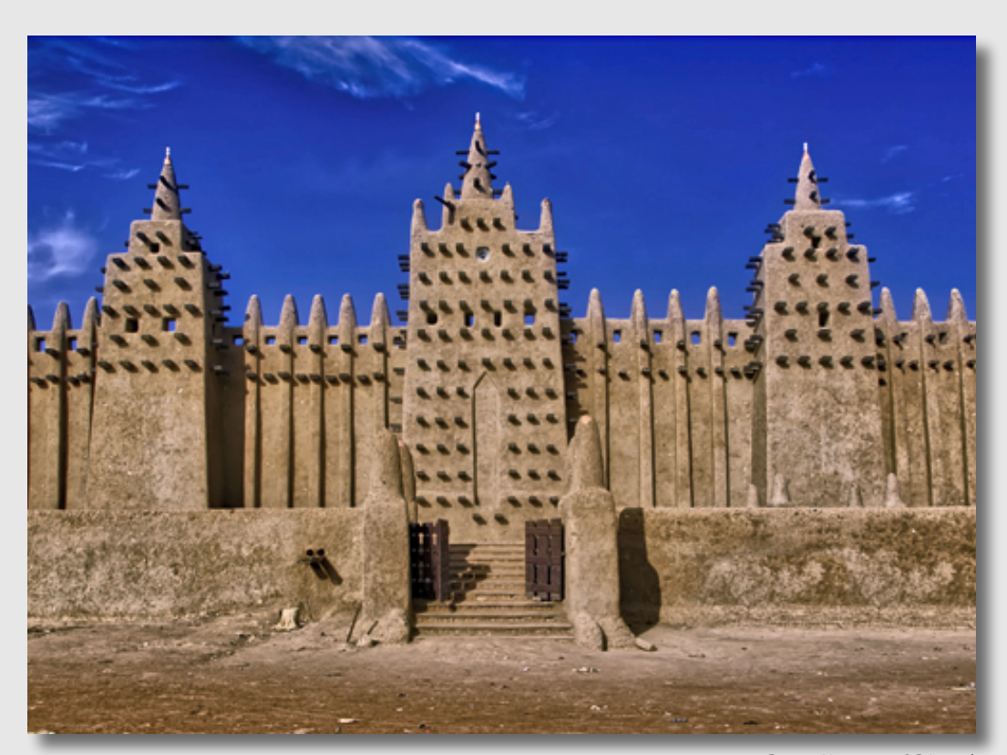
Great Mosque of Djenné