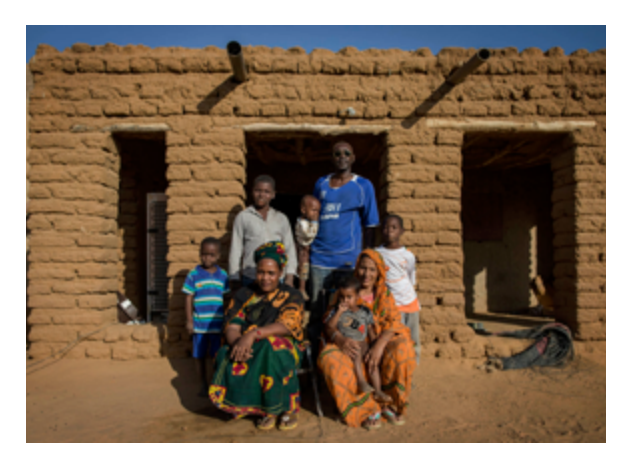
Malian extended family

The concept of family is different than in Western countries. The nuclear family is just a subset of the extended family, which plays a major role in daily life. Extended family members typically live in a single household, and each family member has a defined role. Single parent and female-headed households are more common in urban than in rural areas. Polygynous marriages are also more common in rural Mali than in urban centers; nearly 47% of families in rural Mali are polygynous.<sup>2</sup>