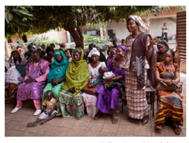
Malians in tradtional dresses

Regardless of where they live, Malian men might wear a boubou, a long, flowing wide-sleeved robe. Malian women also