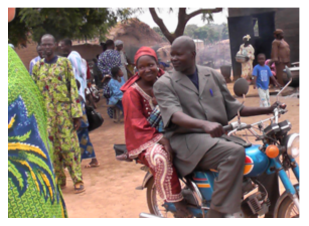
A Malian couple

Malian society is strongly patriarchal. Women are subject to their husbands and must receive permission even for simple activities like leaving the house. A new family law passed in 2012 further deteriorated women's rights by limiting their choices and protections in the areas of child custody and marriage.