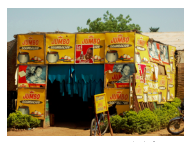
Jumbo Restaurant

Because eating out is prohibitively expensive for average Malians, families tend not to frequent restaurants. However, Mali's dining out options are as rich and diverse as the Malian people, with regional food offerings reflecting a wide variety of cuisine.<sup>24</sup>