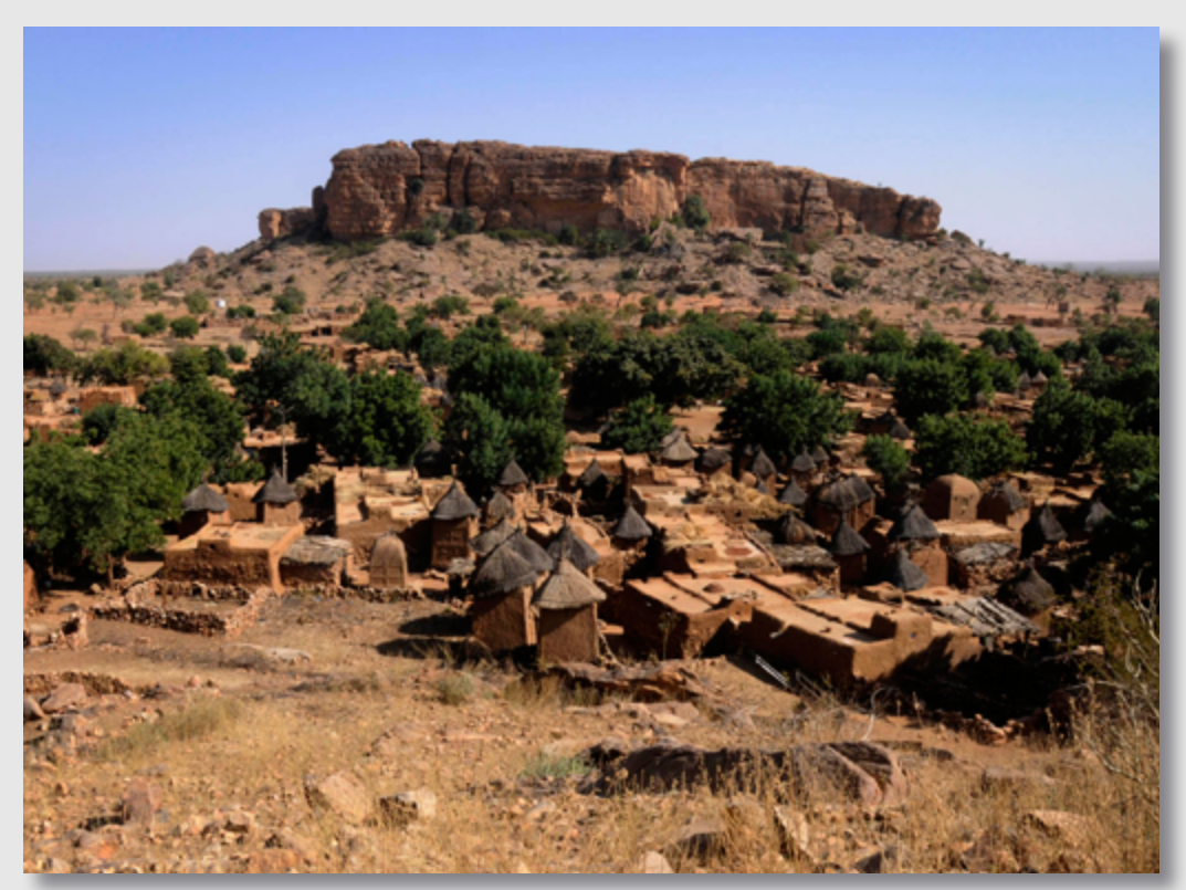
Songho's Village with the Traditional Architecture of Dogons' Houses and Granaries