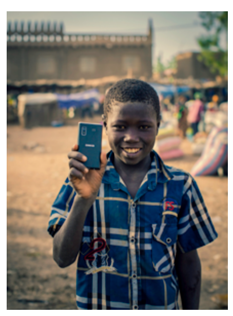
A boy showing his mobile device

As of 2015, only around 10.3% of Malians were able to access the internet via computer. Most Malians use a cell phone to access internet content. There are an estimated 134 mobile phone subscriptions for every 100 residents.<sup>58</sup>