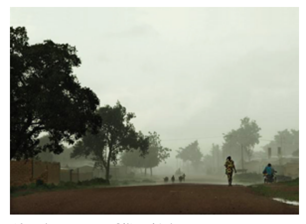
After the storm near Sélingué Lake

Yearly cycles of rainfall combine with annual temperature changes to produce three seasons. The weather is dry and hot from February to June, wet and relatively mild from June to November, and dry and cooler from November to February. These weather patterns produce three climate zones in Mali. The northernmost Saharan zone has almost no annual rainfall, mean daily temperature highs of 48°C (119°F), and lows of 5°C (41°F). In the Sahelian Savanna, the continent-spanning