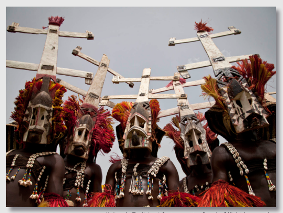
Malians in Traditional Costumes attending the Official Inauguration