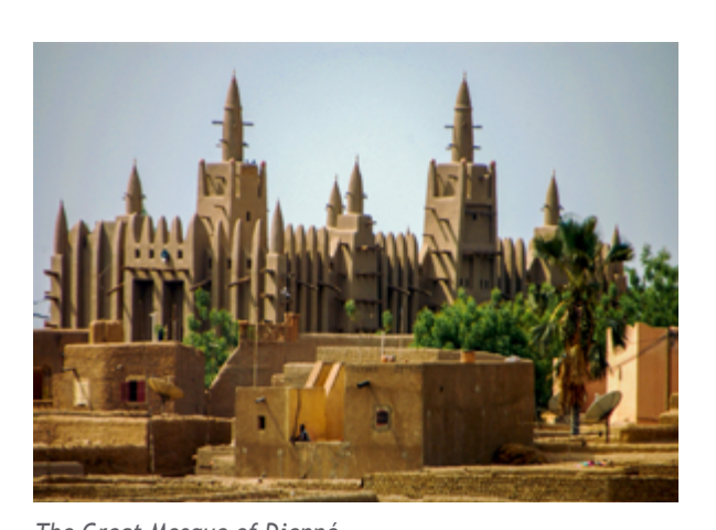
The Great Mosque of Djenné

Djenné is the oldest known city in sub-Saharan Africa. Remnants of the original trading center, Jenne-Jeno, date from 250 BCE. The current city, on an island at the confluence of the Niger and Bani rivers, was settled in the 11th century. The city was a key hub of the gold and salt trades; the Songhai, Fulani, and Tukulor peoples conquered the city, which was subsequently occupied by France. This UNESCO World Heritage site is known for its Great Mosque, the world's largest