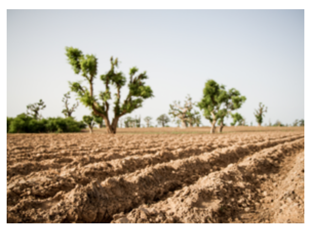
Sahel's dry and sandy soil

Known as the inland delta of the Niger River, the Sahelian Savanna is part of the semiarid transition zone on the southern edge of the Sahara Desert.<sup>20</sup> In Arabic, sahel literally translates to "shore" of the great sand ocean.<sup>21</sup> Overall, this savanna is vast, stretching across the entire African continent from the Red Sea to the Atlantic Ocean—between the Sahara and the rainforests near the West African coast. In Mali, the Sahel is located south of the Sahara Desert and Southern Sahara