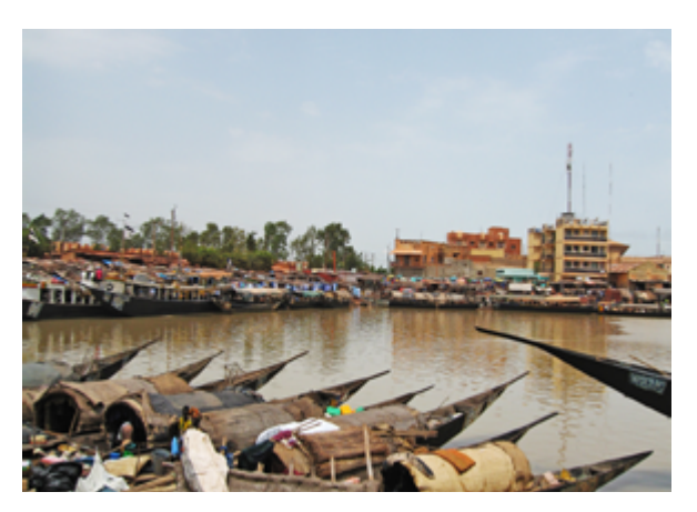
Mopti Port

The regional capital of Mopti lies at the confluence of the Niger and Bani rivers in the Macina region of central Mali. It is a city built on islands, sometimes called the "Venice of Mali." It is a busy port, a center of fishing, and raising livestock. The population of Mopti is a diverse mix of peoples including Fulani, Bambara, Dogon, Songhai, Bozo, Bwa, and Tukulor. 47, 48