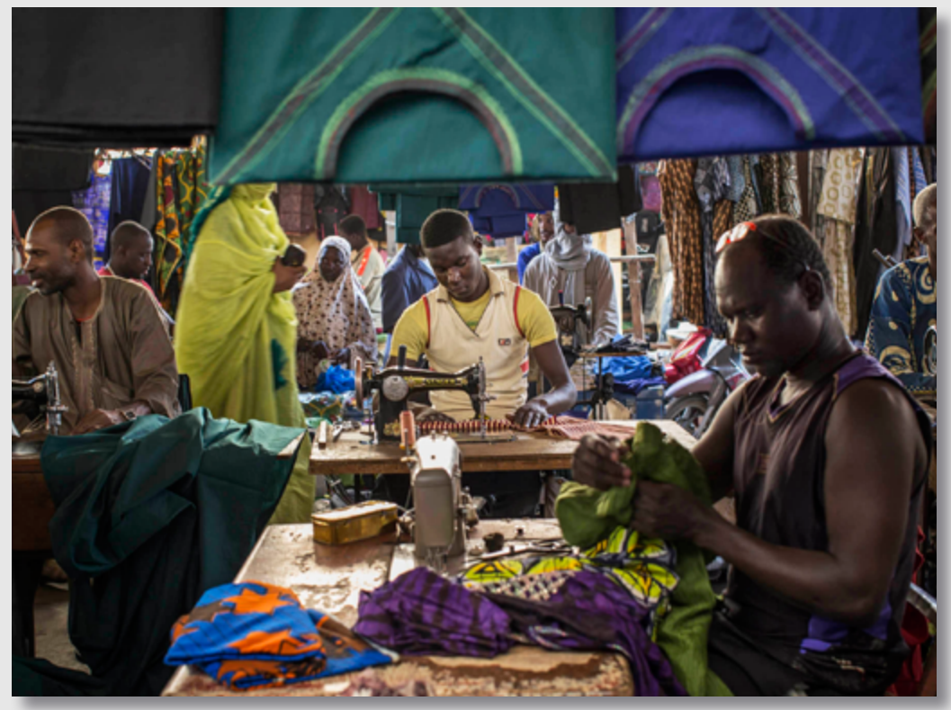
Malian Migration to Urban Areas in Search of Job