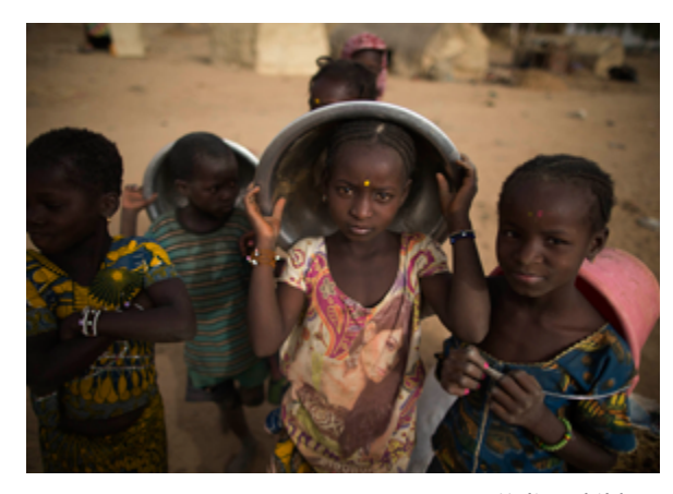
Malian children

Naming a baby in Mali is a time for celebration. Because infant mortality is so high, many parents wait until they are reasonably sure the baby is going to survive before giving the baby a name. Muslim naming ceremonies take place seven days after birth. During the ceremony, the imam (religious leader) reads from the Quran and announces the name of the baby. Some parents ask the imam to choose a name from the Quran. A griot can play a key role in a more traditional baby naming