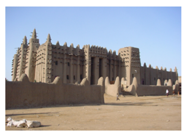
Great Mosque of Djenné

Mosques often have a tower called a minaret from which the calls to daily prayers are issued. Many mosques also have an ablution fountain in the center of an outside courtyard (sahan). Muslims are invited to conduct ritual washing in the ablution fountain before prayers.<sup>47, 48</sup> The mosques in the cities of Timbuktu, Gao, Ménaka, and Kidal are built in the traditional mud architecture of Mali.<sup>49, 50</sup>