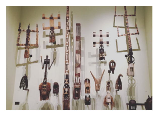
"Dama" funeral masks of the Dogon people in Mali

Since the majority of Malians are Muslim, most funerals are Islamic. Burials vary according to local customs and interpretations of Islamic law. The burial is to take place as soon as possible after death, typically within 24 hours. 53 The body is to be treated with respect, with as much modesty as possible, and the privacy of the deceased is to be upheld. To expedite burial, the deceased should be buried in the city or region of their death. The deceased is washed in a thorough