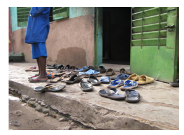
Leaving shoes outside the mosque

If prayers are in progress, visitors should remain silent; otherwise, speaking softly is permissible. One should silence or shut