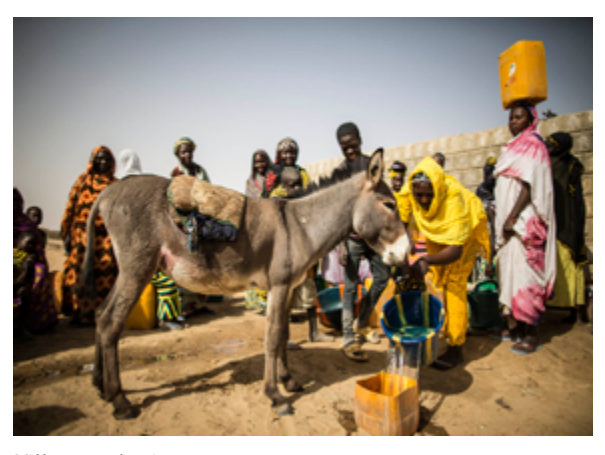
Village gathering

Malians are divided among ethnic, tribal, and caste lines. Relationships between ethnic groups and communities can be complex. Each ethnicity has a unique lifestyle, culture, and societal structure; village life is dictated by the norms of the predominant culture. Because most of the rural population is engaged in agriculture, mostly subsistence farming, family life is dominated by working on family farms, tending to family herds, or activities that enable others to work in agriculture.<sup>49, 50, 51</sup>