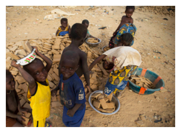
Malian children working

In 2015, Mali's unemployment rate stood at 30%, due in large part to the uncertainty of agricultural work brought on by drought and war.<sup>14, 15</sup> Mali's tumultuous history has made emigration a common survival strategy. In 2014, Malians living abroad sent home over USD 877 million in worker remittances.<sup>16</sup>