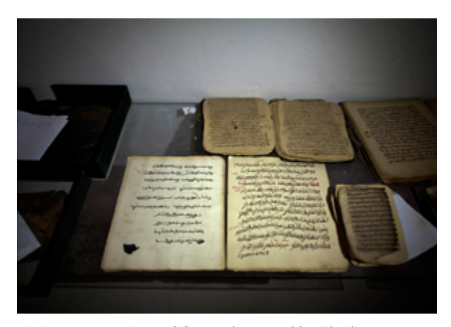
Ancient manuscripts of Quran destroyed by jihadists during the occupation

Although Mali is as a secular nation, religion and politics are inseparable. Traditional religions gave leaders the divine right to rule. The Malian government is cooperating with international investigations and prosecution of those responsible for the destruction of religious sites and other crimes perpetrated by Islamic extremists during the Northern Mali conflict.<sup>21</sup> The High Council of Islam, the most senior Islamic authority in Mali, has significant political power, though it is not directly linked with the Malian government.<sup>22</sup>