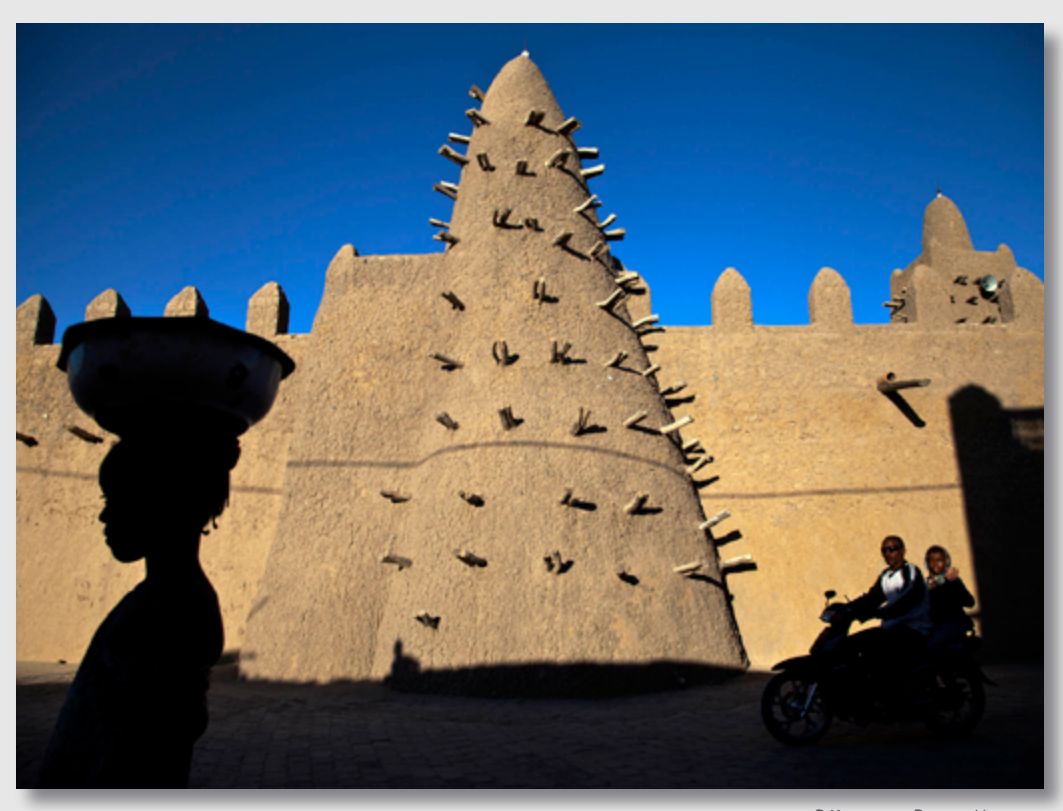
Djingarey Berre Mosque