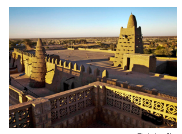
Timbuktu City

19th-century Europeans died while exploring its environs. Tuareg tradition says that "Timbuktu" means "mother with a large navel," which refers to a disfigured woman who was left to guard a seasonal camp. Timbuktu became an important center of trade and learning by the 14th century. It is a regional capital today. Portions of the historic city center were designated as a UNESCO World Heritage site in 1988. More recently, international aid agencies have been helping to preserve