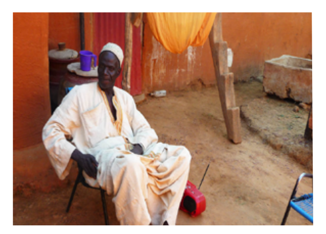
Mande

About half of Mali's population is Mande, who mostly live in the southwest and speak related dialects. The Bambara are the largest Mande subgroup and constitute a majority in the capital, Bamako. Descendants of the Bambara and Kaarta kingdoms of earlier centuries, the Mande are traditionally farmers and craftspeople. Bambara is the first or second language of 80% of Malians and is spoken throughout West Africa. Other Mande people include the Malinke and the Soninke, now known