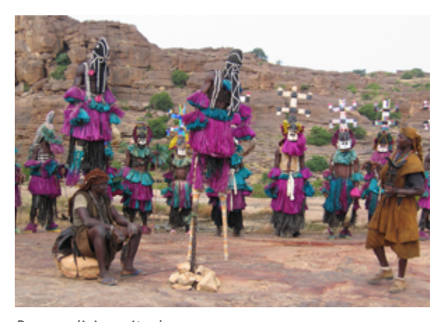
Dogon religious rituals

Intertwining Islamic practices with traditional practices include wearing grigri charms (amulets used to protect a person from harm or illness) and the use of masks or totem animals during religious rituals.<sup>34</sup> The Bambara also believe that their ancestral spirits will be reincarnated. During special ceremonies, a mediator presents an offering of flour and water to ancestral spirits. The mediator is the oldest member of a lineage, whose purpose is to bridge the divide between the living and the dead.<sup>35</sup>