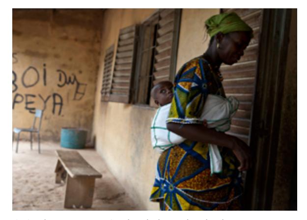
A tired woman carrying her baby on her back

Traditional medicine is widely used, both in urban and rural Mali, to treat ailments experienced during pregnancy. Traditional remedies are more affordable and accessible, and there are far more practitioners of traditional medicine than physicians. There is some integration of traditional medicine and modern medical practices. The knowledge of traditional medicine and the use of medicinal plants has been passed down for generations.<sup>46</sup>