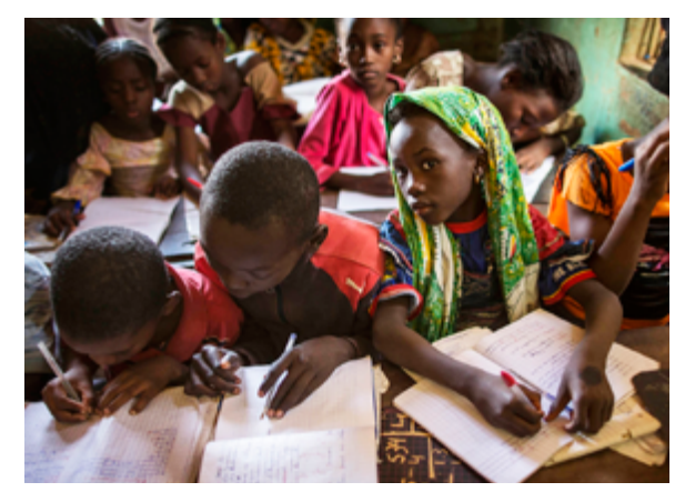
Students from different ethnic groups attending a class, Gao

International education aid has declined since 2007, resulting in fewer funds for public education. Educational funds are concentrated in Bamako, resulting in money being disproportionately distributed to secondary and higher education.<sup>22</sup> Producing textbooks in Mali's 13 national languages, as well as training teachers and offering them better wages and working conditions, remains a challenge. Without adequate funding, Mali's youth remain at a disadvantage.<sup>23</sup>