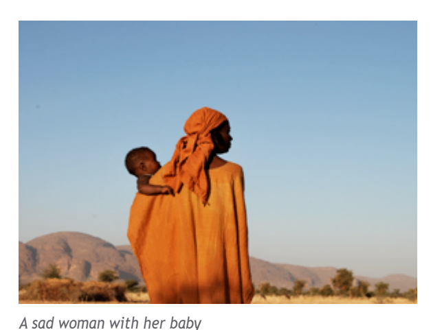
A saa woman with her baby

Divorce can be granted on the grounds of mutual consent, a breakdown of marital relations, or due to the fault of a spouse. Family, religious, and local leaders are often called upon to help couples reconcile before divorce is considered. In instances of divorce, these informal leaders facilitate the dissolution of the marriage. Because these informal channels operate outside of the law, the mediators don't always settle the divorce in a fair manner or in accordance with Malian law; instead,