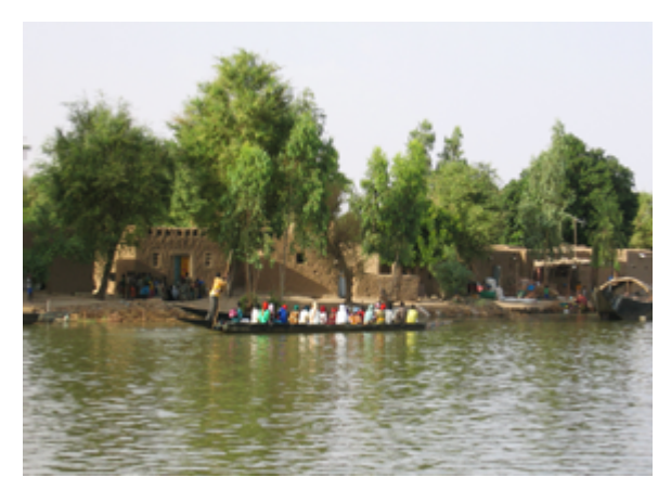
Niger River, Mali's most important water source

Mali's most important water source is the Niger River and its inland delta system. After entering Mali through its southwestern border with Guinea, there are three dams: the Selingué, Sotuba, and Markala. The navigable course of the river runs some 1,600 km (1,000 mi) from Bamako's neighboring port near Koulikoro, northeast past Timbuktu, then east and south toward Gao.<sup>31, 32</sup>