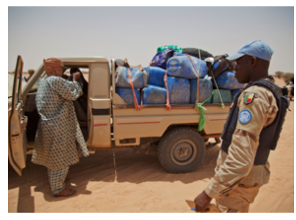
A checkpoint in Kidal

market reach. 52 Border crossings are intermittently closed by Mali or neighboring nations due to