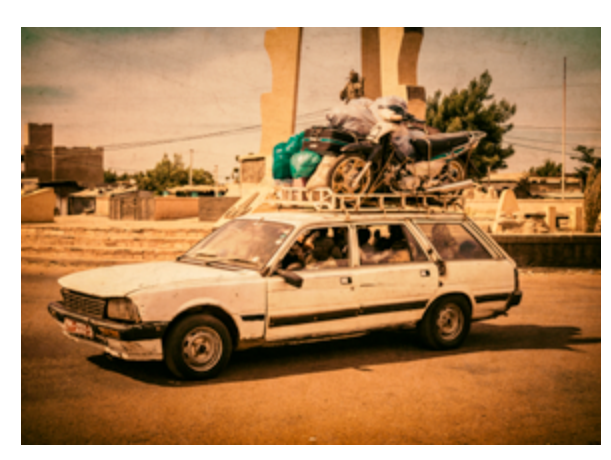
Malians crammed into a taxi

Another option is to hire a West African "bush taxi," which typically seats about seven passengers. 46 These taxis have cheap fixed fares and they go just about