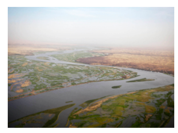
Flooded Savanna

For four months each year, during the rainy season, floodwaters spill over the banks of the Niger and Bani rivers, causing the inner Niger Delta to swell to an area of about 20,000 sq km (7,722 sq mi). This annual flooding produces numerous swamps, lakes, and channels that provide critical habitat for migrating birds and manatees. Located in the semi-arid Sahel region of central Mali, this area of floodplains and lakes is one of Africa's largest. One million Malians derive their livelihood from this