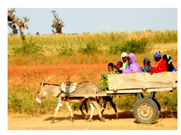
Malian family in a carriage from the village Bouwéré

Mali has 22,474 kilometers (13,964 miles) of roads, approximately 75% of which are unpaved.<sup>21</sup> Most paved roads connect Bamako to other population centers. There is a railroad line linking the Niger River and Bamako with Dakar in Senegal, providing rural Malians with some access to domestic railroad travel. Construction is underway to improve Mali's railroad infrastructure.<sup>22</sup> Mali does not have commercial domestic air travel, but charter air service is available. There are 25 airports in Mali, including two