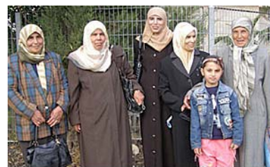
Traditional dress of women

Although many Palestinian youth and men wear Western attire, older and more conservative men wear traditional headdresses known as kaffiyehs . 240 Originally protection from the sun, today the kaffiyeh serves as a symbol of Palestinian nationalism. The late Palestinian leader Yasser Arafat was seldom seen without a kaffiyeh . 241, 242