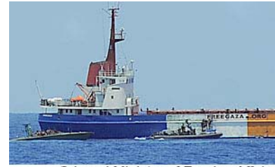
IDF check ship near Gaza

The Palestinian Authority's ability to trade continues to be hampered by Israeli control of its borders and the blockade on the Gaza Strip. Israel maintains a strict embargo on products into the Gaza Strip. Yet smuggling under the border between Gaza and Egypt via tunnel has assured a somewhat steady stream of the basic necessities. 105