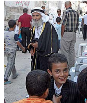
Grandfather and children

Historically, clans were a source of socioeconomic and physical safety. Through the sharing of land, tools, and labor, the clans met the needs of the predominantly agrarian communities. 193