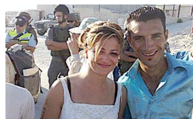
Western style wedding

Western-style formal wear has largely replaced traditional wedding clothing among urban Palestinians. Some women in rural areas and the more conservative Gaza Strip wear a thob , a long robe-like dress with an elaborately embroidered bodice. 370