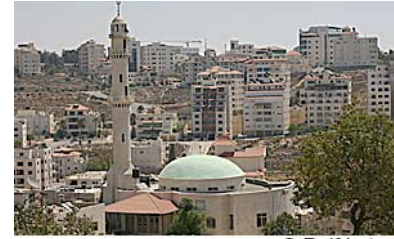
Ramallah in West Bank

The Palestinian Territories are increasingly urban, with an estimated 72% of the population living in cities in 2008. 250 In addition, Palestinian refugee camps in neighboring Jordan, Lebanon, and Syria have merged with nearby urban areas, making urbanization common among Palestinians at home and abroad. 251