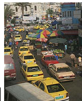
Nablus city traffic

Numerous security checkpoints exist within the Palestinian Territories and along their borders with Israel. As a result, Palestinians' freedom of movement is restricted. Although many urban Palestinians enjoy trips to the countryside to visit family and friends or engage in outdoor activities, such visits are hampered by these security measures. 289