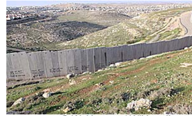
West Bank barrier near Ramallah

Under terms of the 1995 Oslo interim agreement, the Palestinian Territories were divided into three security zones. This left the Palestinian Authority with administrative and security control over most of the urban centers. Israel retained control over much of the rural areas. According to the agreement, the Palestinian government was to gradually gain greater control over the rural areas. But its difficulties managing the security and administration of the urban areas have convinced the Israelis that the Palestinians cannot control more territory. As a result, Palestinians have been limited in their access to much of the rural lands in the West Bank. 311