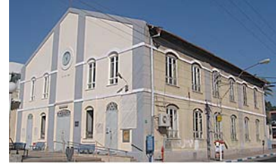
Synagogue in Petah Tikva

In general, anyone may enter a synagogue, so long as they are respectful of the customs and traditions. Typically, the Jewish settler communities in the West Bank are quite closed. Access to synagogues there may be restricted. The more radical interpretations of Judaism and Zionism are more prevalent in these settler communities. 190 One should dress conservatively when visiting a synagogue.