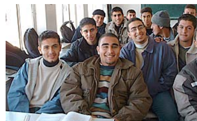
© Darcy Vallance Boys secondary English class

Palestinians place a high value on education. Parents have the option of sending children to public or private schools. The former are funded by the government, and the latter are financed largely by religious institutions—primarily Muslim or Christian. 278 Just as with healthcare, the United Nations operates a separate system for refugees. But overcrowding has led to high student-to-teacher ratios, the need for teaching students in shifts, and other strains upon the education system. 279