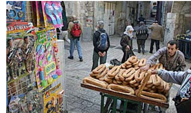
Street vendors in Old Jerusalem

Palestinian cities have large open-air markets, referred to as souqs . One can purchase nearly anything at such markets: foodstuffs, clothing, jewelry, furniture, etc.