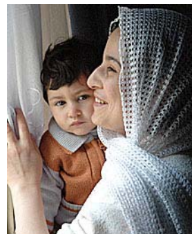
Young mother and son

Many newlyweds, especially young newlyweds, first live with the groom's family. If there is enough room after the couple has children, this might continue. The couple may opt for their own home, but the shortage of available housing or land has increasingly made this option too costly. 379, 380, 381