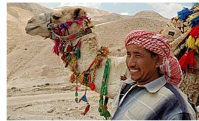
Bedouin near Jericho

To make room for the expansion of nearby Jewish settlements, Israeli authorities recently planned to relocate the Jahalin again, after years in their current tent encampments. Though the plan has been placed on hold, it may come to fruition later. In anticipation of this eventuality, the Jahalin have requested they be returned to their traditional lands in the Negev. 306