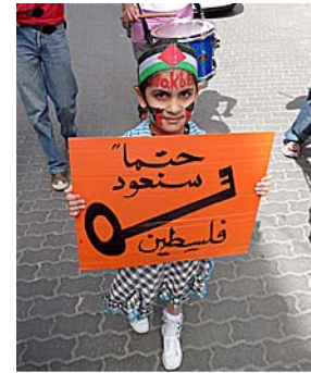
Girl joins protest on Nakba Day

On 15 May each year Palestinians throughout the Middle East commemorate the forced exodus of Palestinians that began after the creation of the state of Israel in 1948. During the annual holiday, Palestinians and other Arabs demonstrate against what they view as the Israeli occupation of Palestine. Such demonstrations frequently result in clashes with Israel Defense Forces. 246, 247, 248