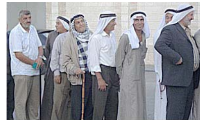
Muslims in Bethlehem

Islam is a monotheistic religion, meaning that its followers believe in a single deity. The Muslim community, or umma , calls this deity Allah. The Arabic term islam means “to submit” or “to surrender.” Therefore, a Muslim is one who submits to the will of Allah. 135 Muslims believe that Allah revealed his message to the Prophet Muhammad, a merchant who lived in Arabia from 570 to 632 C.E. They consider Muhammad as the last in a long line of prophets including Abraham, Moses, and Jesus. Allah’s message, as relayed by Muhammad, is delivered in the Quran, the sacred text of Islam. 136, 137