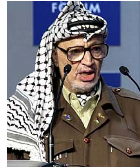
Yasser Arafat

Prior to the establishment of Israel in 1948, the Arab League organized an armed force drawn from member states in 1947. 48, 49 Within a decade of the creation of the Arab Liberation Army (ALA), Yasser Arafat, at the time a civil engineer living in Kuwait, and his business associates established the Palestinian liberation group called Fatah. Fatah has served as the main Palestinian liberation group since its creation in 1956. 50 Fatah continues to wield considerable influence in the Palestinian Territories today.