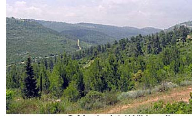
Judean Hills

The West Bank is higher in elevation than the Gaza Strip. The Samaritan and Judean hills run along a north–south axis through much of the West Bank. The territory borders Israel to the west, north, and south (307 km, 191 mi); its eastern border is defined by the Jordan River and the Dead Sea, which narrowly separate the West Bank from Jordan (97 km, 60 mi). The higher elevations receive an average annual rainfall of approximately 69 cm (27 in), but areas closer to the Dead Sea receive considerably less. About 16.9% of the land is arable. 3, 4 Winters are a bit colder in the West Bank, where temperatures average 11°C (52°F). Likewise, summer is a little milder than in the Gaza Strip, with an average temperature of 20–25°C (68–77°F). 5