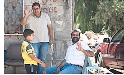
Small town in West Bank

Less than one-third of the current population of the Palestinian Territories lives in rural areas, a dramatic change for the historically agrarian society. The demographic shift follows decades of warfare that has led to the displacement of many Palestinians. Forced from their ancestral villages and farms after the creation of Israel in 1948, the Palestinian people began an exodus to the urban centers and refugee camps of the West Bank, the Gaza Strip, and neighboring states. 296