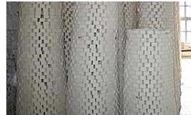
Soap factory in West Bank

In 2010, the industrial sector employed 16% of the Gazan workforce and 28% of the West Bank workforce. Estimates for 2011 are that industry provided nearly 14% of the Palestinian Territories' gross domestic product (GDP). Major industries revolve around food processing, quarrying, small-scale manufacturing, souvenirs, and textiles. 99, 100