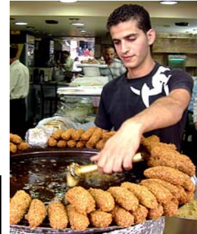
Falafel shop in Ramallah

Palestinian terrorists are known to target restaurants and other public venues. Extreme caution should be used when visiting such places. 284