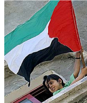
Palestinian girl with flag

Because they have lost the majority of the land they once lived on, Palestinians are now scattered. Even though more than 4 million people live in the Palestinian Territories, many of these are refugees from lands that now make up the country of Israel. Millions of other Palestinians are refugees in the neighboring Arab states of Lebanon, Syria, and Jordan. These Palestinian refugees have lived in poverty for several generations.