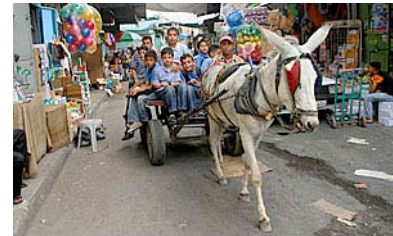
Typical donkey cart in camps

Numerous security checkpoints exist in the Palestinian Territories and along the borders with Israel. As a result, the movement of Palestinians is highly restricted. Although many would enjoy visits to the countryside to visit family, friends, and ancestral properties or to engage in outdoor activities, security measures hamper such visits. 324