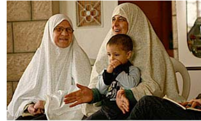
Extended family in Hebron

Like most Arab cultures, Palestinian society is patriarchal. The eldest man in a family makes familial decisions. Because of the importance of extended families, tribes, and clans, Palestinian families frequently live together. Even when living in nuclear family arrangements, close ties remain to the larger familial units. The nuclear family typically continues to live in proximity to their kin. 346, 347