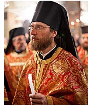
Greek Orthodox mass

Christianity grew from the teachings of Jesus Christ, who Christians believe to be the son of God and the savior of humankind. The holy texts of Christianity are the Old and New Testaments. Many Christians believe the New Testament is the final and complete revelation from God to humanity. They further believe that Jesus died on a cross to save humanity from its sins. On other doctrines and theology, the various branches of Christianity differ, often quite drastically. 145, 146