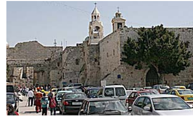
Bethlehem Church of Nativity

Although Christians are a small minority in the Palestinian Territories today, in the past most Palestinians were Christian. As a result, many churches were built throughout the territories and Israel. Many of those churches are no longer standing; others were converted into mosques, though some remain. Also, churches have been built in the modern era.