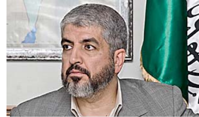
Hamas leader Khaal Meshaal

Although PA President Abbas reasserted control of the West Bank in mid-2007, Hamas militants seized control of the Gaza Strip—a dynamic that remains in place today. 72