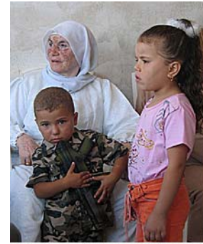
Refugee family

Modern clans have altered their focus from shared agrarian activity to more urban endeavors. Many have launched joint ventures, including NGOs and foundations that continue to pool resources and manage their finances. 201 This is especially true in Gaza, where such ventures have helped diminish hardship through a reallocation of resources and redistribution of wealth. Remittances from the Palestinian diaspora also have helped clan members financially. 202