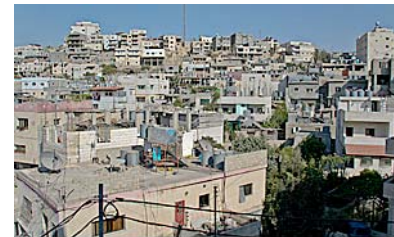
© Jonas Hansel Crowded refugee city

The rampant growth of Palestinian cities—resulting in particular from homes constructed largely without government oversight or adherence to building codes—poses a considerable threat to the region’s archaeological sites and undiscovered cultural treasures. 252 But more urgent is the overcrowding in the cities and refugee camps. Large families crowd into small enclosures that lack proper doors, windows, heating, or protection from the elements. 253 This overcrowding also affects the availability and quality of resources, including education. 254