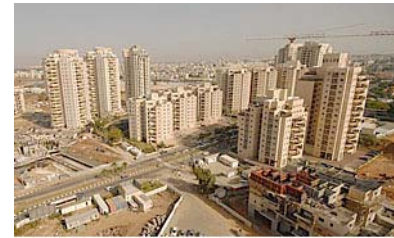
Current view of Petach Tikva

In 1878, the community of Petach Tiqva was established and became the first modern Zionist settlement. The Zionists were Jews, initially primarily from Europe, who believed that the scattered Jewish peoples should return to the Holy Land to reclaim their inheritance from ancient Israelite ancestors. The Zionist movement continued to gain momentum throughout the latter part of the 19th century. 15, 16 The First Aliyah , a major wave of Jewish Zionist immigration from Europe and Yemen to Ottoman-controlled Palestine, occurred in the late 1890s. But the new arrivals met resistance from both Muslims and the Old Yishuv, a small number of Jews who had remained in Palestine since ancient times. 17