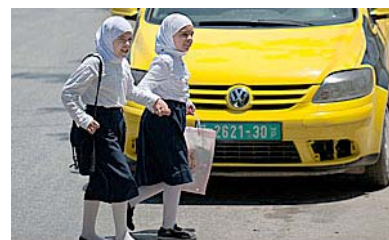
Girls crossing street

A study found that the older generations passed down a reconstructed oral narrative of life before the Arab–Israeli War of 1948. After the war the majority of Palestinians became refugees in the West Bank, the Gaza Strip, and neighboring countries. This has given Palestinian youths a romanticized picture of Palestinian identity and cultivated an outsider status that encourages them to take up resistance, armed or peaceful, against the Israeli state. Thus, they are viewed as the vanguard of Palestinians’ continued struggle to reclaim the country they believe to be theirs. This perspective might increase the likelihood of Palestinian children being recruited for the various peaceful or armed Palestinian factions and terrorist groups. 360, 361