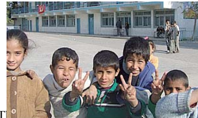
UN school in Gaza

Although schooling is available in the rural areas of the Palestinian Territories, such schools lack the resources of urban schools and may require children to travel long distances to attend. This appears to have a detrimental