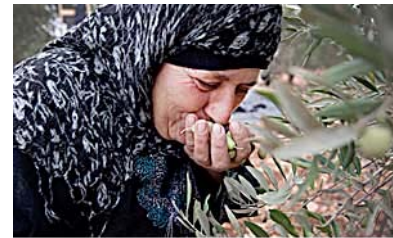
Olives for olive oil

Agriculture, once the backbone of the Palestinian economy, accounts today for about 4% of gross domestic product (GDP) and employs about 16% of the workforce in the West Bank and 5% in the Gaza Strip. 93 The loss of territory in the 1948 Arab–Israeli War, along with Israeli-imposed restrictions on water usage and access to markets, have contributed to this trend. About 17% of the land in the West Bank and 29% of the land in the Gaza Strip are suited to growing crops. Major agricultural products from the West Bank and the Gaza Strip include beef, dairy, flowers, fruit, olives, and vegetables. 94, 95