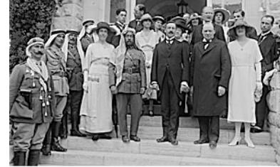
Churchill at Jerusalem meeting

On 2 November 1917, British Foreign Secretary Arthur James Balfour issued the Balfour Declaration, stating that Britain would support the creation of an independent Jewish state in Palestine. (This move was later supported by U.S. President Harry S. Truman.) 22, 23, 24, 25 The terms of the League of Nations' British Mandate for Palestine, which came into effect in September 1923, legitimated British control of the region. 26