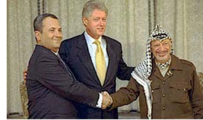
Camp David Summit in 2000

In 1987, popular unrest in the Palestinian Territories led to an uprising known as the First Intifada that lasted until 1993. The PLO's inability to effectively lead the uprising brought about the formation of new militant groups, including Hamas and the Palestinian Islamic Jihad, which would later challenge Fatah. 61