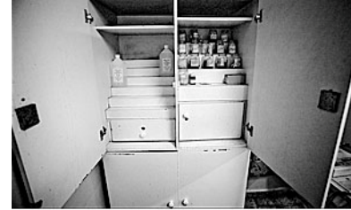
Lacking medicine in Gaza

The security situation in the West Bank increases the difficulty of providing healthcare for rural residents. Healthcare in the Gaza Strip is even worse, because the Israeli blockade has cut off access to medical supplies. 327