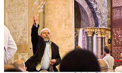
Giving candy on Eid al-Adha

Eid al-Adha commemorates the patriarch Ibrahim's (Abraham's) willingness to sacrifice his son Ismail. During the celebration, which occurs concurrently with the yearly pilgrimage to Mecca, Muslims don their finest clothing and perform the obligatory prayers. Families that can afford the expense also make an animal sacrifice. The meat is then shared with the needy and with friends and family. 179