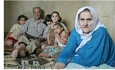
Displaced Palestinian family

Bedouin tribal confederations ( saffs ), another significant social force in the Palestinian Territories, are more common in rural areas. The Bedouins, once nomadic herdsman from the harsh climate of the Negev, were forced into a sedentary lifestyle through resettlement at the hands of the Israel Defense Forces (IDF) in the 1950s and 1960s. Some Bedouin tribes, including the Ahyawat and Tiyaha, had migrated earlier to Egypt's Sinai Peninsula to escape the Arab-Israeli War and the resettlement programs. 302 Other Bedouin, including the Tarabin and Azazmeh, were resettled in Israel proper. 303, 304 The Jahalin and other smaller groups were relocated to the West Bank, near the main encampments of Ma'ale Adumim and Khan al-Ahmar. 305