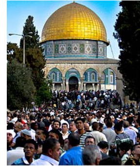
Eid prayer at Dome of the Rock

Beginning the first day after the holy month of Ramadan, Eid al-Fitr, the three-day “festival of fast breaking,” celebrates the end of Ramadan. People dress in new clothes, engage in community prayers, and visit with friends and relatives. Many Muslims also visit the cemeteries to pay respects to their departed loved ones. 176 Eid al-Fitr is a time of togetherness and community. Neighbors are invited for meals, and donations of money and food are given to local mosques. During this time, restaurants, cafés, and bakeries see an upsurge in business as people flock to them for celebratory meals and dishes. 177, 178