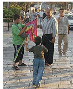
Father and sons

Sibling relationships are important in Palestinian families. If the father dies or becomes unemployed, brothers often assume the responsibility for providing for their sisters' basic needs and education. They also bear responsibility for safeguarding their sisters' reputations, frequently serving as chaperones when their sisters socialize. Similarly, adult sons are expected to look after their widowed mothers. 352, 353