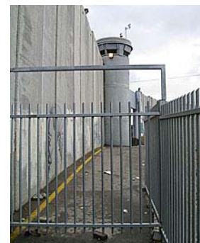
West Bank Checkpoint

Several Israeli-controlled crossings are built into the barrier wall separating the West Bank from Israel. These checkpoints manage the flow of goods, labor, and travel between the two areas. Without the proper Israeli-issued permits, Palestinians are unable to travel beyond the barrier. 332