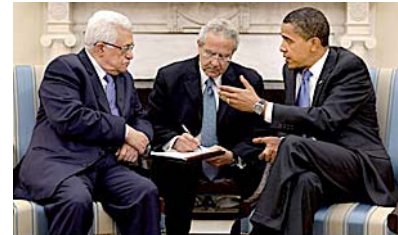
Abbas with President Obama

In a move to defuse tensions, U.S. President Barack Obama called for an end to Israeli construction of settlements in the Palestinian Territories and for Arab recognition of the state of Israel. In mid-2009, President Obama also endorsed a two-state solution to the Palestinian question. Israeli Prime Minister Benjamin Netanyahu has voiced support for the idea of establishing a separate, independent Palestinian state. 73