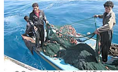
Fishing off shores of Gaza

Fishing, once a staple of the Gazan economy, has been negatively affected by the Israeli blockade. The World Food Programme claims the fishing catch was cut by one-third in 2011 alone. Palestinians now import much of their fish from Egypt. 97