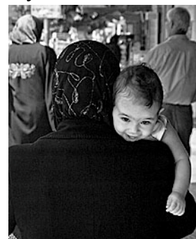
Baby in West Bank

Palestinians celebrate all births, but because they are a patriarchal society, a son is received with extra jubilation. After the circumcision of a newborn son, families celebrate with an animal sacrifice, known as aqiqah , on the seventh day after his birth. Though most of the meat from the sacrifice is given to the needy,