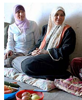
Women visiting

Reflecting the Palestinians' agrarian traditions, the most common gifts are seasonal flowers, fruits, and herbs. 221 Gifts may also be the payment of educational and healthcare fees. This monetary gift type usually comes from relatives living abroad and helps connect them to their home communities. 222 Gift giving also greases the wheels of government bureaucracy. Gifts are given to those in positions to help one's family socially, financially, and politically. 223