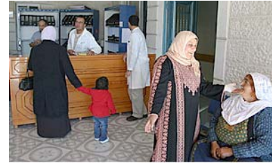
Hospital waiting room

The Palestinian healthcare system has three tiers. The primary level includes the community healthcare services that are typically a patient's first contact point. The secondary level has specialists whom patients are typically referred to from their primary care providers. The third level comprises surgeons, neurologists, and other scarce and more highly specialized practitioners. Specialists are only available in intensive care facilities in Jerusalem and are largely inaccessible to the majority of Palestinians. 266 Advanced medical treatment is available in Israel but must be applied for. Applications are frequently denied by Israeli authorities based on security concerns, especially for those known to have been involved with terrorist groups and liberation movements. 267, 268