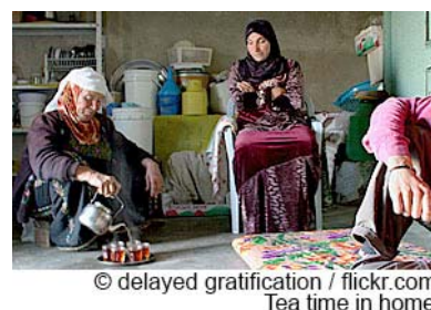
Tea time in home

In general, Palestinians are friendly and welcoming. 215 Palestinian men greet each other with a handshake, and women kiss each other on the cheeks. Such greetings include a smile, direct eye contact, and social commentary about family. When greeting the opposite gender, allow the Palestinian to initiate the interaction to avoid social transgressions. 216