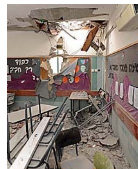
Classroom after rocket strike

The most common street crimes in the Palestinian Territories are breaking into parked vehicles, pick-pocketing, and purse snatching. Additionally, the manufacture and selling of counterfeit and pirated merchandise is rampant. Of far more concern to public safety are the frequent terrorist attacks and expressions of civil unrest in the Palestinian Territories and refugee camps, along with the reciprocal attacks of the Israel Defense Forces. 292, 293 Kidnapping, though rarer than in the past, is a major concern, especially in the Gaza Strip. In April 2011, terrorists kidnapped and killed an Italian pro-Palestinian activist. 294, 295