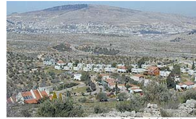
Jewish Settlement in Itamar

Although the Jewish faith has a long history in the Palestinian Territories, the vast majority of Jews there today are recent immigrants from Europe and the Mediterranean. The IDF has forcibly removed Jewish settlers from settlements in the Gaza Strip, but Jewish settlers continue to build in the West Bank, where they make up 17% of the population. 131, 132 The settlers speak Hebrew. Some are also conversant in Arabic or English. 133