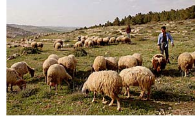
Shepherds in West Bank

Agriculture was once the backbone of the Palestinian economy, but today it accounts for only about 4% of gross domestic product (GDP). Roughly 16% of the workforce in the West Bank and 5% in the Gaza Strip are engaged in agricultural pursuits. 317 About 17% of the land in the West Bank and 29% of the land in the Gaza Strip are suited to growing crops. Major agricultural products include beef, dairy, flowers, fruit, olives, and vegetables. Agricultural exports are primarily flowers, fruit, olives, and vegetables, most of which are sold in the Israeli market. 318, 319