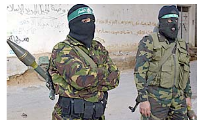
Hamas soldiers in Gaza

Religion defines identity in the Palestinian Territories and much of the Middle East. The role of religion in the daily lives of Palestinians cannot be underestimated. Even among organizations that claim a secular ideology (e.g., Fatah), Islam remains an essential component of their identity. 166