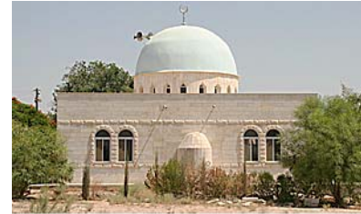
Mosque in Jericho

The Mosque of Omar in Bethlehem and the Great Mosque of Gaza are well known in the Palestinian Territories. The former is prominently situated along the Manger Square and is the largest place of worship in Bethlehem. 181 The latter was originally built by the Crusaders as the Church of St. John and partly constructed with pillars that had been part of a synagogue. It is now the largest mosque in the Gaza Strip. 182