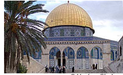
Dome of the Rock

Today, about 75% of the West Bank is Muslim. In the Gaza Strip 99% of the population is Muslim. Muslims from both areas are predominantly Sunni, but in the Gaza Strip, where the Hamas regime relies heavily on Shi'ite allies, Shi'ite conversions may be increasing. 121 Palestinian Muslims speak Arabic. Many also speak Hebrew and/or English. 122, 123