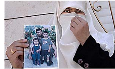
Family of a suicide bomber

Mithaq al-sharaf is the formal code of honor between Palestinian clan members. Although once an oral tradition, today it can be a lengthy legal document. 209 This social contract involves a pledge of loyalty to the clan and a willingness to defend any clan member. An attack against one clan member is an attack on all clan members. 210 This mutual defense mechanism serves as a deterrent to the blood feuds in Palestine. 211, 212