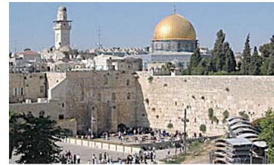
Temple Mount and Dome of Rock

Religion plays a major role in defining groups in the Palestinian Territories and the rest of the Middle East. Religion is a frequent justification for the violence that plagues the region. Most Palestinians are Muslim but there is a Christian minority that dates to Roman and Byzantine eras. Additionally, more than 300,000 Jewish settlers have established communities in the West Bank. 134