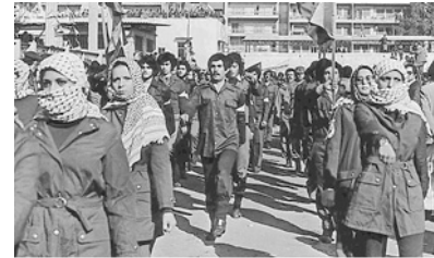
Fatah militia in Beirut

In April 1975, Arafat aligned the PLO with the Lebanese National Movement (LNM) during the Lebanese Civil War, which lasted until October 1990. This alienated many of Arafat's supporters, who saw this as a distraction from the goal of liberating Palestine. It also earned the PLO hostility from many of the key factions vying for power in Lebanon. 56