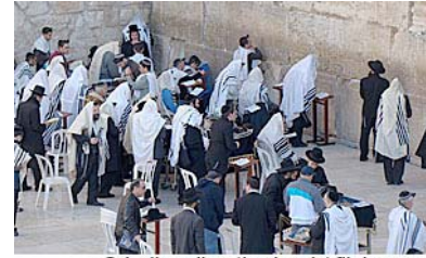
Jews pray at Western Wall

Jewish religious life centers upon the Sabbath, observed from sunset on Friday until sunset on Saturday. Services in synagogues consist primarily of readings from religious texts and prayer. 157, 158