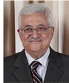
President Mahmoud Abbas

Following the violence that erupted after the 2006 parliamentary elections, Abbas declared a state of emergency. Later, on 14 June 2008 he appointed an emergency government. At this time Salam Fayyad was named the PA prime minister. 80