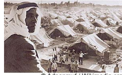
Refugee camp in Syria 1948

Palestine's Jewish community proclaimed the establishment of the state of Israel in 1948, sending thousands of Arab Palestinians fleeing to neighboring countries. 36, 37 The Law of Return, passed by the Israeli parliament in 1950, declared the right of all Jews to immigrate to the new Jewish state and provided assistance with settling there. This profoundly altered Israel's demographics and created a need for additional land. 38 Numerous armed conflicts between Israel and the Palestinians have occurred since then. 39, 40