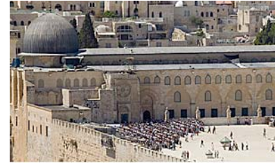
Ramadan in Jerusalem

Ramadan is the name for the ninth month of the Islamic lunar calendar during which Muslims celebrate the Archangel Gabriel's revelation of the Quran to Muhammad. Throughout this month, Muslims fast during daylight hours. The fast is broken at sunset by a prayer and a meal called iftar , which is shared with the family. Ramadan is a time to visit family and friends as well as a time for prayer and reflective thinking. Visitors are welcome to join celebrations; there are no restrictions that prevent outsiders from participating. 175