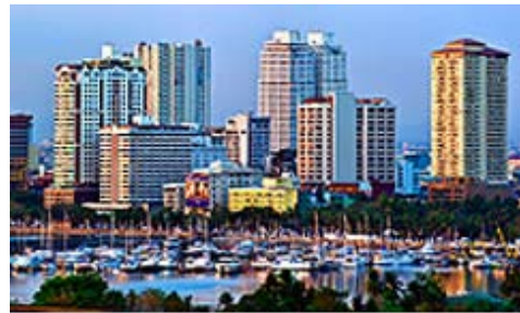
Manila Bay

Members of the Tagalog group are concentrated around Manila Bay, and occupy the island of Luzon in its central and south-central region. Luzon is the northernmost island in the Philippines and the largest in the archipelago, which includes over 7,100 islands and islets. 7 It covers an area of 104,688 sq km (40,420 sq mi). 8 The Tagalog people also occupy most of the island of Mindoro,