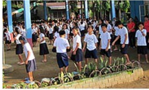
Children at school

Both in public and private schools, education in the Philippines is modeled after the U.S. educational system, and English is used in instruction. Until 1898 and the end of the Spanish colonial era, only students from wealthy families were able to attend school. This situation changed during the American occupation when free public education was introduced. It quickly became appreciated in the Philippines as a way to create social mobility and a more democratic society. 203