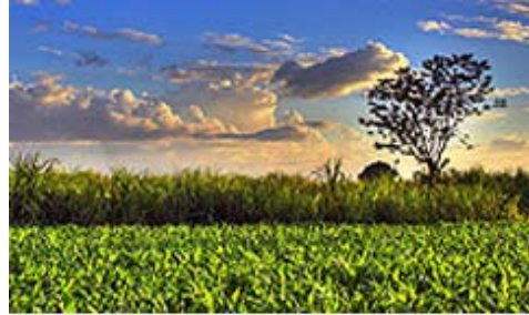
Sugarcane field

Manufacturing is concentrated in Manila, where the main industries produce chemicals, textiles, and metal products. On the Bataan Peninsula that stretches south into Manila Bay, bamboo is harvested for commercial use. Other industries found at various sites on Luzon include lumber processing and plywood mills, and mining of copper, gold, nickel, chromite, and iron.