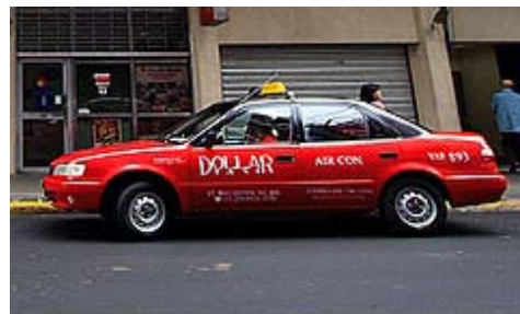
Taxi looking for a customer

Regular taxis operate throughout Manila. To control costs, it is advisable to use only the ones that charge by meter and are registered with the Department of Tourism. 230 When using a cab travelers should ask in advance if the cab driver will go to the desired destination, and how much the fare is. Travelers should also have exact change ready. 231 Although tipping is optional, most taxi drivers in Manila expect a small tip. Taxis are the preferred form of public transportation. Travel by light rail, buses, and jeepneys should be avoided because of safety and security concerns. 232