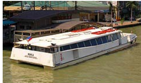
Ferryboat on the Pasig River

Roads in the Philippines are used not only for vehicles, but also for pedestrians, food carts, and non-vehicular traffic. There is a continual, crowded mix of vehicles, speeds, and unpredictable activity on the roadways. For these reasons, driving is dangerous and leads to many accidents. 235