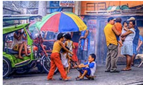
Socializing on the street

People who live in cities, and especially those in the suburbs or barrios , spend much of their free time socializing with family and friends. 195 Often they congregate in a public square or central neighborhood area. In large cities, visiting tends to be less frequent and more formal than in rural areas since the pace of life is busier and faster in the city. Urban residents typically call before they visit other people’s homes, rather than just dropping by. 196