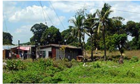
Rural area near Luzon

The rural economy of Luzon is rooted strongly in traditions. When indigenous people settled in central Luzon, they lived by subsistence farming. Early inhabitants lived in isolated groups but worked together to clear and farm the land. This pattern prevailed for centuries in the central lowland plains. Its organization, which predated the Spanish, followed that of a kasama (sharecropper system) in which peasants worked on an owner's land and kept part of the harvest. 260