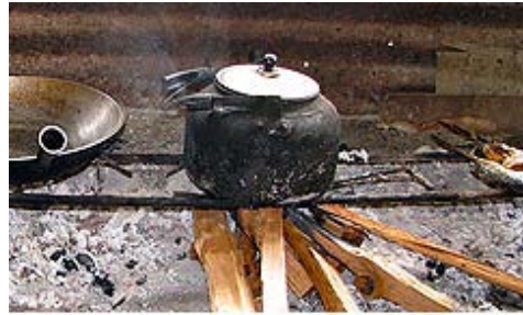
Heating the kettle

When dinner begins, guests should wait until the host begins eating before they commence to eat. Filipinos eat by holding a spoon in the right hand, and a fork in the left. They use the fork to manipulate food onto the spoon, which is used for eating. Leaving a small amount of food on the plate after eating indicates satisfaction with the amount of food provided.