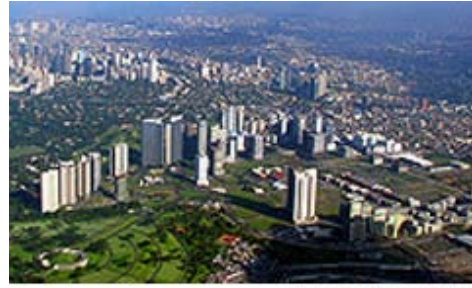
Aerial view of Manila

Located on Manila Bay on Luzon's southwestern coast, the nation's capital of Manila is the largest city and port of the Philippines. It is also the nation's center of culture, government, industry, and commerce, and one of Asia's most cosmopolitan cities. Manila has over 20 colleges and universities, a variety of TV and radio stations, and a symphony orchestra. 34