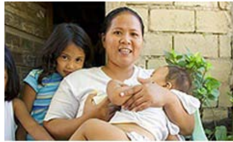
Mother and her children

Women usually manage the family finances and often work fulltime outside the home, even while raising children and running the household. In such circumstances, members of the extended family are often available to help the working mother with childcare. Familial authority is more a function of age than of gender, and decisions that affect the family are based on a consensus of all its members. 325