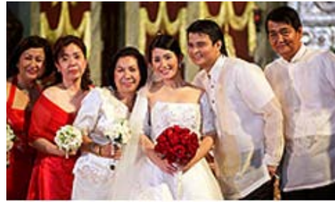
Formal wedding attire

After a couple decides to marry, the intended groom and members of his family traditionally ask the bride's parents if they will give consent to her marriage. If agreed, both families begin planning for the wedding, deciding on budget details and drawing up the guest list. The groom's family is expected to pay for the wedding ceremony and reception. 170, 171