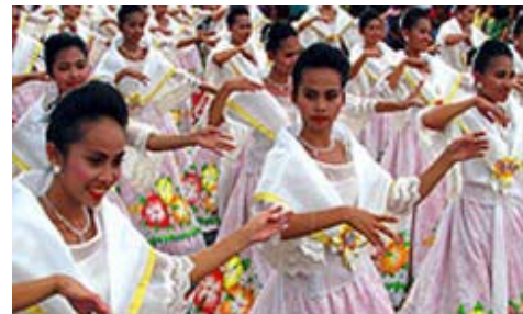
Spanish influenced dress

In the Philippines, local people dress casually for everyday activities, adapting their clothing choices to the hot, humid climate. Women wear western-style skirts and brightly colored blouses or dresses with the hem length reaching the knee or below the knee. Shorts are loosely fitted and knee-length. Low necklines are unacceptable. Women who visit should avoid wearing clothing that is sheer, provocative, or tight. Everyday wear for women is