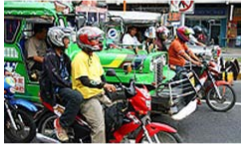
© Pawl Lewin Common forms of transportation

Although the city lacks a unified bus network, bus service is available to carry passengers on Manila’s main thoroughfares. Several private operators maintain a variety of routes, many leading to destinations outside the city. The buses are usually crowded, but fares are inexpensive. The World Bank recently agreed to loan money for the Metro Manila Transport Integration Project. With traffic moving at an average speed of 15 kph in some areas of the city, the project is expected to improve travel time for commuters, 75% of whom come from lower income groups. The project is also aimed at improving pedestrian facilities, improving lanes and advancing transportation services in the cities. 224, 225, 226, 227