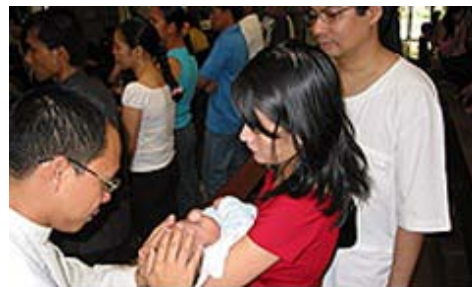
Baby being baptized

In the ancient Malay culture, the lineage of both the father and mother were equally important. This cultural base influences the “bilateral extended kinship system” that exists in the Philippines today, and it is reflected in names. 354 Among Filipinos, a newborn child’s name may include a family name from both the mother’s and father’s side of the family. Children at birth receive a first name, a middle name, and a last name (the family name). Often, it is the mother’s maiden name that becomes the middle name assigned to the child. 355 Children can also have lifelong nicknames used by family and friends. 356