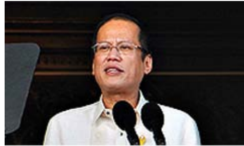
President Benigno Aquino

Between 1965 and 1986, Ferdinand Marcos served as elected president of the Philippine Republic. Responding to increasing opposition to his government and opposition to its support for both the Vietnam War and the presence of U.S. military bases, he declared martial law in 1972. During his rule, Marcos curtailed civil liberties, suppressed democratic processes, and detained many journalists and activists. Government corruption and crony capitalism (in which Marcos controlled monopolies in most economic sectors) eventually led to his downfall. He and his wife were forced to depart the Philippines in 1986, leaving the country in debt and a deep recession.