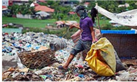
Scavenging to earn money

Those who have money, university degrees, and connections are more likely to find jobs that pay well or career paths with upward mobility and secure working conditions. A large segment of the urban population, however, does not fall within this category. Depending on the type and place of employment, working conditions are often unregulated. 185