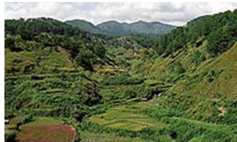
Wet weather keeps the landscape green

In its location approximately 15 degrees north of the equator, the Tagalog region (like all of the Philippines) has two distinct climate zones. 21, 22 A hot and humid tropical marine climate is typically found year-round in the coastal and lowland areas. In Manila, temperatures often rise as high as 38°C (100°F). During most of the year (except between March and the end of May), this zone's heat and humidity are tempered by breezes from the ocean. Two seasons are marked in this zone: the dry season between mid-November and May, and the monsoon season between May or June and October. In the dry season, winds are from the northeast, and during the wet season, monsoon winds bearing rain blow from the southwest. During the wet season, typhoons ( bagyos ) lasting three to four days pass over the islands, often causing considerable damage with their high winds and heavy rainfall. 23