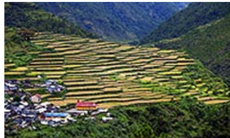
Rice terraces in Luzon

The central plain of Luzon is the most productive rice-growing region in the entire country and the second most productive for sugarcane. Southeast of Manila, the plains that encircle Lake Laguna de Bay remain saturated throughout the season of heavy rainfall, ensuring optimal growing and cultivation conditions for rice. 62, 63