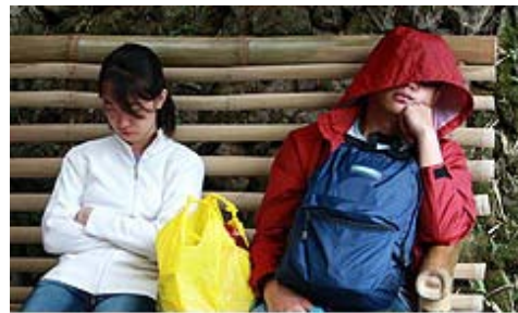
A couple resting on a bench

Annulment increased by 40% between 2001 and 2010. 347 The Office of the Solicitor General has also reported that 40% of young people in the Philippines now favor legal divorce. 348 The popularity of marriage as an institution has been declining among women as well as men. More young people are now willing to live together in a relationship without marrying. 349