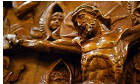
© Dave Ceasar Dela Cruz Carving of Jesus

Statues and images of Christ are sacred to Filipinos and should be approached quietly and with a respectful attitude. Although Catholic churches represent much of the Philippines' religious and cultural background, Filipinos show reverence toward the Catholic faith, regardless of the denomination they belong to.