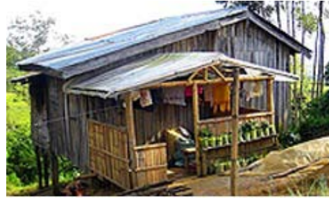
© Francesco Veronesi Typical rural home

Kinship ties are very close and important in the Philippines, and extended families often live in one household in rural parts of the country. It is common for entire families to work together doing farm labor, especially when harvesting and planting crops. Traditionally it is men who cultivate the fields, but the entire family assists with other chores. Women tend gardens and care for their children and the household. They also take care of any farm animals. 297