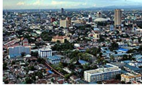
Looking out over Quezon City

Replacing Manila as the capital of the Philippines from 1948 to 1976, Quezon City adjoins and lies directly northeast of Manila. It was named after Manuel Luis Quezon y Molina, who served as the first president of the Commonwealth of the Philippines. Similar to Manila, Quezon City grew rapidly after the end of World War II. Although it is primarily residential, it has also developed as a center of light industry. Quezon City is one of the nation's largest cities with a population close to 2,680,000. 40, 41