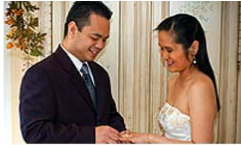
Young couple getting married

Young Tagalog people and Filipinos in general, marry in their 20s. It is considered preferable to acquire education or job training before marrying, to prepare a foundation for supporting a family. Many couples remain engaged for a few years before they marry in order to become established financially, and to create support for the marriage and associated family members. 338 Most Filipinos who marry begin having children around a year later. The presence of children in the marriage establishes a stronger tie between the families of the newly married couple. Children also represent good fortune in a marriage and are treated accordingly. 339