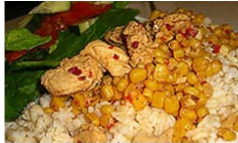
Chicken adobo with rice

Spanish, Chinese, and indigenous Malay influences are all present in Filipino food today. In the Tagalog region and throughout the islands, prepared foods have milder flavors than those of surrounding Asian countries, where cooks rely on hot peppers and spices to flavor their dishes. The favored grain in the Philippines is rice, which is usually served with all main meals, while fresh seafood cooked in different ways is the most popular source of protein. Sometimes the fish is marinated in a vinegar mixture and served uncooked.