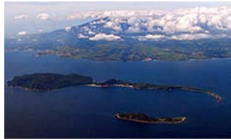
Corregidor Island in Manila Bay

An inlet carved into Luzon's western shore on the South China Sea, Manila Bay is considered one of the world's finest harbors because of its sheltered access. Almost landlocked, it covers an area of 2,000 sq km (770 sq mi) and stretches across 58 km (36 mi) at its widest point. The island of Corregidor divides the bay at its entrance into the 3.2-km-wide (2 mi) North Channel, with the Bataan Peninsula and the central plain on its northern shore. Although much wider, the South Channel is seldom used because it is less safe to navigate. The bay is further divided into two sections, one for international shipping and one for inter-island shipping. A joint U.S.–Filipino naval base (Sangley Point) is located on the southeastern shore. 24, 25