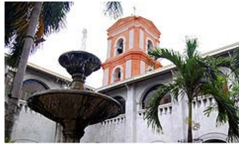
San Agustin Catholic Church, Manila

The Catholic Church is especially prominent in and around Manila, where the Tagalog people are concentrated. It is customary for the local people to practice their religion with devotion since they see it as a central part of their lives. They regularly attend church or chapel services offered by the church clergy. People also rely on alternative spiritual practitioners “who have special powers for curing and making contact with spirits of the deceased.” 104, 105, 106