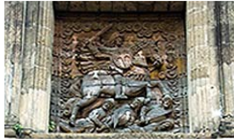
Spanish-era gate carving

Tagalog in written form was in use when the Spanish arrived in the Philippines. Used only for personal communication, little is known of Tagalog history prior to the 16th century. 46 The Philippines generally consists of people of Malay descent, who began arriving around the third century B.C.E. They settled throughout the islands, and their languages became separate over time, each developing in isolation from the others. 47, 48