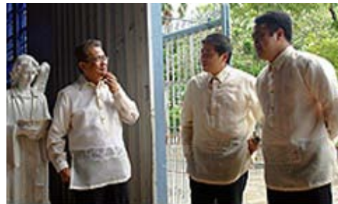
Traditional barong shirts

At festivals or special events, women in Luzon may dress in traditional styles of clothing that predated the Spanish presence. The clothing may include a long, loose skirt, called a saya by Tagalogs. On the upper part of their bodies, women traditionally wear a long-sleeved jacket called a baro or camisa . They complement the outfit with a tapis , a piece of cloth worn around the waist. Such styles can still be seen today in rural, remote areas that have resisted the habits of modern civilization.