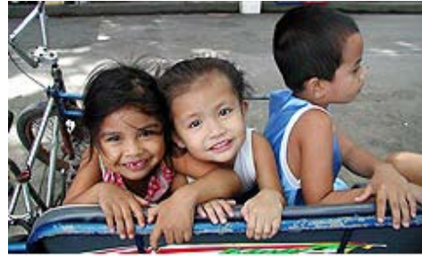
Smiling children

Children, both boys and girls, are indulged in Filipino families, continually surrounded by family members. Extended families are typically very close, and parents might send their child to stay for extended periods with aunts or grandparents, if those relatives live outside the family home. Within the home, children are in the company of siblings, parents, aunts, uncles, or other members of the family. Babies, seen as vulnerable and in need of protection from any kind of danger or trauma, are seldom left alone. Mothers hold their babies as much as possible and typically breastfeed them whenever the child is hungry, often until 2 years of age. If the mother is not holding the infant, it is likely that another family member is taking on this role. When a young child is upset or in discomfort, older siblings, parents, or other relatives will readily console the child and tend to its needs. Few demands, if any, are made on young children. 333, 334