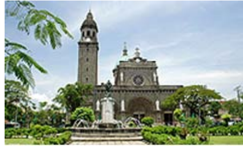
Manila Cathedral Church

The predominant religion of the Tagalog people is Christianity, historically Roman Catholicism blended with indigenous beliefs. 93 The same is true for the entire Philippines, where close to 93% of the people are Christian and 81% are Roman Catholic. A small percentage of Filipinos (fewer than 12%) are members of other Christian denominations. 94