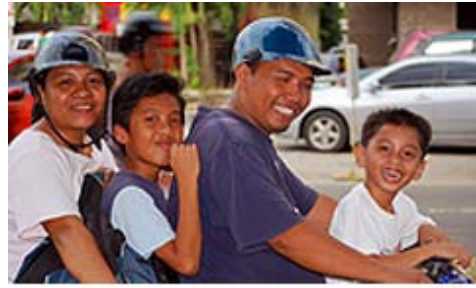
© Ubo Pakes Greeting with smiles

Tagalogs have maintained independent traditions in the Philippines. They were early opponents of Spanish colonization and supporters of Philippine independence. In Manila, they served as mediators between their own culture and that of the Chinese, Spanish, and Americans. From these foreign cultures, they selected what was useful and meaningful and adapted it to their basic Indo-Malayan social pattern. In this process, Tagalogs have “thus led in the modernization and Westernization that has passed in varying degrees from Luzon to all parts of the Philippine archipelago.” 141