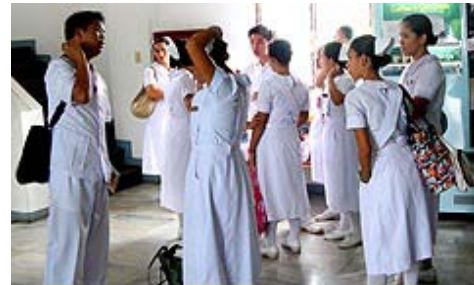
Metro South Hospital nurses

The majority of hospitals in the country are privately owned and operated. The number is even higher in metropolitan Manila where about 72% of all hospitals are privately owned. 221 In the cities, the public hospitals (specialized, general, and research) are run by the Department of Health (DOH). Within the DOH, the Department of Social Welfare and Development and its related agencies provide services for patients who are disabled. 222