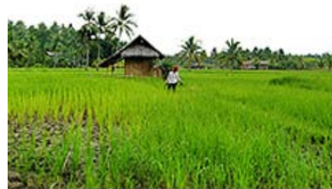
Rural rice fields

Under the Arroyo government, a four-year strategic plan was drawn up to reduce poverty between 2001 and 2004. One of the administration’s main strategies to reduce rural poverty was to modernize agricultural practices. To meet this objective, the government continued to make land reforms and strengthen the rural infrastructure. In spite of all attempts, however, poverty has remained “acute and widespread” in rural areas. 266, 267