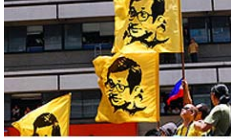
Flags of Ninoy Aquino

This holiday on 21 August (or the nearest Monday) commemorates the anniversary of Senator Benigno (“Ninoy”) Aquino’s death. Following three years of exile, Senator Aquino was assassinated immediately upon his return to the Philippines in 1983. He was an adversary of President Marcos, and Aquino’s death triggered a series of anti-Marcos events that led to the EDSA Revolution in 1986. 164, 165