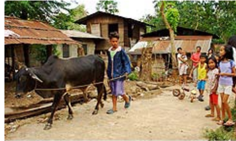
© Jonathan S. Ighares Philippine barangay

Villages in the Philippines are traditionally named barangays . Named after, balangays , the sailboats that carried early Malay settlers from Borneo to the Philippines, barangays were the “basic unit of local administration.” 304 Today, they are named in the constitution of the Philippines as governing village units. 305 Each barangay has an official leader who organizes community events and village activities, signs payments, and approves contracts. He oversees village life and assumes responsibility for the exercise of government power in the village. 306