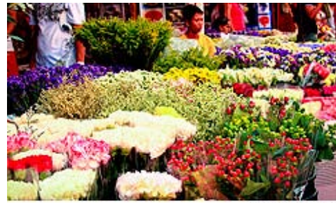
Flowers from the market are a good gift

When entering a Filipino’s home, visitors should be observant of the customs and behavior of the host and of other guests. It is also wise to know certain customs in advance. For instance, guests must remove their shoes before entering the house. 146 Furthermore, guests should be aware of some language intricacies, such as avoiding reference to “the hostess,” which in the Philippines is equivalent to calling her a “prostitute.” 147, 148