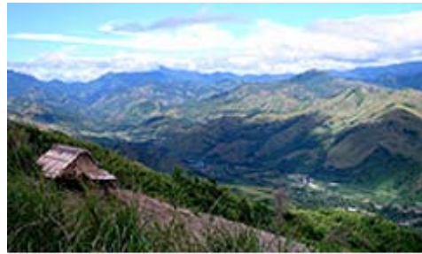
Sierra Madre mountain range

Coastal mountains are found along both the eastern and western sides of Luzon. In the central Tagalog region, the Sierra Madre Mountains lie along the eastern Pacific shore (the Philippine Sea). They are the longest mountain range in the Philippines, extending from northern Luzon to the southeastern peninsular part of the island. 14 The Sierra Madre forms a steep ridge so close to the island's shoreline that there is almost no coastal plain on that side of the island. 15