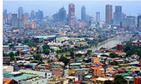
Manila city sprawl

Manila, Tagalog's main city, grew rapidly as a result of rural-to-urban migration in the 1980s and 1990s. Quezon City, just northeast of Manila, also experienced almost uncontrolled growth in the same period. As a result of the heavy migration of rural people searching both for jobs and for a better life in the cities, squatter communities developed. According to a National Housing Authority report, one out of every four residents of metropolitan Manila in the early 1980s was a squatter. 176