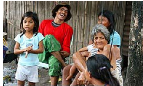
A village family

An extended family in the Philippines includes those considered part of the family as godparents or sponsors, as well as those who share kinship ties. Extended family members are expected to lend each other their support, perhaps by providing the connections that will help someone in the family get a job or move to a new region. Family bonds are continually reinforced through social networking and through ceremonial events such as marriage, baptisms, and confirmations.