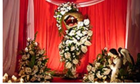
Maundy Thursday Altar of Repose

Religious public holidays in the Philippines include Maundy Thursday, Good Friday, Easter, All Saints' Day, and Christmas Day. 111 The nationwide Muslim public holiday of Eid al-Fitr is observed much more widely in the southern islands than in the Tagalog region, where Christianity is the principal religion. Still, Muslims live and practice their religion throughout the islands. Eid al-Fitr was declared a national holiday in order to promote “cultural understanding between Filipino Muslims and Christians.” 112