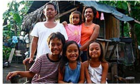
Family portrait

Collectivism is a core concept in Filipino philosophy and culture. Related to this core value is family, which is central to Filipino life. It represents the heart of the country's social structure. Individuals derive strength and stability from the family. Filipino families often include extended members such as aunt, uncles, grandparents, cousins, godparents, and close family friends in addition to the nuclear family. 130, 131