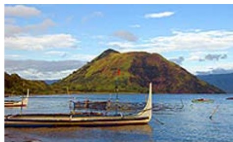
Volcano at Lake Taal

The Philippines' third largest lake, Lake Taal, is located in southwestern Luzon, directly south of