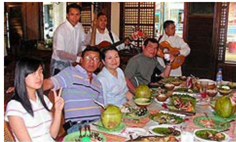
Dining in Manila

Filipinos usually eat communal style. That is, they gather in a large group and socialize while they are eating. Whether the occasion is formal or informal, it often takes on an air of celebration when food is involved. Diners use knives, forks, and spoons, or they may resort to the traditional method of eating food with their hands. Chopsticks are used mainly in Japanese or Chinese restaurants.