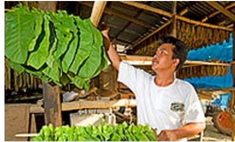
Drying tobacco leaves

During the 17th and 18th centuries, the Spanish colonists changed the norms of economic interaction in the Philippines. They did not systematically exploit the island's natural resources. Instead, they conducted business with Chinese intermediaries who acquired goods from China and sold them to the Spanish to use in their monopolistic "galleon trade" with Acapulco, Mexico. This trade was disrupted by the Seven Years' War (1756–1763) between the French and British empires, in which Spain sided with France. By 1815, the galleon trade between Mexico and the Philippines had ceased to exist. 136