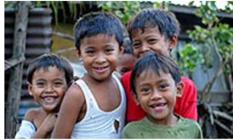
Children of the Mindoro region

The Tagalog people speak Tagalog, which also forms the foundation for Filipino, the nation's official language. The Tagalog language is spoken by approximately 15 million people on the islands of Luzon and Mindoro in the Philippines. 73 Although its script was originally of South Asian origin, it now utilizes the Roman alphabet. 74, 75