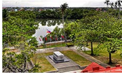
Emilio Aguinaldo's resting place

articulated by leaders such as the Chinese-Filipino national hero, Jose Rizal. Led by another Chinese-Filipino nationalist leader, Emilio Aguinaldo, Filipinos revolted against Spain in 1896. After the Americans won the Spanish-American War in 1898, defeating the Spanish fleet, Aguinaldo declared independence for the Philippine Republic and became president. 52