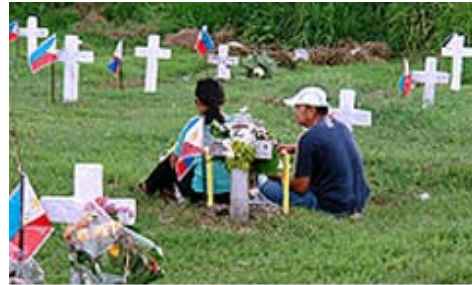
Remembrance on All Saints Day

This national holiday, also called Day of the Dead, is a time for remembering and honoring those who have died. Families gather together at cemeteries, cleaning the gravesites of deceased family members. Often they will spend the entire night at the gravesites. 116