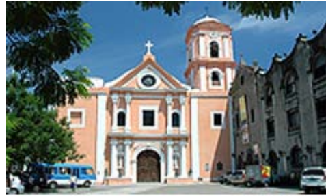
San Agustin Church

A large number of Catholic churches are found in and around Manila and throughout the Tagalog countryside. 122, 123 Alongside Catholic churches, it is common to find churches of other Protestant denominations. One of Manila's larger churches is the Iglesia ni Cristo (Church of Christ), with its tall gothic spires. 124