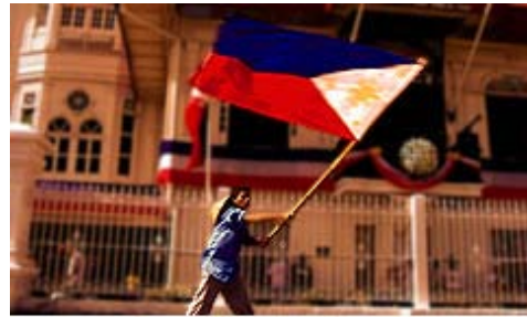
Independence Day

This national holiday celebrates 12 June 1898, when General Emilio Aguinaldo proclaimed Filipino independence from foreign rule. It was originally recognized on 4 July, after the date in 1946 when the Philippines became independent of U.S. rule. However, the celebration date was changed to 12 June (or the nearest Monday) by then-President Diosdado Macapagal in 1962 (signed into law in 1964). The change honors the earlier declaration of Filipino independence, which in reality would only come nearly 50 years later. 163