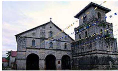
Baclayon Church in Bohol

From the beginning of the Spanish colonial period, the government was active in attempts to spread Christianity. As the Spanish settled the land around Manila Bay in the 16th century, they converted the local people in the lowland areas to Catholicism. The Spanish colonial government subsidized the missionary activity. In exchange, the government gained the right to name church officials, choosing priests and friars who were politically favorable in the eyes of the Spanish crown. Catholicism spread further through other methods employed by the government and church working together. The clergy possessed a broad knowledge of local languages and were able to talk with the local people. The information gleaned from these conversations was then passed on by the priests and friars to the Spanish colonial governmental authorities. Working with the government, the Catholic Church suppressed local religions, although never entirely. Traditional beliefs remained imbued in the new Catholic beliefs that local people adopted. 100