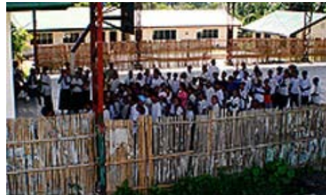
Rural village school

Education, once the privilege of the elite under Spanish rule, became publicly available to all Filipinos after the U.S. educational system was introduced. 290 When the Philippines achieved independence in 1946, the government built schools throughout the country, including remote, rural areas. Still, the quality of education has remained higher in the cities. 291