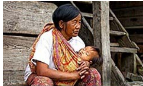
Grandmother and baby

Filipino families are clearly child-centered. Married couples do not truly become a family until the birth of a child. Because parents are considered to “know best,” their decisions must always be upheld even if they run counter to the wishes of the children. Children are rarely consulted about decisions directly affecting their lives. 331