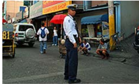
Police officer on patrol

In Manila and other urban areas, pick pocketing and credit card fraud are common. Theft frequently takes place on the public transportation system, including buses and the light rail train system. Kidnapping and violent crimes are often perpetrated in Manila, but in the southern island of Mindanao and the surrounding region, political violence is more prevalent. 256