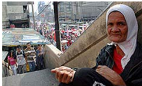
Old woman begging in the city

Poverty is widespread in Manila, and many people who live on the streets earn money by begging. These beggars often gather around restaurants and clubs frequented by foreigners, forming groups that may follow tourists to solicit money. They can be quite aggressive, and it is best to ignore them. 253, 254