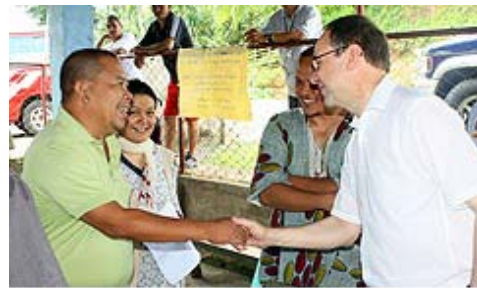
A handshake and a smile

Filipinos often have multiple names, taking both their mother's and father's last names. When speaking to them, it is best to err on the side of formality, addressing people by their formal title or using "Mr.," "Mrs.," or "Miss," followed by their father's surname. It is also a good idea to ask people how they wish to be addressed.