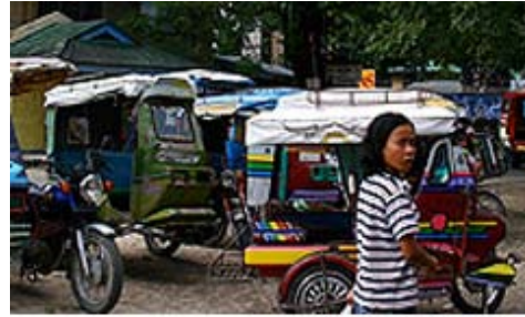
Tricycle transportation

Rural residents must rely on both land and sea transportation. Because of the heavy reliance on agriculture, improved transportation has been identified as a key element in reducing poverty in the area. Since 2004, transportation by sea has opened trade and cut time and costs. 273, 274, 275, 276