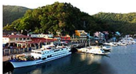
Romblon Port in the Sibuyan Sea

A small sea that separates Luzon from the Philippine islands that lie to its south, the Sibuyan Sea extends as far south as the island of Panay. Mindoro forms its western boundary. 31