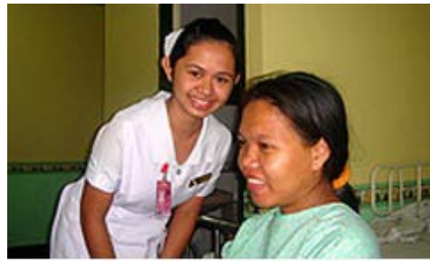
Nurse and her patient

Nationwide, a shortage of health professionals exists. In 2011, only one physician was available for every 1,000 people. 212 Most of the doctors are in urban areas where the nation’s modern health facilities are found. 213 The continued emigration of Philippine health care professionals seeking opportunities in other countries has resulted in a shortage of trained staff in the Philippines. 214 Many Filipinos who need medical help turn to alternative cures or unlicensed practitioners. 215