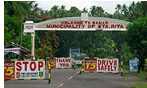
Checkpoint along the road

Security checkpoints are commonplace in the Philippines. The Department of Justice recently issued a 10-point guideline on motorist rights at such checkpoints. The checkpoints must be well-lit. Motorists are to stay in the car and lock all doors. Only visual searches are permitted and motorists do not have to open glove boxes, trunks, or luggage. Drivers may be expected to answer certain questions and must have licenses and registration at the ready. 307, 308