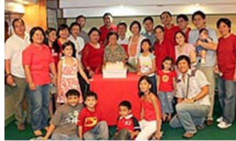
Large extended family