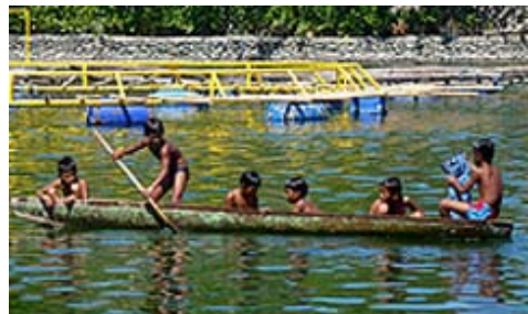
Pangasinan children on a boat

The Kapampangan kingdom was extant when the Spaniards arrived at this region in the 16th century. Founded in 1571, the same year the city of Manila was founded, Kapampangan (also called Pampanga ) became the country's first official province. The area it encompassed was much larger than the linguistic region the Kapampangan people now occupy in western-central Luzon. The Kapampangan language originally used a script descended from India's Brahmi script, then switched to the Latin alphabet. In 1965, a new orthography similar to that used by Tagalog was adopted and has remained in use. 77