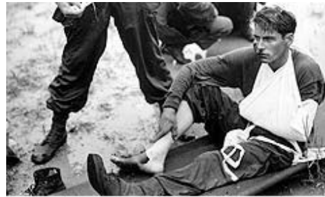
US soldier injured by a Japanese landmine, 1944

The Republic of the Philippines signed the Mine Ban Treaty on 3 December 1997, but domestic legislation has yet to be enacted that would make the treaty effective. The Armed Forces of the Philippines (AFP) has denied using land mines in its fight against insurgents trying to topple the Philippine government. The AFP has, however, accused the New People's Army (NPA, the armed wing of the Philippine Communist Party) of using landmines, including some in Luzon. The NPA in turn denies that it has used any "victim-activated mines," although limited evidence of their use has been found. 309