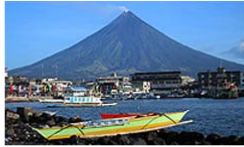
Mount Mayon as seen from Luzon

Tagalog is one of the two largest of nearly 100 distinct ethnic and language groups in the Philippines. 1 Located primarily on the islands of Luzon and Mindoro, Tagalog people constitute approximately 28% of the Philippine population. 2 Like most of the nation's other ethnicities, they are descendants of the Malay people. 3 Their language, Tagalog, forms the basis of the official national language, Filipino, the most widely spoken of the Philippine languages. 4