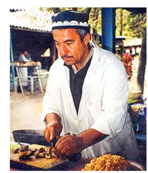
Man in skullcap

Men have fallen under bans concerning their facial hair. Tajik officials claim that long beards are an outward sign of Islamic radicalism and have issued regulations pertaining to beards. Schoolteachers below age 50 may not wear beards of any length, while those above 50 may not grow a beard longer than 3 cm (1.2 in). Bearded men report difficulties finding work. Many men have been detained by security forces and police because of their beards. <sup>181, 182, 183</sup>