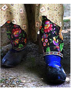
Feet flat on the ground

As in the United States and other Western countries, showing one's thumb through the middle and index fingers is an obscene gesture. Showing the bottoms of one's feet when sitting and blowing one's nose in public are also considered rude. People are required to apologize if they step on someone's foot, and they should never step over a person's legs or in front of people who are sitting. 199