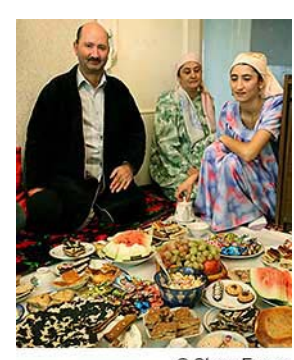
Family celebrating Eid

Eid al-Fitr and Eid al-Adha are two important Islamic holidays, and the Tajik government recognizes them as national holidays. <sup>141</sup> Beginning the first day after the holy month of Ramadan, Eid al-Fitr is the "festival of fast breaking," which celebrates the end of Ramadan and lasts for three days. During this time, ministries and other government offices shut down. People wear new clothes, engage in community prayers, and visit friends and relatives. Eid al-Fitr is a time of togetherness and community. Neighbors are invited for meals, and donations of money and food are given to local mosques for charity. Restaurants, cafes, and bakeries experience an upsurge in business as people flock to them for celebratory meals and dishes. <sup>142, 143, 144, 145</sup>