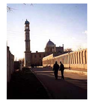
Mosque in Dushanbe

Jewish community of Dushanbe to use as a synagogue. <sup>148</sup> Christian groups face difficulties in maintaining their buildings of worship. Only officially registered Christian groups are allowed to operate churches. Churches that operate without official status are closed down. Dushanbe's Baptist church was forcibly closed by the Tajik government in 2009. <sup>149, 150, 151</sup> Mosques remain ubiquitous throughout Tajikistan. According to a statement in 2012 by the CRA, Tajikistan has more mosques than schools, with 45 more planned for construction. A mega-Mosque that is to be built in the capital, Dushanbe, is being jointly financed by Tajikistan and Qatar, which is expected to donate 70% of the financing for the project. <sup>152, 153</sup>