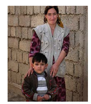
Mother and son

Divorce is on the rise in Tajikistan. Partly as a result of labor migration, divorce is beginning to lose some of its stigma. Economic instability and poverty are partly responsible for divorce as well. Spouses who cannot afford to support their families often initiate divorce to reduce their financial burden. Absentee husbands sometimes divorce their wives because they create new families abroad. Women are also beginning to initiate divorces in Tajikistan. Although women remain second-class citizens, social reforms and necessity have turned many of them into breadwinners. Women have begun to initiate divorces against husbands who are incapable or unwilling to contribute to the financial survival of